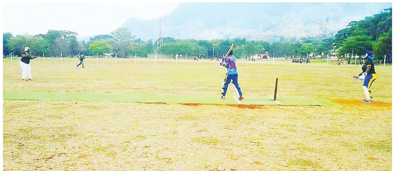
Sokoine University of Agriculture (SUA) Queens' cricketers and their Mwanza Queens' counterparts lock horns in a previous season's Tanzania Cricket Association (TCA) Regional Women League's game, which took place in Tanga.

The four-team tournament, organized by Tanzania Cricket Association (TCA), gears towards boosting efforts to develop the sport domestically.