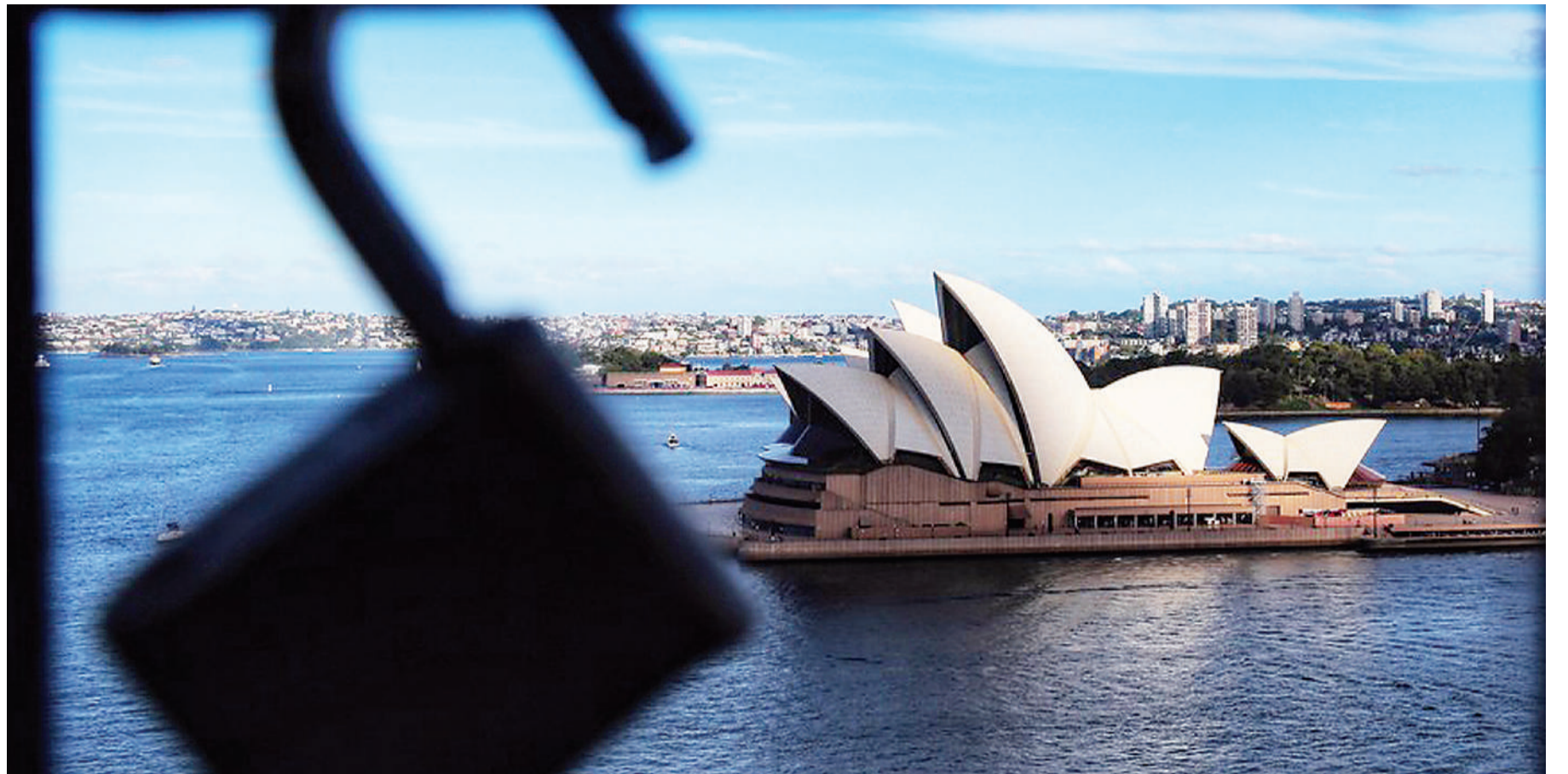
Photo taken on Nov. 2, 2020 shows the Sydney Opera House in Sydney, Australia. (Xinhua)

As Australia follows the US's lead to smear China on Xinjiang, meddle in the Taiwan and Hong Kong issues, and hype up conspiracy theories surrounding the origin of COVID-19, it allows its farmers and workers to bear the brunt of the subsequent economic fallout, while being totally unaware that American companies are quietly tak-