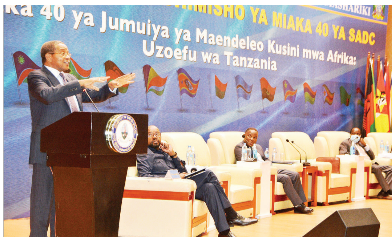
The Chancellor of the University of Dar es Salaam and retired president Dr Jakaya Kikwete inaugurates the 40th anniversary conference of the Southern Africa Development Community (SADC) at the Nkrumah Hall of UDSM - Main Campus yesterday.

Those shifted to the BoT will not yield cash when accessed