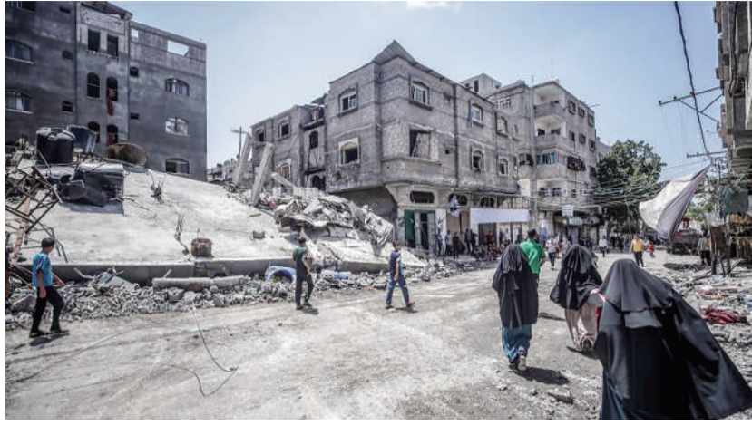
Palestinians inspect their destroyed house after Israeli air strikes in Jabaliya refugee camp northern Gaza Strip, on Thursday.