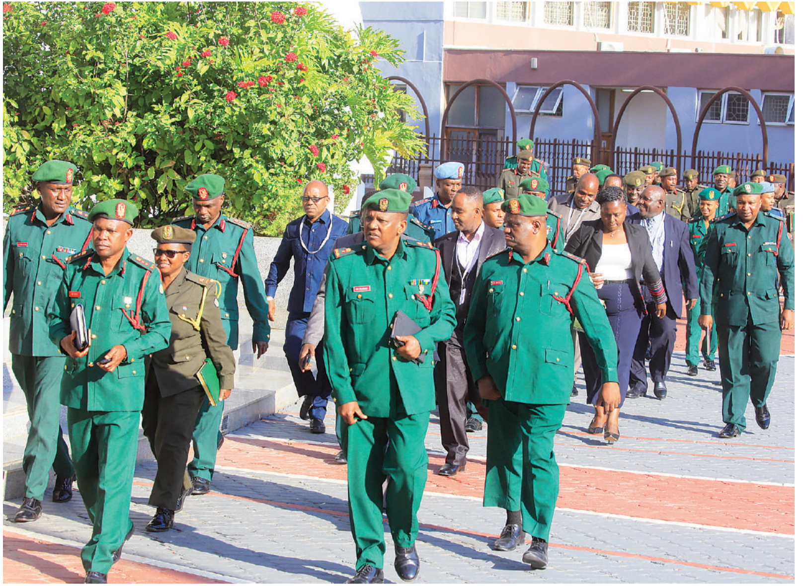
Tanzania Peoples Defence Forces (TPDF) and National Service officers arriving at the Parliament grounds in Dodoma yesterday to attend the ministry of Defence and National Service 2021/2022 budget estimates presentation.

He said he has no problem with the firms and others likely to be established by ministries and departments. The problem is awarded tenders which he said must be transparent and competitive hence a level playing field.