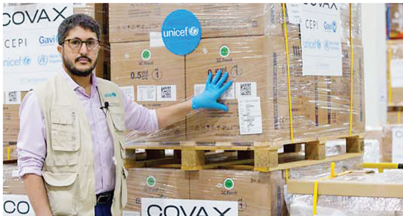
Under the UN-backed COVAX initiative, UNICEF ships COVID-19 vaccine syringes from a warehouse in Dubai Logistics City, United Arab Emirates. And as the world continues to grapple with the health and economic crisis sparked by the COVID-19 pandemic, the UN and Islamic Development Bank have teamed up to help the most vulnerable. May 2021.

Collecting and publishing the beneficial ownership of contracting companies is a measure that aims to deter corruption, including by facilitating the detection of potential conflicts-of-interest involving public officials. It requires bidding companies to provide the names of the people with effective control over a company, that is the "beneficial owners". This information is provided to the procurement agency, which must publish it.