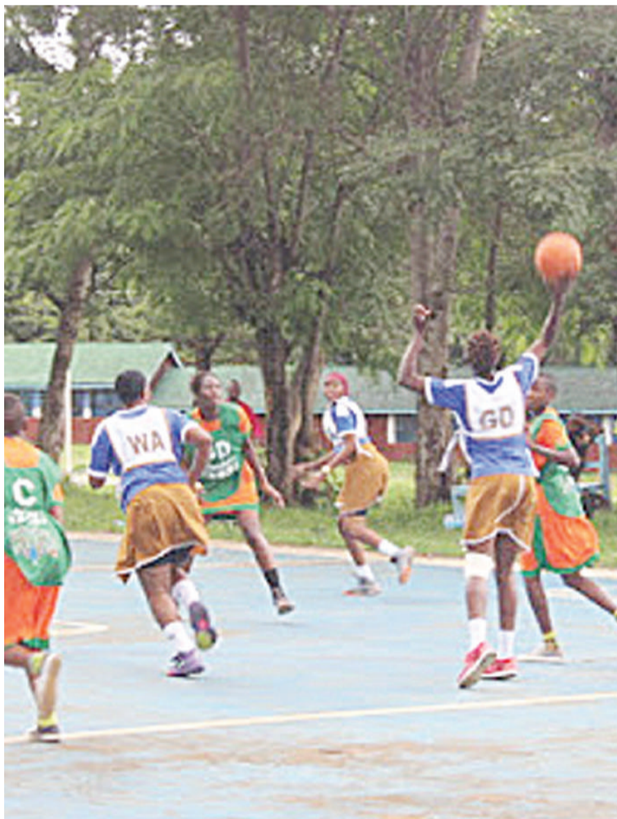
Netballers making some of the squads, which competed in the previous season's national netball championship 'Taifa Cup', put their skills to show in one of the games in Manyara.

She disclosed the aim is to see to it the sport enjoys success and is played in all parts of the world.