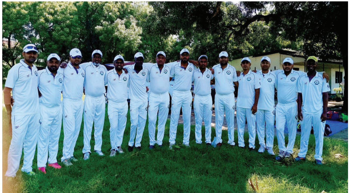
Shree Kutchi Leva Patel Sports Centre (SKLPSC) cricket outfit.