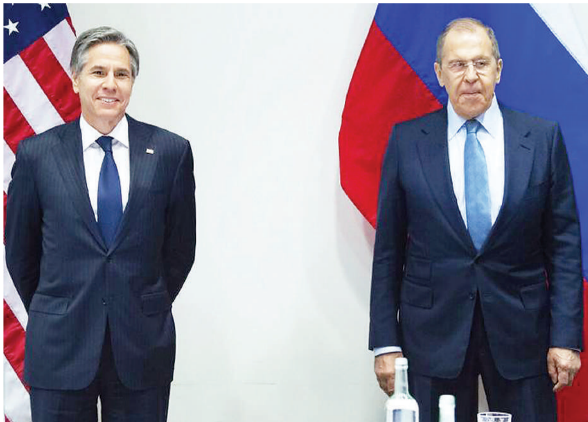
US Secretary of State Antony Blinken (left) poses with Russian Foreign Minister Sergey Lavrov (right) before a meeting at the Harpa Concert Hall in Reykjavik, Iceland on Wednesday, on the sidelines of the Arctic Council Ministerial summit.