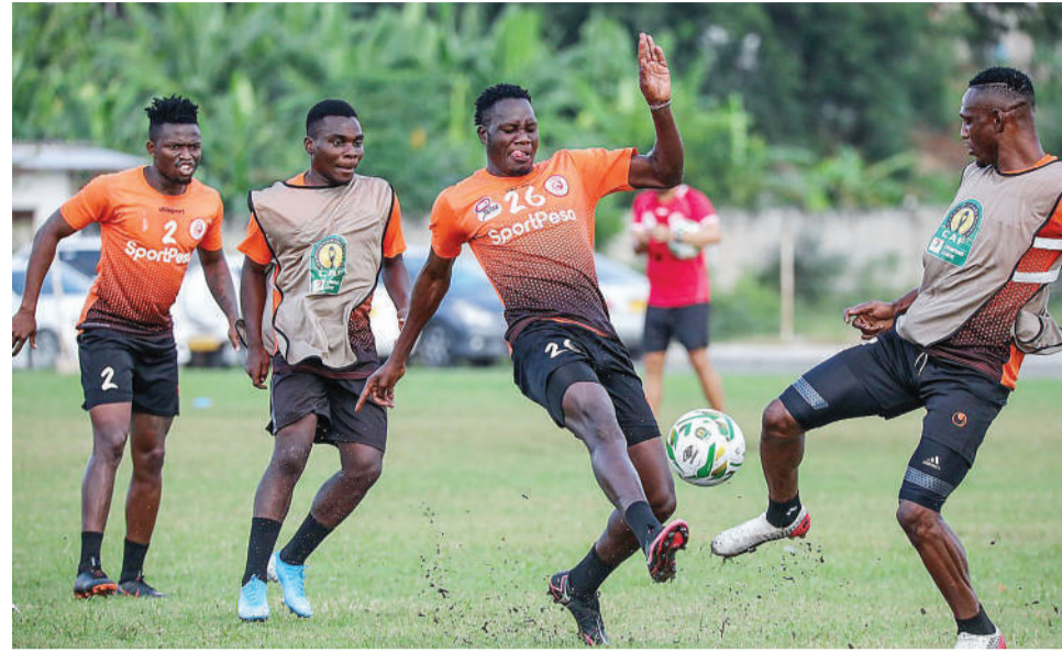
Simba SC players participate in training in Dar es Salaam recently to prepare for today's CAF Champions League's last eight's duel against Kaizer Chiefs, which will be played in Dar es Salaam.