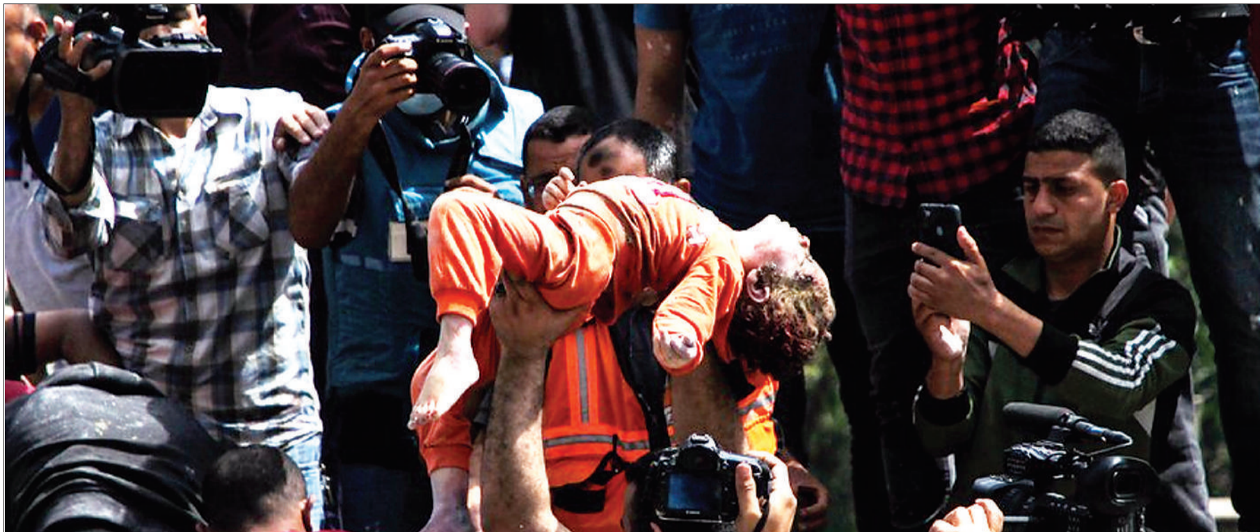
A Palestinian man holds a child who was rescued from the rubble of destroyed houses following Israeli air strikes in Al-Wahda Street in the middle of Gaza City, on May 16, 2021.