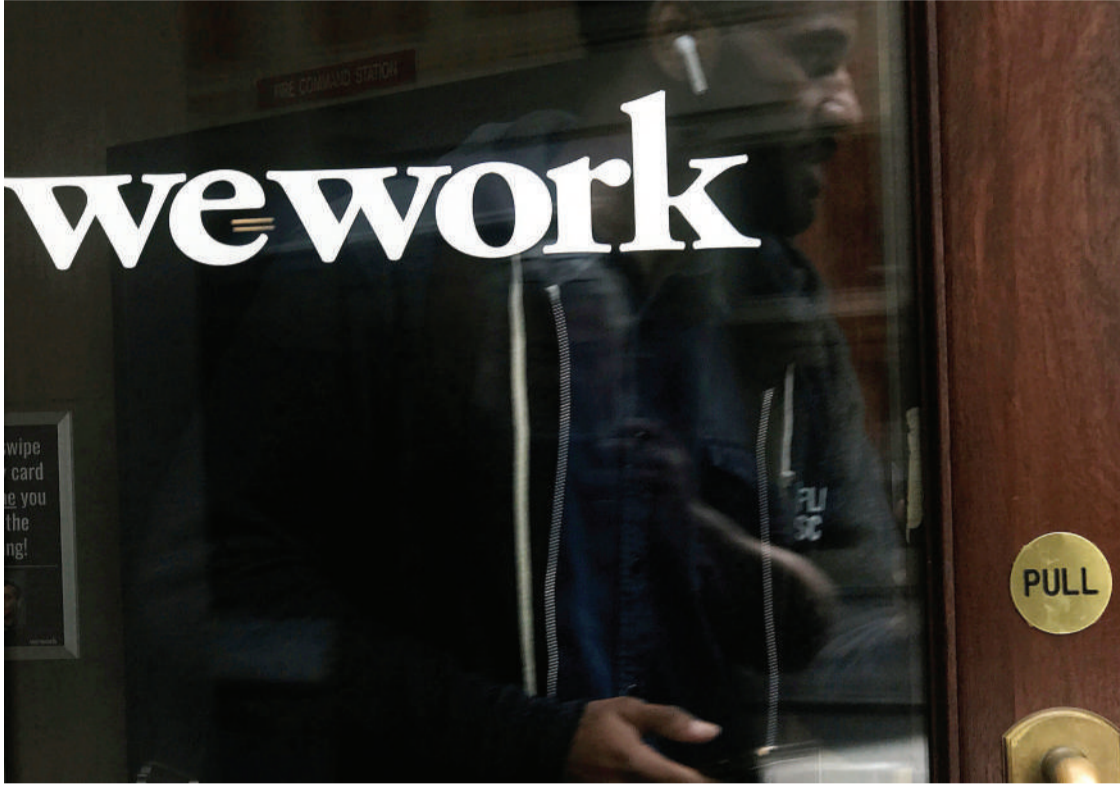
A man walks out of a WeWork space in the Manhattan borough of New York City recently.

WeWork in March agreed to go public through a merger with BowX Acquisition Corp, a special purpose acquisition company, in a deal that valued it at $9 billion. SoftBank Group Corp said it would retain a