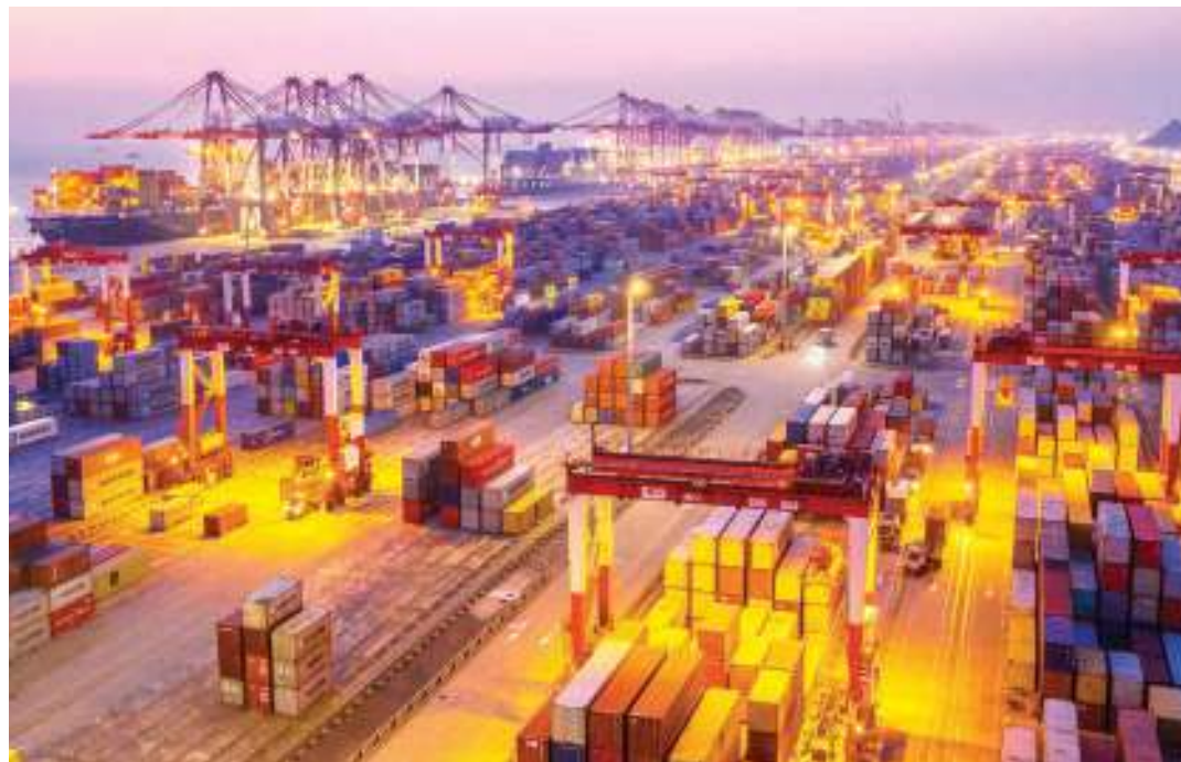
Aerial photo taken on Oct. 3, 2019 shows Shanghai Yangshan Deep Water Port.

France is one of the fifteen guest countries of honor of the expo. 17 influential French enterprises, six French regions and