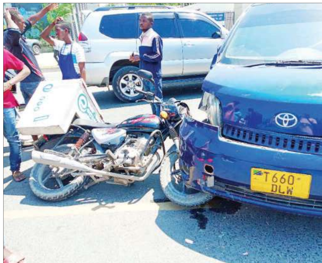
This road crash occurred yesterday along the Victoria stretch of Dar es Salaam's Ali Hassan Mwinyi Road. There were no immediate reports of casualties.

In order to ensure transparency and accountability in extractive industries, the committee shall cause the minister to publish among other things in the website or through the media which is widely accessible all concessions, contracts and licenses relating to extractive industry companies.