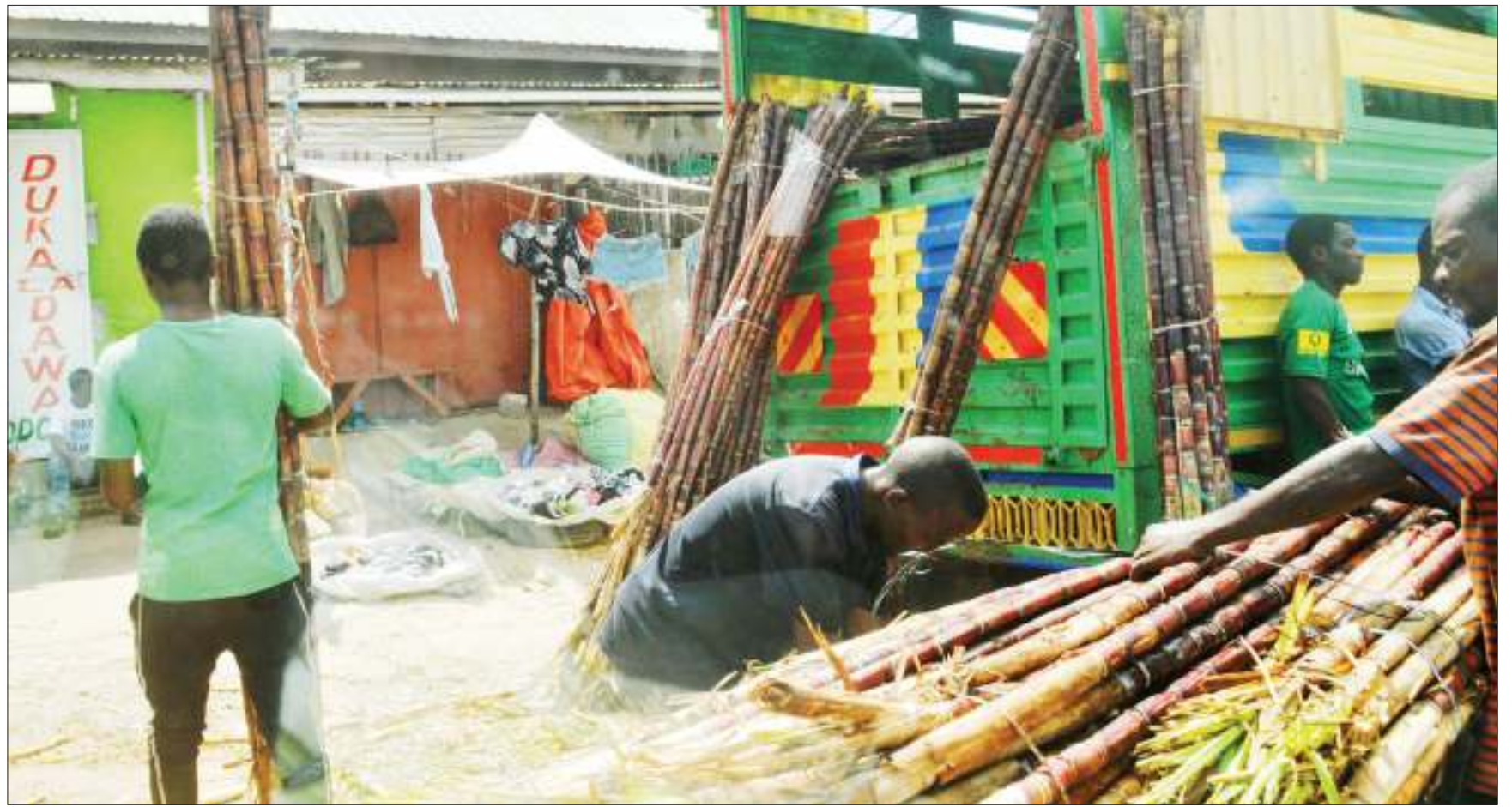
Sugarcanes are off-loaded from a truck at Dar es Salaam's Tandale foodstuff and general supplies market yesterday ready for sale.

"The country has also priorities investment in the use of renewable energies like solar, wind power and the like"