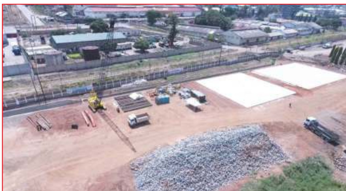
The construction of a slipway that will be used for new shipbuilding, also in progress at Mwanza South Port. The project is implemented by STX Engine Co. in Joint Venture with Saekyung Construction Co. Ltd both from South Korea whereby the slipway is expected to be ready for uses by March, 2020. Upon completion of the project, the permanent structure is earmarked to be the biggest structure along the Lake Victoria with ability to Dock/Undock Capacity of Ship Light Weight of at least 4000 tons and Associated Facilities for Building a New Ship in Lake Victoria.

The minor rehabilitation done to those three vessels have enabled the Company to start emerging from doldrums state (being a turnaround verge) back to its original designed state of providing competitive services to the Public and operate commercially. Completion of the ongoing projects will lead to the increase of vessel fleet of the Company hence strengthen the operating muscles of MSCL to achieve its goal of stimulating the growth of our economy through the improved water transport in the Lake Zone and the neighboring countries.