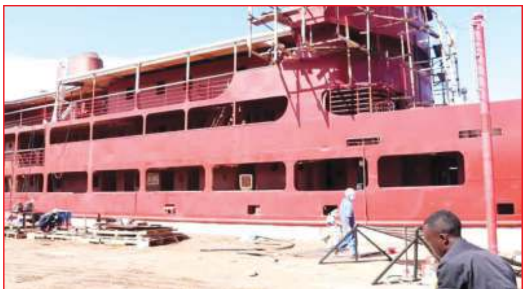
Rehabilitation of MV.Victoria in progress at Mwanza South Port. The Project is implemented by KTMI Co. Ltd from South Korea in Joint Venture with Yuko's Enterprises (EA) from Tanzania and is expected to be ready by March, 2020. This project is implemented concurrently with the rehabilitation of MV.Butima by the same contractors.

Lastly MSCL appeals to all key stakeholders to join their hands to promote marine industry as it has a tremendous impact to the growth of our economy.