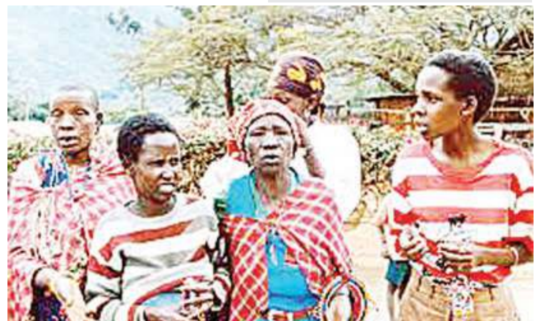
Cross-border women traders at Sirari in Mara region.

"This project relates to the EAC because it supports the actual implementation of the bloc's Common Market and Customs Union Protocols all of which aim at promoting cross border trade. Since the project seeks to, document and disseminate the success stories of women in business on the implementation of the Common Market Protocol, it is aligned to its objective particularly with the involvement of women in cross border trade," added Ndiribengo while stressing that the project will also establish the extent to which the group's earnings have increased as a result of engaging in regional trade.