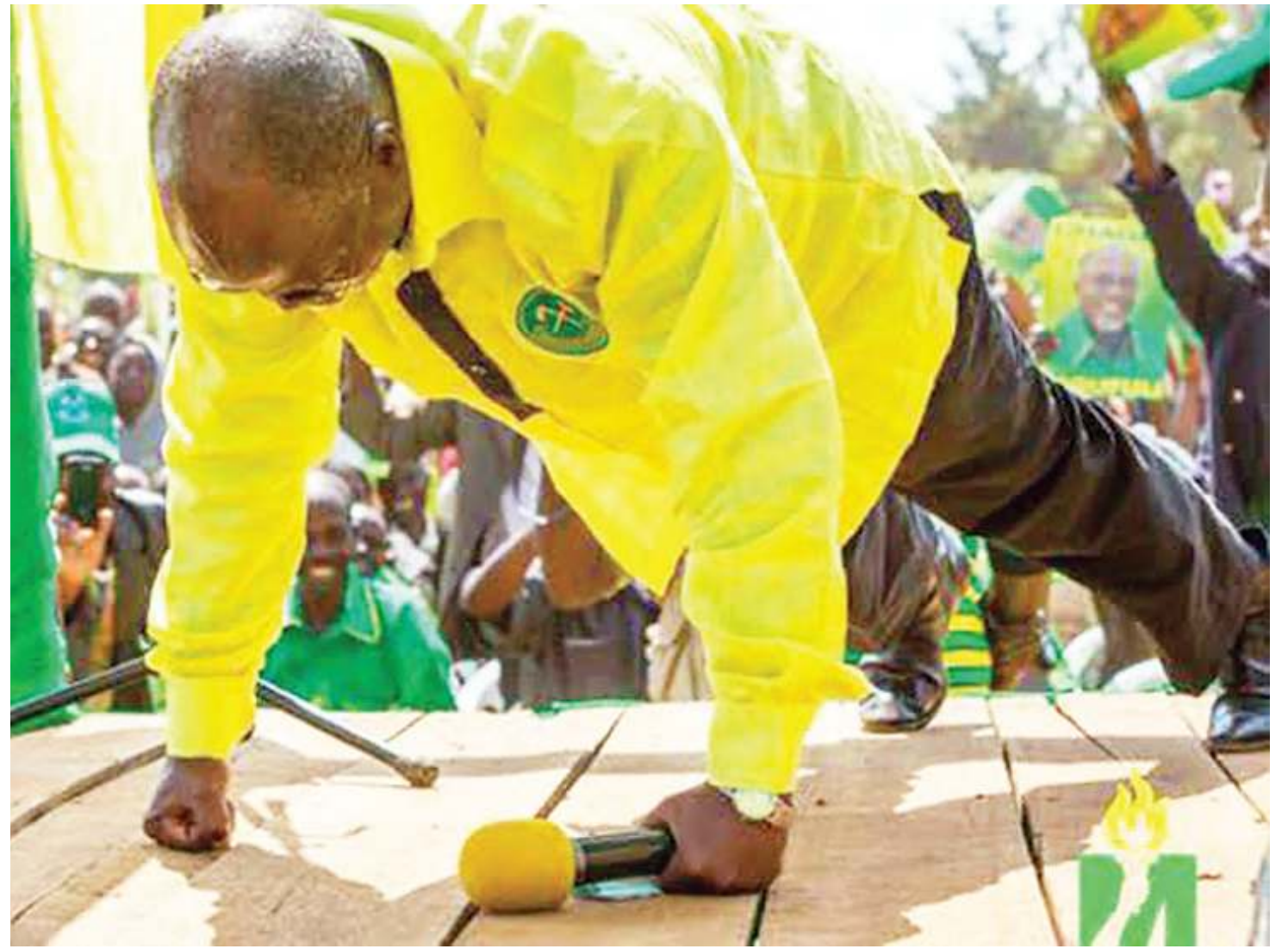
President John Magufuli

Later, the president skipped the 6th Ordinary