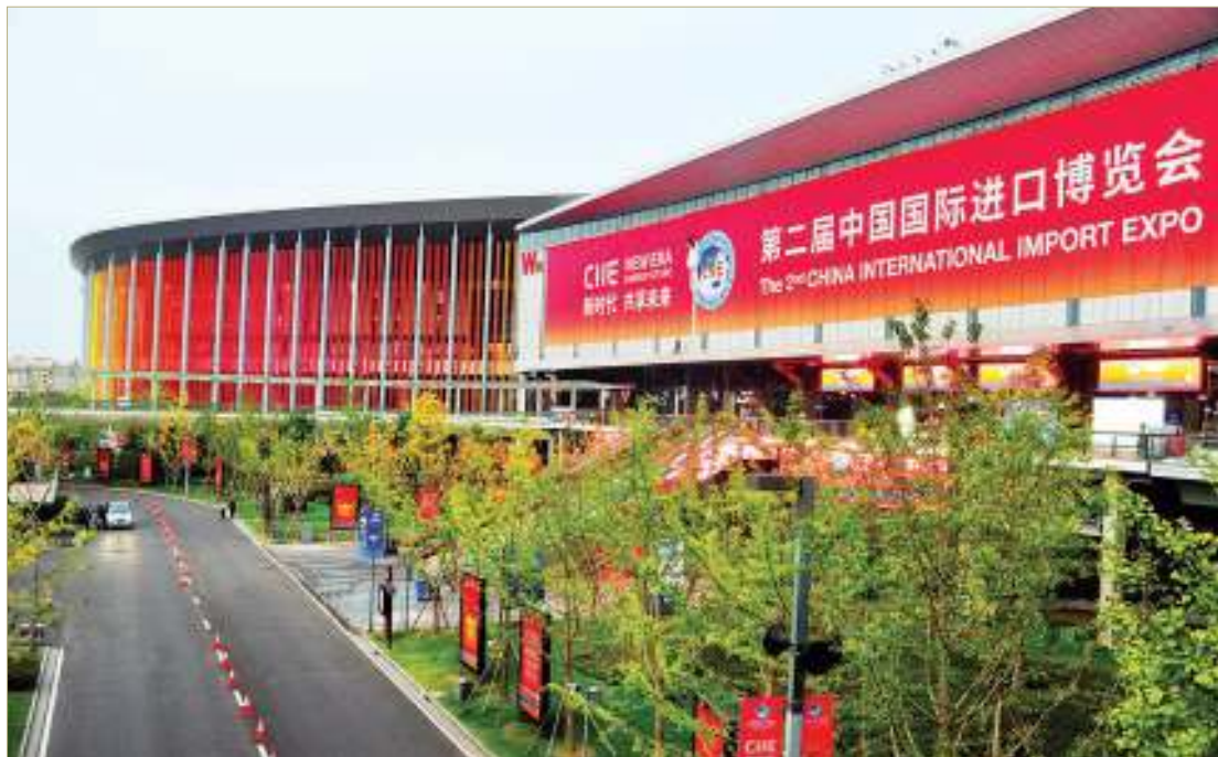
Decoration of the west gate at the National Exhibition and Convention Center in Shanghai is almost complete, Oct. 22, 2019.

The popularity of the CIIE also reflects the confidence of enterprises around the world in China's determination to constantly deep-