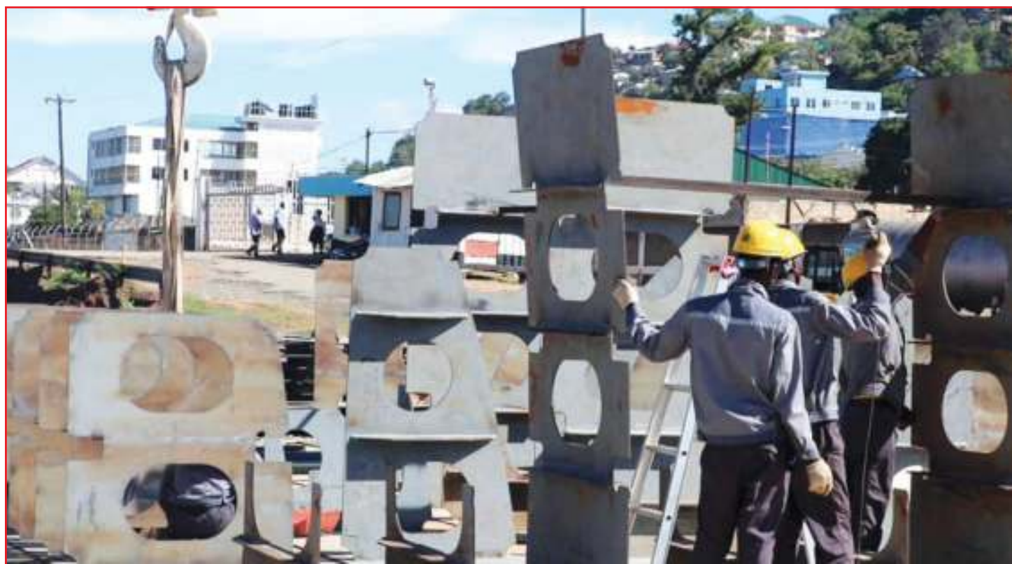
Assembling of steel blocks as part of new shipbuilding in progress at Mwanza South Port. The project of new shipbuilding which will be having a carrying capacity of 1,200 passengers and 400 tons upon its completion hence making it the biggest Passenger Cum Cargo vessel along Lake Victoria, is being implemented by GAS Entec Co. Ltd. in Joint Venture with Kang Nam Co. Ltd. (both from South Korea) and SUMA JKT. The new ship is expected to be ready for operations by the beginning of year 2021.

The achievements realized by MSCL during the period of 4 years of President Magufuli ruling MSCL has observed improvement of its Infrastructure for delivery of marine transport services. However, the respective improvement is still in progress and it involves new shipbuilding in Lake Victoria, major rehabilitation of two existing vessels and installation of an electronic ticketing system.