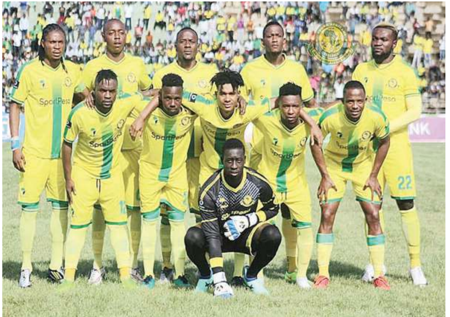
Young Africans SC (Yanga) players pictured before a kick off of their recent match in this season's Vodacom Premier League.