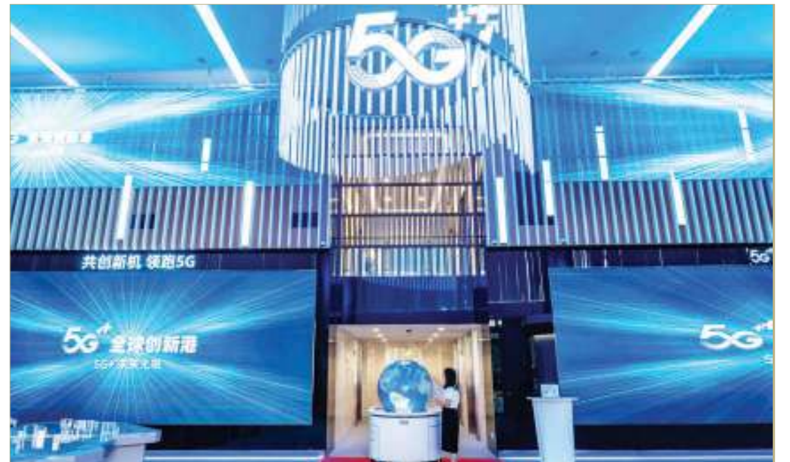
The "5G Global Innovation Port", the world's first comprehensive 5G application demonstration and joint innovation platform, is officially put into operation in the North Bund area of Hongkou district, Shanghai

These new creations include concept car that can automatically perceive the physiological status of passengers and adjust its interior environment accordingly,