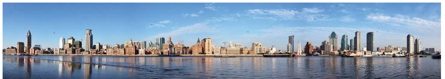
A panorama view of the Bund in Shanghai.