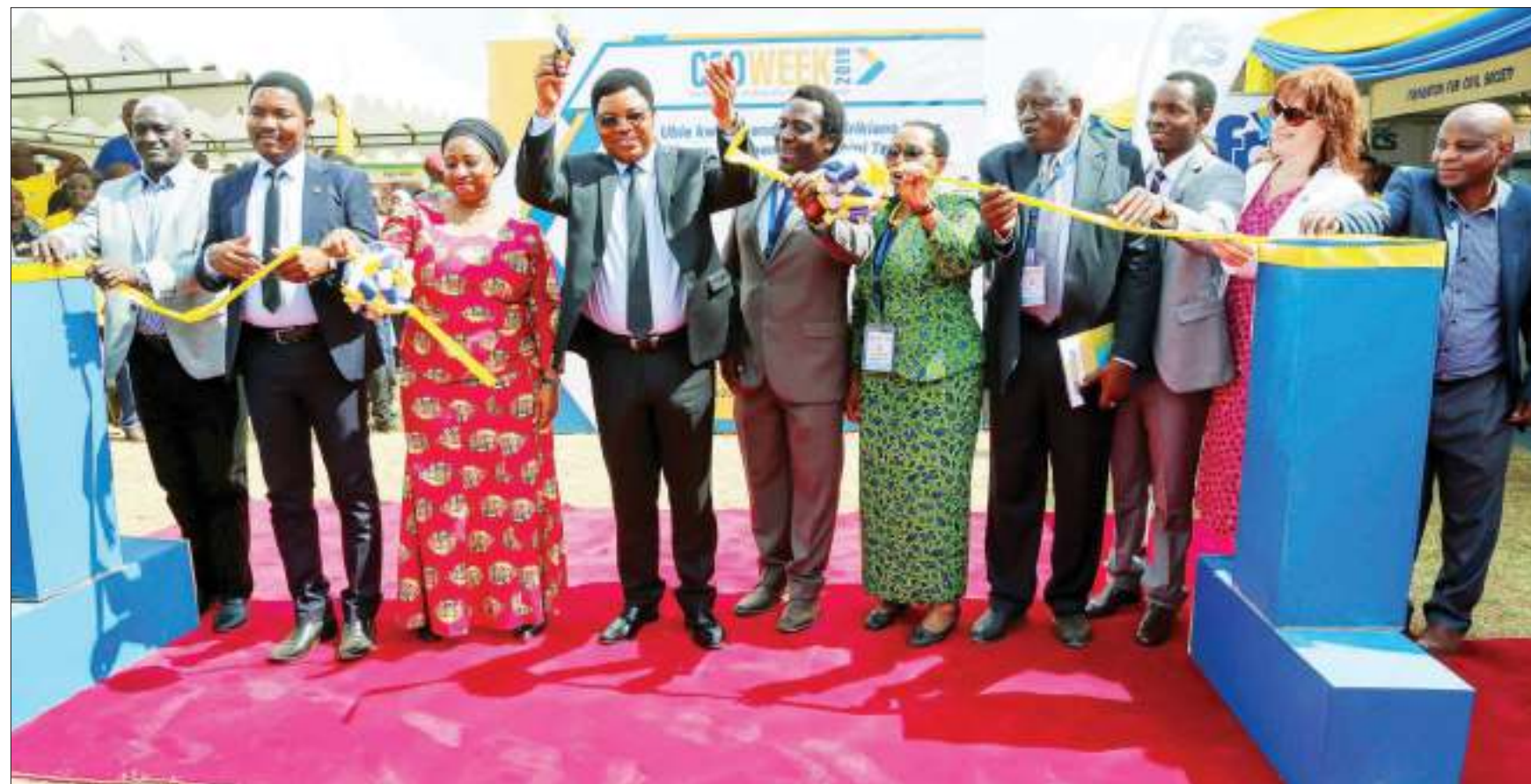
Prime Minister Kassim Majaliwa cuts a ribbon to inaugurate the 2019 edition of the CSOs (civil society organisations) Week exhibition in Dodoma city yesterday, accompanied by some senior government and CSO officials.

Records show that there is a global increase of cases relating to journalists being killed, injured, abducted or imprisoned under false charges and this has driven most parties to find ways of addressing this serious problem, he added.