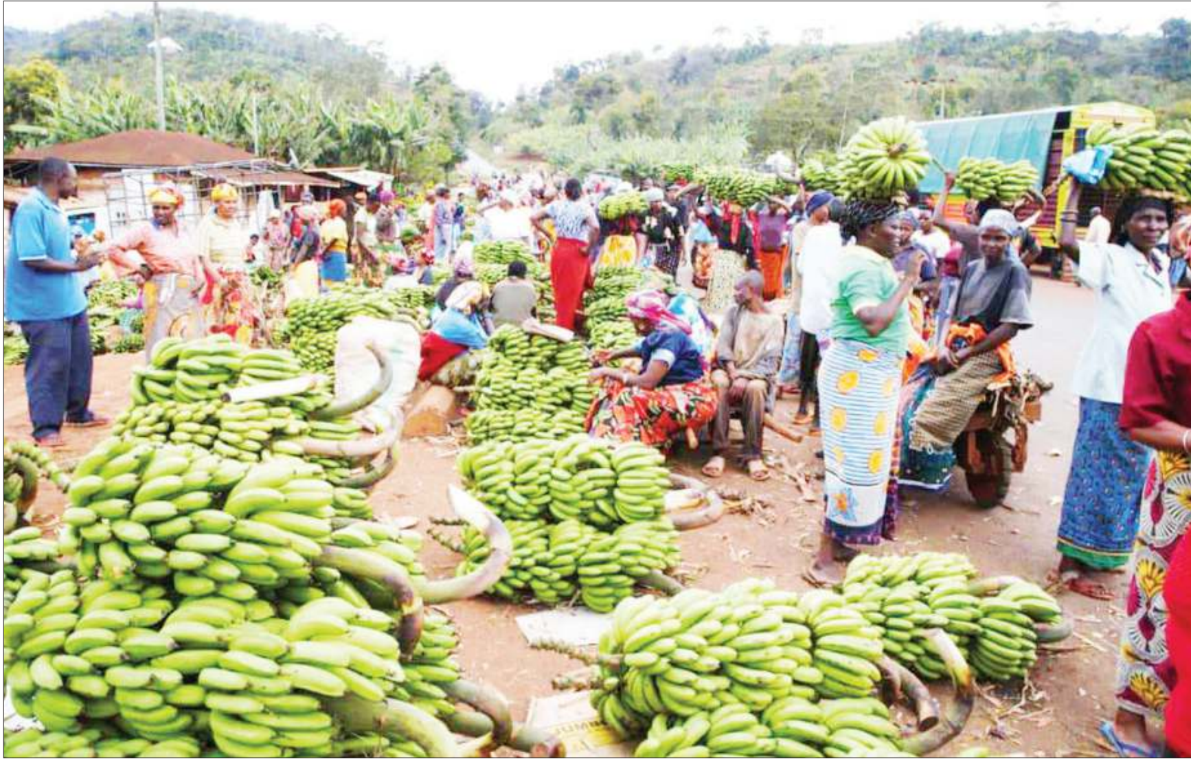
It's bananas in abundance at Mamsera open market in Rombo District, Kilimanjaro Region, as captured yesterday.