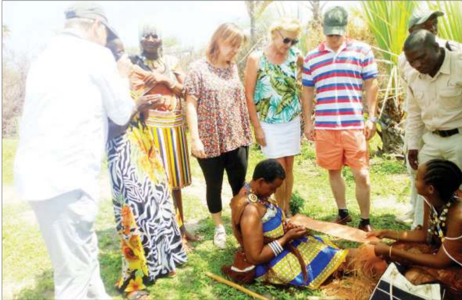
Tourists from the Netherlands admire handicraft made by members of the Barbaig community at Vilima Vitatu in Babati District, Manyara Region, at the weekend.