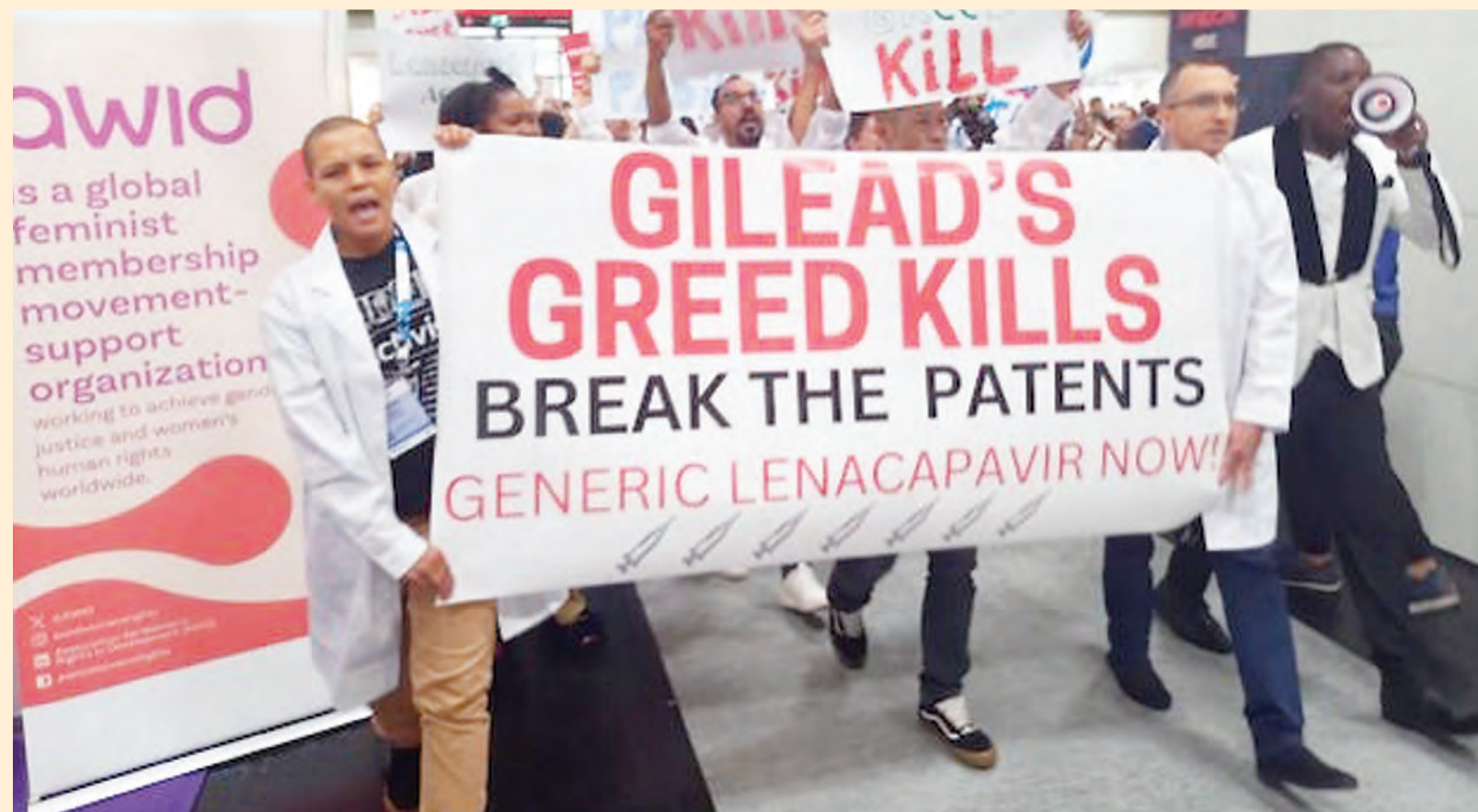
Activists protest during the 25th International AIDS Conference (AIDS2024) in Munich over affordable pricing for a drug currently sold by pharmaceutical firm Gilead.

But they warned there were likely to be challenges to access, with