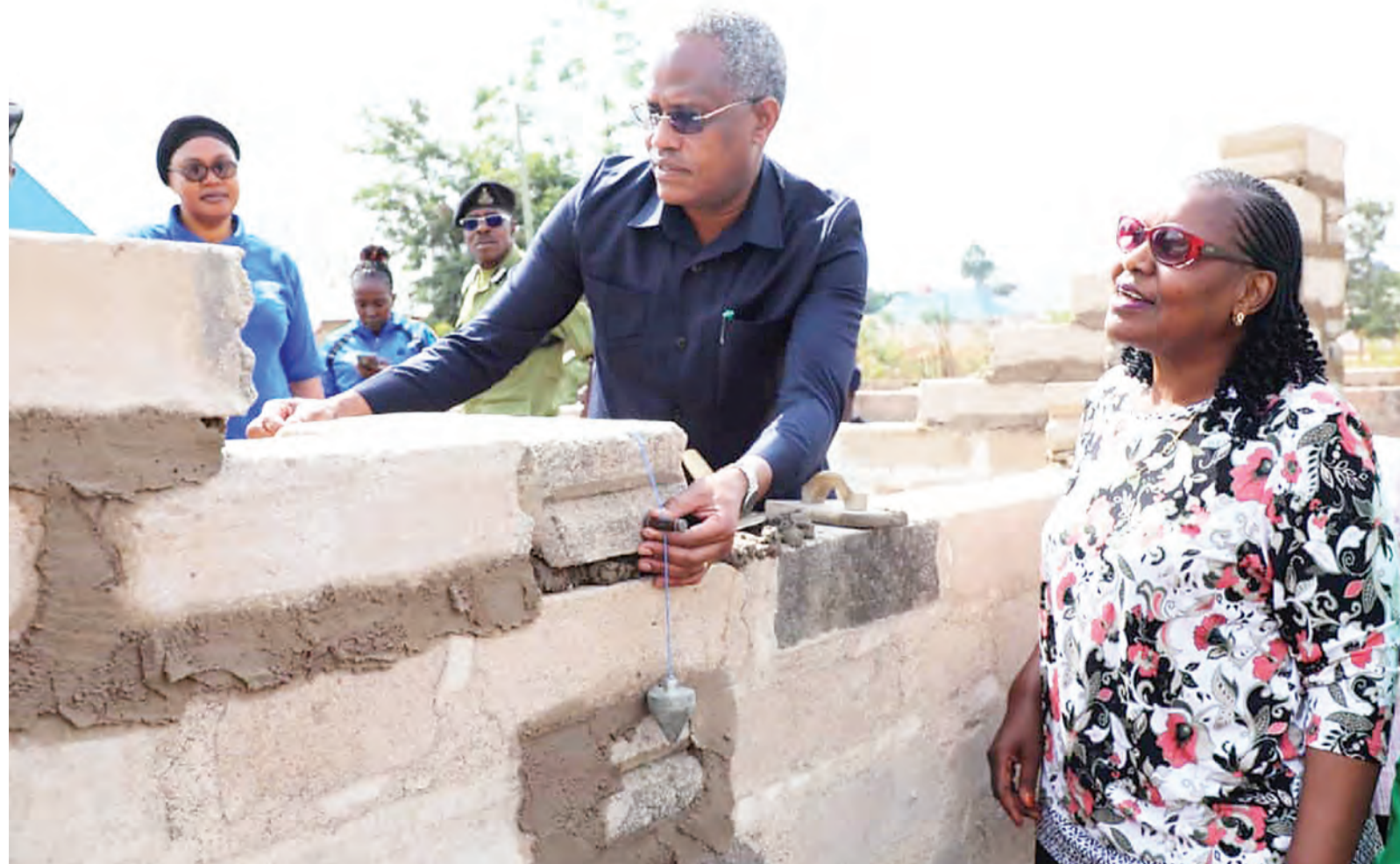
Home Affairs deputy minister Daniel Sillo takes part in the construction of a building at Nyamhongolo Police Station in Ilemela District, Mwanza Region, while on an official visit on yesterday. Right is Ilemela constituency legislator Dr Angelina Mabula.

doctors - 50 general practitioners and 50 specialists, including dentists, pediatricians, and opticians - volunteered to offer these crucial services. Supported by a dedicated team of approximately 500 volunteers, this collective effort highlights the power of compassion and unity in addressing community health needs.