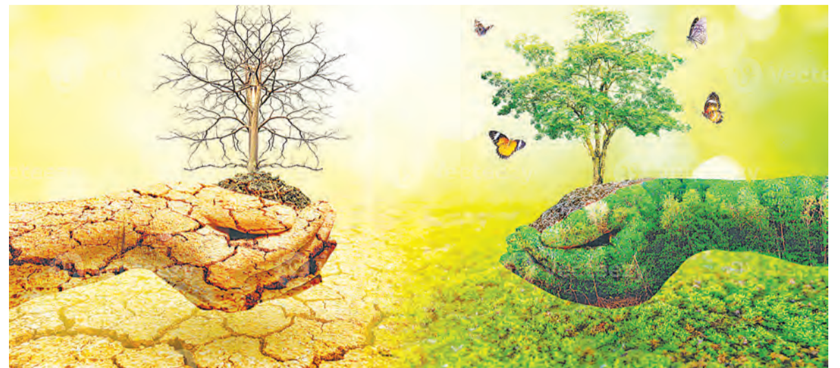
A visualisation on the importance of environmental conservation in relation to climate change effects. File Photo.

2024, more than 351 AMCOS have participated in tree planting campaigns in the areas of their operations across the country," said Dr. Komba.