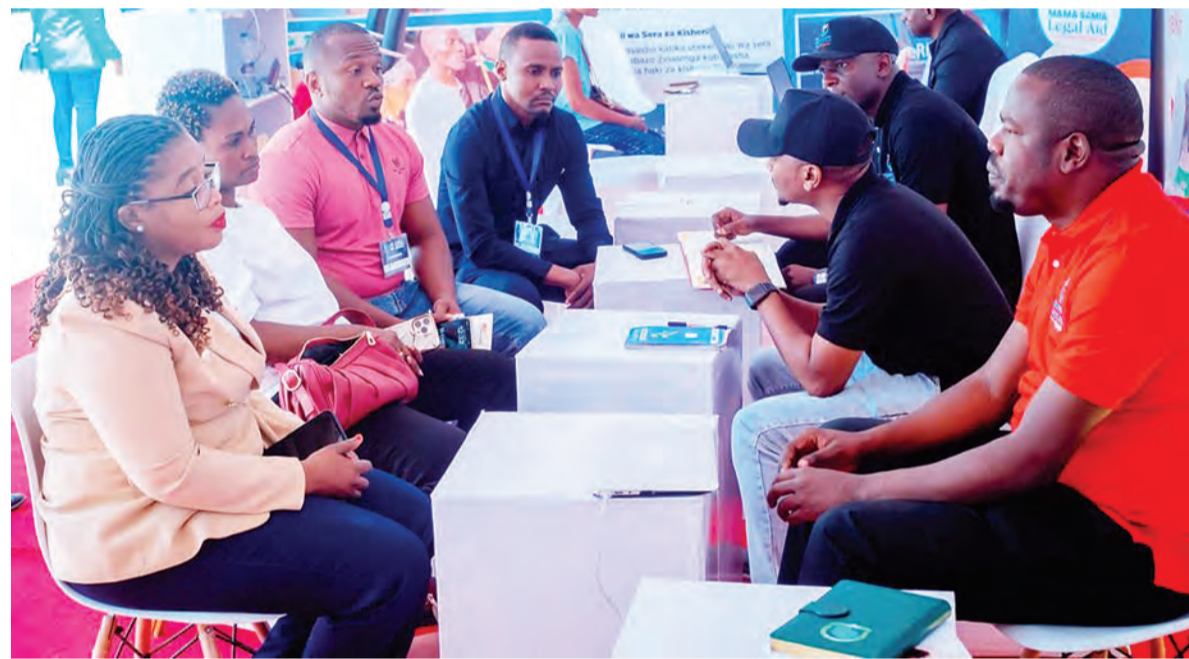
Samia Legal Aid Campaign officials (R) extend legal aid to members of the public yesterday at their pavilion at the annual Nane Nane (Farmers' Day) agricultural exhibition in Morogoro municipality.