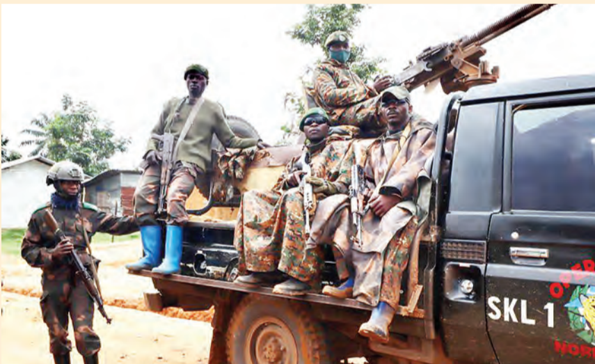
A file photo taken on July 25, 2024, shows soldiers seen in Cantine, a village in North Kivu Province, the Democratic Republic of the Congo (DRC).

The Congolese army's fight against the ADF started in 2016, when government