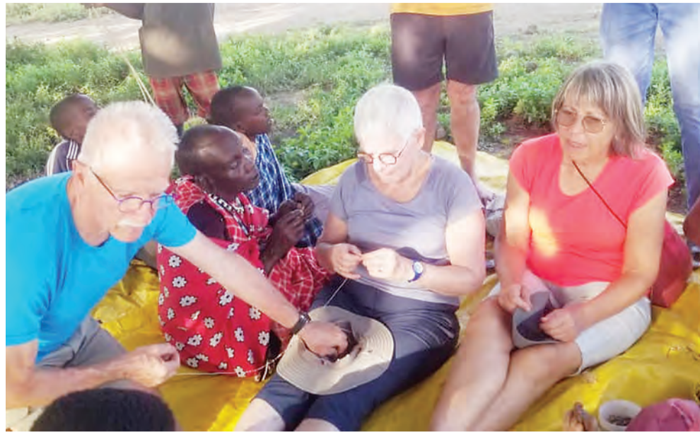
Travellers in one of the villages in Zanzibar

Execution of income generating activities has led to an increase in group membership from 20 to 35 and formation of additional farmers' groups in Pongwe village.