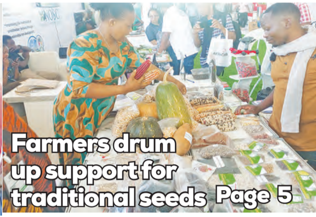
Farmers drum up support for traditional seeds Page 5