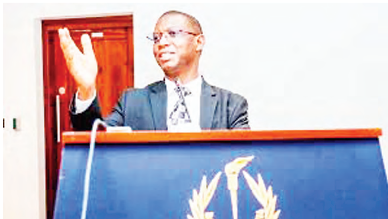
Bank of Tanzania governor Emmanuel Tutuba

The report on summary of assessment of the recent performance of the economy and outlook which was signed by BoT Governor, Emmanuel Tutuba showed that, "the country's economy continued to grow by 5.1 percent in 2023 compared to 4.7 percent in previous