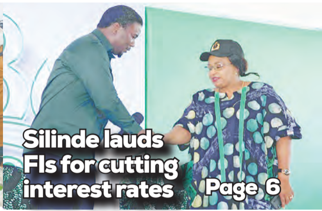
Silinde lauds FIs for cutting interest rates Page 6