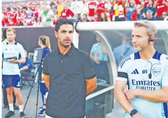
Mikel Arteta's insistence to upgrade his left-backs shows his desire for defensive perfection.

There are several instructive elements. One is that, despite posting the best defensive record last season - conceding five goals fewer than Manchester City, 12 fewer than Liverpool and 22 fewer than Everton, the fourth most frugal side - Arteta's immediate target was to