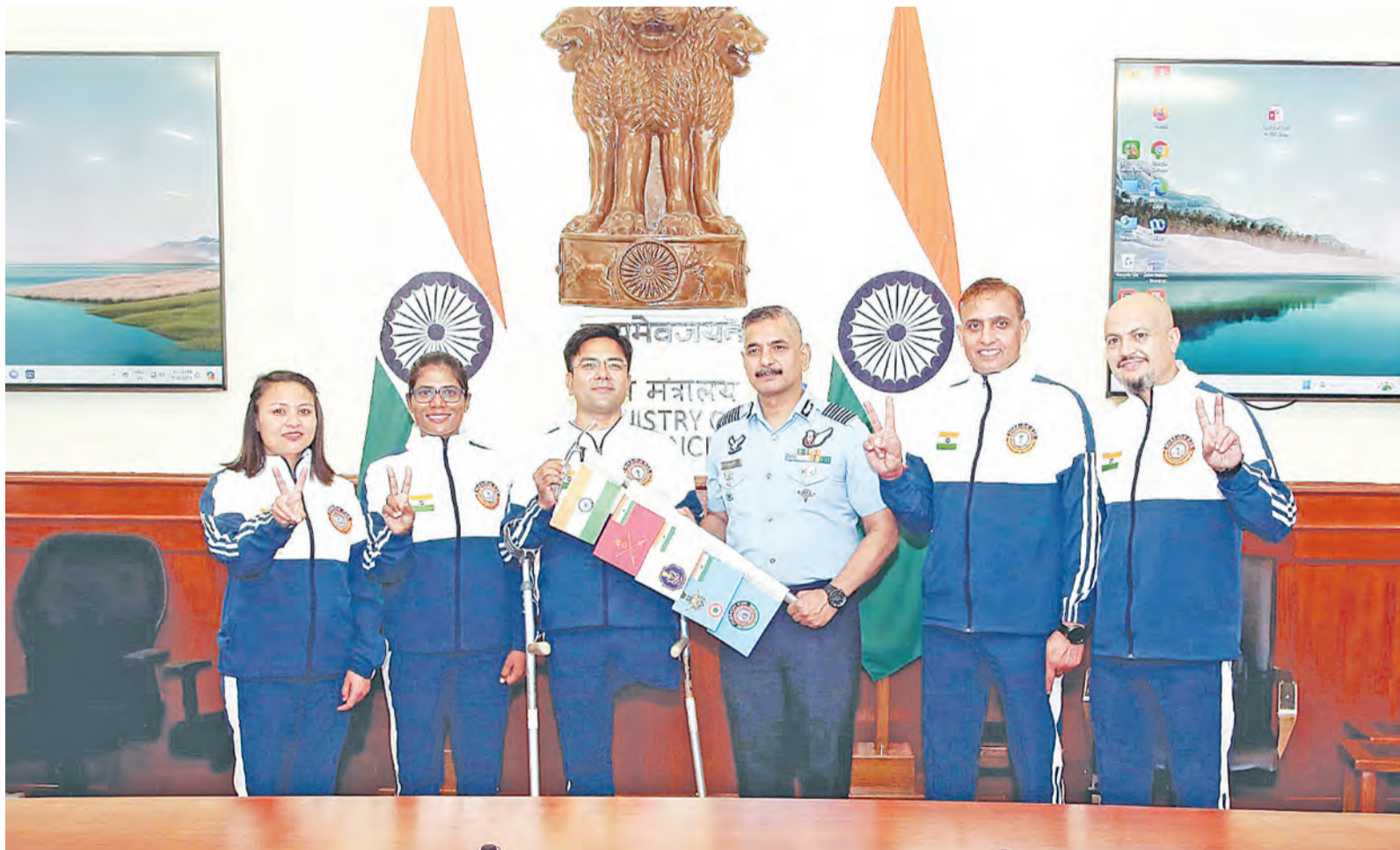
These are members of a delegation of Indian nations expected to scale Mount Kilimanjaro under 'empowerment' of the Himalayan Mountaineering Institute. One is a 91 per cent above-knee leg amputee. The expedition was flagged off in India on July 30 and is determined to unfurl the Indian national flag at the mountain's highest point, Uhuru Peak, by August 15.

The World Health Organisation (WHO) says mpox (previously known as monkeypox) has from May 2022 to 31 May 2024 been noticed 97,745 cases and 203 deaths reported from 116 countries worldwide, the statement added.