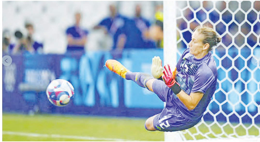
Germany goalkeeper Ann-Katrin Berger saves a penalty shoot-out during their match against Canada.

however, by an injury to defender Rafaelle, who was taken off by stretcher in the second half and later seen using a crutch.