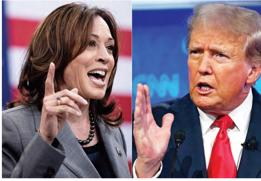
This combination of file pictures created on August 3, 2024 shows US Vice-President and 2024 Democratic presidential candidate Kamala Harris speaking on March 26, 2024, in Raleigh, North Carolina; and former US president and Republican presidential candidate Donald Trump speaking in the first presidential debate with US President Joe Biden in Atlanta, Georgia, on June 27, 2024.

Trump, speaking at the same stadium where Harris held a rally on Tuesday, said on Saturday that there were "19 different ways" of pronouncing Harris' first name, while also calling her a "lunatic" with a "low IQ." Before Trump took the stage, his campaign displayed an article on a large screen referring to