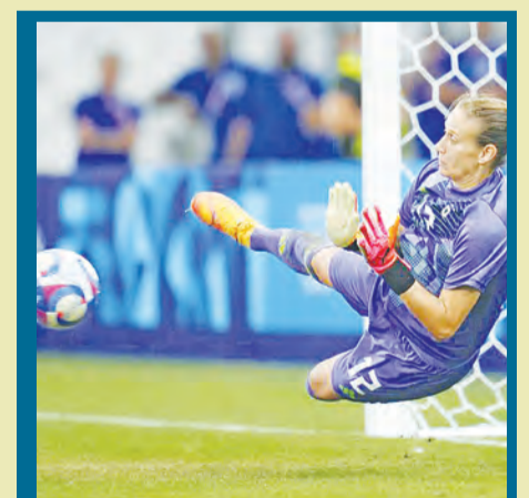
Brazil beats France 1-0 and advances to the semifinals of Olympic women's soccer tournament