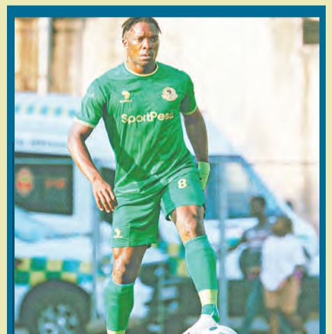
Consistent midfielder blocks Aucho's NBC PL Best XI path