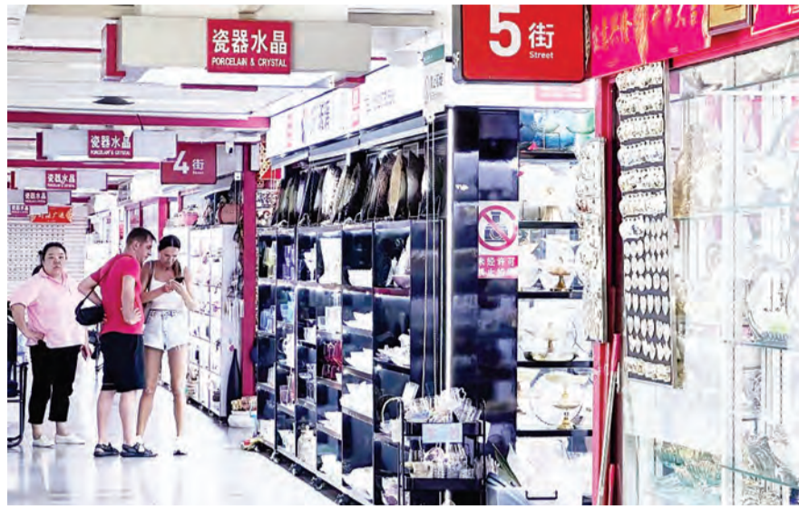
Foreign merchants select goods at the Yiwu International Trade Market in Yiwu, east China's Zhejiang Province, July 29, 2024.