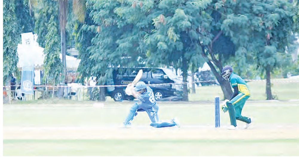
Tanzania's U-19 men's cricket squad's batsman (L) puts his prowess to show during the ICC U-19 Men's World Cup Qualifier Africa Division 2 clash against Nigeria held in Dar es Salaam last weekend.