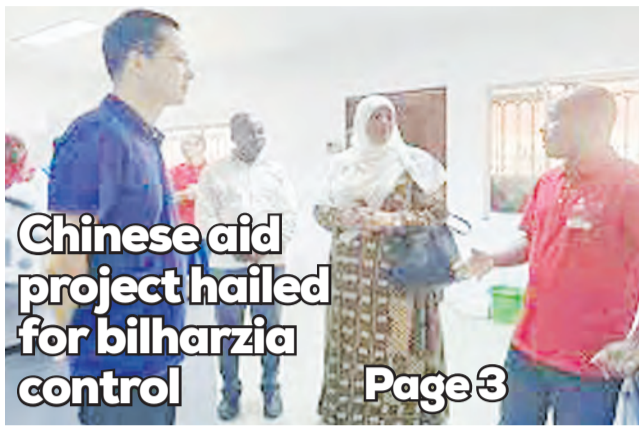
Chinese aid project hailed for bilharzia control Page 3