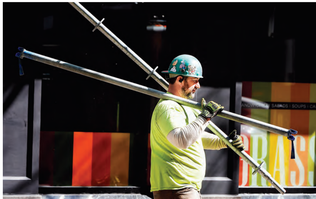
A construction worker carries scaffolding parts on March 14, 2024, in Boston.

It is "difficult to understand" why the Fed has not already started an interest rate cutting cycle when the economy is slowing, real progress is being made in re-