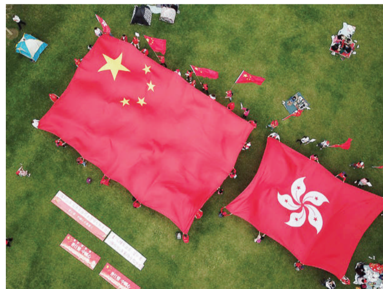
Aerial photo taken on March 6, 2021 shows people displaying China's national flag and the flag of the Hong Kong Special Administrative Region in support of implementing the principle of "patriots administering Hong Kong" at Tamar Park in Hong Kong, China. File photo

Hong Kong is an inalienable part of China and its affairs are China's internal affairs that brook no interference by any external forces. How