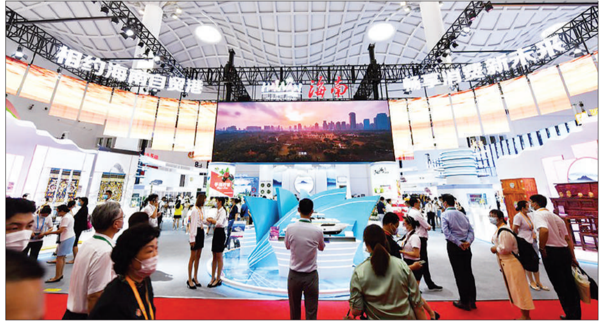
People visit the Hainan Exhibition Area during the first China International Consumer Products Expo in Haikou, capital of south China's Hainan Province, May 7, 2021.

China in 2018 proposed the establishment of a free trade zone in Hainan and began construction of the Hainan FTP last year to build the island into a globally influential and high-level free trade port by the middle of the century. Hainan has implemented a package of favorable policies to ease market access and further facilitate free trade, invest-