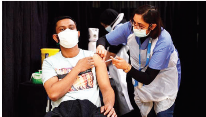
A health worker gives an injection of the AstraZeneca/Oxford vaccine at a temporary vaccination centre set up at the East London Mosque in London on April 14, 2021. (File photo)

England, and the other nations of the UK, calculates COVID-19 mortalities by counting the number of people who died within 28 days of a first positive test.