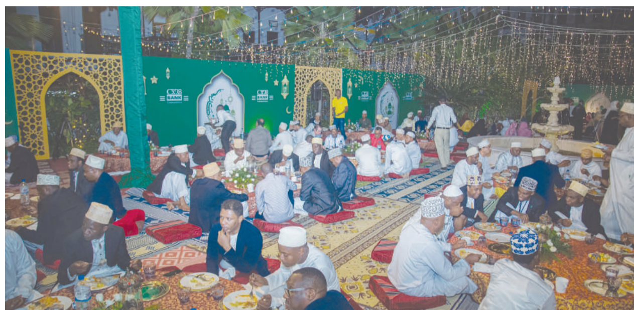
CRDB Bank customers and stakeholders during the iftar event organized by the bank at the Park Hyatt Hotel, Zanzibar, 7 May 2021.