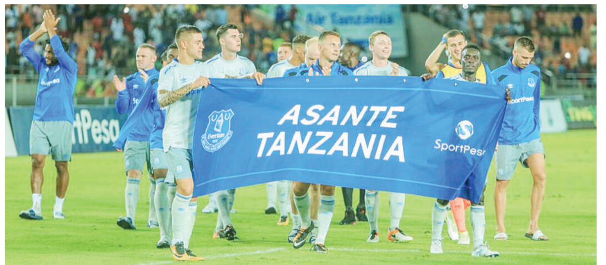
English Premier League's Everton FC's players express gratitude to soccer enthusiasts, who turned up for the side's clash against 2017 SportPesa Super Cup winners, Kenya's Gor Mahia, which took place at Benjamin Mkapa Stadium.

Many people believed SportPesa would have