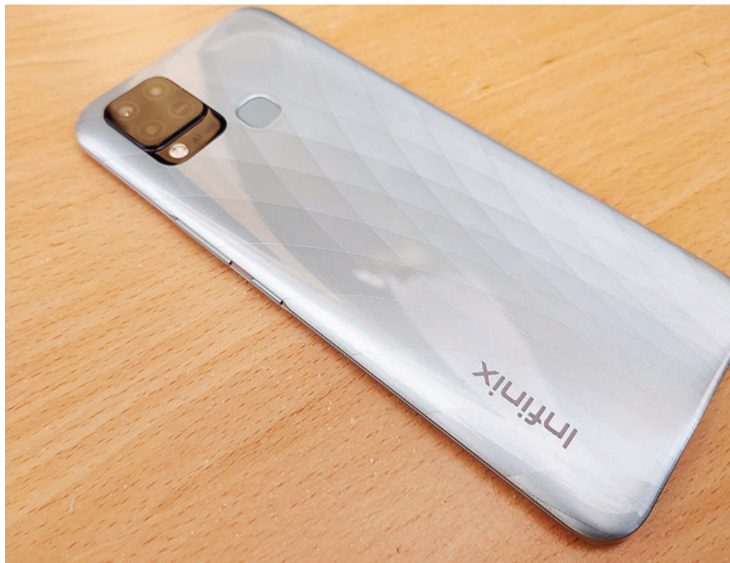
An Infinix Hot10t smartphone on display at a shop.