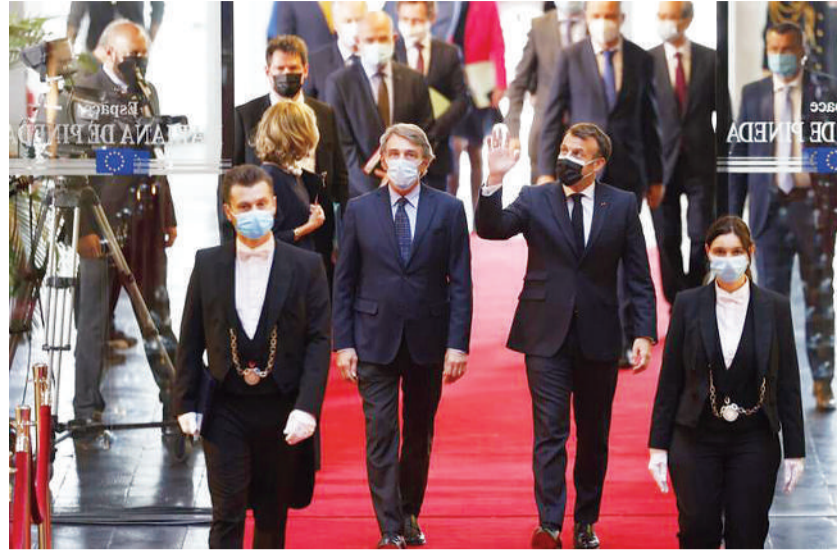
French President Emmanuel Macron (center, right) and European Parliament President David Sassoli (center, left) arrive at the European Parliament in Strasbourg, eastern France, May 9, 2021 before launching the Conference on the Future of Europe and to mark Europe Day.

The French president, a powerful voice in the EU who will face the next