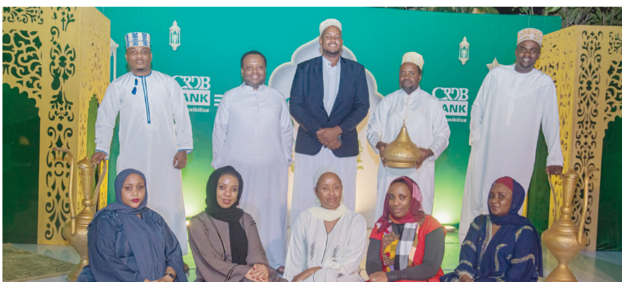
CRDB Bank's Corporate Affairs staff pose for a group photo at one of the iftar events organized by the bank for customers and people in need in Zanzibar.