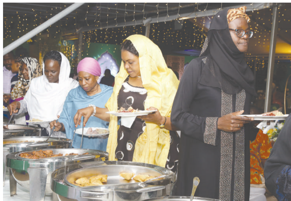
Deputy Speaker of the National Assembly, Tulia Ackson serves herself iftar hosted by CRDB Bank for Members of Parliament in Dodoma at the Parliament grounds on May 4, 2021. Others include the Minister of Labor, Jenista Mhagama, Minister of TAMISEMI, Ummu Mwalimu and Minister of Education, Prof. Joyce Ndalichako.