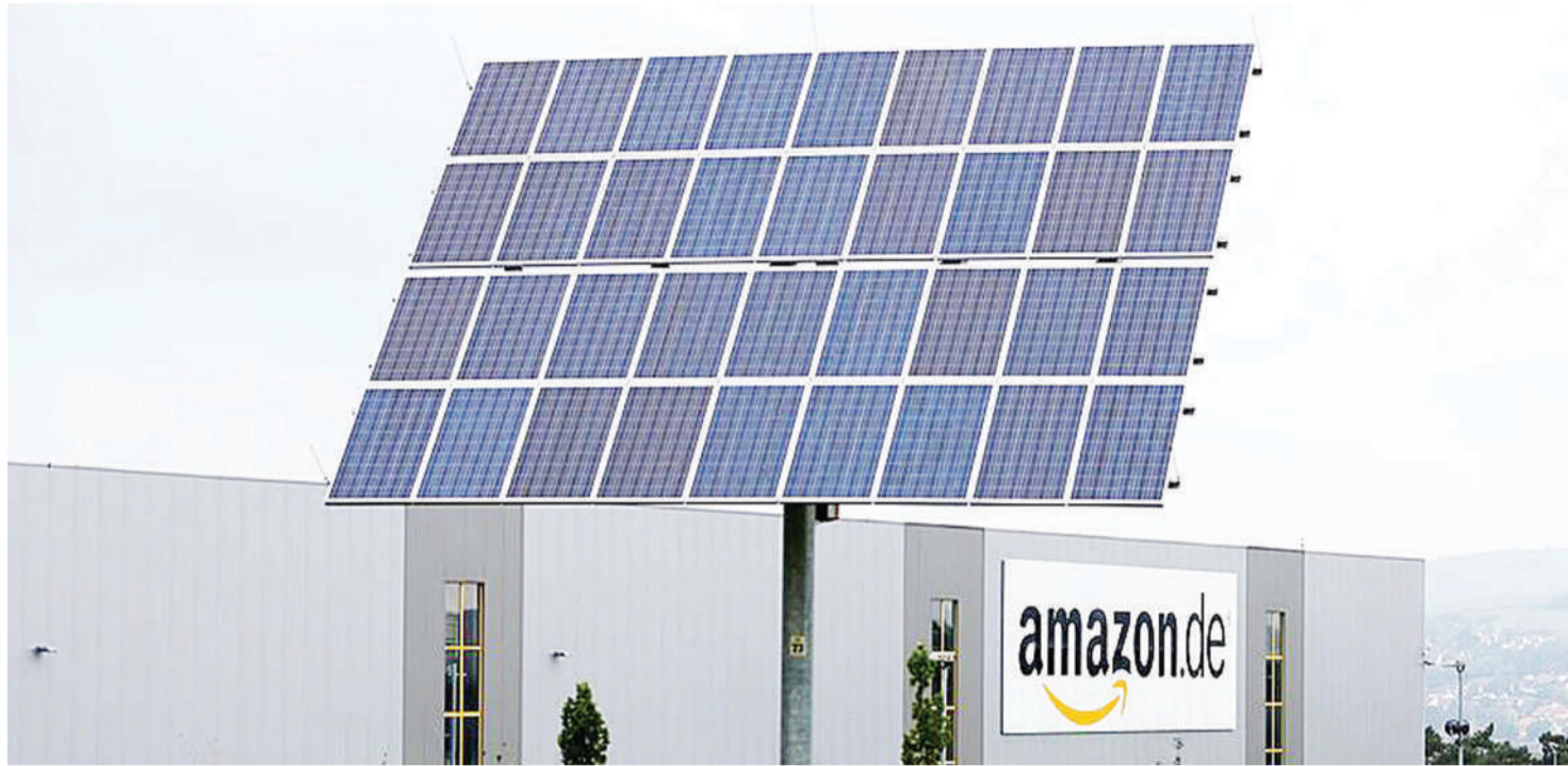
Photovoltaic panels in front of the Amazon distribution centre in Bad Hersfeld, Germany.

Sustainable finance has gained traction over the past year as some of the world's biggest companies and fund