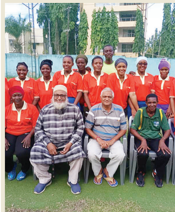
Female cricketers, who took part in a seminar for umpiring and match scoring hosted by Tanzania Cricket Association (TCA), pictured with the association's officials in Dar es Salaam last weekend.