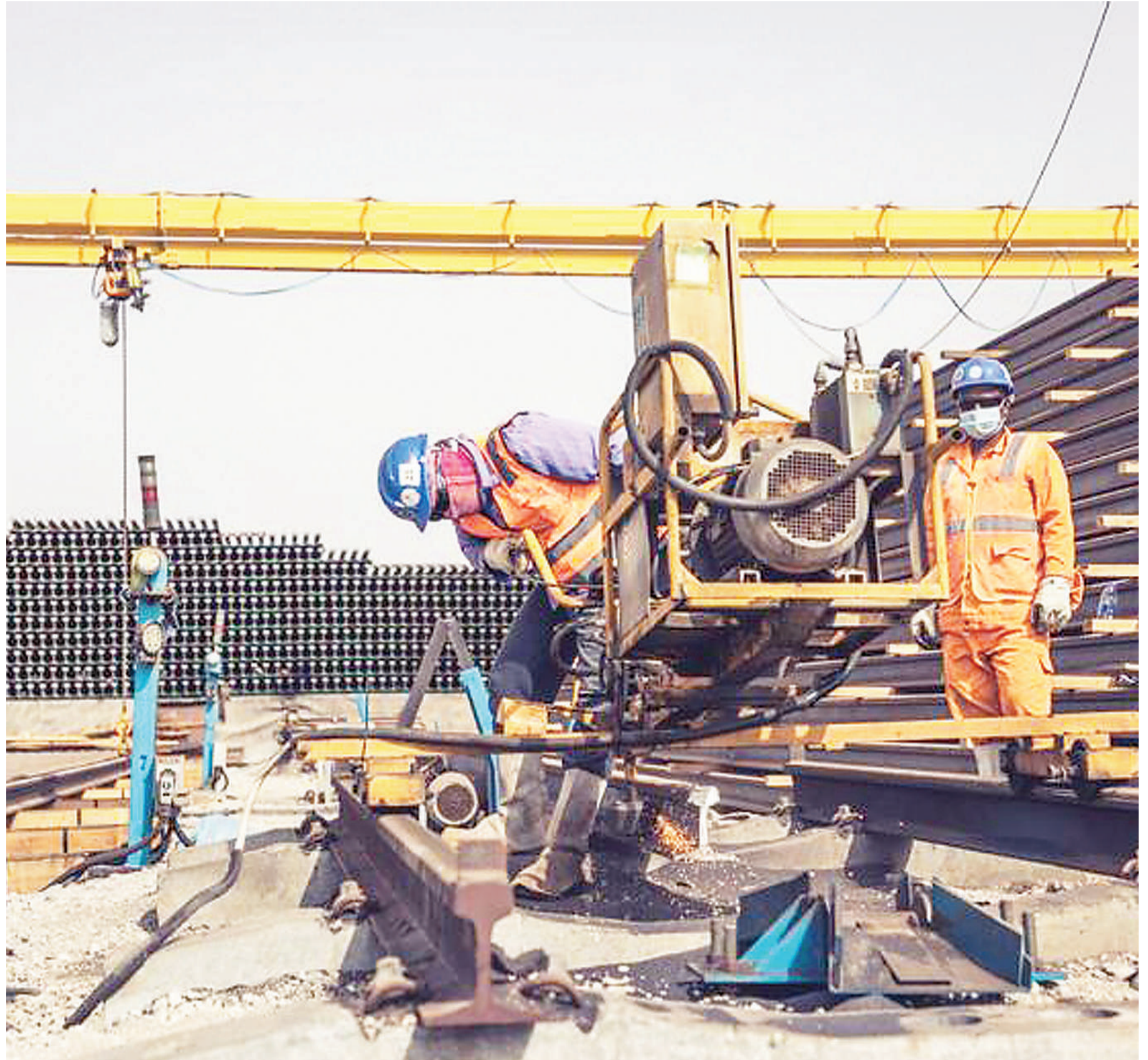
CSCEC employees ready steel rails for laying track at the construction site of Package A of Etihad Rail's 605-km Stage 2 project in the United Arab Emirates in April. (File photo)

"Innovation is the key to our achievements, and has