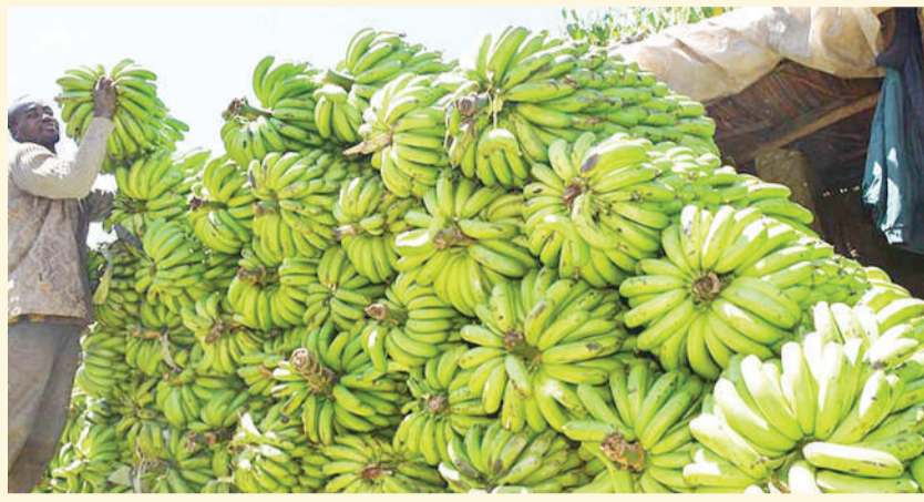
A trader arranges green bananas at Nakuru's Wakulima Market, in Kenya.