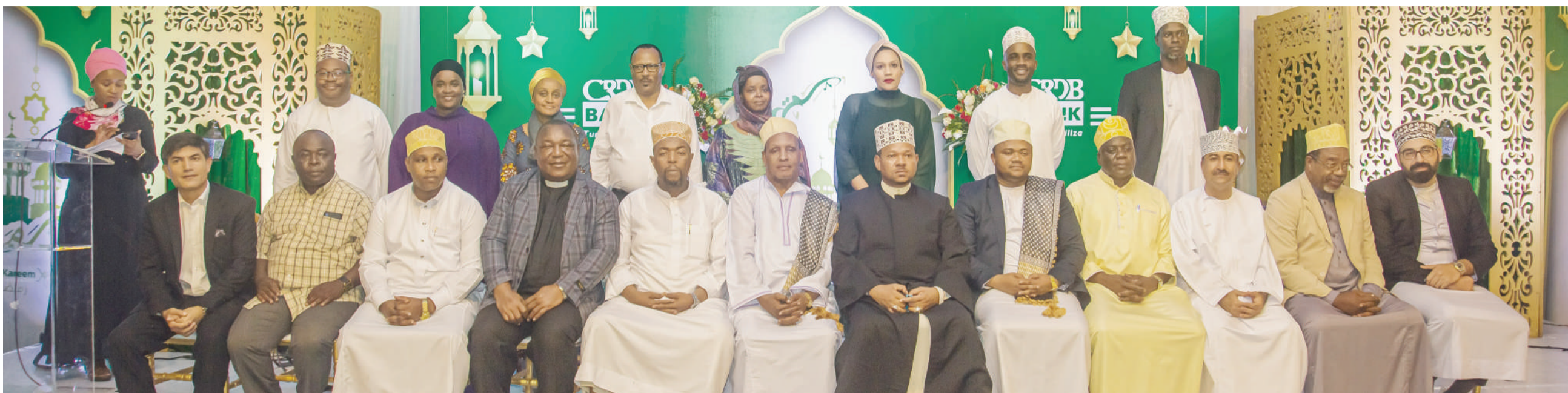
The Board and Management of CRDB Bank in a group photo with customers and invited guests during the iftar event organized by the bank for its Dar es Salaam customers. The iftar ceremony was held at the Serena Hotel Dar es Salaam, 30 April 2021.