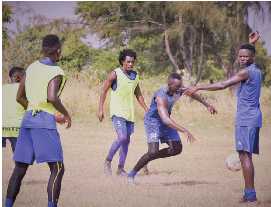
Kinondoni Municipal Council (KMC) FC players participate in training in Dar es Salaam recently.