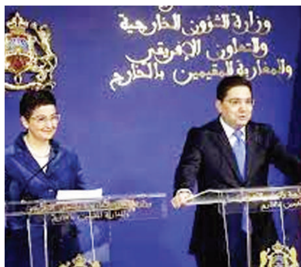
Spanish Foreign Minister, Arantxa Gonzalez Laya (L) and Moroccan Minister of Foreign Affairs, Nasser Bourita at a joint news conference earlier this year.