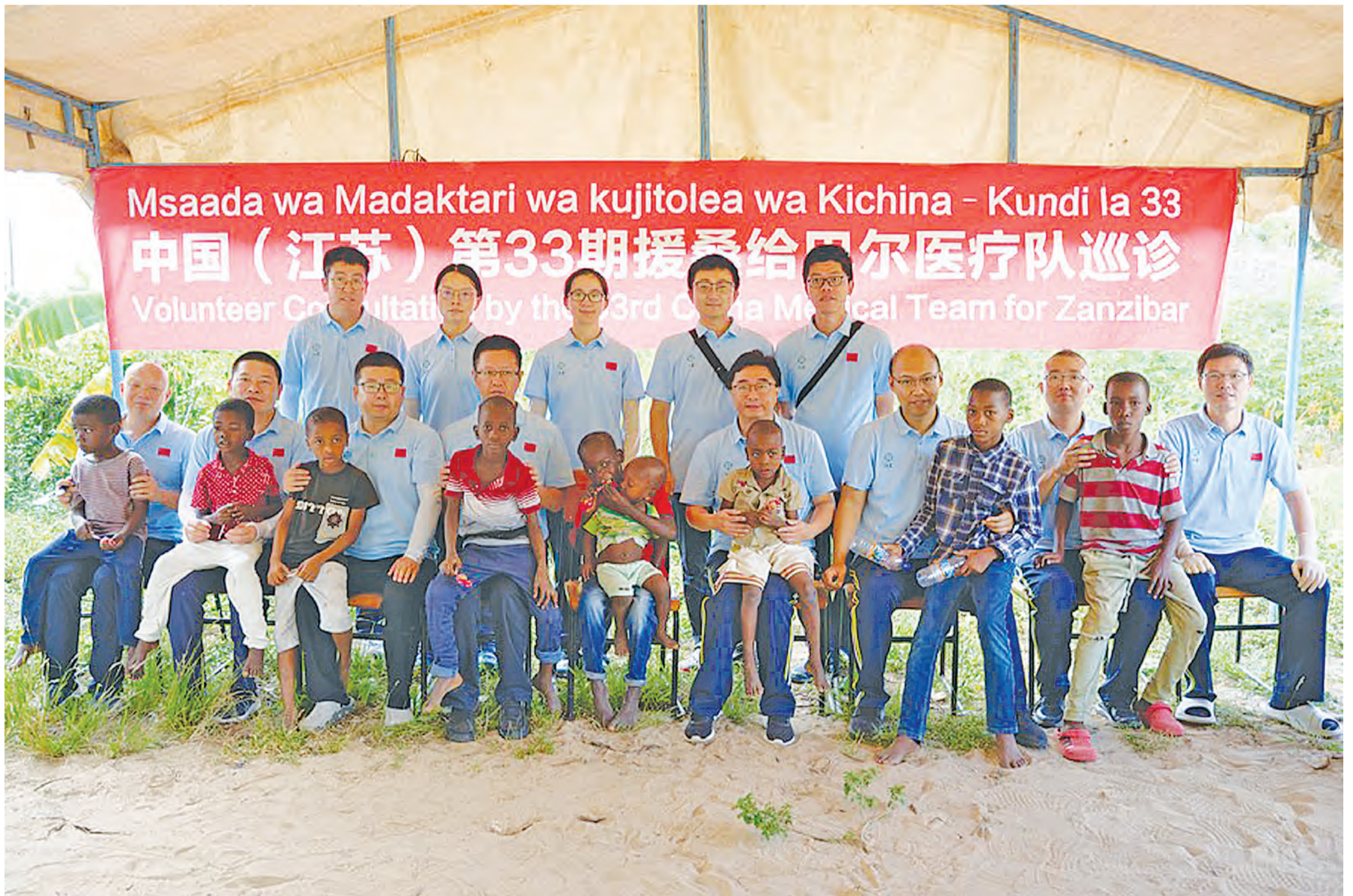
Members of the 33rd batch of the Chinese medical team pose for a photo with local children after providing free medical services in Zanzibar.

Faced with numerous patients, complex disease types, and a serious lack of equipment and drugs, members of the Chinese