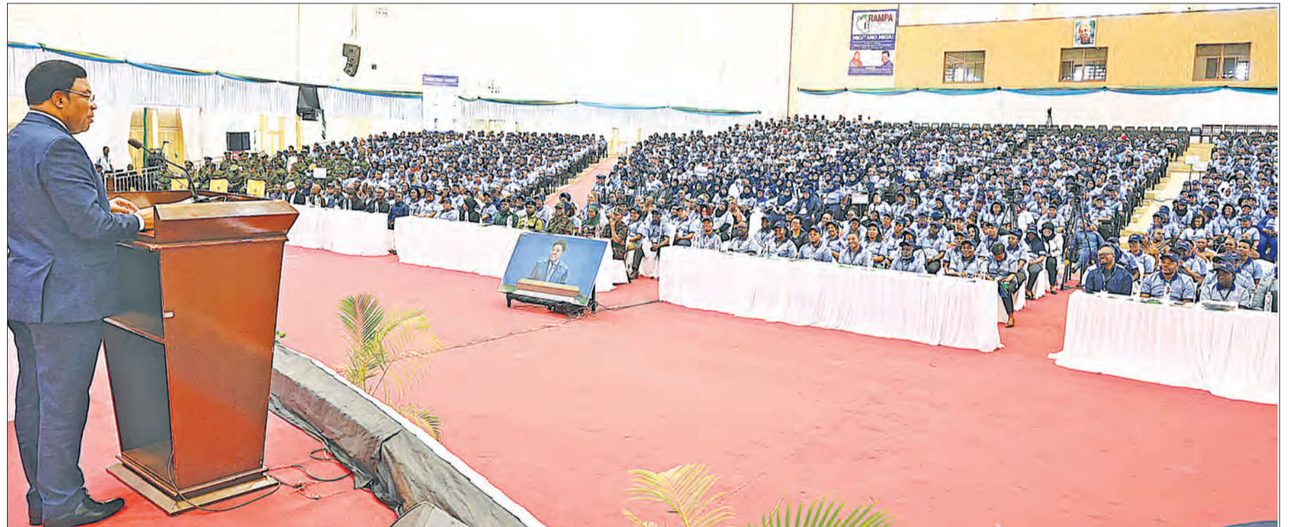
Prime Minister Kassim Majaliwa speaks opens the 11th General Meeting of the Tanzania Records and Archives Management Professionals Association in Dodoma city yesterday.

"As we implement our foreign policy, we have witnessed our bilateral relations with Tanzania grow even further in key areas of trade, investment and infrastructure development," he added.