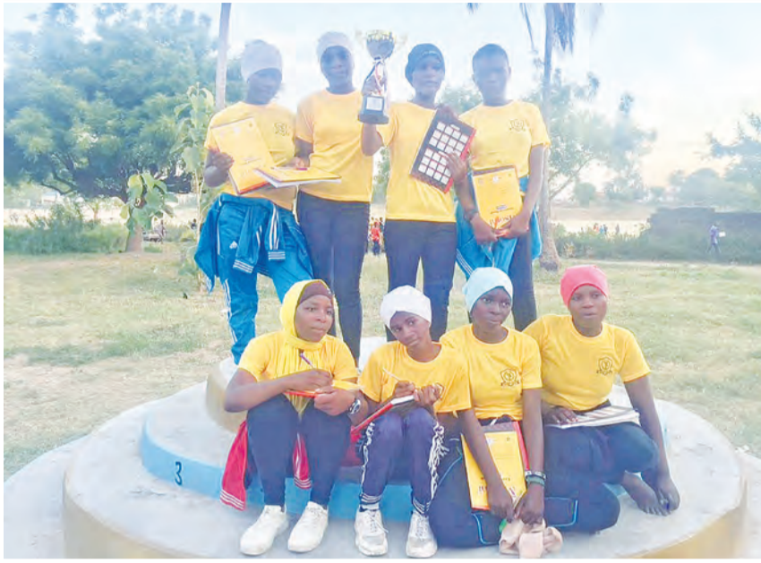
Female junior cricketers making Dunda Secondary School's team pose for a photo shortly after the culmination of this season's Chanzo Cricket Bonanza that took place in Bagamoyo recently. Dunda Secondary School's team won the girls' showdown.