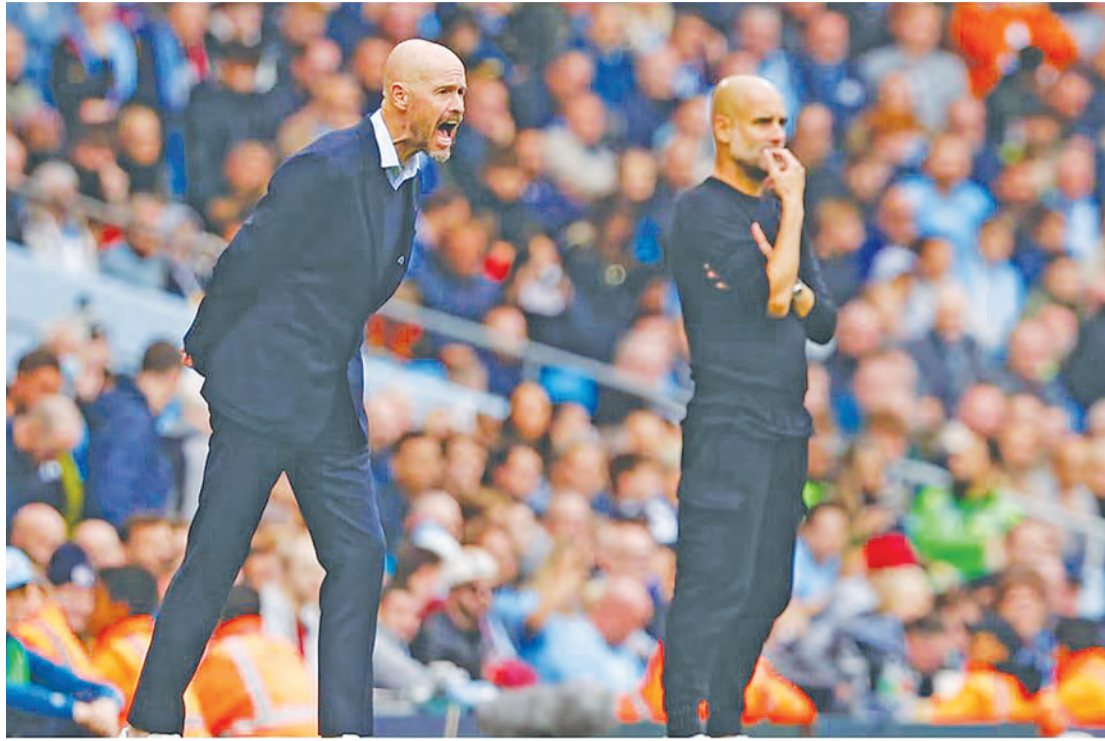
Manchester United manager Erik ten Hag and his Manchester City counterpart Pep Guardiola.

But it is a different story during the current campaign, with Rashford stuck on a solitary goal in a team struggling to find fluency