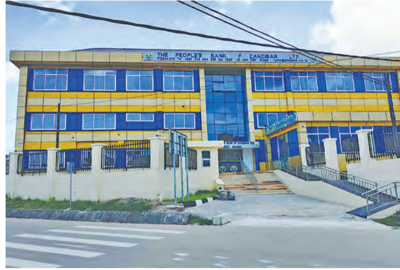
PBZ's Wete branch in Pemba.

The growth of profit has also pushed the basic earnings per share (eps) to 262.36/- during the first three quarters of this year, compared to 154.53/- recorded during nine months of last year. On quarterly basis, eps increased to 97.20/- during the third quarter of this year, compared with 61.08/- in the third quarter of last year.