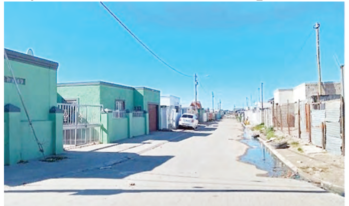
Robert Sobukwe Street in Samora Machel, Philippi. People who live here have to find ways to deal with daily crime.

My dad got robbed on his way to work about a week ago, at the same spot where I witnessed a robbery. His smartphone and transport money were safely inside his socks and the bad guys only got a R10 note and a spare phone that was in his pocket. He says he always keeps stuff in his