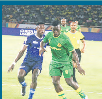
Yanga's new signings a motivation for Aziz Ki