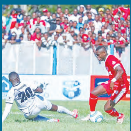
Unbeaten Simba SC targets Ihefu SC scalp in PL