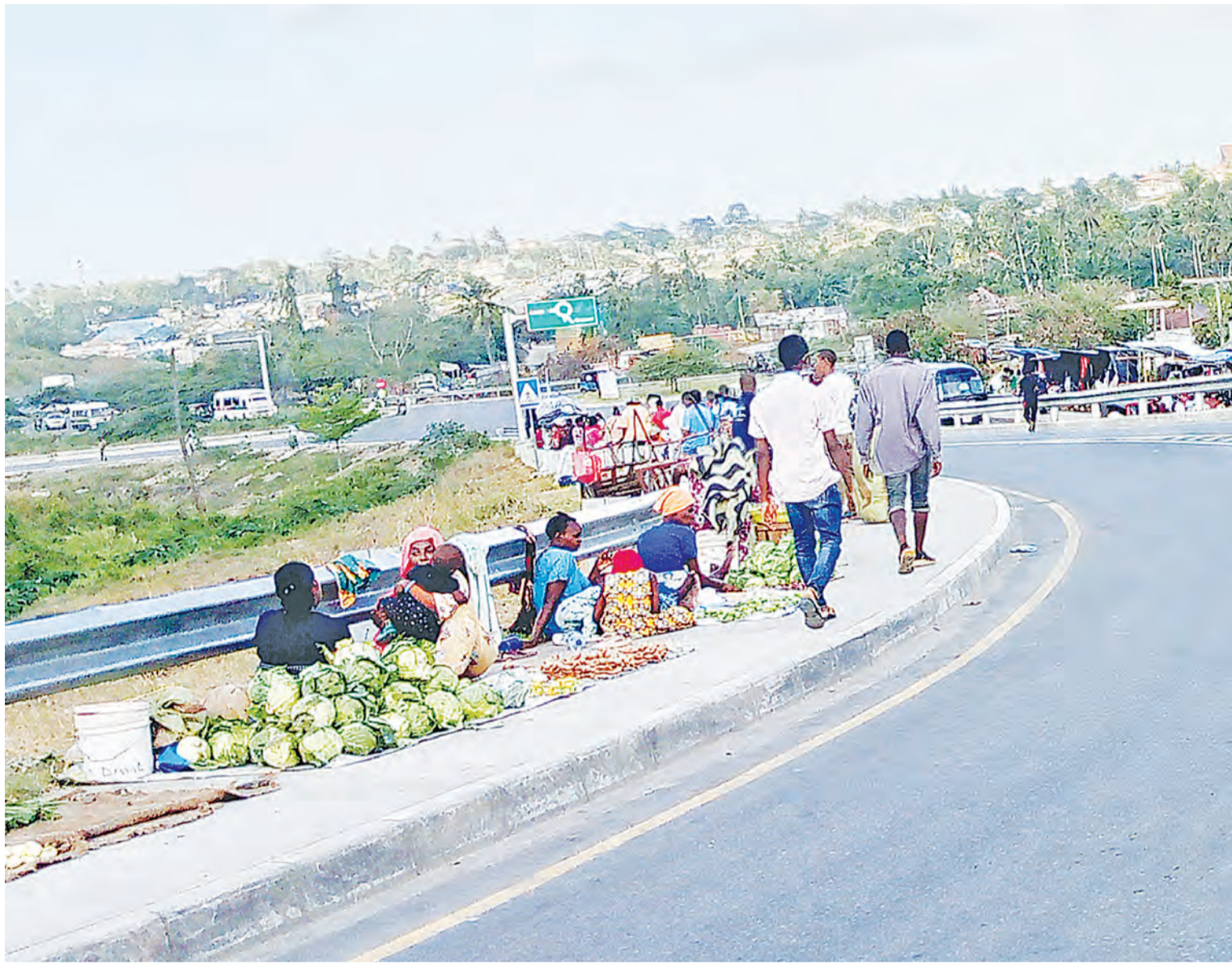
Small traders clearly giving pedestrians a hard time making it along paths meant for them at a section of the Mbezi Mwisho stretch of Dar es Salaam's modernised Morogoro Road, as found yesterday afternoon.