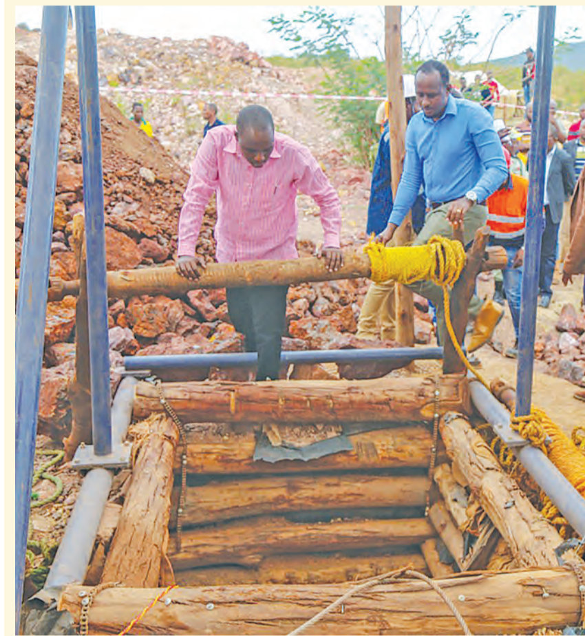
Small-scale mining activity in Tanzania