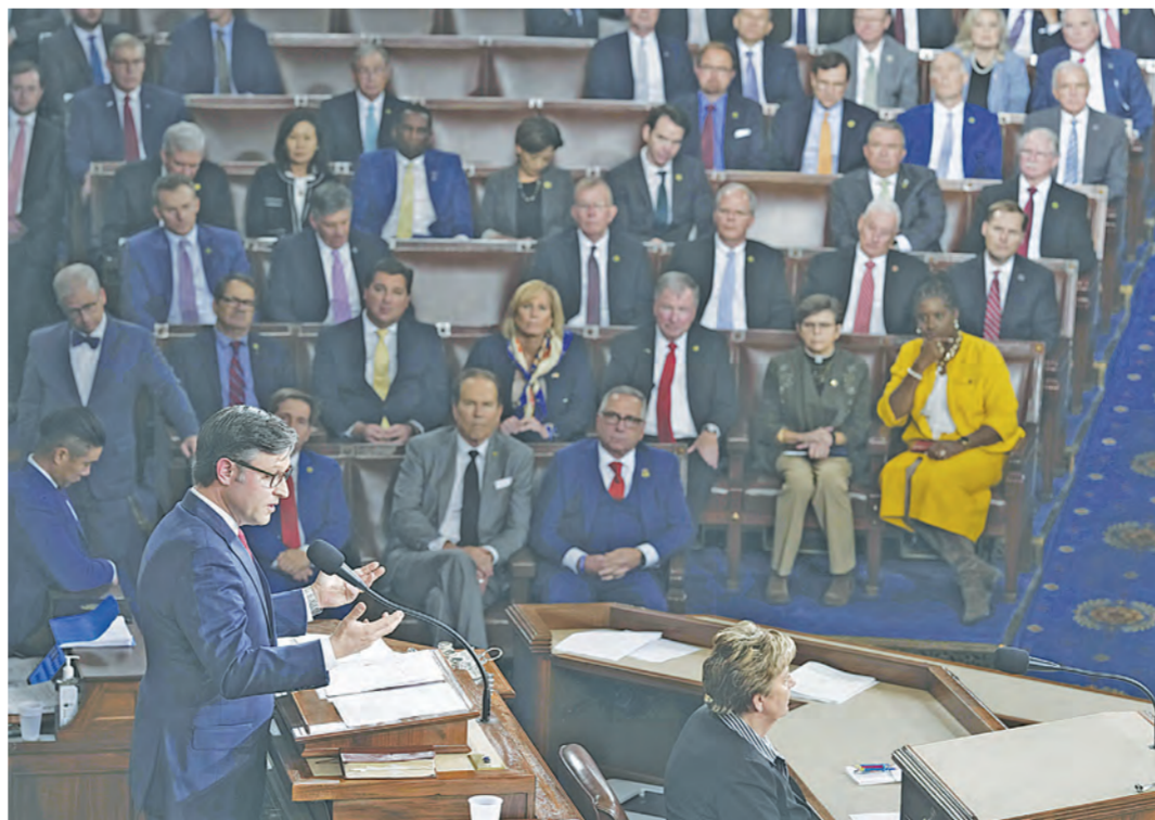
US House Speaker Mike Johnson addresses members of Congress at the Capitol in Washington, Oct 25, 2023.

Less than a month ago, intra-party fighting among Republicans brought the federal government within hours of a partial shutdown, with hardline Republicans rejecting a $159 trillion discretionary spending limit Biden and Johnson's predecessor Kevin McCarthy had agreed on, instead calling for an additional $120 billion in cuts.