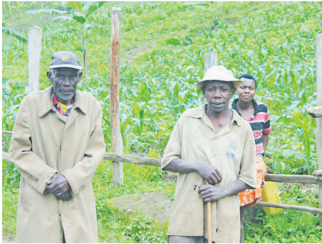
Survivors of the 2011 mudslide in Bududa district. Hundreds died in that disaster. Some of the victims were buried by huge boulders carried down by the impact of the mudslide.

“What do these acts and conventions provide? And how