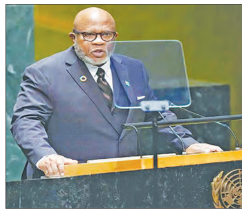
General Assembly President Dennis Francis

At this juncture, the most immediate step is clear: "the violence must cease, and further bloodshed must