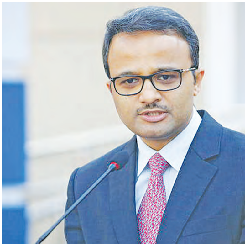
India's High Commissioner to Tanzania, Binaya Pradhan

Tanzania in July 2016 giving a significant boost to development cooperation.