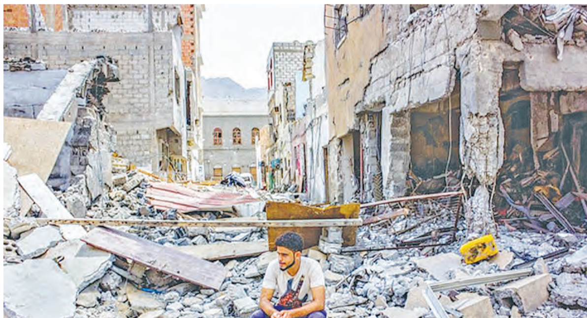
Frustration among the population in Yemen is running high, and there have been repeated roadblocks, injuries and even deaths during protests.

Criticism also came from the ranks of the General People's Congress (GPC), the former unity and ruling party, to whom, until his surprising ouster by the National Security Council on 27 September, the prime minister of the Houthi government, Abdel-Aziz bin Habtoor, had belonged.