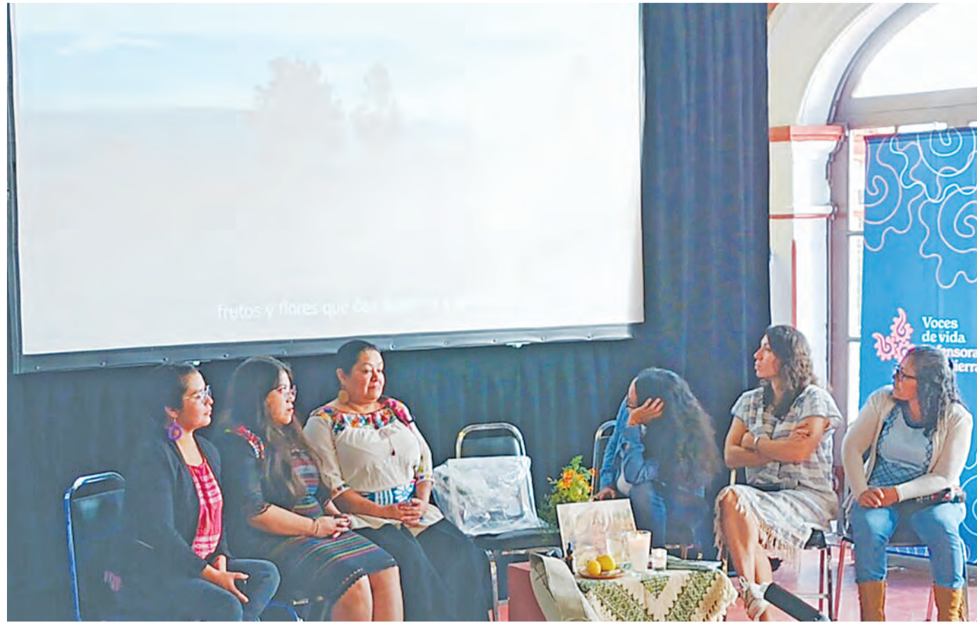
Dozens of women environmentalists participated in Mexico City in the launch of the Voices of Life campaign by eight non-governmental organizations on Oct. 12, 2023, which brings together hundreds of activists in five of the country’s 32 states.

“There was no public consultation of the plan based on a vision of development from the perspective of native peoples. In addition, it encourages real estate speculation, changes in land use and invasions,” said López, a member of the non-governmental organization Sembradoras Xochimilpas, part of the Voices of Life campaign.