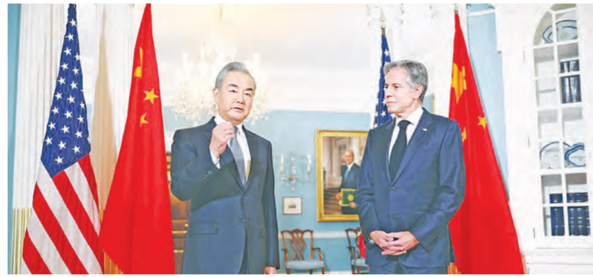
China's Foreign Minister Wang Yi meets with US Secretary of State Antony Blinken at the State Department on Thursday.