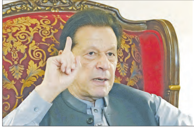
Pakistan's former prime minister Imran Khan

Former cricket star Khan denies that and said the contents of the cable appeared in the media from other sources. Lawyer Naem Panjutha said the Islamabad High Court de-