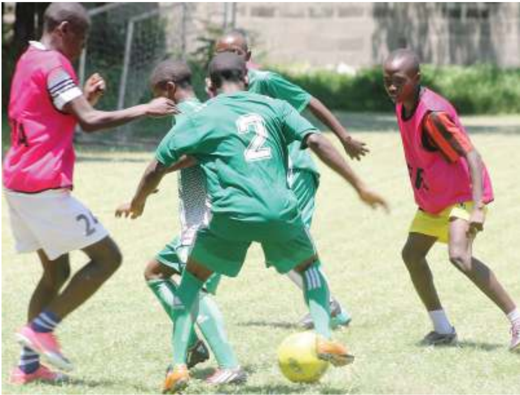
Grin White football team's players (in green kits) take on youths that are taking part in a junior training program conducted by Tanzania Football Federation (TFF) in a match, which was held at Laureate International School's venue at Mbezi Beach, Dar es Salaam recently.