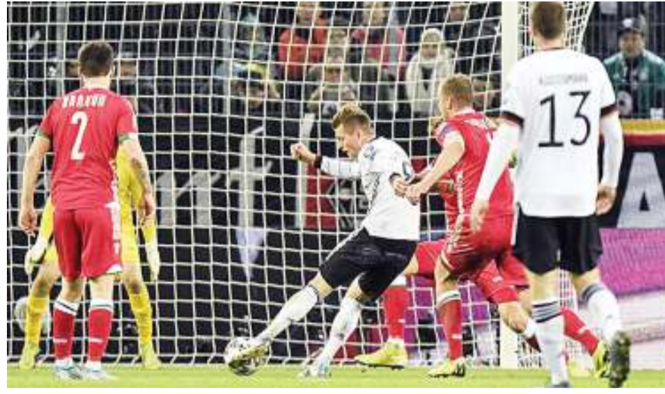
Germany's Toni Kroos scores his side's 4th goal during the Euro 2020 group C qualifying soccer match between Germany and Belarus in Moenchengladbach, Germany, Saturday, Nov. 16, 2019.