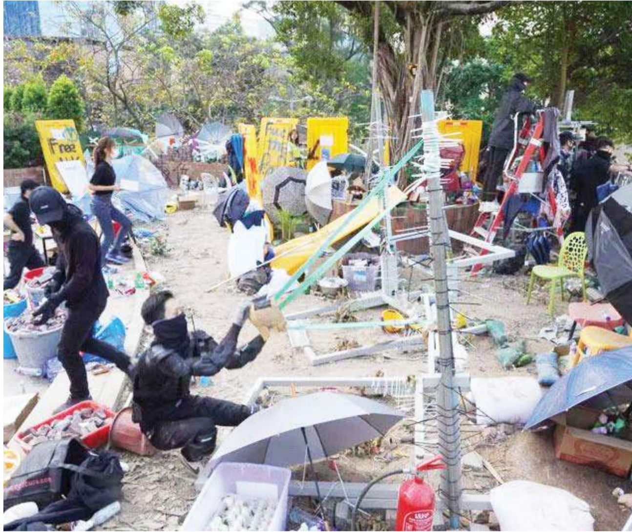
A black-clad protester tries out a large catapult at the Hong Kong Polytechnic University, Hong Kong yesterday

On the contrary, Nancy Pelosi, speaker of the U.S. House of Repre-