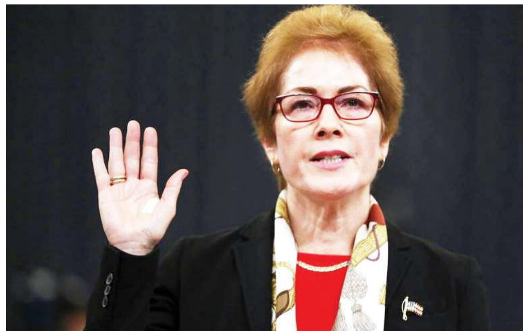
Former US Ambassador to Ukraine Marie Yovanovitch

the former Soviet Union and Nazi Germany, her career included three tours as an ambassador to some of the world's toughest postings, before arriving in Ukraine in 2016. She was forced out last May.