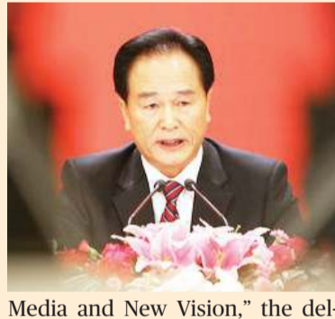
Media and New Vision," the del-

will preside over the meeting. Senior executives of the Agence France-Presse (AFP), Al Jazeera Media Network, the Associated Press, BBC, Kyodo News, Naspers South Africa, Reuters, Folha de S. Paulo Press Group of Brazil, International News Agency and Radio Sputnik, TASS Russian News Agency, the Hindu Group, Xinhua and ANSA will attend the meeting. With a theme of "New Era, New