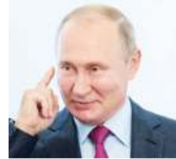
out to do," he noted.

"Not only liberated, but also returned under the control of the legitimate government. We have achieved what we had set