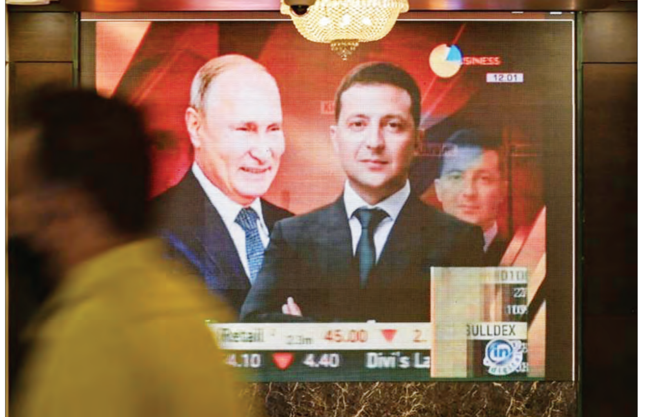
A man walks past a digital broadcast screen airing news of the conflict between Russia and Ukraine at the Bombay Stock Exchange (BSE) in Mumbai on Feb 24, 2022.

"We continue our attempts to achieve a ceasefire," Erdogan said, adding that Turkish Foreign Minister Mevlut Cavusoglu will continue "shuttle diplomacy" visiting Ukraine on Thursday after his talks with his Russian counterpart in Moscow on