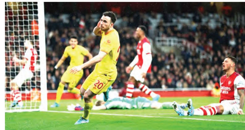
Liverpool have the Big Mo in the chase to the title -- as in momentum, not just Salah.

City haven't been playing badly. Their 3-2 defeat at home to Tottenham Hotspur on Feb. 19 was their first league loss since October, but City and Liverpool have been so close to each other over the past four years that every dropped point matters. Monday's 0-0 draw at Crystal Palace was an unexpected stumble by City,