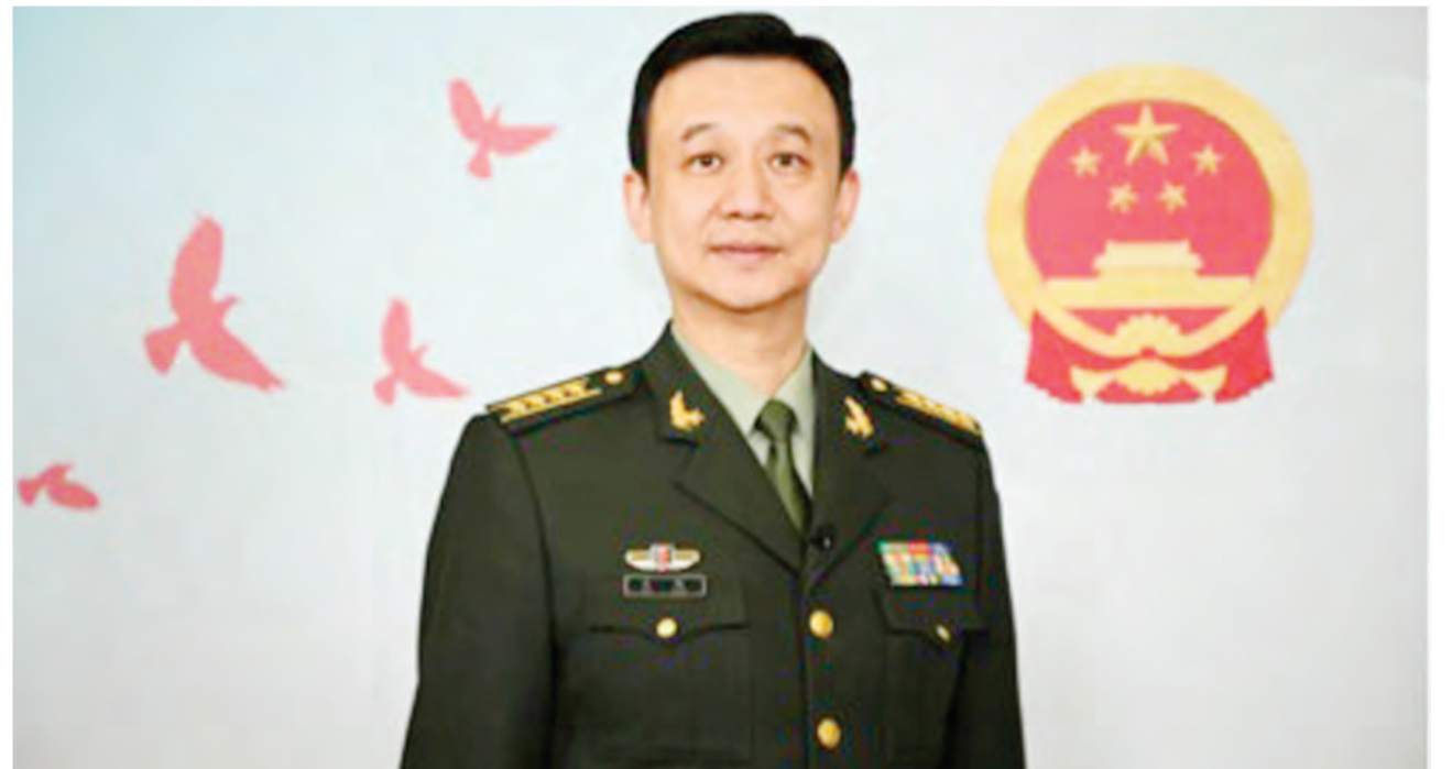
Wu Qian, spokesperson of the People's Liberation Army (PLA) and People's Armed Police Force delegation to the 5th session of the 13th National People's Congress

Wu said China's increased defense budget is necessary both to cope with