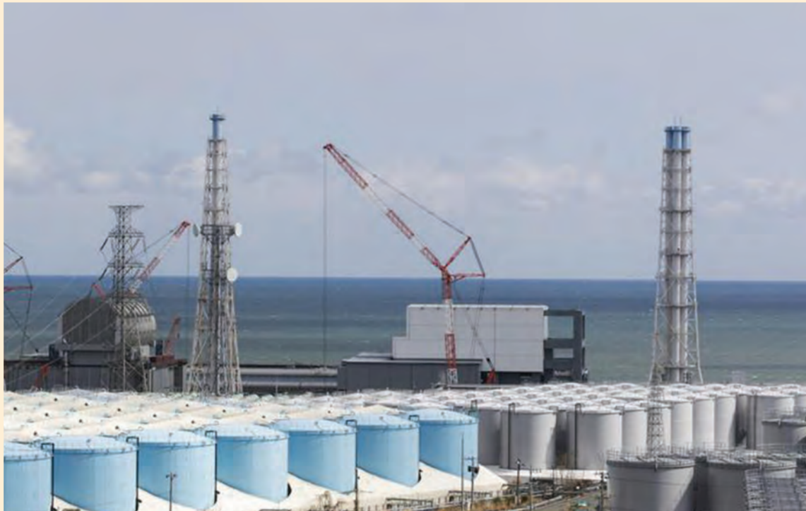
The Pacific Ocean looks over nuclear reactor units of No 3 (left) and 4 at the Fukushima Daiichi nuclear power plant in Okuma town, Fukushima prefecture, northeastern Japan on Feb 27, 2021.

to be fully restored, posing challenges to Prime Minister Fumio Kishida's drive to restart Japan's idle plants.