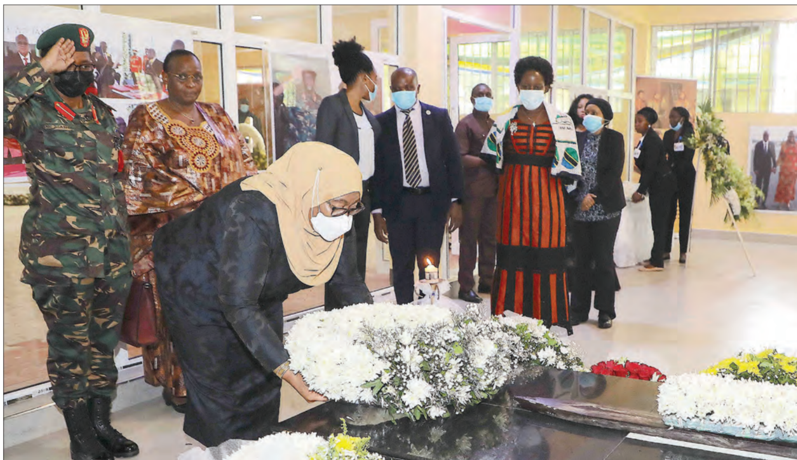
President Samia Suluhu Hassan lays a wreath at the grave of former President Dr John Pombe Joseph Magufuli at his home village in Chato District, Geita Region, yesterday as the nation marked the first anniversary of his passing in Dar Salaam. Second left is his widow, Janeth Magufuli.

It is very important to honour his philosophy and dreams