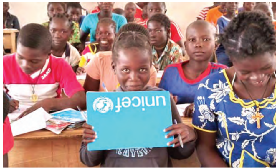
Children in Paoua, in the Central African Republic, celebrate being at school which is often interrupted by armed conflicts. They are beneficiaries of an Education Cannot Wait funded multi-year resilience programme, delivered by the Norwegian Refugee Council, Plan International, UNICEF, and UNHCR.