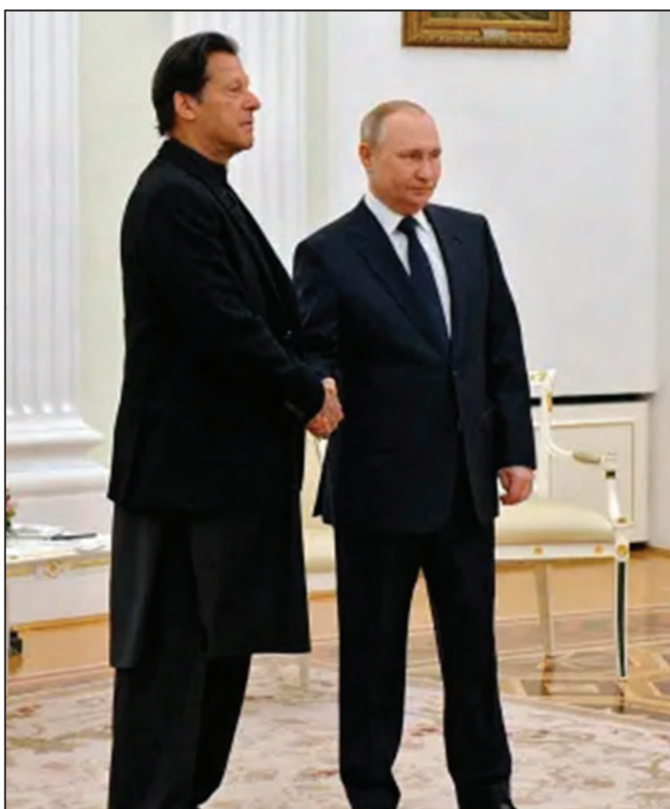
Pakistan's Prime Minister Imran Khan visited President Vladimir Putin in Moscow on the same day that Russia invaded Ukraine

Well before the latest surge in oil and gas prices, Pakistan was struggling with a widening current account deficit and double-digit inflation exacer-