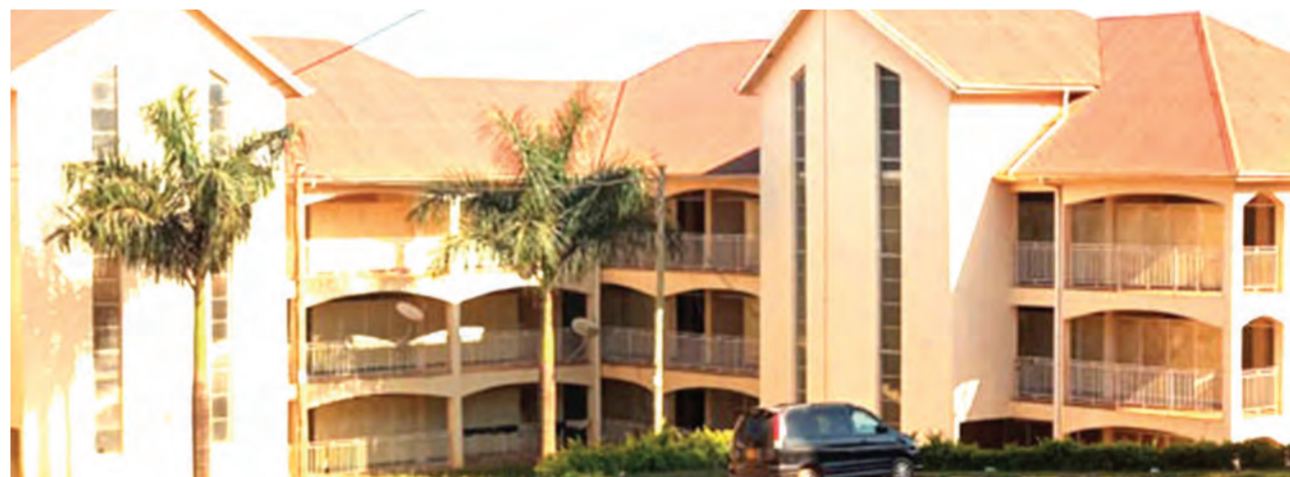
The hospital raises Shs2.7m from the existing 54 housing units monthly.

ERG's Turkish and UK based Environmental & Social teams will bring many years of international experience to this important project, in order to ensure that IFC, Equator Principles, and national standards are at all times met. We would like to thank all our partners and stakeholders in the UK, Europe and Turkey to make this dream project come true, which will positively change and enhance the lives of millions of travellers and people living along the alignment.