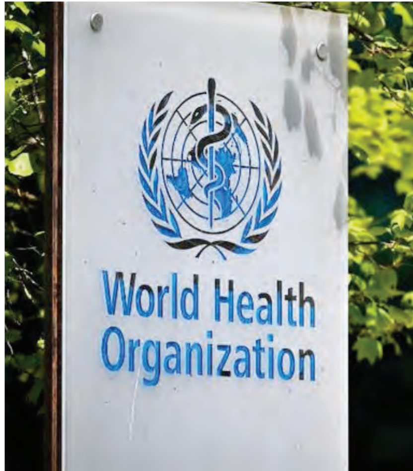
A picture taken on May 8, 2021 shows a sign of the World Health Organization at the entrance of their headquarters in Geneva amid the COVID-19 outbreak.

The picture in Europe is also not universal. Denmark, for example, saw a brief peak in cases in the first half of February, driven by BA.2, which