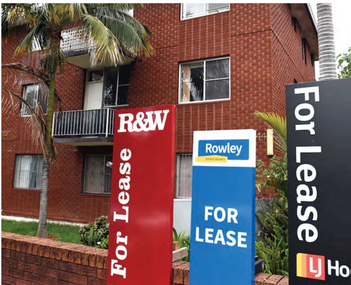
Housing will be a hot topic as the budget approaches.