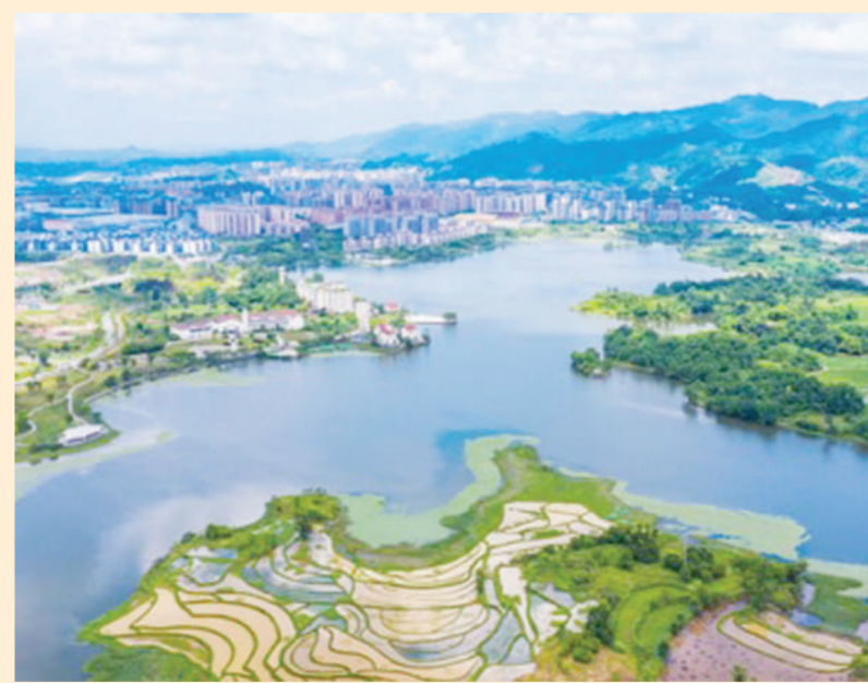
Photo taken on June 15, 2020 shows the picturesque Shuanggui Lake National Wetland Park in Liangping district, southwest China's Chongqing municipality. The park injects new impetus into the city's green development. File photo

In July of that year, China issued interim measures for the nomination of candidate cities, which specified that the cities it nominates for