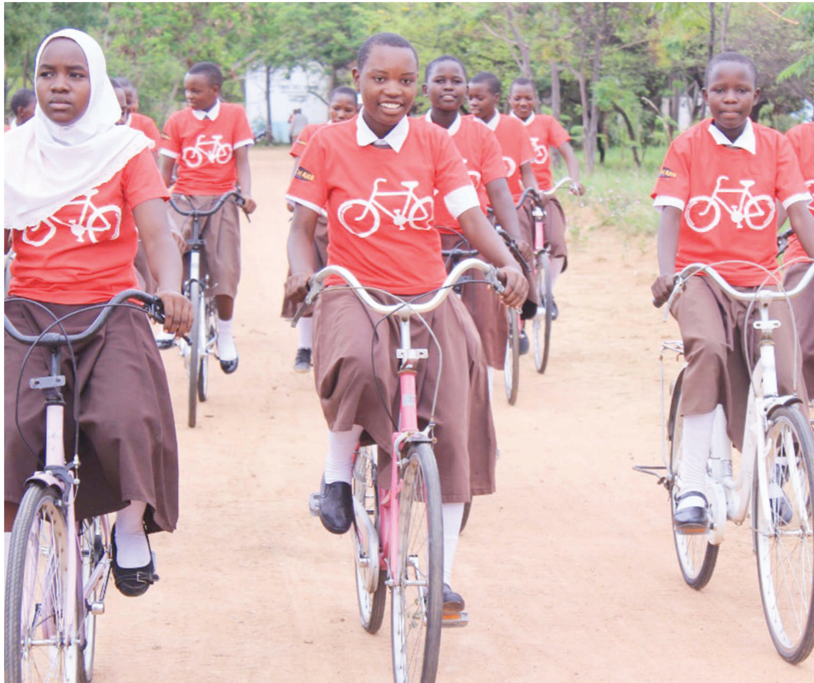
Girls on a test ride at Kituli secondary school in Shinyanga Region after receiving bicycles to enable them attend school smoothly.

"Ensuring equal access to education and keeping young girls' dreams alive. One Girl, One Bike is a donation campaign that supports young girls in secondary schools in rural areas, living more than 10 kilometers from where the schools are, and having to walk two to three hours every day to attend