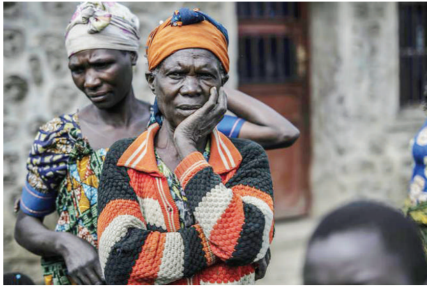
Women fleeing the fighting between M23 forces and the Congolese army find refuge in a church in Kibumba, north of Goma, in Congo, in this Jan 28, 2022 file photo.

Another video, shot during a protest in the city on May 30, showed a crowd cheering as a picture of Rwandan President Paul Kagame, defaced with a Hitler-like moustache and swastika, was torched. Protesters, including some well-known political