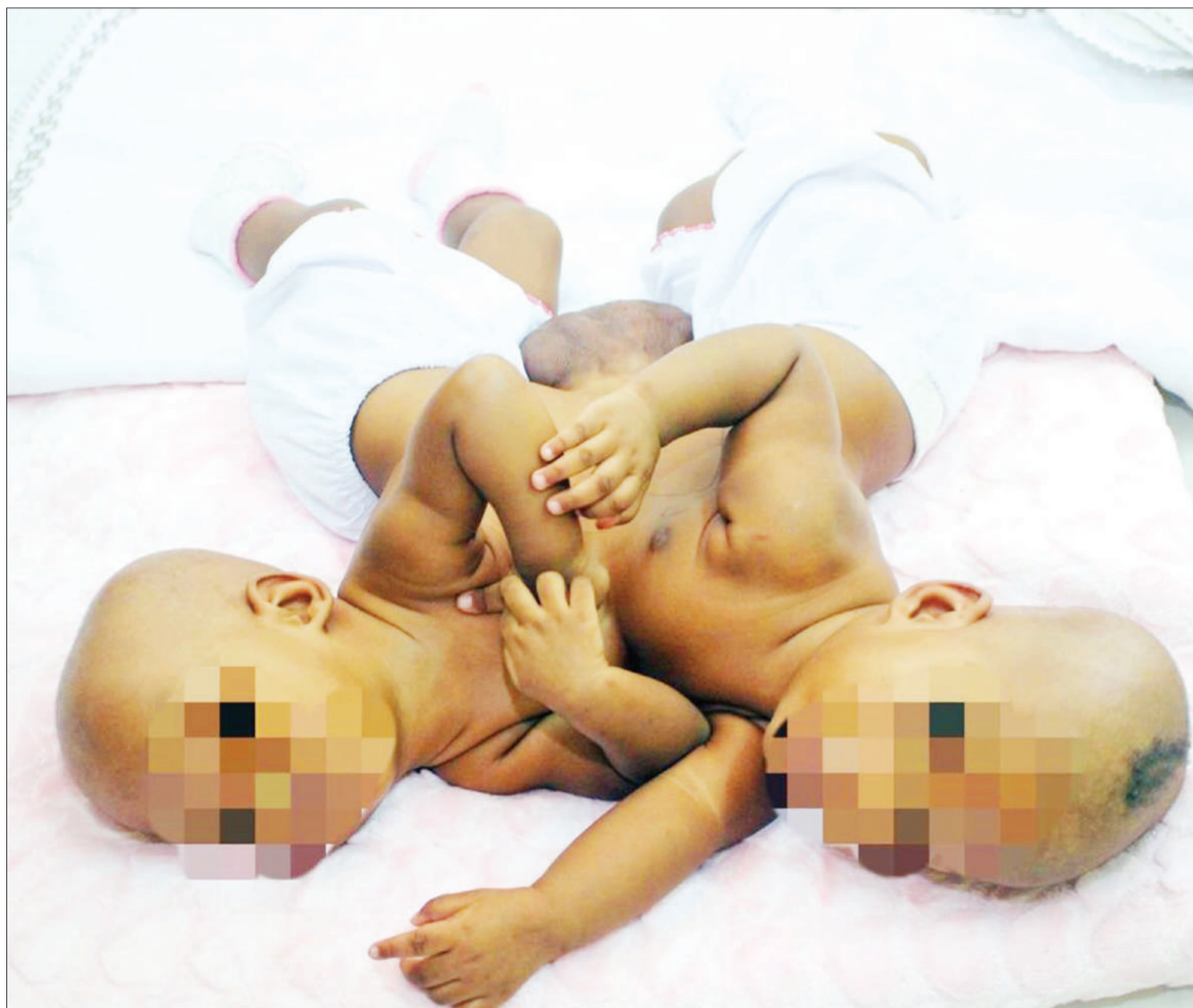
Photo of conjoined twins awaiting separation scheduled for tomorrow at Muhimbili National Hospital in Dar es Salaam - as availed to the media yesterday by MNH authorities.