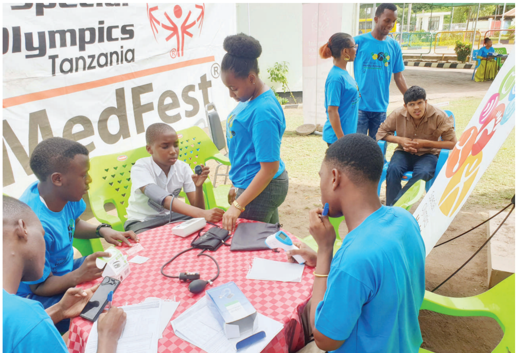
Medical students from various universities in Tanzania that volunteered to screen children with special needs at Dar es Salaam's Al Muntazir Special Education Needs, attend to the youngsters in the exercise which took place last week. More than 30 children that participate in athletics were screened in the exercise which was organized by Special Olympics Tanzania (SOT) and backed by Golisano Foundation.

The contest will see swimmers from Mainland Tanzania compete in 105 disciplines.