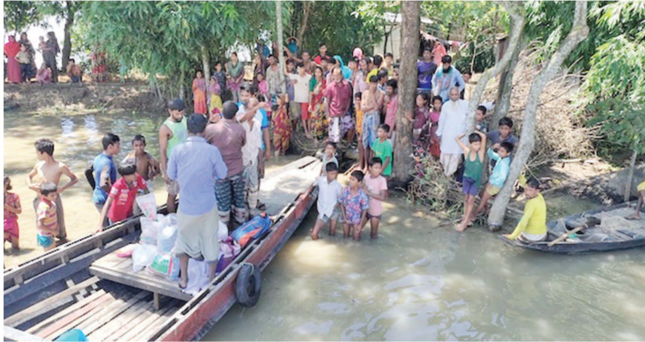
Relief workers bring supplies to stranded communities following devastating floods in Bangladesh.

"My husband had an auto-rickshaw. The flood washed it away too," Joynaba said.