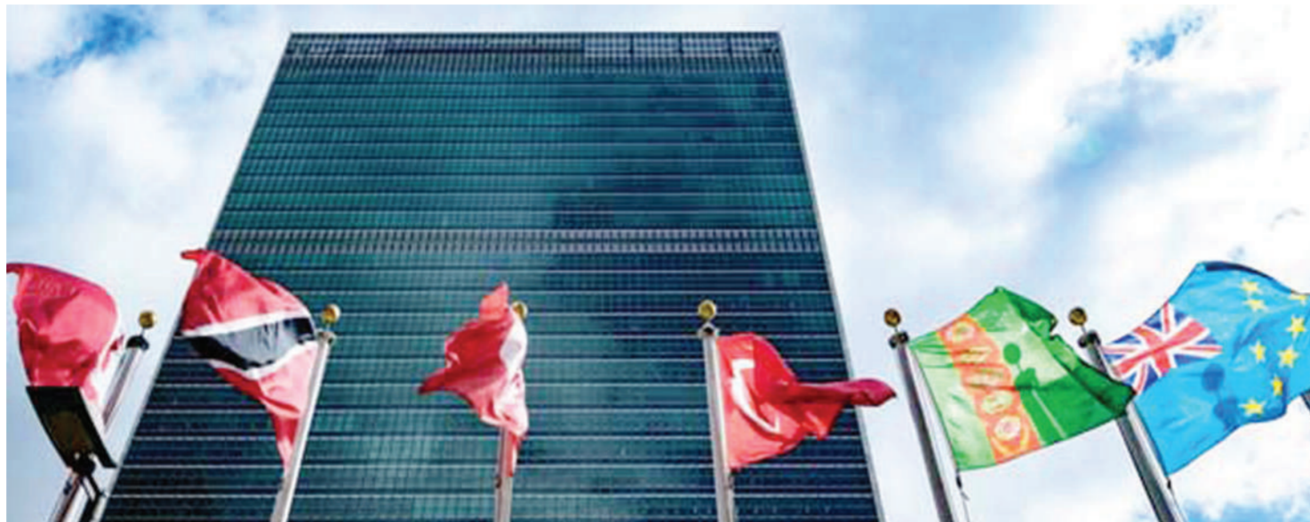
The UN Secretariat building in New York City.