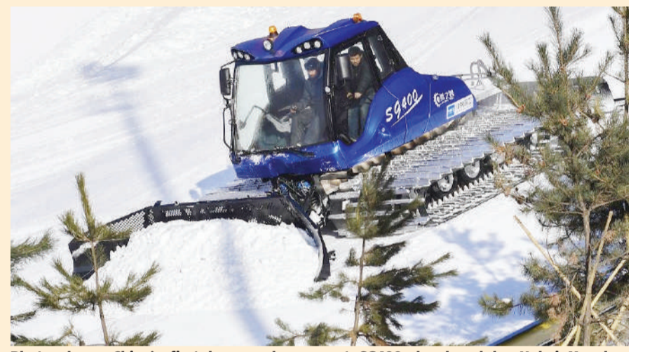
Photo shows China's first homemade snowcat SG400 developed by Hubei Xuanhua Construction Machinery Co., Ltd

It's believed that the approaching Beijing 2022 Winter Olympics and Paralympics will be made a grand event powered by technology, and attract attention from all over the world.