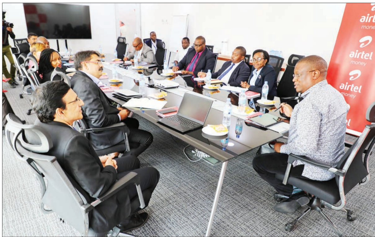
Information, Communications and Information Technology minister Nape Nnauye (R) has an audience with members of Airtel Tanzania Plc's senior management team when he made a working visit to the firm's headquarters in Dar es Salaam yesterday. He was briefed on the mobile phone service provider's strategic development plan, the major operational challenges facing the company and the importance the firm attaches to delivering quality communication services to the nation.