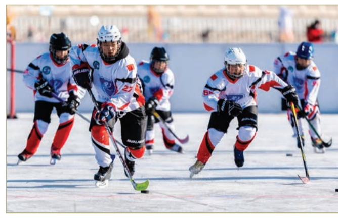
Ice hockey enthusiasts practice at a skating rink in Hohhot, north China's Inner Mongolia autonomous region, Jan. 1, 2022.

The Beijing 2022 Olympic and Paralympic Winter Games have ushered in a new chapter for China's ice and snow sports. Residents in 31 provinces, autonomous regions and municipalities all participated in winter sports activities more or less, and 12 provincial-level regions saw the number of