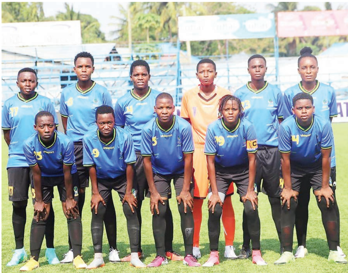
Tanzania's national U-20 women football side 'Tanzanite Queens'.