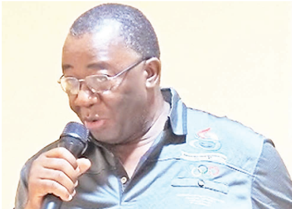
Tanzania Olympic Committee (TOC) vice-president, Henry Tandau.