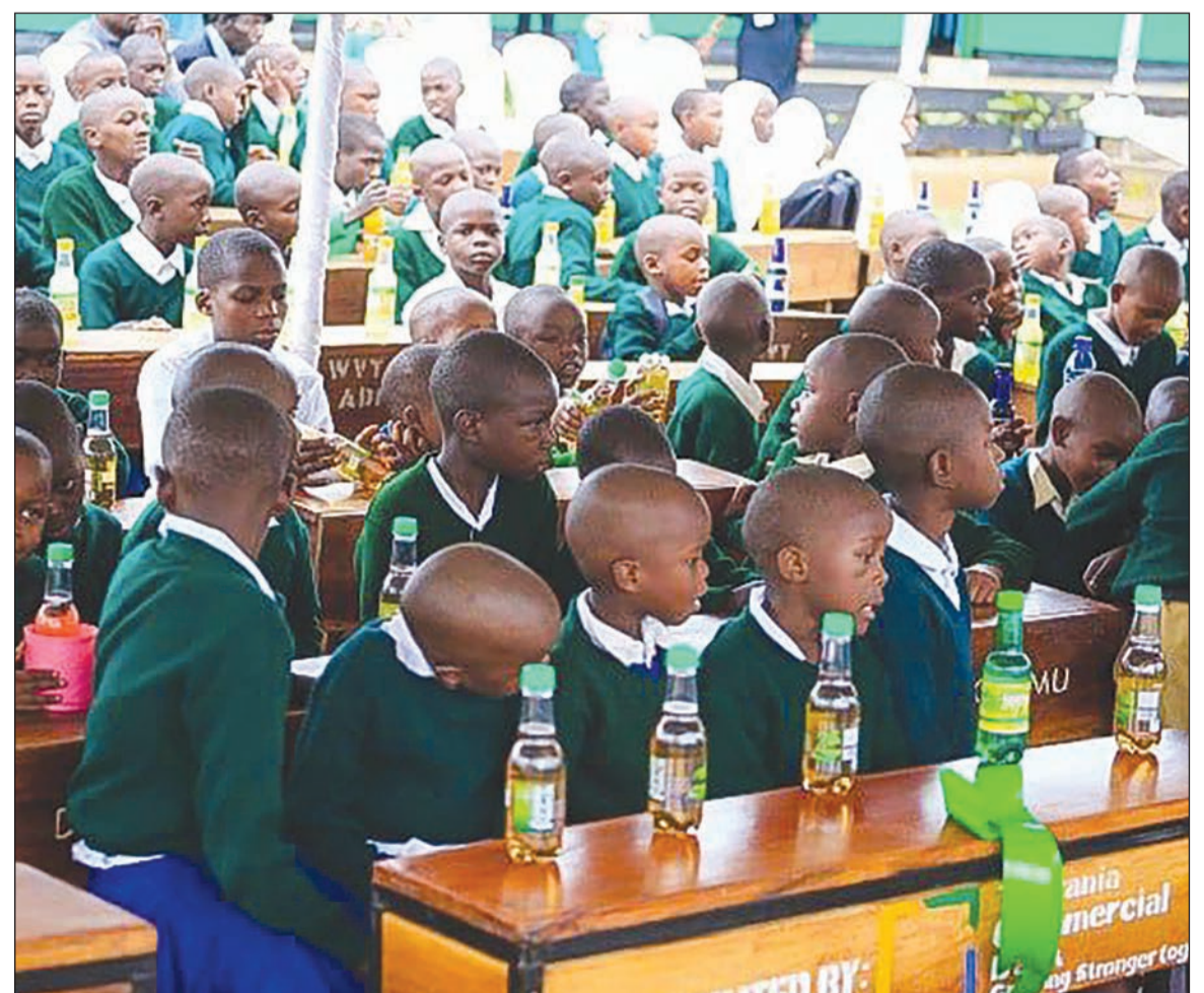
Kitunga Primary School pupils in Muleba District sitting on some of the 50 desks donated by Tanzania Commercial Bank to help address shortage of the furniture at the school.