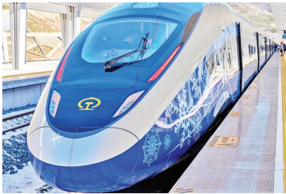
The first train custom-made for the Beijing Winter Olympics sets off from Qinghe Railway Station in Beijing on the high-speed railway linking Beijing and Zhangjiakou, the co-host cities of the 2022 Winter Games, Jan. 6, 2022.

"We will fulfill all our commitments and witness, together with the people of all countries and the IOC, the advent of a new phase in the development of the Olympic winter sports and in the spread of the Olympi-