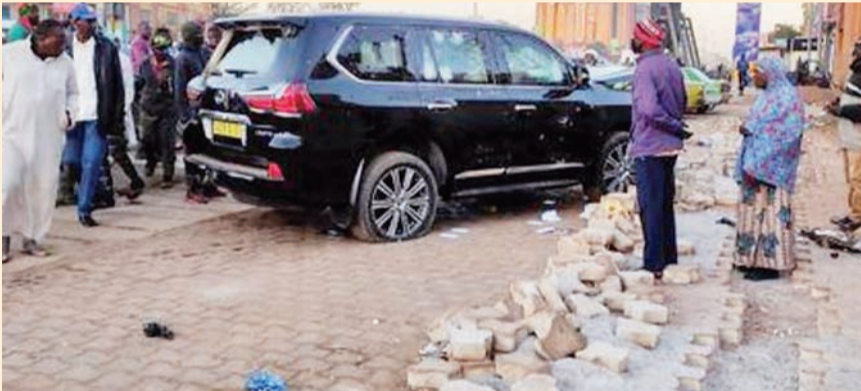
Bullet holes are seen in a car that belong to presidency following heavy gunfire near the president Roch Kabore residence in Ouagadougou, Burkina Faso yesterday.

Three armoured vehicles and soldiers wearing balaclavas were stationed outside the headquarters of the