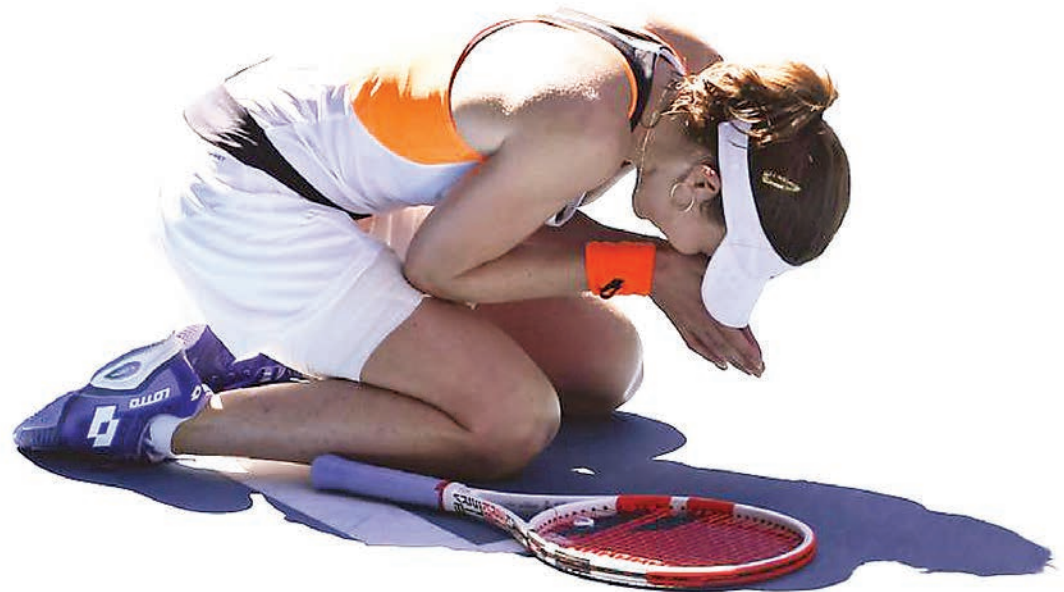
Alize Cornet of France reacts after defeating Simona Halep of Romania in their fourth round match at the Australian Open tennis championships in Melbourne, Australia, yesterday, Jan. 24, 2022.

Collins hasn't had a straight-forward path, either, the 28-year-old American having to rally from a set down to win back-to-back matches at a Grand Slam tournament for the first time.