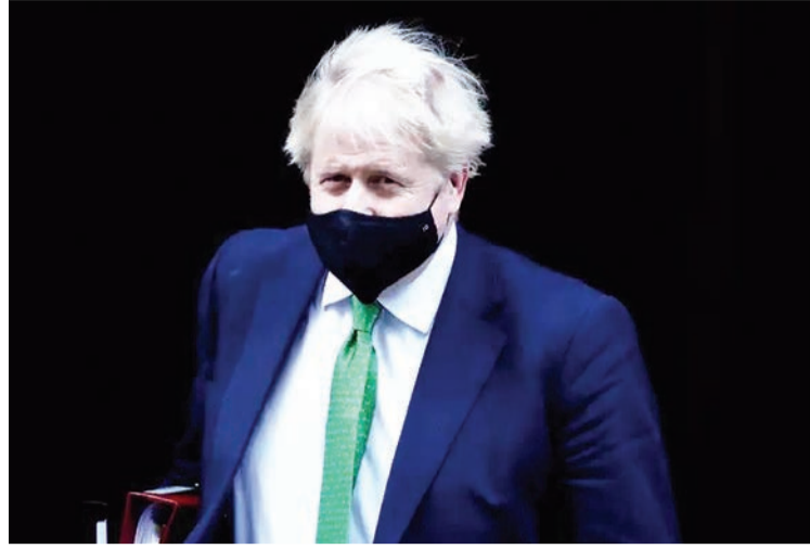
Britain's Prime Minister Boris Johnson

Leading rivals within the Conservative Party include Chancellor of the Exchequer Rishi Sunak, 41, and Foreign Secretary Liz Truss, 46.