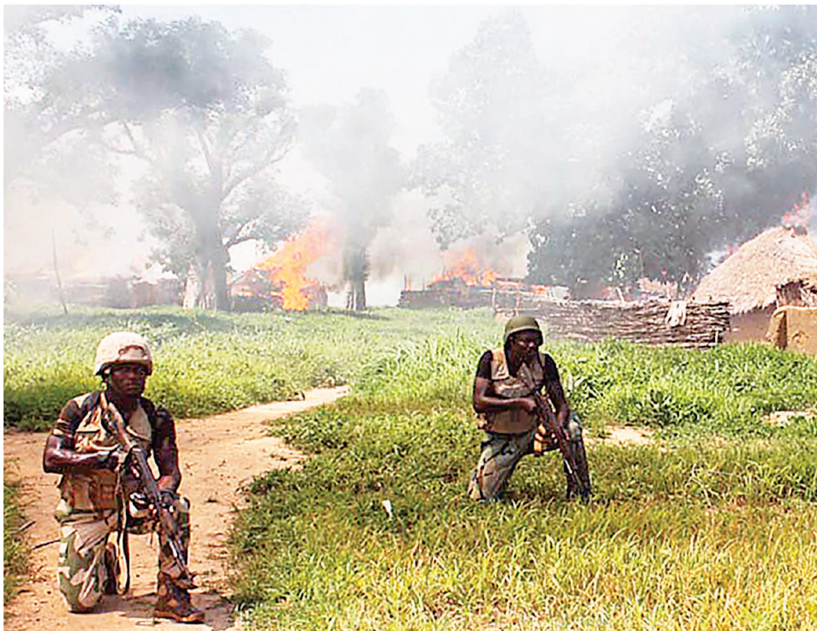
Nigerian troops clear a Boko Haram militant camp in northeast Nigeria. Security efforts in the region in 2022 are likely to come under increasing strain.

As Iswap consolidates its influence in the region and adapts to military responses against it, more attacks will inevitably occur. And although it's been weakened, JAS is trying to survive Shekau's death with the emergence of new leaders. Another trend triggered by