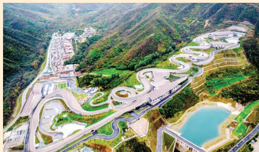
Photo shows the National Sliding Center near the Yanqing Winter Olympic Village for the Beijing 2022 Winter Olympics and Paralympics.

Apart from training, scientific innovation has also played a very crucial role in the construction of the venues for the Beijing Winter Olympics. It contributed to the