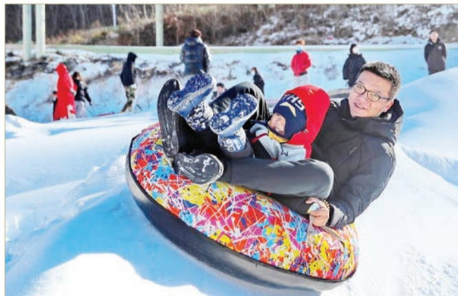
Tourists play on snow tubes at a tourist attraction in Shimenzhai township, Qinhuangdao city, north China's Hebei province, Jan. 3, 2022.

Among respondents who have participated in ice