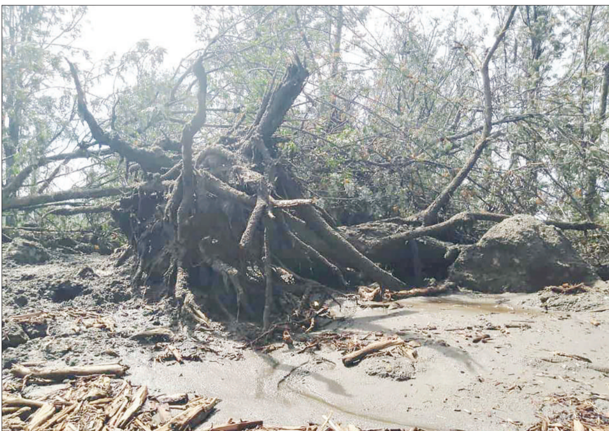
A giant tree uprooted in the torrential rain and mudflow.