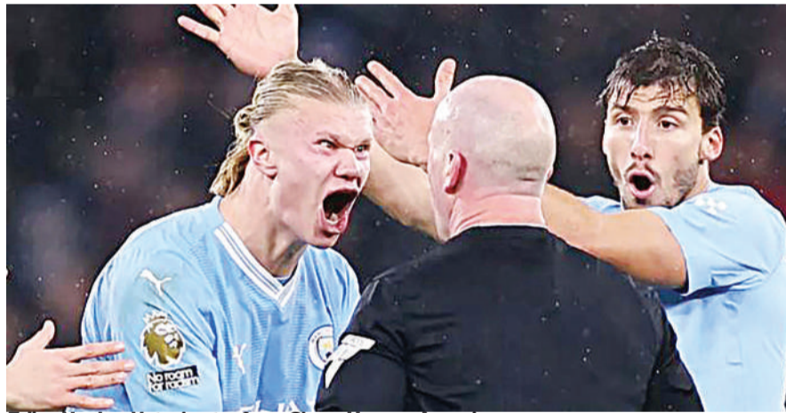
Erling Haaland lets rip at referee Simon Hooper.

On Sky Sports, former Manchester United captain Roy Keane said the referee had made a "mistake" while