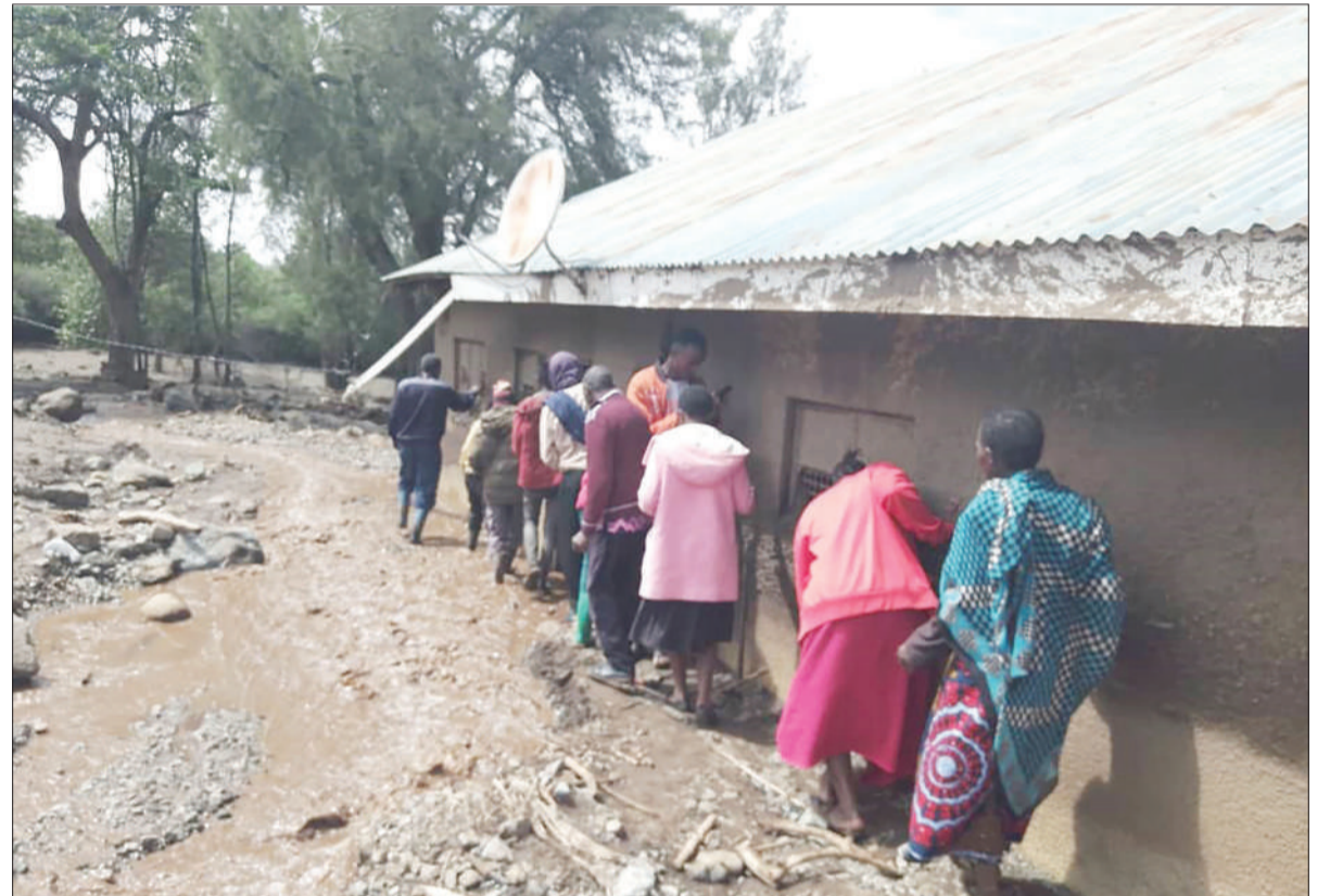
Gendabi villagers look at a house where the family had to be rescued from the raging mudflow outside.