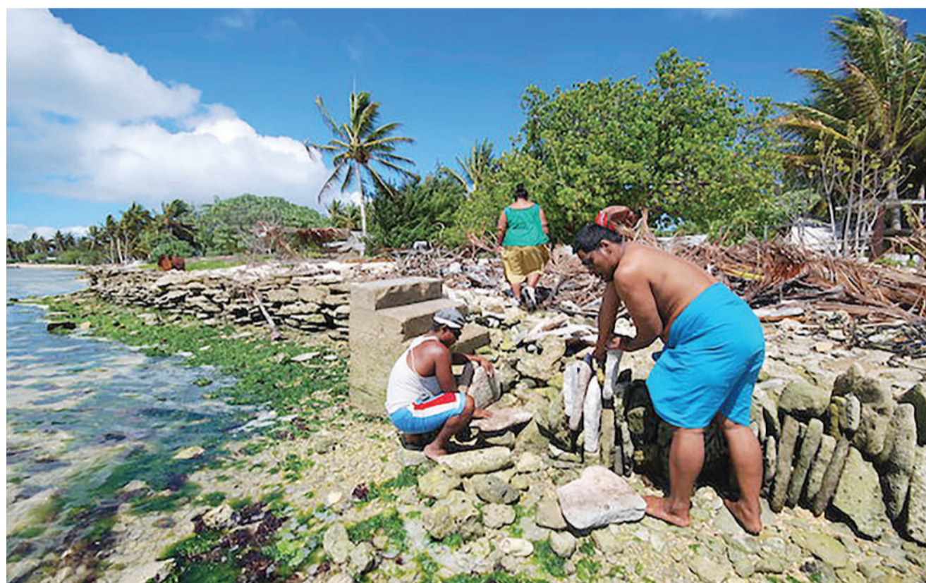
Coastal Community builds a seawall. The Pacific Community’s Unlocking Blue Pacific Prosperity aims to conserve 1 billion hectares.

Announcing the $100 million donation, CEO and President of Bezos Earth