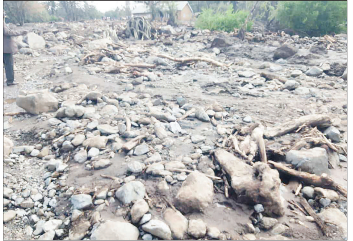
Part of road infrastructure disfigured by stones.