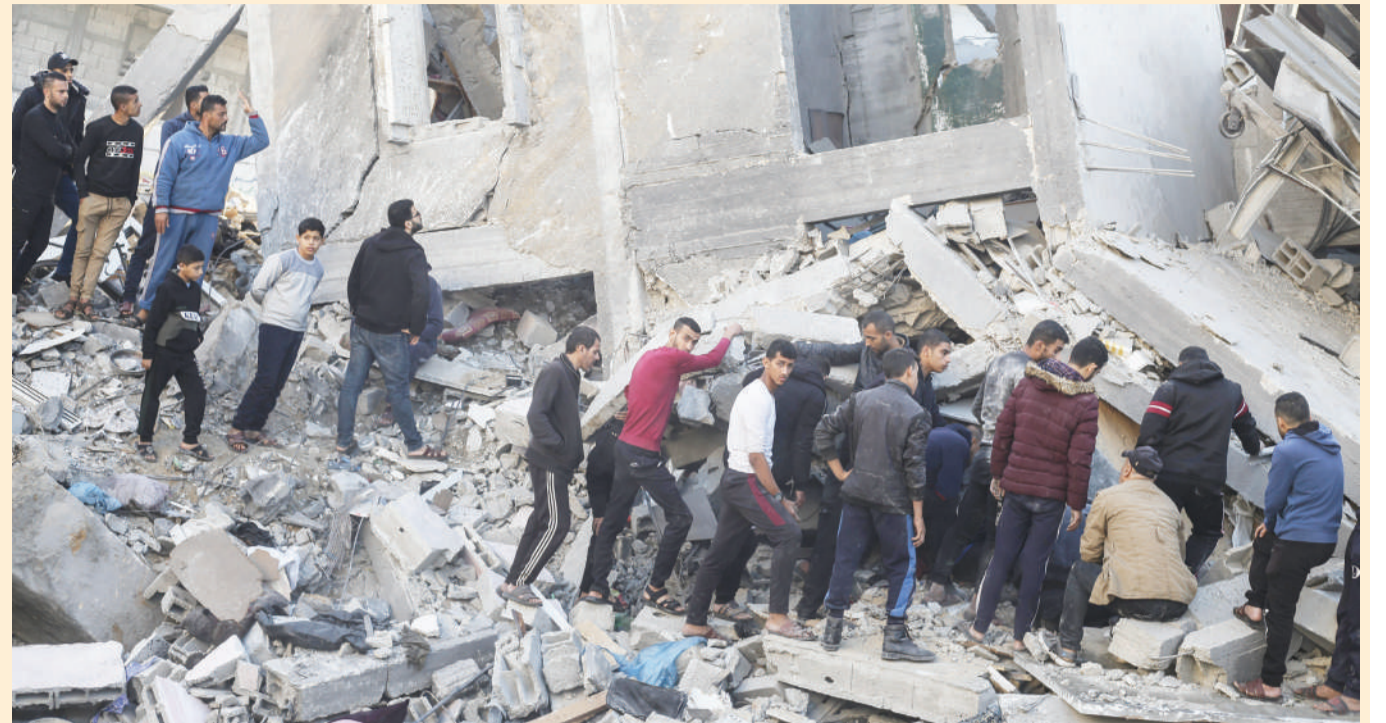
Palestinians look for survivors of the Israeli bombardment of the Gaza Strip in Rafah, on Sunday.

Halevi said that on Saturday morning, a day after a fragile seven-day ceasefire between Israel and Hamas had collapsed, the forces "started the same process in the southern Gaza