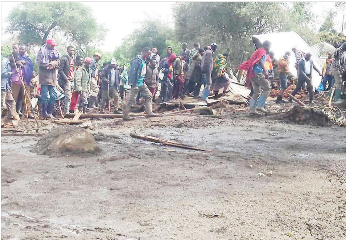
Village leaders inspect the scene of a mud swept house, seeking out signs of people swept into the mud.