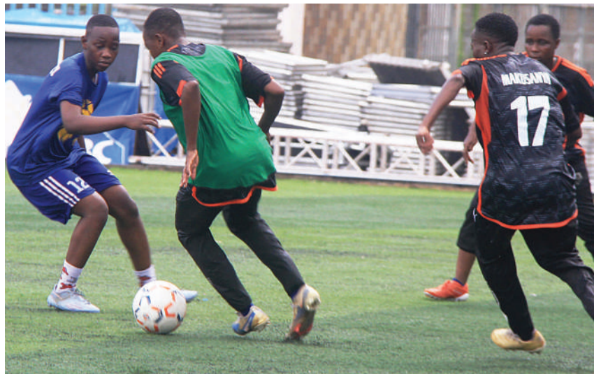
JKT Queens' players participate in training at Uhuru Stadium in Dar es Salaam yesterday, shaping up for 2023/24 Serengeti Lite Women's Premier League (SWPL) slated to kick off later this month.

Simba SC needs a number nine who can have good hold-up plays with wingers and attacking midfielders. Signing five wingers every season costs Simba SC, the squad needs at least two defensive midfielders in this mini-transfer window.