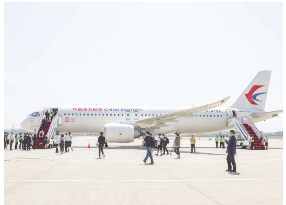
A C919 jet, China's first self-developed large passenger aircraft, is about to depart as MU9191 of China Eastern Airlines from Shanghai Hongqiao International Airport for Beijing Capital International Airport, May 28, 2023. It is the first commercial flight of the C919.

On May 28 this year, C919, China's self-developed large passenger aircraft, completed its first commercial flight, which was a testimony to the manufacturing muscle of the Yangtze River Delta. About 10 percent of the aircraft's parts, 50 percent of its aluminum materials, and 50 percent of composite structural components were manufactured in Zhenjiang, Jiangsu province.