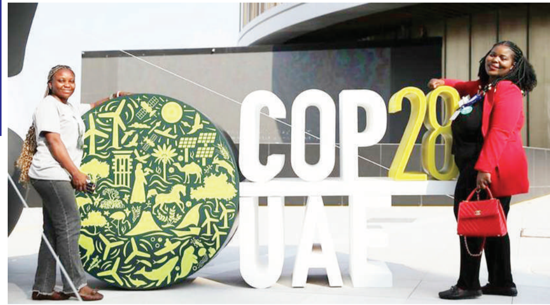
Visitors pose for photos at the Green Zone of the 28th session of the Conference of the Parties to the United Nations Framework Convention on Climate Change (COP28), in Dubai, the United Arab Emirates, on Sunday.

easy to treat. River blindness and sleeping sickness, for example, are both endemic to Africa and spread through parasitic worms and flies that are likely to proliferate in a warming world.