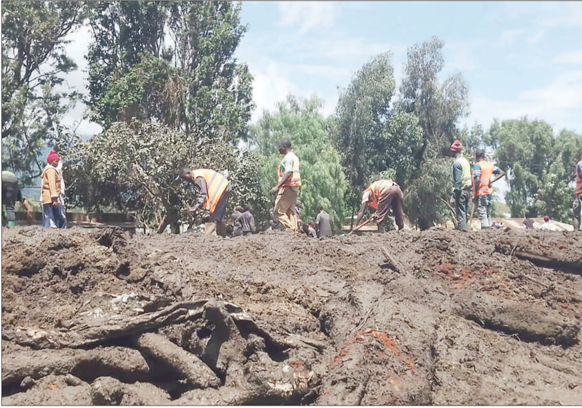
Gendabi villagers at Katesh town in Manyara Region remove mud covering the road.