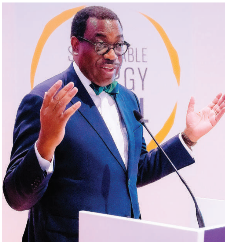
African Development Bank President, Dr Akinwumi Adesina

Dr Rajiv J. Shah, President of the Rockefeller Foundation and Co-chair of the Global Leadership Council said, "Without sufficient storage capacity, countries will be unable to add renewable energy to their grids at the scale