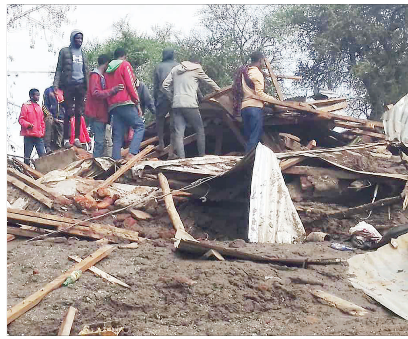
Gendabi villagers near Katesh town in Manyara Region searching for missing people yesterday at one of the houses swept away by mudflow following heavy rain on Sunday.