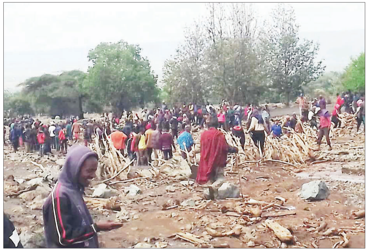
Gendabi villagers search for missing people in the debris as houses were overpowered by the mudflow with people inside.