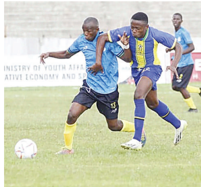
Mainland Tanzania U-18 football team's player (C) challenges his Zanzibar U-18 side's counterpart when the two sides faced each other in the 2023 CECAFA U-18 Boys Championship's round robin stage's tie at Bukhuru Stadium in Kenya last week. The two teams settled for a 1-1 draw.