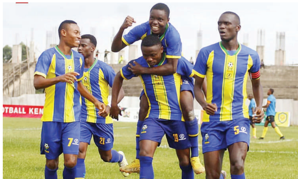
Mainland Tanzania's U-18 Boys team youngsters are pictured jubilating when the team notched a goal in this year's CECAFA U-18 Championship clash versus Zanzibar in Kakamega, Kenya recently. The two squads settled for a 1-1 draw.

Since the two teams Mainland Tanzania and Zanzibar, tied on four points each whilst scoring and leaking the same number of goals, the Fair Play criteria was used- with Mainland Tanzania prevailing after collecting four cautions as opposed