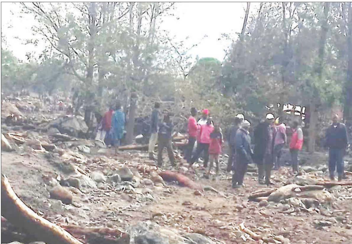
Gendabi residents amazed by debris piled up on roads after mudslides, yesterday.