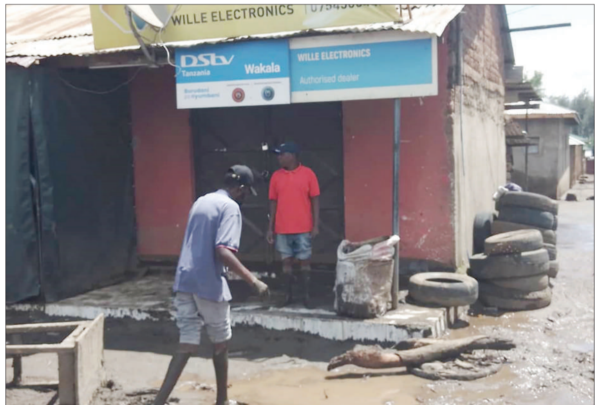
Gendabi village residents at a street mechanic work to restore orderly surroundings after the mudflow waylaid the trading area.