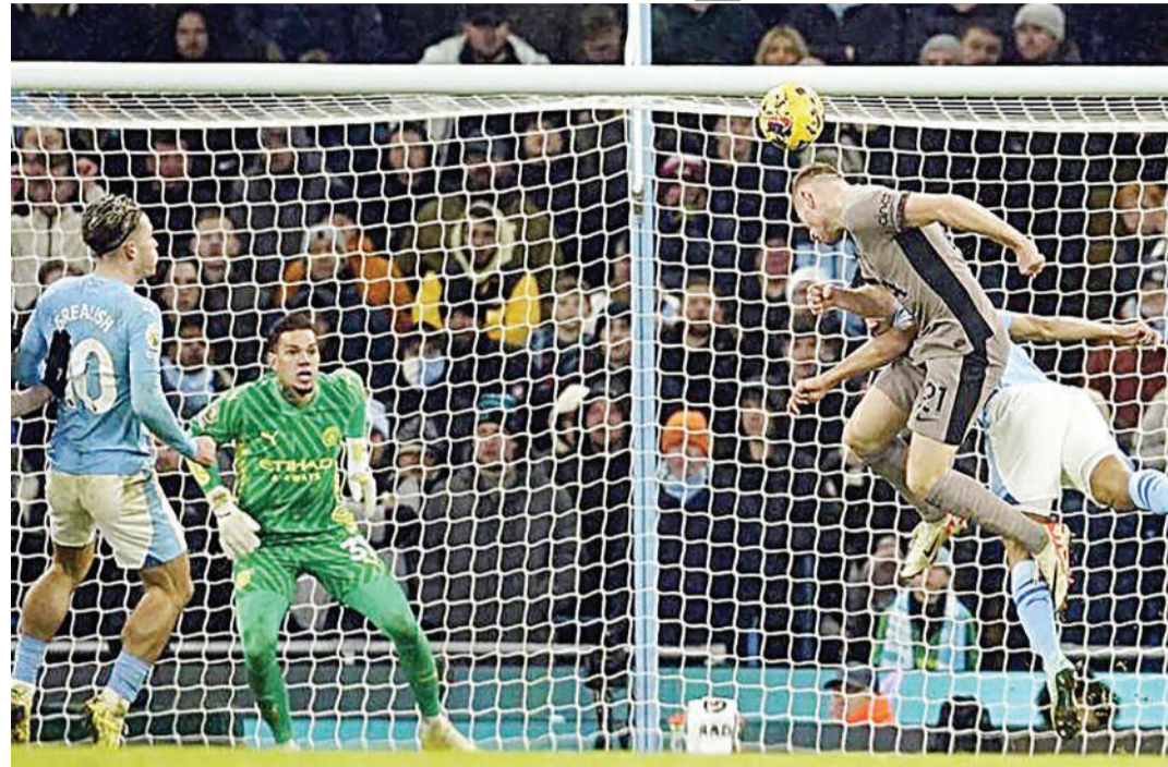
Tottenham's Dejan Kulusevski scores a late, late equaliser in the 3-3 draw at Man City.

Sunday's results mean Arsenal remain two points clear at the top of the table, with Liverpool second and City in