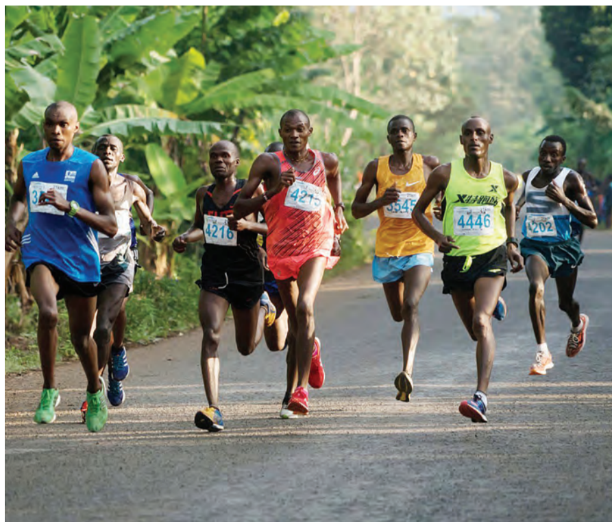
A section of runners battle it out in recent Kilimanjaro Premium Lager Marathon, which took place in Moshi.