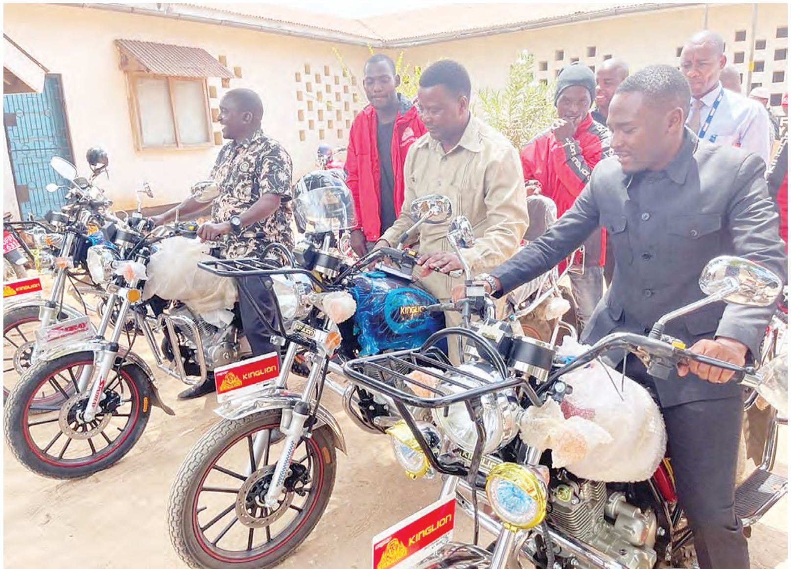
Simanjiro district commissioner Dr Suleiman Serera (R) pictured yesterday test-riding one of six motorbikes the district council has issued on credit to a group of youths in the area.

The African Day of Standardisation is celebrated as a means of raising more awareness among African regulators, industry, academia, consumers, policy makers and the entire African Citizens on the benefits of Standardization to Africa's Industrialisation, Integration, Transformation and Sustainable Development.