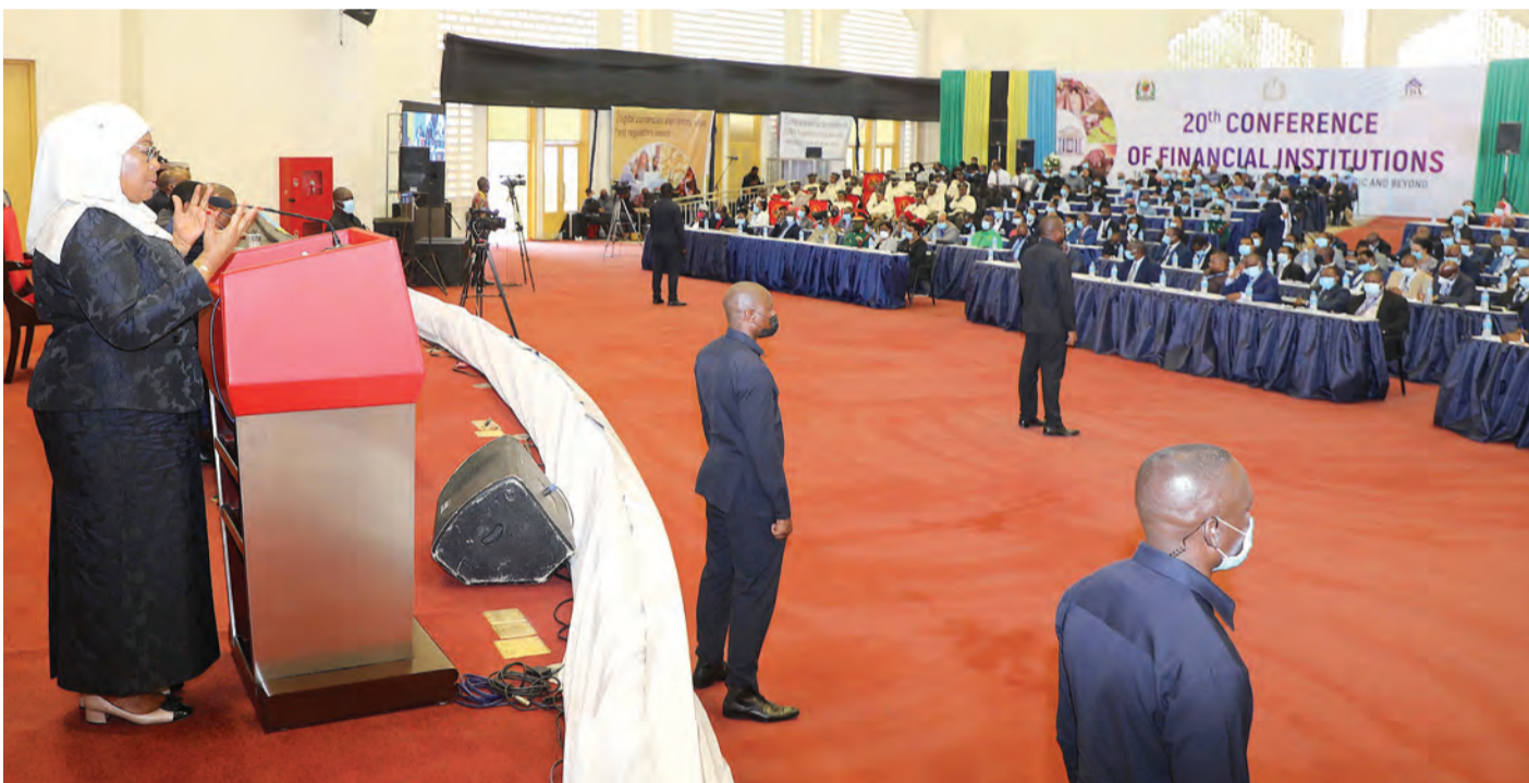
President Samia Suluhu Hassan opens two-day 20th Financial Institutions meeting in Dodoma city yesterday.