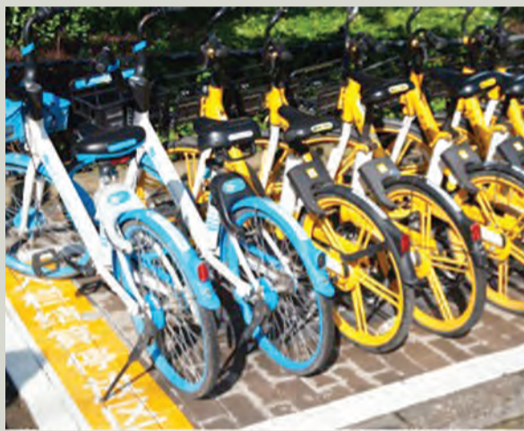
A designated parking zone for shared bikes in Dongcheng district, Beijing.

As more and more people engage in food and express delivery services in the country, handy elec-