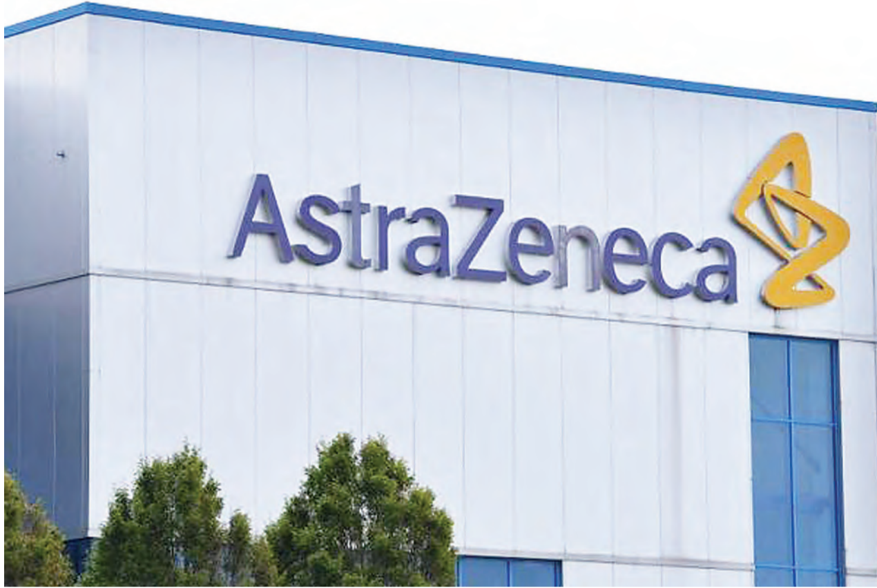
This photo shows a general view of the offices of British-Swedish multinational pharmaceutical and biopharmaceutical company AstraZeneca PLC in Macclesfield, Cheshire.

Several risk factors for severe COVID-19 in children have been reported including older age, obesity and pre-existing conditions including type 2 diabetes, asthma and heart disease,