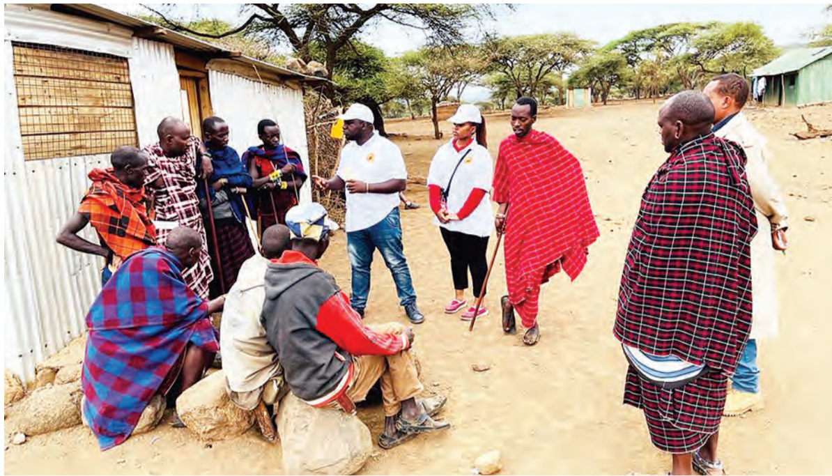
National Electoral Commission officers sensitise residents of Obalbal-Meshili 'B' villagers in Ngorongoro District, Arusha Region, earlier this week on the need to take full part in the electoral process.