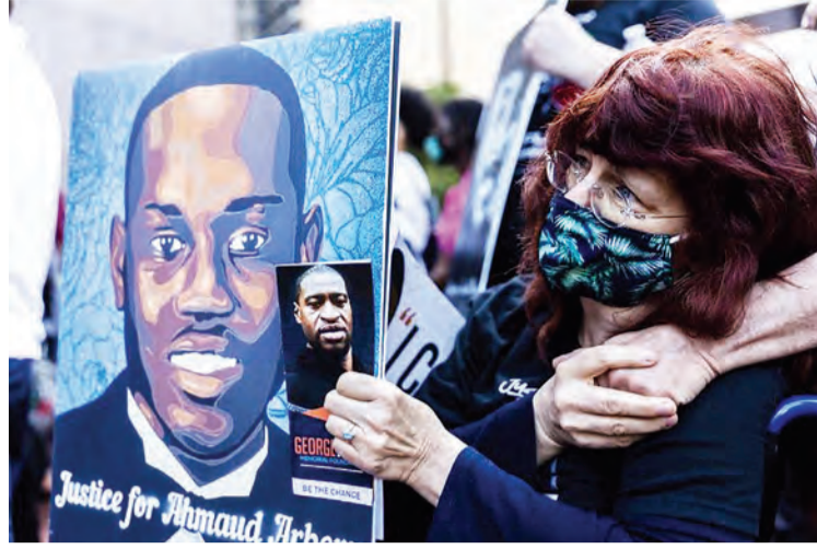
A woman holds portraits of Ahmaud Arbery and George Floyd during an event in remembrance of George Floyd in Minneapolis, Minnesota. File photo