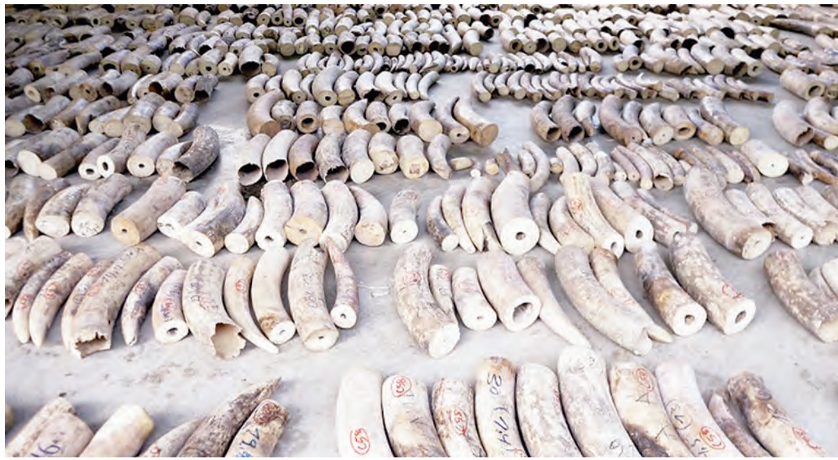
A photo released by Singapore's national parks board shows seized ivory at a holding area in Singapore, part of a haul of smuggled elephant ivory and pangolin scales from Africa destined for Vietnam

Since 2010, the EIA says, and based solely on confirmed global