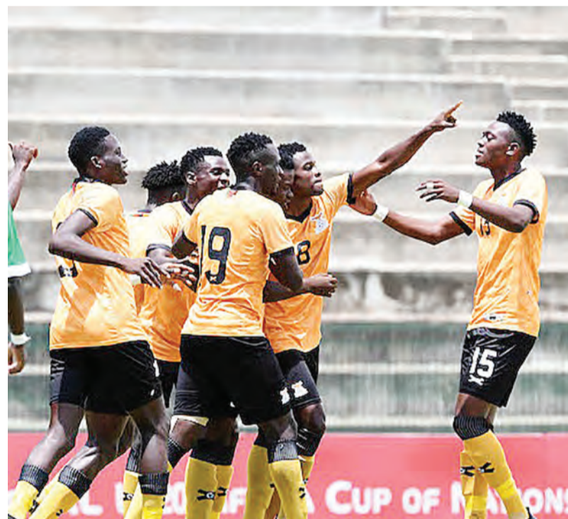
Zambia's U-20 football team celebrate one of the squad's goals in a recent COSAFA Men's U-20 Championship.

Those early years were dominated by the 'Two Zs', with Zambia winning six and Zimbabwe three