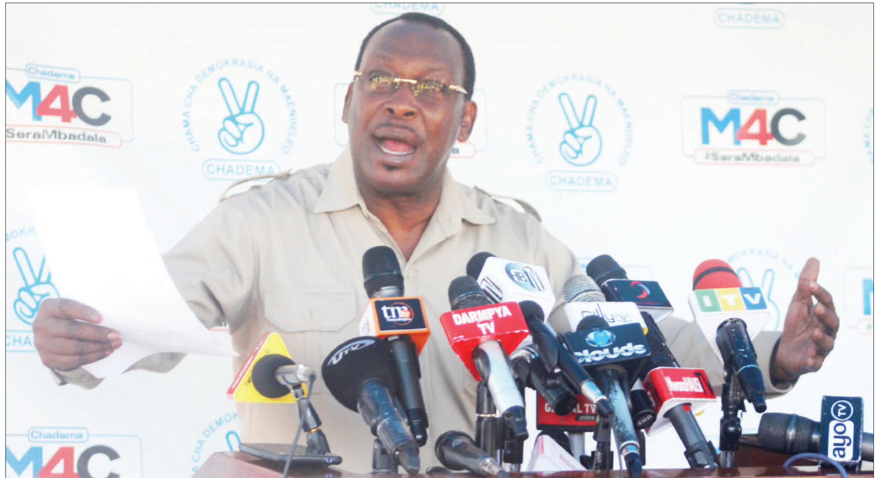
Opposition Chadema national Chairman Freeman Mbowe addresses a press conference in Dar es Salaam yesterday at which he announced that the party's candidate for the Zanzibar Presidency was withdrawing and they would now support ACT-Wazalendo flag-bearer Seif Shariff Hamad.

It is the right time that parents continue taking their children for vaccines as the spread for Coronavirus in our country has gone down