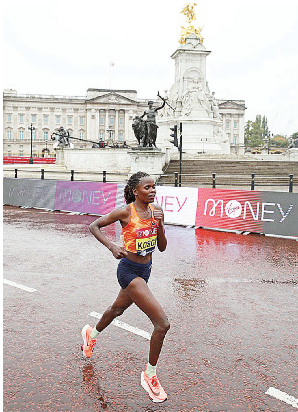
Kenya's Brigid Kosgei runs past Buckingham Palace and the Queen Victoria Memorial into the Mall on her way to winning the London Marathon in London, England, Sunday, Oct. 4, 2020. Athletes are competing on a 26.2-mile (42.2-kilometer) closed-loop course consisting of 19.6 clockwise laps around St. James's Park. The traditional course along the River Thames was scrapped because of the coronavirus pandemic and only elite men and women are competing and no spectators are permitted.

A tiring Chepngetich was caught by a stunning late charge from Hall, who overtook her with just a few strides remaining.