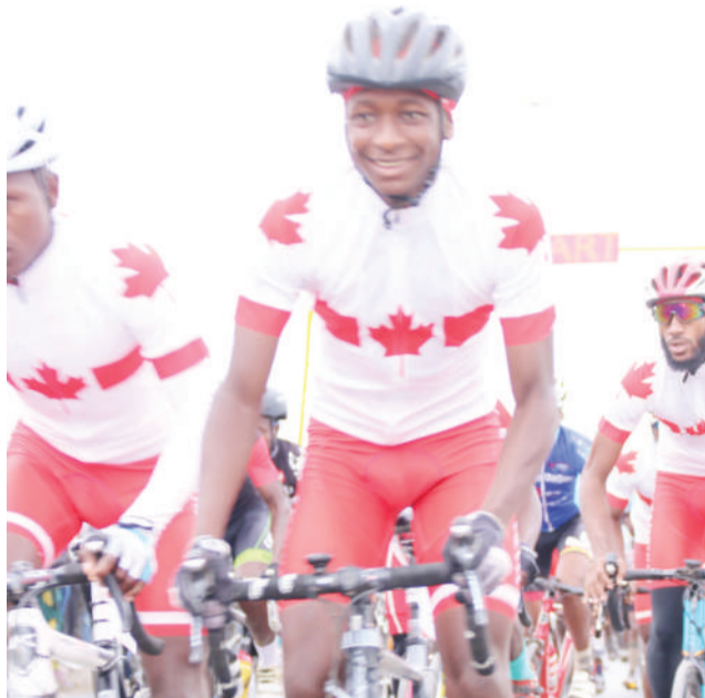
A section of riders from Team Matambuu from Dar es Salaam feature in a recent race, held in Tanga.