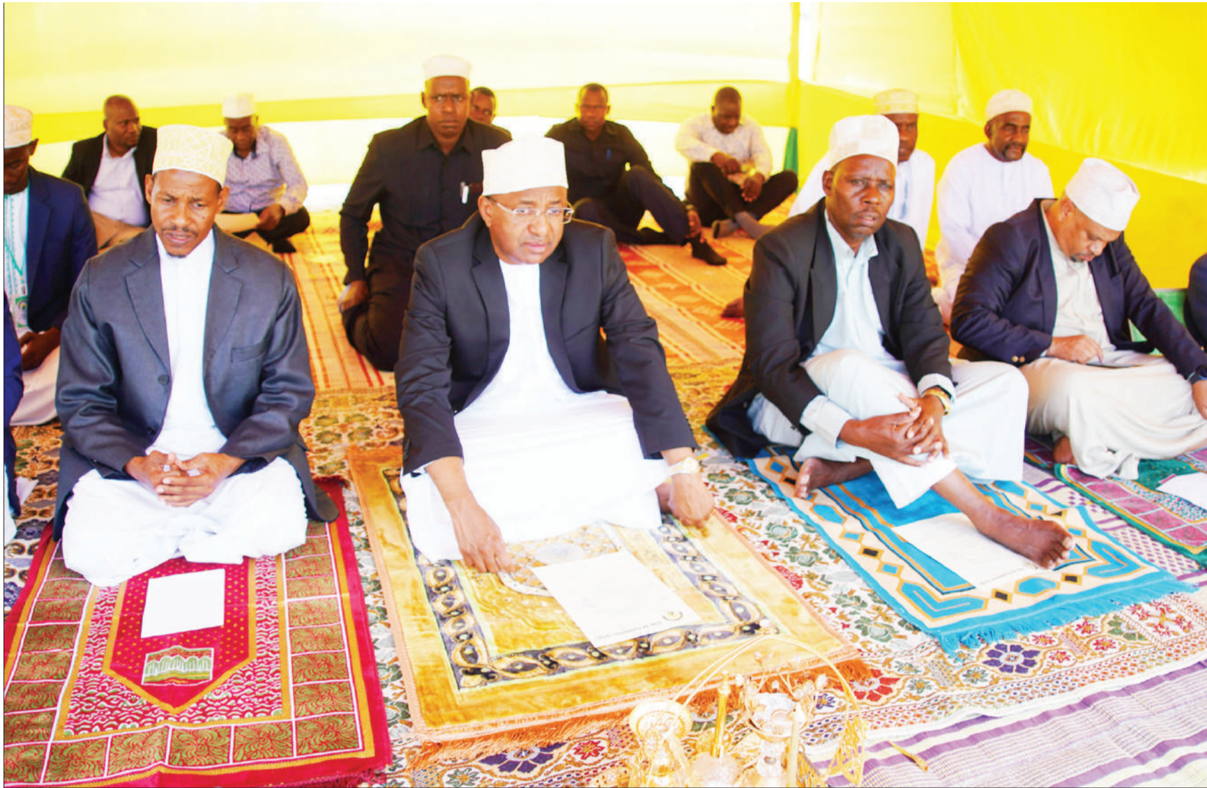
Dr Hussein Mwinyi (2nd-L, foreground), the ruling CCM's candidate for the Zanzibar Presidency in the upcoming General Election, attends special peace prayers in Zanzibar yesterday alongside religious leaders and other government officials.