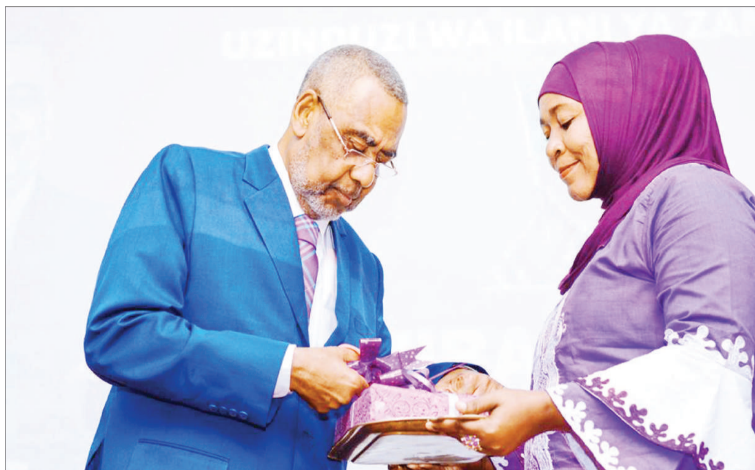
Seif Shariff Hamad (L), the opposition Alliance for Change and Transparency (ACT-Wazalendo) candidate for the Zanzibar Presidency in the upcoming General Election, pictured in Zanzibar yesterday cutting a ribbon to launch the party's 2020/2025 election manifesto.