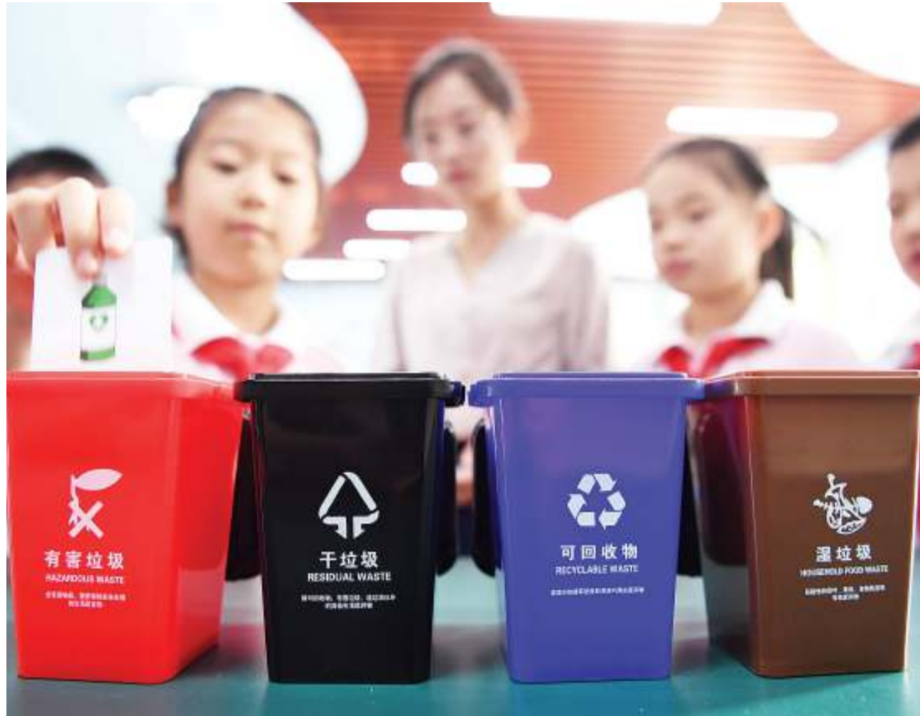
Pupils take part in a garbage sorting game at Jianping Experimental Primary School in Hefei, capital of east China's Anhui Province, on Friday (Xinhua)

"It is more environmentally friendly. Compared to burning coals, our fuel block emits about 70 percent less