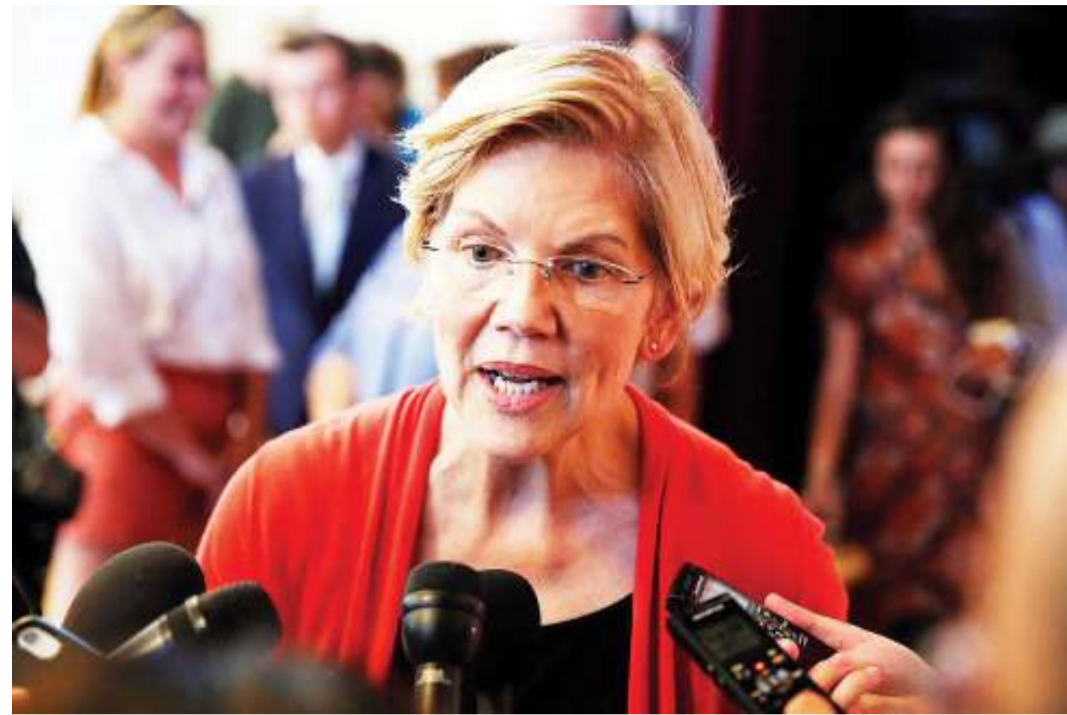
Democratic 2020 US presidential candidate Sen. Elizabeth Warren speaks to members of the media during a town hall at the Peterborough Town House in Peterborough, New Hampshire, U.S., July 8, 2019. (File photo)