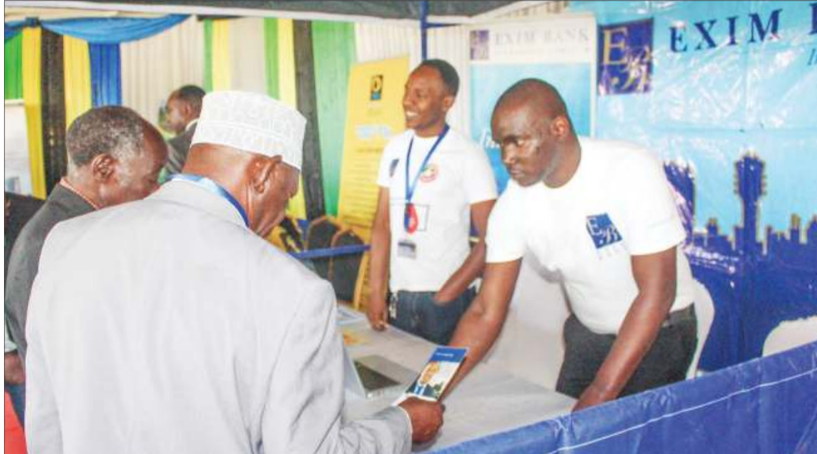
Exim Bank Tanzania's Mtwara Branch members of staff attend to customers at the bank's pavilion during the Tanzania Cashewnut International Investment Forum held in Mtwara municipality at the weekend. The bank has been supporting cashewnut farmers and exporters for many years by extending to them financial services.

"It will also develop business model for sanitation service chain to improve water security and sanitation in urban centres," he said.