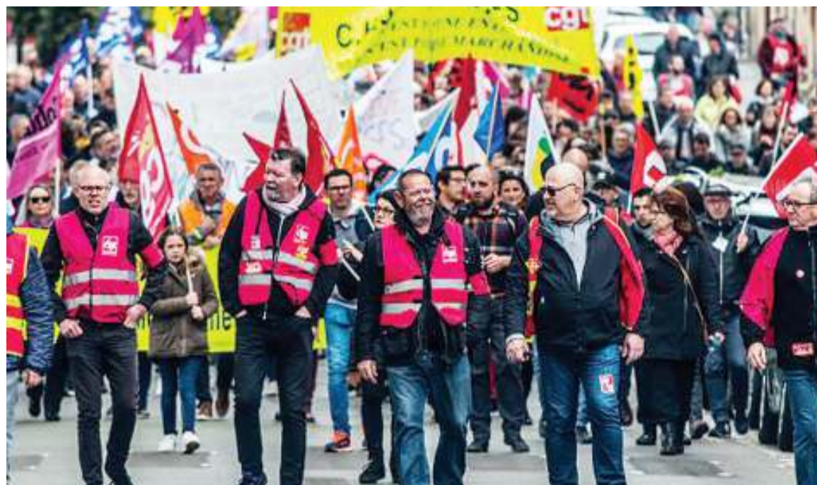
3,000 workers in the public service demonstrated in Nantes, France, on 9 May 2019

Prosecutors offered the personal stories of several employees who died