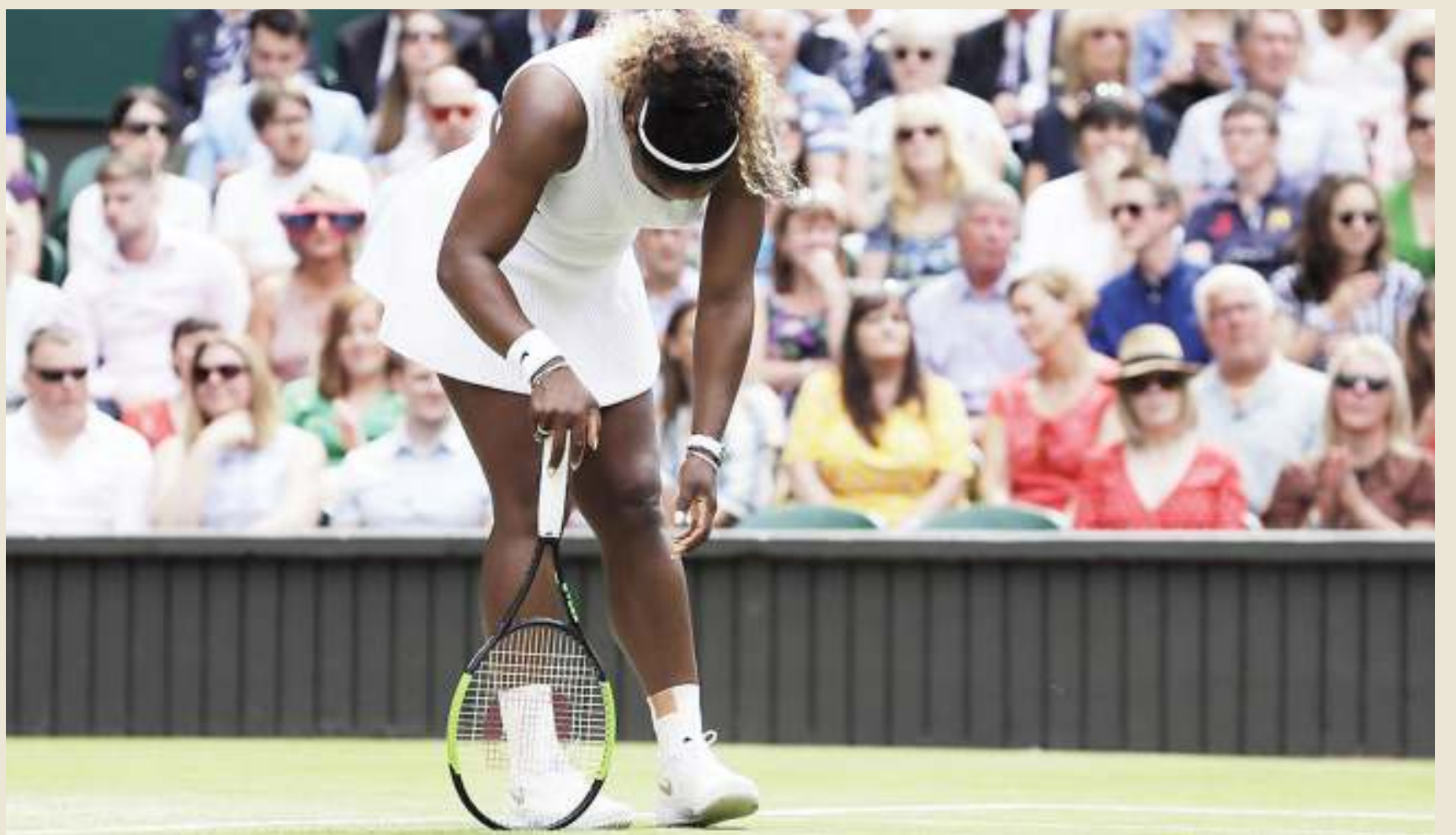
United States' Serena Williams is dejected after losing a point during the women's singles final match against Romania's Simona Halep on day twelve of the Wimbledon Tennis Championships in London, Saturday, July 13, 2019.