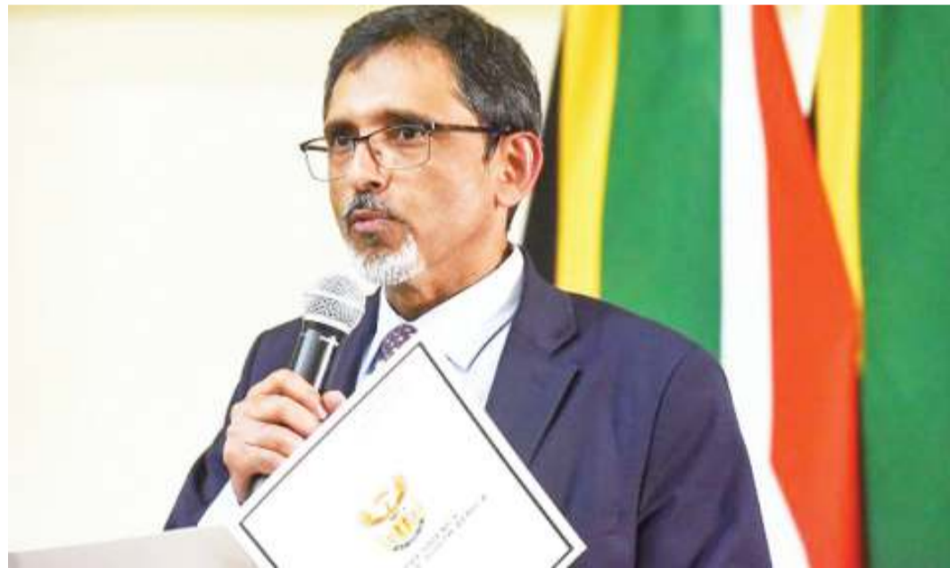
Minister of Trade, Industry & Economic Development Ebrahim Patel.

"[T]he policy challenge that government faces is that it wants to promote and support jobs locally, and [it has] a responsibility to ensure cheap sources of meat protein to working and poor South Africans. ITAC has a difficult job in applying their mind to