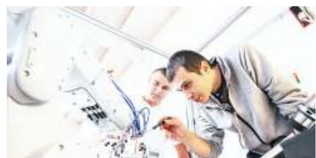
Robots are coming up for manufacturing jobs around the world.

Still, the Trump administration has been slow to acknowledge AI's impact on the American workforce. Treasury Secretary Steven Mnuchin once said he's "not worried at all" about robots' impact on employment.