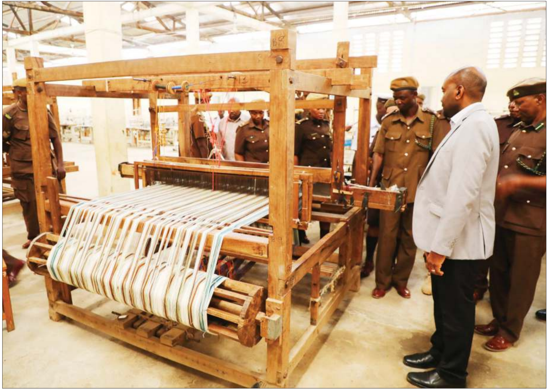
Home Affairs deputy minister Hamad Masauni (in jacket) is briefed yesterday on a locally made machine used in the manufacture of bed sheets. He was on a tour of Butimba Prison in Mwanza city.

Community banks need a 2bn/- capital base, whereas development finance institutions require 50bn/-, merchant banks 25bn/- and Islamic banks 15bn/- capital base to qualify for operating licences.