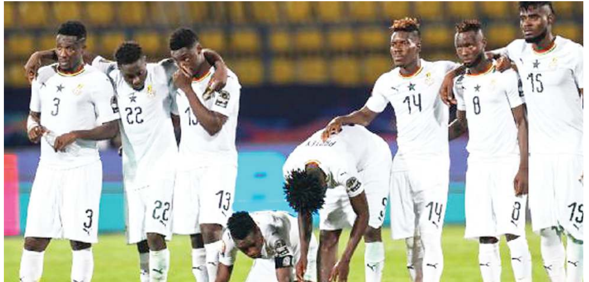
Ghana's players were devastated by their last 16 defeat on penalties to Tunisia, knocking them out of Afcon at the earliest stage since 2008.