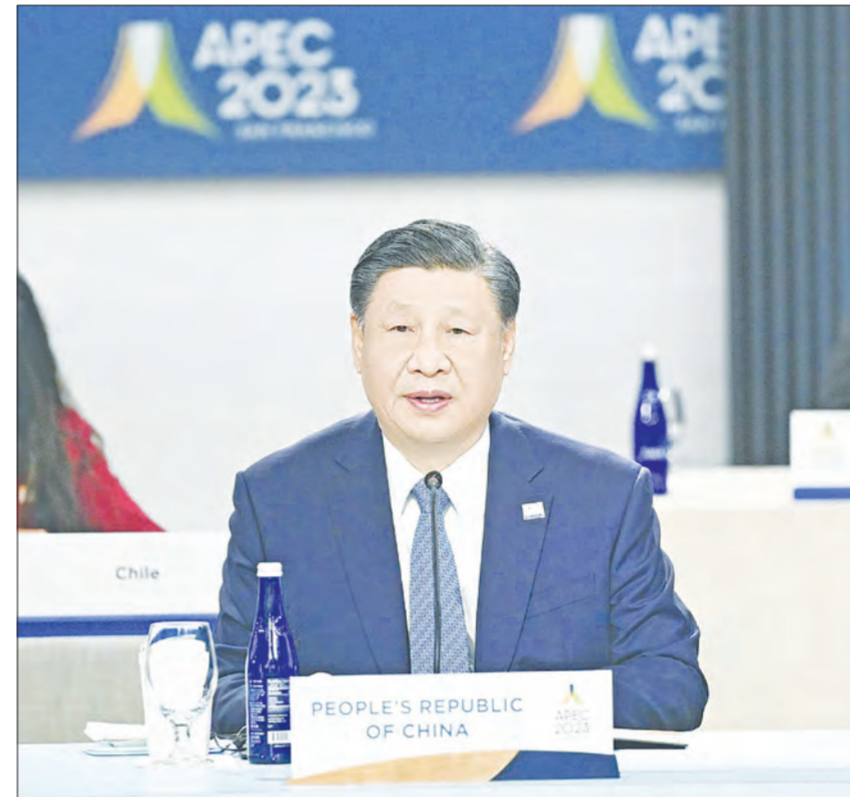
Chinese President Xi Jinping addresses the 30th APEC Economic Leaders' Meeting held at Moscone Center in San Francisco, the United States on Friday.

To accelerate the transition to green and low-carbon development, Xi said that the APEC members must deliver on the Bangkok Goals on Bio-Circular-Green (BCG) Economy, making "green" a defining feature of Asia-Pacific growth.