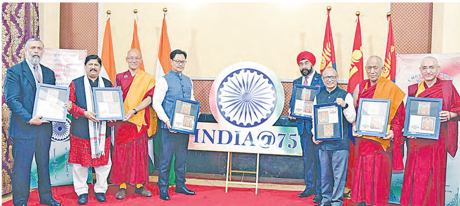
Union Law and Justice Minister Kiren Rijiju with President of Mongolia, Ukhnaa Khurelsukh, at the launch of postal stamp on 19th anniversary of the death of Khusok Bakula Rinpoche, India's former Ambassador to Mongolia, in Ulaanbaatar on Wednesday.