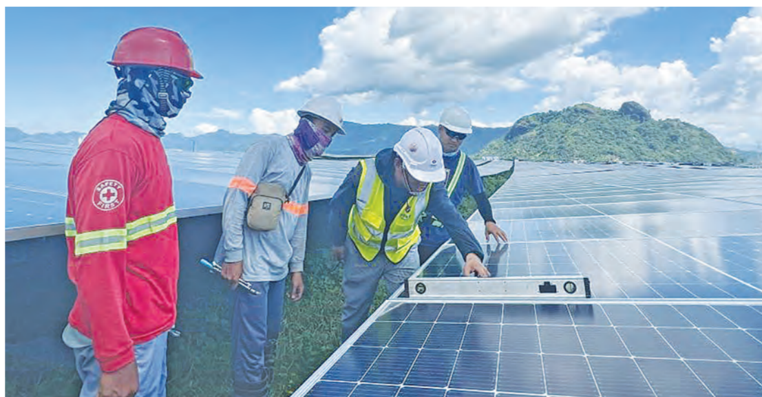
A Chinese engineer (C) takes Philippine staff members to adjust solar panel racks in a solar farm built by Chinese enterprises in San Marcelino, the Philippines. Upon completion, the solar farm will become the largest of its kind in the Philippines.

Under the active promotion by the Chinese government and the vigorous