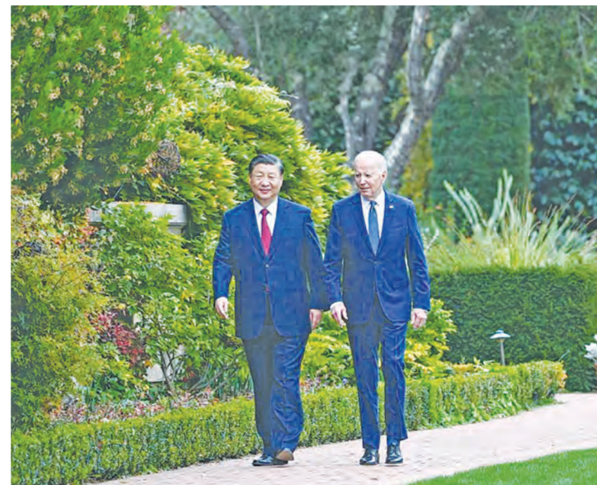
Chinese President Xi Jinping and US President Joe Biden take a walk after their talks in the Filoli Estate in the US state of California, on Wednesday.

However, it should be noted that China-US relations are complex and complicated, and there are still erroneous aspects in the US' perception of China, which still need to be corrected, he added. Xinhua