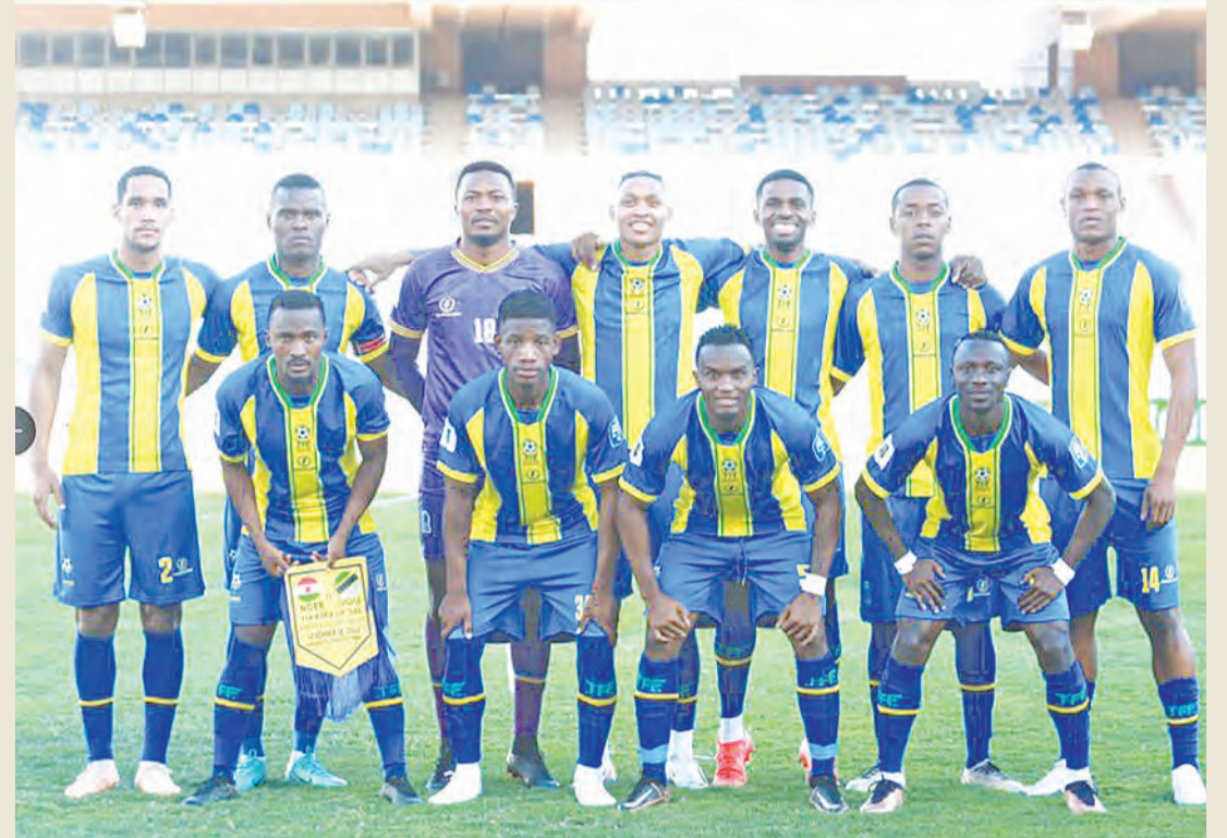
Taifa Stars squad during their 2026 FIFA World Cup African qualifiers Group E match against Niger at the Stade de Marrakech in Morocco on Saturday. Stars won 1-0.