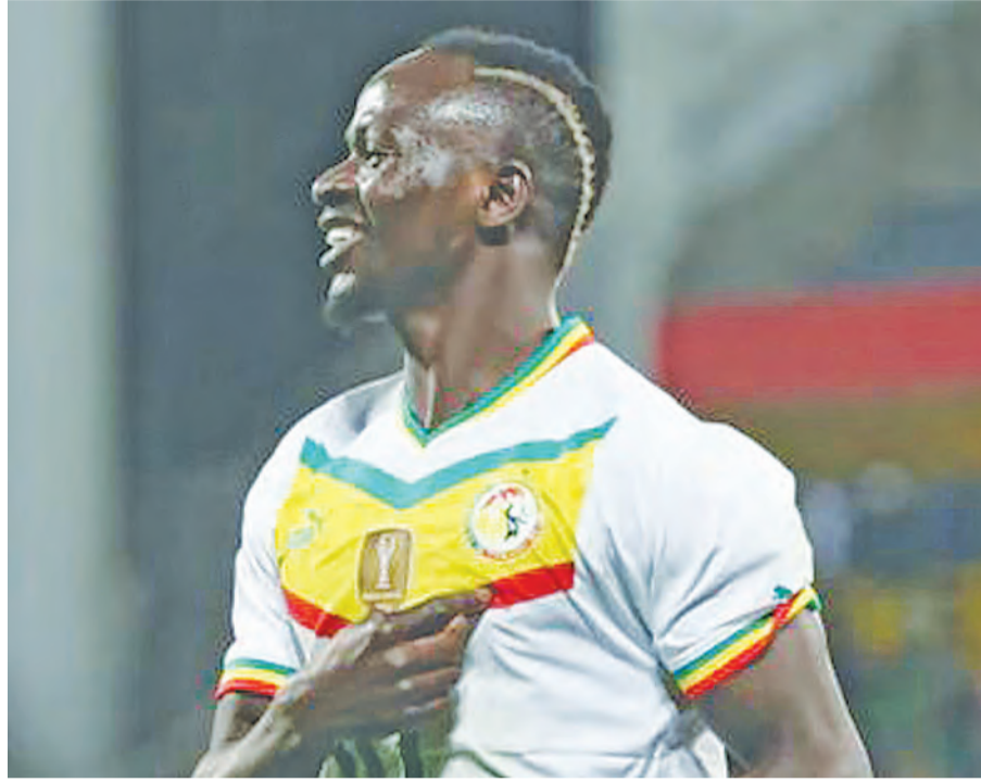
Sadio Mane was denied the chance of a hat-trick against South Sudan after Senegal coach Aliou Cisse took him off just after the hour mark.

Elsewhere, Tanzania enjoyed a 1-0 victory in an away fixture against Ni-