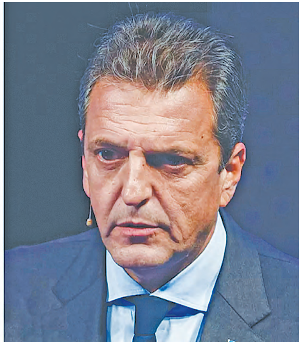
Javier Milei and Sergio Massa have been battling it out in an acrimonious election campaign

And while a majority of surveys are giving Mr Milei a slight lead over his rival, Sunday's run-off looks set to be a nail-biting finish to an acrimonious election campaign.