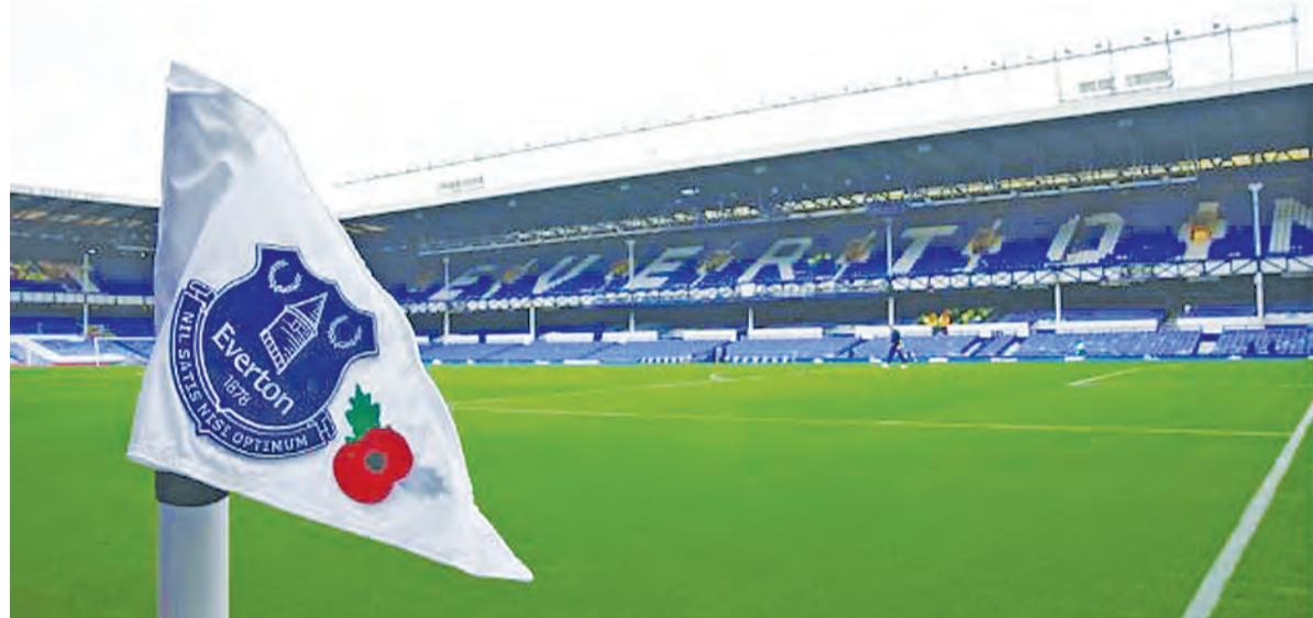
A general view of a corner flag with a poppy logo ahead of the Premier League match at Goodison Park, Liverpool. Picture date: Saturday November 4, 2023.

Whether clubs proceed with litigation in this latest case, whether it is successful, and what all this uncertainty may mean for Everton's pro-