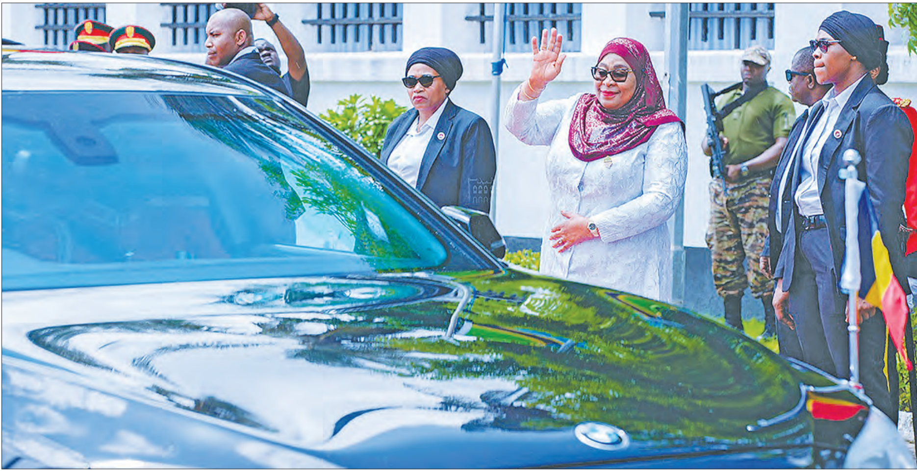
President Samia Suluhu Hassan pictured at State House in Dar es Salaam yesterday bidding farewell to Romanian President Klaus Iohannis, who had just wrapped up a four-day state visit to Tanzania.