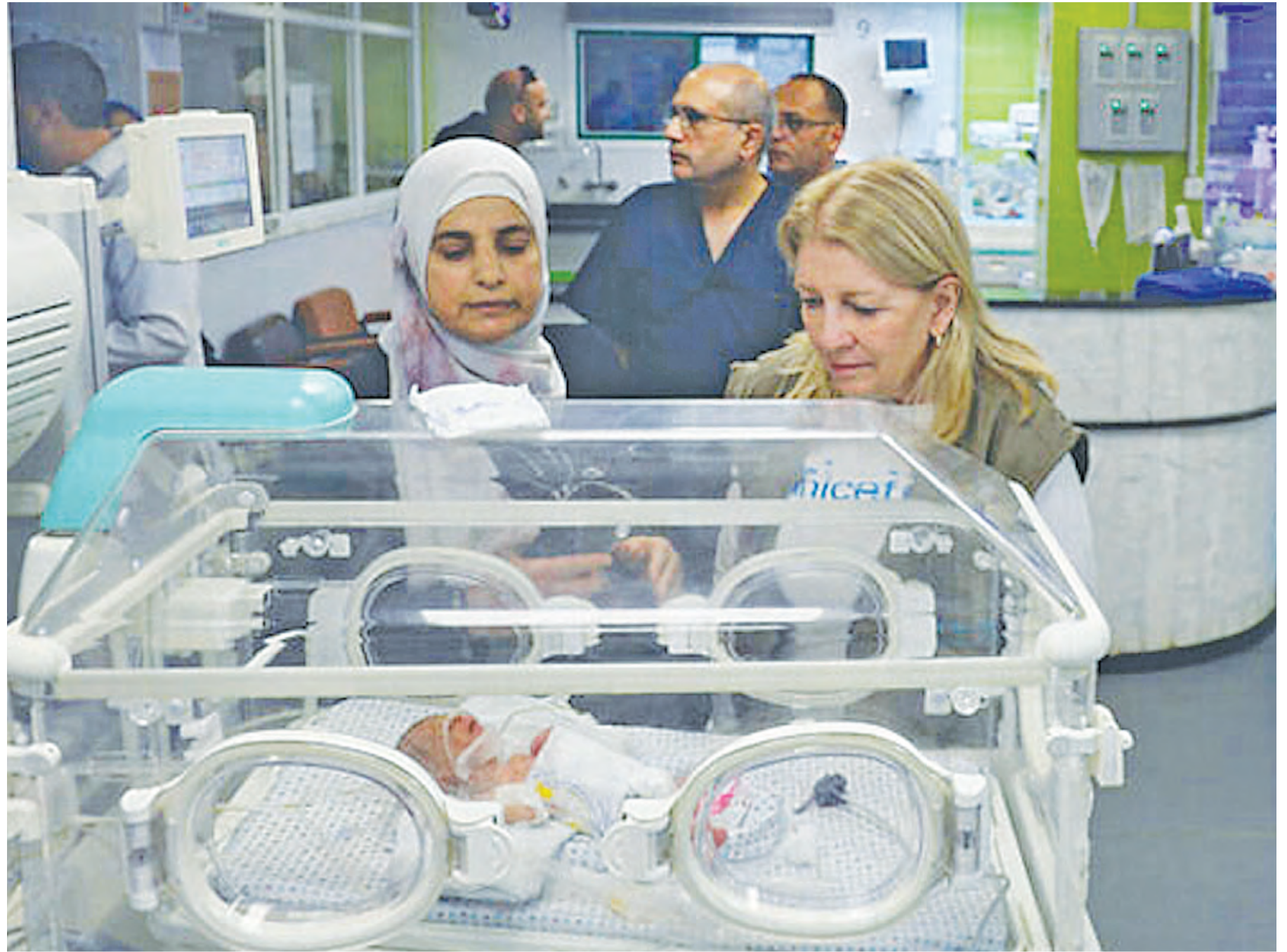
UNICEF executive director Catherine Russell (right) visits Nasser Hospital in Khan Younis, Gaza on November 14, 2023.

Number four: This is bedrock, of course: enable humanitarian organizations to deliver aid throughout Gaza without impediment or interference. I haven't witnessed in my many, many decades of dealing with war, an occasion on which so much attention is being paid to the requirements of international humanitar-