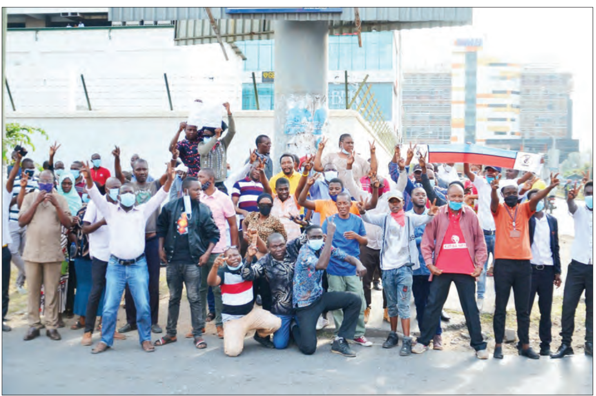
Chadema supporters chant outside the court.