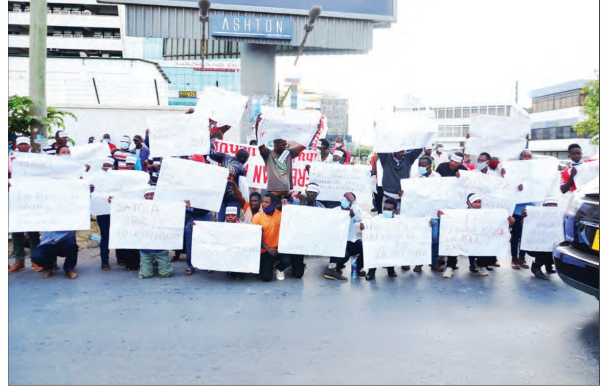
Chadema supporters display placards bearing messages expressing support for their embattled national chairman, Freeman Mbowe.