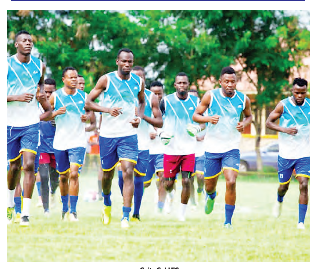
Geita Gold FC