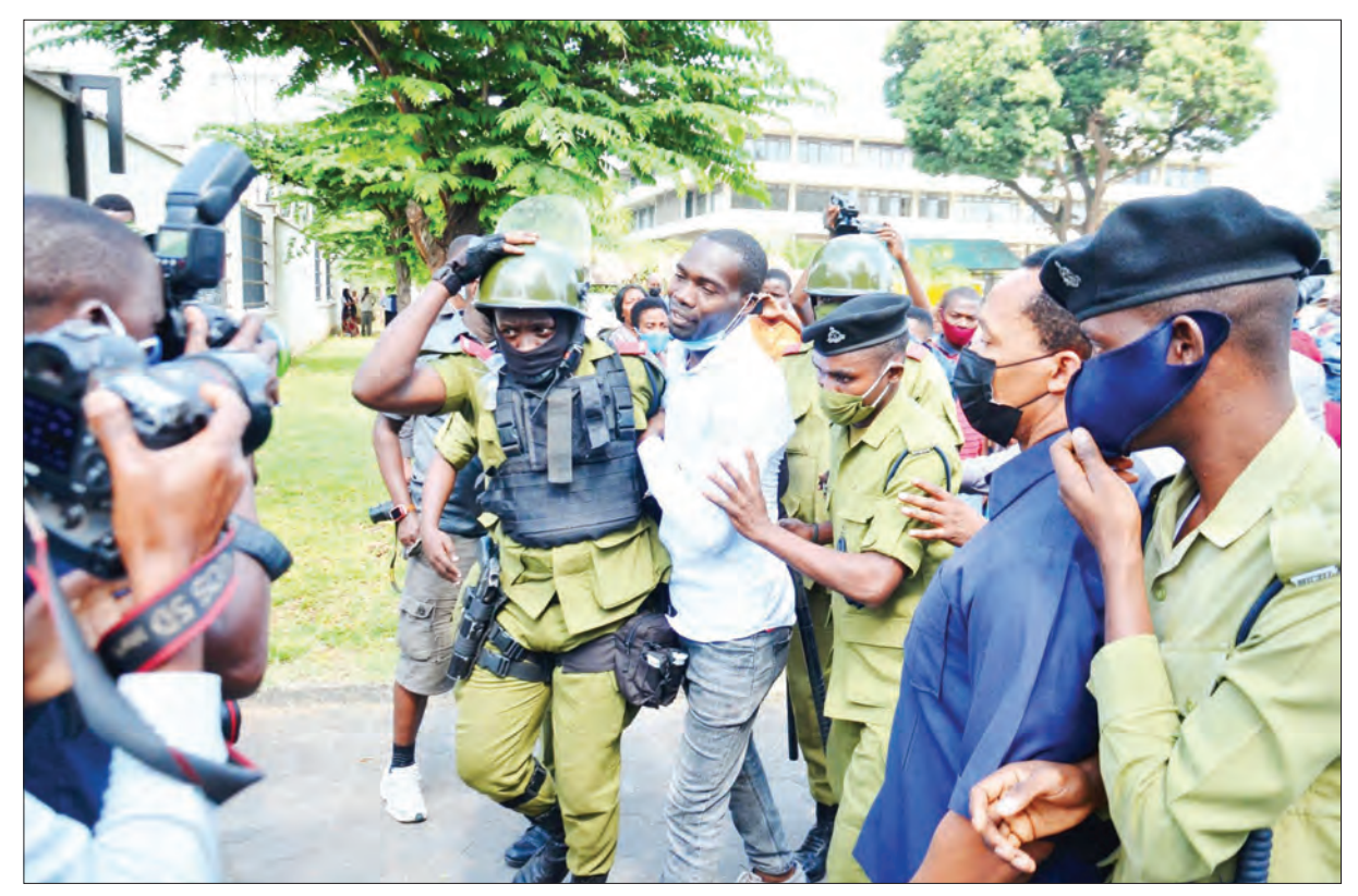
Riot police officers on patrol at the court's grounds lead away a presumed Chadema supporter.