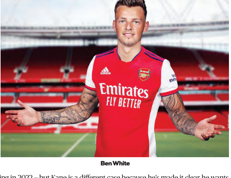
by David Chikoko

It remains to be seen if the incoming capital originating from the La-Liga investment by CVC will impact the European transfer market or simply alleviate the short-term financial pressure on Spanish clubs.