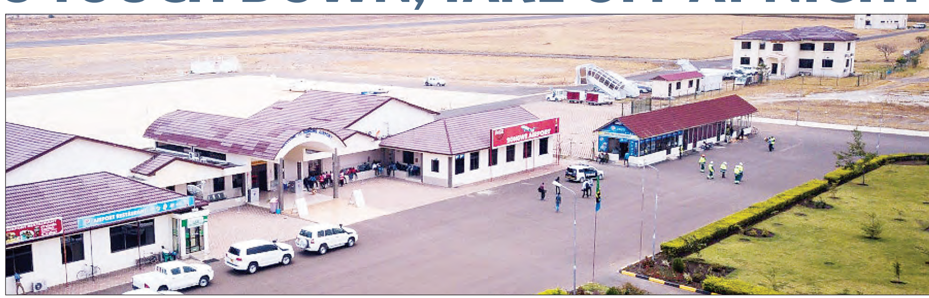
An aerial view of Songwe International Airport.

"This airport will also be equipped world contractor is proceeding well with the class cargo and passenger handling equip- fixing of airport lighting system on the