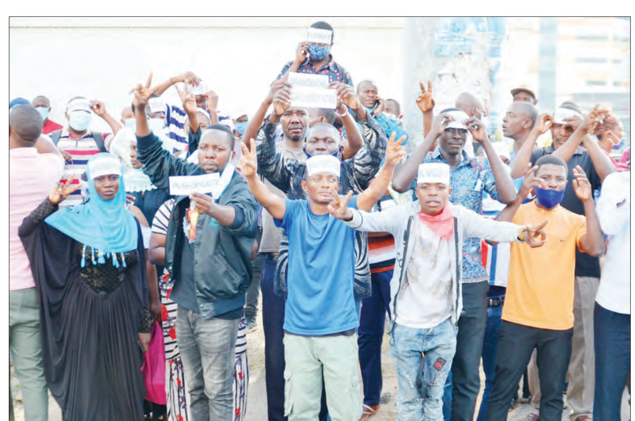
Chadema supporters show the party's trademark victory sign.