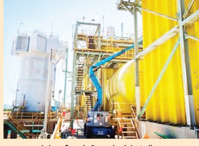
A zinc refinery in Queensland, Australia.

While South Africa has 20% of the world's zinc deposits, it no longer refines any zinc following Exxaro closing the Zincor refinery in Springs at the end of 2011. Up to then, South Africa produced 110,000t/y of refined zinc valued at R4.3bn. From 2014 to 2019, it instead