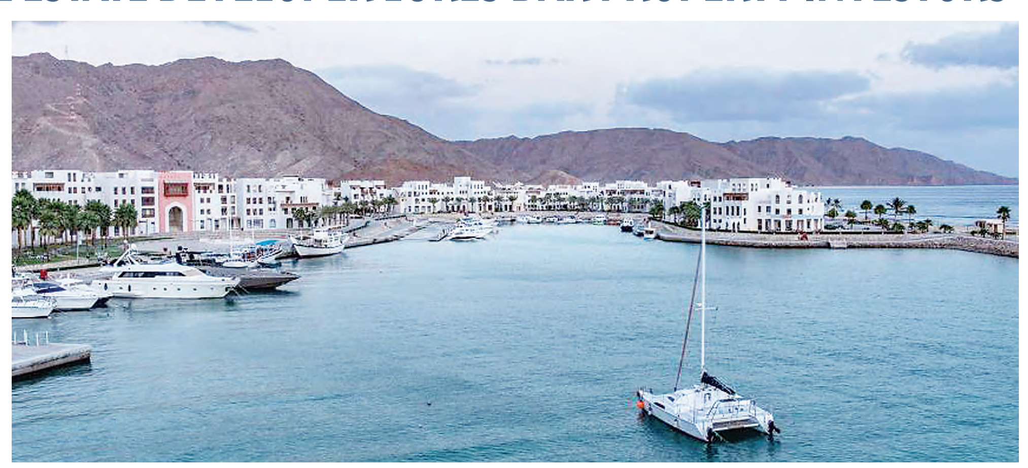
Muriya's flagship residential units at Jebel Sifa in Muscat.

"Our project's construction works of new units are ongoing and already 730 units have been sold out since when they were put on the market