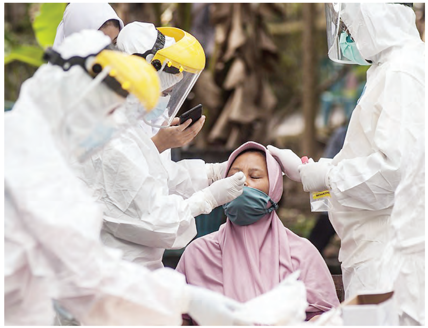
A health worker takes a swab sample from a woman for COVID-19 test in Yogyakarta, Indonesia, June 14, 2021. File photo