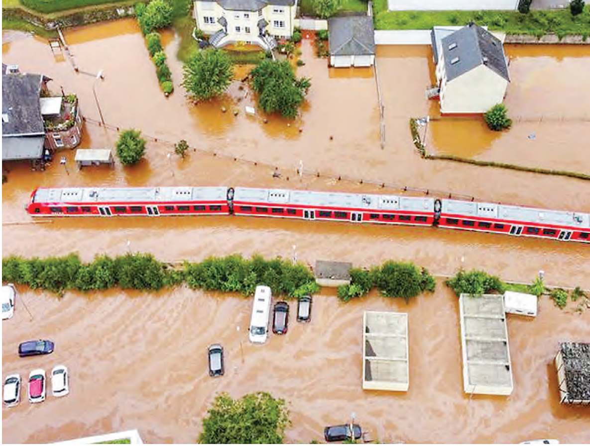
A regional train sits in the flood waters at the local station in Kordel, Germany, Thursday July 15, 2021 after it was flooded by the high waters of the Kyll river.

In drafting those assessments, scientists consider thousands of individual studies published since the last IPCC report. To finalize their latest assessments for the upcoming report, scientists have been meeting virtually with policymakers since July 26, scrutinizing the details