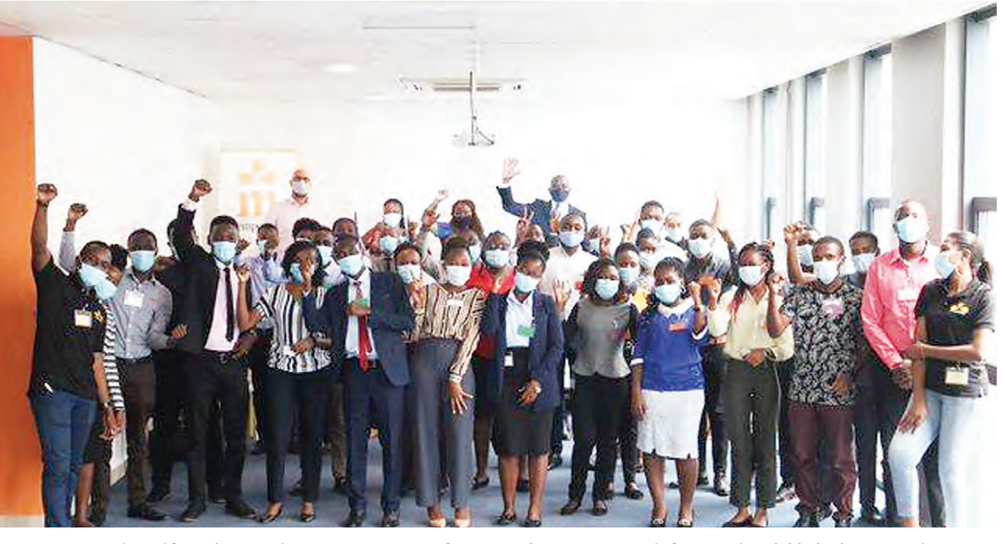
Youths who graduated from Tigo's Graduate Programme pose for a souvenir photo at the end of the year long initiative in Dar es Salaam recently.

One of the reasons for this challenging situation is that most graduates lack or have limited necessary and complimentary 'soft' skills to enable them find employment in the formal sector. These