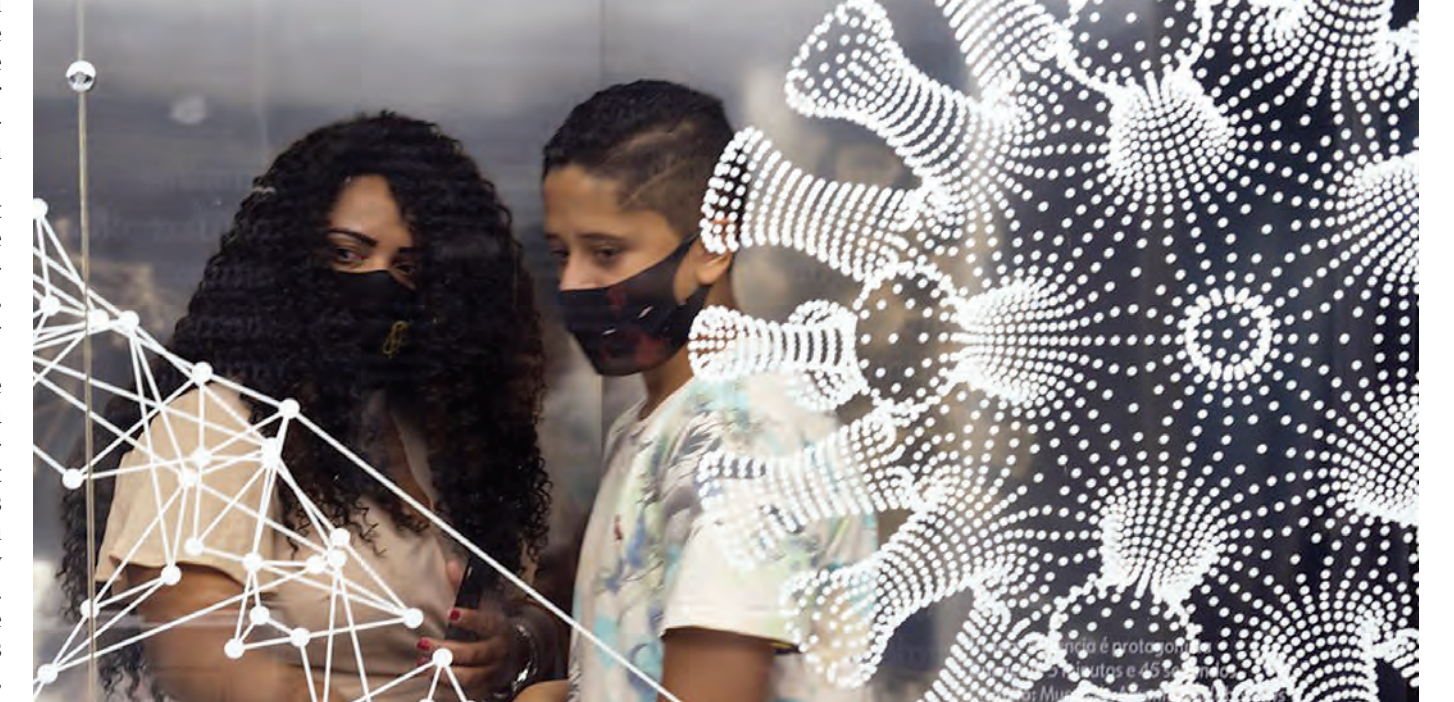
People visit an exhibition themed on COVID-19 pandemic in Rio de Janeiro, Brazil, March 11, 2021. File photo

Some U.S. politicians' ignorance of science has given free rein to an anti-science sentiment across the country,