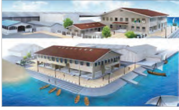
Architect's impression of the Malindi Fish Landing and Marketing facilities

Through JICA's support, a Japanese contractor started rehabilitating the old erosion-prone Malindi Fish Landing and Marketing Facilities to contribute to the provision of safer and more hygienic working condition for the users, thus promoting stable supply of quality fish to the people of Zanzibar. The facilities are expected to accommodate fishing vessels, create jobs for people in the sector, and increase the earnings of stakeholders in fisheries value-chains, thereby bringing out the potential of blue economy in Zanzibar and boosting it.