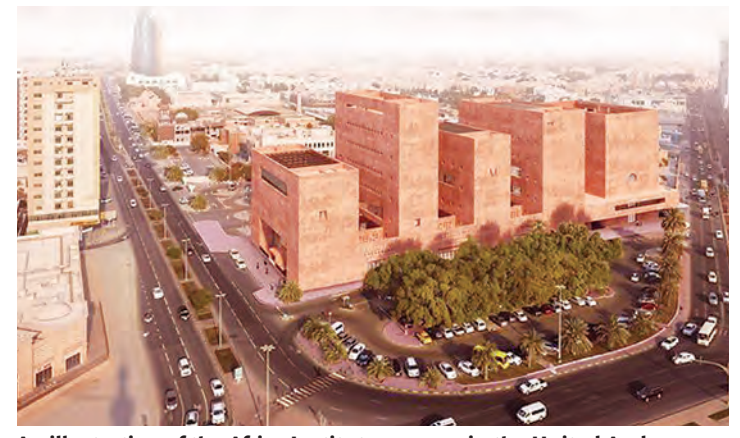
An illustration of the Africa Institute campus in the United Arab

The open-air courtyards are designed on the first and ground floors which are punctuated by water features and native planters, while these courtyards also improve air circulation and provide natural