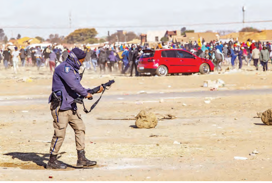
Chaos on July 13, 2021 in Daveyton, South Africa. Violence and looting started in KwaZulu-Natal with Jacob Zuma's supporters calling for his immediate release before spreading to some parts of the country. File photo

indeed grown, albeit modestly. According to Police Minister Bheki Cele, in March 2021 the number stood at 6,324, a rise of 34% from 2014. And the number of units has expanded to 49. Despite these increases, police were still overwhelmed when responding to the recent unrest.