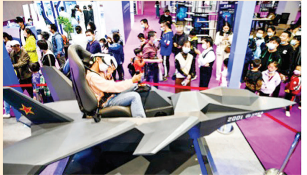
A child "pilots" a plane via a VR program at the 2022 World Conference on VR Industry in Nanchang, east China's Jiangxi province, Nov. 13, 2022.

The action plan also proposed to drive new types of consump-