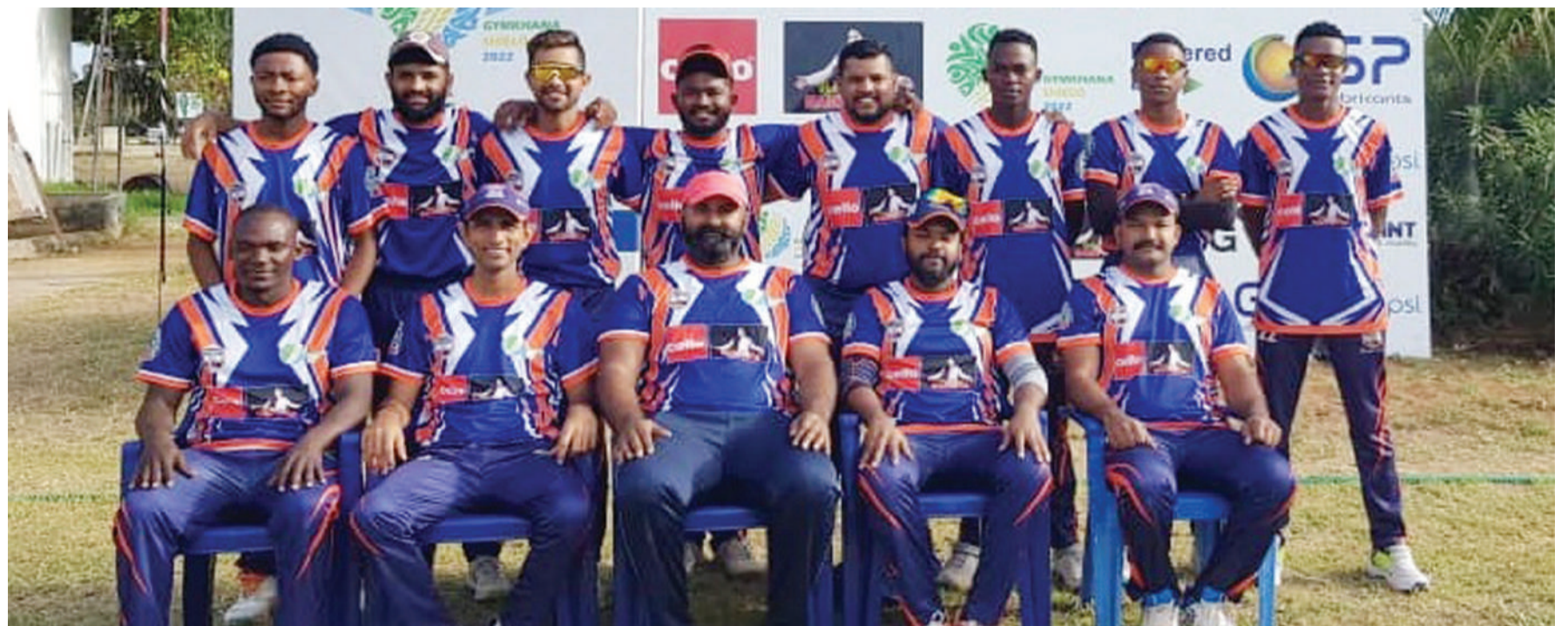
Caravans Cricket Club is pictured before taking part in a 2022 Cello/Ruby's Magic Gymkhana Shield tournament duel against Shree Kutchi Leva Patel Sports Center (SKLPSC) which took place in Dar es Salaam last weekend.

The showpiece's organizers stated that exciting matchups made up of old and new rivalries are in store for cricket followers in the city that will watch the tournament's ties during weekends.