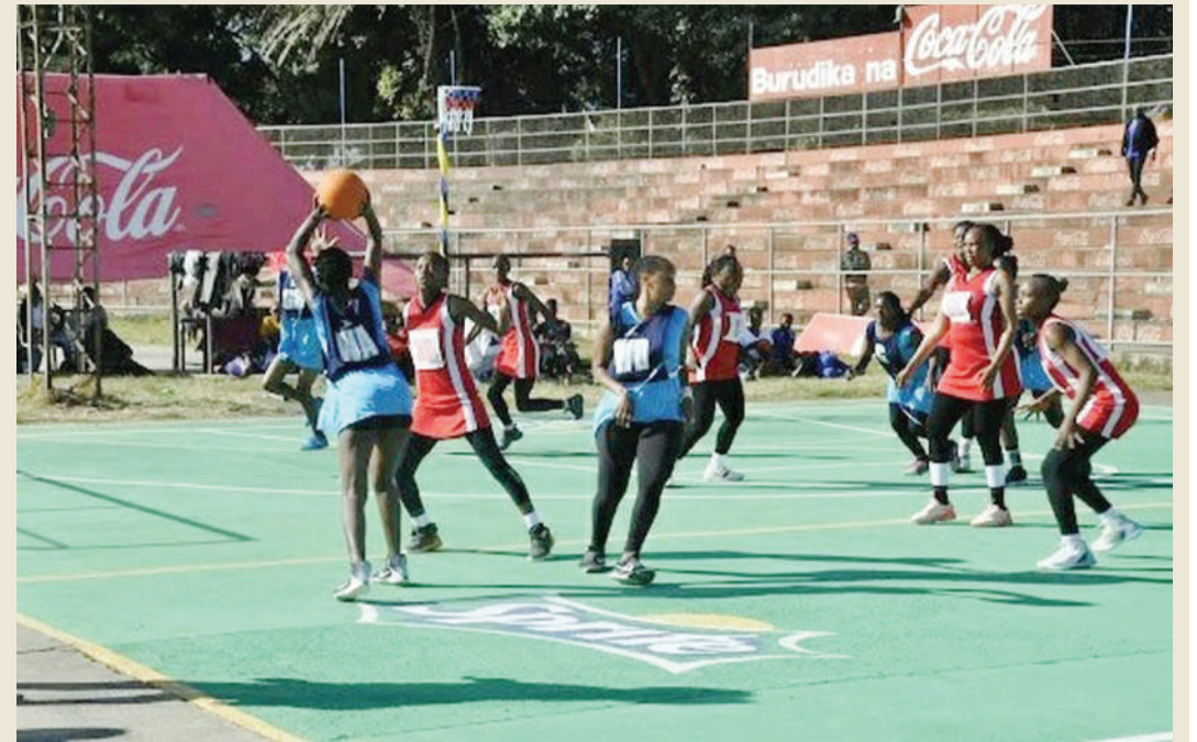
Netballers feature in one of the sports tournaments which were organized to vouch for the prevention and control of non-communicable diseases in Arusha recently.

"The WN compiles rankings based on points that teams accumulate, what is needed now is to have Taifa Queens