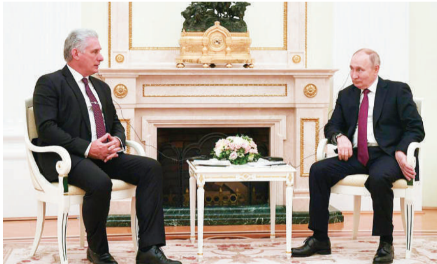
Cuban President Miguel Diaz-Canel (L) and Russian President Vladimir Putin

"Today we opened a monument to him, which in my opinion, is very good. I do not know if you liked it or not, but it seems to me that one can't help but like it," Putin said with a smile, adding that it was a proper tribute to Castro's memory and a real work of art. "It's dynamic, on the move, looking forward. A perfect image of a true fighter."