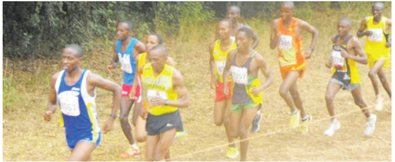
Tanzania's athletes compete in a recent National Open Cross-Country Championships which took place in Arusha.