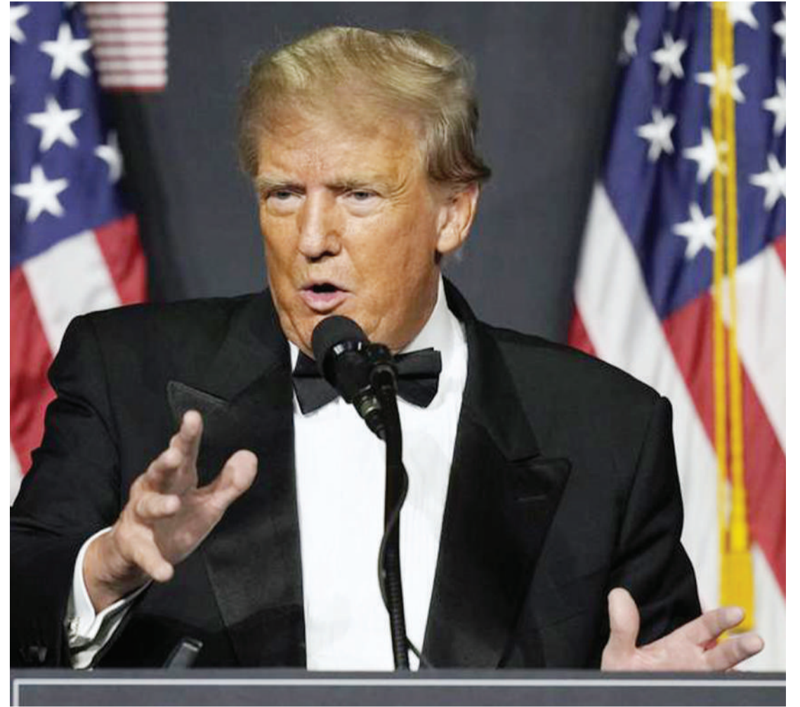
Former US president Donald Trump speaks at Mar-a-Lago Friday, Nov 18, 2022 in Palm Beach, Florida.

The panel in its request invoked a federal law that empowers its chairman to request any person's tax returns from the Internal Revenue Ser-