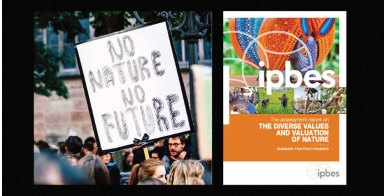
IPBES' Assessment Report on Diverse Values and Valuation of Nature Report tells of the successful campaign by the Niyamgiri Movement.

objective scientific assessments about the state of knowledge regarding the planet's biodiversity, ecosystems and the contributions they make to people, as well as options and actions to protect and sustainably use these vital natural assets. In this regard, the Values Assessment responds to the need to support decision-makers in understanding and accounting for the wide range of nature's values in policy decisions to address the