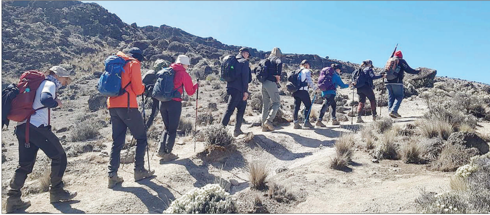
Tourists from various countries at Horombo on Monday heading towards Uhuru Peak of Mount Kilimanjaro. It is the highest mountain in Africa and the highest single free-standing mountain above sea level in the world: 5,895 metres (19,341 ft) above sea level.