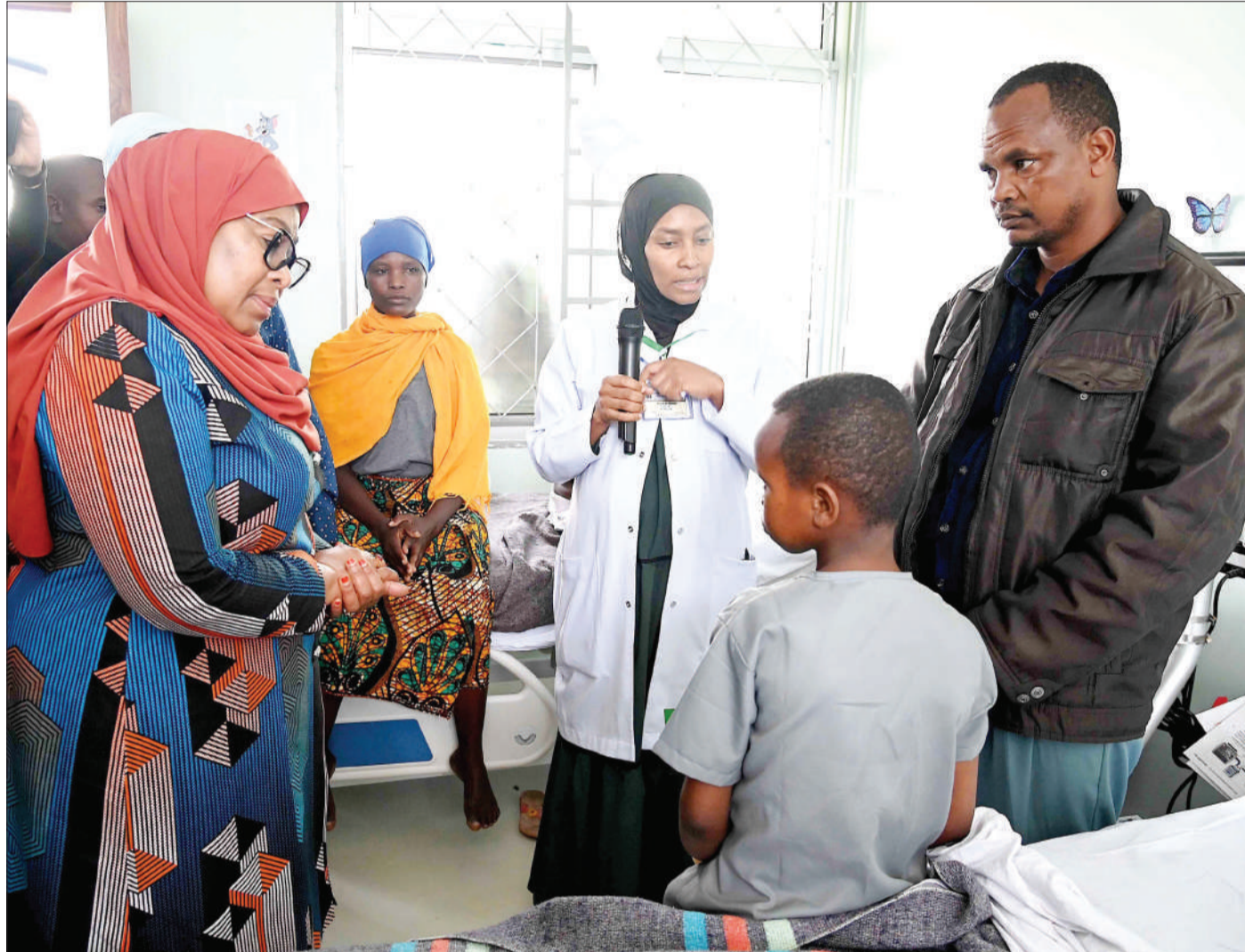
President Samia Suluhu Hassan consoles patients admitted to the Manyara regional referral hospital in Babati as part of her tour of the region yesterday.