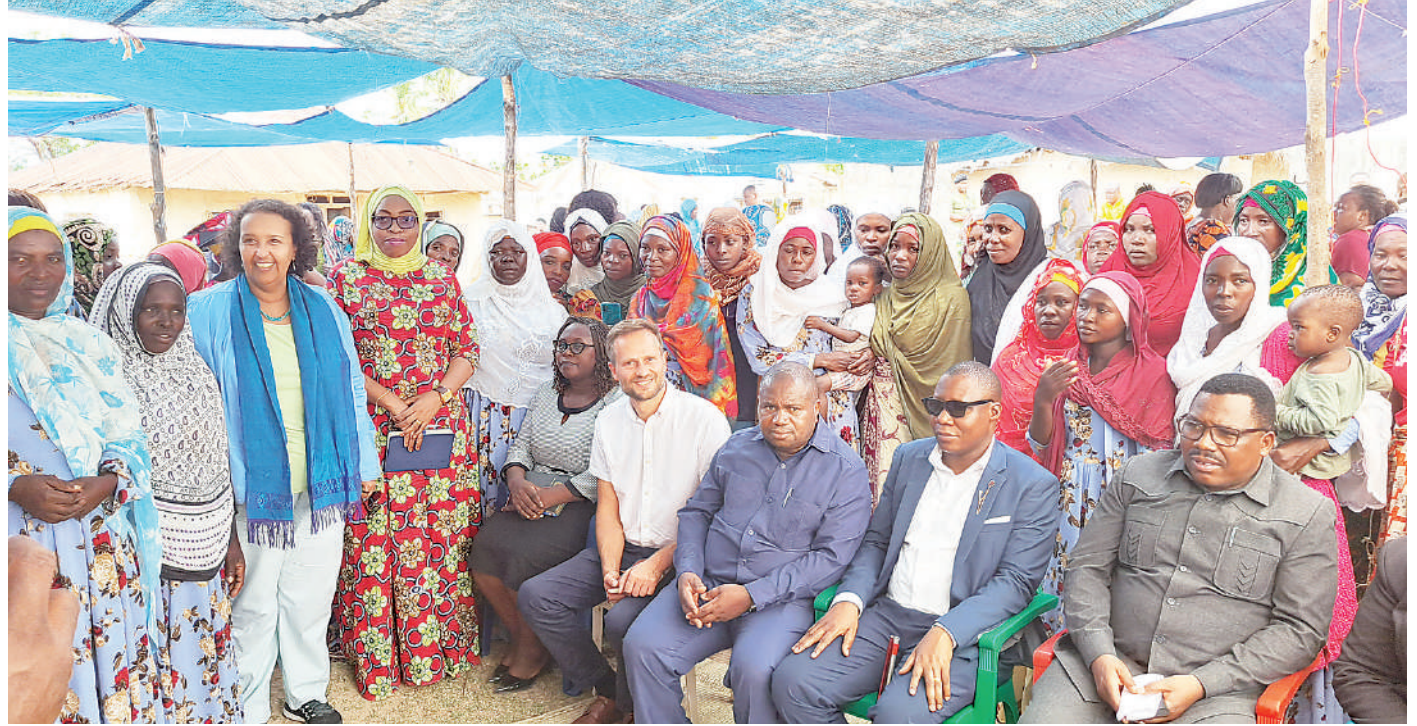
Some of the partners, stakeholders and beneficiaries of the WLER project in Mkungu village in Mtwara Region.

"Through the promotion of inclusivity and the strengthening of women's leadership, the project