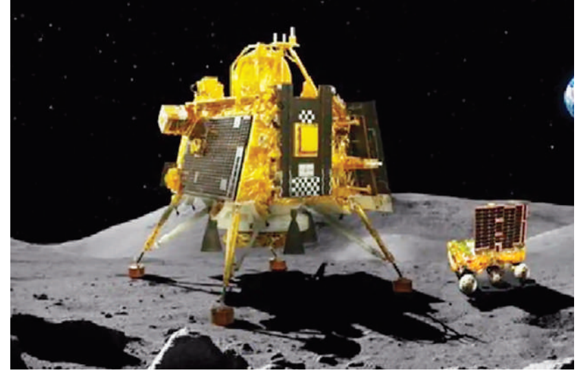
Chandrayaan-3 Moon Mission cost India around 700 crore.

Overall, India became the fourth country - after the US, China, and Rus-