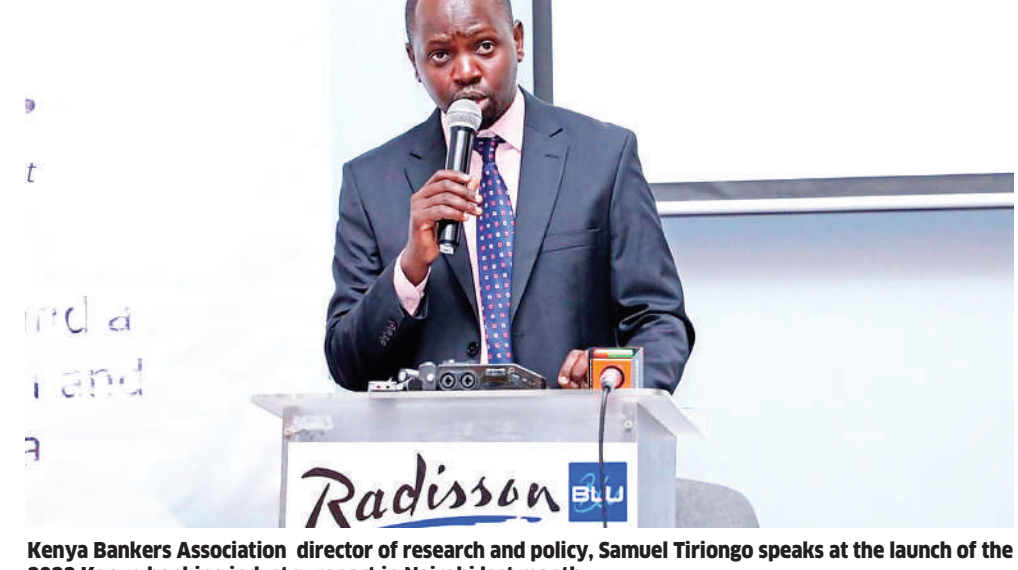
2023 Kenya banking industry report in Nairobi last month.

The move mirrors what was witnessed at the height of Covid-19 era disruptions where banks were granting customers loan servicing breaks and varied servicing periods to accommodate struggling firms