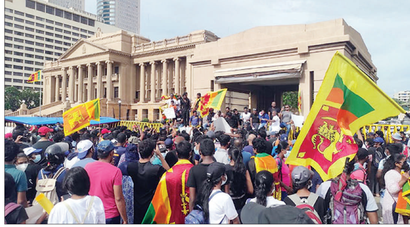
Anti-government protest in Sri Lanka on April 13, 2022.

The transfer of financial and resource wealth from poor countries in the global South to the rich countries in the North is not a new phenomenon. It has been an