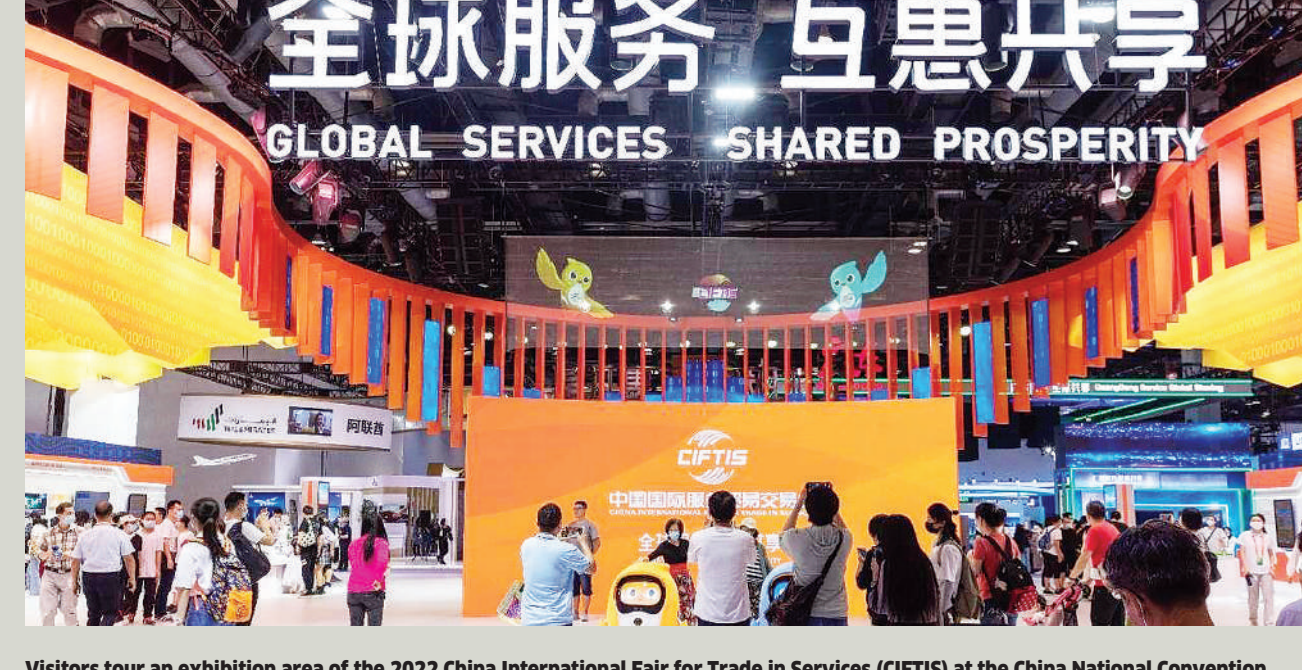
Visitors tour an exhibition area of the 2022 China International Fair for Trade in Services (CIFTIS) at the China National Convention Center in Beijing, on Sept. 3, 2022.

porters globally to access the Chinese market, explore investment and partnership opportunities, and gain insights into China's economic development.