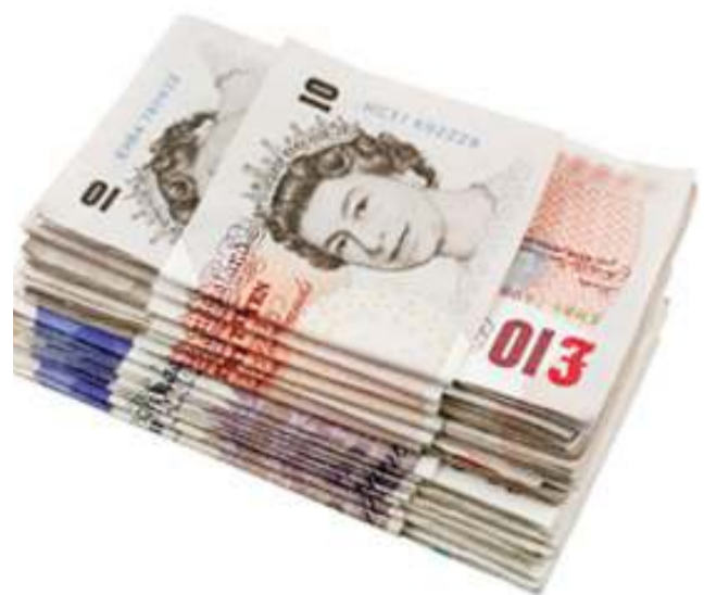
British pound sterling bills.

5:30 Uwanja wa Mazoezi 6:00 HABARI 6:40 Kumekucha 7:00 Habari 8:00 Al Jazeera 09:00 Watoto Wetu 10:00 Isidingo 11:45 Aibu Yako 11:50 Hawavumi lakini wamo rpt 12:50 Bongo Movie rpt: Mahabusu 2 14:00 Tamasha la Michezo 15:00 Mwangaza 16:00 Korean drama: The great queen Seonduk 16:45 Mjue zaidi 17:30 Kipindi cha kikristo 18:00 Jiji Letu 18:15 Mapishi 18:30 Mizengwe rpt 18:45 Matukio ya wiki 19:30 Igizo: Mtego 20:00 Habari 21:05 Mizengwe 21:00 Bongo Movie: Mkwé 22:00 Telenovela rpt: Destiny (Destino)