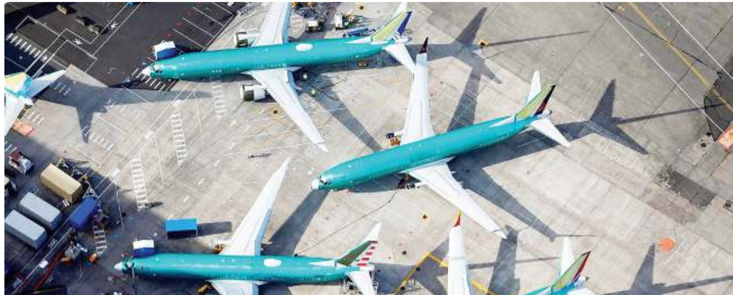
Boeing 737 MAX airplanes parked on the tarmac at the Boeing Factory in Renton, Washington.

The company, based in Chicago, knows that the ultimate success of its effort lies in winning back the confi-