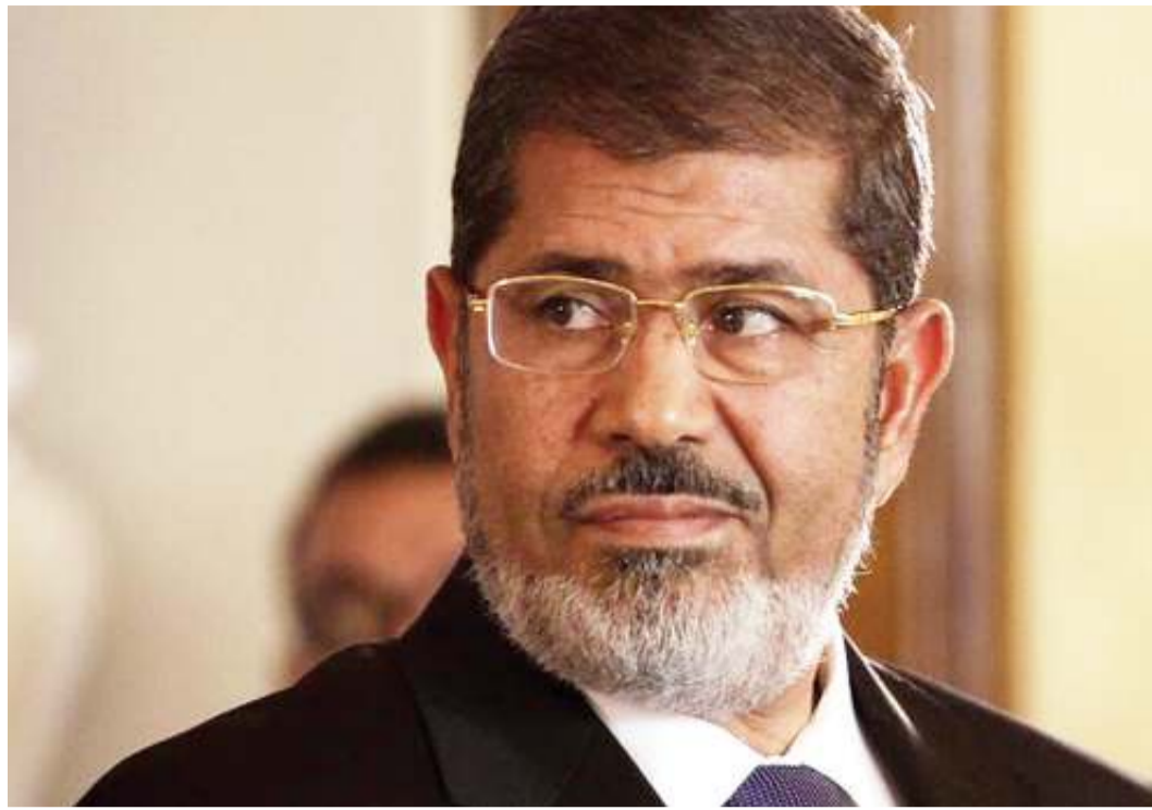
Egypt's former president, Islamist leader Mohammed Morsi