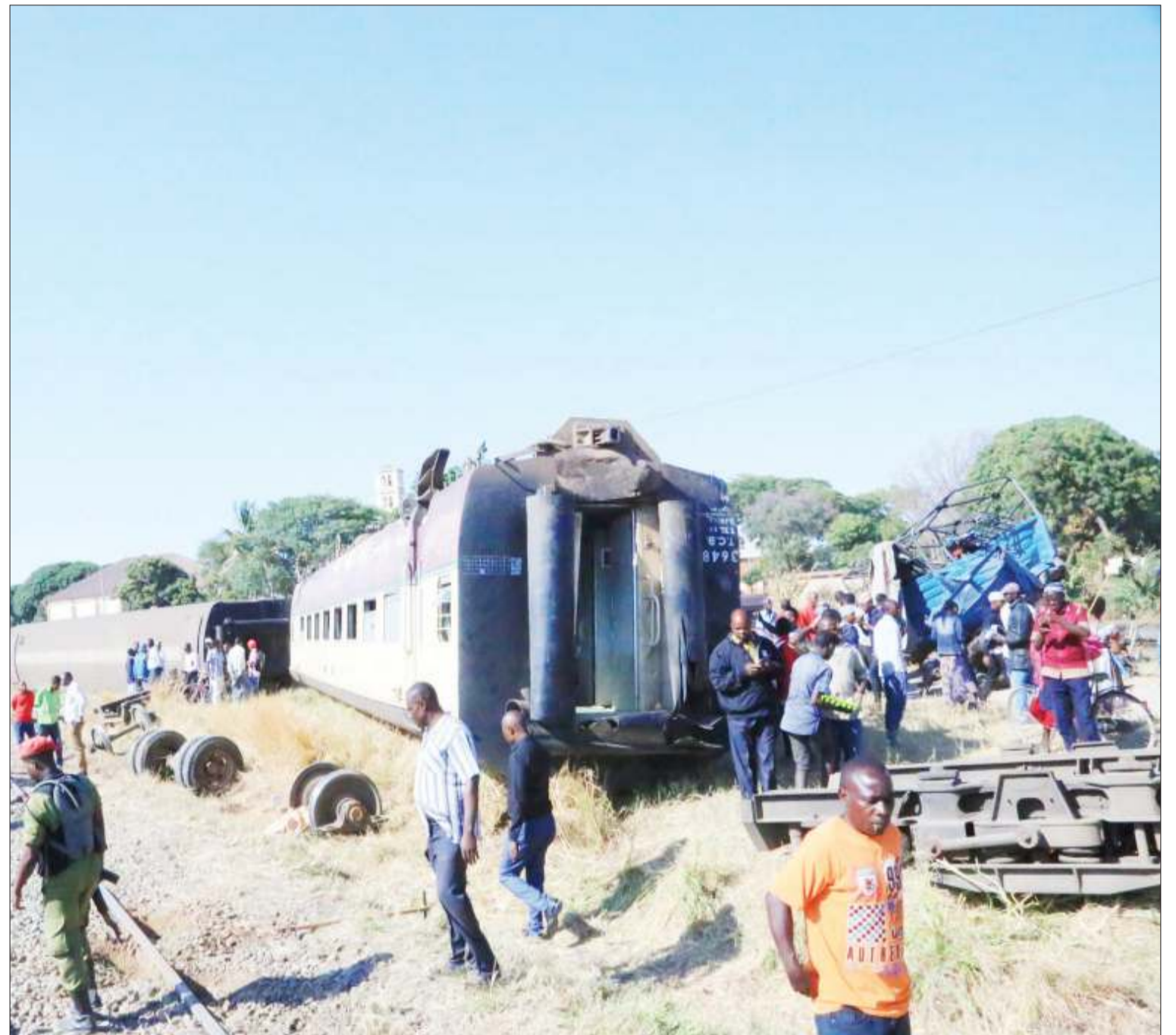
Dodoma residents look on forlornly shortly after the two Tanzania Railway Corporation wagons pictured fell off the rails following a collision involving a passenger train and a lorry in the city on Monday night.