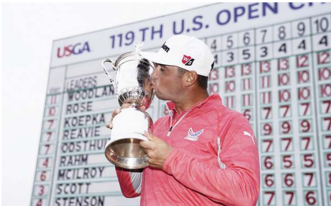
Gary Woodland poses with the trophy after winning the U.S. Open Championship golf tournament Sunday, June 16, 2019, in Pebble Beach, Calif.

His winning shot at Pebble Beach was more like a breakaway dunk in the final seconds with the outcome already secure.