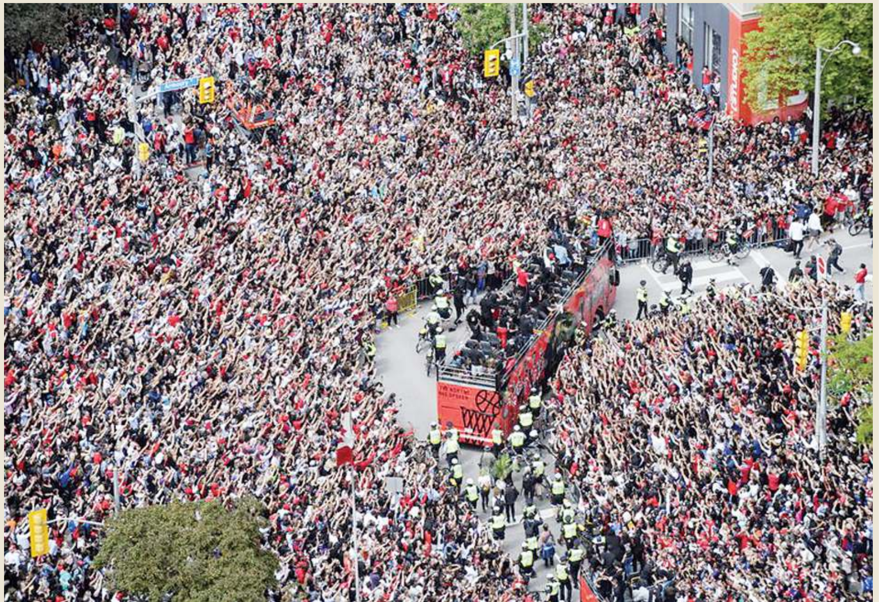
Fans cheer during the Toronto Raptors NBA basketball championship victory parade in Toronto, Monday, June 17, 2019.