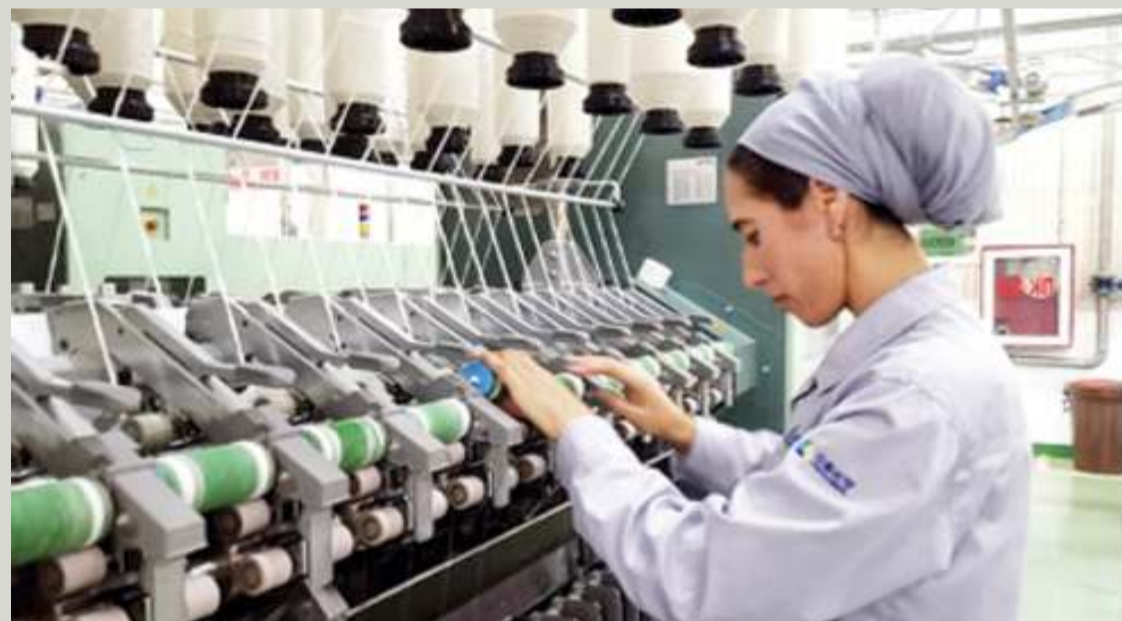
A Tajik worker is spinning at a workshop of a textile agricultural industry park built by China's Zhongtai Group.

A textile agricultural industry park built by China's Zhongtai Group is now the largest textile