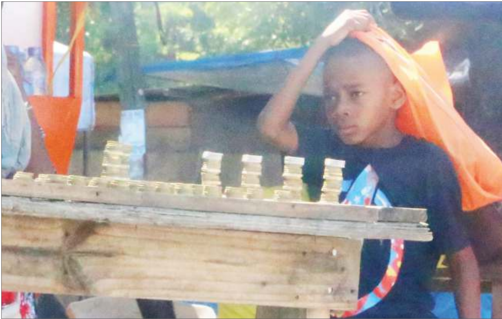
It is handy small change for Tanzanian currency all over this table, with the boy all ready to do the needful. City commuter bus conductors are easily the most frequent customers, while some sources say the business is illegal. This scene was captured at Ilala Boma in Dar es Salaam yesterday.