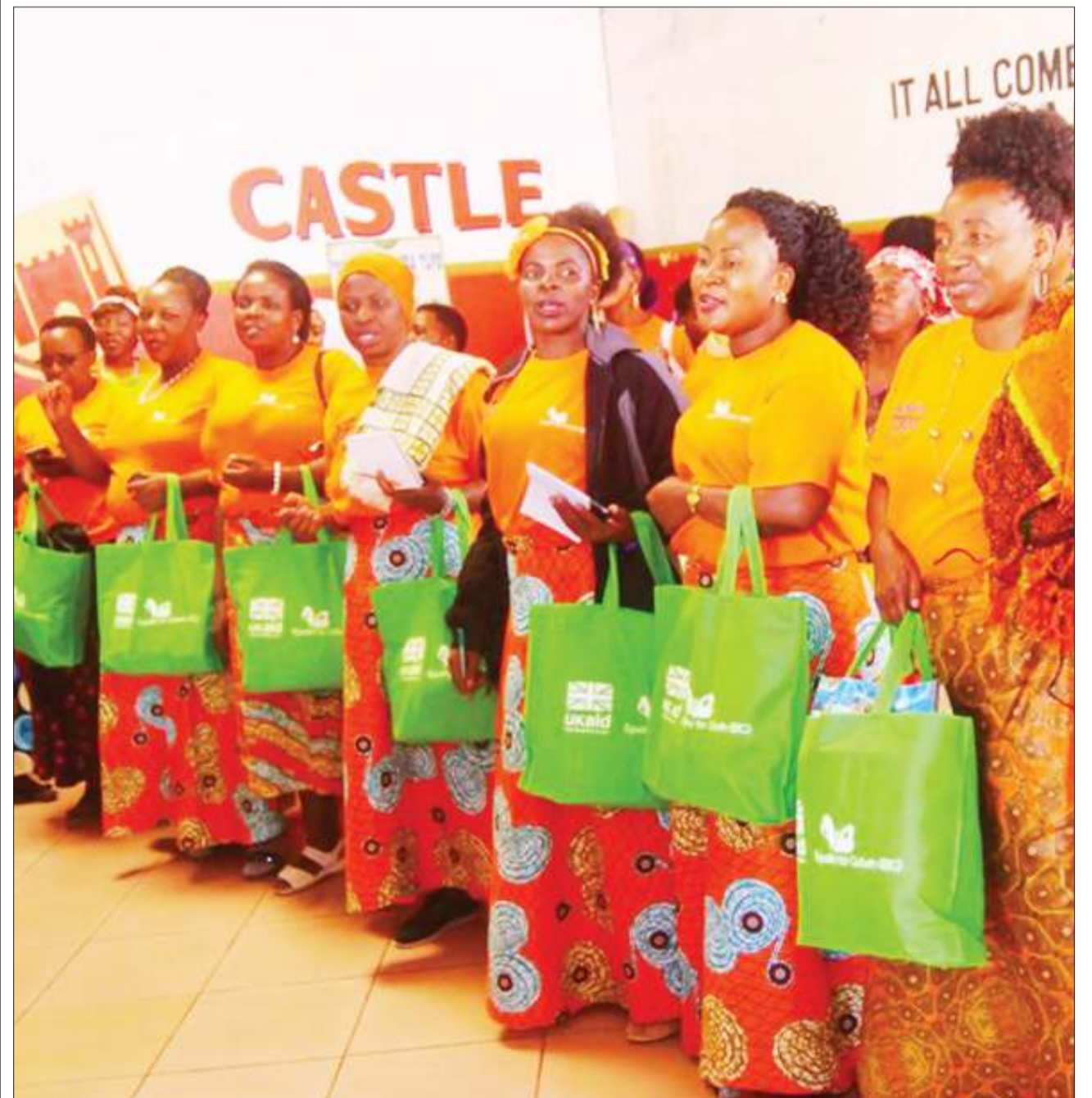
Dar es Salaam businesswomen carry paper bags containing sensitisation documents on the importance of solidarity in business and other issues. This was shortly after they had attended a workshop in Mbeya city at the weekend alongside their Mbeya Region colleagues.

He urged petrol stations operators in the lake zone to conduct their businesses in compliance with the law and rules governing the petrol sub-sector.