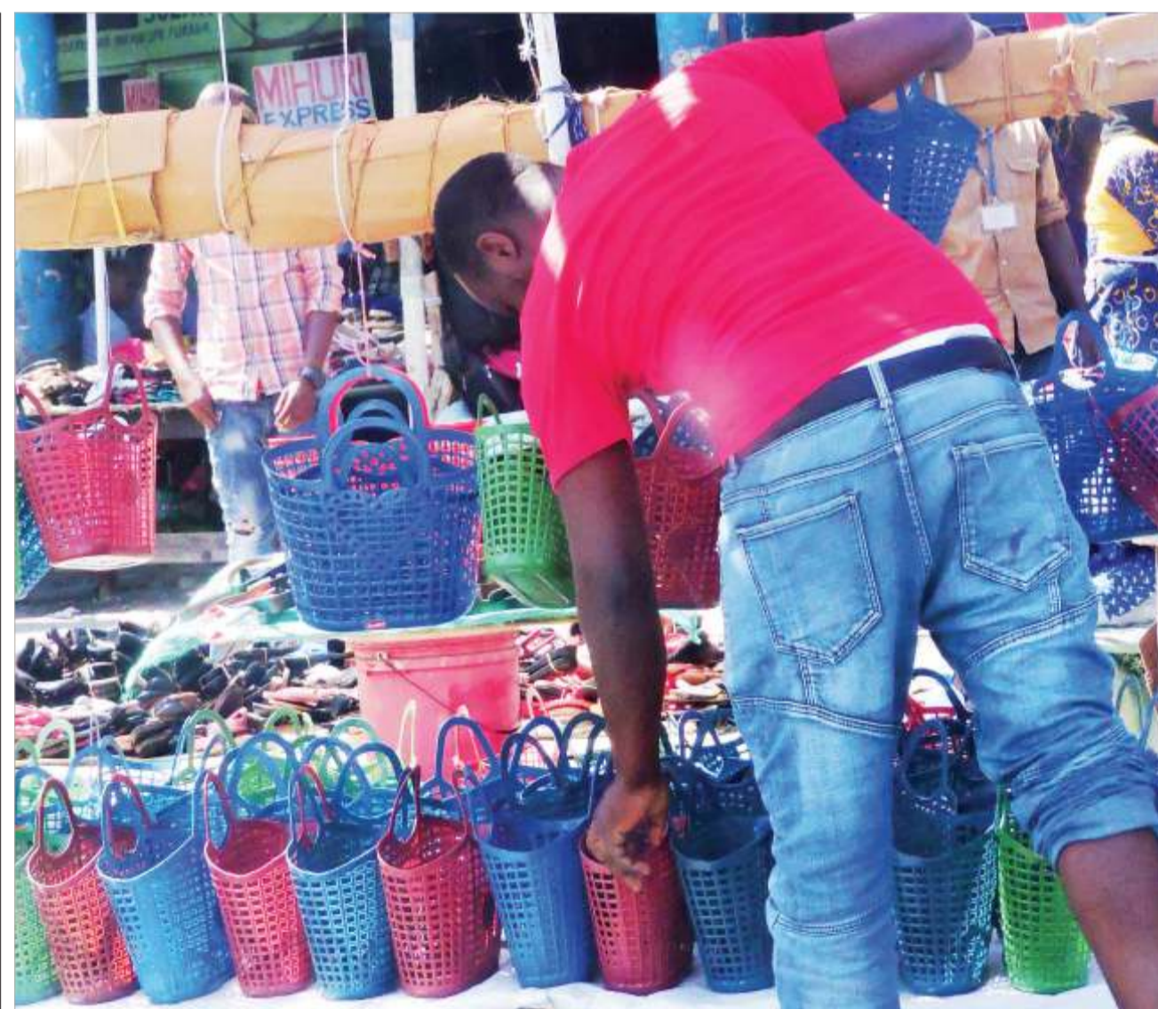
One of the types of 'Shopping' baskets now in fashion following the recent countrywide ban of plastic bags on sale, as found along Uhuru Street in Dar es Salaam's sprawling Kariakoo market zone yesterday.

"The World Population Prospects 2019: Highlights," is published by the Population Division of the UN Department of Economic and Social Affairs (DESA) and provides a comprehensive overview of global demographic patterns and prospects. The report is based on population estimates from 1950 to the present for 235 countries or areas, underpinned by analyses of historical demographic trends. The 2019 revision also includes population projections to the year 2100, that reflect a range of plausible outcomes at the global, regional and country levels.