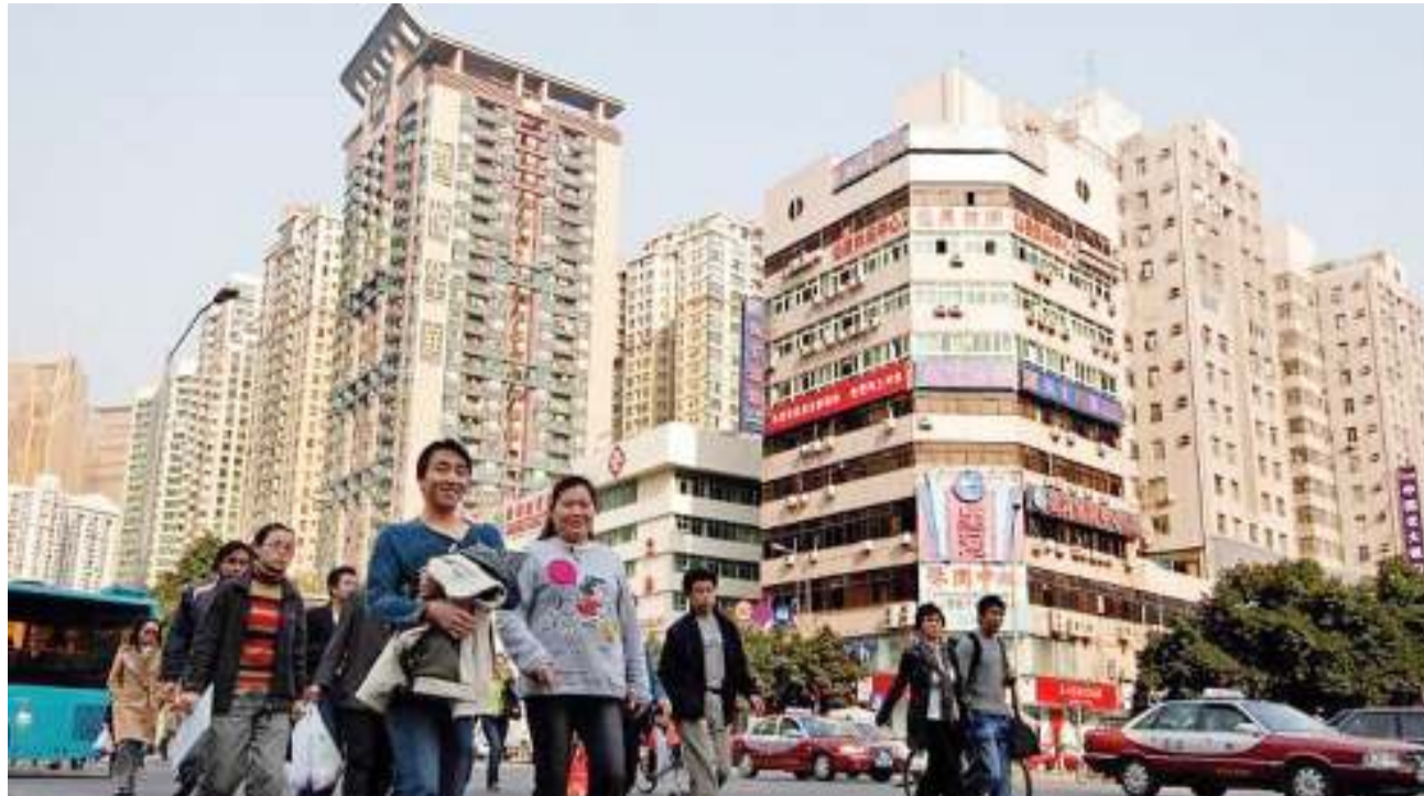
Pedestrians cross a busy intersection in Shenzhen, Jan 30, 2007. According to a survey by the Chinese Academy of Social Sciences, Shenzhen's new expanding middle class now accounts for about 10 percent of the city's population of 12 million.