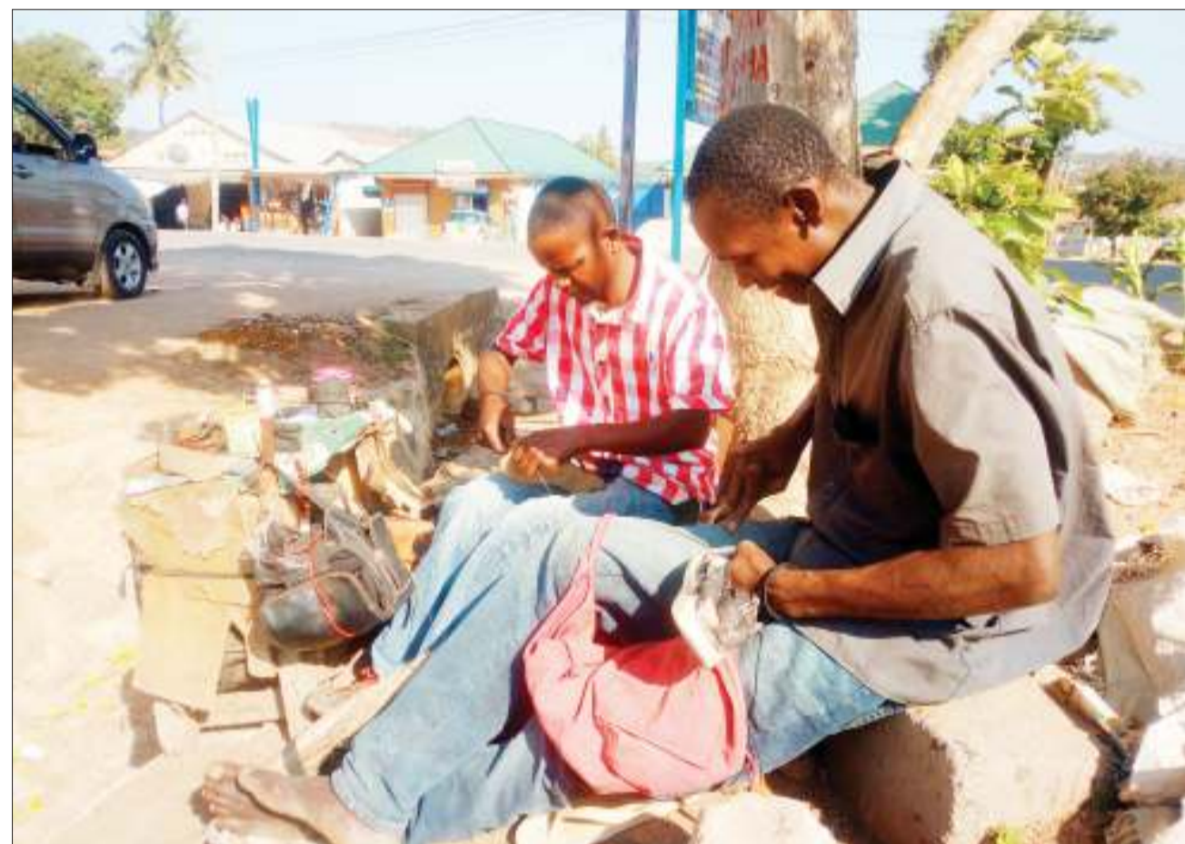
Business in full swing at an open-air shoe repair-& shine 'shop' at Nyakato in Mwanza city yesterday.

Mbulu is one of the five districts of Manyara Region, bordering Arusha Region to the north and Lake Eyasi, to the east by the Babati District, to the south by the Hanang District, and to the west by the Singida Region.