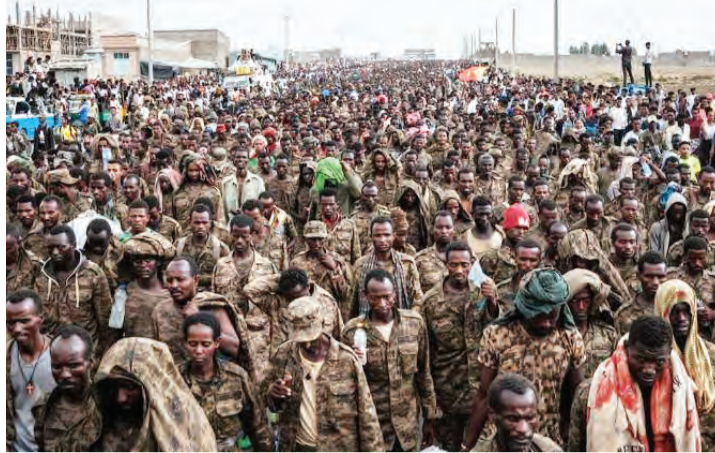
In this file photo taken on July 02, 2021 captive Ethiopian soldiers walk towards the Mekele Rehabilitation Center in Mekele, the capital of Tigray region, Ethiopia.

"If we do see a movement of Tigrayan forces back into Tigray, that is something we would welcome. It's something we've called for and we hope it opens the door to broader diplomacy," Price said.