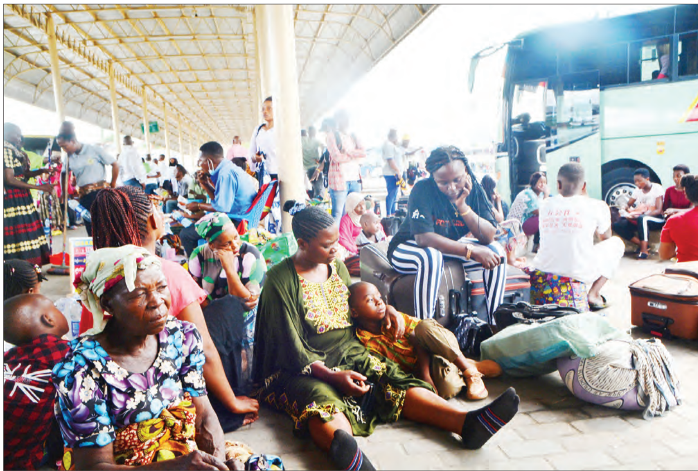
Passengers travelling to upcountry destinations for late December holidays with their families wait for buses at the Magufuli Terminal at Mbezi in Kinondoni district, Dar es Salaam yesterday. With this influx of people to the terminal, other transporters were being asked to fill the gap.