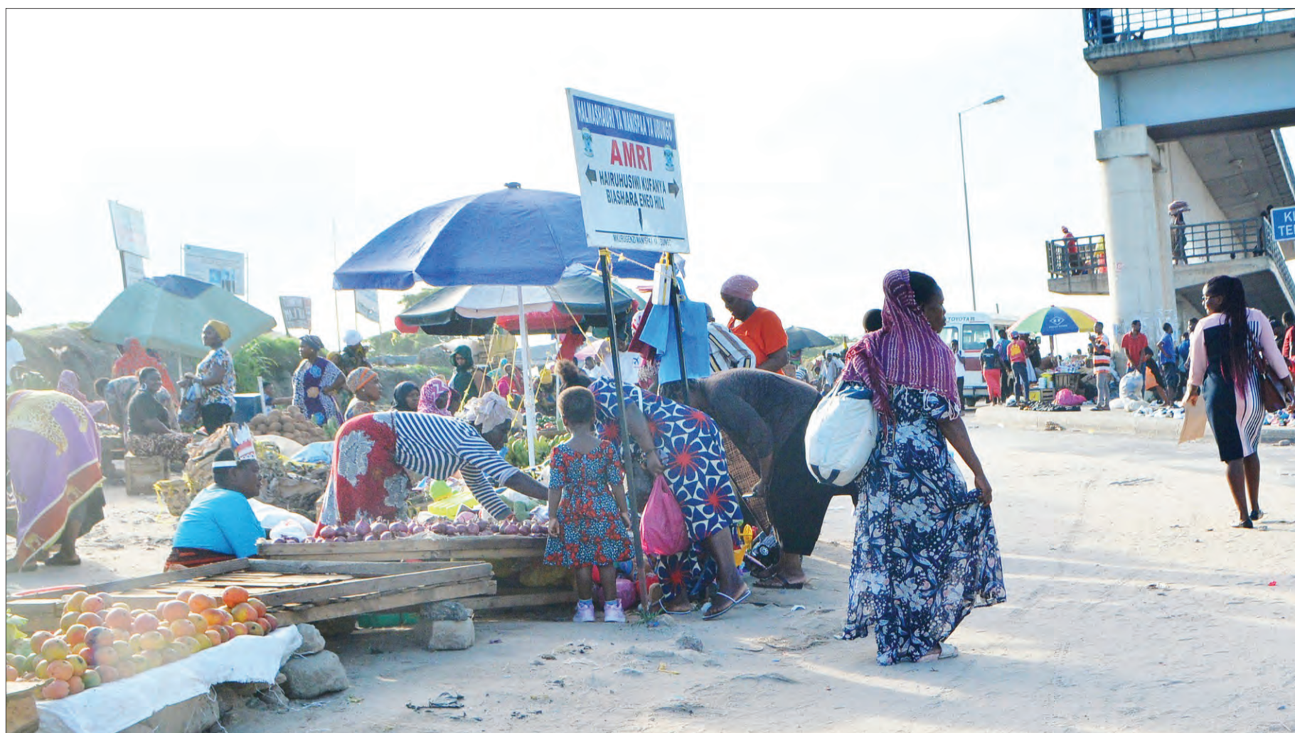
With or without the ban petty traders continue to conduct their businesses under the sign board at Kimara-Mwisho in Dar es Salaam yesterday.