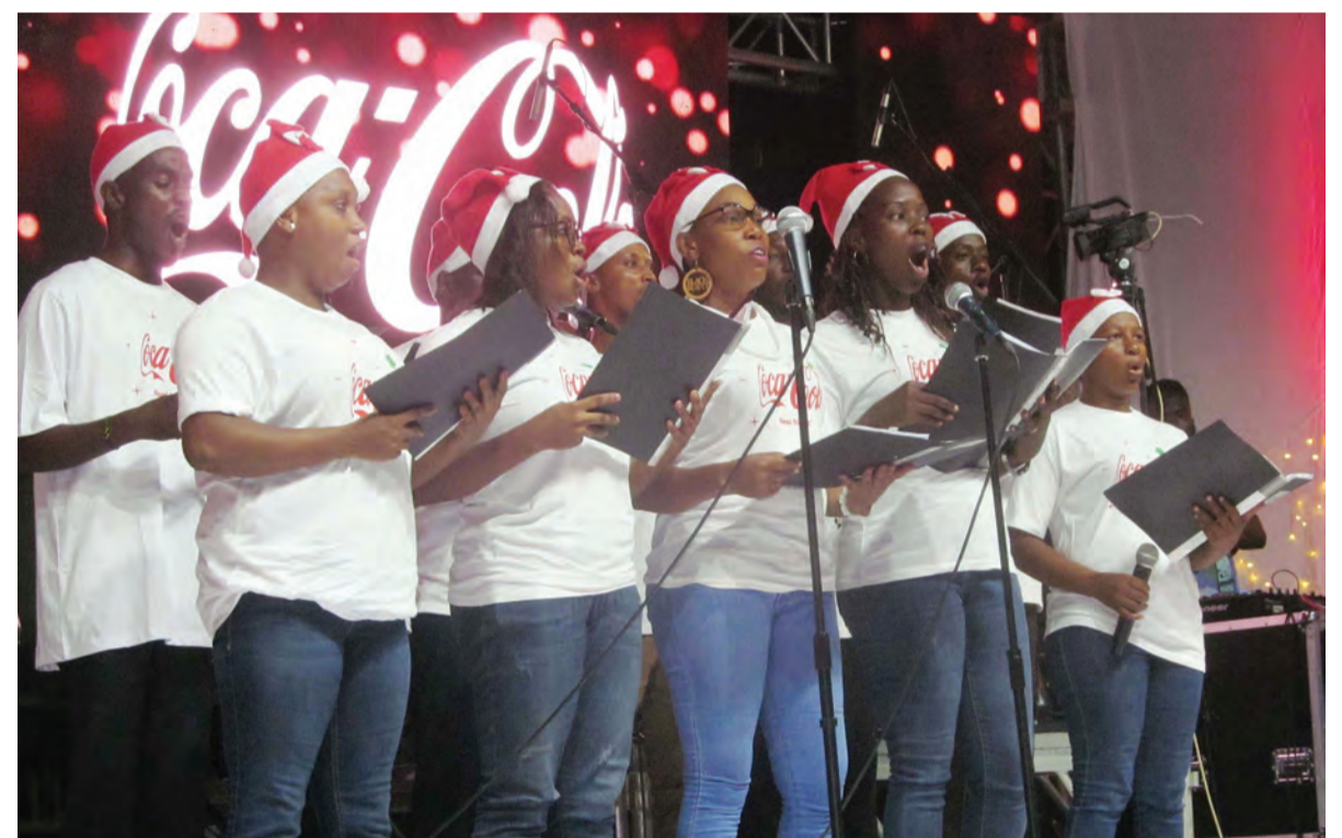
The Tanzania Philharmonic Society (TPS) singers perform at a festival, termed 'Christmas Carols 2021', which took place in Dar es Salaam last weekend.

"We have partnered with our colleagues in this concert, we are announcing our insulated Christmas tree, people can come and stand in front of it and take vari-