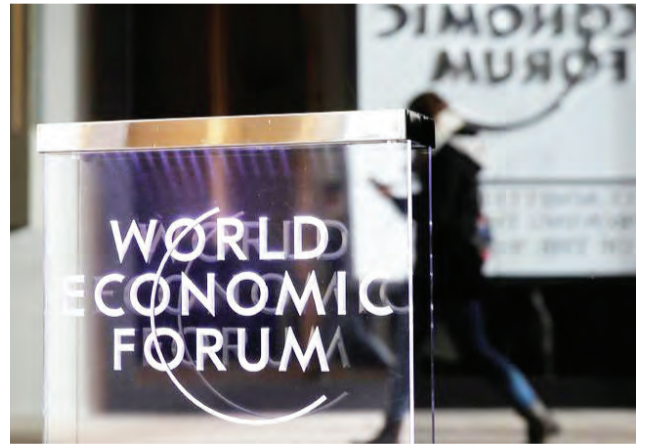
A woman passes by the World Economic Forum logo in Davos, Switzerland, Jan 20, 2019. File photo

"Public-private cooperation has moved forward throughout the pandemic and that will continue apace. We look forward to bringing global leaders together in person soon," Schwab added.