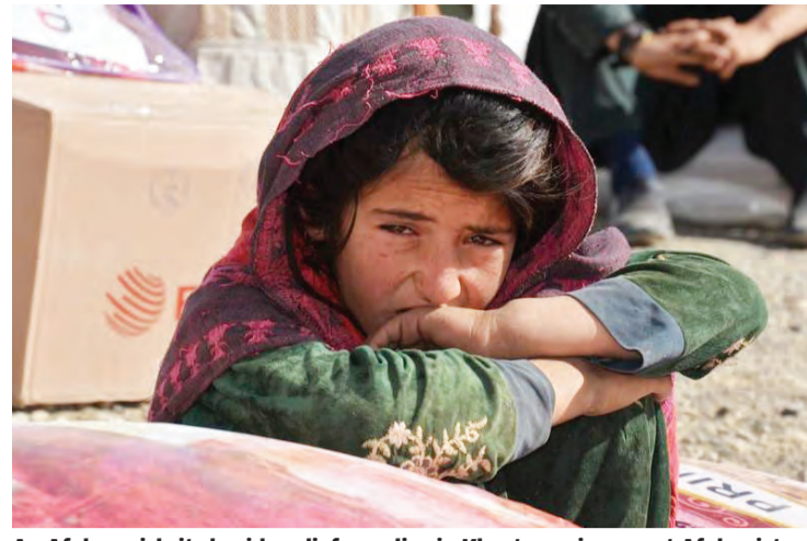
An Afghan girl sits beside relief supplies in Khost province, east Afghanistan, Nov 9, 2021.

"Afghanistan is facing an avalanche of hunger and destitution the likes of which I have never seen in my twenty plus years