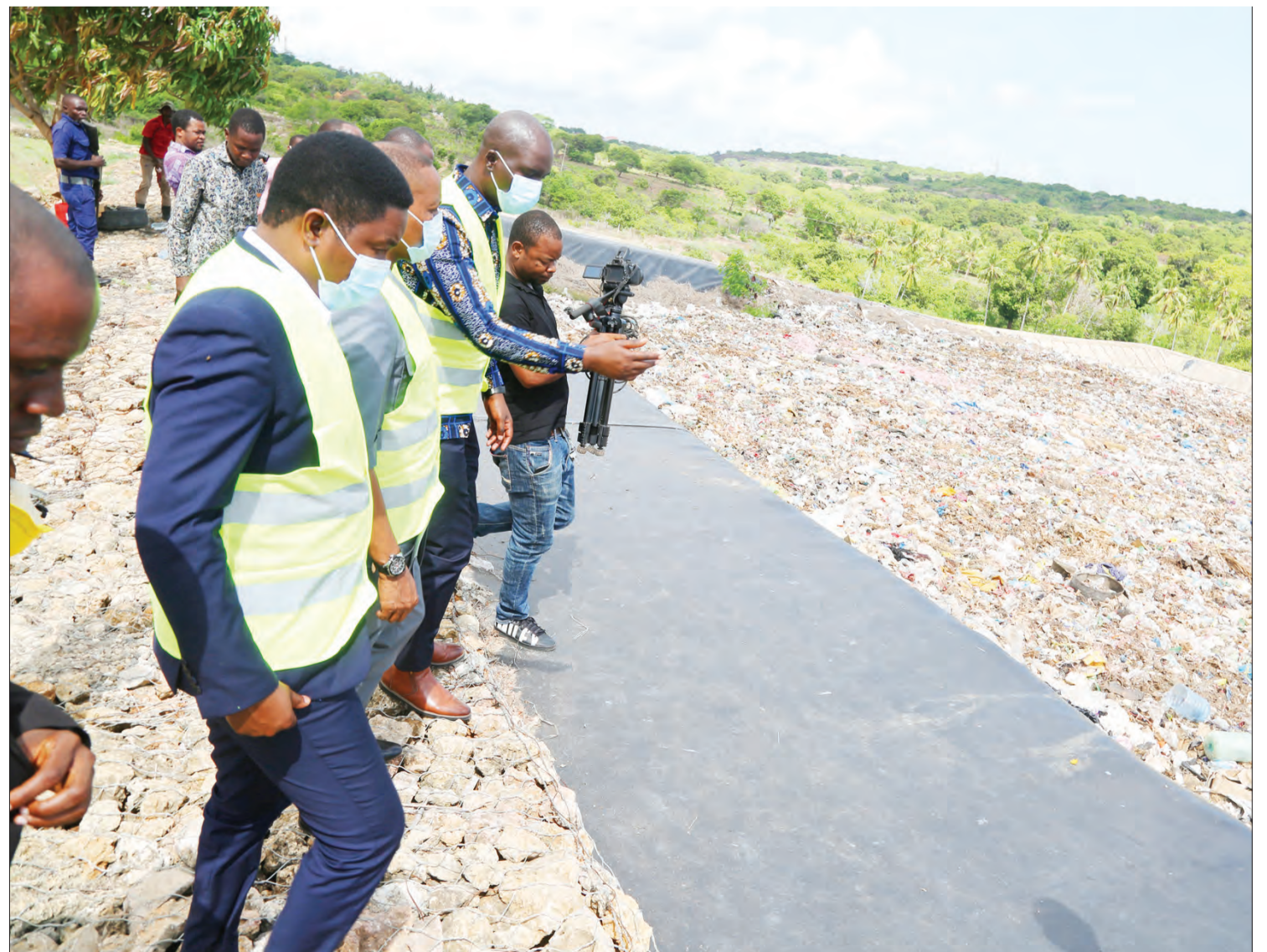
Minister of State in the Vice President's Office (Union and Environment Selemani Jafu (L) looks at a landfill during his official visit in Mtwara Mikindani recently.