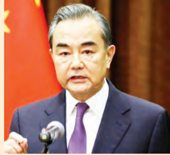
Wang Yi, Chinese State Councilor and Foreign Minister, speaking at a symposium.

"Facing multiple risks to global development, we have injected new impetus into economic recovery and created new opportunities for common devel-