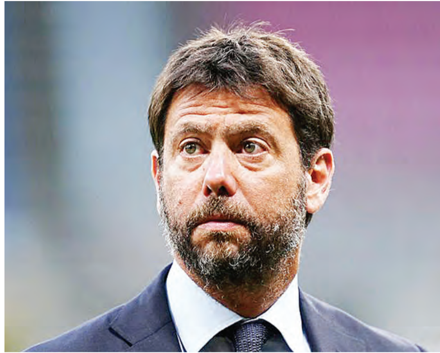
Juventus Football Club's Chairman, Andrea Agnelli.

That €115m is spread over the five year contract they gave him, so on the books, it's cost-