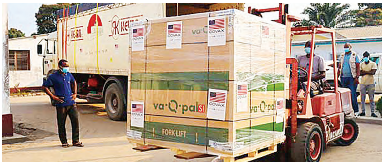
The Republic of Congo received just over 300,000 doses of the COVID vaccines through the COVAX Facility in August 2021.

However, with the pandemic, tourism has come to a standstill, and the continent recorded a 2.1 per cent decline in economic growth in 2020. Other accompanying challenges have included general exchange rates depreciations, food