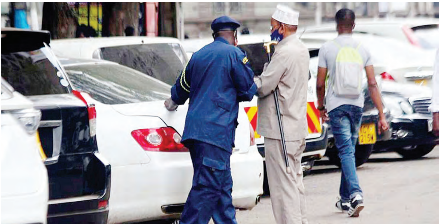
Nairobi Metropolitan Services (NMS) parking control officer talks to a motorist along Banda Street on November 25, 2020.

For buses, which are not matatus, the charge will be Sh1,000 per day, same as for lorries weighing between three and 10 tonnes while trailers will be levied Sh3,000. For on-street parking in residential areas not included in the city centre and other areas, buses and lorries will pay Sh500 while trailers will still pay Sh3,000. Loss of tickets will attract a charge of Sh1,000 per ticket whether off-street or seasonal.