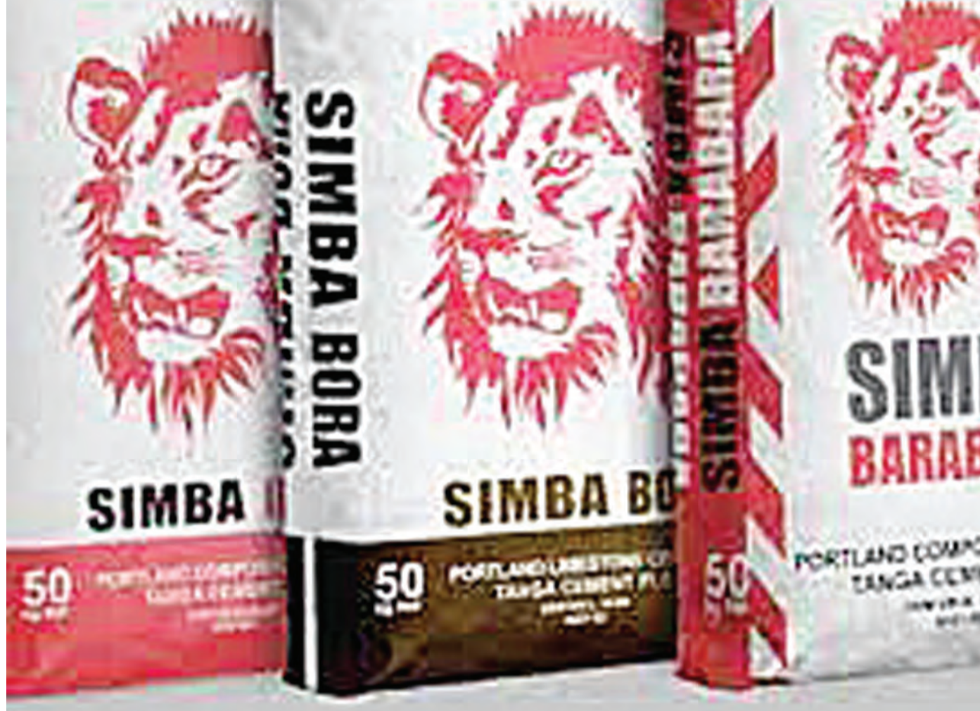
Tanga Cement products selling at a shop in Tanga city.

Afrisam that currently holds 68.3 percent stake in Tanga Cement received an offer to buy its stake for an indicative price of 3,157/- per share from Scancern. In a statement released by the company, it said if the acquisition becomes unconditional and is implemented, Scancern will acquire control of the company. Scancern will, after the final acquisition price is determined, make a general offer to acquire