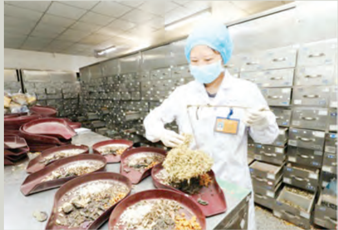
A pharmacist of traditional Chinese medicine (TCM) dispenses a prescription for epidemic prevention medicine at a TCM hospital in Huai'an city, east China's Jiangsu province, August 19, 2021. File photo