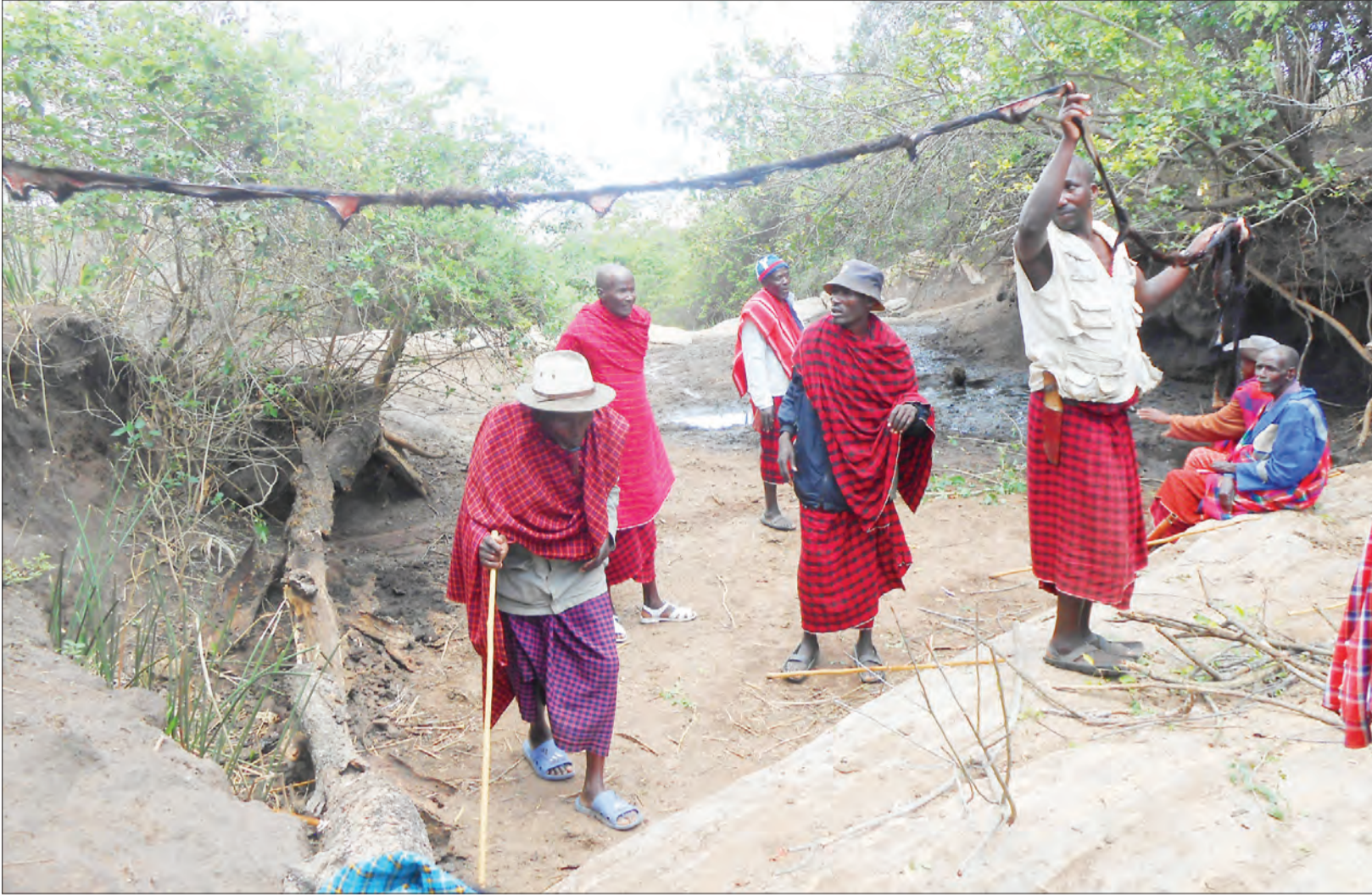
Maasai herders of Mlembule village in Kilindi district, Tanga region across Lwambalazi River for ritual rain prayers.