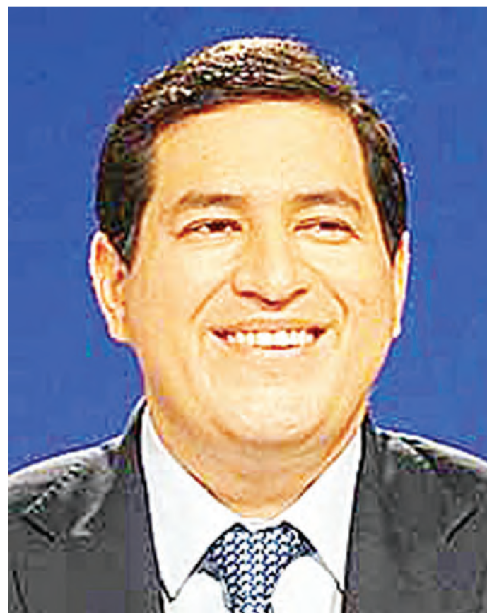
By Andrés Arauz