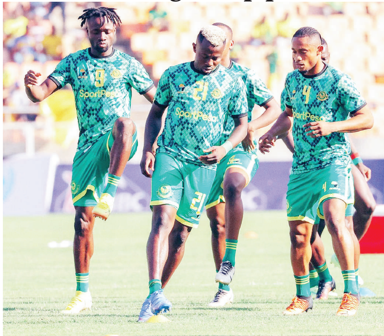
Yanga's players warm up a few minutes before confronting Simba SC in a 2022/23 NBC Premier League match which took place at Benjamin Mkapa Stadium in Dar es Salaam last Sunday and ended in a 1-1 draw.