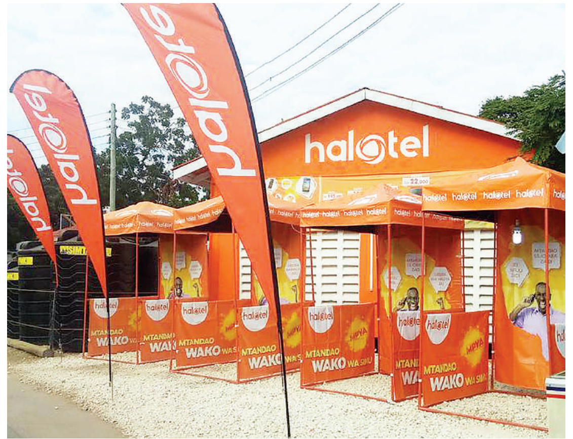
Halotel plans to increase the number of its subscribers from the current seven million to 10 million by 2023.

The company this month also acquired new 2600MHz (FDD) broadband, following an auction by TCRA at a cost of $30.169million.