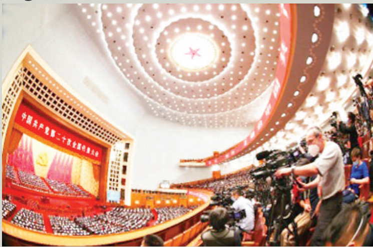
The 20th National Congress of the Communist Party of China opens at the Great Hall of the People in Beijing on Oct. 16, 2022. File photo

said that the CPC, with a responsible attitude, has led the country to achieve sustainable development, which demonstrates its political vision and wisdom. They believe socialism with Chinese characteristics and the Chinese governance system are a role model in seeking happiness for the people. Facts prove that, the cause of the CPC benefits not only the Chinese people, but also the world at large.