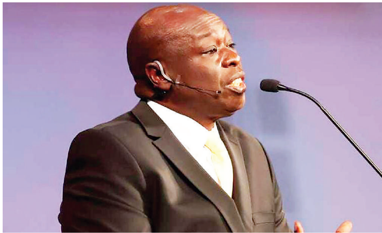
Kenyan Deputy President Rigathi Gachagua

"I have carefully considered the evidence on record including affidavits, annexures and submissions by all parties and I am satisfied that the funds are liable for forfeiture to the government,"