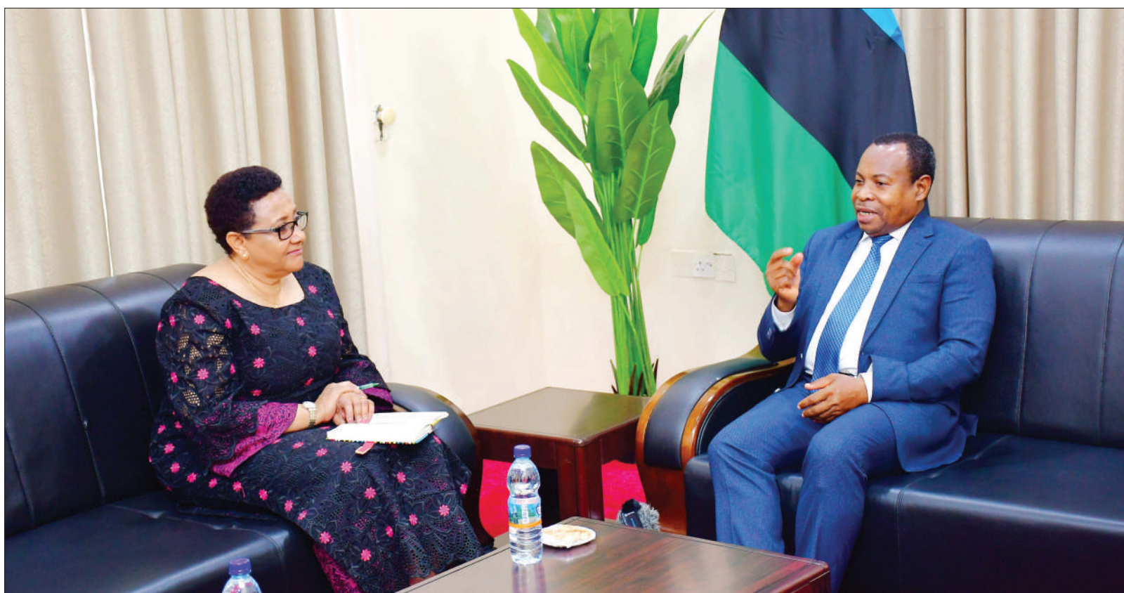
Zanzibar's First Vice President, Othman Masoud Othman (R), has an audience with Foreign Affairs and East African Cooperation minister Stergomena Tax in Zanzibar yesterday. She went to introduce herself following her recent appointment.