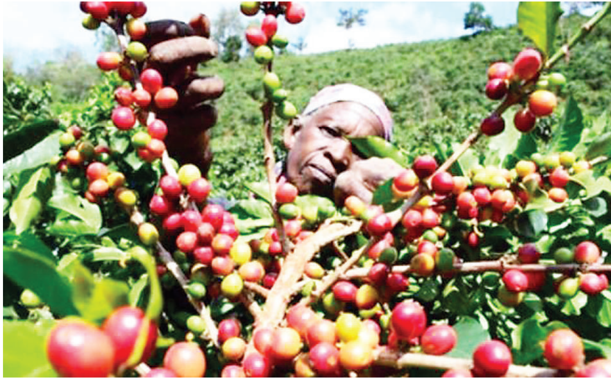
Farmer harvests coffee beans

He said Kaderes does not work with a fixed number of smallholder farmers, but a constantly growing and expanding network, explaining that its mission is to empower members and communities to contribute to sustainable land use and environmental conservation by focusing on the scaling of their agro-forestry project.