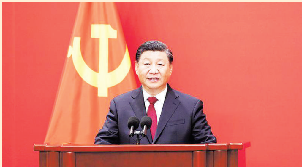
Xi Jinping, general secretary of the Central Committee of the Communist Party of China, delivers an important speech when meeting with the media on Sunday at the Great Hall of the People in Beijing with the other six newly elected members of the Standing Committee of the Political Bureau of the 20th CPC Central Committee.

He told China Daily that the economy will be crucial going