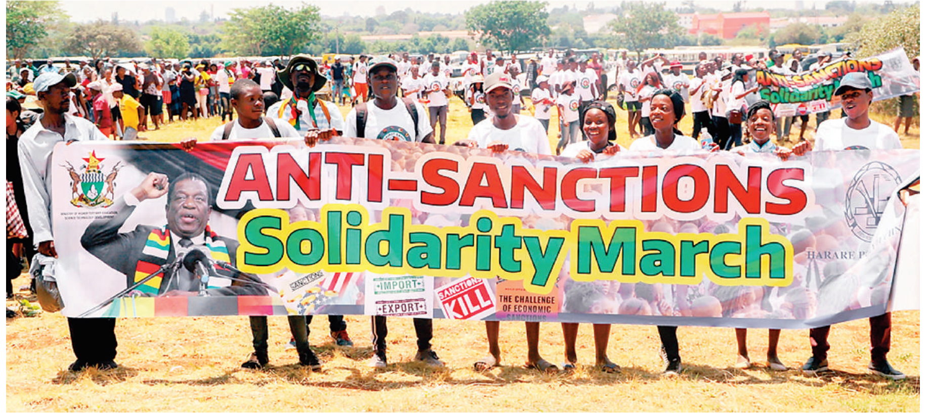
Zimbabweans participate in an anti-sanctions protest in Harare on 25 October 2019. The Zimbabwean government organised countrywide anti-sanctions marches to protest against economic sanctions imposed by the EU and the US.

The targeted sanctions are more or less symbolic; a blunt instrument to enforce behaviour change. For most individuals on the US sanctions list, the prospect of travelling to the US has always been remote, so banning them is of little import. However, sanctions can be a deterrent