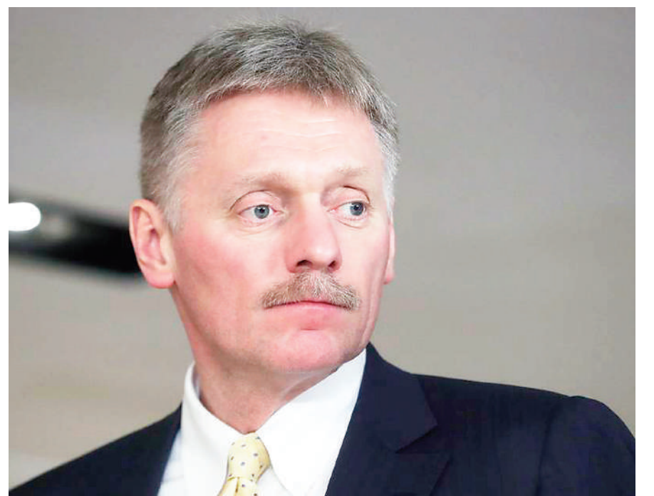
Russian Presidential Spokesman Dmitry Peskov