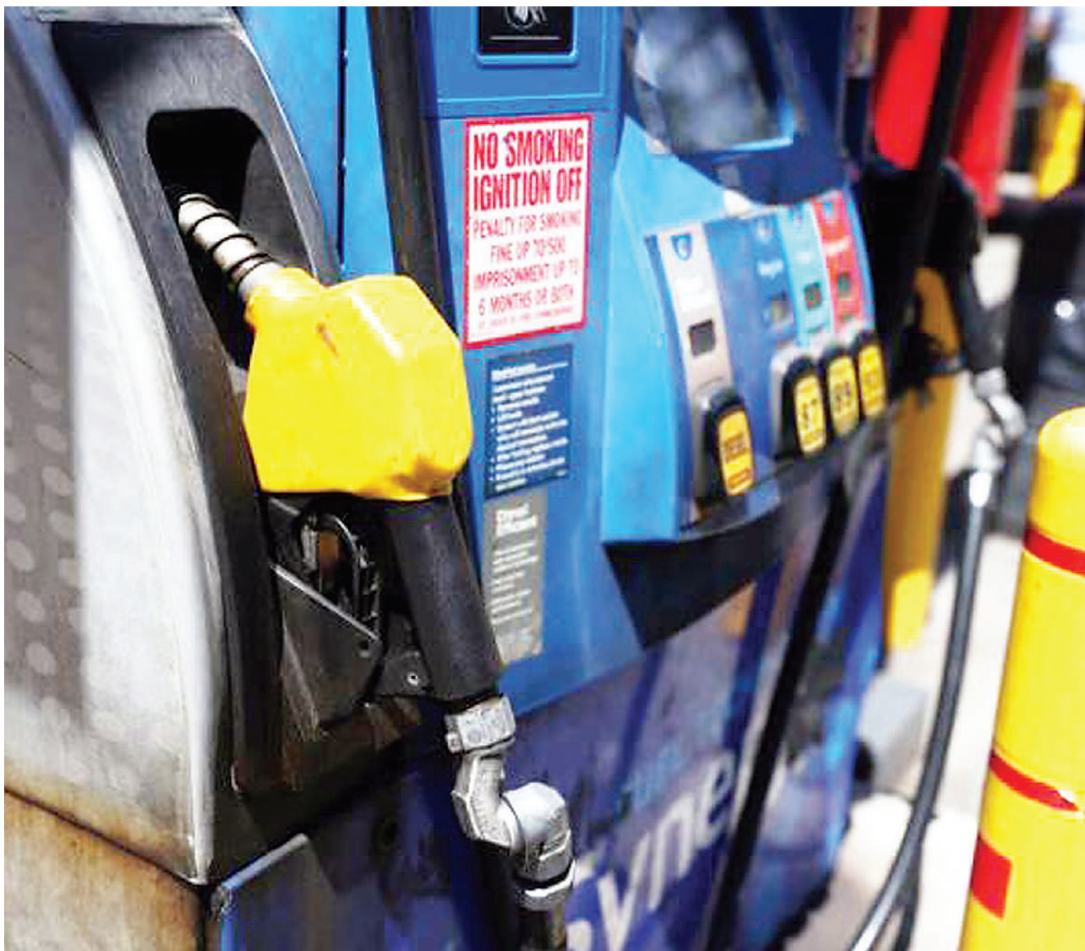
A pump is seen at a gas station in Manhattan, New York City

During the closing day of last week, a total of 15.9bn/- recorded from ten deals for 10, 20 and 25 maturities bonds. Ten years maturity bond had two deals amounting 11bn/-.