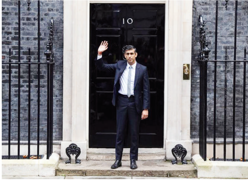
Britain's newly appointed Prime Minister Rishi Sunak waves as he poses outside to door to 10 Downing Street in central London, yesterday after delivering his first speech as prime minister.

In her farewell speech, Truss defended her "growth plan," adding, "I'm more convinced than ever that we need to be bold and confront the challenges we