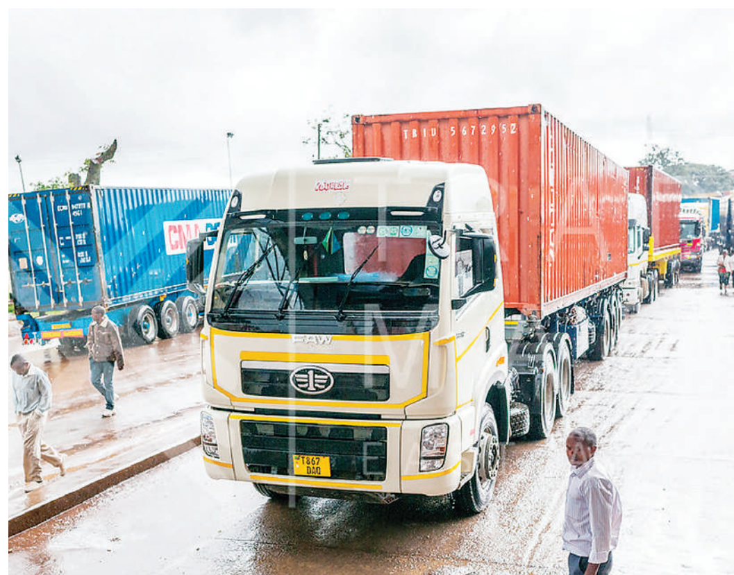
Trucks at the Tunduma border post.