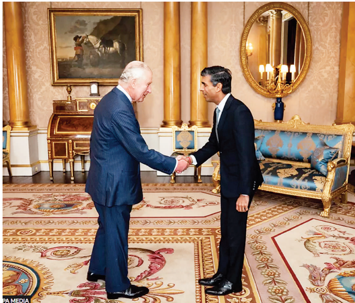
After being invited to form a government by King Charles, Sunak became the UK's 57th prime minister

"The big challenge for Sunak is that he has to manage a series of complicated problems against a very