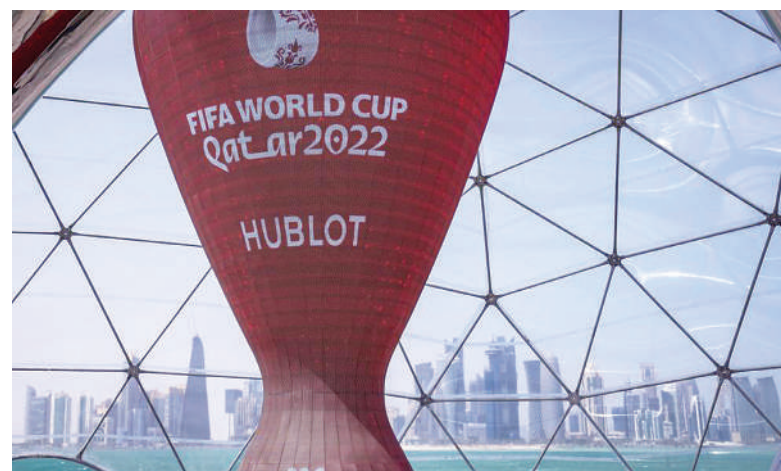
FILE – A count down clock is displayed at the seafloor in Doha, Qatar, Tuesday, March 29, 2022. Qatar's residents squeezed as World Cup rental demand soars.

Some 1.2 million fans are expected to descend next month on the Gulf Arab