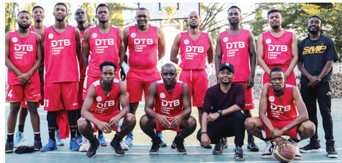
Dar es Salaam's DTB basketball side pictured after playing Vijana Basketball Club in the ongoing Regional Basketball Association (RBA) League's tie, which took place last weekend.

"The DTB squad, honestly, deserved to come out victorious in this tie, given the side's players showcased