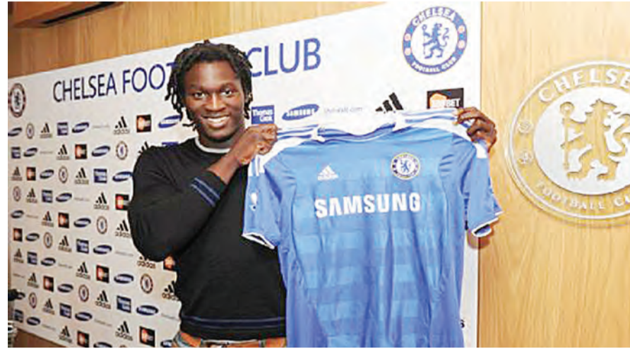
Romelu Lukaku first signed for Chelsea in 2011.

Neymar has managed to generate almost £280m in career-transfer fees despite only ever moving twice. The first was a massive move to Barcelona, and the second was a world-record-obliterating switch between two of the biggest clubs in existence. You wouldn't bet against him regaining the No. 1 position eventually.