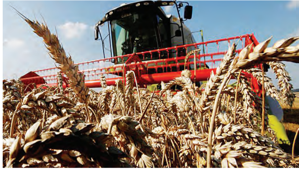
A French farmer harvests his wheat crop in Bugnicourt, northern France. Global wheat reserves could fall to a five-year low after crop losses in Russia and Canada.

culated by the London-based International Grains Council is now up 46 per cent on the year. Separately, the UN index of global farm-commodity prices is flirting with a decade high.