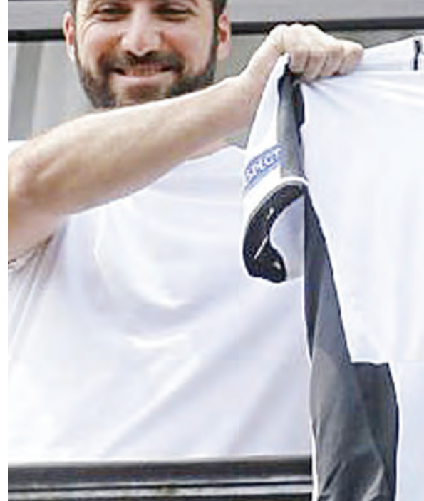
Gonzalo Higuain's biggest move was from Napoli to Juventus.

goals in 32 appearances during his single faltering season at Old Trafford before fleeing to PSG at the soonest available juncture.