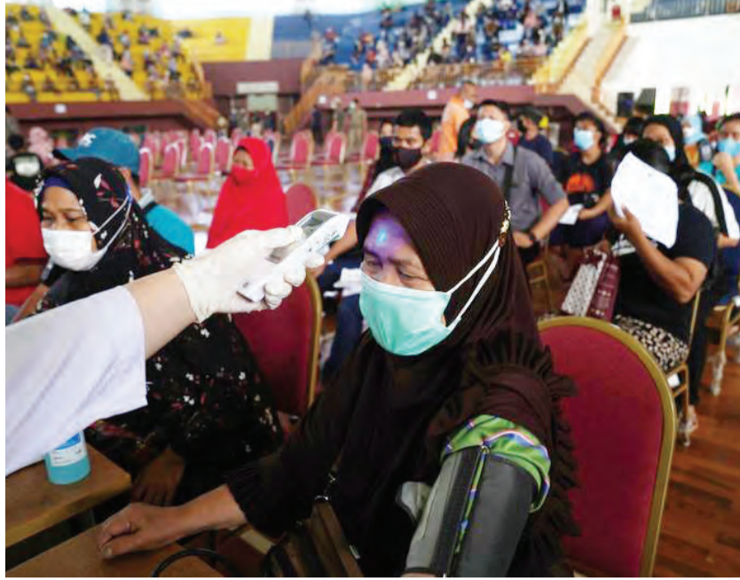
A member of the public gets her temperature checked at a vaccination center in Jakarta, on Aug 4, 2021.

of herd immunity the hard way. UK Prime Minister Boris Johnson originally planned to use it as a primary approach to COVID-19, suggesting some of his constituents could "take it on the chin" with natural infections before the magnitude of the damage became apparent.