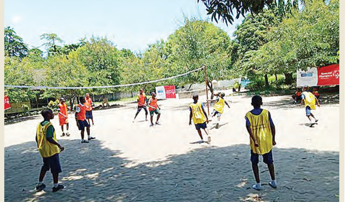
Children with special needs play volleyball in Dar es Salaam recently.

He noted: "The COVID-19 is here and its devastating effects on social and economic sectors are seen all over the world,