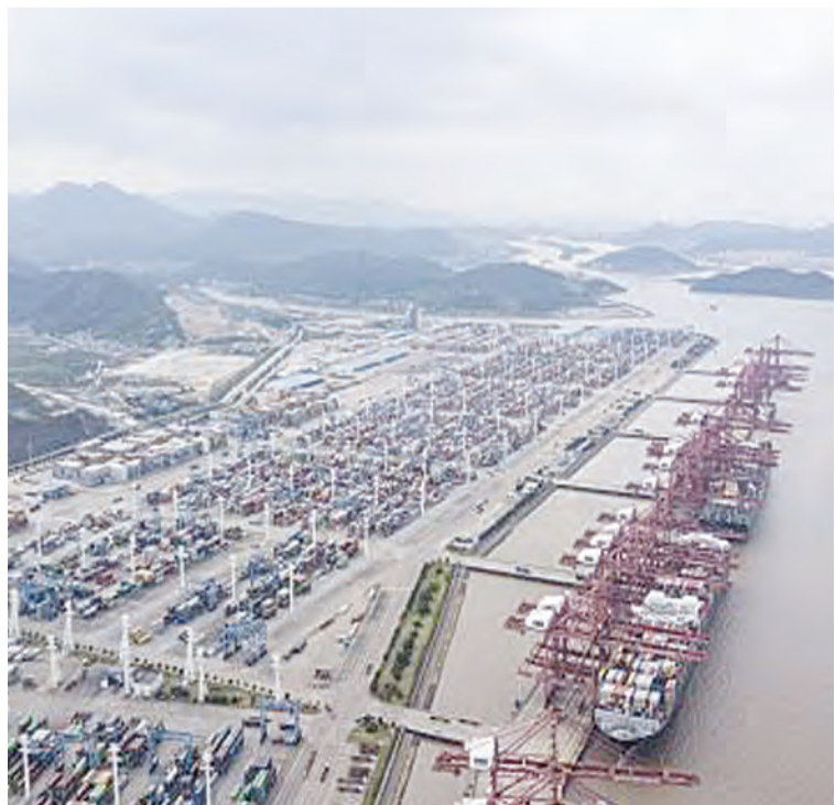
A bird's eye view of Ningbo-Zhoushan port in China.

The port was the third-busiest globally in terms of container shipments in 2020 and the second busiest in China after Shanghai, according to maritime publication Lloyd's List. The discovery of a port worker that tested positive for Covid-19 shows that virus-prevention measures in Ningbo City still have loopholes, the local government said in a statement on its website Thursday, which urged officials to implement quarantines, disinfection and closure of affected areas to prevent the virus' spread.