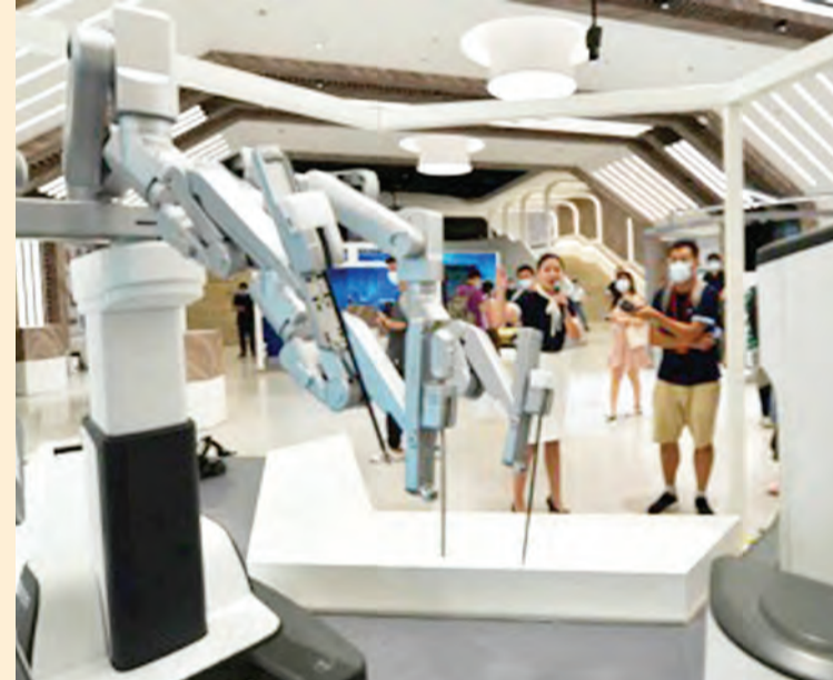
Photo shows Zhangjiang AI Robot Valley Future Experience Hall in Zhangjiang township, Pudong New Area, east China's Shanghai.

In the first quarter of the next year, Swiss tech giant ABB's $150-million gigafactory is expected to be comprehensively put into operation in