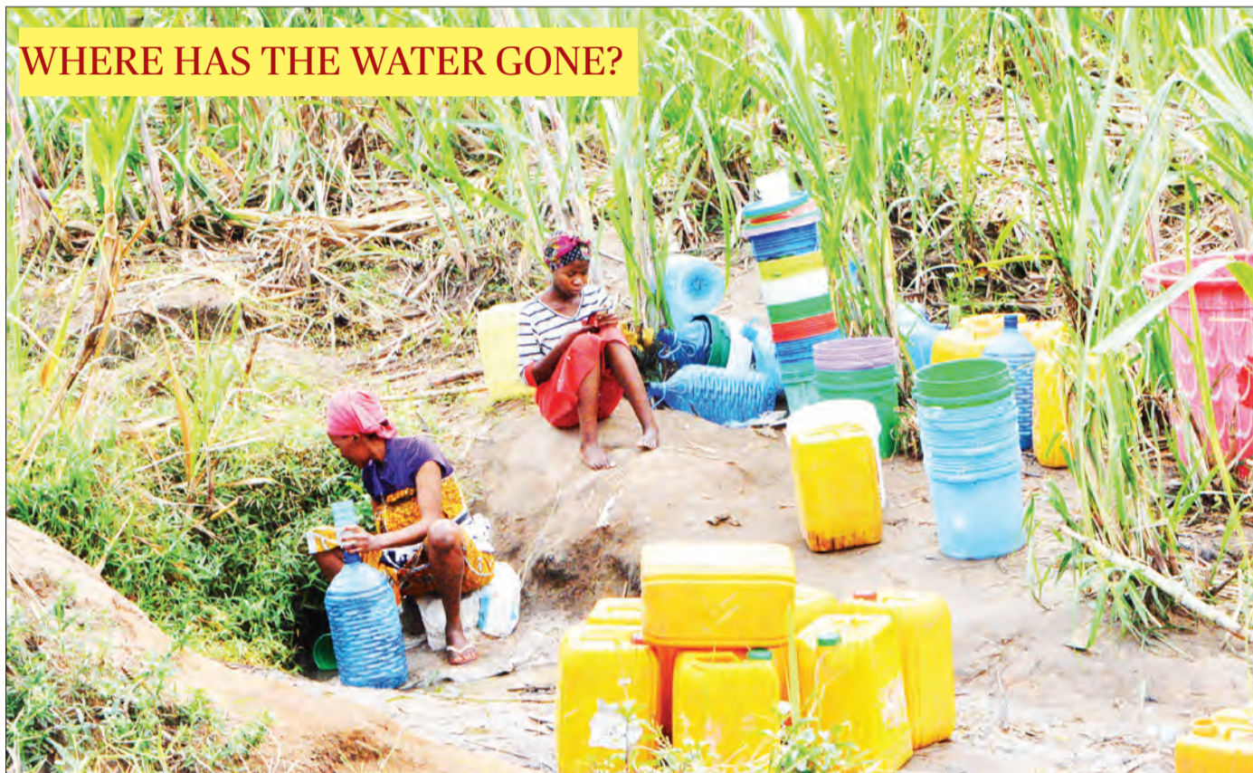
WHERE HAS THE WATER GONE?