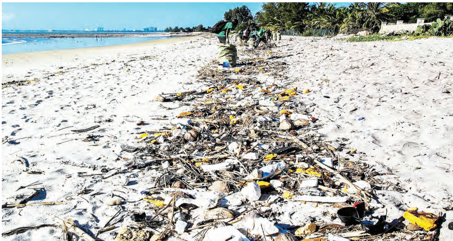
Mbezi Beach. this is what it looks like.....the effects of environmental degradation shows the reality, which is becoming worse. FILE PHOTO

.....well time to go, and I've decided to keep my visitors away from beaches and cities....and head for the mountains....Oh dear.....they haven't built the cable cars yet .....have they?!