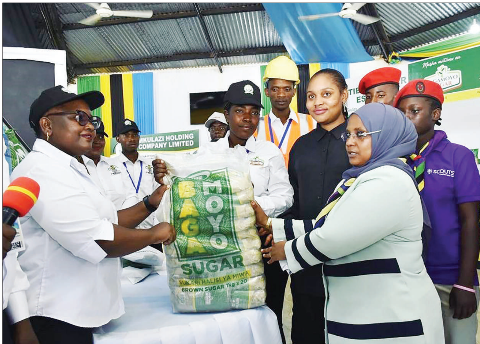
Industry and Trade minister Dr Ashatu Kijaji (R, foreground) pictured yesterday having a feel of sugar produced by Bagamoyo-based Mukulazi Holding Company Limited factory. She was at the just-climaxed Nanenane (Farmers' Day) Exhibition for the Eastern Zone - held in Morogoro municipality.

He said the goal of the ministry is to see the livestock and fishing sectors increase production and raise the output of individuals and the nation as a whole.