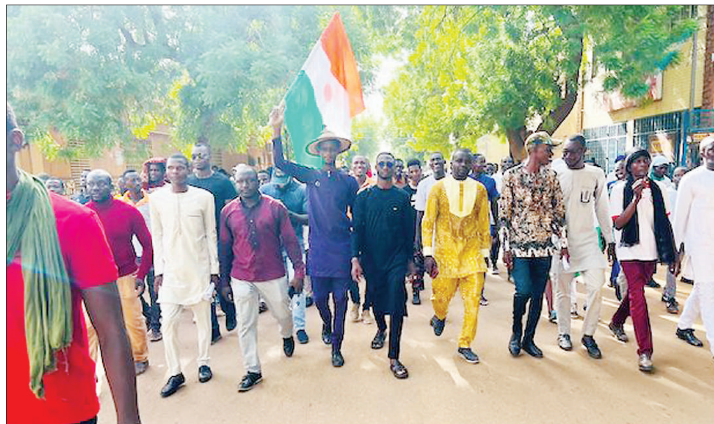
Université Abdou Moumouni de Niamey students stage a protest in support of Russia and the coup plotters.