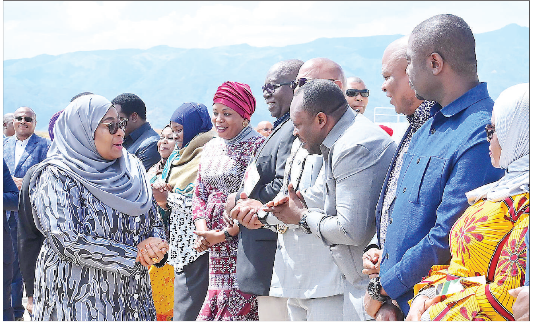
President Samia Suluhu Hassan exchanges greetings with government officials in Mbeya city moments after jetting into Songwe Airport on Monday for the climax national Nanene celebrations.

For, government has set aside 160,000 acres for over 40,000 young people. The lands are in Dodoma, Mbeya, Kigoma and Kagera Regions while other fertile areas are being searched for the same purpose.