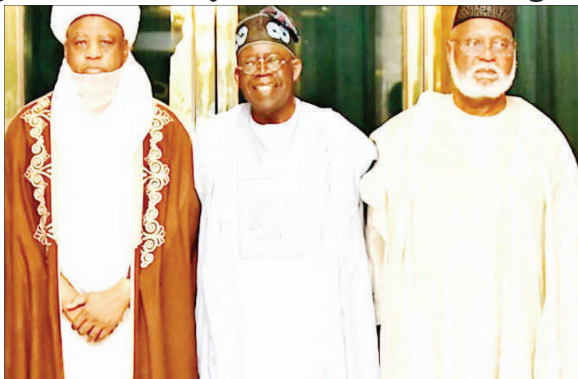
President Bola Tinubu (C) with former Nigerian Head of State General Abdulsalami Abubakar (R) and the Sultan of Sokoto, Sa'ad Abubakar, who the president appointed to negotiate with the military junta in Niger.

Can our economy carry the inevitable cost of an intervention in Niger? Or will it be financed through debt? Have we defeated Boko Haram and sundry other terrorists at home first? Given that Niger shares borders with Nigeria across seven states, the reality of potentially destabilising mass refugee movements into our country, not to talk of a possible "invasion" of Nigeria by terrorists from the Sahel region under the pretext of being refugees, are not distant possibilities in a scenario