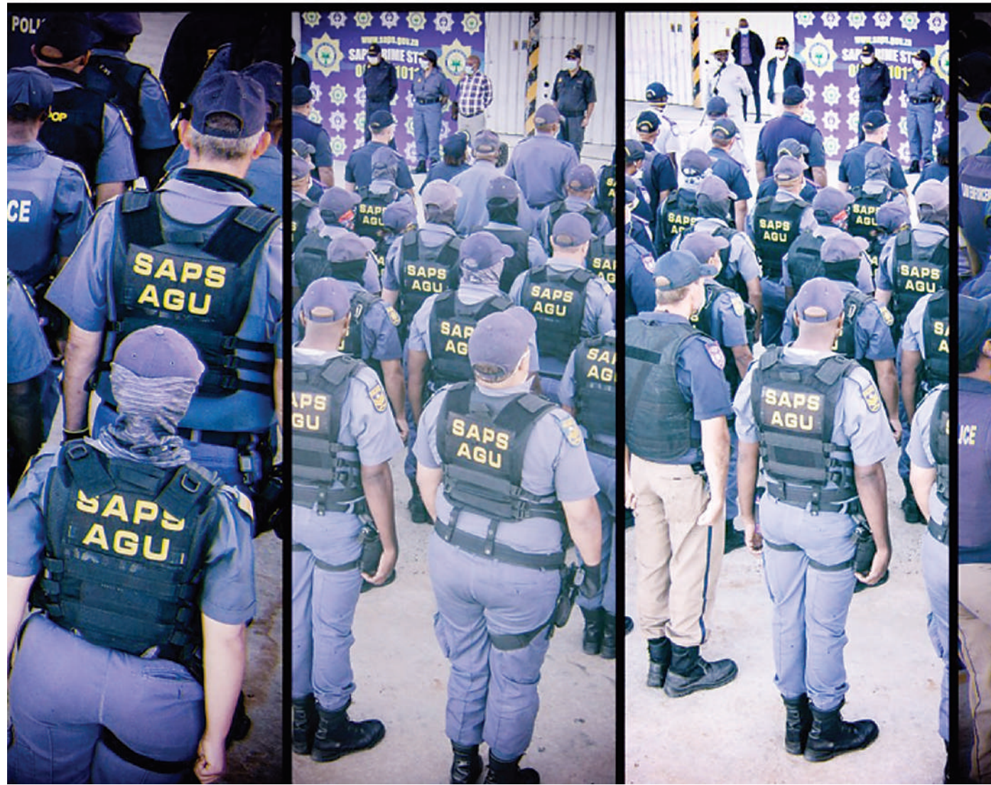
The Independent Police Investigative Directorate investigates specified categories of crime committed by members of the South African Police Service and municipal police.

Through legal action, McBride successfully contested the attempt to remove him. This resulted in Ipid Act provisions regarding removing the Ipid head being ruled unconstitutional in 2016. The 2019 Ipid Act amendment was passed to address the defects highlighted by the Constitutional Court in this judgment.