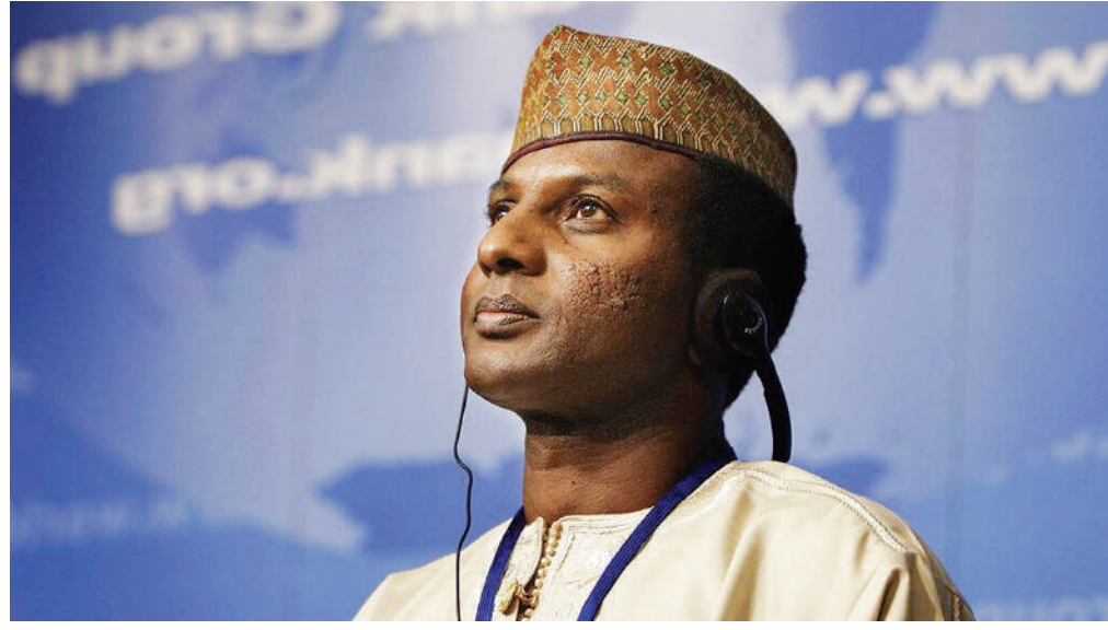
In this file photo dated Oct 12, 2008, Ali Mahaman Lamine Zeine, then minister of Economy and Finance of Niger, briefs reporters on efforts to assist developing countries with high levels of poverty and debt, at IMF headquarters in Washington.

Niger's uranium and oil reserves and its pivotal role in a war with Islamist militants in the Sahel region give it economic and strategic importance for the