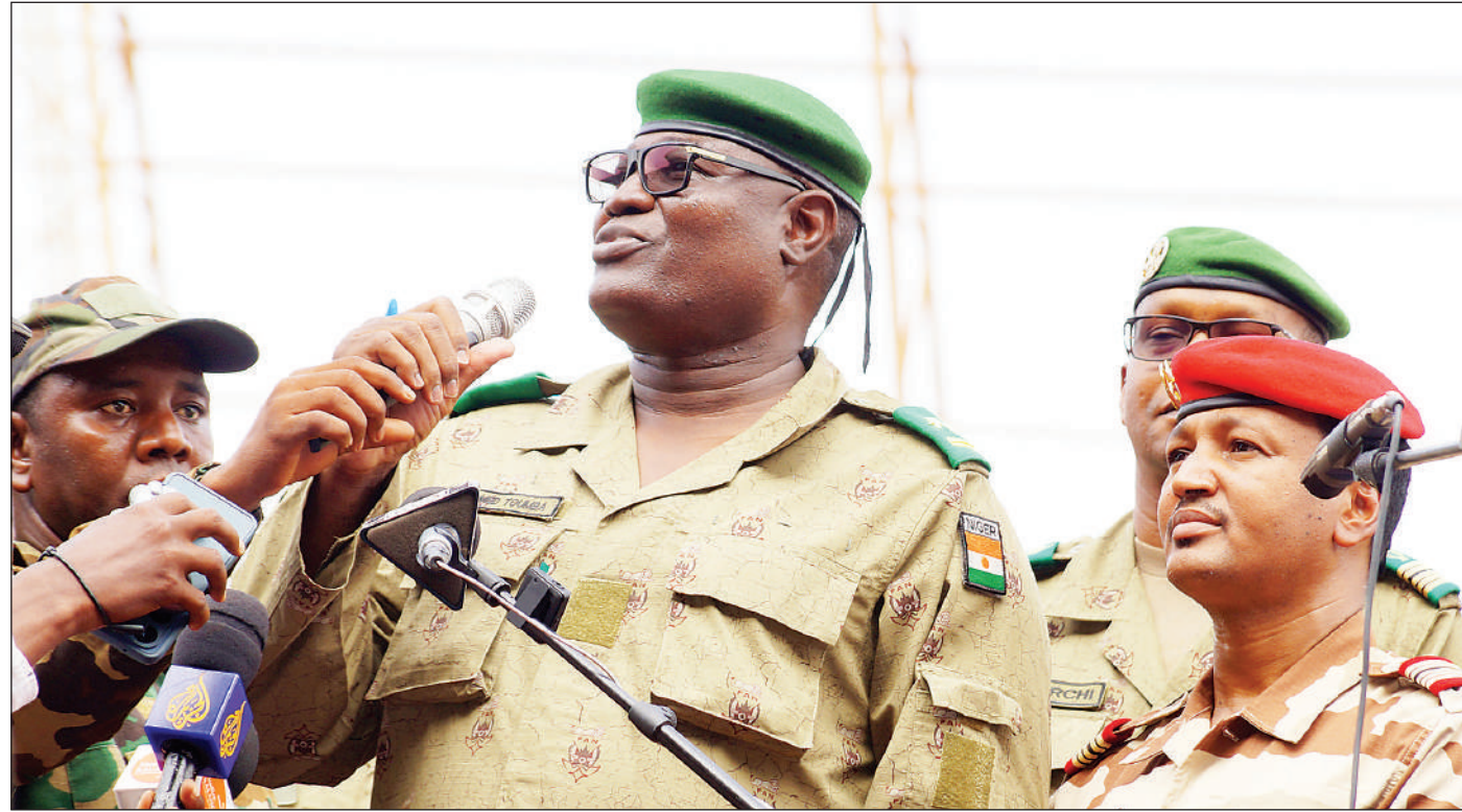
Niger's new military leader, General Abdourahamane Tchiani, has ignored one week ultimatum by west African states to reinstate civilian rule.

"The coup stands as evidence that democracy is facing challenges in Africa, and it reflects the inability of ECOWAS to ensure that leaders in the West African sub-region meet the expectations of their people," he adds.