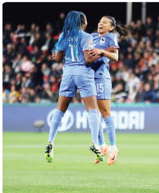
France players celebrate during their match against Morocco.

Karchaoui, whose parents are Moroccan, set up the opener with a great run down the left flank, a quick exchange of passes with Selma Bacha, and a cross for Diani to nod in.