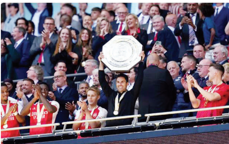
Mikel Arteta lifted the Community Shield

Meanwhile, Kai Havertz was bought to operate in midfield and instead deputised for the injured Ga-