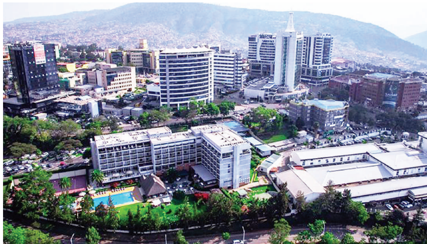
Aerial view of Kigali city

So far, he said, only one payout was made, in September 2019, to members of Caisse des Affaires Financières