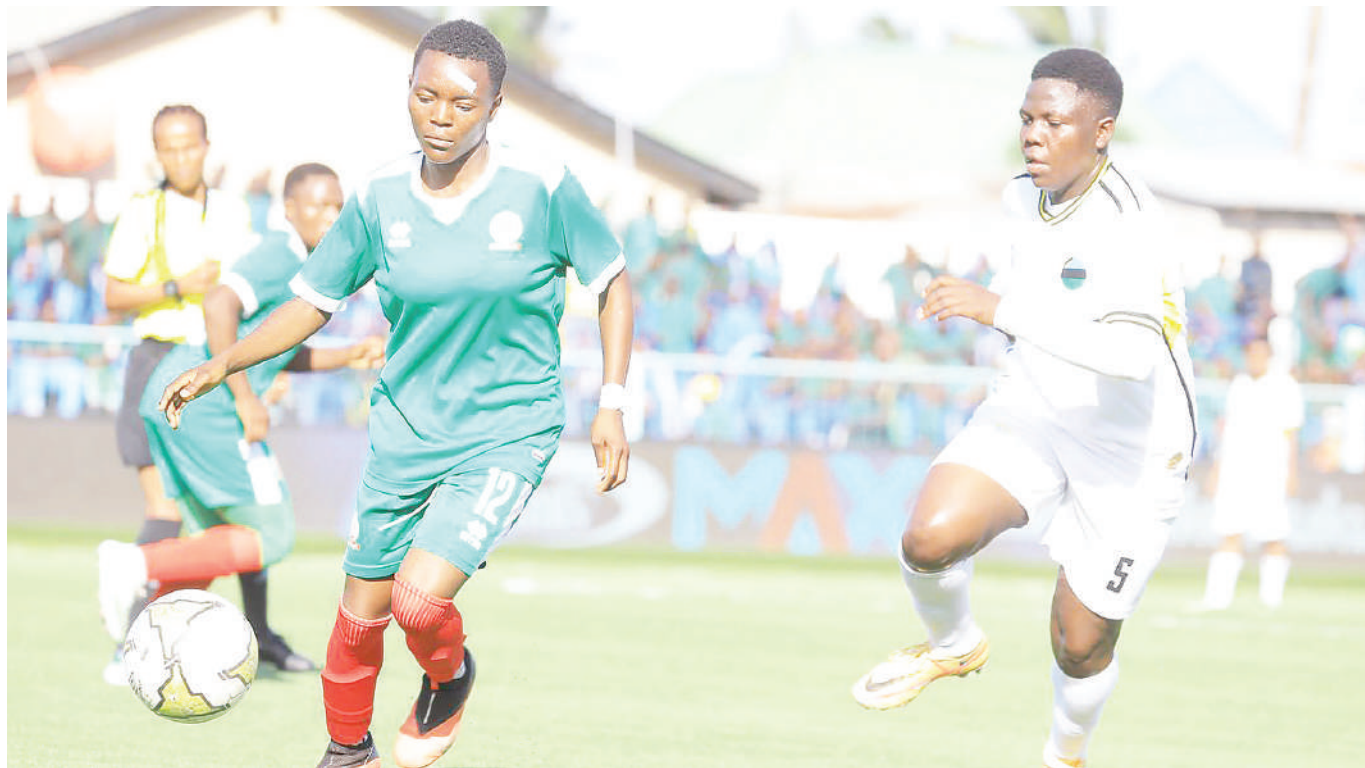
Zanzibar U-18 women's squad defender (R) challenges Burundi U-18 women's team attacker when they took on each other in the 2023 CECAFA U-18 Women's Championship duel at Azam Complex Stadium in Dar es Salaam last week, with Burundi U-18 women's team cruising to 4-0 victory.