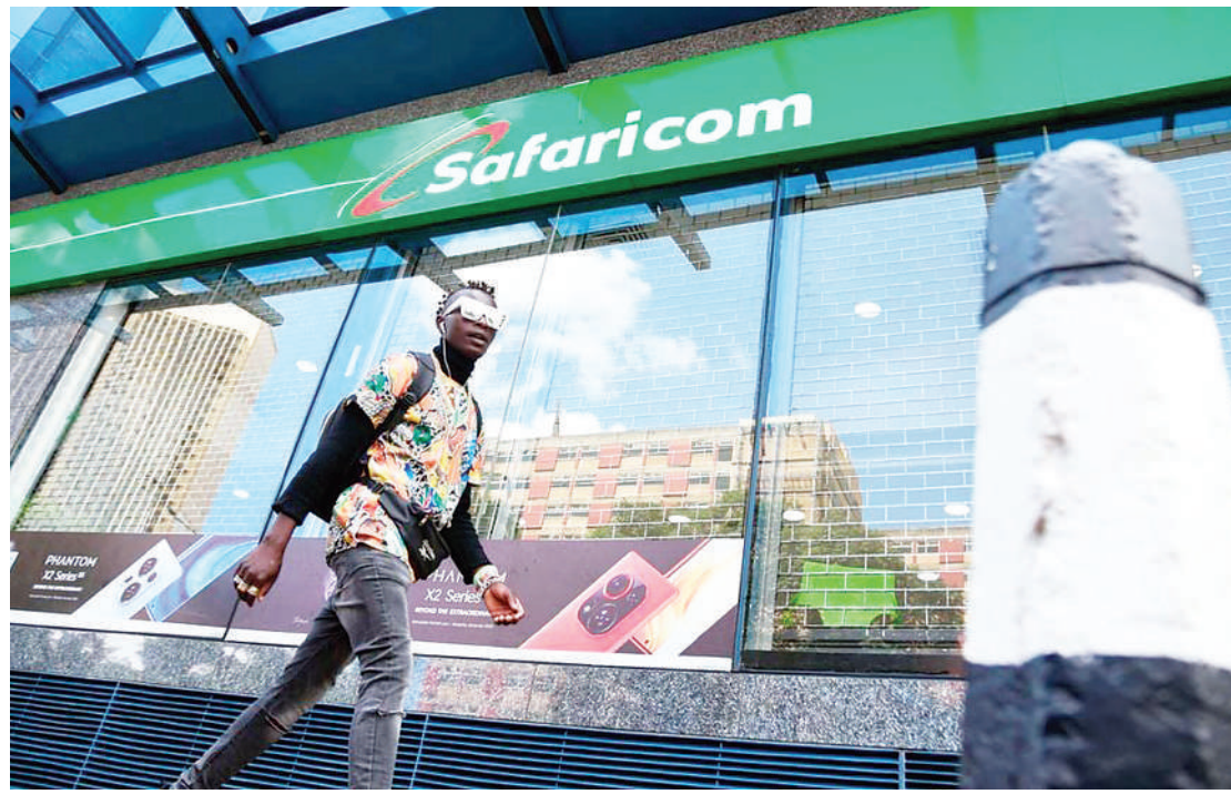
A Pedestrian walking past a Safaricom Shop along Kenyatta Avenue in Nairobi

This is despite the company's fundamental remain-