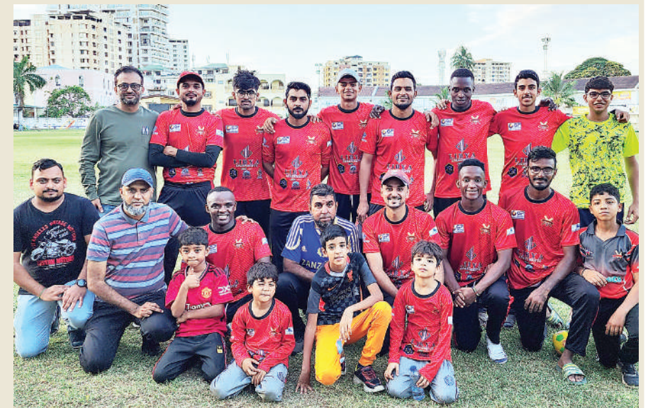
Players making Lions Cricket Club pose for a photo shortly after defeating ALAF Aces A in this season's Dar es Salaam Cricket (DC) Saturday T20 Division A-League tie which took place last weekend.