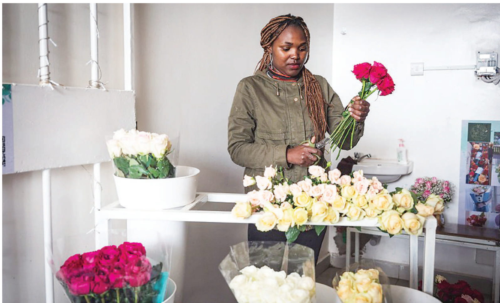
A vendor trims flowers at a flower shop in Nairobi. Kenya is one of the world's leading exporters of cut flowers

the Africa Heads of State Human Capital Summit (HCS), whereby a number of issues on investment in human resources were discussed.