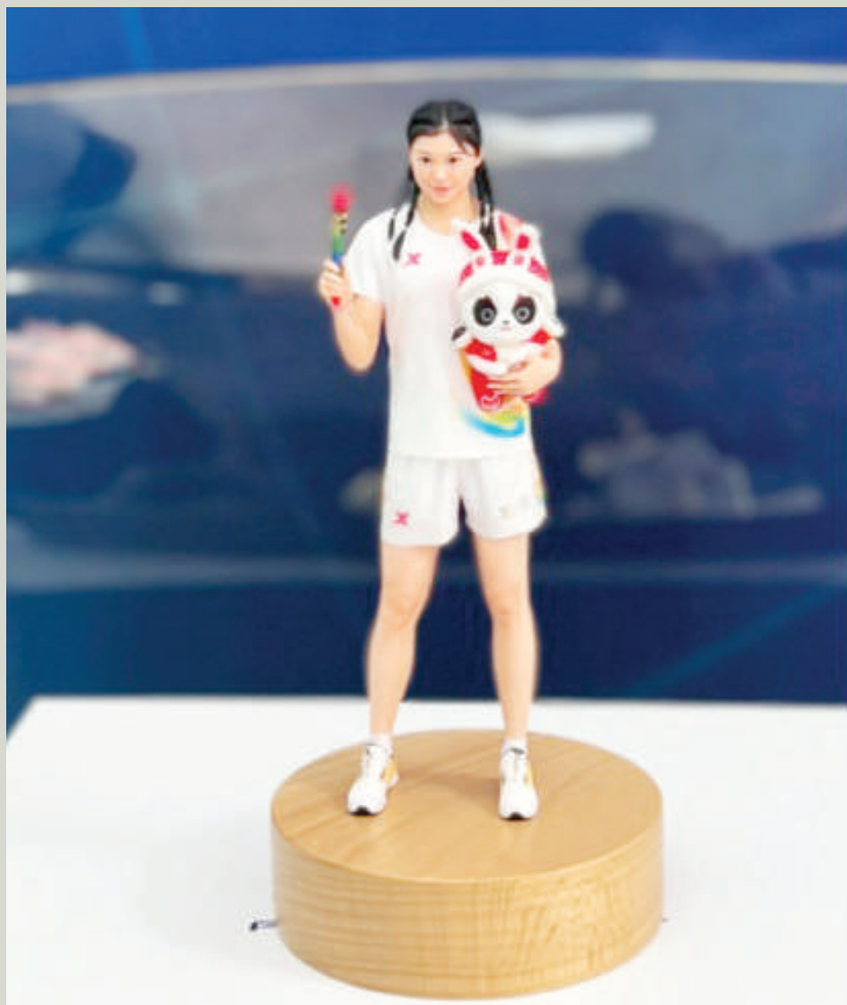
Photo shows a 3D-printed figurine of Chinese hurdling star Wu Yanni.

According to Gu Li, who works at the studio, such figurines normally can be printed in heights of 9 cm,