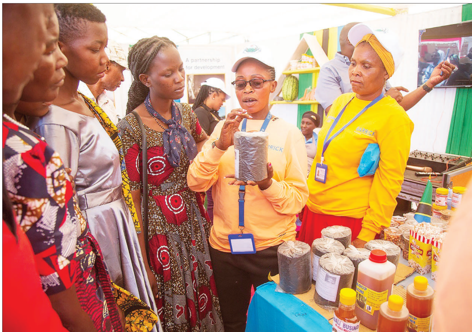
Members of a group of entrepreneurs sponsored by Barrick Bulyanhulu Gold Mine who took part in the Lake Victoria Zone 'chapter' of the just-climaxed Nanenane (Farmers' Day) Exhibition held in Bariadi District, Simiyu Region, pictured yesterday at the Barrick Bulyanhulu pavilion briefing visitors on their products.

"I am pleased the ASEAN family fun games is held for the second year in Tanzania, allowing us here to mark the ASEAN Day together in a fun yet meaningful means through friendly sport matches and traditional culinary exchange"