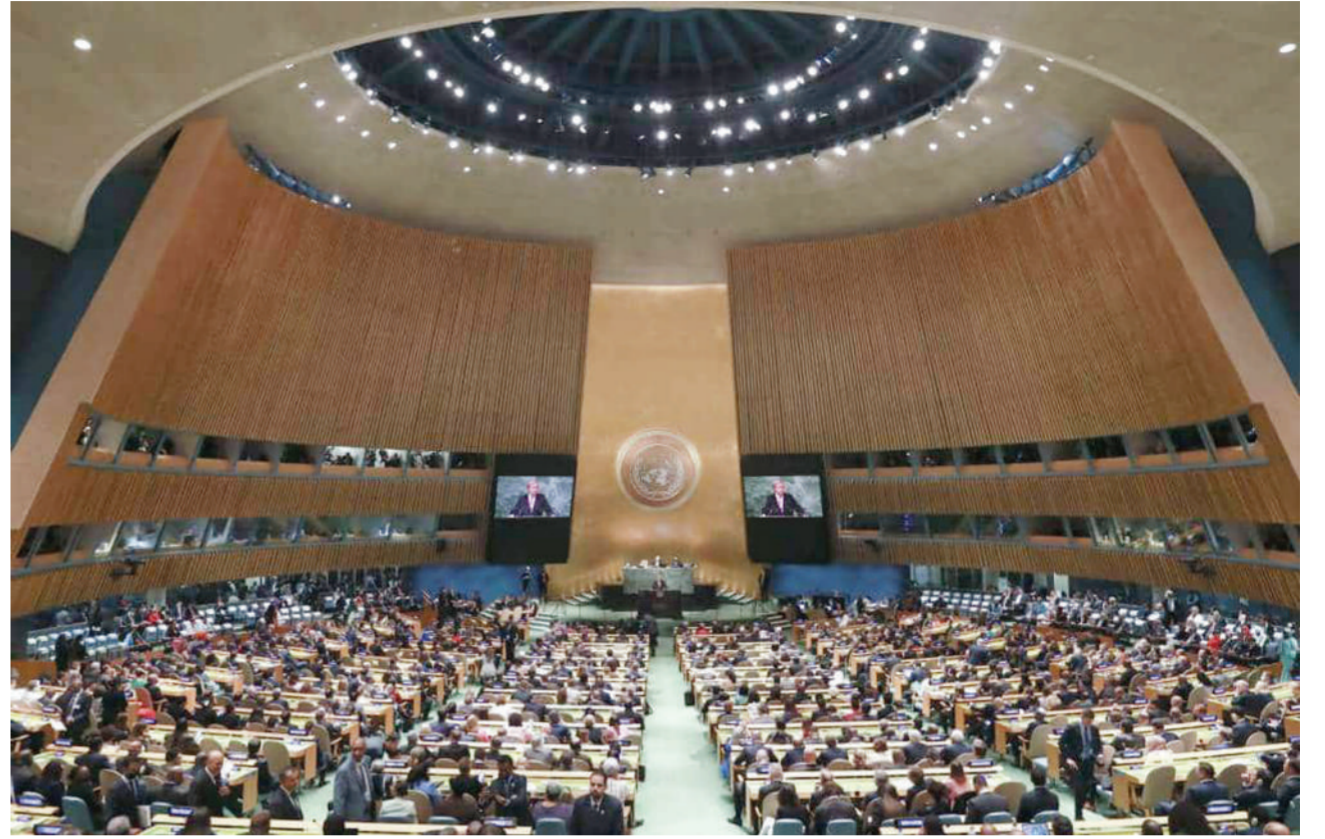
Photo taken on Sept. 20, 2022 shows the opening of the General Debate of the 77th session of the UN General Assembly at the UN headquarters in New York. The General Debate of the 77th session of the UN General Assembly opened on Tuesday with the theme of "A watershed moment: transformative solutions to interlocking challenges."

The international community must vigorously endeavor to share responsibility and join forces, whenever neces-