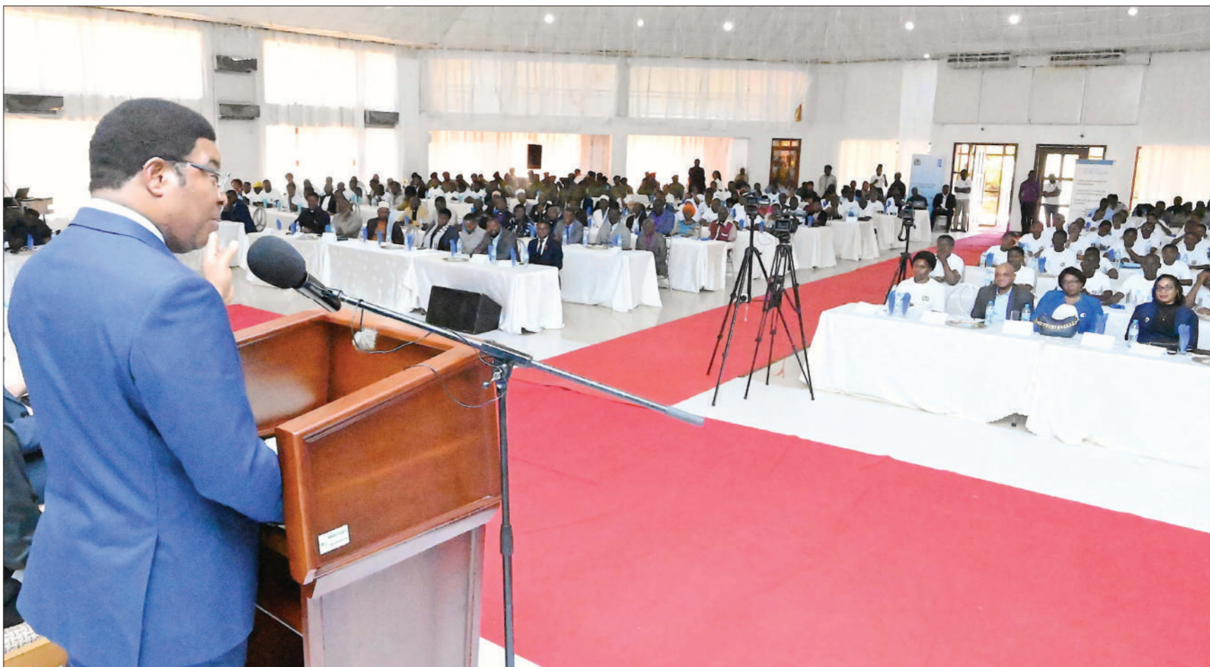
Prime Minister Kassim Majaliwa speaks at the climax of the commemoration of International Day of Peace (Sept 21) held at national level in Moshi District, Kilimanjaro Region, yesterday.

People need to look at the breakdown of a transaction after sending money, as government levy was little compared to what services providers such as banks and telecom companies obtain, he added.