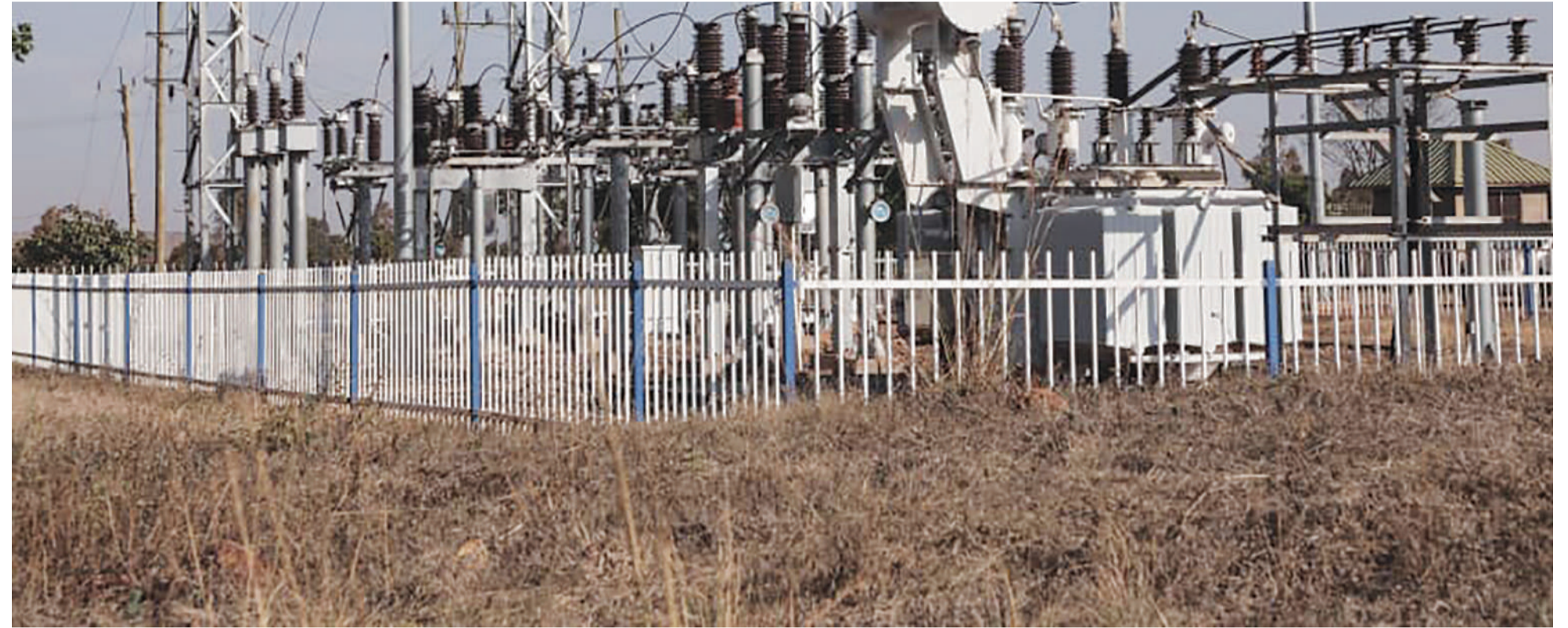
The 33/11 KV Kibongo Grid electricity receiving and Cooling Station at Kibondo.