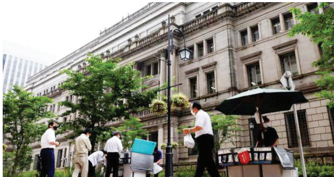
FILE PHOTO: People buy their lunches from street vendors in front of the headquarters of Bank of Japan in Tokyo

But household savings have been building up in the world's largest creditor nation. As of June, households had 1,102 trillion yen ($77 trillion) in cash and deposits, while private non-financial companies had