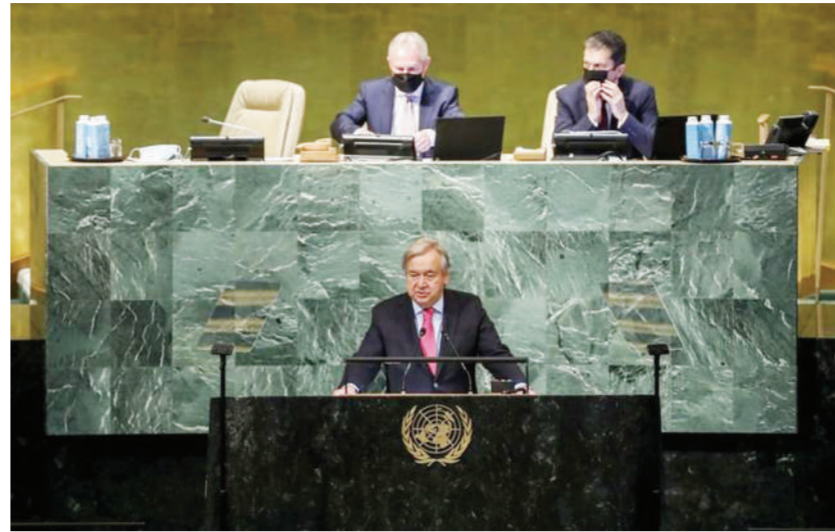
UN Secretary-General Antonio Guterres (front) speaks during the opening of the General Debate of the 77th session of the UN General Assembly at the UN headquarters in New York, on Tuesday.

Guterres called on all developed economies to tax the windfall profits of fossil fuel companies, and re-direct the funds to countries