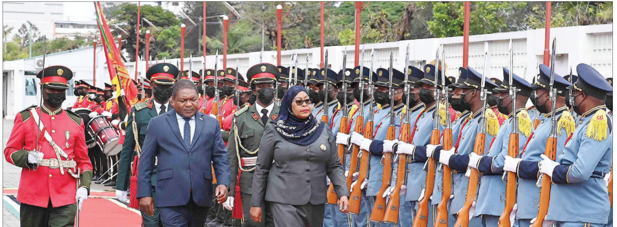
President Samia Suluhu Hassan accompanied by Mozambican President Filipe Jacinto Nyusi as she inspects an honour guard yesterday shortly after arriving at Maputo State House for a three-day official visit to Mozambique.