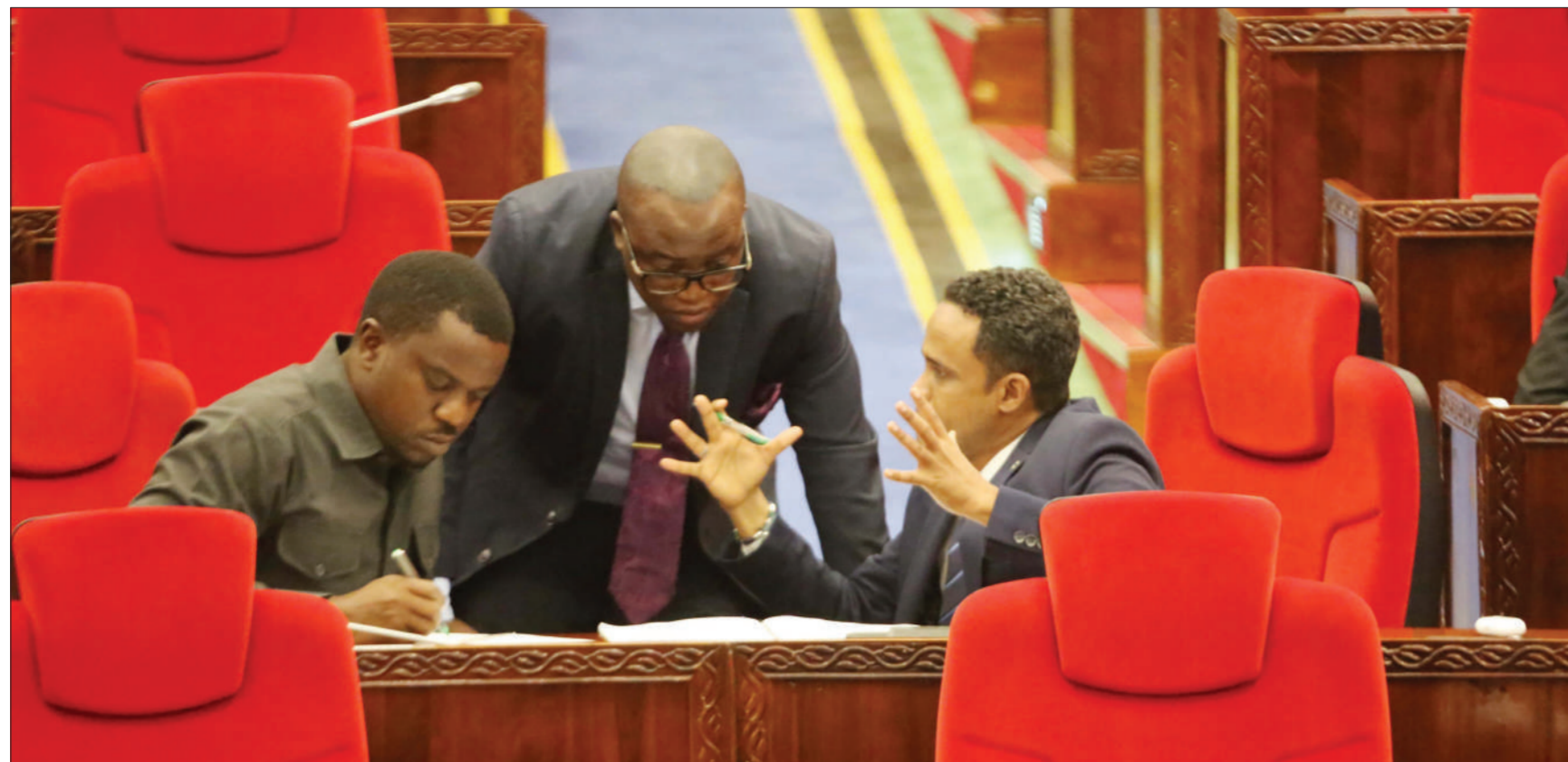
Agriculture minister Hussein Bashe (R) in discussion with Regional Administration, and Local Government minister Innocent Bashungwa (L) and his deputy Anthony Mavunde in the National Assembly in Dodoma yesterday.