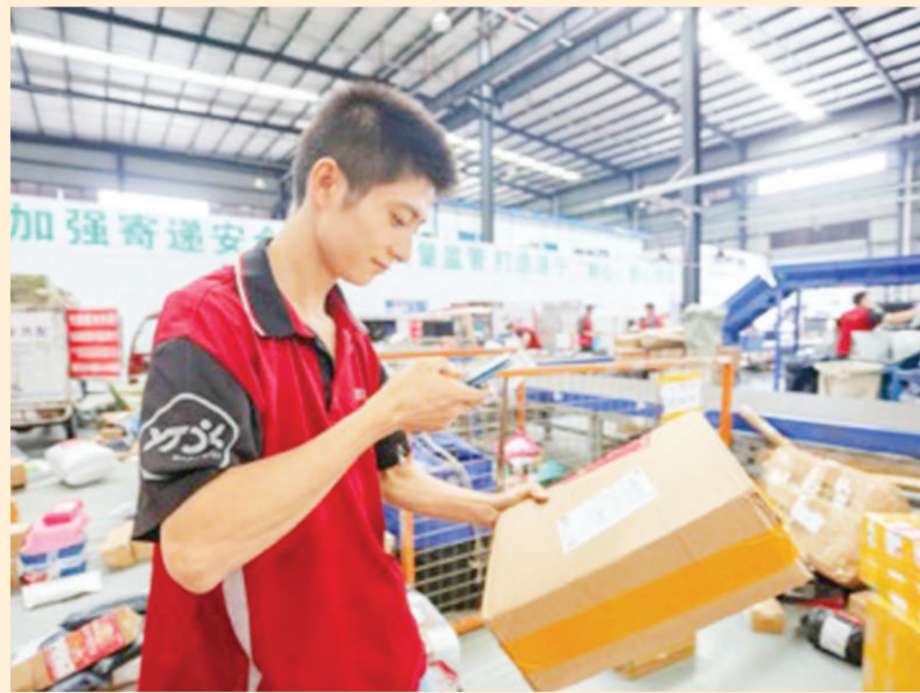
A man scans the code on an Express Parcel in a warehouse of a logistics company in Suining, southwest China's Sichuan province, September, 2020.

STO Express, one of China's top delivery companies, was the first client of Wayz Intelligent. In November 2016, Wayz Intelligent's automatic sorting system was officially put into use in a distribution center of STO Express in Dongguan,