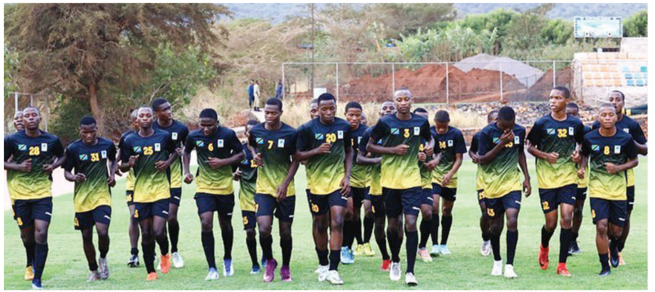
Players making Tanzania's national U-17 football squad, Serengeti Boys, engage in drills at Black Rhino Stadium in Karatu, Arusha last week ahead of this year's U-17 AFCON qualifiers for CECAFA Zone slated for September 20-October 19 in Addis Ababa, Ethiopia.