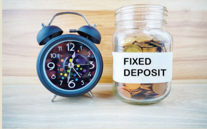
A regular depositor is earning 16.1/- for each 1,000/- deposited in one year, compared with 75.6/- from fixed.

This comes in a time when large number of banks, both big and small, intensified on deposits mobilization campaigns to raise cheaper funds, by