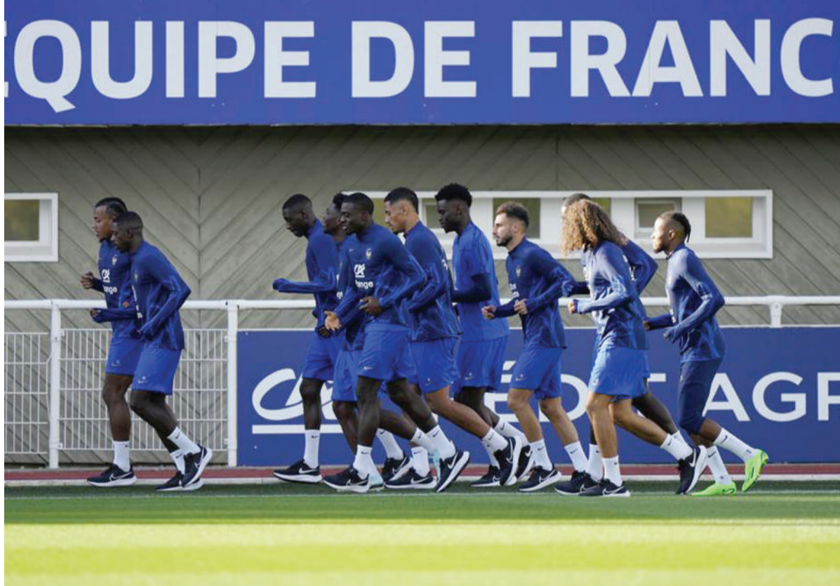
French soccer players warm up during a training session of the French national soccer team at Clairefontaine training center, south of Paris, France, Monday, Sept. 19, 2022.

lenging for promotion include Norway -- led by Erling Haaland's five goals in four games -- and Ukraine.