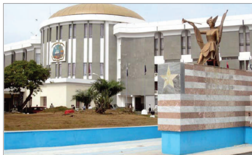
Liberian parliamentary building

This is unfair! Does our legislature know if this will increase the cost of governance? It will likely consume a huge amount of money and increase the cost of governance and an increase in the cost of governance will likely lead to deficit spending for the country. All of these are recurrent expenditures.