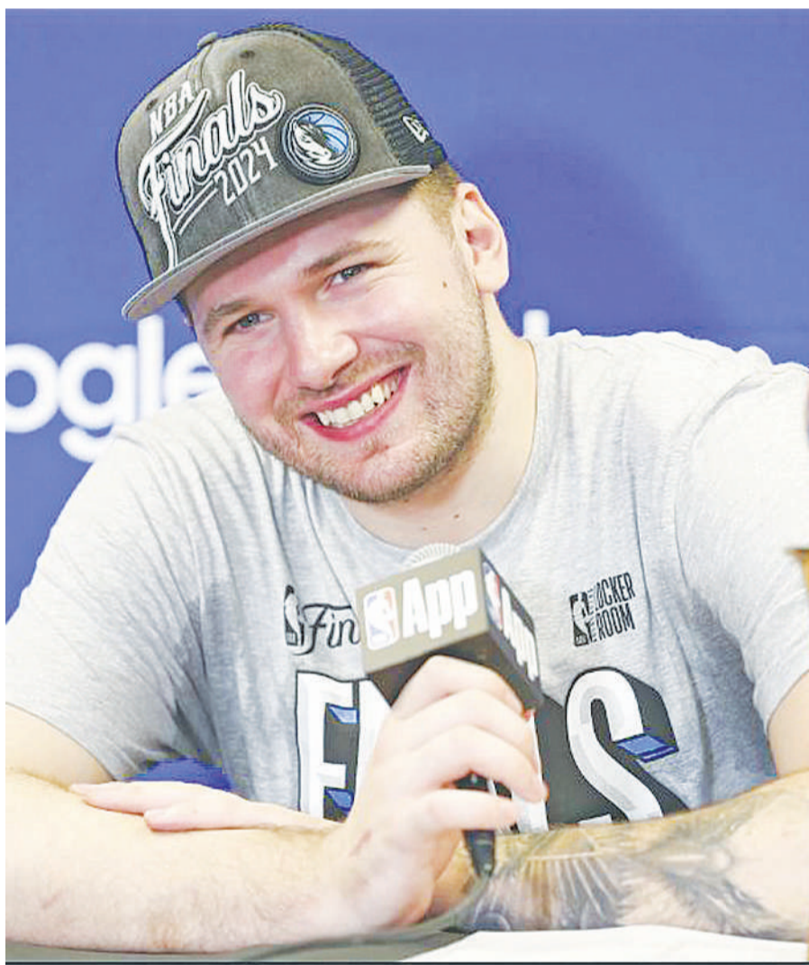
Dallas Mavericks guard Luka Doncic smiles during a news conference after the team's win over the Minnesota Timberwolves in Game 5 of the NBA basketball Western Conference finals, on Thursday, May 30, 2024, in Minneapolis.