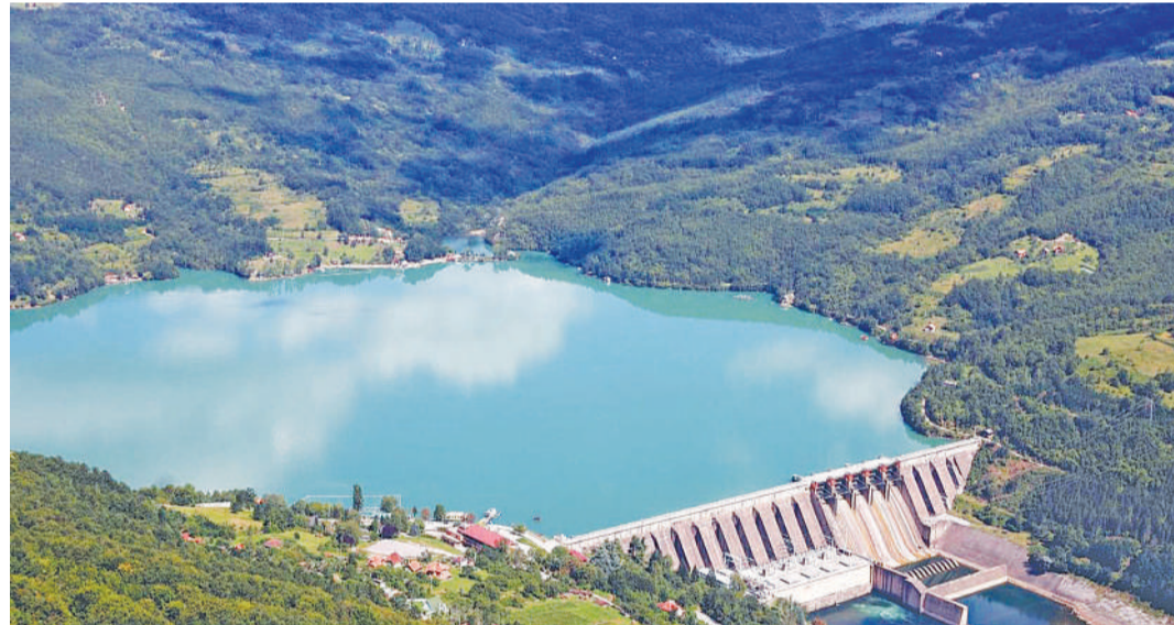
Itare Dam will have the capacity to hold 27 million cubic meters of water and produce 100,000 cubic metres of water per day. File Photo

Rift Valley Water Works Development Agency is the project implementing body. According to the agency, by the time the project came to a total halt, only 30 per cent of the related works had been completed. These works included the construction of the dam foundation, treatment