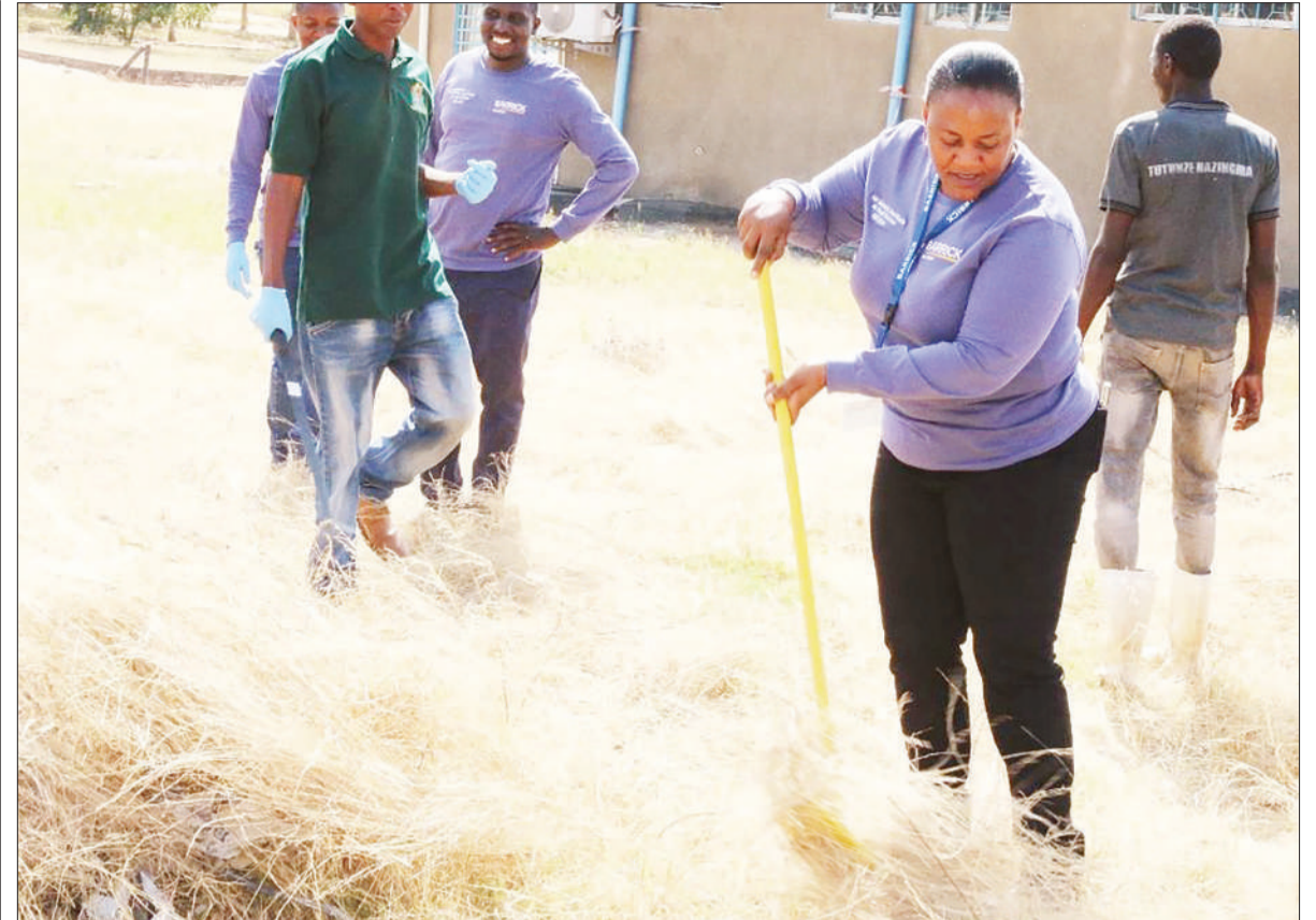
Barrick Bulyanhulu workers engaged in environmental cleanliness at the Bugarama health centre in Msalala District, Shinyanga Region, on Wednesday (May 5) in marking World Environment Day.