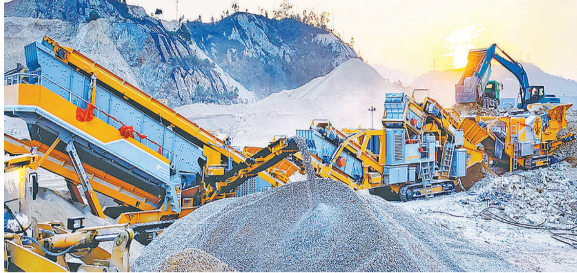
A quarry operation.

million t of aggregates. To meet this demand, optimisation of processes, such as feed control, are key.