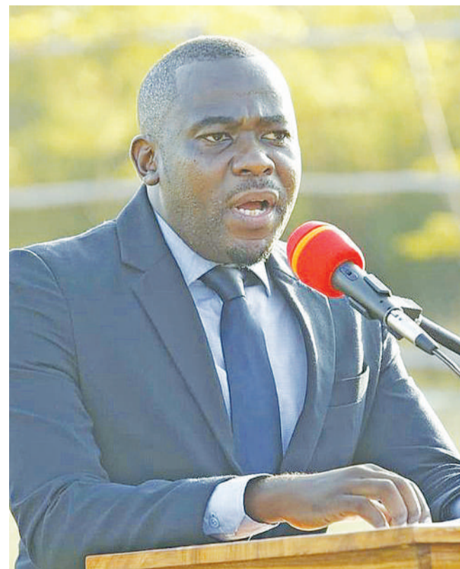
Mudrick Ramadhani Soraga, Zanzibar's Tourism and Heritage minister. File Photo

"The government is making it possible for people to own luxurious five-star resorts through this project. The project is scheduled to be developed in 2024 and finished in early 2025. It comprises 54 individual vil-