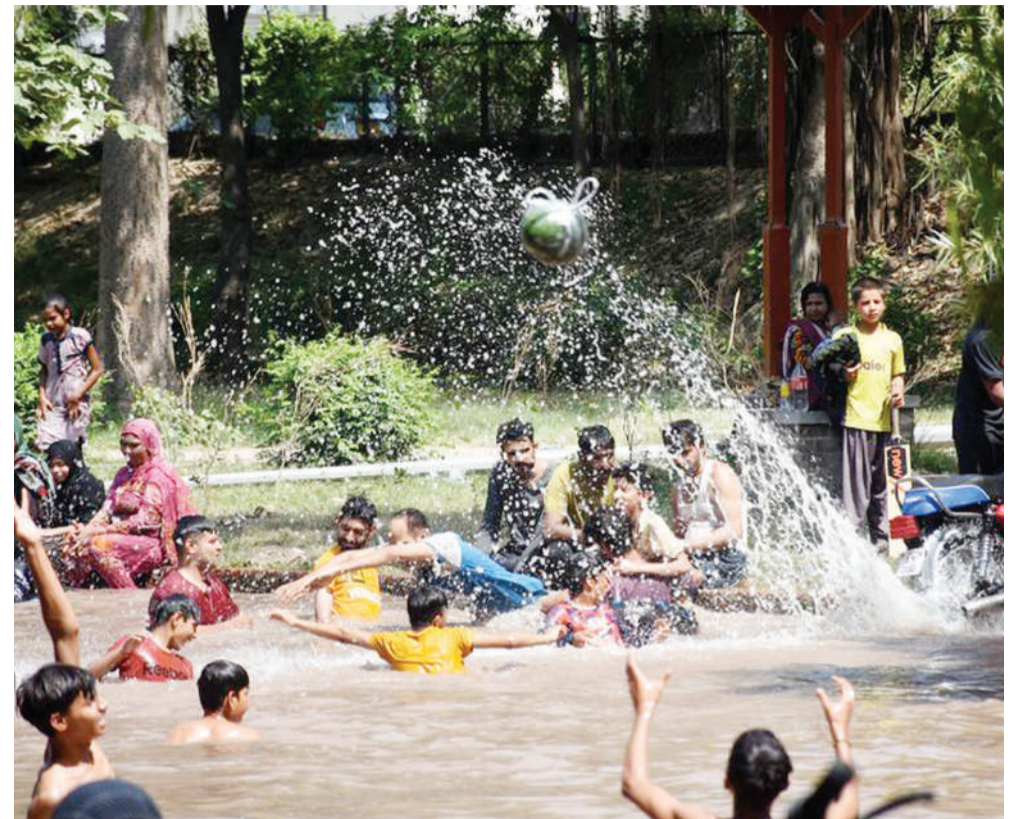
People cool off themselves during a heat wave in a canal in Lahore, Pakistan on June 2, 2024.

"It's climate crunch time," he said, empha-