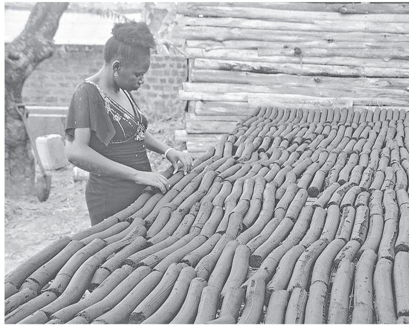
A woman arranges freshly made briquettes at a sanctuary in Kampala, Uganda