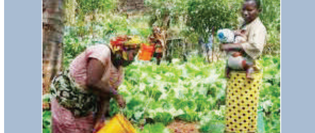
CENTRE EMPOWERS FARMERS TO BECOME HEALTHY FOOD PRODUCERS PAGE 6