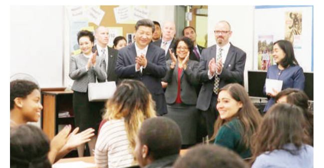
In this file photo dated Sept 23, 2015, Xi Jinping (back, fourth left) and his wife Peng Liyuan (back, second left) greet teachers and students during their visit to the Lincoln High School in Tacoma of Washington State, the United States.