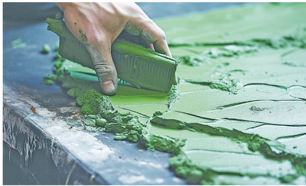
As awareness of climate change grows, demand for green cement is expected to increase. File Photo

For JSW One Homes, the potential to make a substantial impact lies in replacing traditional cement with green cement. Green cement production consumes roughly 60