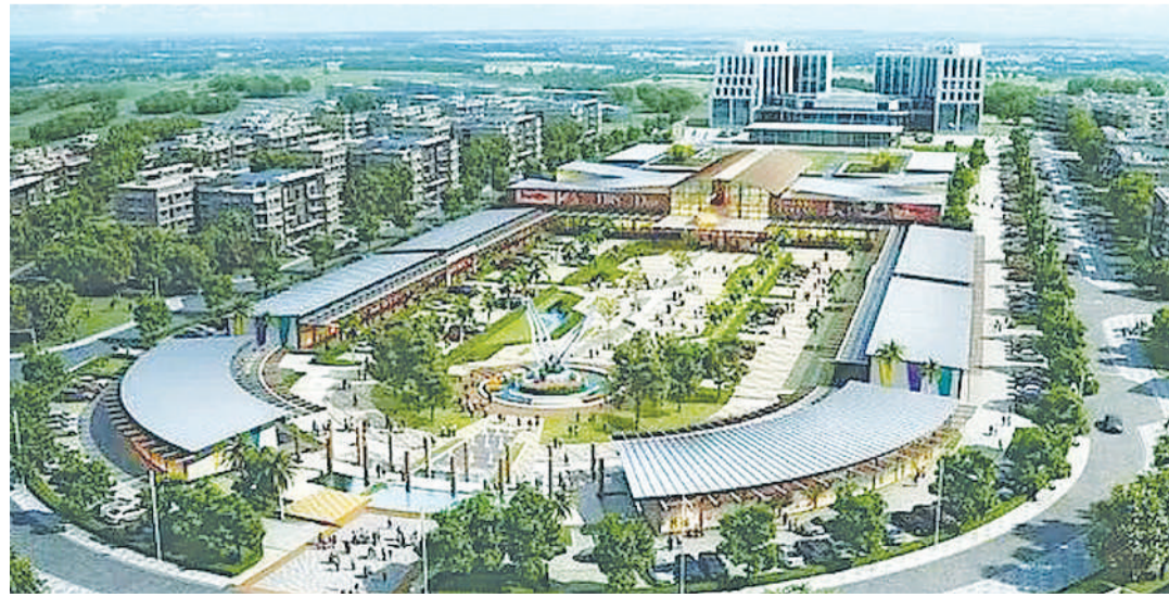
A computer-generated artistic rendition of Kigali Innovation City.