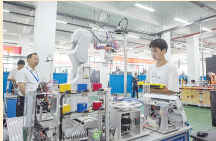
Students at Wuhu Machine Engineering School, east China's Anhui province join an industrial robot operation competition.

In the job market, there is a growing demand for new professions such as digital managers, business data analysts, smart building administrators, blockchain application opera-