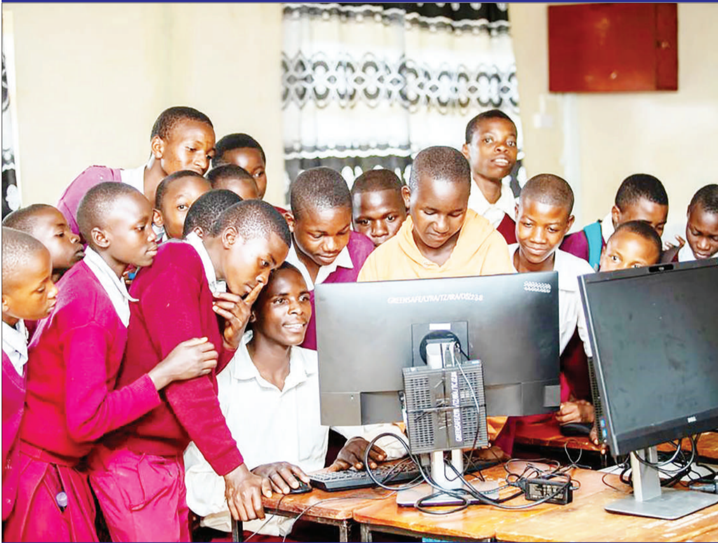
Students of Mseke Secondary School in Iringa Region enjoy their first computer application lab class yesterday, only days after a Tanzania non-profit and a UK-based firm gifted the school 33 computers.