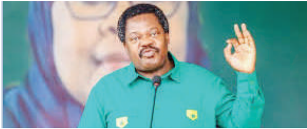
CCM THROWS WEIGHT BEHIND SAMIA'S CLEAN COOKING AGENDA PAGE 3