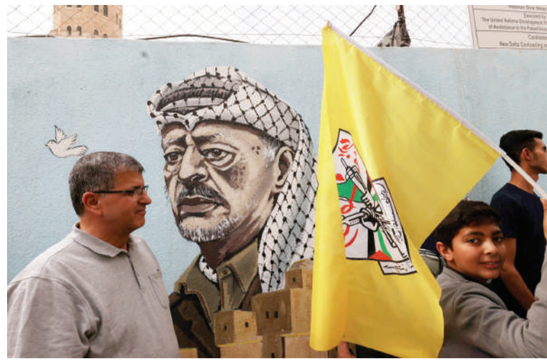
In this file photo dated Oct 27, 2023, A young boy carries the flag of Fatah as he walks past a mural painting of late Palestinian leader Yasser Arafat, during a solidarity march with the Palestinians of the Gaza Strip, in the occupied West Bank city of Hebron.

Despite the talks, the factions' enmity means odds remain low for a deal to reunite the administration of the Palestinian territories, the conversations with