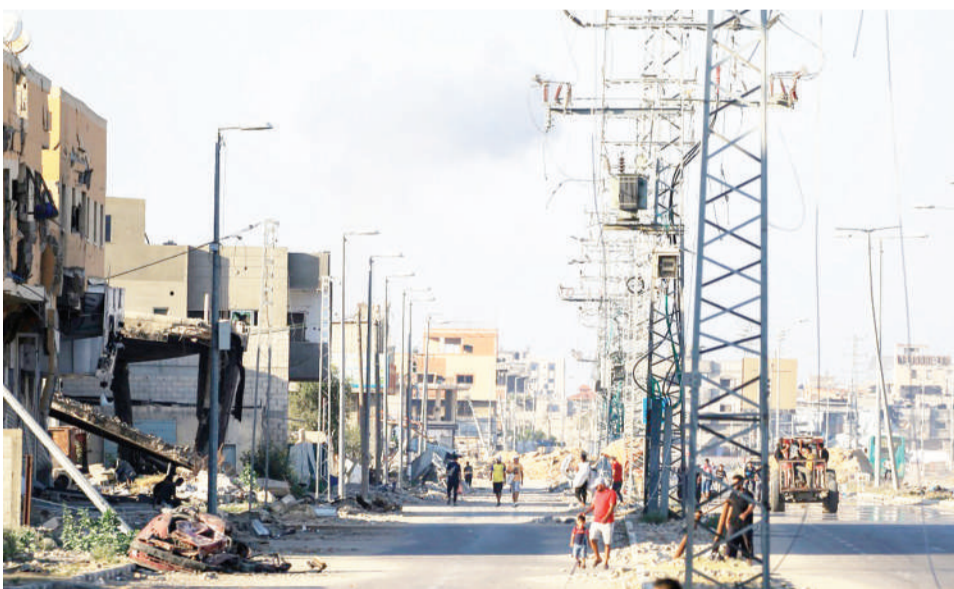
Palestinians take to the road in Al-Maghazi as they flee their displacement camps due to heavy Israeli bombardment of the central Gaza Strip on Wednesday.