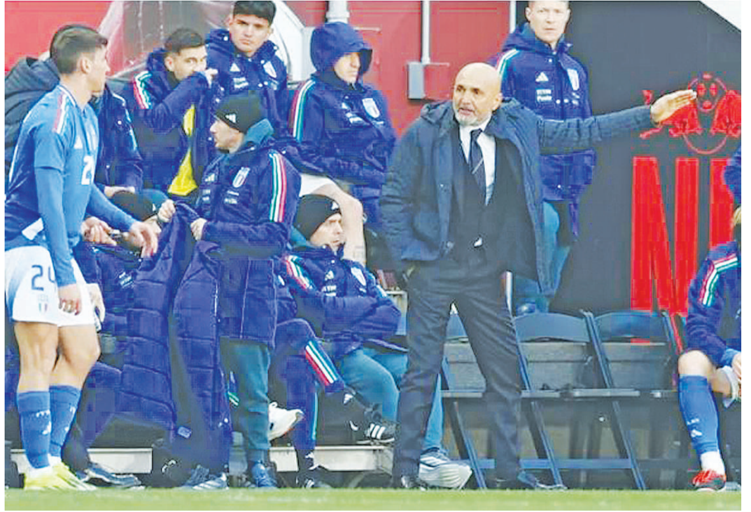
Italy will attempt to win back-to-back Euros, this time under the guidance of Luciano Spalletti.

incentives, new blood, people who are willing to put themselves forward and show what they're made of," said Spalletti on Monday.