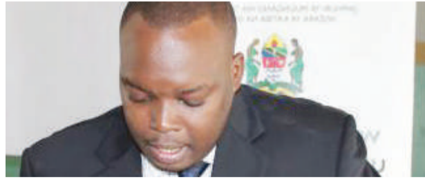
REGISTER WITH ERITA SYSTEM, MARRIAGE CELEBRANTS TOLD PAGE 5