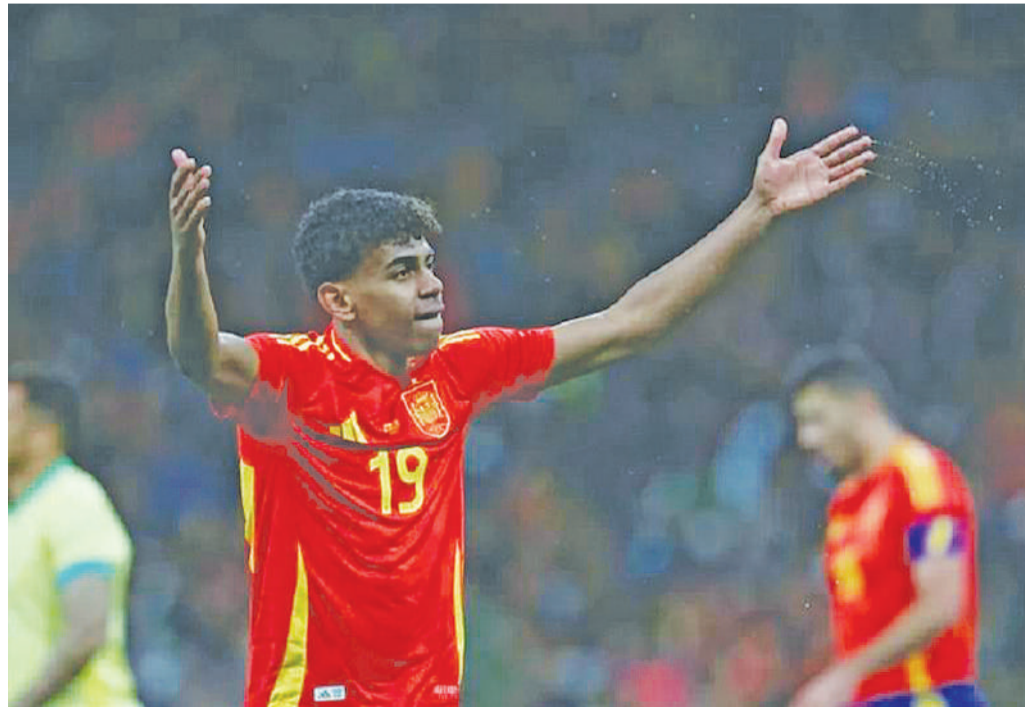
Spain winger Lamine Yamal is one of the brightest prospects the country has and could make an impact in Germany this summer.

Their technical quality is undoubted. Luis Enrique's Spain passed endlessly at the 2022 World Cup, as was the coach's wont, but they