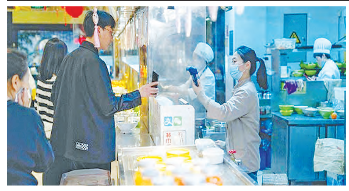
An unidentified woman serves street food while processing payment with her card machine.

Gerri Detweiler is a credit and financing expert, she can be connected via social media