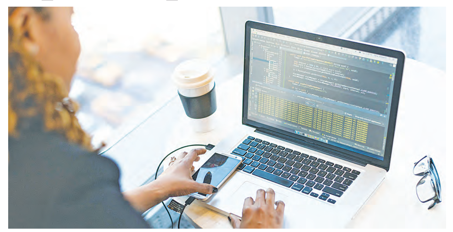
Consider the impressions you want to make when starting your business.

a month. (Note that G Suite email can give you an email address at your domain name, which looks better than an @gmail.com ad-