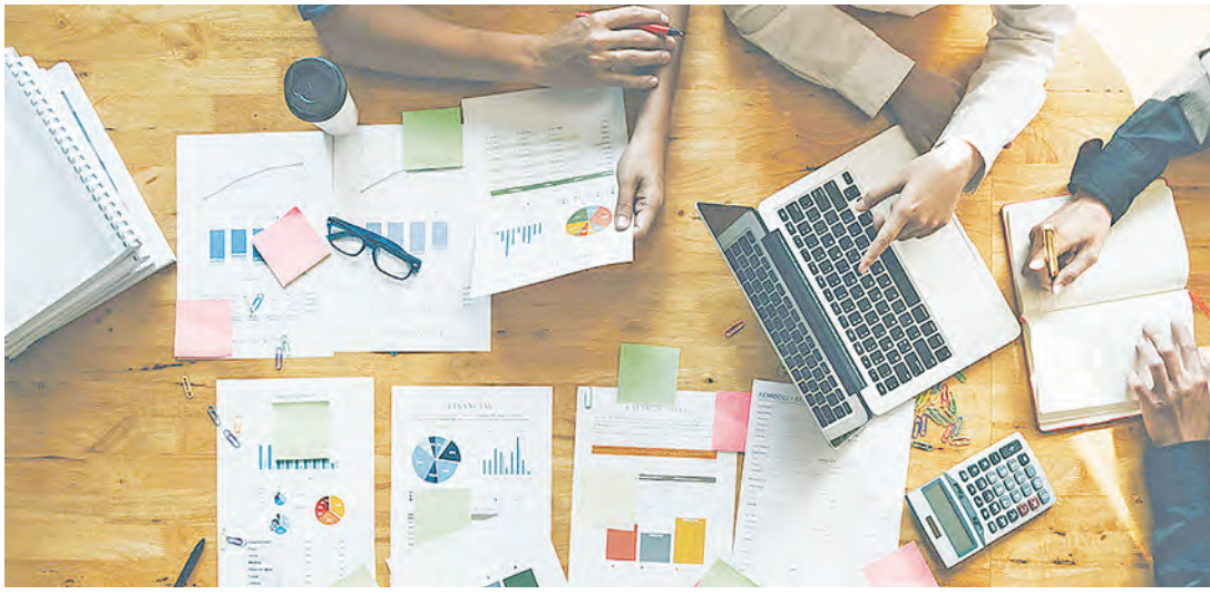
Brand storytelling builds emotional connections through personality. File Photo

diverse marketing platforms by tailoring its narrative approach to each channel's unique characteristics. Social media is designed for quick consumption, making it thrive on concise, visually compelling storytelling, allowing brands to capture attention quickly and effectively amidst a sea of competing posts. It provides easy digestible content that users can quickly interact with and share from the touch of their fingertips, making your brand