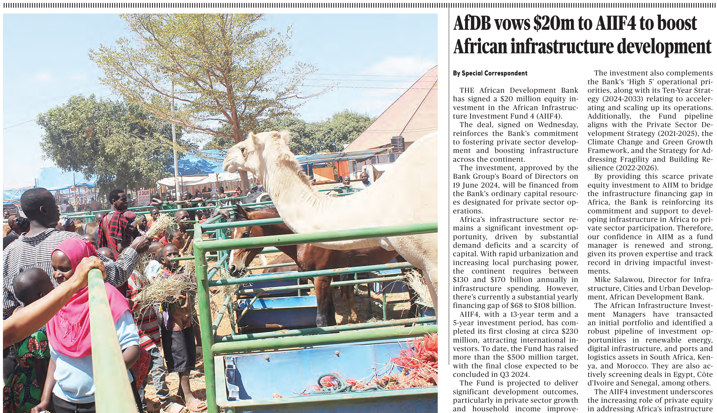
Camels and horses a crowd-puller at this year's edition of the Nane Nane (Farmers' Day) agricultural exhibition in progress at Nzunguni grounds in Dodoma Urban District yesterday.

The projects inspected by the Second VP during his visit included Abdalla Mzee Hospital in Pemba, construction of Mwambe multistorey school, Ukuthini-Mtangani road, Vitongoji fish and vegetable market, Vitongoji waste incineration facility and the progress of Ole Secondary School in Pemba South.