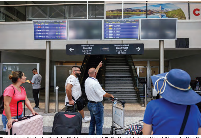
Passengers look at schedule flights screen at Rafic Hariri International Airport after their flights were delayed or canceled in Beirut on July 29, 2024.

However, a significant number of airlines on Friday were still flying over Iran, including United Arab Emirates tice to Canadian aircraft to avoid carriers Etihad, Emirates and FlyDubai, Lebanese airspace for one month