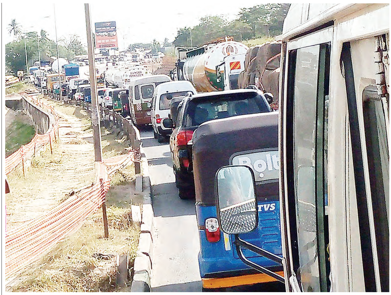
Vehicular traffic at a standstill along a Kimara Mwisho section of Dar es Salaam's Morogoro Road, undergoing major rehabilitation and expansion, as witnessed on Thursday.