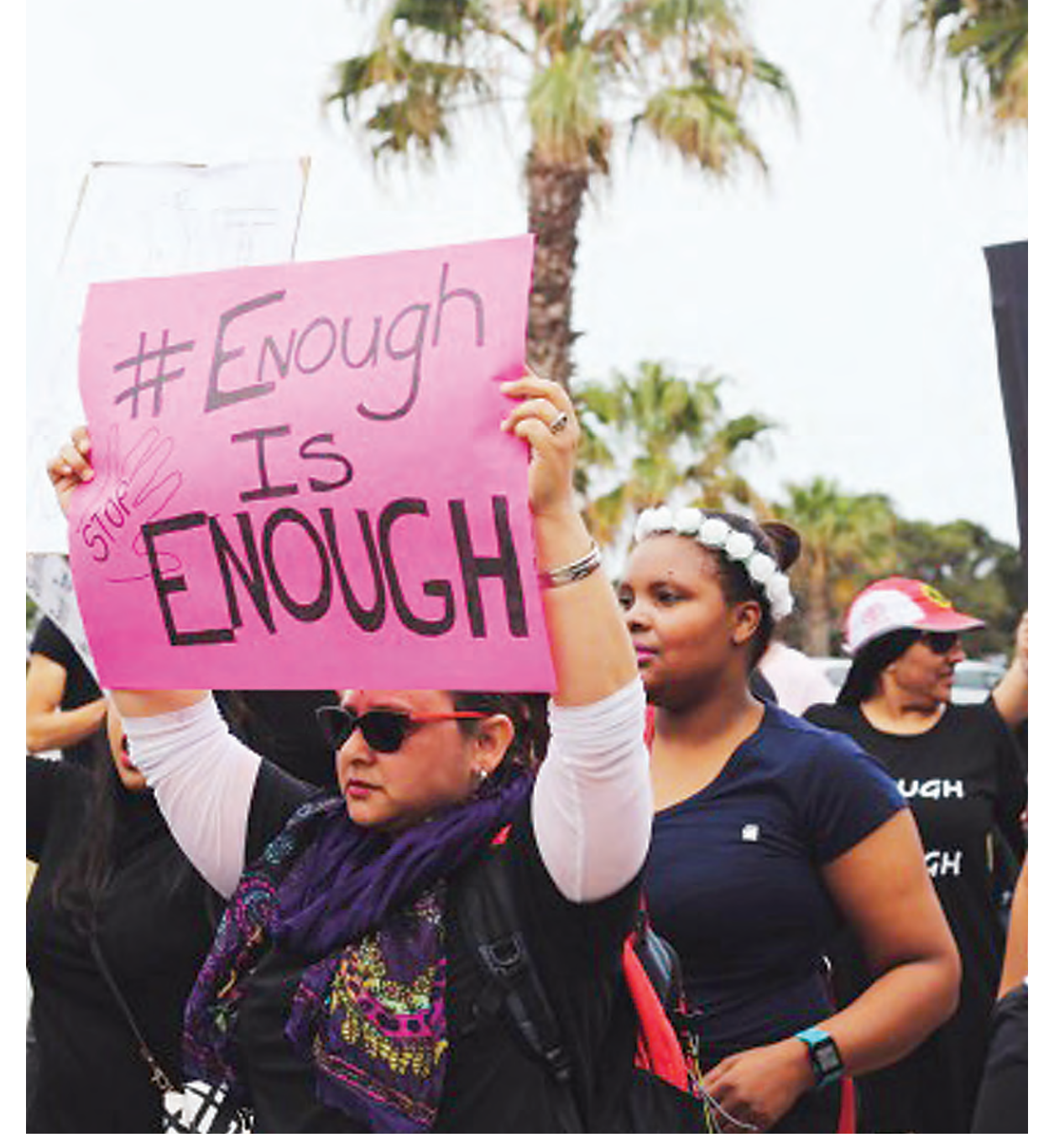
If Africa is to achieve the milestones under the UN 2030 Agenda for sustainable development or the Africa Union Agenda 2063, countries urgently need to recommit themselves to carrying out the Maputo Protocol.

to respond to mistreatment of women and girls during pregnancy, childbirth, and postpartum care, including verbal and physical abuse, neglect, and nonconsensual and medically unnecessary procedures.