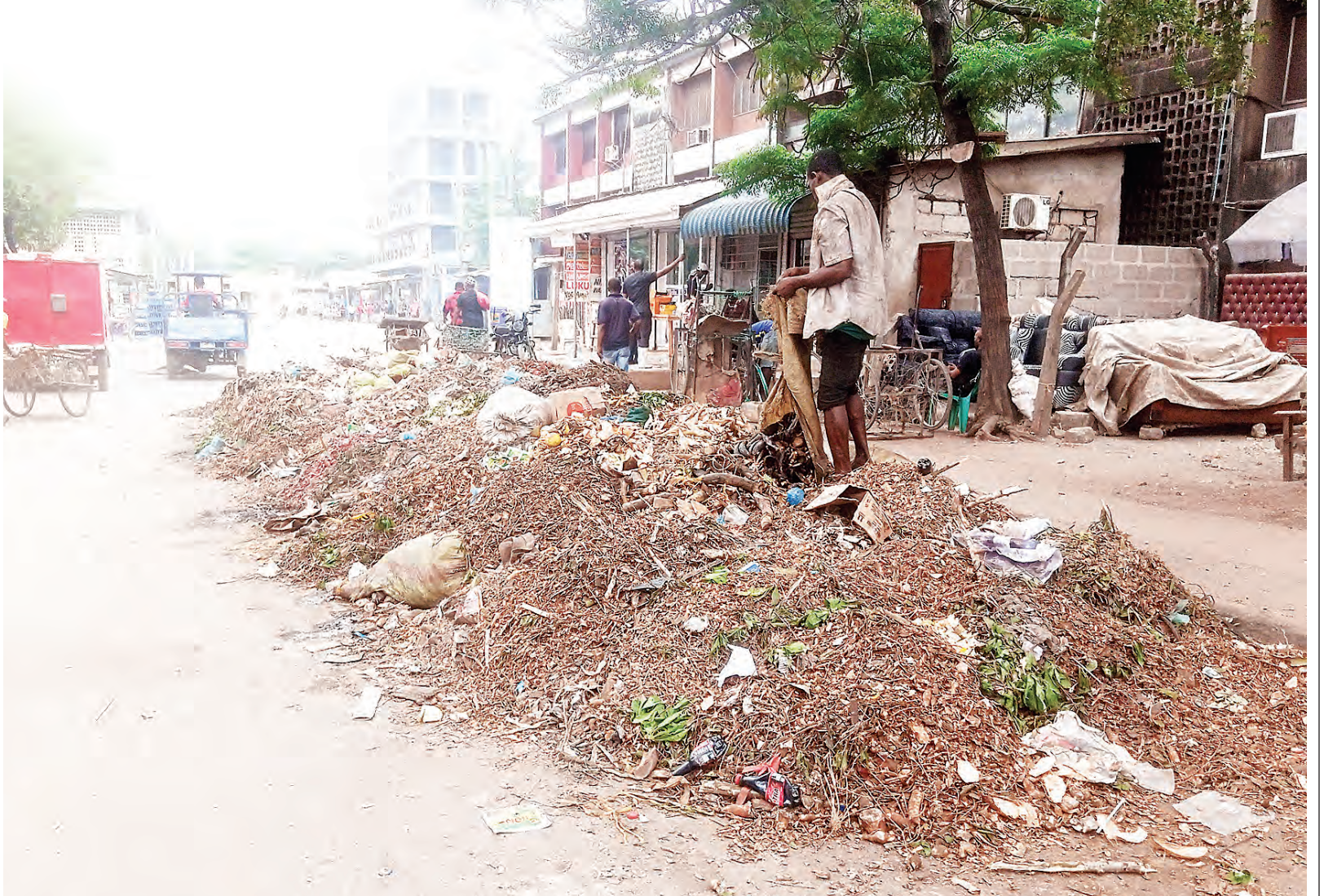
A sure public health hazard as garbage lies abandoned along Dar es Salaam's Madenge Street - a stone's throw away from the popular Buguruni mixedgoods market. Correspondent Jumanne Juma captured this scene earlier this week.

"CLEAR will unlock much-needed access to finance and exit routes for climate entrepreneurs whilst giving investors comfort that their investments will generate the growth they expect and support global ef-