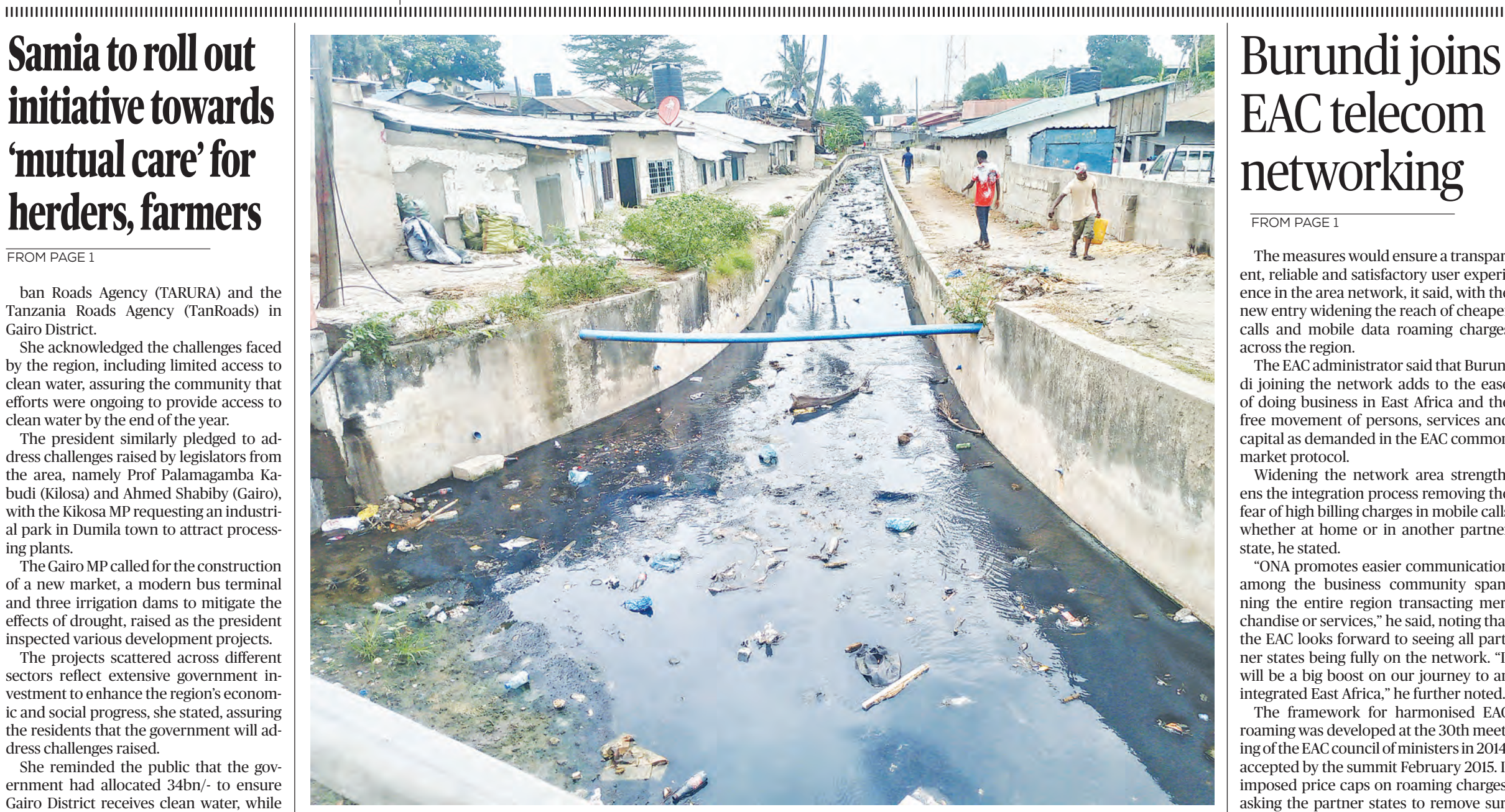
This trench, found deep inside the Uzuri Kilimani segment of Dar es Salaam city's densely populated Manzese suburb, has for long turned into a virtual "river" of sewage mainly discharged from toilets that is seriously endangering public health.

She reminded the public that the government had allocated 34bn/- to ensure Gairo District receives clean water, while proceeding with the tour to Mvomero, Kilosa, Kilombero districts as well as Morogoro municipality.