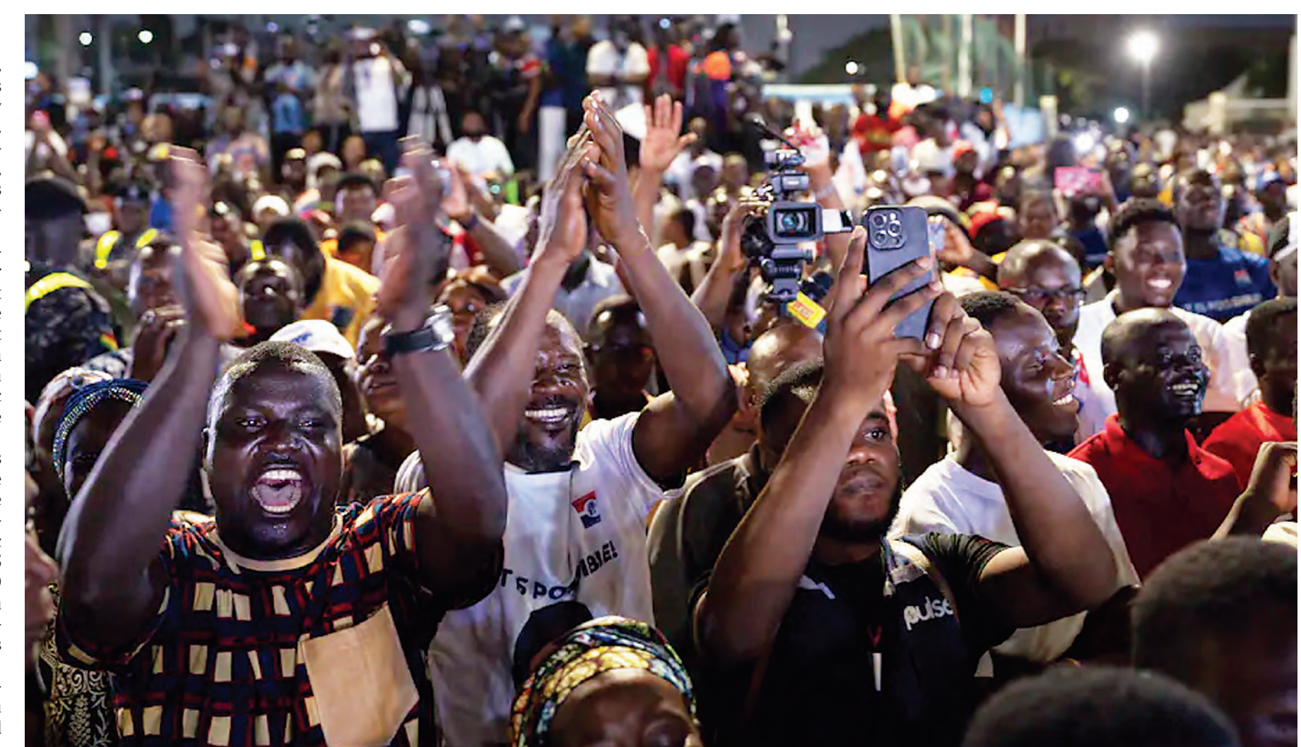
Ghana's two leading parties rely on support from the Asante and Ewe ethnic groups

Fourteen of the country's 16 regions have narrower margins of voting or have swing constituencies. The Ashanti and Volta regions are the exceptions. They comprise about a quarter of the voting population; 76.4 percent and 71.7 percent of residents in the Ashanti and Volta regions are Asantes and Ewes respectively. Since 1992, the Asantes have voted consistently for the New Patriotic Party. Ewes, meanwhile, have voted for the Na-