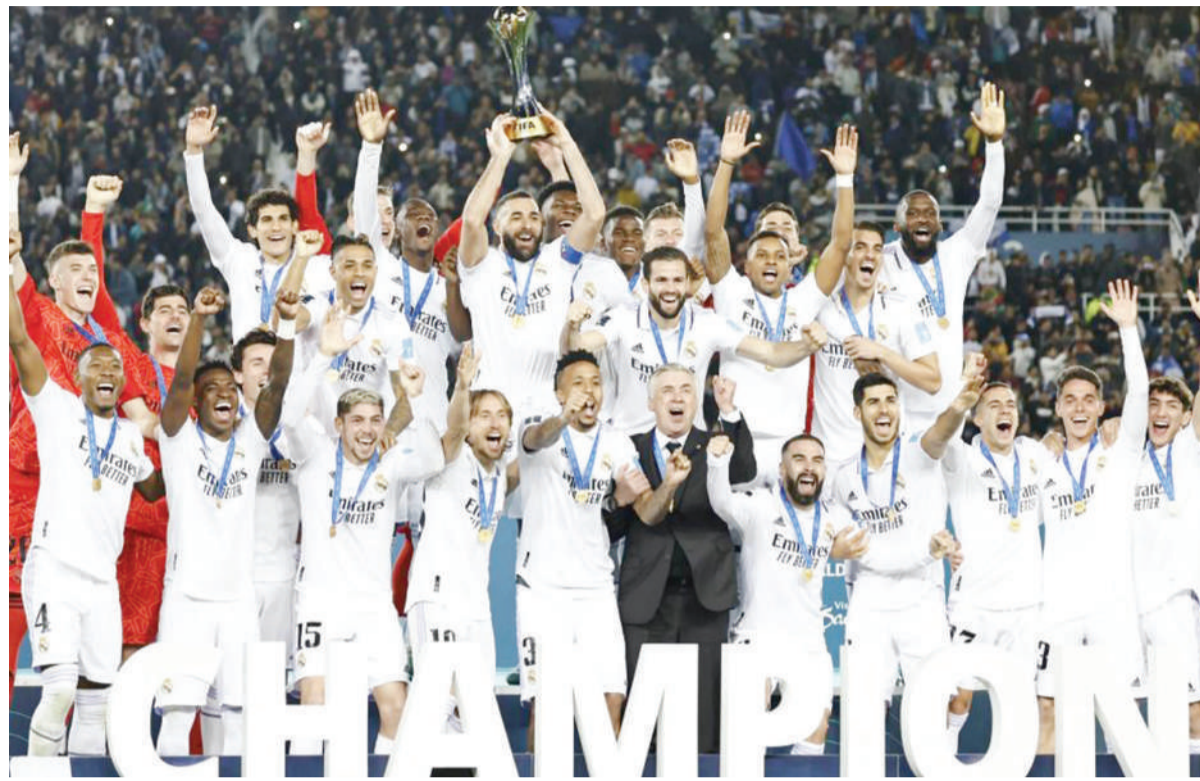
Real Madrid's players celebrate with the trophy at the end of the FIFA Club World Cup final football match between Spain's Real Madrid and Saudi Arabia's Al-Hilal at the Prince Moulay Abdellah Stadium in Rabat on February 11, 2023. -- Real Madrid lifted the Club World Cup for a record fifth time with a pulsating 5-3 win over Al-Hilal.

"We are very happy, for the eighth time Madrid are champions of