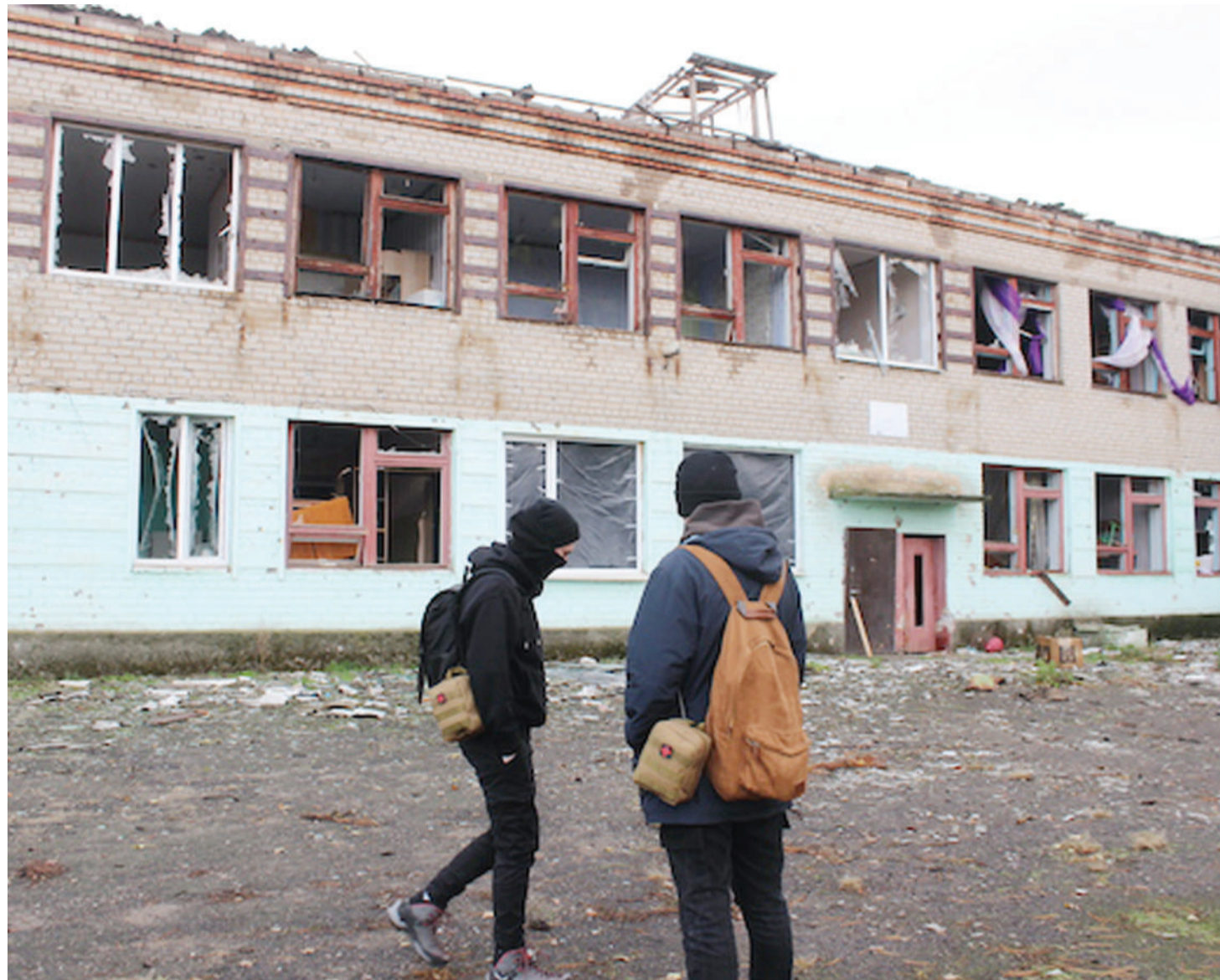
Ukrainian officials say 65,000 war crimes have been registered since the war began nearly a year ago on February 24, 2022. This picture shows some of the damage in the Novopetrivka, Kherson region.

"The UN and participating states must solve the problem of a 'responsibility gap' and provide a chance for justice for hundreds of thousands of victims of war crimes. Without this, sustainable peace in our region is impossible. An international tribunal must be set up and