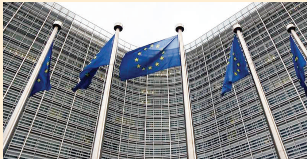
Photo taken on June 29, 2020 shows a billboard on the Law of the People's Republic of China on Safeguarding National Security in the Hong Kong Special Administrative Region (HKSAR) in Central area in Hong Kong, south China.

Speaking before Zelensky's arrival at the summit, Radev said that sending more military aid to the conflict was like "putting out fire with gasoline." He added that "one