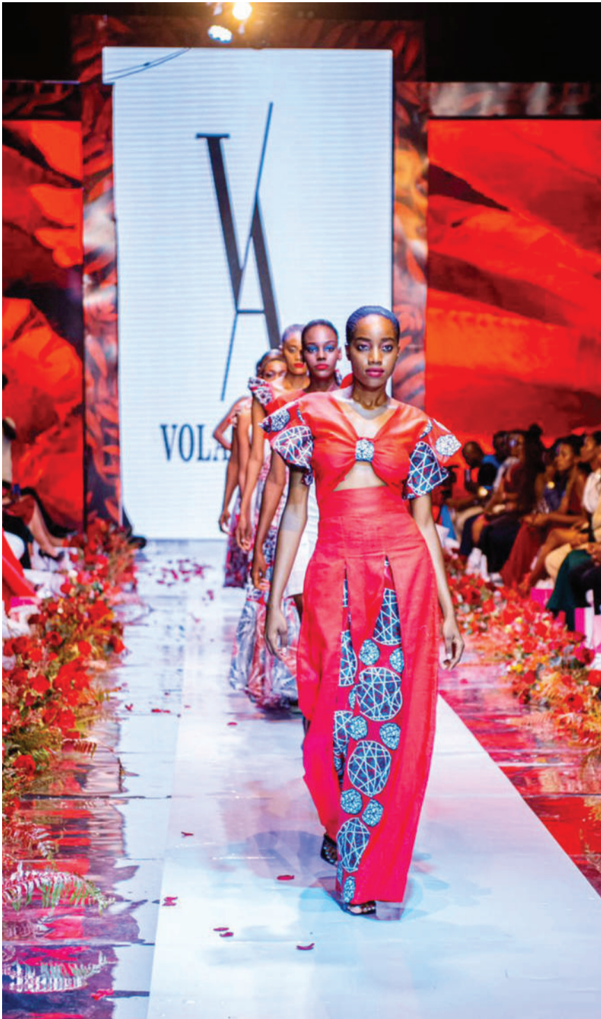
Models showcase the upcoming fashion designer's work during the event that marked the 20th Anniversary of the Red In Red Fashion show in Dar es Salaam over the weekend.