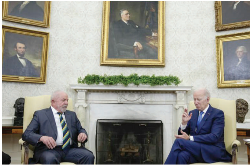
US President Joe Biden crosses his fingers as he meets with Brazil's President Luiz Inacio Lula da Silva in the Oval Office of the White House, on Friday, in Washington.

Biden and Lula did agree to work together on reforming the United Nations Security Council to include "permanent