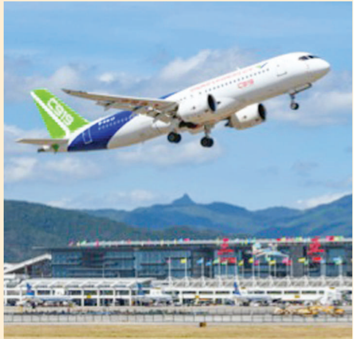
China's domestically-developed C919 large jetliner takes off from the Sanya Phoenix International Airport, south China's Hainan province, and heads for Harbin, northeast China's Heilongjiang province, Feb. 8, 2023.

China, maintaining its commodity price at a relatively low level, has convinced the international community of its ample room for keeping proactive