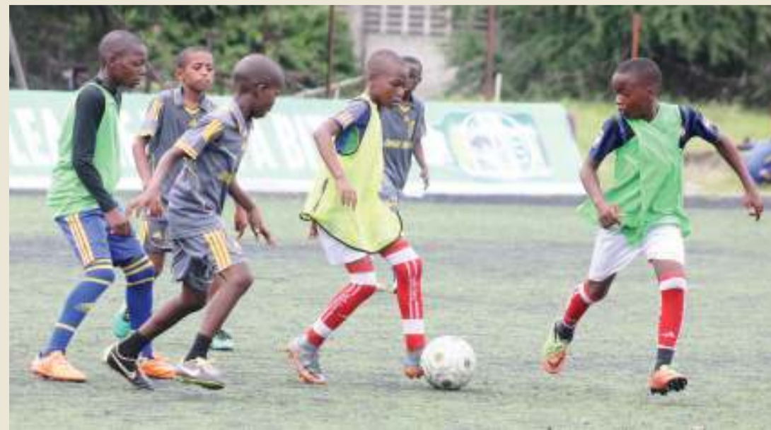
Youngsters that attend junior soccer training program under supervision of Tanzania Football Federation (TFF) take part in training session at Karume Stadium in Dar es Salaam recently.

In my humble viewpoint, the overall deeply dissatisfying