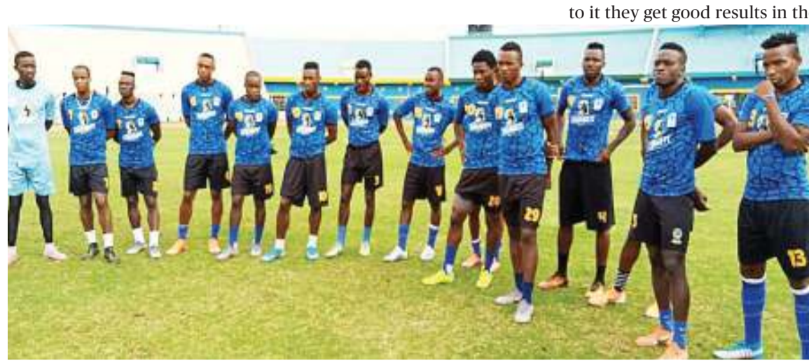
Senior national football team, Taifa Stars.