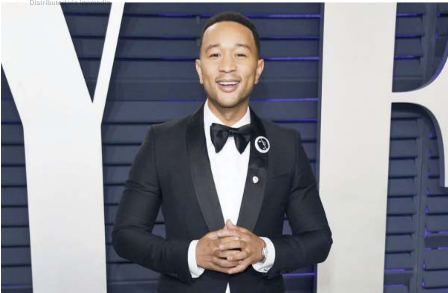
This Feb. 24, 2019 file photo shows John Legend at the Vanity Fair Oscar Party in Beverly Hills, Calif. People magazine has named Legend as the sexiest man alive in their special double issue on newsstands nationwide on Nov. 15.

Failing this, one fears that the glorious successes of yesteryear which were achieved by African heavyweights at this level like Nigeria and Ghana may never be relived again.