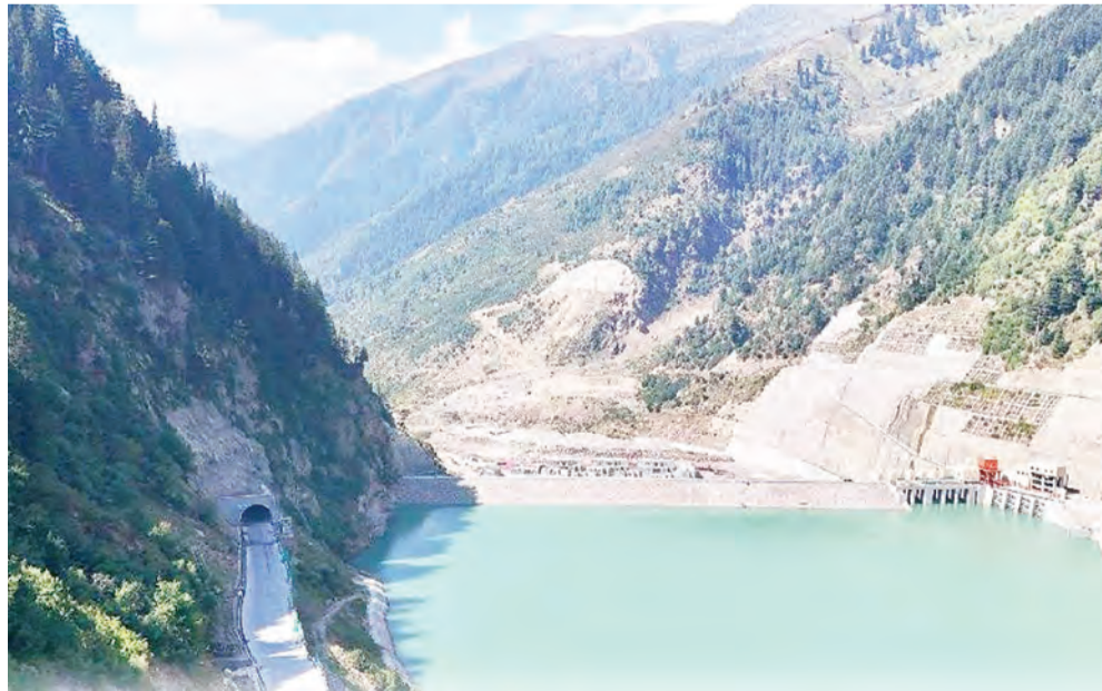
Photo shows the Suki Kinari Hydropower project in Pakistan, invested and constructed by a Chinese company.

From actively advancing climate negotiations to officially launching the International Zero-Carbon Island Cooperation Initiative, and from establishing a "China Pa-