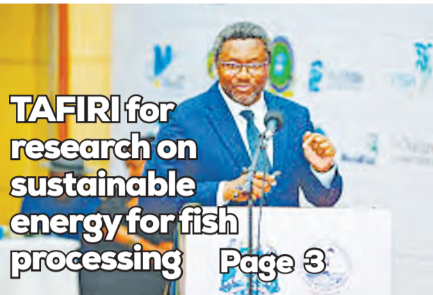
TAFIRI for research on sustainable energy for fish processing Page 3