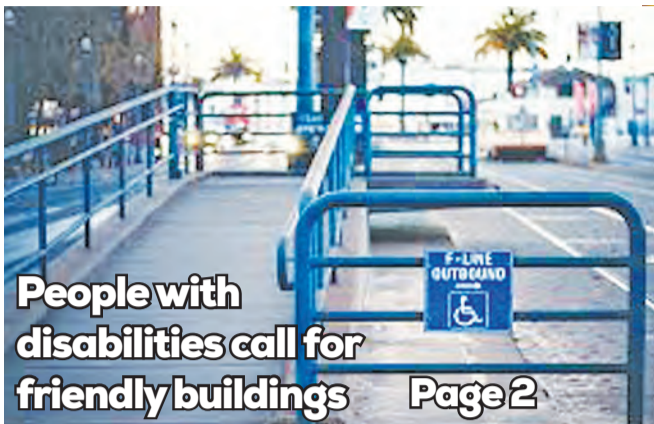
People with disabilities call for friendly buildings Page 2