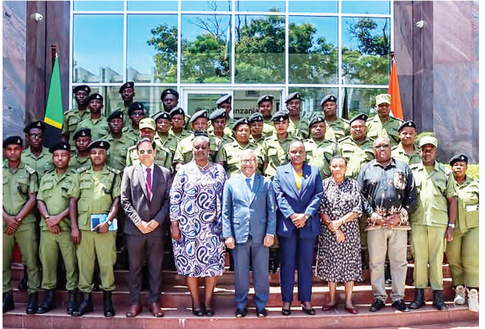
Thirty Tanzanian police officers who attended a recent orientation programme at the Indian High Commission in Dar es Salaam pictured in the city at the weekend shortly before departing for specialised capacity building training in Fundamental Forensics at the National Forensic Sciences University in Gujarat, India, under the Indian Technical and Economic Cooperation Programme.

The 16 Days of Activism Against Gender-Based Violence is an annual global campaign aimed at raising awareness and advocating for an end to gender-based violence.