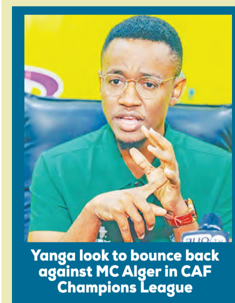
Yanga look to bounce back against MC Alger in CAF Champions League