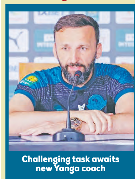
Challenging task awaits new Yanga coach