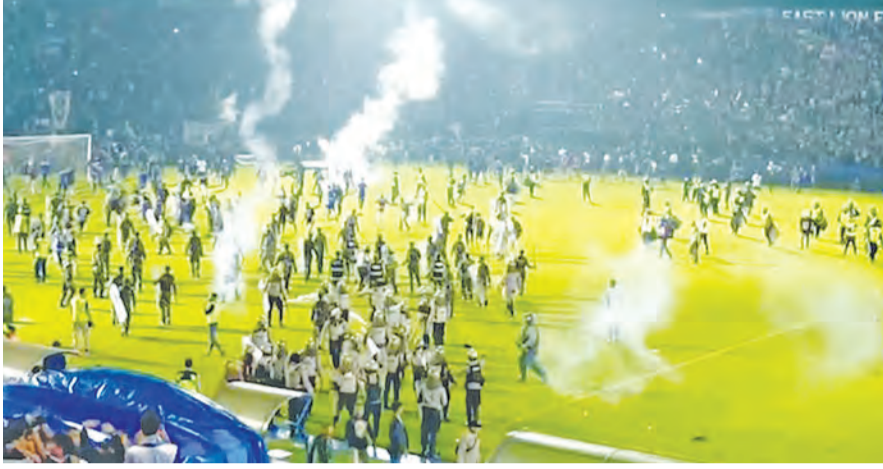
Fans invade the soccer field after a match between Arema FC and Persebaya Surabaya at Kanjuruhan Stadium, Malang, Indonesia Oct 2, 2022 in this screen grab taken from a REUTERS video.