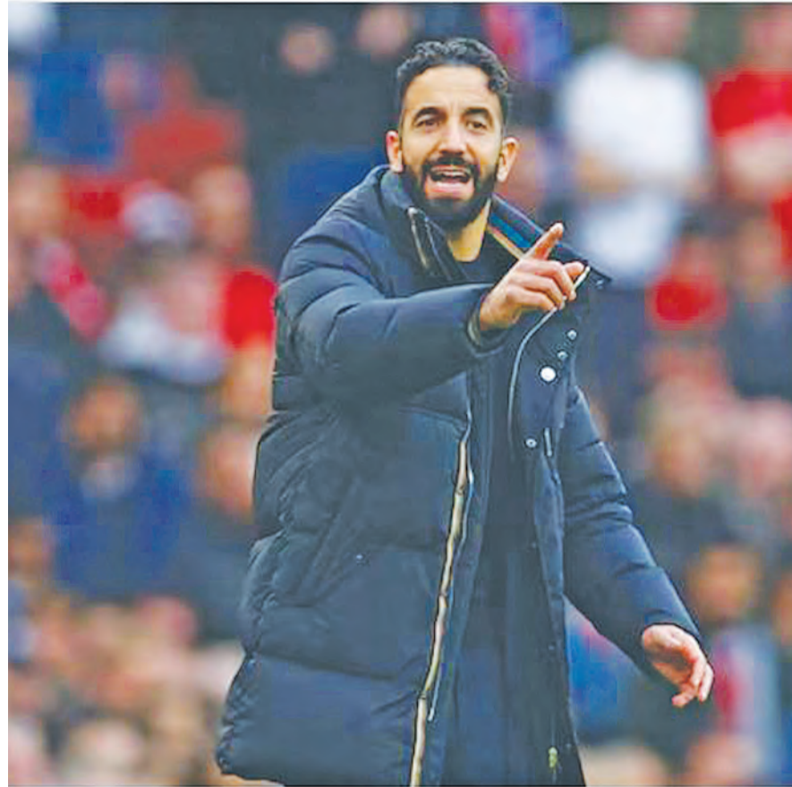
Manchester United manager Ruben Amorim reacts during the Premier League match against Everton at Old Trafford, in Manchester, Britain on December 1, 2024.

"It's important to be brave (on Wednesday), when I say it's brave it's