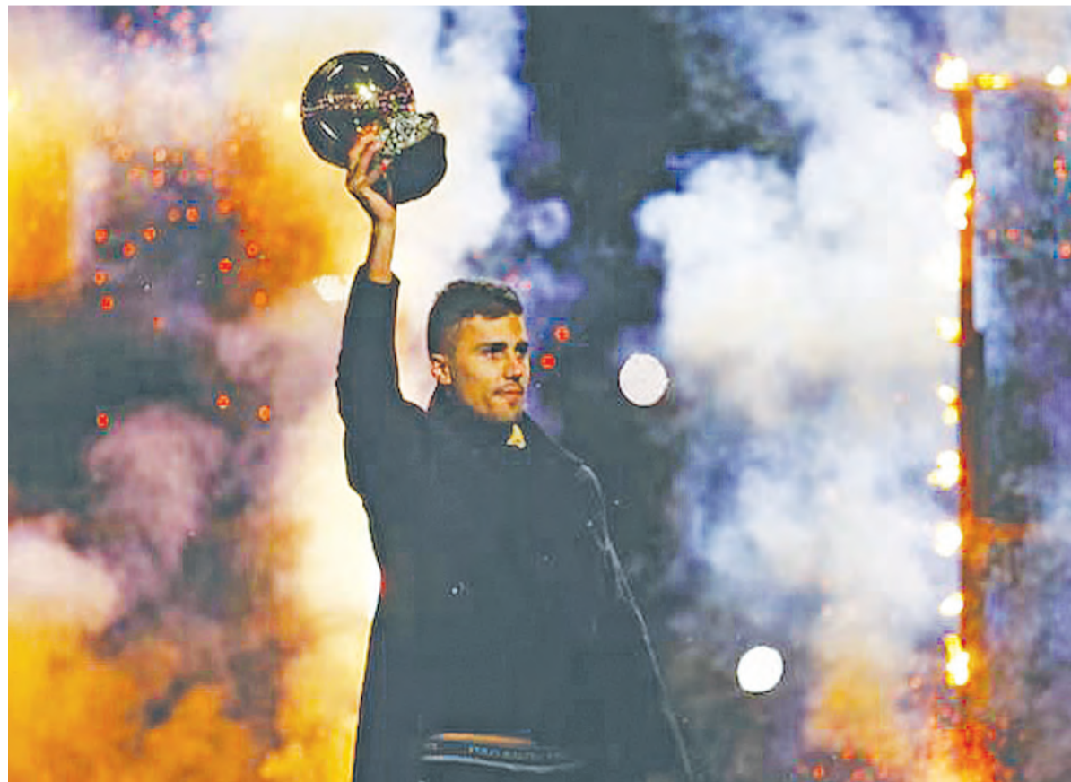
Manchester City's Rodri with the Ballon d'Or trophy on the pitch before the Premier League match against Tottenham Hotspur at Etihad Stadium, in Manchester, Britain on November 23, 2024.

Although Real Madrid continued to fly the flag in the Champions League, a return to similar success at national level seemed a long way away for many years.