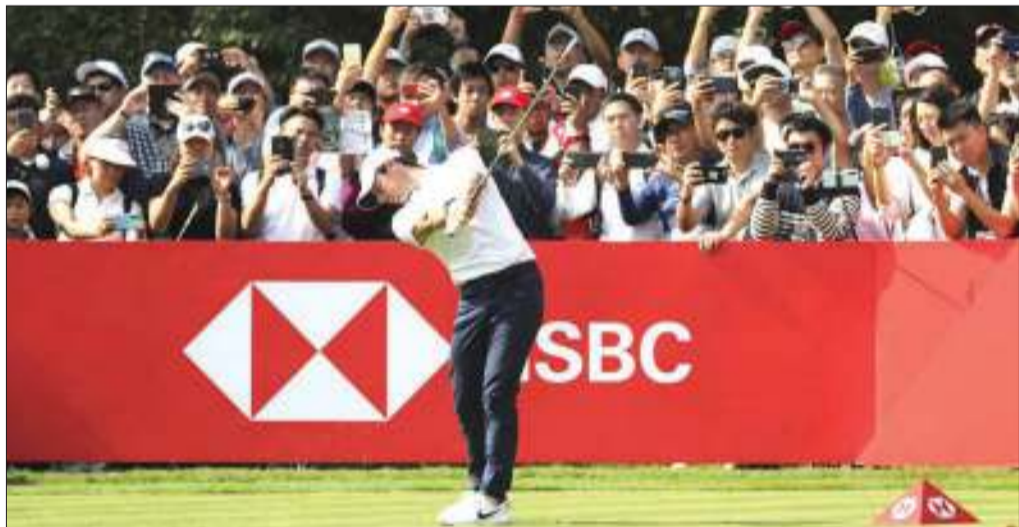
Rory McIlroy of Northern Ireland tees off on the final day of the HSBC Champions golf tournament at the Sheshan International Golf Club in Shanghai on Sunday, Nov. 3, 2019.