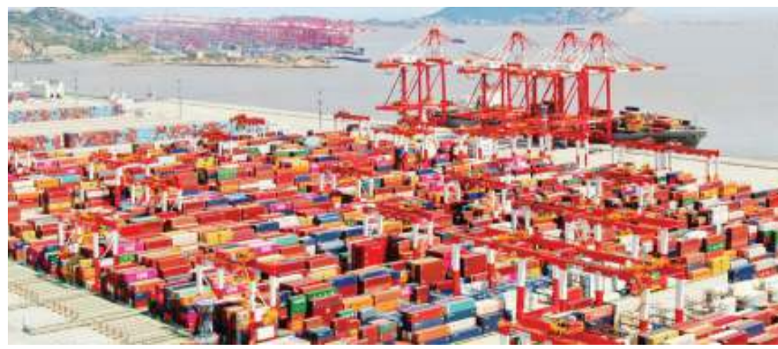
Aerial photo taken on May 28, 2019 shows Shanghai Yangshan Deep Water Port.

Right now, these orders have gradually been confirmed and