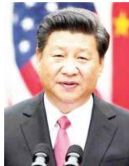
Chinese President Xi Jinping

But they do not tell the truth about 30% of the country's contribution in the world economy. Since human beings believe in what they hear, then some of those who are unaware of how China is contributing to world