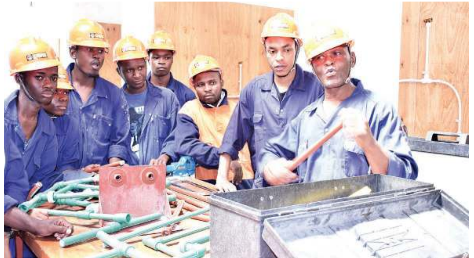
Young people being trained in plumbing and pipe fitting skills at the Arusha Technical College (ATC) under the new Netherlands programme to support local youth in Arusha.

“Because these are the best envoys to speak well about the institution, attend lessons in time, work extra time, as well as help to protect the fa-