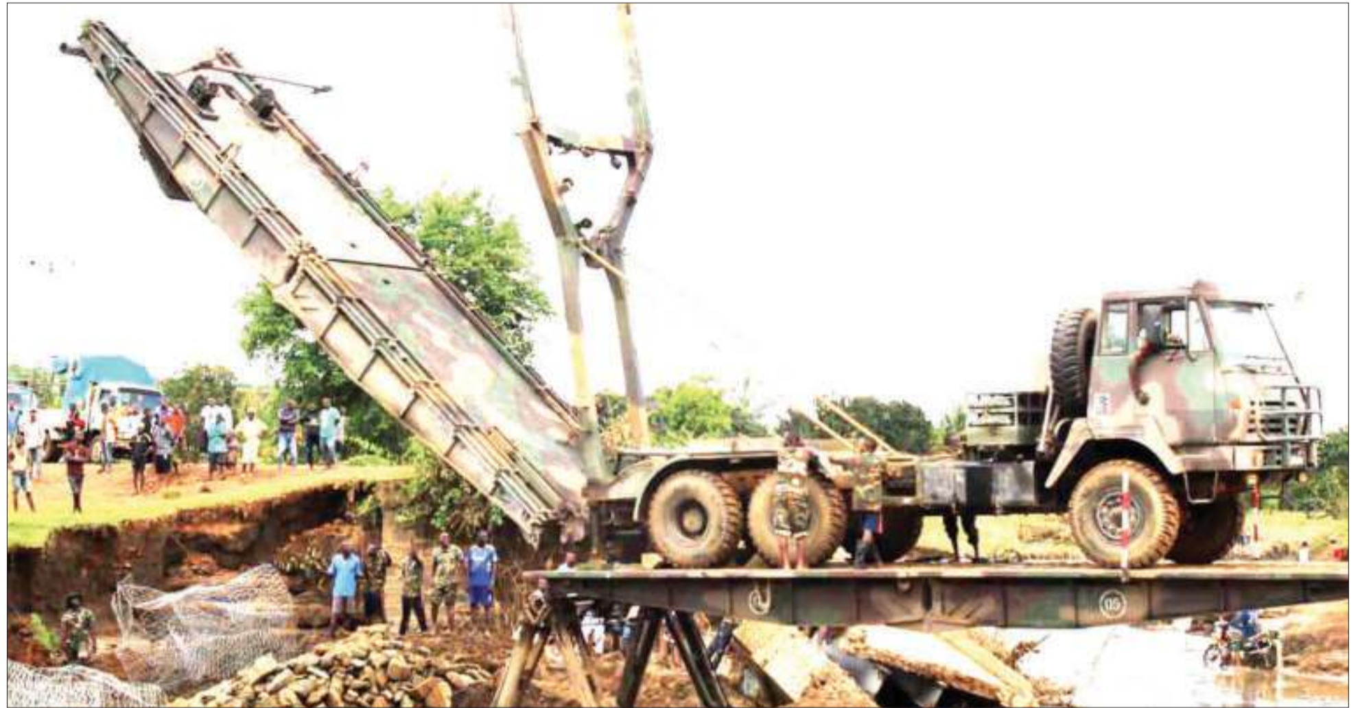
Members of the Tanzania People's Defence Forces move to install a temporary bridge across Nderema River in Handeni District, Tanga Region, as found at the weekend. The bridge previously there was recently swept away by floodwaters, which led to a serious disruption on transport to and from various parts of Tanzania and neighbouring countries.