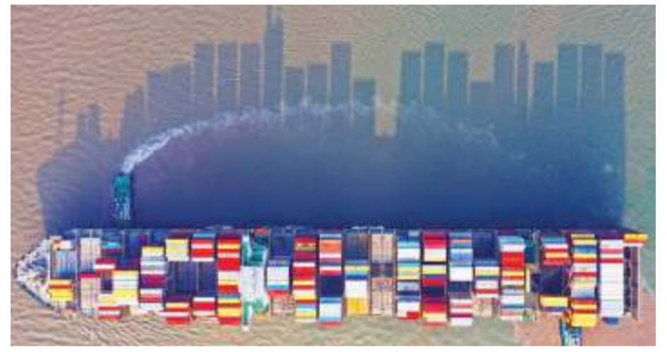
A cargo vessel laden with containers departs from Shanghai Yangshan Deep Water Port, Oct. 4, 2019.

To understand China and its development path and strategies will help many countries save twists and turns in their own development,