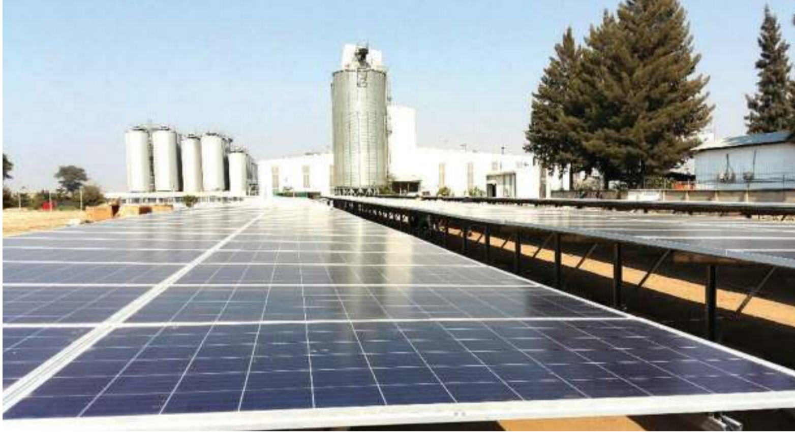
Solar power panels at TBL Mbeya plant. END

He said his team implemented SABMiller's manufacturing way which is an approach to operational excellence. "This tested approach has earned SABMiller and its subsidiaries good reputa-