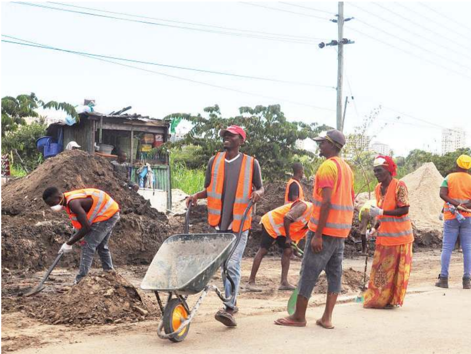
An environmental cleanliness team deployed by Kinondoni municipality pictured at the weekend clearing a Jangwani Valley stretch of Dar es Salaam Morogoro Road of soil accumulated in the course of the recent rains.