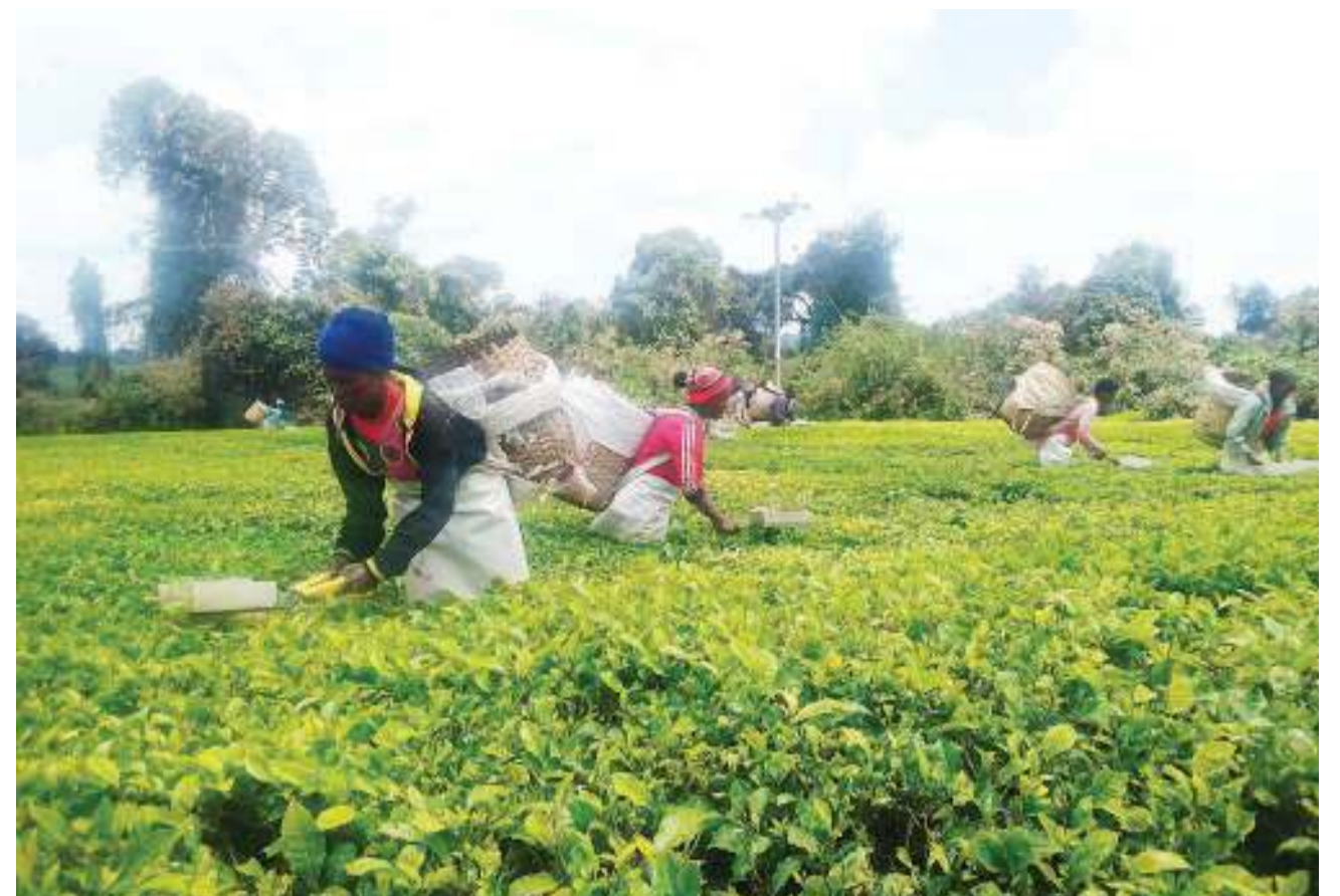
Tea harvesting well under way in Unilever Tea Company's Kibwele estate in Mufindi, Iringa Region, yesterday.

She acknowledged that one of the main requirements for the success of industrialization drive having skilled and knowledgeable individuals. "The fifth phase government through various programmes is determined to help youth initiate different small and medium economic projects due to limited opportunities in the employment market,"