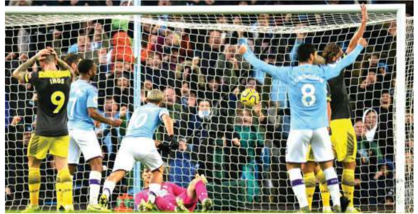
Manchester City's Sergio Aguero celebrates scoring their first goal against Southampton during their Premier League match at Etihad Stadium in Manchester, Britain on Sunday.

Manchester United slumped to a 1-0 loss at Bournemouth and Arsenal were held to a disappointing 1-1 draw by Wolves, but all the focus was on the drama at the top of the table.