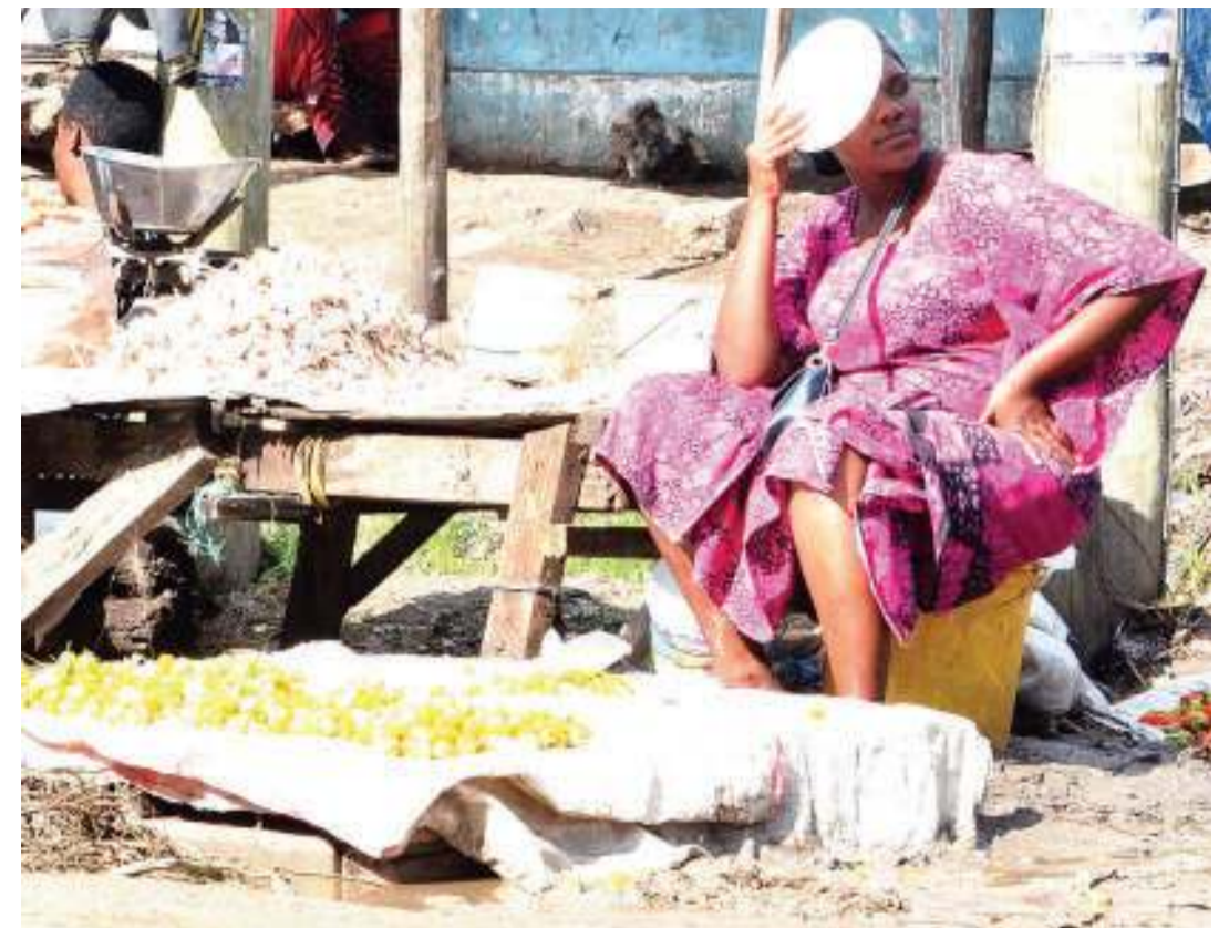
The scorching sun is doing little to dissuade this small trader from waiting for customers for her fresh hot pepper, as captured at Mabibo in Dar es Salaam yesterday.

We have decided to come up with the Genge Campaign in order to support majority of women