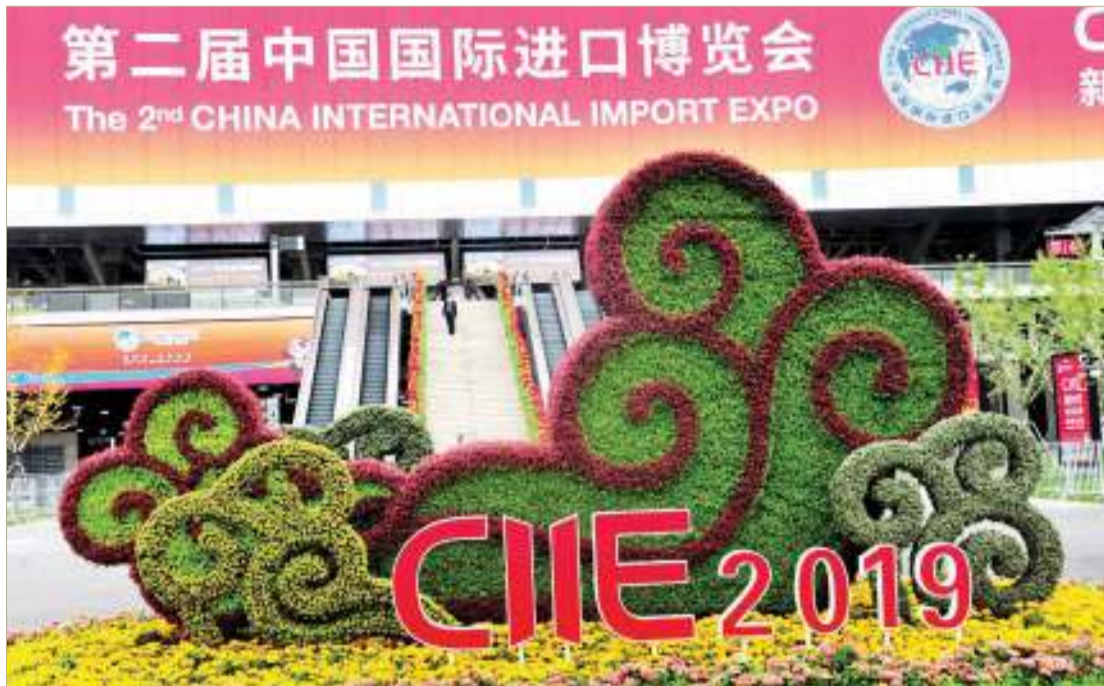
Decoration of the west gate at the National Exhibition and Convention Center in Shanghai is almost complete, Oct. 22, 2019.

The success of the first CIIE greatly inspired foreign exhibitors. According to credible sources, the number of participating countries, regions, international organizations, and companies of the second CIIE will all exceed