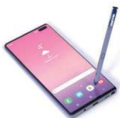
Samsung's Galaxy Note 10 smartphone.

Cupertino-based Apple -- Samsung's arch rival in the premium smartphone market -- posted a 2.8 per cent year-on-year drop in its net profit to $13.7bn in the third quarter to September 28, as earnings from its flagship product the iPhone declined.