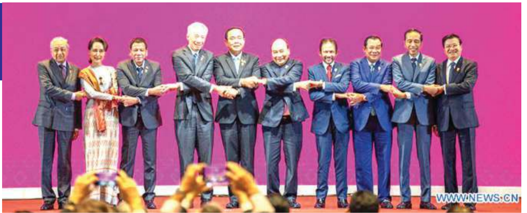
(From L) Malaysian Prime Minister Mahathir Mohamad, Myanmar State Counselor Aung San Suu Kyi, Philippine President Rodrigo Duterte, Singaporean Prime Minister Lee Hsien Loong, Thai Prime Minister Prayut Chan-o-cha, Vietnamese Prime Minister Nguyen Xuan Phuc, Brunei Sultan Haji Hassanal Bolkiah, Cambodian Prime Minister Samdech Techo Hun Sen, Indonesian President Joko Widodo and Lao Prime Minister Thongloun Sissouli pose for photos at the opening ceremony of the 35th summit of the Association of Southeast Asian Nations (ASEAN) and the related summits in Bangkok, Thailand, yesterday. The 35th ASEAN Summit and related summits kicked off here with multilateralism and connectivity taking the center stage.