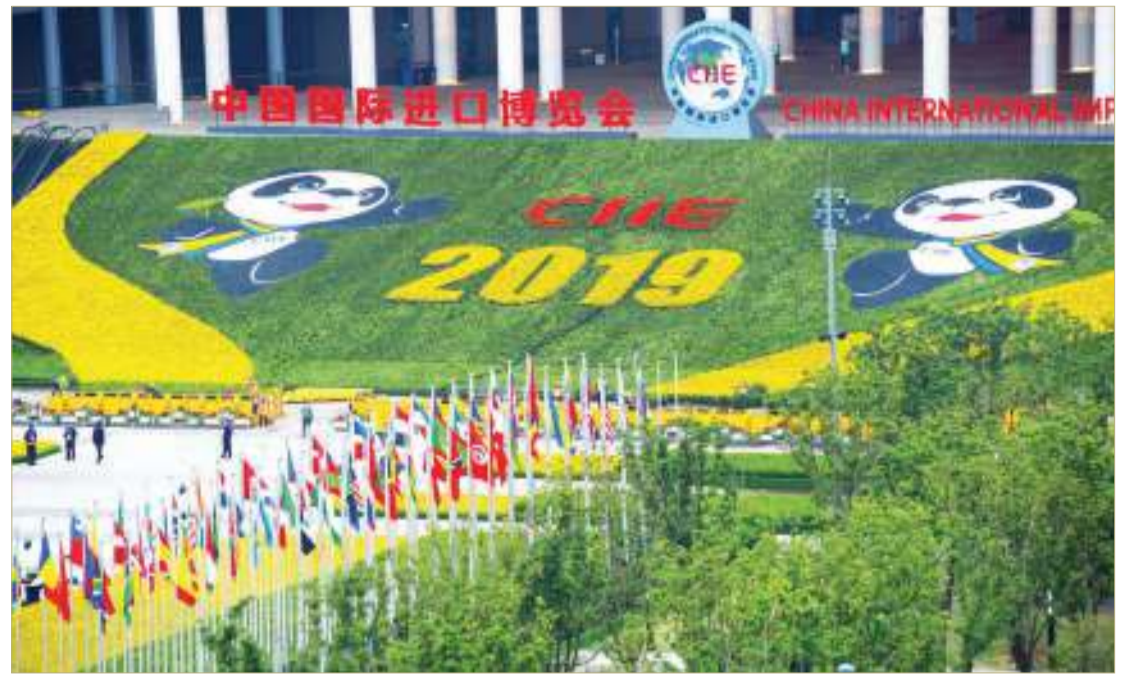
Photo taken on Oct. 26, 2019 shows the National Exhibition and Convention Center in Shanghai, the venue of the second China International Import Expo (CIIE).

During the first CIIE, Johnson & Johnson received many government delegations and signed Procurement Memorandums (PM) with more than 50 well-