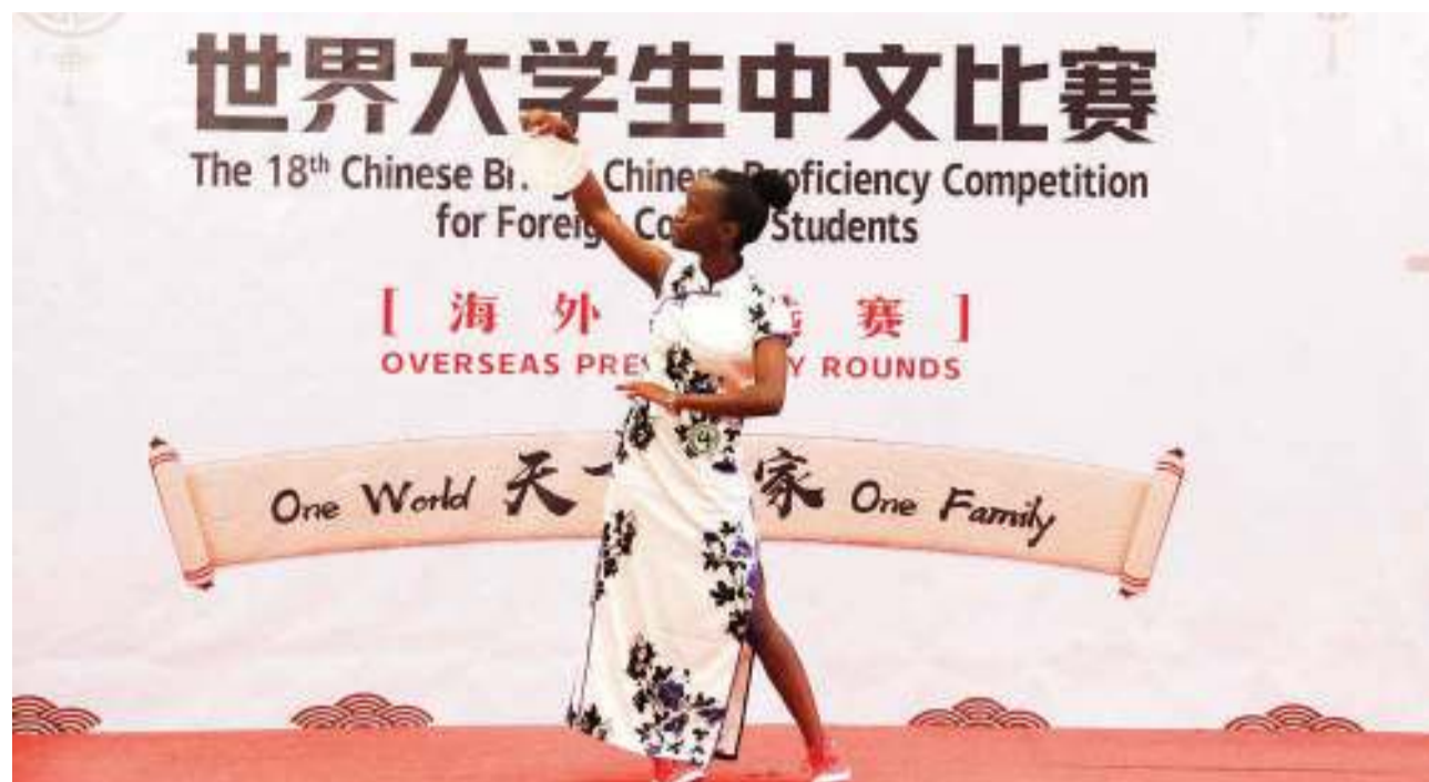
A student takes part in the 18th Chinese-Bridge Chinese Proficiency Competition for college students in Windhoek, capital of Namibia, April 23, 2019.

The growing popularity of the Chinese language among Uganda's youths and the working population has inspired policymakers to include it in the national curriculum for schools.