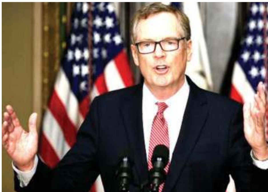
US Trade Representative Robert Lighthizer.

However, Washington has defied those rulings and continued to employ this method of calculation be-