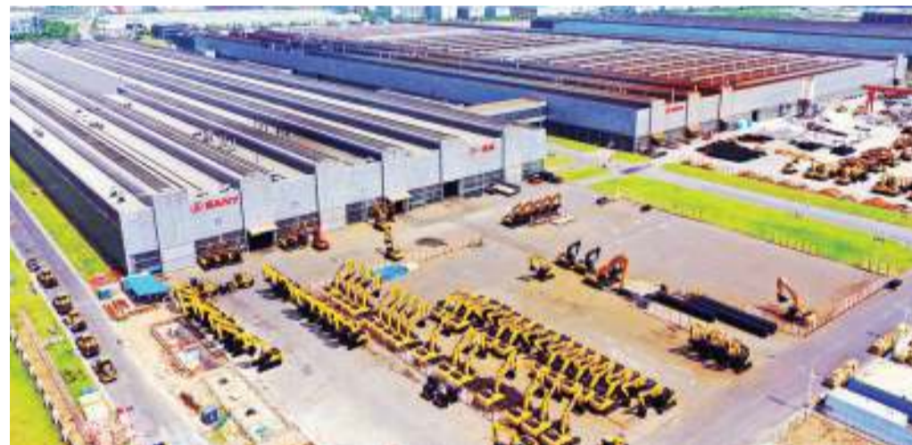
Aerial photo taken on Jun. 8, 2019 shows the new Lingang area of the China (Shanghai) Pilot Free Trade Zone.

As he pointed out, the trade war and unprecedented tariff increases have undermined the WTO rules and the international law, hindered the stable growth of world economy, and