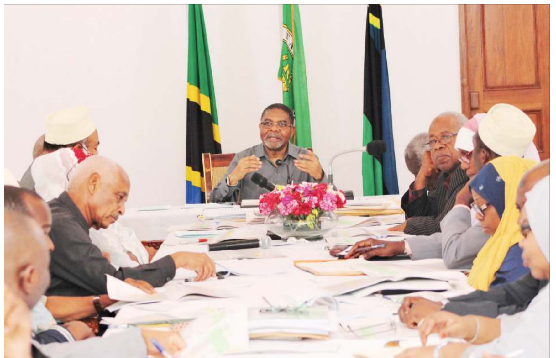
Zanzibar President Dr Ali Mohamed Shein chairs a meeting with senior officials of the Isles Information, Tourism and Antiquities ministry yesterday.

The organisation involves over a million activists, chefs, experts, youth, farmers, fishers and academics in over 160 countries.