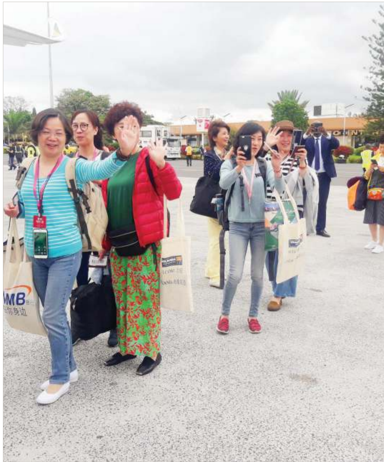
Chinese tourists in jovial mood as they head for their flight back home yesterday at the Kilimanjaro International Airport yesterday.