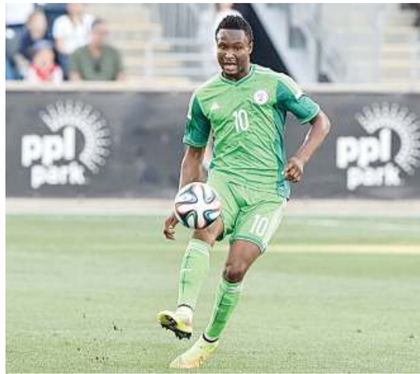
John Obi Mikel.