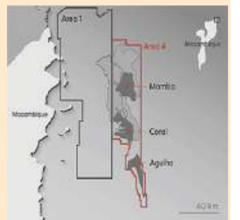
Area 4, in Rovuma Basin, Mozambique.

Eni Rovuma Basin will lead construction and operation of upstream facilities on behalf of MRV and ExxonMobil Mozambique Limitada will lead construction and operation of natural gas liquefaction and related facilities.