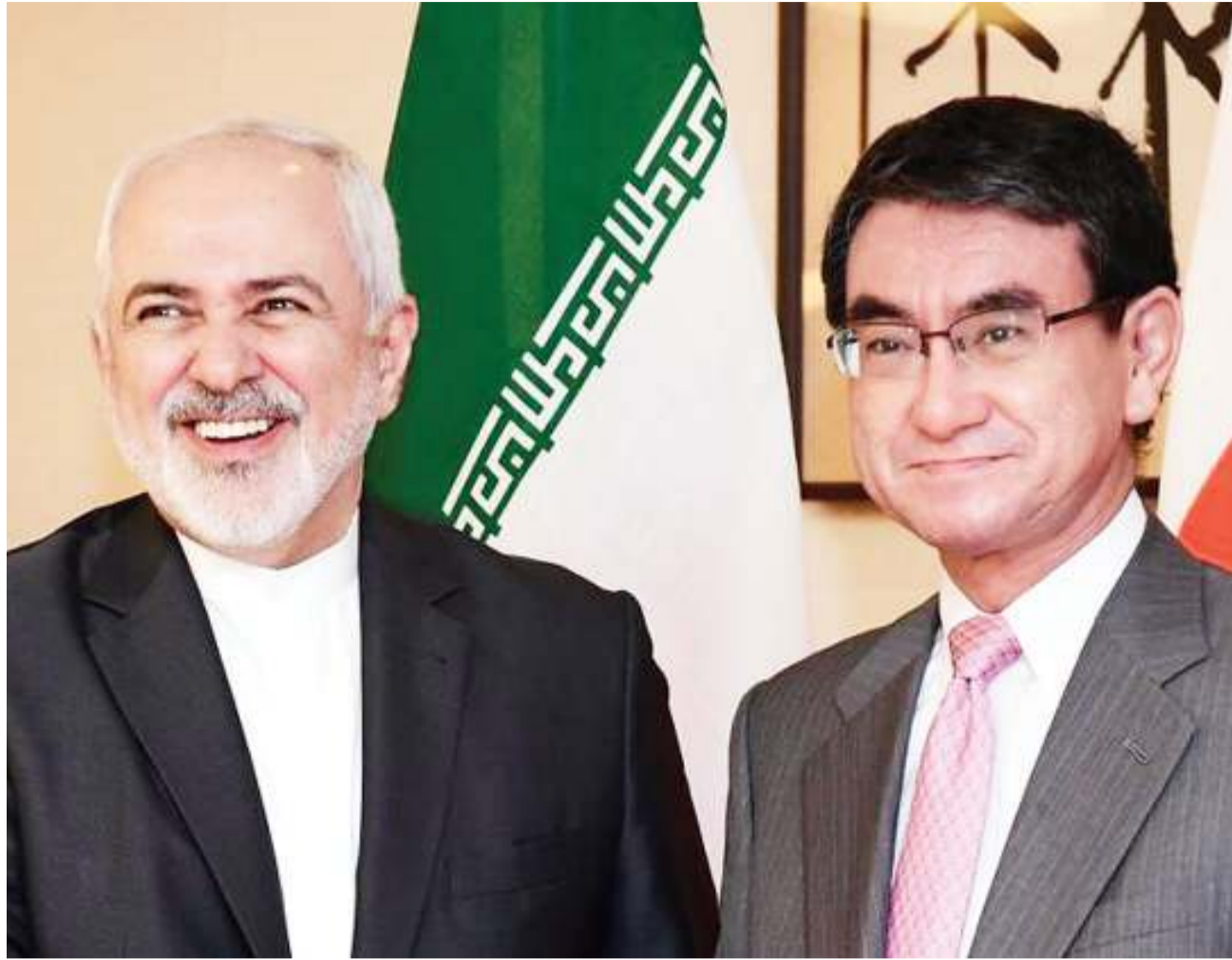
Iranian Foreign Minister Mohammad Javad Zarif (left) and his Japanese counterpart Taro Kono pose for the media prior to their talks at the foreign minister's audience room in Tokyo yesterday.

In Russia, the Kremlin said Wednesday that US pressure on Iran has forced Tehran to suspend the implementation of the JCPOA, reports Xinhua.