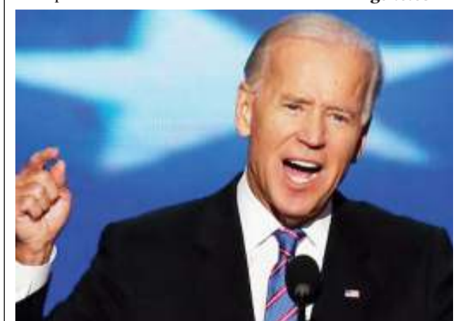
Former US Vice President Joe Biden

Respondents were asked to pick from 23 potential Democratic nominees, including New York City Mayor Bill de Blasio, who was expected to jump into the race yesterday. Agencies