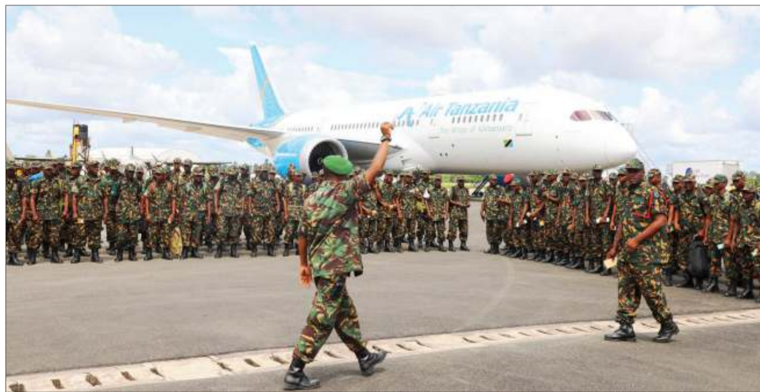
Tanzania People's Defence Forces officers and soldiers pictured shortly before departure from Julius Nyerere International Airport in Dar es Salaam yesterday by Air Tanzania Company Limited flight for peacekeeping mission in Darfur, Sudan. Story on Page 4

In an effort to alleviate the challenges and ensure the targeted groups of people get the desired medical services, the government has come up with Health Sector Financing strategy under which a single national health Insurance format would soon be established