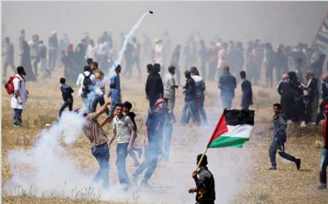
A Palestinian demonstrator hurls back a tear gas canister fired by Israeli forces during a protest marking the 71st anniversary of the 'Nakba', or catastrophe, when hundreds of thousands fled or were forced from their homes in the war surrounding Israel's independence in 1948, at the Israel-Gaza border fence, in the southern Gaza Strip on Wednesday.

In 1948, 957,000 Palestinians, 66 percent of the total popula-