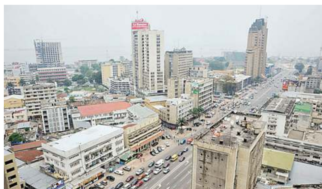
Africa's megacities includes Kinshasa in DRC.

He adds that "proper urban planning requires significant upfront investment" and that "local governments also need to harness the potential of these rapidly growing cities by making strides to formalise the economy."