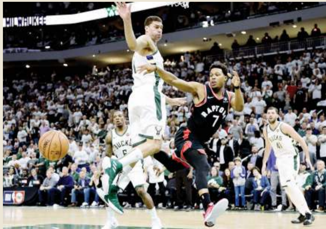
Toronto Raptors guard Kyle Lowry (7) passes the ball under pressure from Milwaukee Bucks forward Nikola Mirotic (41) during the second half in Game 1 of the NBA basketball playoffs Eastern Conference final in Milwaukee on Wednesday, May 15, 2019.

Kawhi Leonard scored 31 points and Kyle Lowry added 30 for the Raptors, who led by as many as 13 early and took an 83-76 lead into