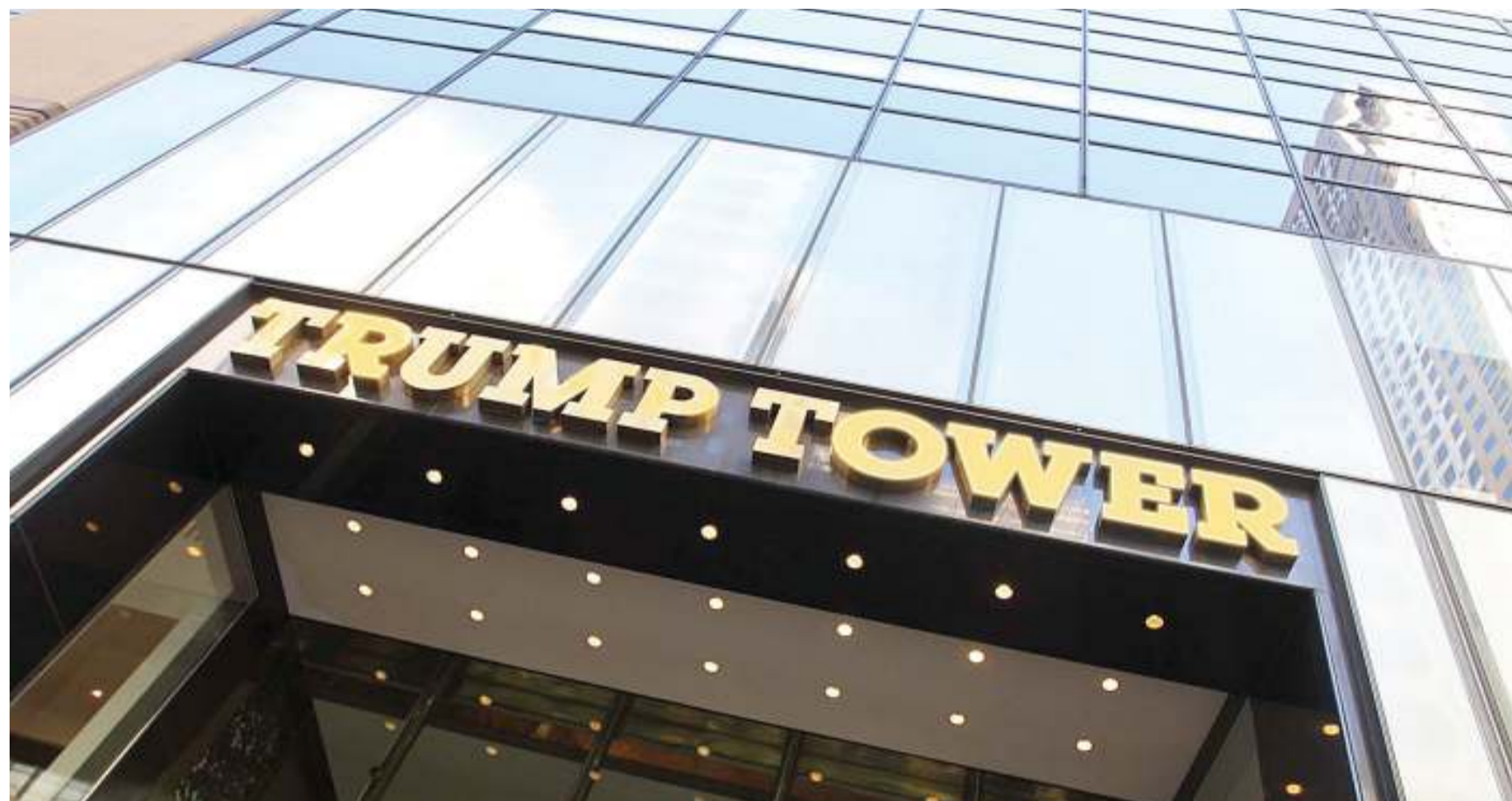
Trump Tower in downtown Manhattan.

the number of government and Trump Organisation security personnel rivaled the number of other people inside the building's atrium.