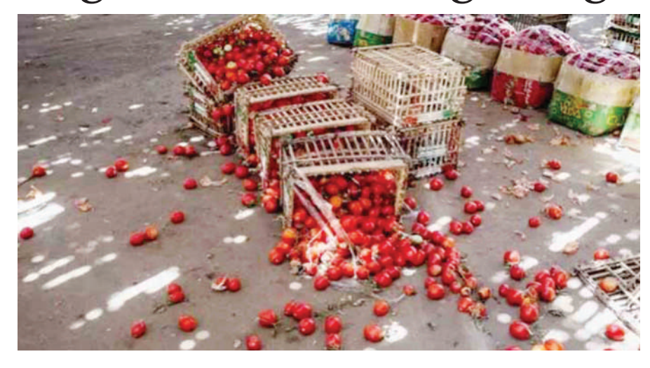
Controlling the loss and waste of food is a crucial factor in reaching the goal of eradicating hunger in the world.

For its part, the United Nations, on the occasion of this year's International Day of Awareness on Food Loss and Waste Reduction, on 29 September, reports that reducing food losses and waste is