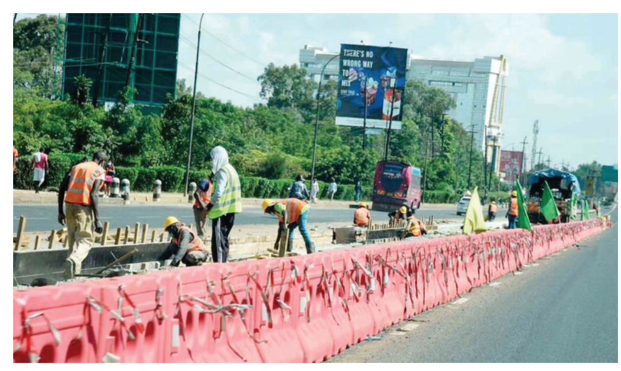
Road works for the Bus Rapid Transport (BRT) Station under construction along Thika Road Superhighway PHOTO |

bus rapid transport (BRT) to be launched in June along Thika