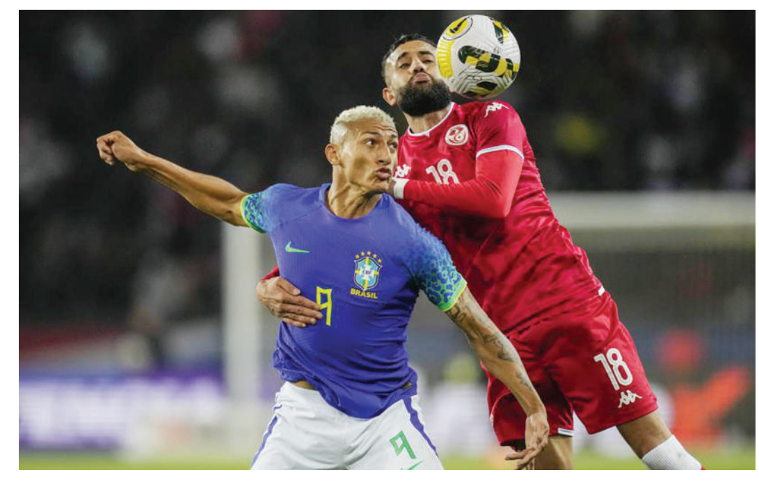
Tunisia's Ghaylen Chaaleli, right, duels for the ball with Brazil's Richarlison during the international friendly soccer match between Brazil and Tunisia at the Parc des Princes stadium in Paris, France, Tuesday, Sept. 27, 2022.

The Tottenham striker later tweeted: "As long as it's 'blah blah blah' and they don't punish, it will continue like this, happening every day and everywhere. No