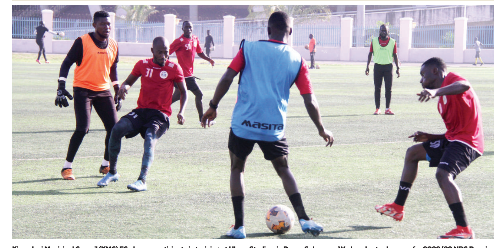
Kinondoni Municipal Council (KMC) FC players participate in training at Uhuru Stadium in Dar es Salaam on Wednesday to shape up for 2022/23 NBC Premier League.

The disjointed performance may be down to a lack of chemistry as a result of inadequate preparation time.