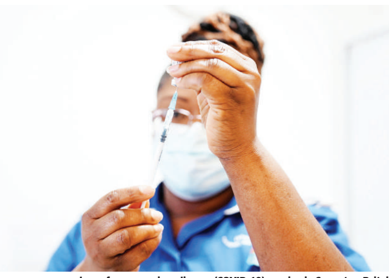
A nurse prepares a dose of a coronavirus disease (COVID-19) vaccine in Coventry, Britain, April 22, 2022. File photo

Around 33 million people in the UK are eligible for a free flu vaccine this fall, and around 26 million of those people believed to have contributed to around are also eligible for a COVID-19 booster that it was "vital" that those most at