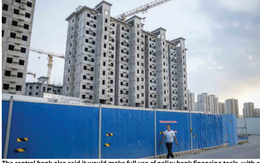
The central bank also said it would make full use of policy bank financing tools, with an emphasis on supporting infrastructure development

While the economy looks to have rebounded from the April-June period, when the lockdowns of Shanghai, Jilin province and other major economic