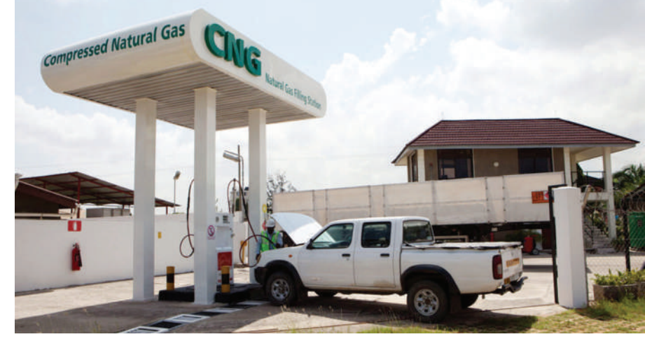
A CNG filling station

He said the use of gas in vehicles and industries