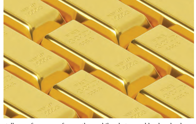
stellar performance of more than hike bets could already have 20% over the past three months, been at play and having found the some positioning for softer rate- much-needed validation from the

recent FOMC meeting," said Yeap Jun Rong, a market analyst at IG.