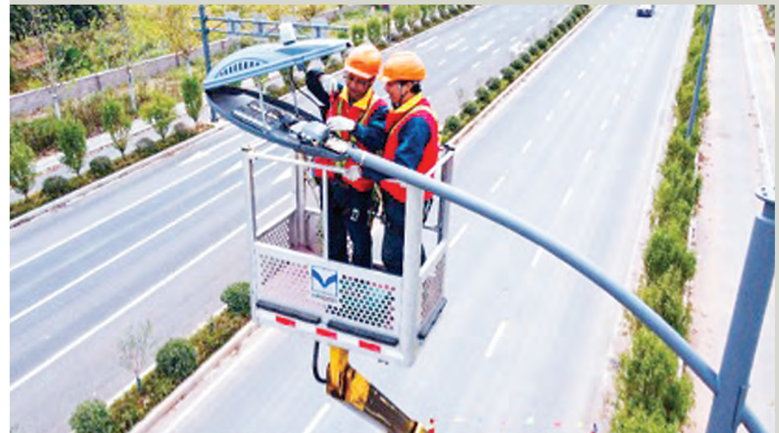
Technicians install a smart street lamp in Jinyi New Area, Jinhua, east China's Zhejiang province, Oct. 11, 2022.

China's cellular IoT connections account for 70 percent of world's