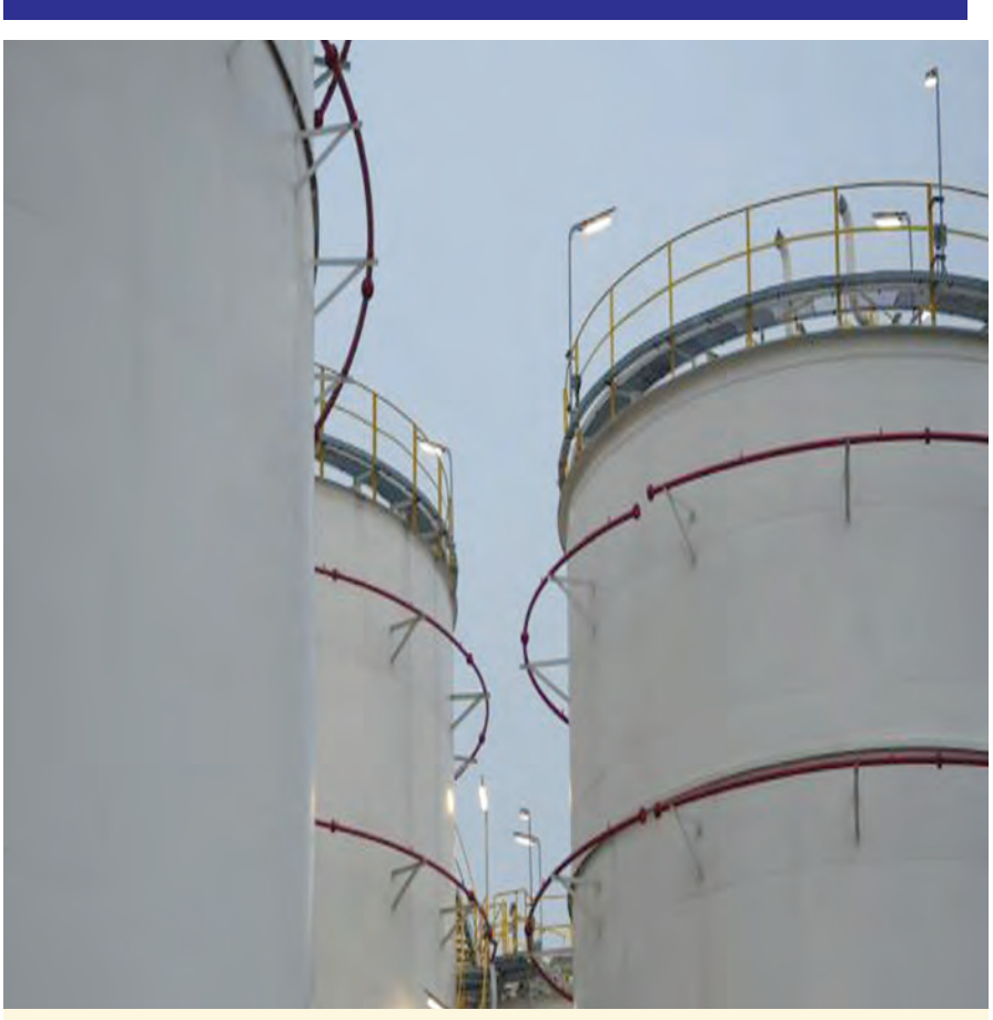
Pump jacks operate at sunset in an oil field