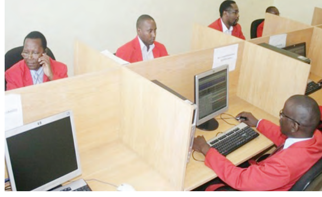
Stockbrokers participate in online share trading on DSE platform (File photo)

DSE was the second top gainer, after its share price recorded an increase of 3.53 percent to 1,760/-