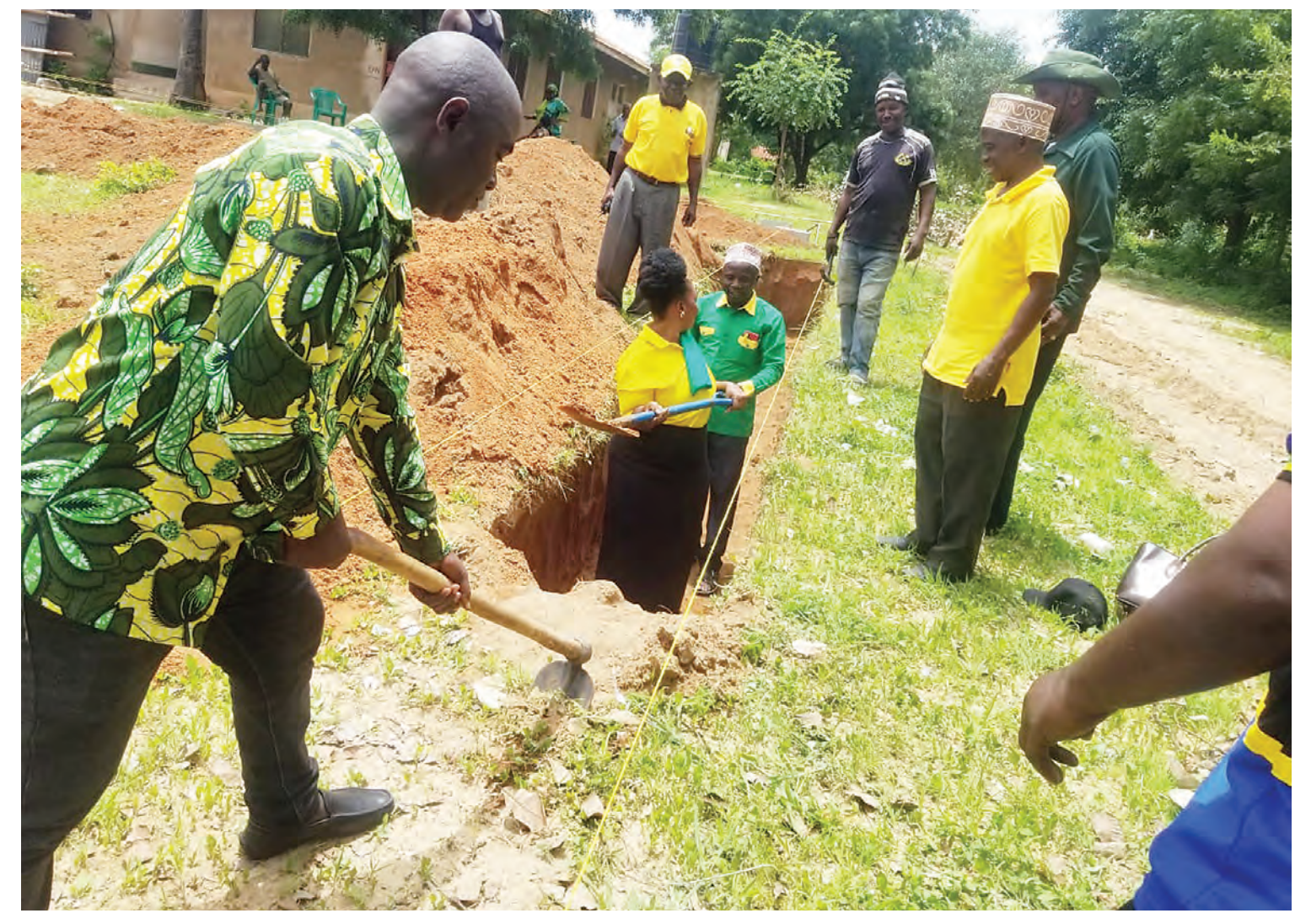
Liwale District CCM leaders and members pictured on Thursday participating in the initial stage of the construction of a modern hall as one of the strategic projects expected to boost the party economically.

In this issue, the councillor knows everything, but only trying to defend the parents, hence the police should collaborate with the district commissioner to hunt for the Ibwera ward councillor so that