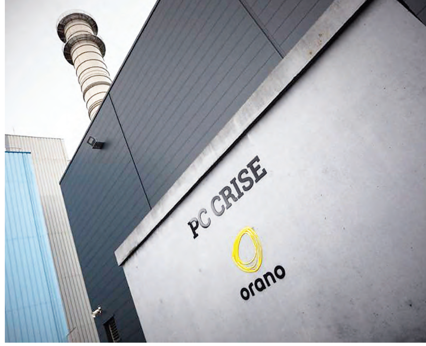
This photo taken on Dec 14, 2022 shows an outdoor view of the crisis unit at the Orano la Hague reprocessing plant, in La Hague, northwestern France, with the Orano logo on a facade.

Meanwhile, France's national agency for managing nuclear waste last month requested approval for a project to store permanently high-level radioactive waste.