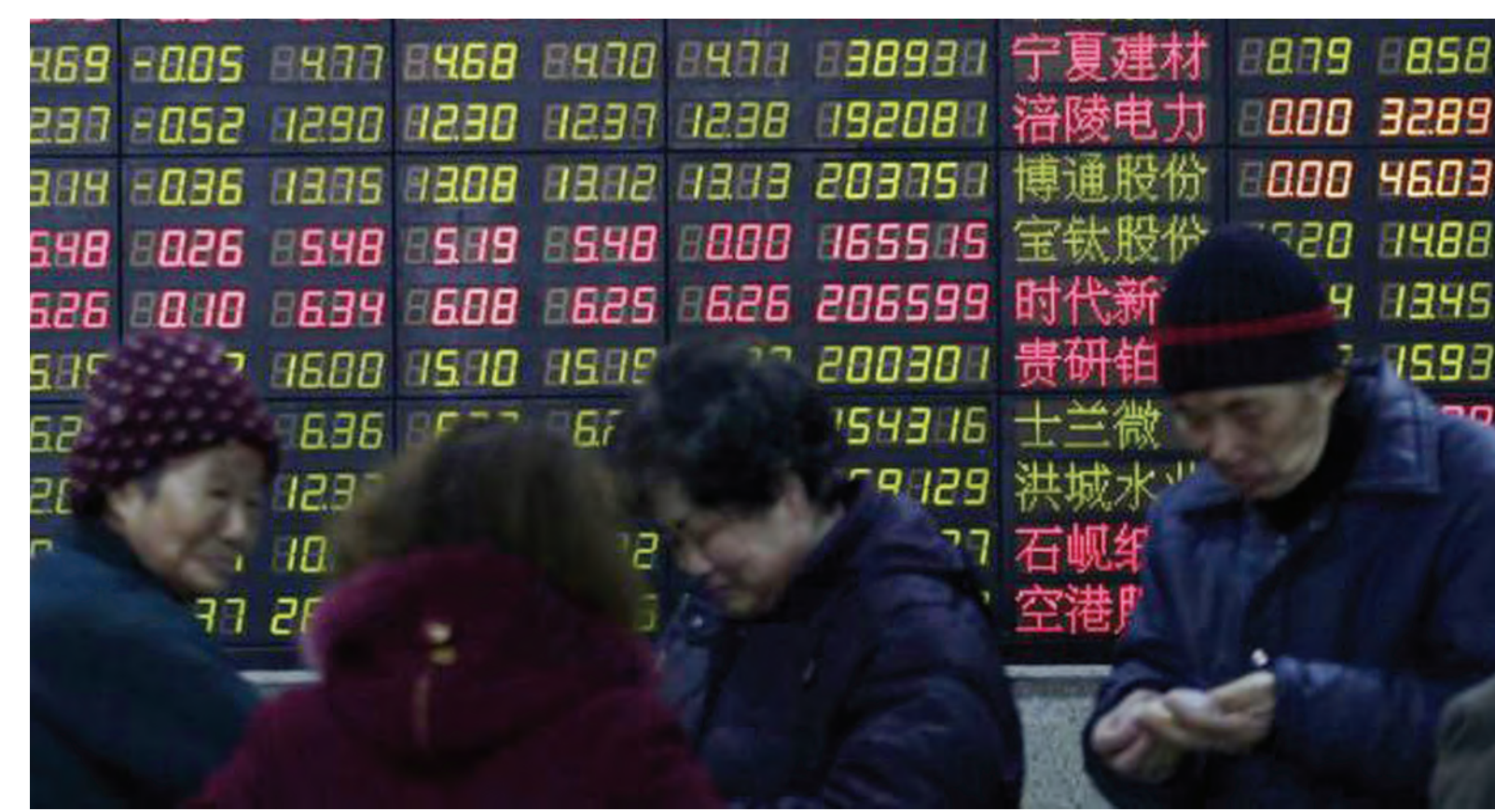
Investors stand in front of an electronic board showing stock information on the first trading day after the week-long Lunar New Year holiday at a brokerage house

"Under China's mechanism, the government dic-