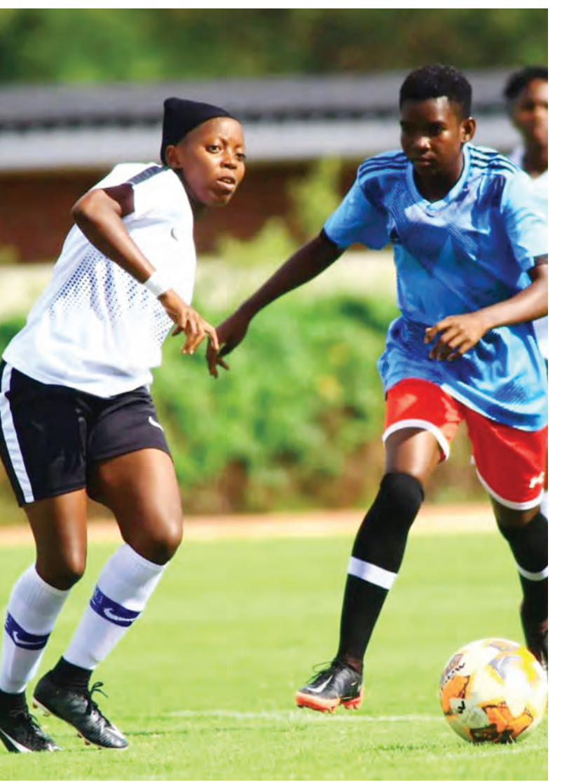
Arusha's The Tiger Queens player (L) challenges Lindi's Amani Queens footballer during this season's Serengeti Lite Women's Premier League clash which took place in Arusha recently. The Tiger Queens won 1-0.