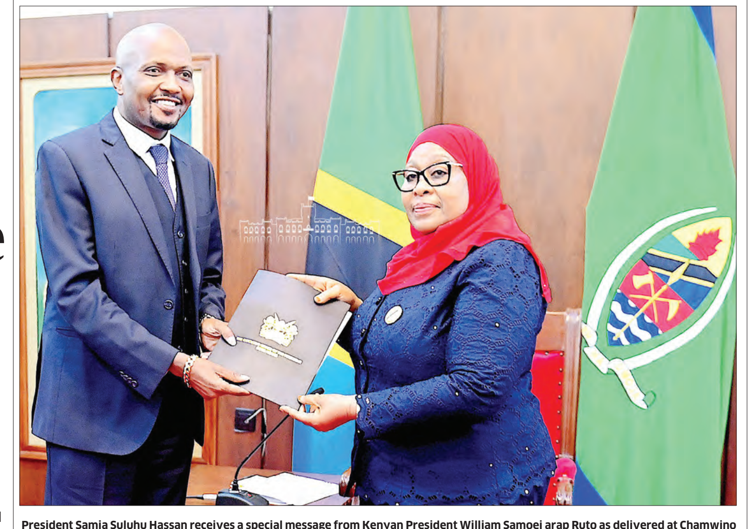
chiefly on ways to enhance cooperation between Tanzania and Kenya.