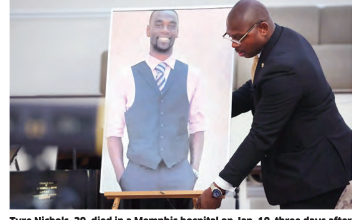
Tyre Nichols, 29, died in a Memphis hospital on Jan. 10, three days after he was beaten by officers during a traffic stop.

Mostly peaceful protests over police brutality were carried out around the country after the public release of body camera footage brought the police killing of Tyre Nichols in Memphis, Tennessee, into clearer picture. Nichols, a 29-year-old Black motorist,