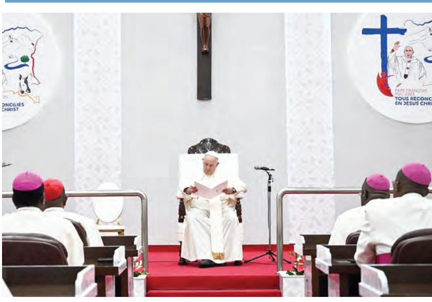
Pope Francis (center) attends a meeting with Bishops at the National Episcopal Conference

Eastern Congo has been plagued for decades by conflict driven in part by the struggle for control of deposits of diamonds, gold and other precious metals between the government, rebels and foreign invaders. The spillo-