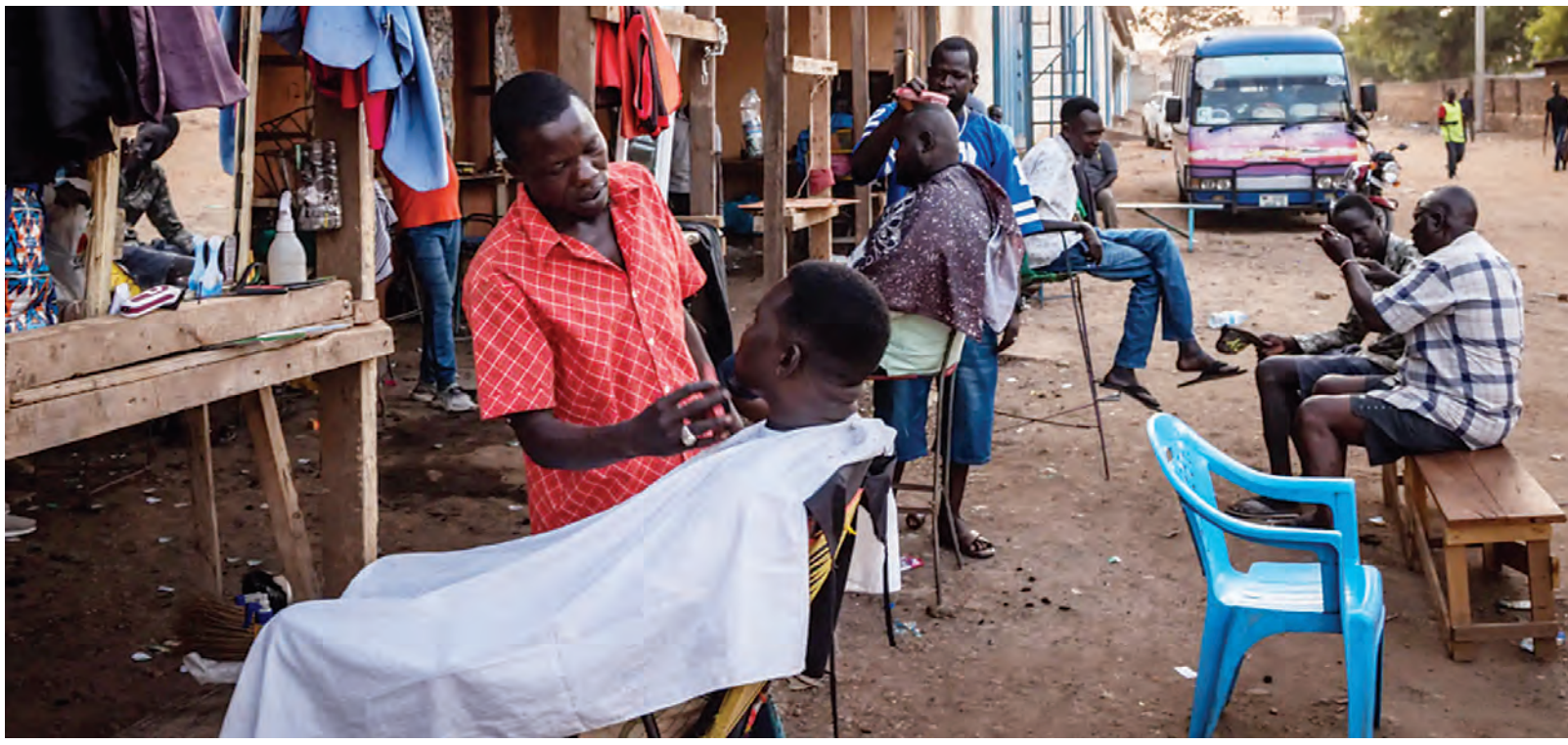
An outdoor barbershop in central Juba.