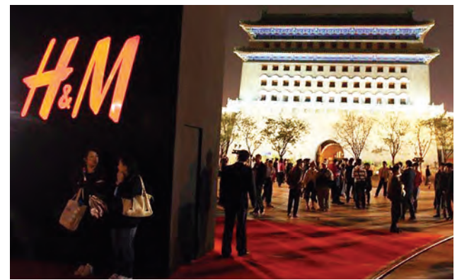
File photo taken on April 22, 2009 shows the giant signboard of Sweden's chic fashion chain store H&M on Qianmen Street in Beijing, capital of China.

Sales from March 1-28 were up 55 percent measured in local currencies. H&M said it would not propose a dividend at its annual general meeting but saw good prospects of one in the second half of the year.