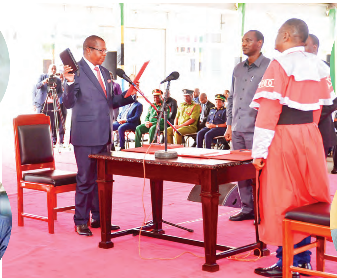
Chief Justice Prof Ibrahim Hamis Juma (R) swears in newly appointed Vice President Dr Philip Isidor Mpango at State House at Chamwino in Dodoma Region yesterday.