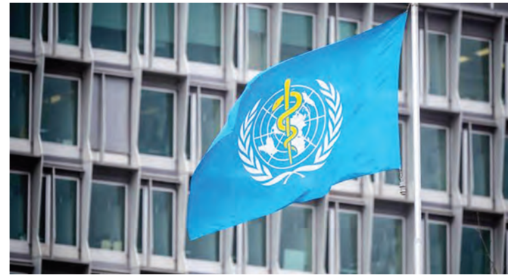
The flag of the World Health Organization (WHO) at the agency's headquarters in Geneva, Switzerland.

"Instead, we have COVID aiming for perhaps 27 percent by the end of the year if we possibly can manage it—that is simply not good enough." Agencies