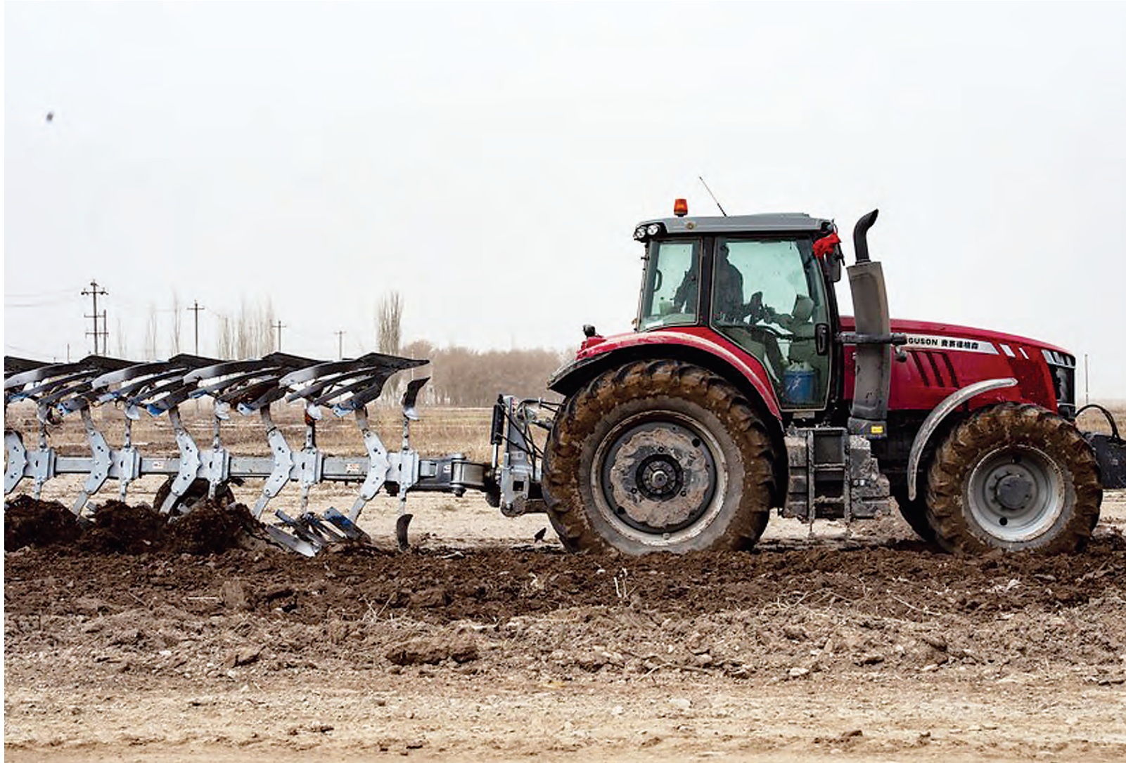
A farmer ploughs in a field with a tractor in Bachu County, northwest China's Xinjiang Uygur Autonomous Region, March 28, 2021.

But cotton-picking used to rely heavily on manual labor. When the harvesting season arrived, hundreds of thousands of migrant workers from China's labor abundant provinces such as Henan and Sichuan would take train trips to Xinjiang to join local residents in the manual picking of cotton, which was considered a well-paid job.