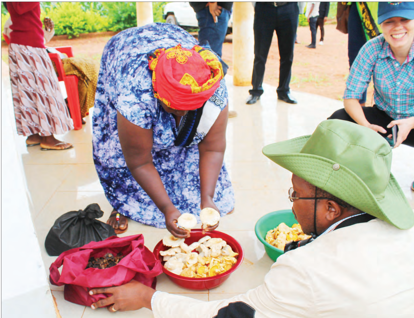
A resident of Peramiho in Ruvuma Region (L) sells mushrooms, as found yesterday.

UAE based Afriamco has been having close relations with China and India and was operating in 17 African countries.