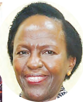
Amb Liberata Mulamula