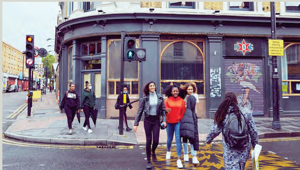
Pedestrians cross the junction of Coldharbour Lane and Atlantic Road in the Brixton district of London, UK, on July 1, 2020.

"The prime minister commissioned this report because he believed this was an extremely important issue for the country and that we want to tackle this, to go even further," Cabinet minister Robert Jenrick told Sky News Wednesday. "We're doing well as a country on the road