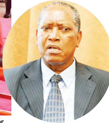
Prof Palamagamba Kabudi