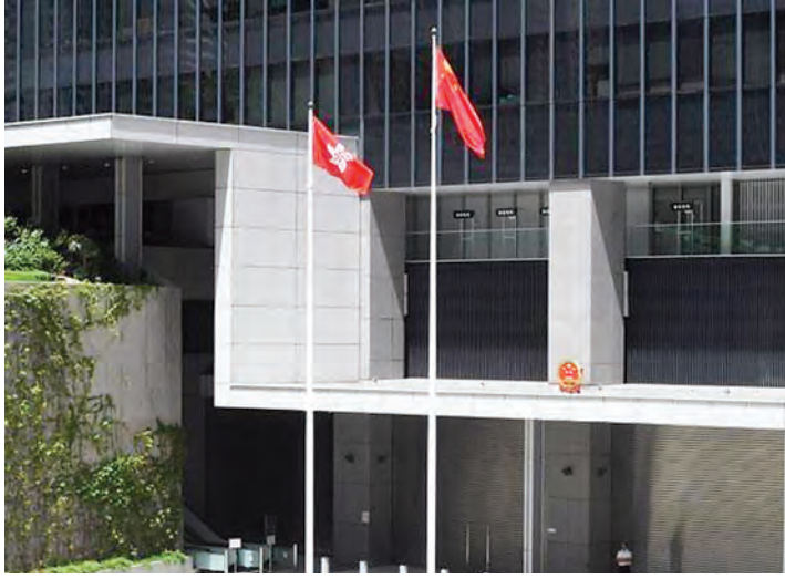
This photo dated Aug 8, 2017 shows the Central Government Offices in Tamar, Hong Kong.

Regarding judicial independence, the spokesperson said as enshrined under the Basic Law, Hong Kong courts can exercise independent judicial power, including that of final