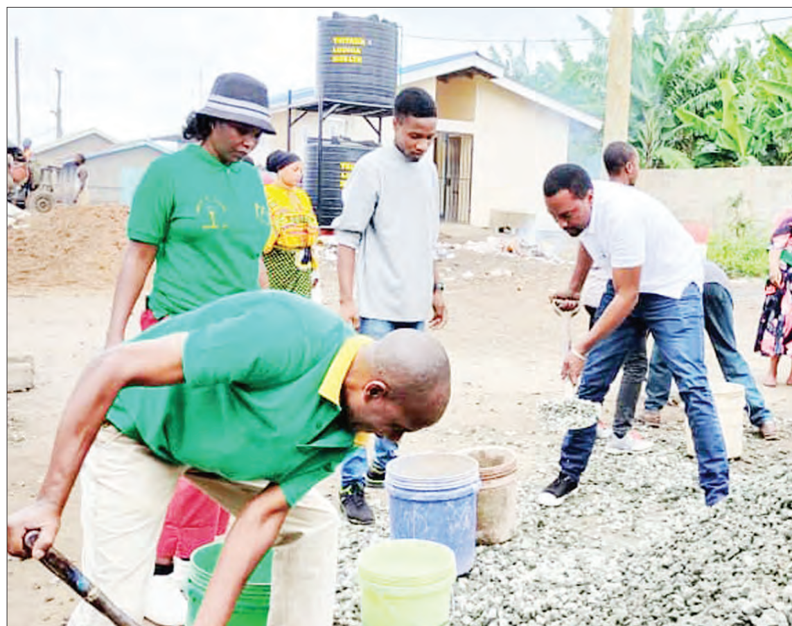
Members of the CCM parents organisation in Elerai division, Arusha District, participate in the construction of classrooms for Osunyai Primary School on self-help basis yesterday.

These variants are rapidly becoming dominant in many parts of the world, replacing other versions of the virus.