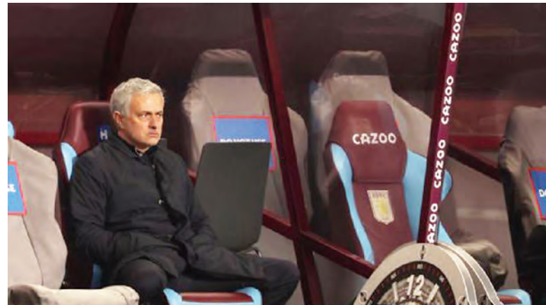
Mourinho's teams always start strong before tailing away. Is the same happening at Tottenham, but at a much quicker rate than at past stops in the Special One's career?

play out, it is perhaps worthwhile to look at how Mourinho teams take shape statistically, where Spurs have lacked to date and what things tend to look like when his tenures fall apart.