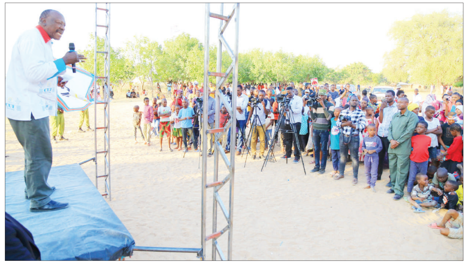
Civic United Front presidential candidate Prof Ibrahim Lipumba addresses a campaign rally at Dodoma's Medeli Primary School grounds yesterday.