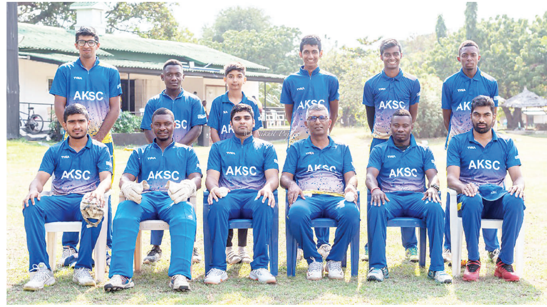
Aga Khan A team's cricketers in group picture ahead of one of their encounters in the 2020 Kazim Nasser Memorial League (KNML)'s Division A, which took place in Dar es Salaam recently.