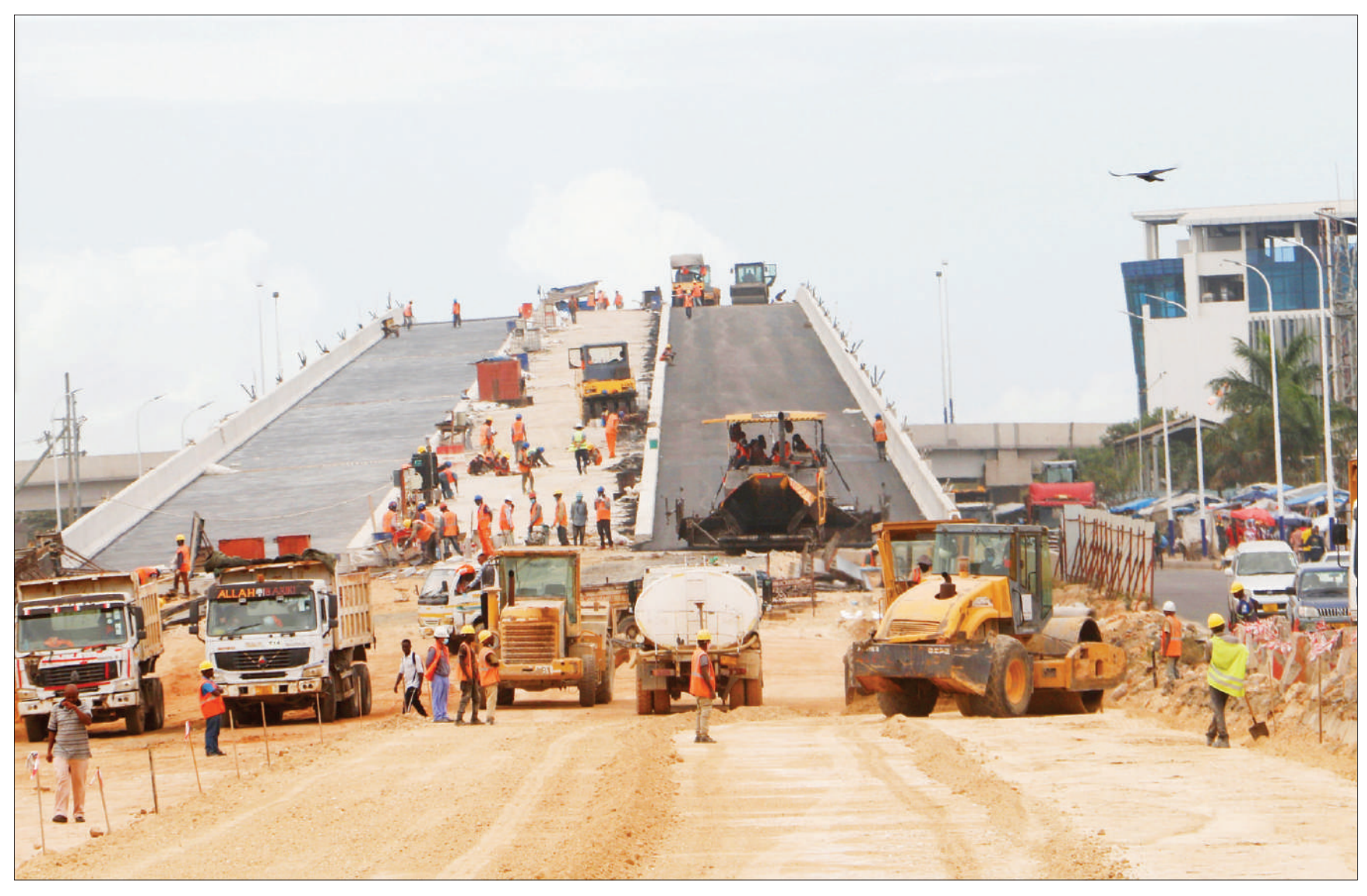
Work well in progress on the Ubungo interchange at the Morogoro Road/Mandela Road/Sam Nujoma Road intersection in Dar es Salaam yesterday. Photo: