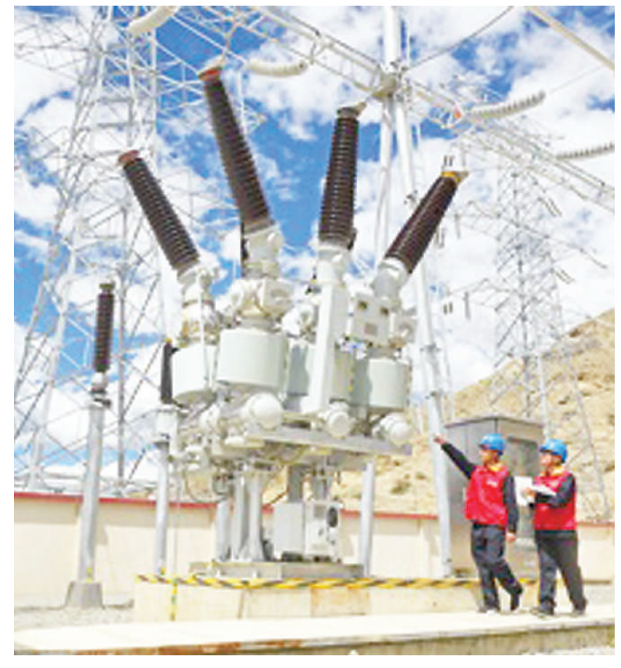
Staff workers with the State Grid Anhui Electric Power Co., Ltd. conduct inspection on power supply equipment in Zhanang county, Shannan, southwest China's Tibet autonomous region, in preparation for the peak demand for electricity in summer, June 17. File photo

Based on a systematic review of more than 20 years of experience in aiding Tibet, they focused efforts on identifying the region's weak links in development, and proposed five major projects involving such ideas as development of endogenous power, targeted assistance, partner assistance, and revitalization of Tibet.