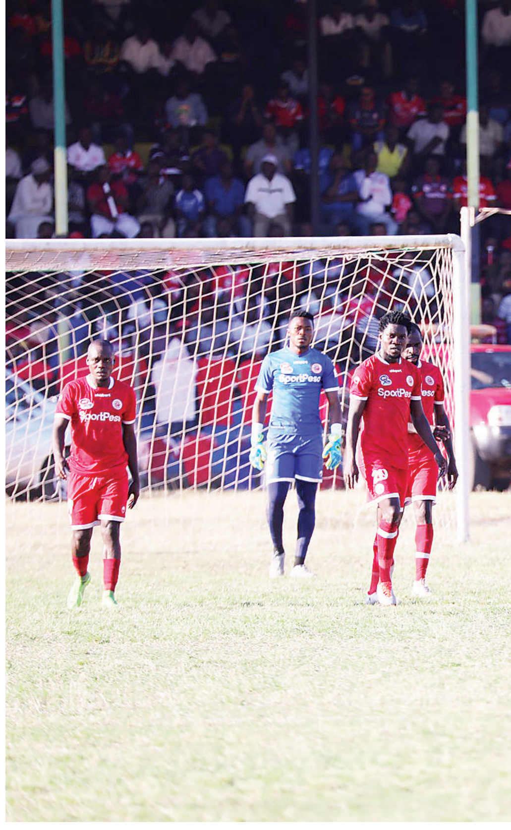
Simba SC players react after conceding an equalizer when the outfit locked horns with Mtibwa Sugar in Vodacom Premier League clash at the Jamhuri Stadium in Morogoro last weekend. The clash ended in 1-1 draw.