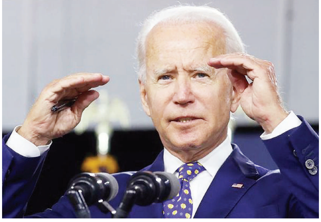
US Democratic presidential nominee Joe Bide

Biden has incorporated his climate plan into his economic vision, viewing it as a way to create jobs. With a