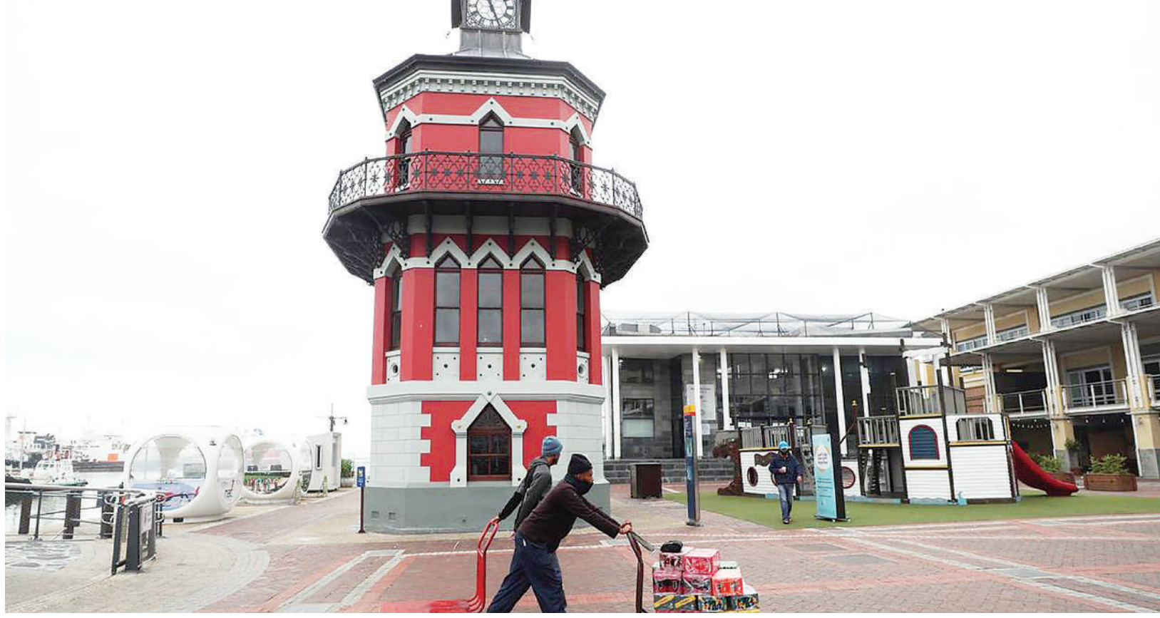
Workers prepare to reopen restaurants in Cape Town.

The lockdown that followed included a ban on international arrivals, the shutdown of most busi-