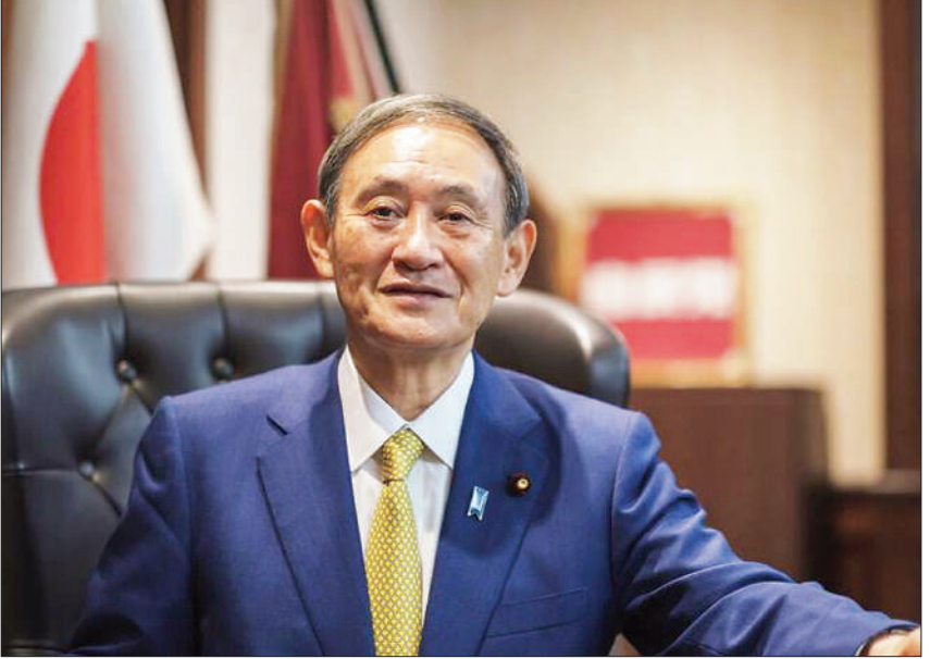
Newly elected head of Japan's ruling Liberal Democratic Party, Yoshihide Suga, poses for photos following his press conference at LDP's headquarters after the party's leadership election in Tokyo, Japan, on Monday.

"We will do everything we can to secure the vaccines and the medications to protect the people's lives