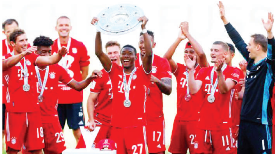
Bayern Munich's dominance of the Bundesliga belies the competitive nature of the German top flight.

- Fourteen Bundesliga teams averaged more than three combined goals (for and against) per match.