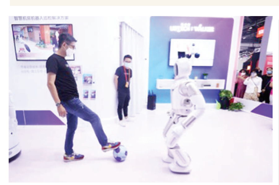
A staff worker plays football with a robot in the comprehensive exhibition area of the 2020 China International Fair for Trade in Services (CIFTIS), September 6.