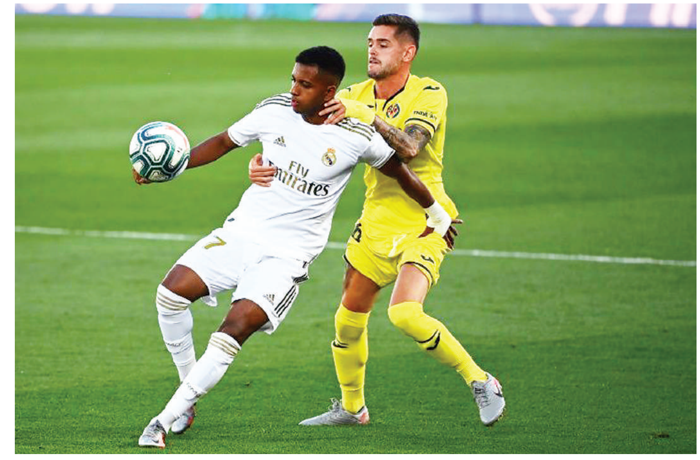
Rodrygo (L) scored seven times in 26 games for Real Madrid in his first season at the club.

The slump comes at the worst possible time for Brazilian clubs, which were already struggling with heavy debt. Now, they are also reeling from the economic fallout of Covid-19 in the country that has the second-highest death toll worldwide, after the United States.