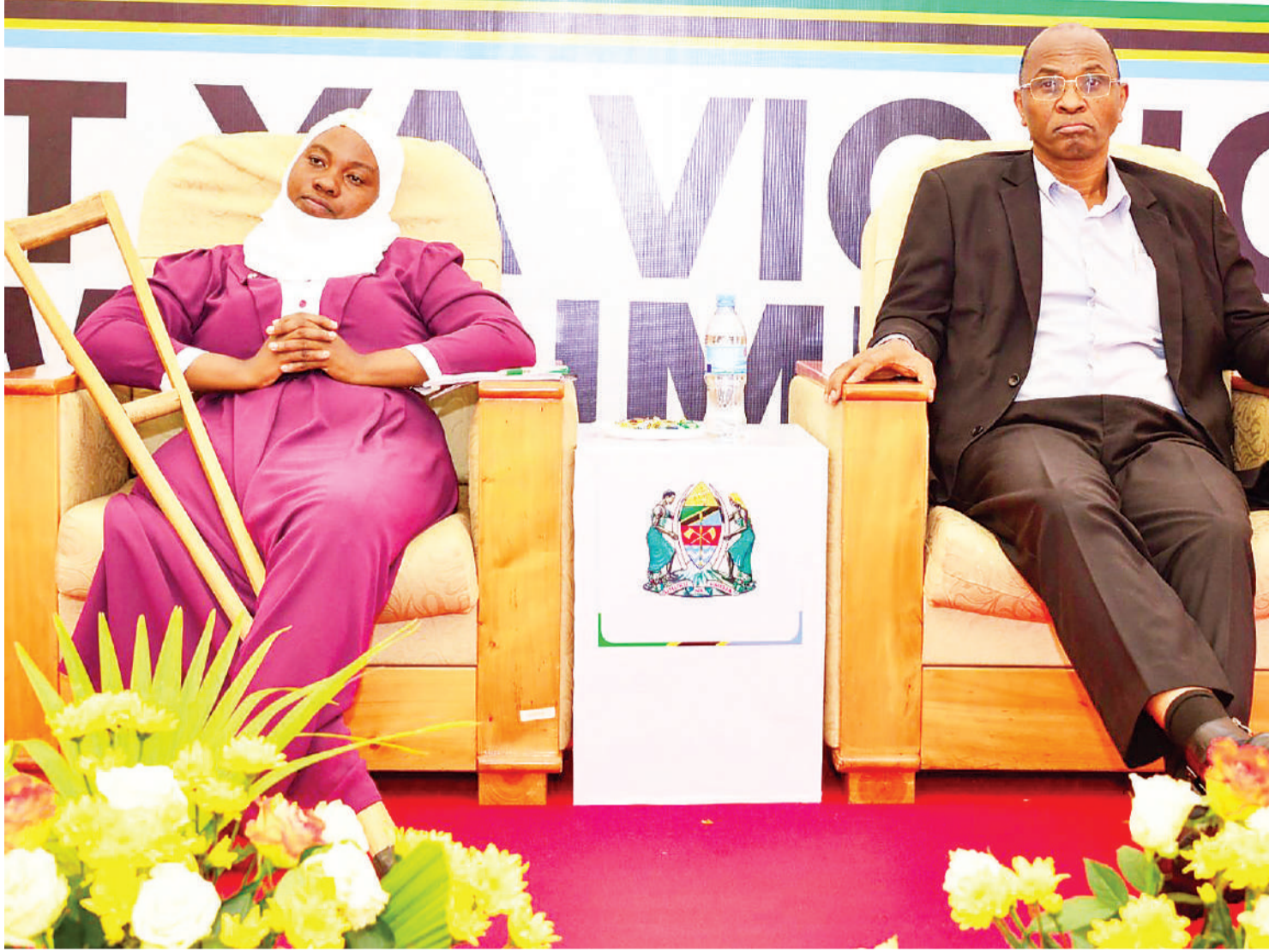
Ummu Nderiananga (L), Deputy Minister of State in the Prime Minister's Office (Policy, Parliament and Coordination), follows presentations at a meeting for PMO officers and other staff held in Arusha city on Friday.