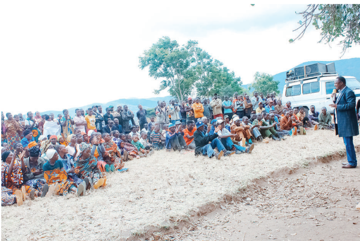
George Simbachawene, Minister of State in the President's Office (Public Service Management and Good Governance) and Kibakwe legislator, addresses a rally in the constituency's Galigali ward at the weekend.

"China-Africa investments need to find or rather align with the 2063 Africa development agenda and specifically the national development strategy. The Chinese government is looking forward to cooperation with African countries," he said.