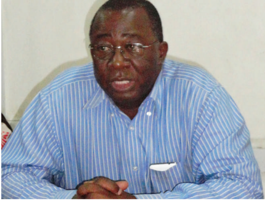
Tanzania Olympic Committee (TOC) vice-president, Henry Tandau.