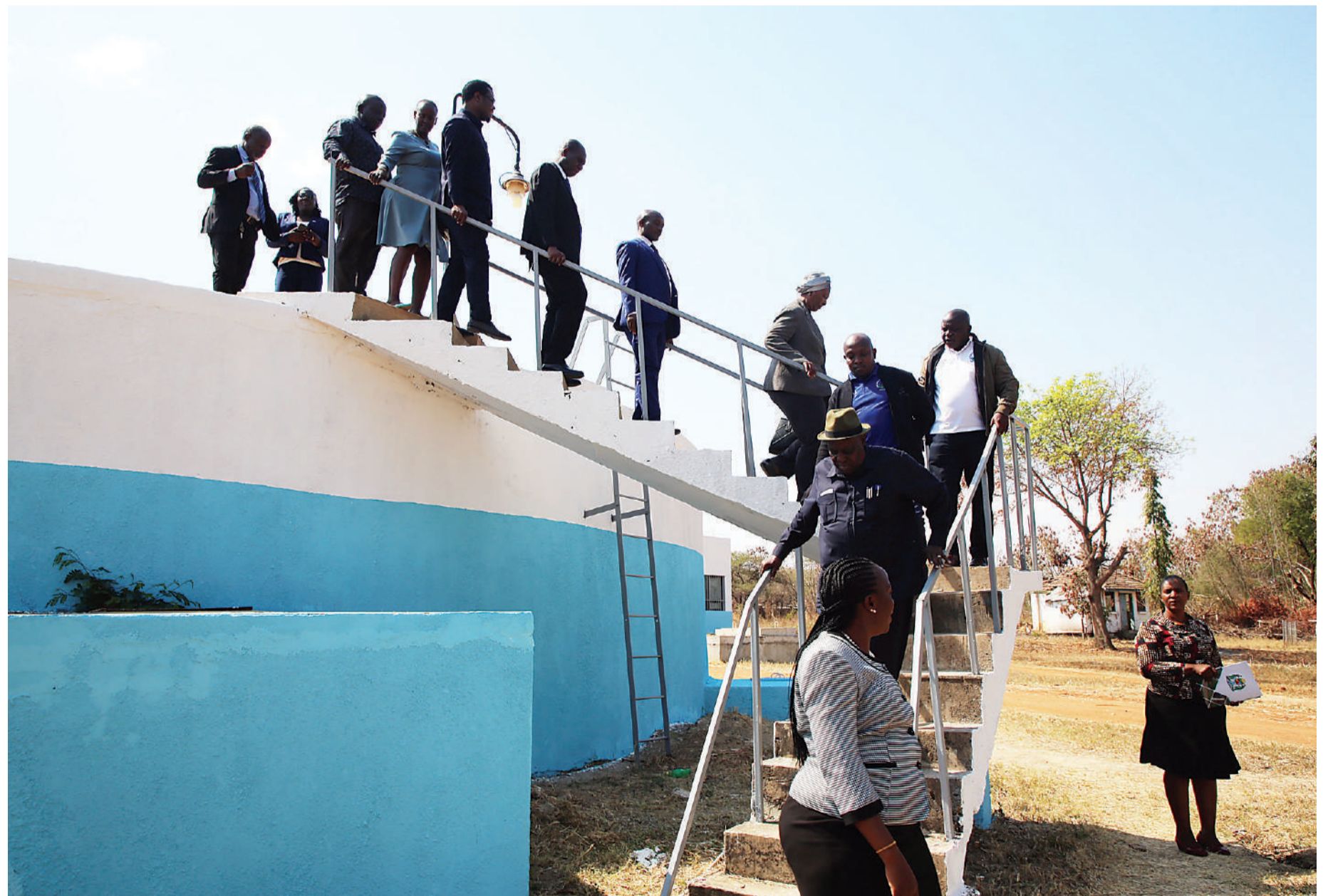
Dodoma Urban Water Supply and Sanitation Authority officials tour a reservoir at the Mzakwe water source yesterday. Mzakwe well-field is located in Dodoma Urban District's Makutupora ward, some 27 kilometres north of Dodoma city, and has for long stood as the national capital's main source of water supply.

Mwakilema also called on Tanzanians to visit these tourist attractions to learn about various things, and to make various products to sell to visiting tourists to earn income for themselves.