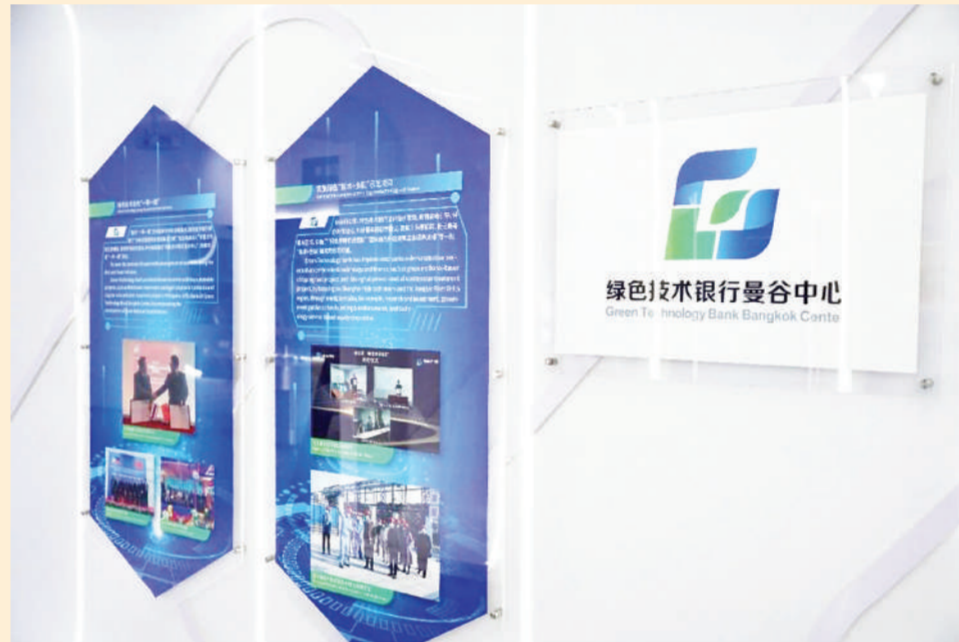
Photo shows display boards at the Green Technology Bank Bangkok Center.

"This year we will accelerate the application of proton therapy at the Ramathibodi