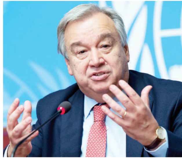
UN Secretary-General Antonio Guterres