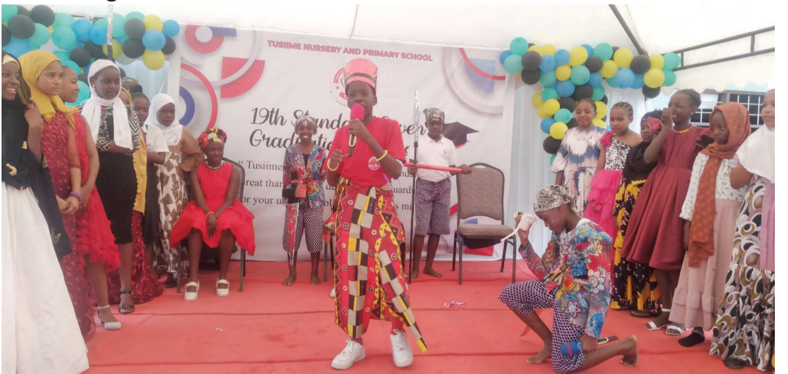
Tusiime Primary School's pupils, whose school is located at Tabata, Dar es Salaam perform the Cinderella musical during the 19th graduation ceremony held at the school's premises last weekend.