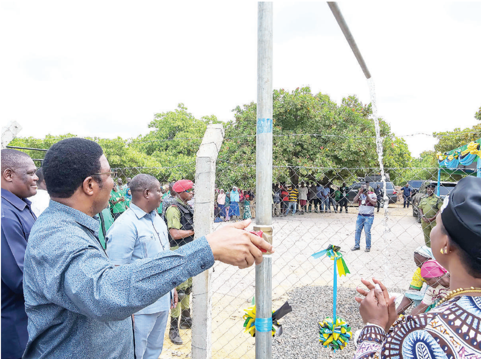
Prime Minister Kassim Majaliwa turns on a tap yesterday to launch Kitama water project in Mtwara Region. Right is Water deputy minister Maryprisca Mahundi.