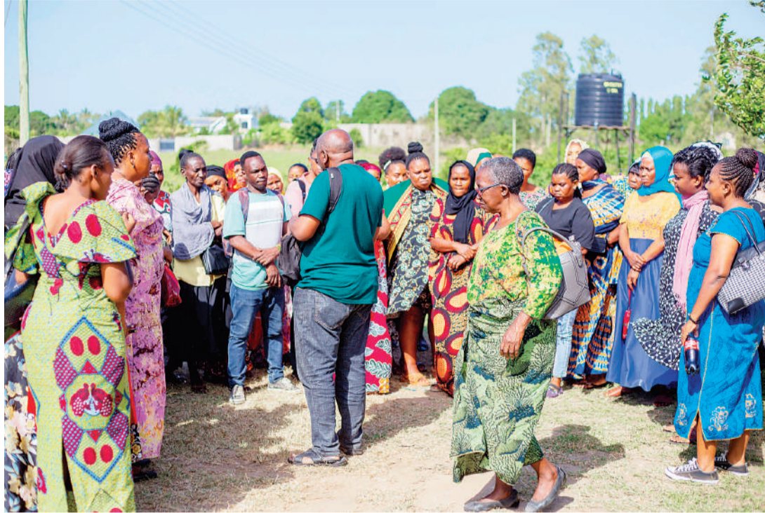
Participants were taught on how to prepare compost manure, poultry farming, and urban farming.