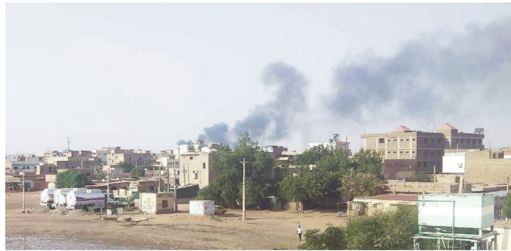
Smoke rises over Khartoum, Sudan, June 23, 2023.

In Nyala, one of the country's largest cities and capital of South Darfur, clashes have continued since Thursday in residential areas, according to witnesses. At least 20 people have been killed, medical sources said. The United Nations says 5,000 families have been displaced, and