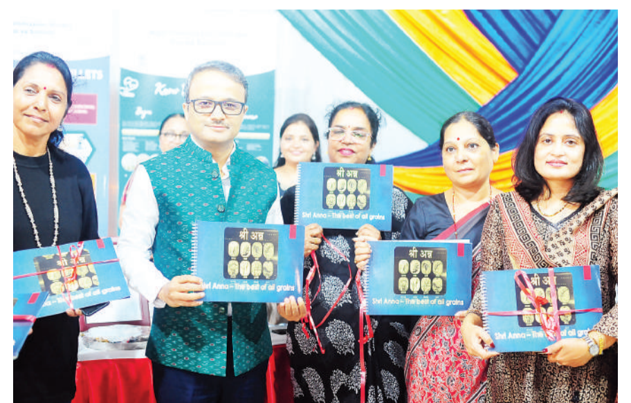
India's High Commissioner to Tanzania, Binaya Pradhan (2ND L) in a group photo with Dar Indian Women's Association (DIWA) members showing books on various different types of millets at Swami Vivekananda Cultural in Dar es Salaam.

We are now embarking on a new campaign to promote millet crops in Tanzania, because 2023 is an International Year of Millets proclaimed by Food and Agricultural Organization and the United Nations (UN)