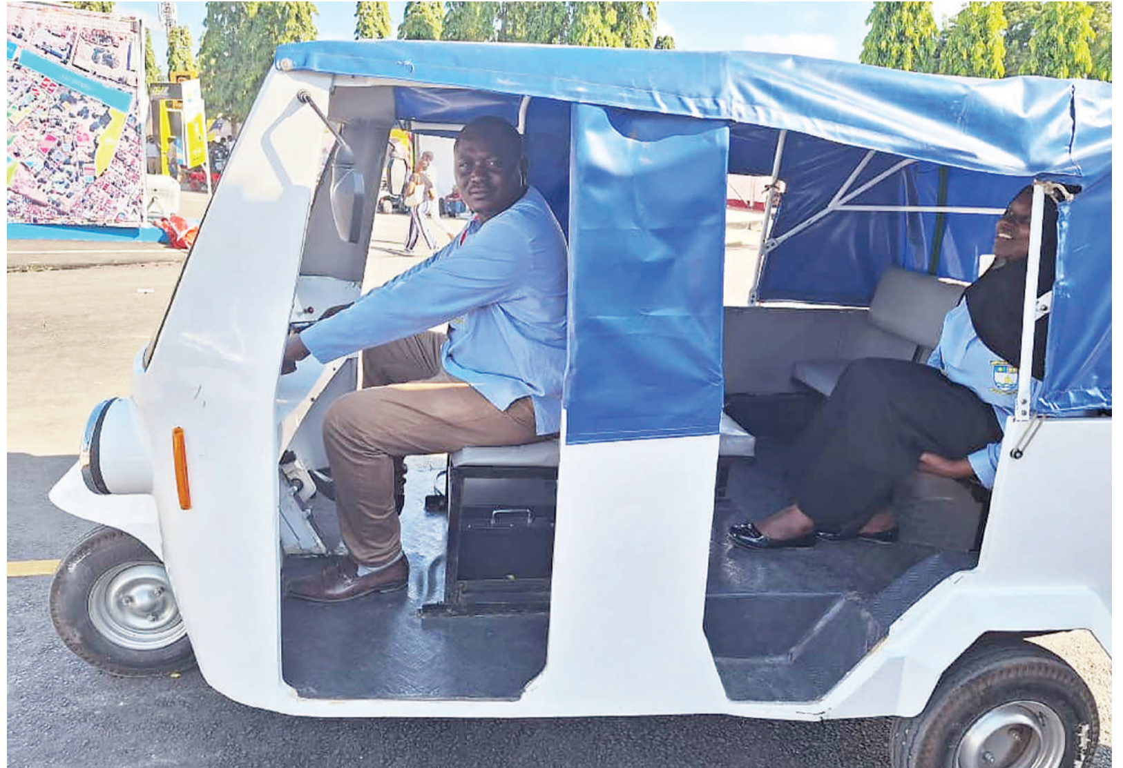
A new designed electric tricycle by experts at the Dar es Salaam Institute of Technology (DIT)

rently experiencing rapid changes in science and technology, adopting the innovations in various sectors including transport was a matter of paramount importance so as to align with the development.