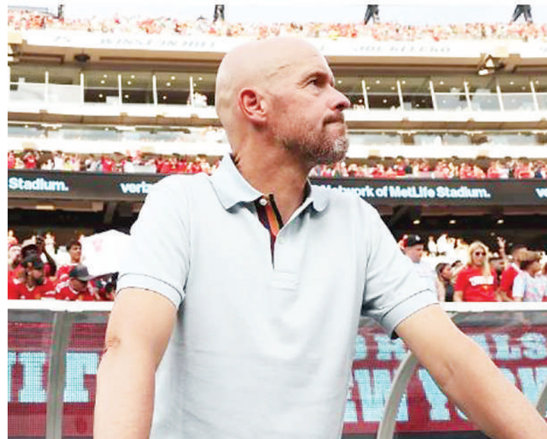
Erik ten Hag has switched up Manchester United's captaincy and is set to announce a new senior players group.

Ten Hag - who has talked about his side "raising the bar" next season - was delighted with United's performance against Arsenal and in particular the robust, aggressive nature of his team's