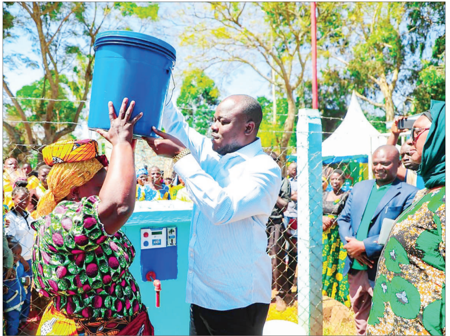
Water minister Jumaa Aweso pictured yesterday assisting a resident of a Ngara District village in carrying a bucket of water shortly after launching a newly implemented water project.