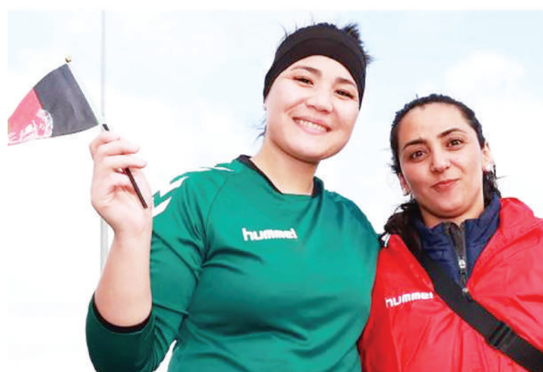
The Afghanistan women's team is no longer recognised by their country or Fifa.