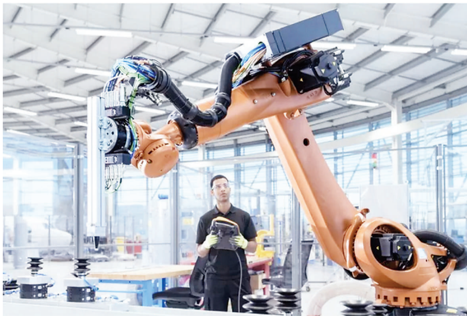
We use technology in work more than ever before, but it isn't making us more productive

"There is nothing that doesn't use digital now, but it is difficult to see what is going on because none of this is visible in the statistics. We just don't collect the data in ways that would help us understand what is happening."