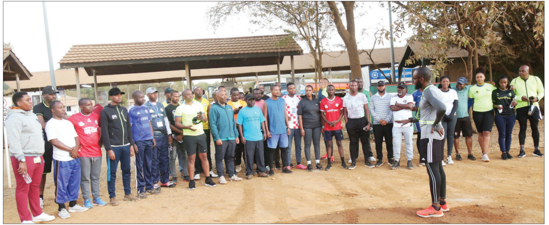
Barrick Gold Bulyanhulu mine workers attend a health drill at the weekend shortly before embarking a special race held in implementation of a malaria eradication strategy.

As per needs, students can benefit from scholarships which are fully funded or covering part of the school expenses, in this, we have been supporting them on how to seek for the scholarship opportunities