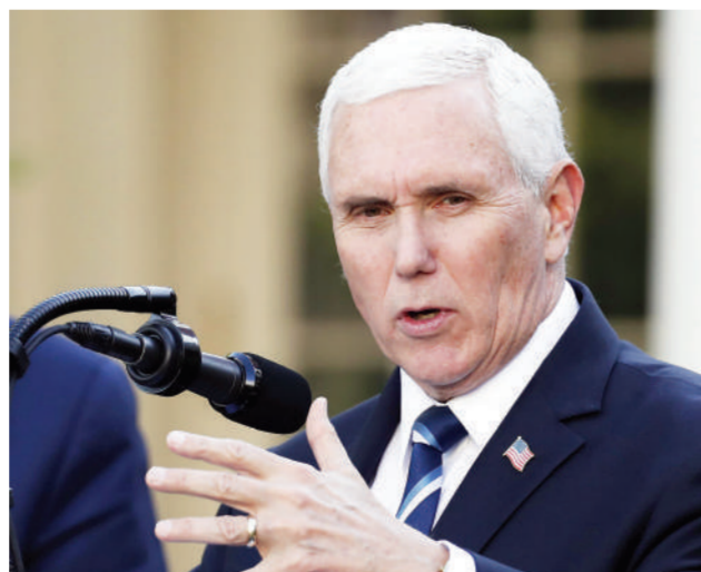
election. He said it should be left to the American public to determine whether Trump was responsible.

"I hope it does not come to that," Pence said on a potential Trump indictment over efforts to overturn the 2020