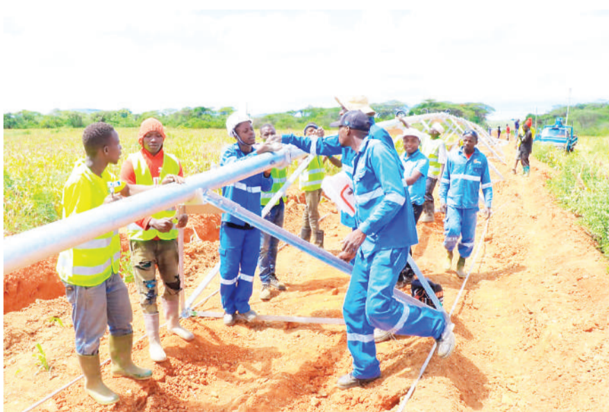
Pro Agro Global Company Ltd workers install modern irrigation infrastructure at the Kilimi Seed farm in Nzega District Tabora Region.

make Tanzania the seeds hub and thus, start marketing numerous crops seeds to different neighbouring counties," he expressed.