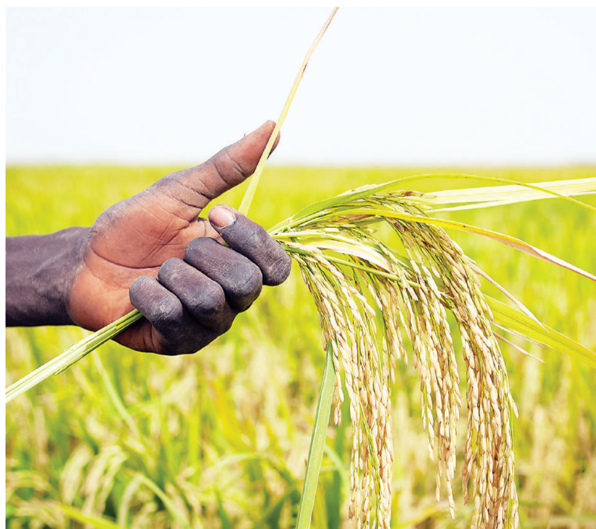
Since officials at ANCAR introduced a new method for growing rice, called the "system of rice intensification" (SRI), yields have more than doubled.

Developed in Madagascar in the mid-1960s, SRI has been spreading across Africa for the past 20 years, driven by a group of enthusiastic advocates with international support. It's increasingly seen by officials as a way to decrease methane emissions; alongside four other countries, Senegal committed to fund new SRI projects as "mitigation actions" in its 2020 Nationally Determined Contribution (NDC), its pledge under the Paris climate deal. In January 2023, after years of testing and pilot programs, the Sahara and Sahel Observatory, an intergovernmental collaboration that represents 13 West African states, launched a new project, extending SRI use to more than