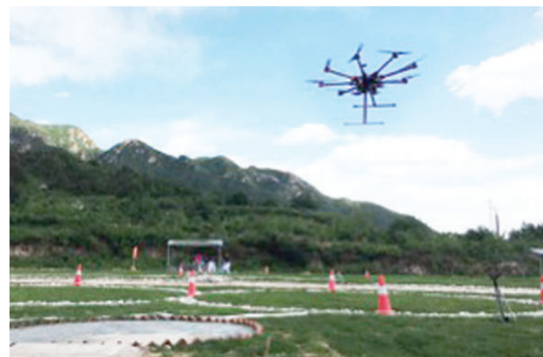
A drone flies above the LTFY drone training school in Changping district of Beijing.