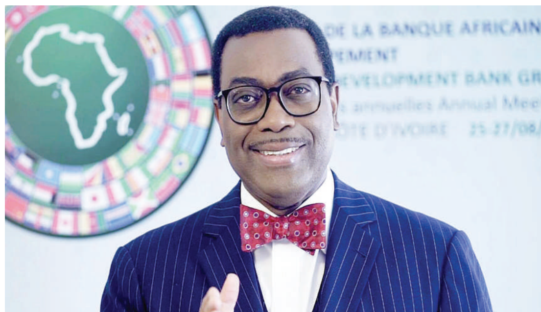
AfDB President, Dr Akinwumi Adesina

Managed by Janngo Capital, the Janngo Start-Up Fund builds and invests in tech start-ups with proven business models and inclusive social impact, with a focus on agribusiness, financial services, energy, education, and health-care, primarily in Francophone West Africa.