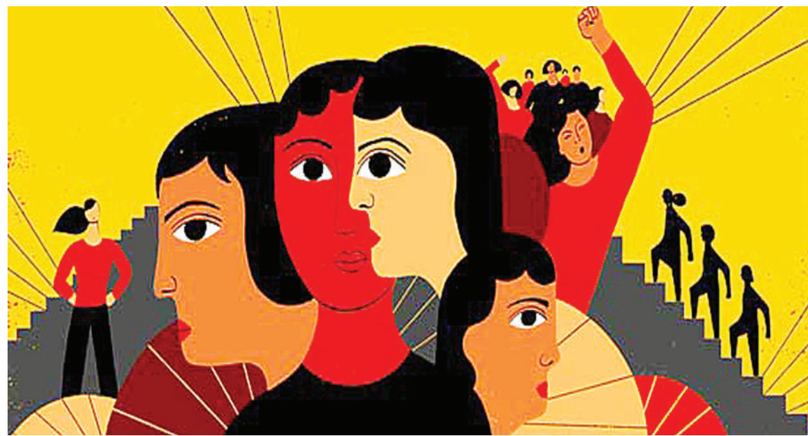
International Day for the Elimination of Violence against Women.

Hailed as an important step towards ensuring access to justice for all survivors, the reforms just signed into law improve the defini-