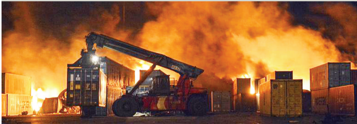
Representatives from China, Laos, Myanmar and Thailand participate in the launching ceremony of the joint Mekong River patrol and law enforcement mechanism among the four countries, Dec. 10, 2011.