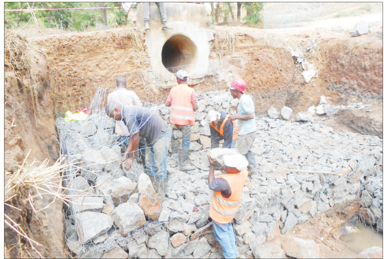
Workers construct Kwasantemo bridge at Songe in Kilindi district which connects Gairo in Morogoro region and Tanga.

"Current edible oil availability in the country is 290,000 tonnes on average from 1 million tonnes of the crops' seeds produced, and it is estimated that Dodoma Region contributes 190,000 tonnes of the sunflower seeds, equivalent to 53,000 tonnes of edible oil, according to 2020/2021 production statistics," Abraham said.