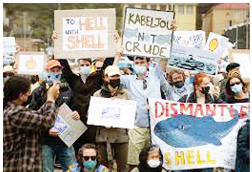
The ruling is a temporary victory for green groups who said seismic exploration would harm whales, seals and other fragile species

On Tuesday, it also stressed what it described as the benefits for South Africa if oil and gas were found.