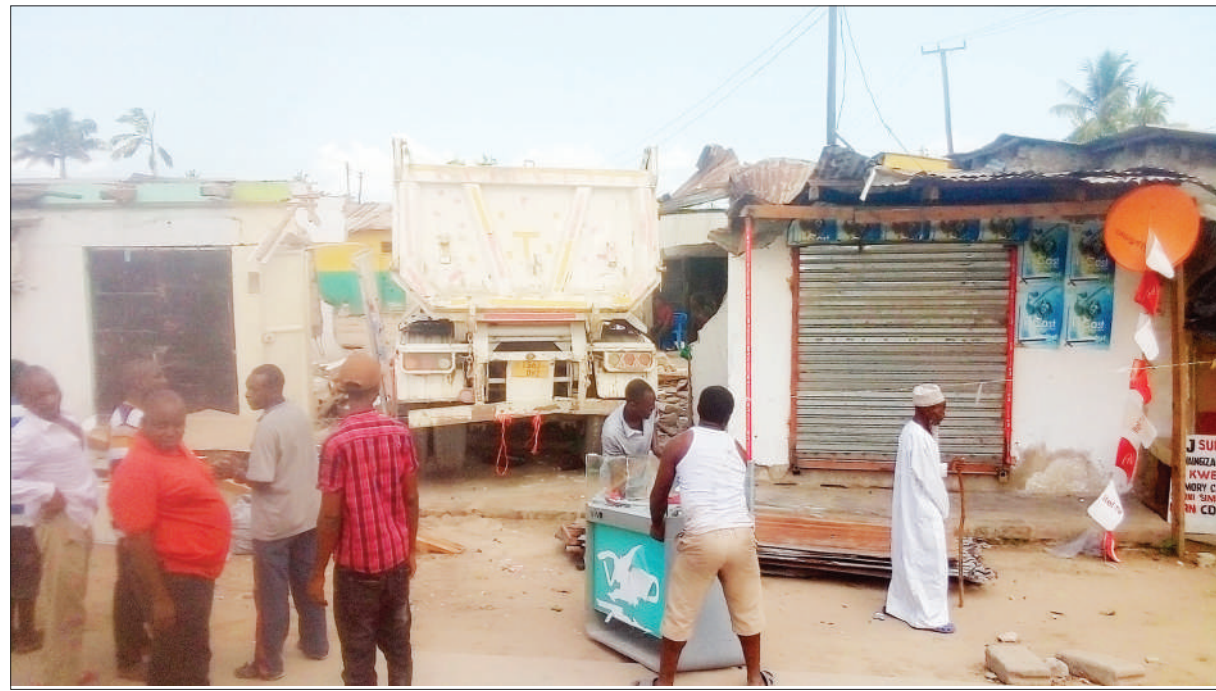
Tegeta residents look at a lorry that crashed into kiosk yesterday. There were no casualties, said the onlookers.

scale industries and businesses within their areas," she said. She said that through the programme poor families have received support; students are able to attend school as well as obtain services such as health care while others establishing small projects thus break the cycle of poverty. She added: "The programme has also enabled the beneficiaries to acquire basic services such as food, shelter and health service which they were unable to access."