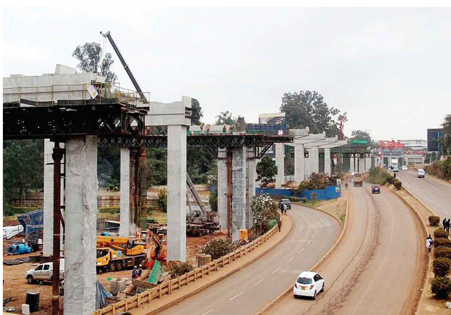
Nairobi Expressway under construction.