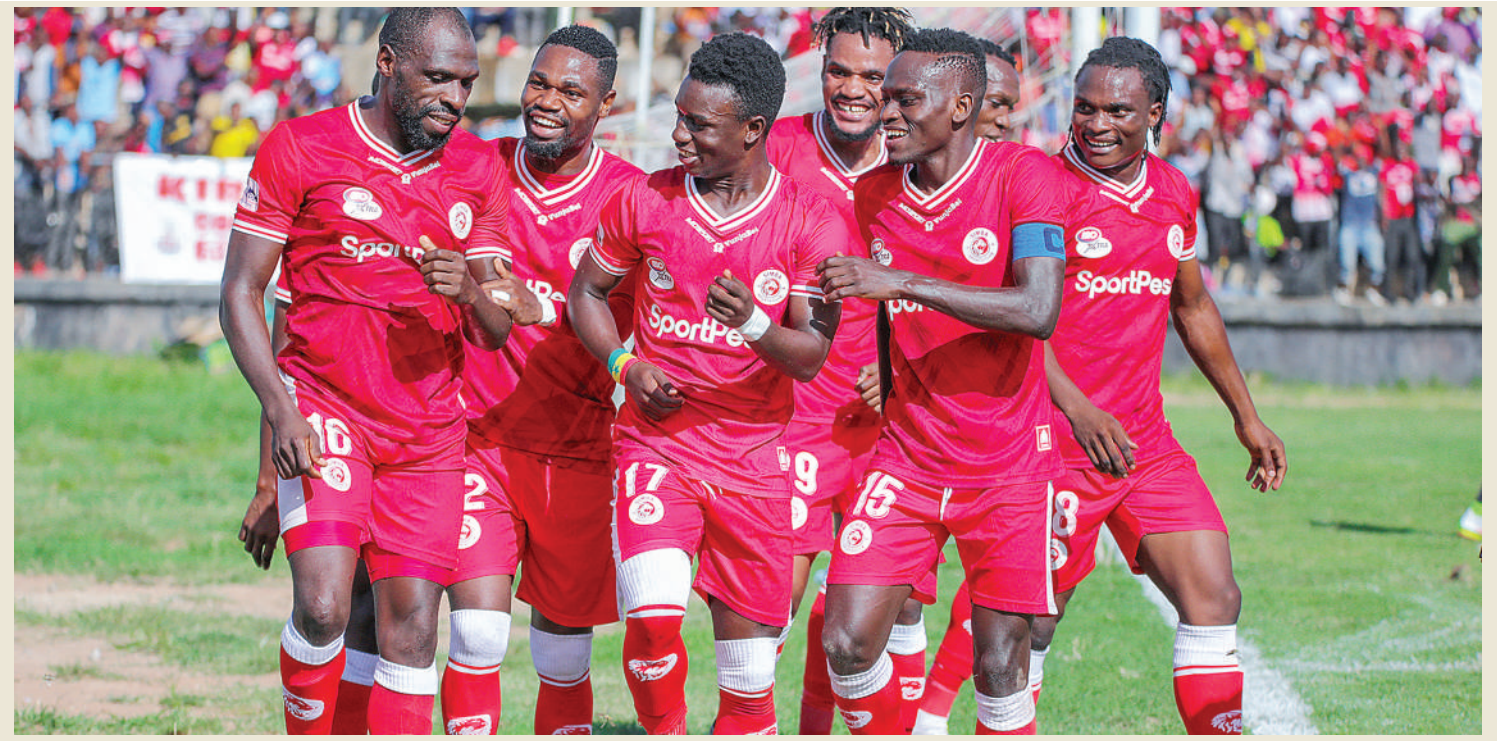
Simba SC.