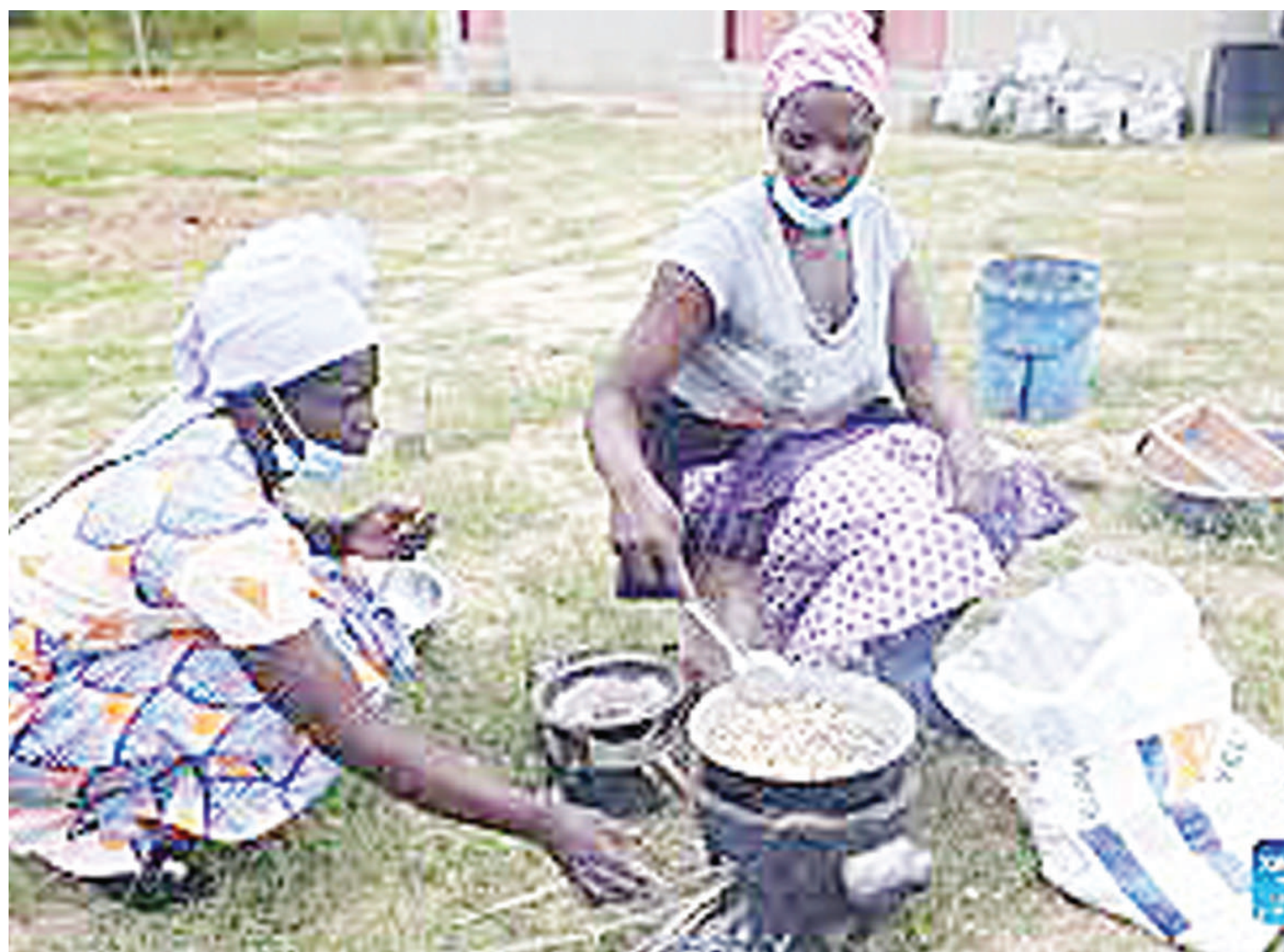
Members of the Women's Farming Syndicate (WFS) roast baobab fruit seeds in Domboshava, Mashonaland East Province, Zimbabwe

While indigenous knowledge systems in treating diseases remain one of the most valuable intellectual resources owned by rural communities in Zimbabwe, Machingauta said it has been the