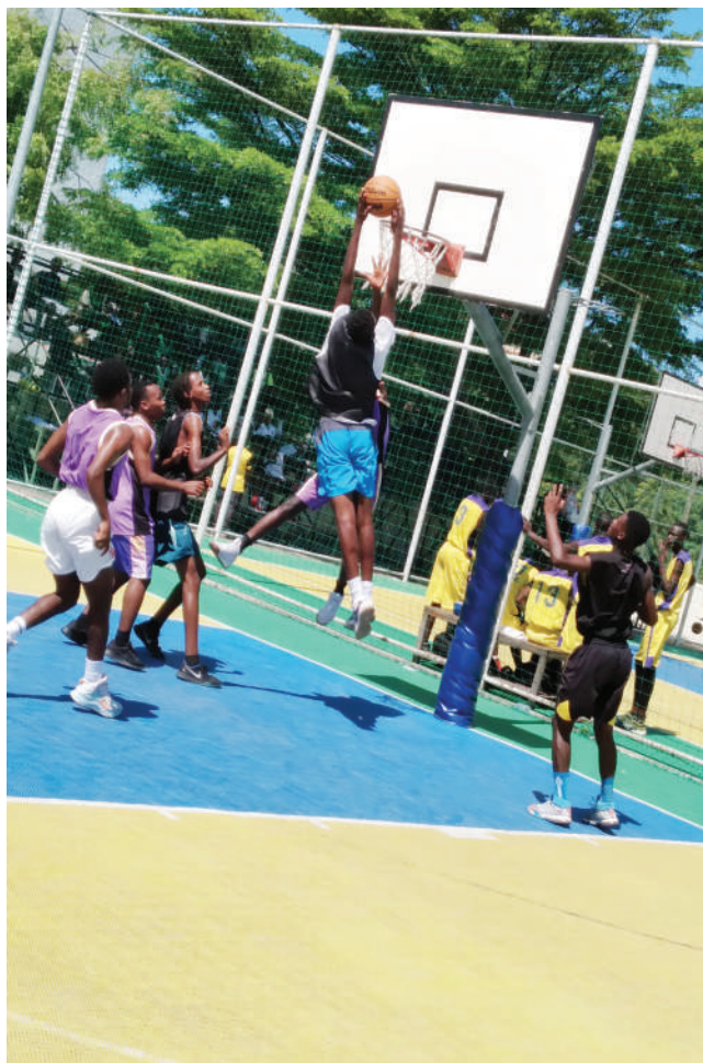
Arusha's Mtaani girls basketball side's players (in black jerseys) lock horns with Dar es Salaam's Creators' ballers in one of this season's JMK Youth Park Open Tournament's ties that took place at the center's courts last week.

The third edition of the Jakaya Mrisho Kikwete (JMK) Youth Park Open Tournament came to a close in Dar es Salaam last week, with the showdown enjoying an increase in the number of participating teams.