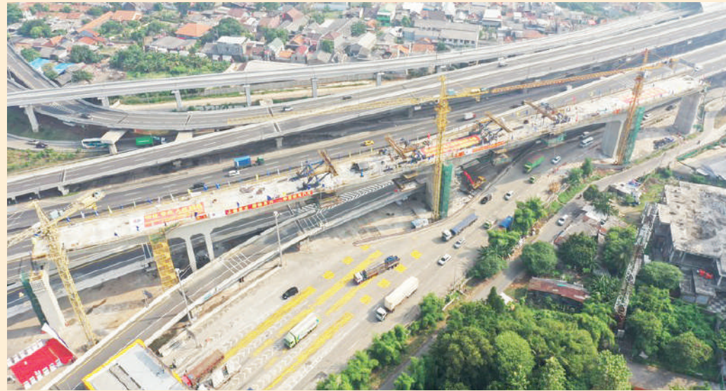
Photo taken on Sept. 29, 2021 shows the construction site of the last continuous beam on the No. 2 super large bridge of the Jakarta-Bandung High Speed Railway (HSR) in Bekasi, West Java province, Indonesia.

The last continuous beam on the No. 2 super large bridge of the Jakarta-Bandung High Speed Railway (HSR) was successfully closed on Sept. 30, marking the completion of the construction of all 24 continuous beams on