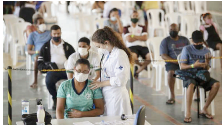
A patient gets medical treatment at the Health Care Center specialized in Flu and COVID-19 at the Complexo do Alemão Olympic Village, located in Complexo do Alemão favela in Rio de Janeiro, Brazil, on Dec 10, 2021. File photo

Infection and death rates have plummeted compared to the middle of the year when Latin America and the Caribbean accounted for almost half of global deaths and infections. Now it is Europe where - due to the spread of the Omicron variant - contagion is