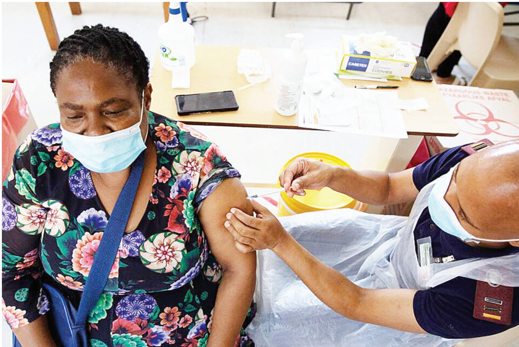
Covid-19: Hope Consortium to transport ultra-cold freezers for vaccines to Africa

Assistant Minister of Foreign Affairs and International Cooperation for International Development Affairs, United Arab Emirates, Sultan Mohammed Al Shamsi, said: "The UAE remains committed to doing our part to mitigate the effects of the pandemic by helping countries overcome the logistical and technical challenges associated with the delivery of large-scale vaccination programmes. Our partnership with UNICEF plays a vital role in helping implement an effective global response to