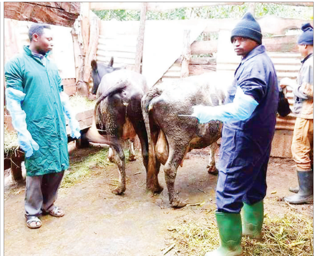
Livestock development officers vaccinate cattle against ticks, as found in Babati District, Manyara Region, on Monday.