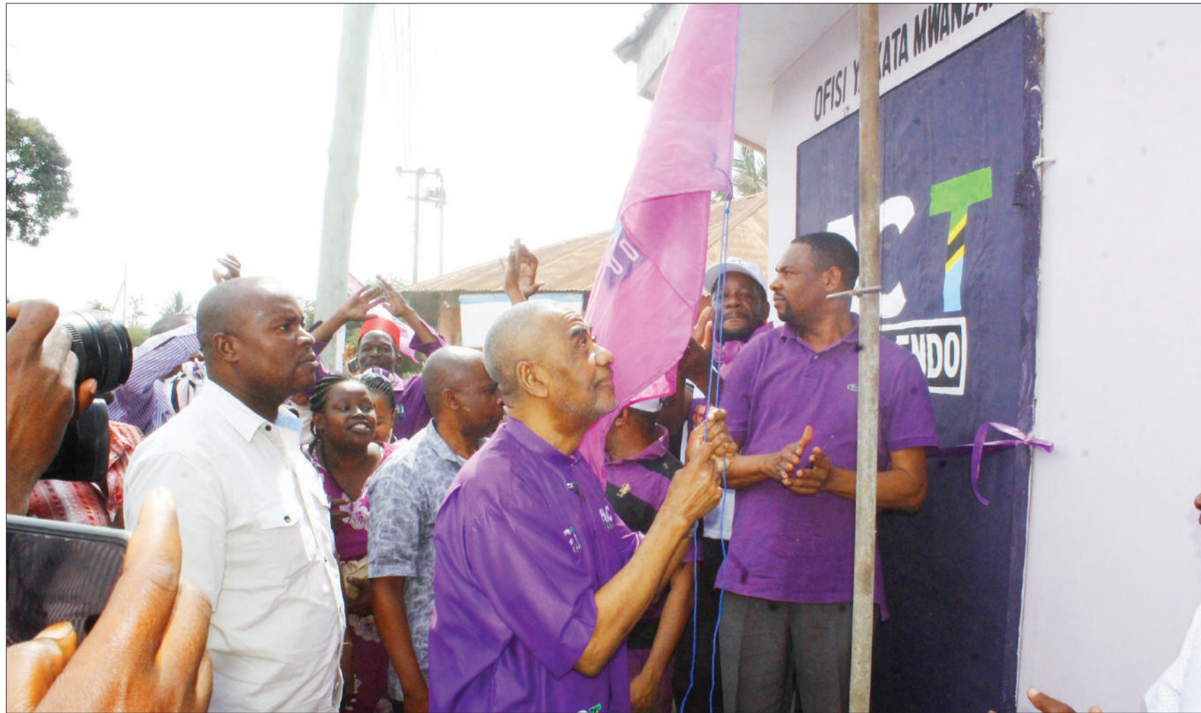
Seif Shariff Hamad, national Chairman of the opposition Alliance for Change and Transparency (ACT-Wazalendo), hoists the party's flag at the Mwanzange ward office in Tanga Region yesterday.