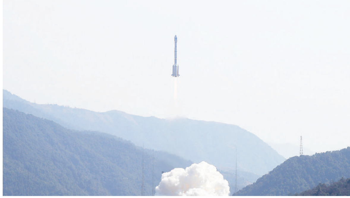
Two Beidou satellites via a single carrier rocket take off at the Xichang Satellite Launch Centre, Sichuan province, China, on 12 February 2018.

Many of those countries are involved in the Belt and Road initiative, spearheaded by President Xi Jinping to create a modern-day Silk Road of trade and investment. In a 2019 report, the US congress-