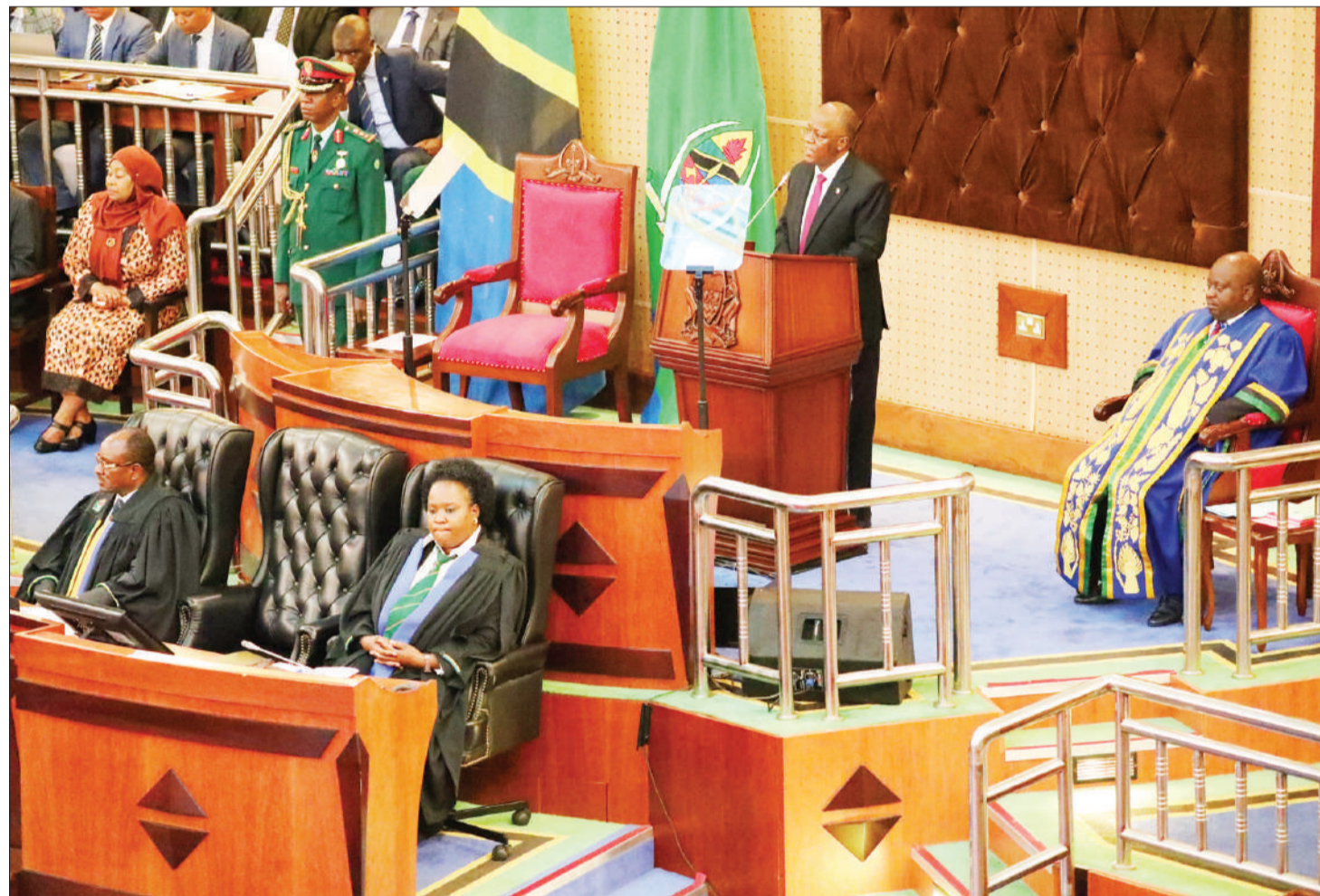
President John Magufuli addresses legislators in Dodoma yesterday shortly before dissolving Parliament in readiness for later this year's General Election, with House Speaker Job Ndugai (R) and Vice President Samia Suluhu Hassan visibly attentive.