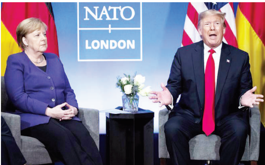
US President Donald Trump meets with German Chancellor Angela Merkel during the NATO summit at The Grove in Watford, England. (File photo)

its payments to the NATO and vowed to stick with the plan unless Berlin changed course. "So we're protecting Germany and they're delinquent. That doesn't make sense. So I said, we're going to bring down the count to 25,000 soldiers," Trump said, adding that "they treat us very badly on trade" but providing no details. NATO in 2014 set a target that each of its 30 members should spend 2 percent of GDP on defense. Most, including Germany, do not. Trump's remarks were the first official confirmation of the planned troop cut, which was first reported by the Wall Street Journal and later confirmed to Reuters by a senior US official who spoke on condition of anonymity. That official said it stemmed from months of work by the US military and had nothing to do with tensions between Trump and German Chancellor Angela Merkel, who thwarted his plan to host an in-person Group of Seven (G7) summit.