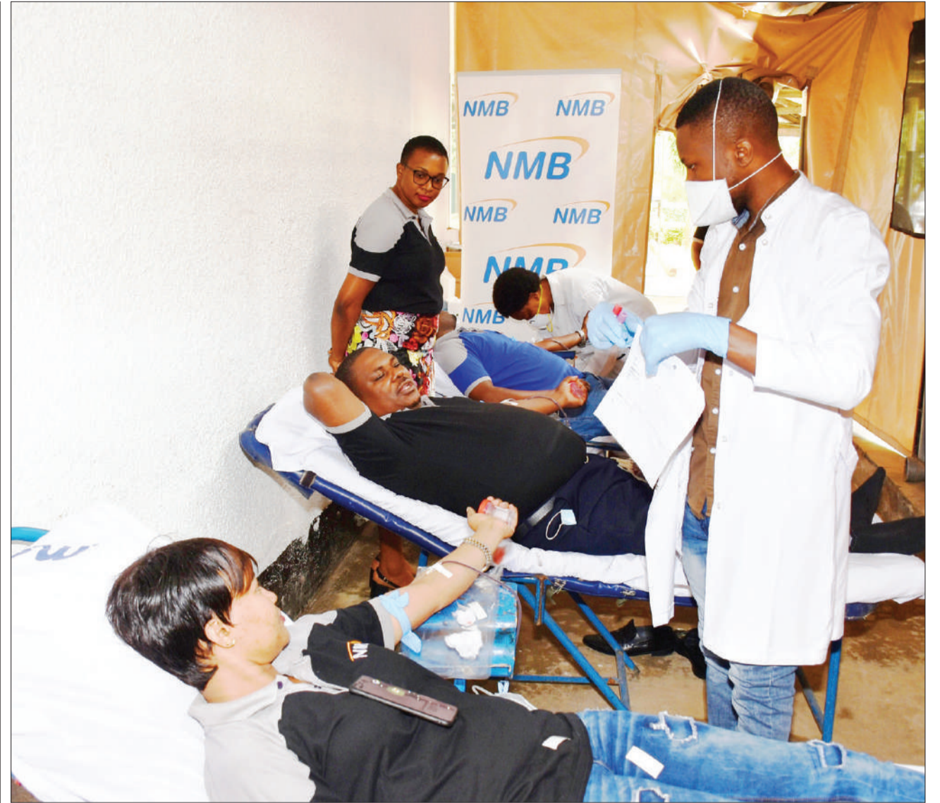
Members of staff of NMB Bank Plc's north zone donate blood at the Arusha regional hospital, Mount Meru, yesterday.

It will be a follow up on the implementation of the resolutions of the previous bilateral meeting with Tanzania