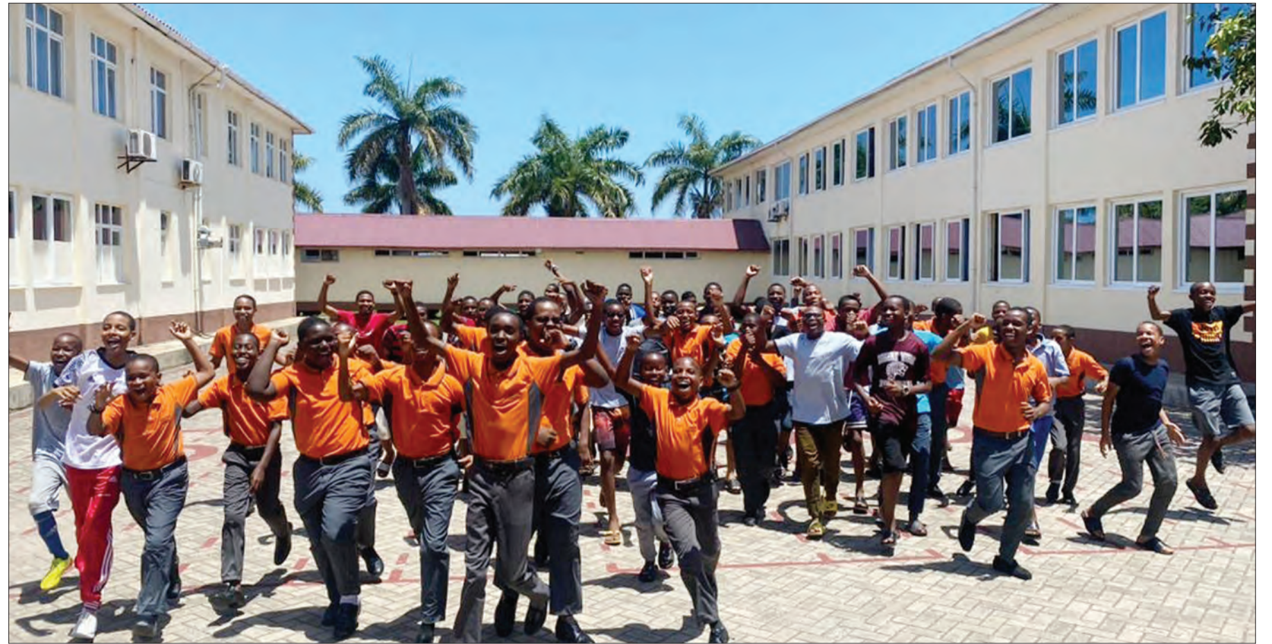
Students of Dar es Salaam's Feza Boys Secondary School in celebratory mood in the city yesterday shortly after it was learnt that the school was among those which have done remarkably well in the 2022 National Examination Council of Tanzania (NECTA) Form Four (Certificate of Secondary School) Examination.

Geita Region leads in the use of mercury at 4,489 kilograms in the last recorded year, followed by Mbeya (1,854kg), Katavi (1,234kg), Shinyanga (1,456kg) Tabora (1,112kg), Singida (1,048kg), Mwanza (1,696kg), Kagera (1,840kg), Mara (886kg), Iringa (870kg) and Kigoma (899kg), the data indicates.