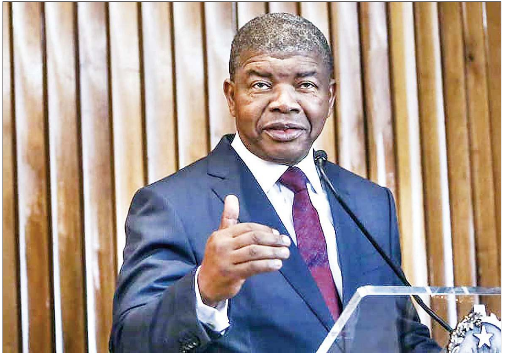
The country is on track with economic and anti-corruption reforms, but it's still too early to pass judgement. File photo

Like other analysts, Schubert is suspicious of Lourenço's 'resurrection' of Dos Santos's old vice president and