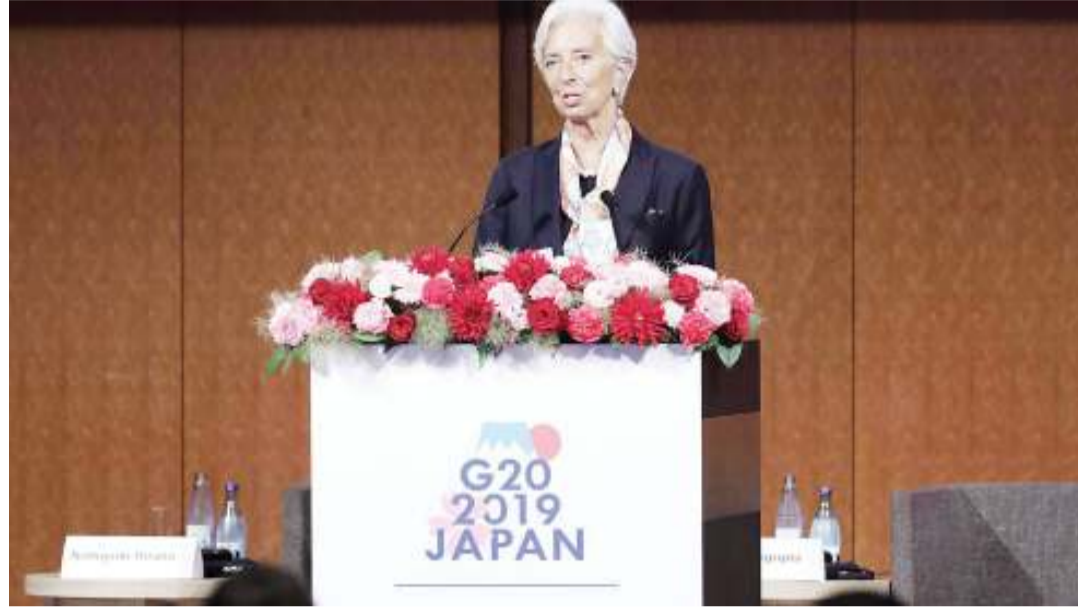
Christine Lagarde, managing director of the International Monetary Fund speaking at G20 Summit I Fukuoka.

The IMF, along with the World Bank and the World Trade Organisation, has in the past voiced concerns over an escalating tariff war, but it doesn't see the threat of a global recession as a result of the dispute. It has however, lowered China's growth forecast to 6.2 per cent