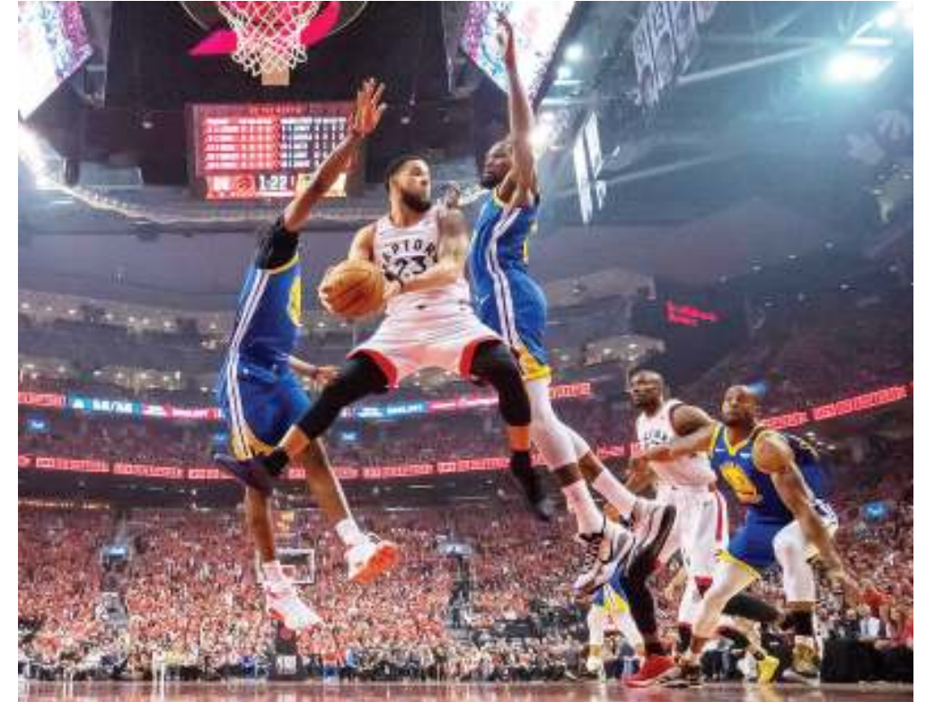
Toronto Raptors guard Fred VanVleet (23) grabs a rebound under pressure from Golden State Warriors forward Kevin Durant (35) and center Kevon Looney (5) during Game 5 of the NBA Finals in Toronto.