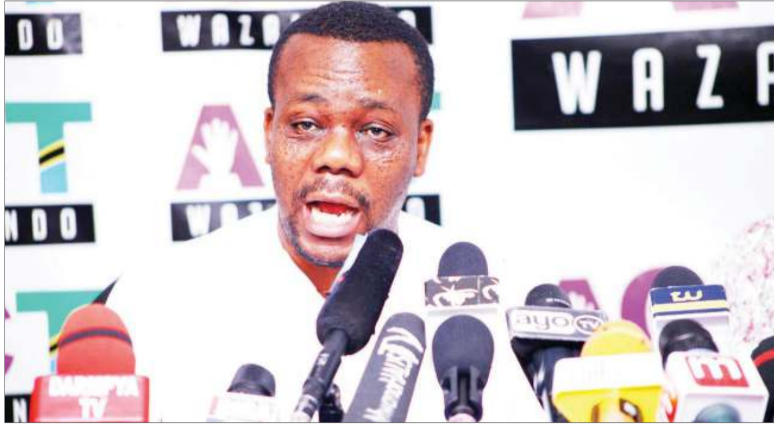
Alliance for Change and Transparency (ACT-Wazalendo) Leader Zitto Kabwe addresses journalists in Dar es Salaam yesterday on the stand by the opposition party's central committee on various issues, including cooperation with other opposition parties, the National Electoral Commission, and elections in the country.