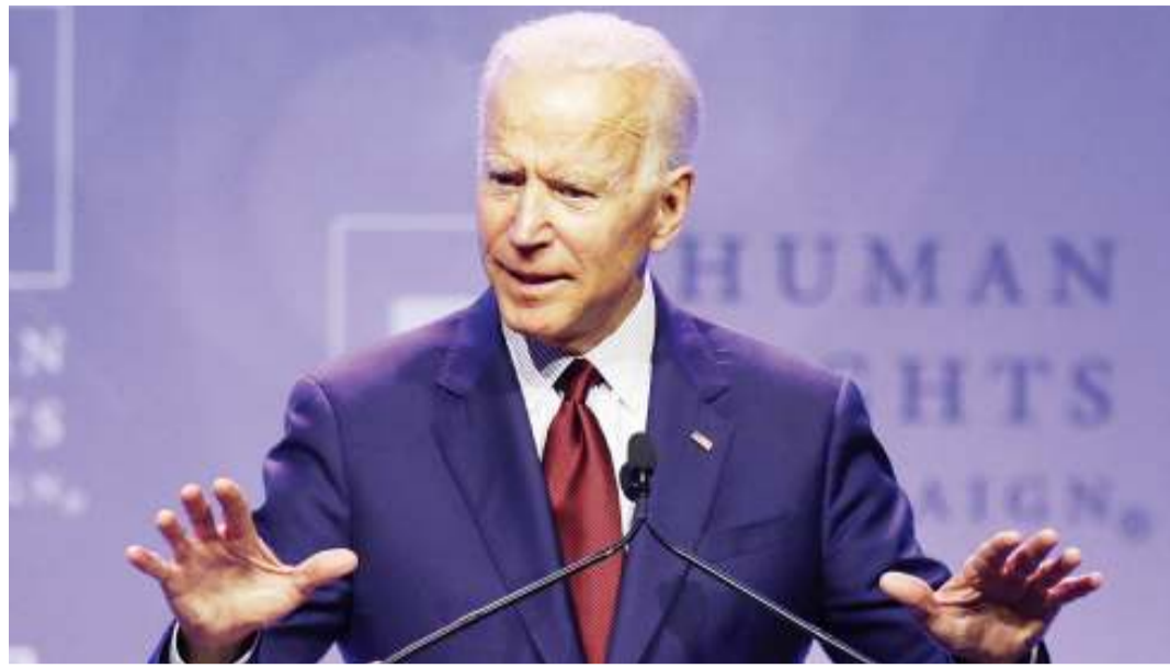
Former U.S. vice president Joe Biden