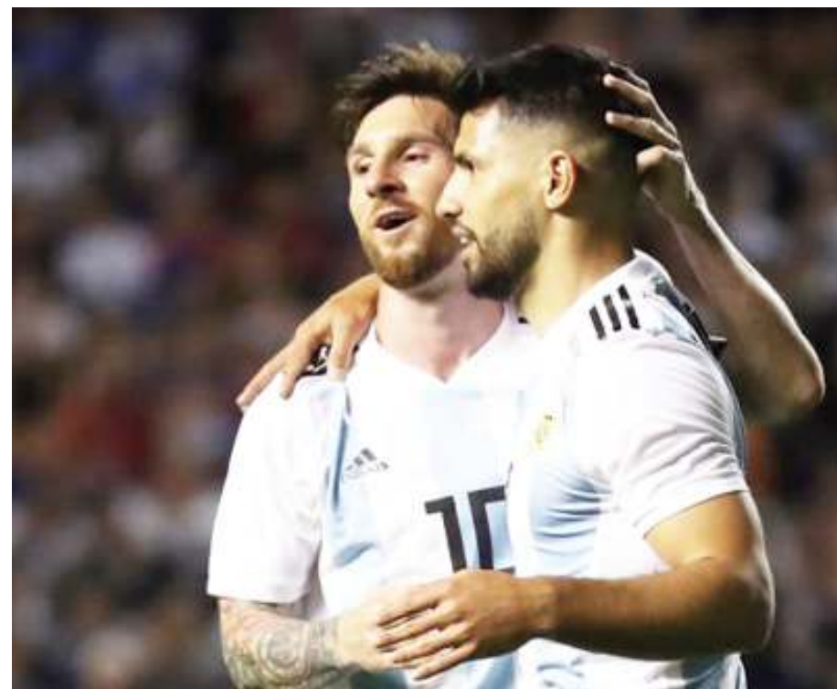
Lionel Messi - Sergio Aguero

However, the former defender, who was an as-