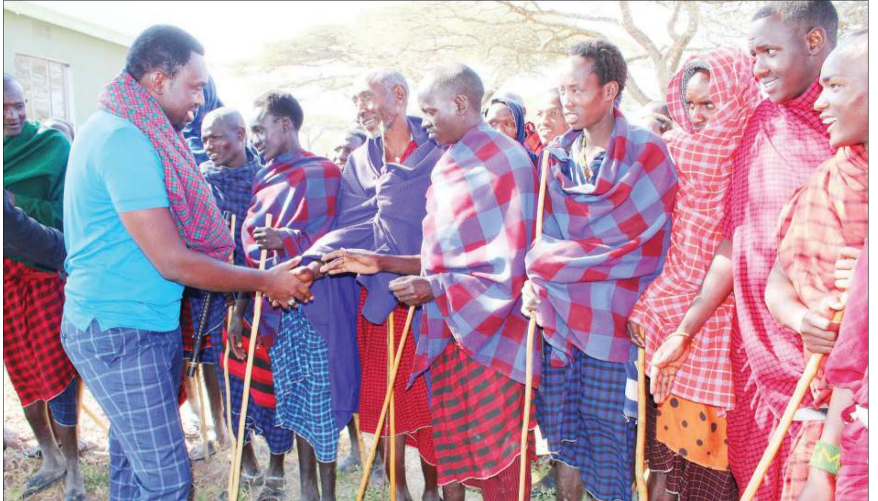
Natural Resources and Tourism minister Dr Hamisi Kigwangalla (L) greets Alaitole ward residents living in the Ngorongoro conservation area. He was there on Monday specifically to resolve a dispute between the people and the Ngorongoro Conservation Area Authority management, reportedly with the residents determined to build a boarding school for girls at Esero - deep inside the world-acclaimed wildlife sanctuary.

Right now ARINSA has direct contact with asset recovery networks in other parts of the world such as: Camden Asset Recovery Inter-Agency Network (CARIN) in Europe, Rede de Recuperação de Activos de Grupo de Accion Financiera de Sudamerica (GAFISUD) (RRAG) in South and Central America.