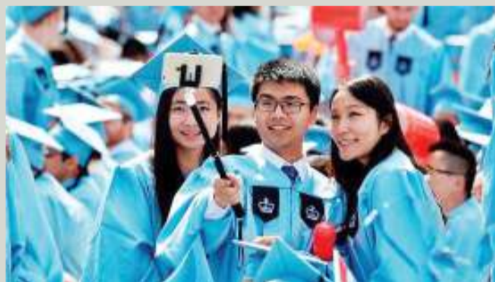
Students taking a selfie at the commencement ceremony of Columbia University's 261st academic year in New York, the United States, May 20, 2015.

He said it was unusual to see such a large number of cancellations after many had already