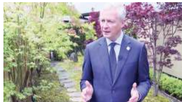
An image grab from an AFP TV interview with French finance

Mr Le Maire also sought to take a step back by insisting that it was up to the management at Renault and Nissan to determine how to reinforce their relationship, and that it wasn't his role to meet with Nissan's CEO during his trip to Japan.