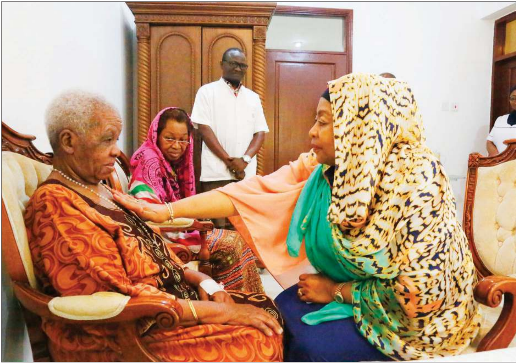
Vice President Samia Suluhu Hassan pictured yesterday having a word with Father of the Nation Mwalimu J K Nyerere's widow, Mama Maria Nyerere (88), who is admitted to a Dar es Salaam hospital.