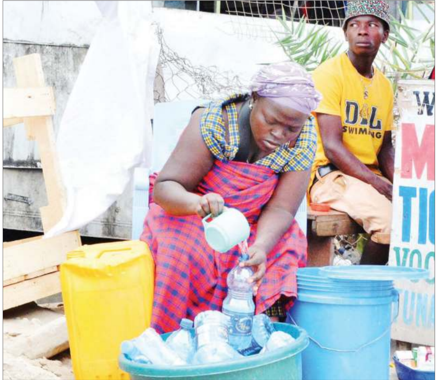
A small trader fills tap water of uncertified quality in bottles – also of suspicious quality – for sale at Ubungu Bus Terminal in Dar es Salaam yesterday. The practice, a common feature in some urban areas in the country, is a health hazard calling for urgent deterrent measures.