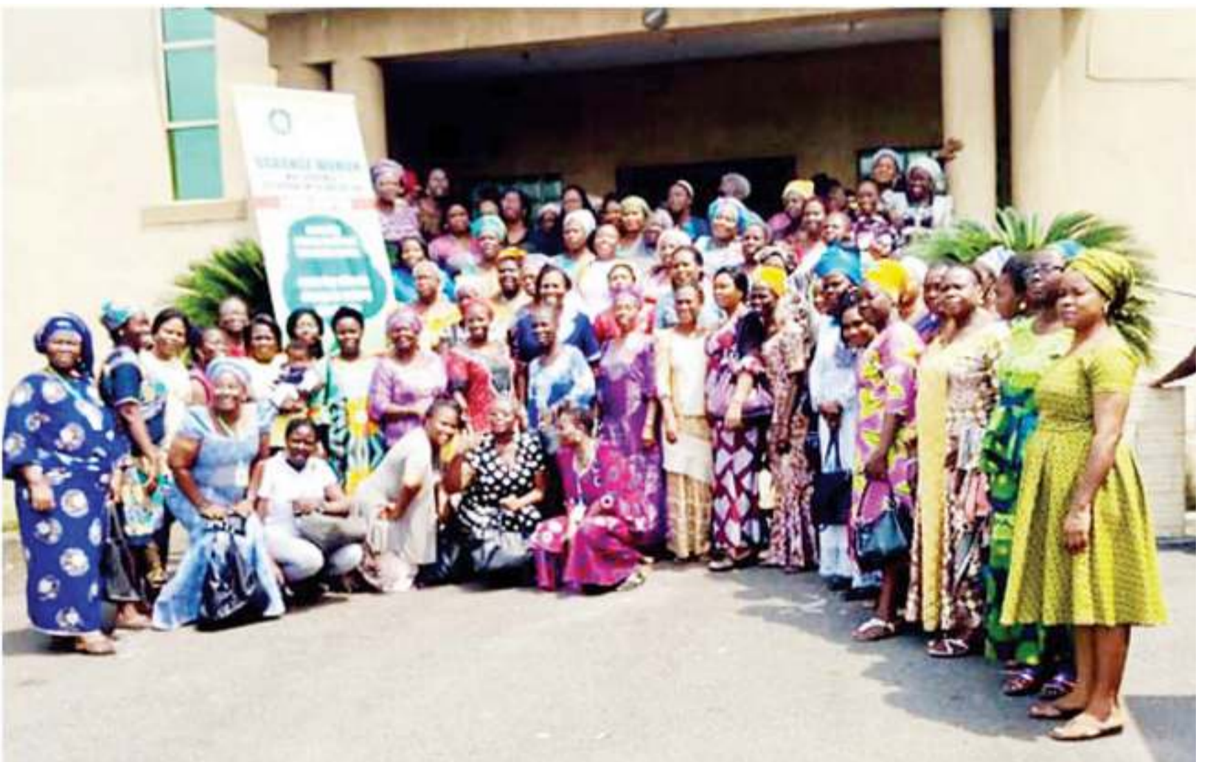
Ogbonge Women Lagos Chapter in Agege. File photo

We are also pleading for more donors and NGOs to come to our aid, because even with a strong, united group, the women farmers really need help. I will continue to advocate for my fellow female farmers, because we each deserve a chance to work hard, feel safe, make promises and fulfill them.