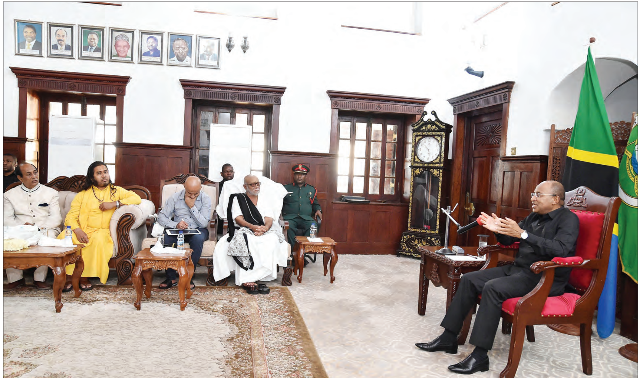
Zanzibar President Dr Hussein Ali Mwinyi has an audience at Zanzibar State House yesterday with a visiting Hindu Community delegation from India led by Sheikh Morari Babu.

Tanzania joined other countries to mark 15th World Democracy Day on September 15, an international day created by the UN General Assembly in 2007 to mobilise pro-democracy activities around the world.