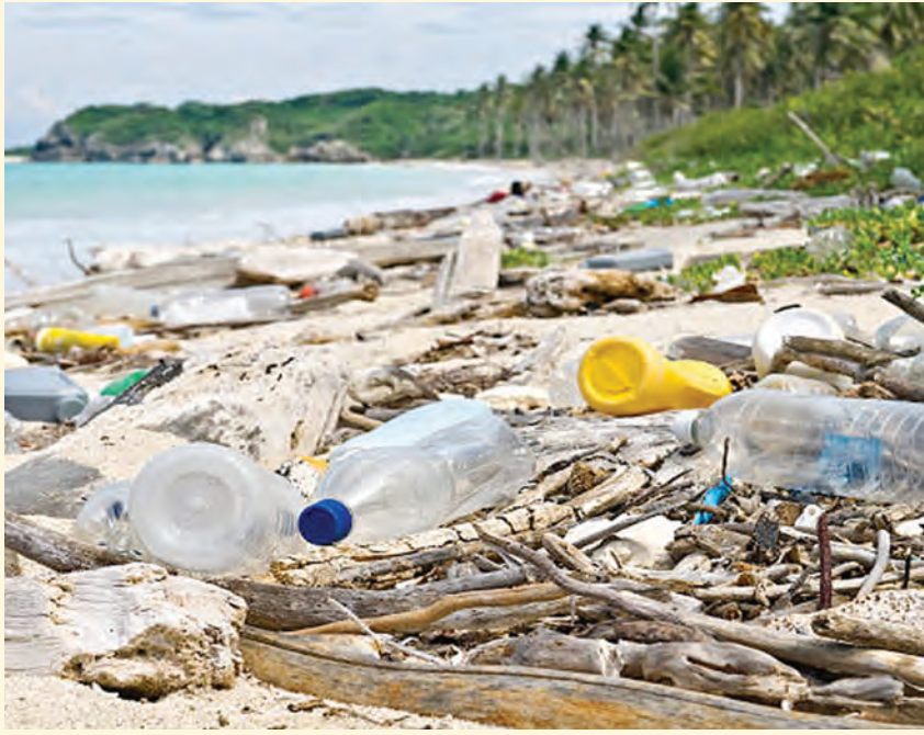
Plastic pollution at the beach