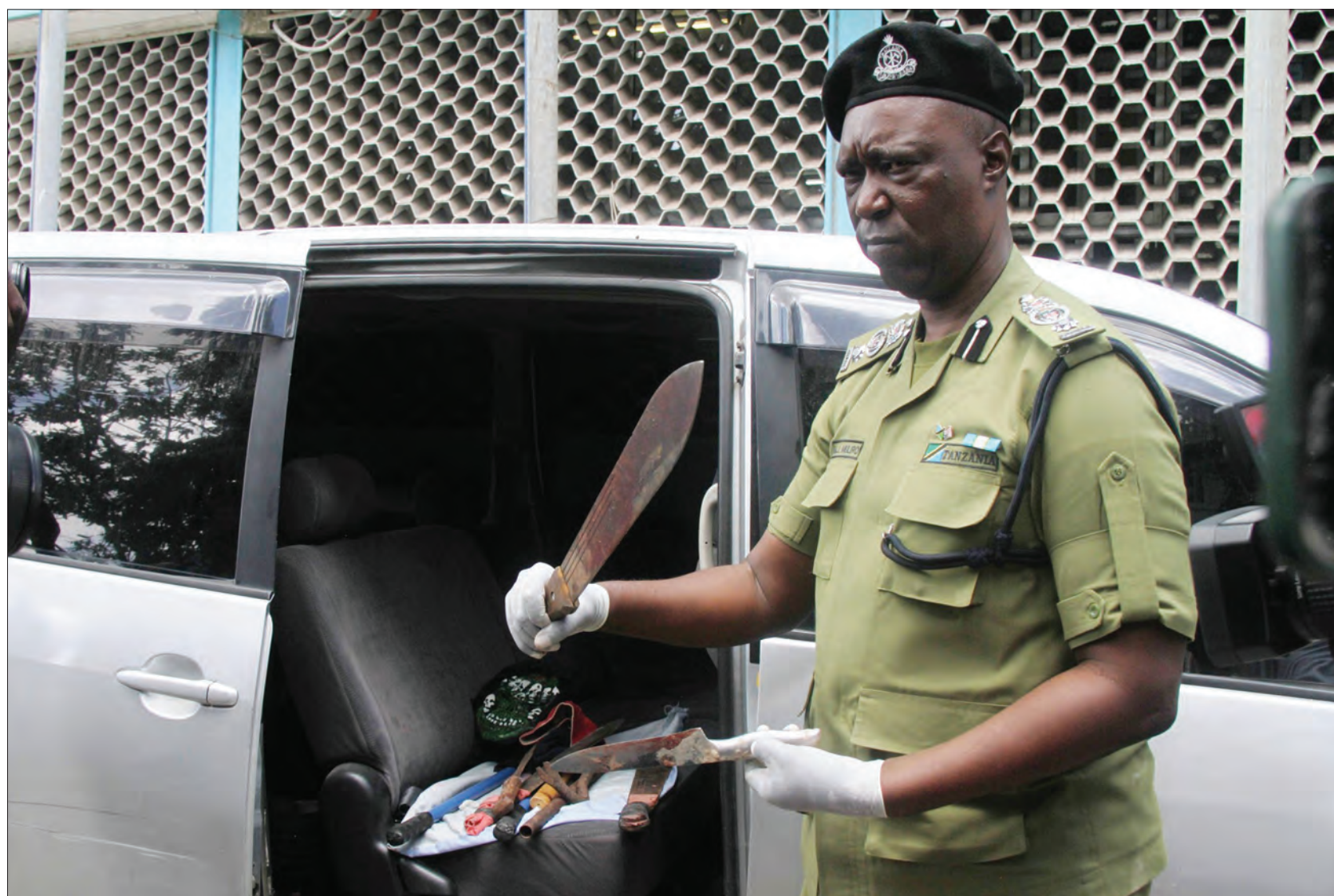
Dar es Salaam Special Zone Police Commander Jumanne Muliro pictured yesterday showing journalists weapons said to have been seized during an on-going police crackdown that has thus far resulted in the killing of six people suspected to belong to criminal gangs of youths commonly known as 'panya road'.