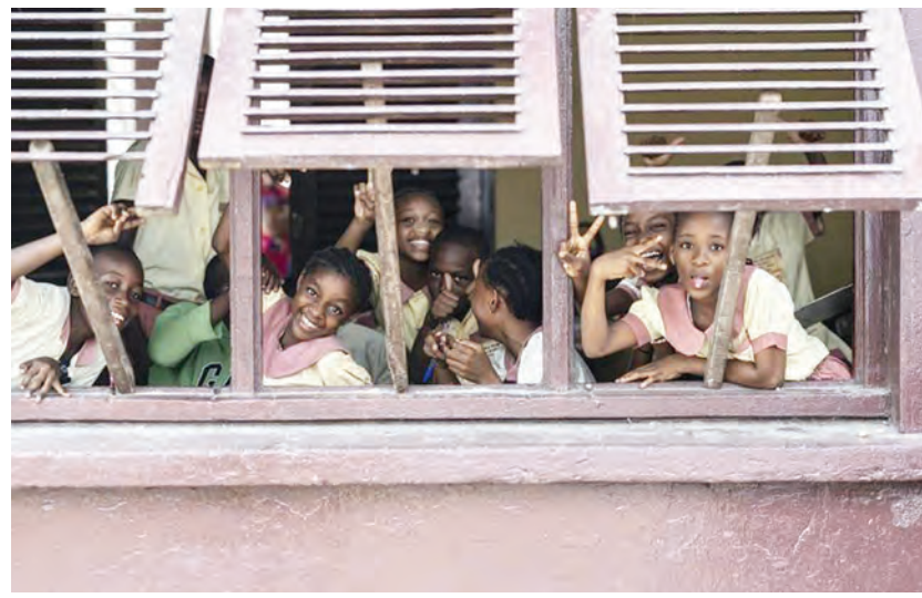
Pupils pose at a window of their school in Douala, western Cameroon, on Jan 13, 2022.

This facility is aimed at getting financing to