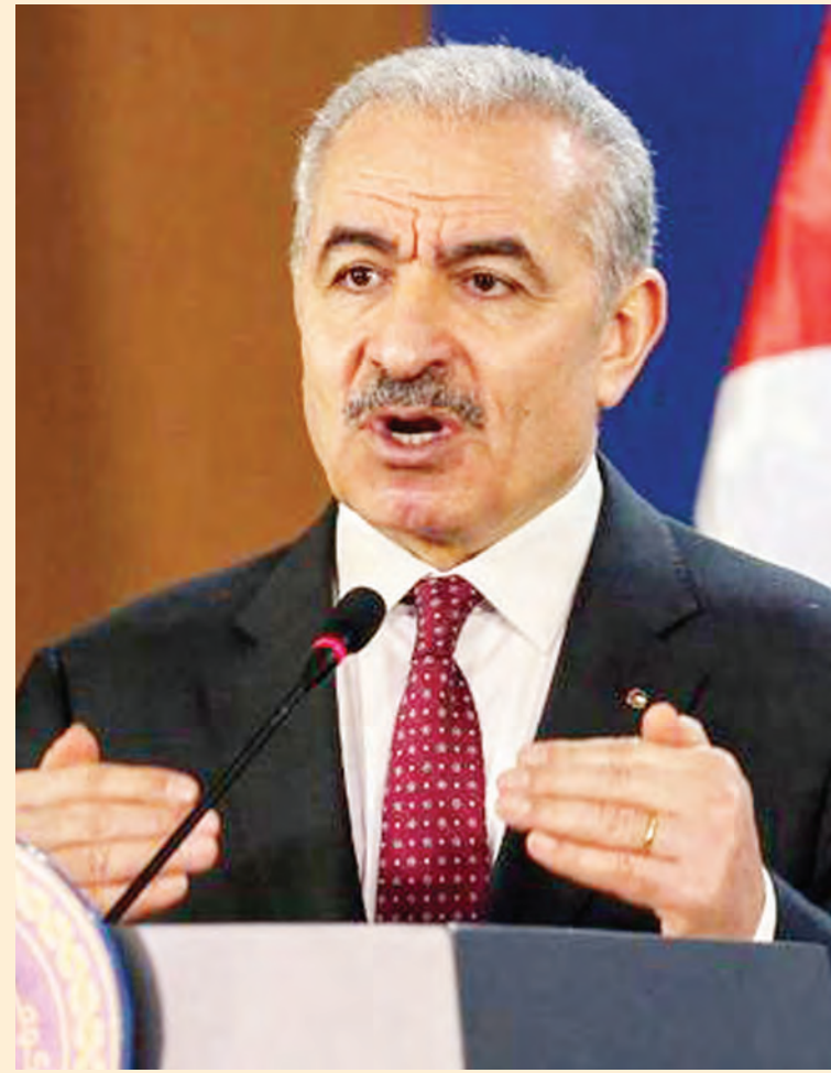
Palestinian Prime Minister Mohammed Ishtaye speaks during a joint press conference with Libya's interim prime minister in the Libyan capital Tripoli, on Feb 14, 2022. File photo

Palestinian Authority's jurisdiction have not only undermined the latter's role, but reveal the Israeli authorities' rhetoric about strengthening the Palestinian Authority.