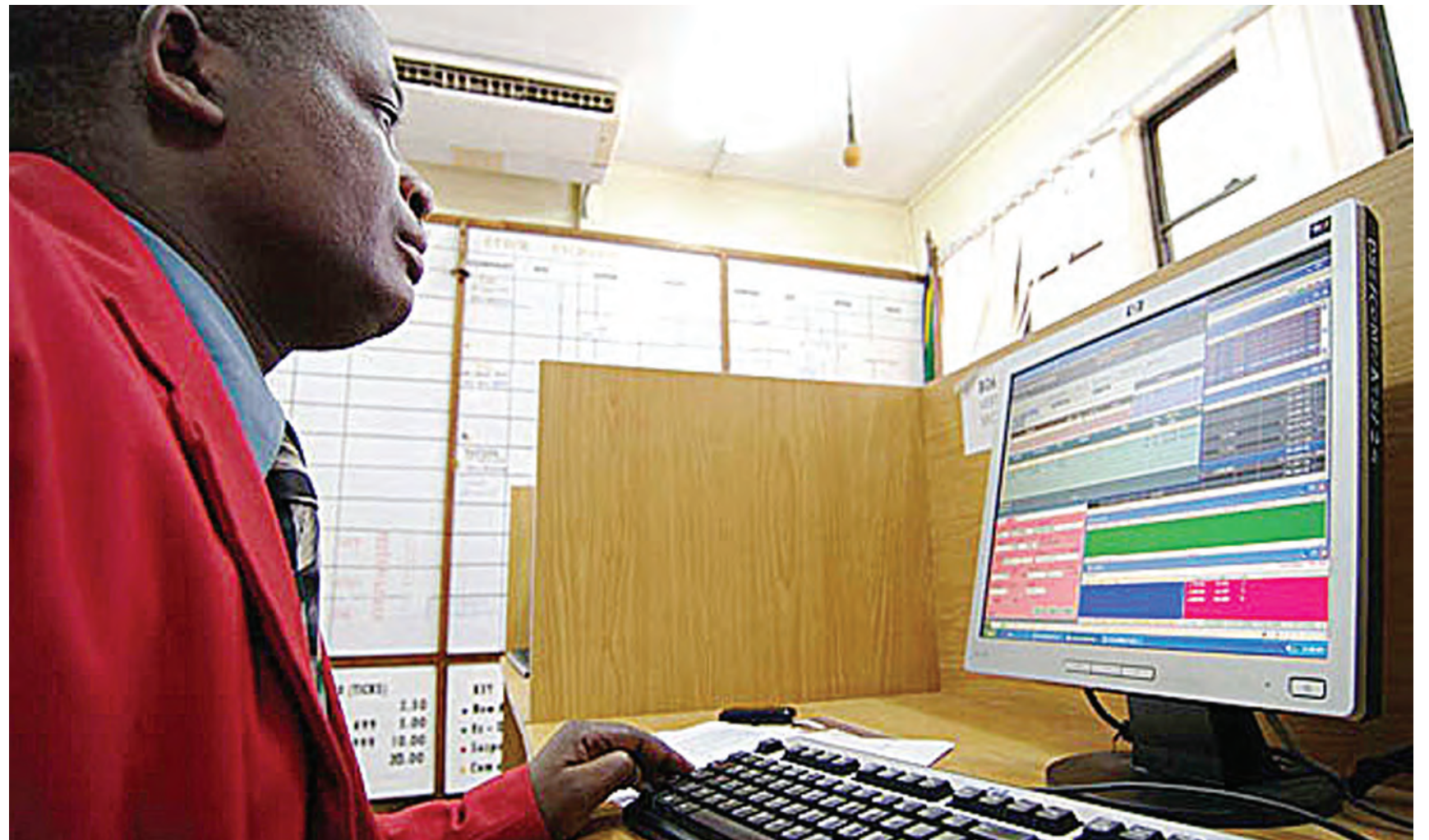
Foreign investors injected 14.8bn/- through the buying of shares and moved out 7.78bn/- through selling shares.