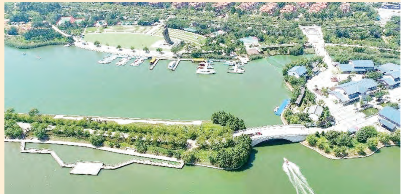
Photo shows the China-Shanghai Cooperation Organization (SCO) Local Economic and Trade Cooperation Demonstration Area in Jiaozhou, Qingdao, east China's Shandong province. File photo

A record 15,000 China-Europe freight train trips were made in 2021, and the first China-Russia highway bridge opened to traffic.