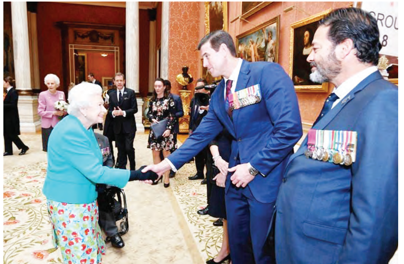
In this May 16, 2018 photo, Britain's Queen Elizabeth II shakes hands with Victoria Cross recipient Ben Roberts-Smith (second right) during a reception for living recipients of the Victoria and George Cross medals, in the Picture Gallery at Buckingham Palace in London.

All four VC recipients, the highest military award for gallantry while under fire, were not invited to fly with