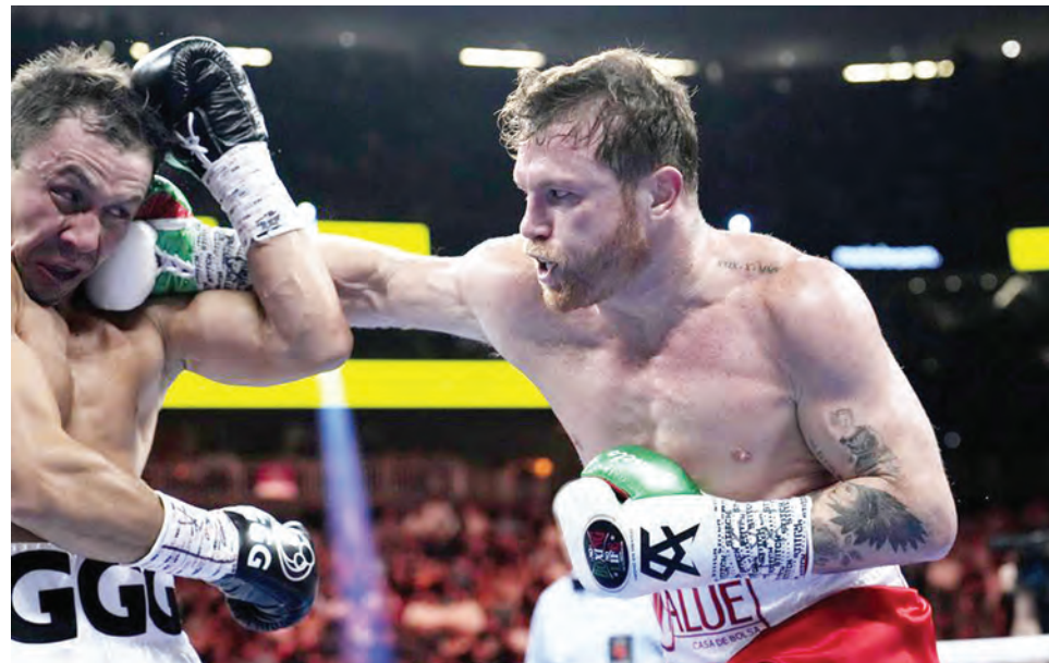
Canelo Álvarez, right, fights Gennady Golovkin in a super middleweight title boxing match, Saturday, Sept. 17, 2022, in Las Vegas.

Golovkin started far too slowly with no clear strat-