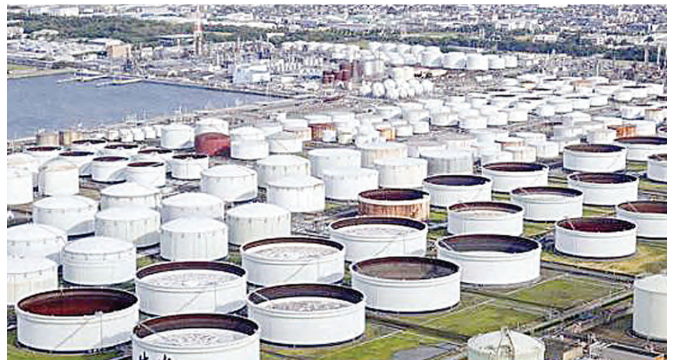
An aerial view shows an oil factory of Idemitsu Kosan Co. in Ichihara

Generally bullish, the group of 13 oil exporting nations predicts an increase in demand of 3.1 million bpd this year and 2.7