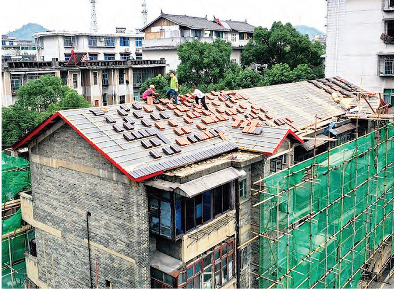
An old residential building in Shuangjiang township, Tongdao Dong autonomous county, Huaihua, central China's Hunan province is being renovated, August, 2022.