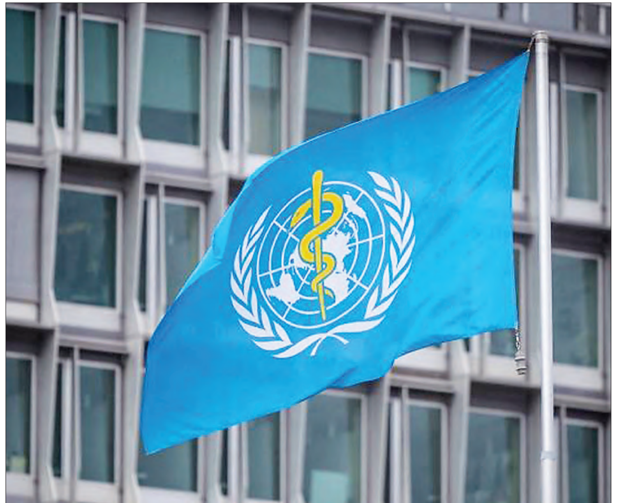
This photograph taken on Mar 5, 2021 shows the flag of the World Health Organization (WHO) at their headquarters in Geneva amid the COVID-19 outbreak.

"We encourage the WHO to continue and show the community that its personnel who abused women and their daughters in our community have been gen-