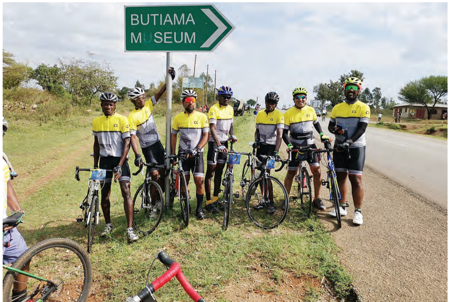
Cyclists, who participated in the 2020 Twende Buitama Cycling Tour, pictured at Mwitongo Village in Buitama to commemorate the Father of the Nation, the late Mwalimu Julius Kambarage Nyerere.

Other co-sponsors are Tanfoam, Hanspaul/HIL/DSH/HAL, Songea Mississippi, AMREF, Rhotia Valley, Blink, Johnny Walker, Lemala, Sirringit, Greenside, Mount Kilimanjaro Safari, Jibu, Nimali, Insight, Dolphin, Sanaa, Multichoice, and Dekker.