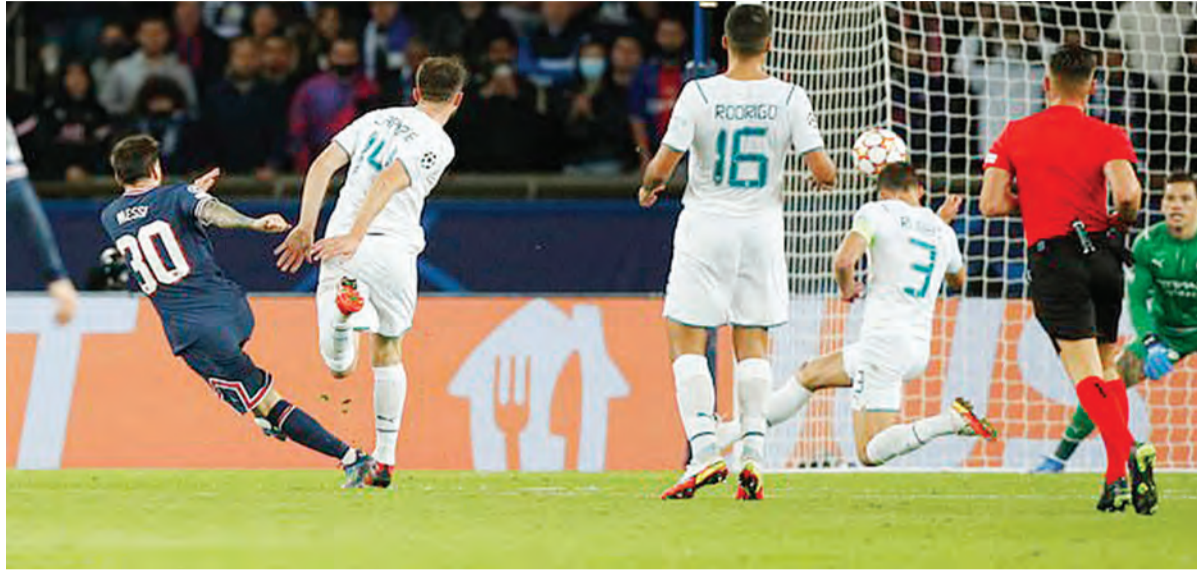
Messi took the game away from Manchester City late on to help PSG record a 2-0 win.

"Oh, I celebrated today," Pochettino said of his compatriot's strike