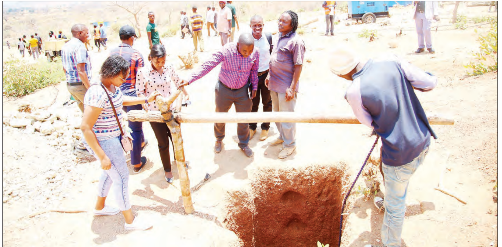
Journalists from various regions visit Chikowa mining site in Dodoma Region as part of awareness training about reducing mercury impacts in small-scale gold mining on Wednesday.

He holds Masters degree in Leadership and Development, from Kings College London, Post Graduate Diploma in Management of Foreign Service from the Mozambique-Tanzania Centre for Foreign Relations, and a bachelor degree in Political Science and Public Administration, International Relations from the University of Dar es Salaam.