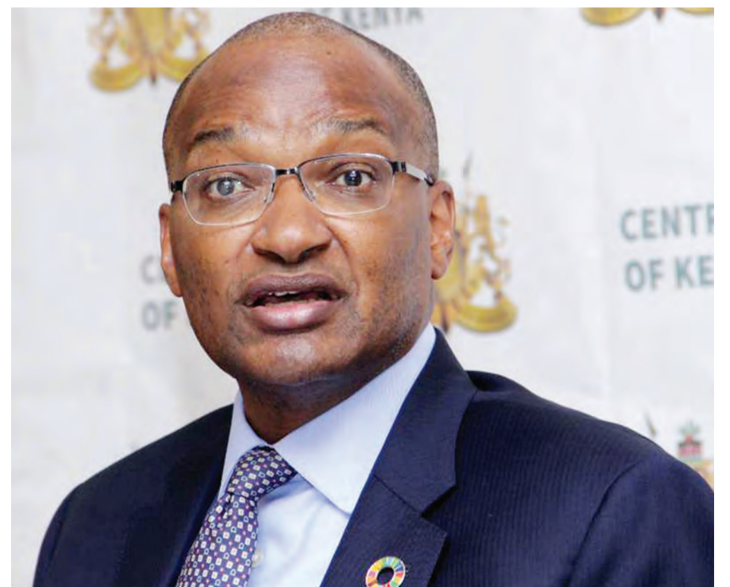
CBK governor, Patrick Njoroge.

Data from the Communications Authority of Kenya show M-Pesa controls the largest number of agents at 89.8 percent of 283,357 operating in the period ended June, while Airtel Money and T-Kash at 7.5 percent and 2.7 percent, respectively.