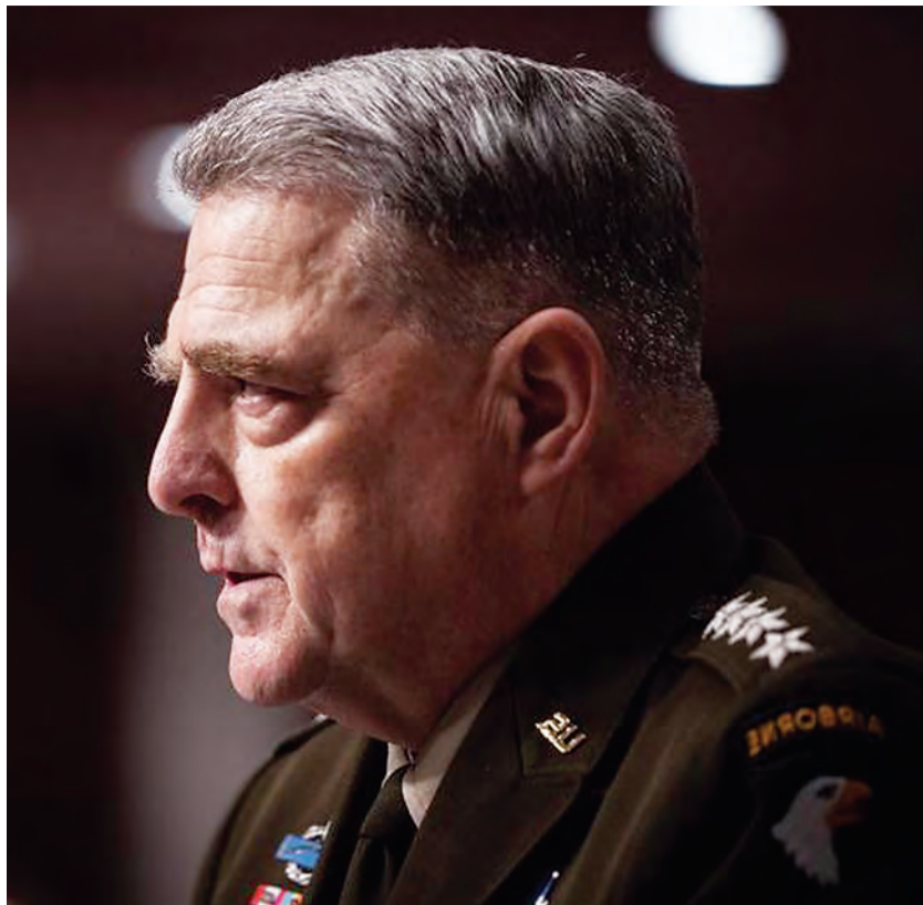
Chairman of the Joint Chiefs of Staff Gen. Mark Milley

Milley noted that most intelligence assessments indicated the collapse "would occur late fall, perhaps early winter, Kabul might hold till next spring."