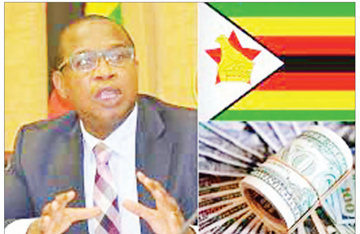
Zimbabwe Finance Minister Mthuli Ncube

A second factor is the access to trustworthy and correct information. Chinese company owners and managers do not rely on the media, and especially not on social media. They want the real low-down. When Zimbabwe changed