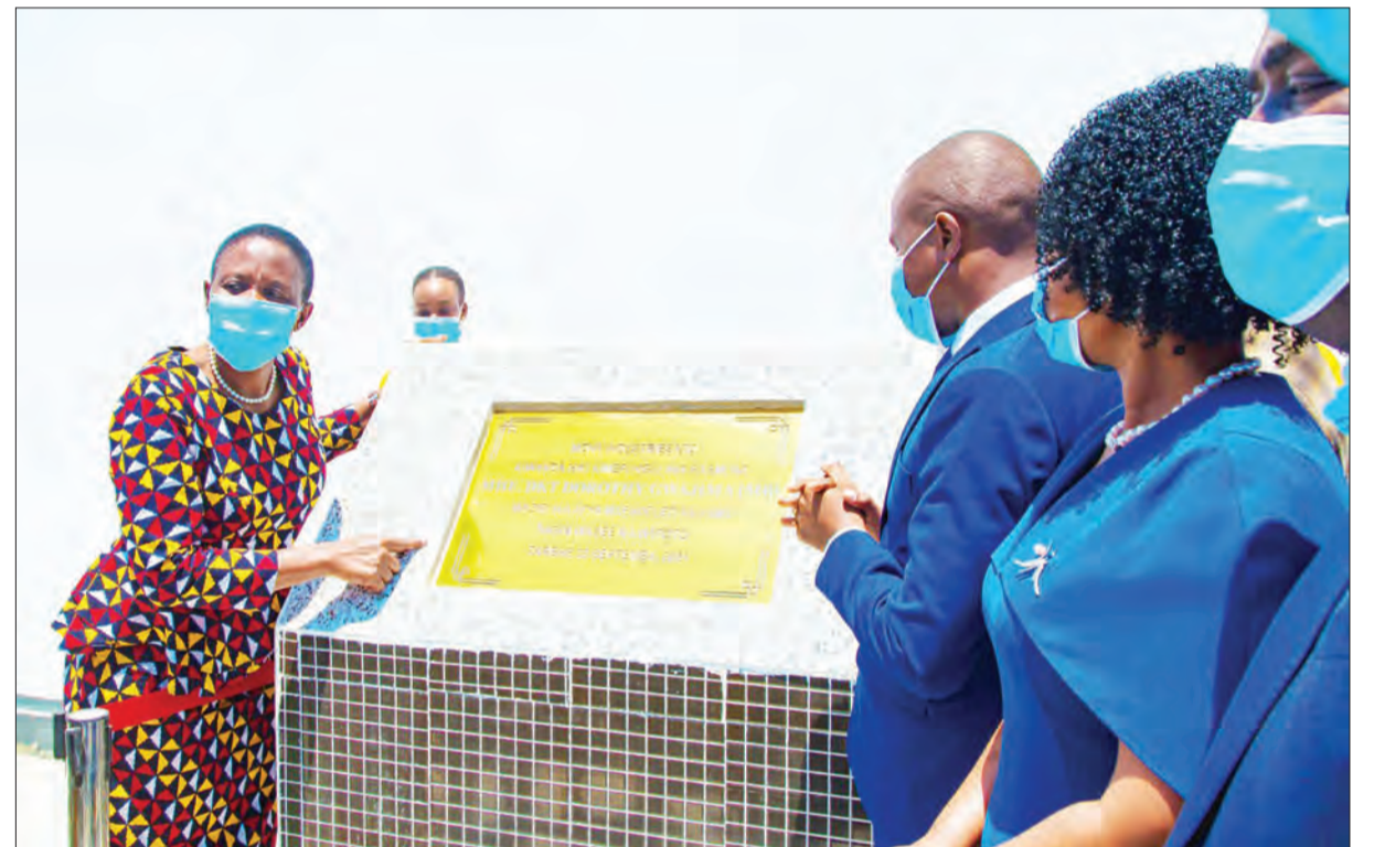
Minister for Health, Community Development, Gender, Elderly and Children, Dr. Dorothy Gwajima lays a foundation stone to launch Mony Industries medical devices factory at Kigamboni Uvumba in Dar es Salaam on Tuesday.

Mony Industries was established in 2018 and operates in the United Republic of Tanzania. The medical face masks are produced using a non-woven fabric forming technology. The use of state of the art semi-automatic technologies in production and the machineries are of top-notch qualities that were brought from China.