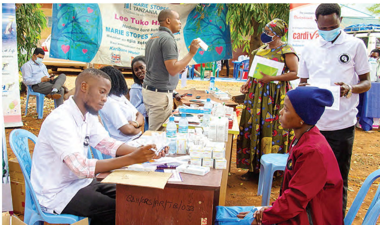
Doctors who are members of the Tanzania Medical Association (MAT), in collaboration with various stakeholders provide free medical check-ups to the public in Geita Region.

"Geita Residents should be proud of the GGML's investment in this hospital as most of the equipment found here is also found in major hospitals like Bugando and Muhimbili National Hospital. GGML's contribution to these sophisticated devices is to be applauded," he said.