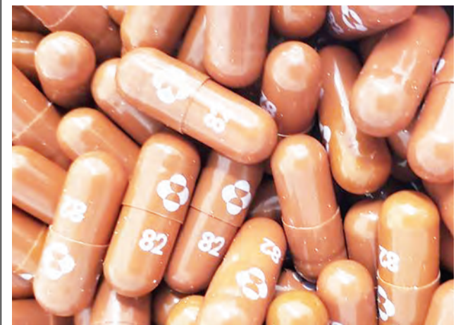
This handout photo obtained May 26, 2021 courtesy of Merck & Co Inc shows capsules of the investigational antiviral pill Molnupiravir.

Rivals are at least a year behind. Pardes began an early-stage trial last month, Shionogi plans to start large-scale clinical trials by year-end. Enanta aims to start human trials early next year and Novartis is still testing its pill in animals.