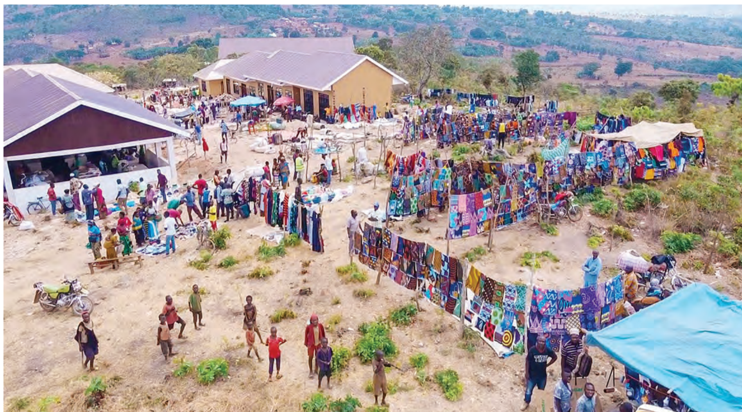
Vibrant trade at Kakonko cross border market

Around 250 participants from government, local authorities, academia, financial institutions, development partners, UN system, and private sector heard first hand new financing initiatives that the government is introducing to support national development plans.