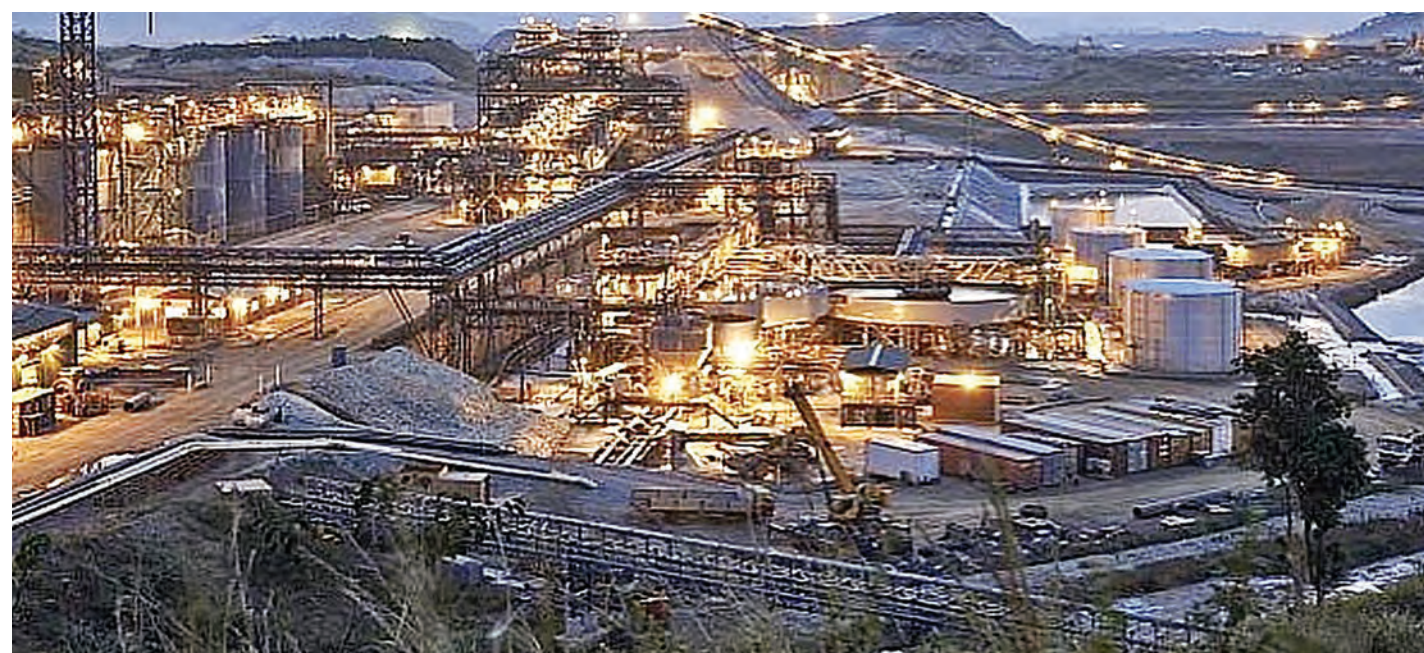
A night view of GGML mining plant.