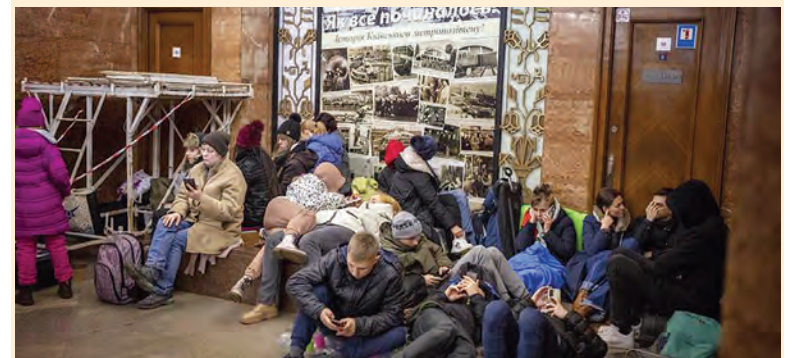
People rest in the Kyiv subway, using it as a bomb shelter in Kyiv, Ukraine, Feb 24, 2022.

On Wednesday, Russian Foreign Minister Sergei Lavrov said the United States would not like to see a rapid completion of the Moscow-Kyiv peace talks but hopes that Russia is mired in prolonged hostilities.