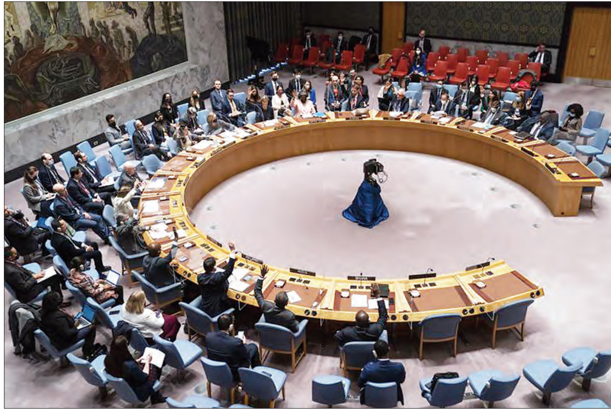
Members of the UN Security Council vote to abstain from a resolution proposed by the Russian Federation and therefore preventing its passage during a meeting of the UN Security Council on Wednesday at United Nations headquarters.

Since the conflict erupted on Feb 24, the council has held three briefings on the humanitarian situation in Ukraine - on