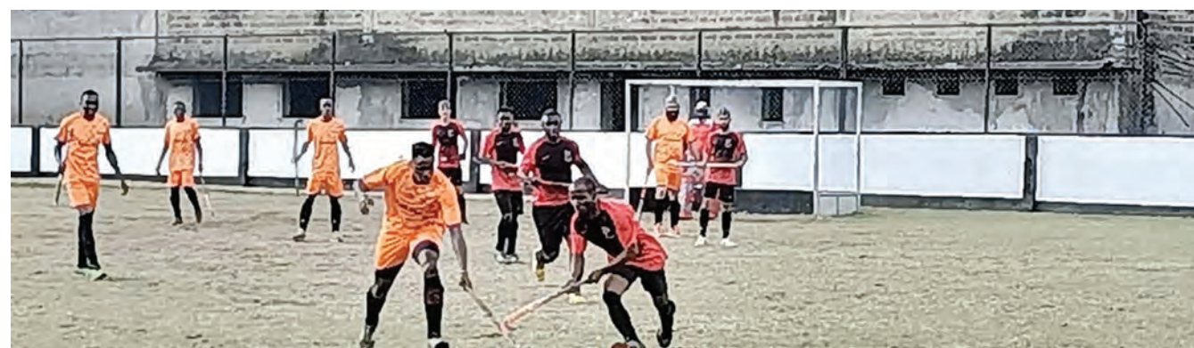
Hockey players battle it out in a recent Mapinduzi Cup hockey tournament that took place in Kilimanjaro.

According to him, Tanzania has not made its presence felt in the international basketball championships, appealing to the government and other stakeholders is to invest more in sports particularly basketball so that the country can excel internationally.