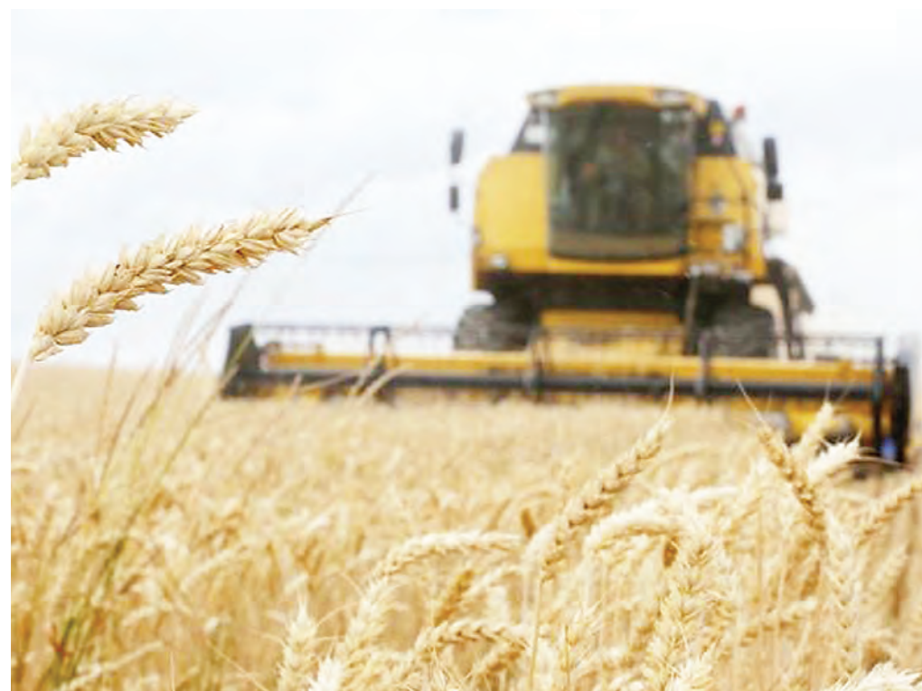
A combine harvesting picks up the wheat on a field near the Krasne village, in the Chernihiv area, 120 km to the north from Kiev, on July 05, 2019.

Food and fuel prices have increased sharply in the world since the start of the conflict in Eastern Europe, the WFP said. According to the Food and Agriculture Organization's Food Price Index, they reached an all-time high recently. The price of wheat increased by 24 percent between Feb 21 and March