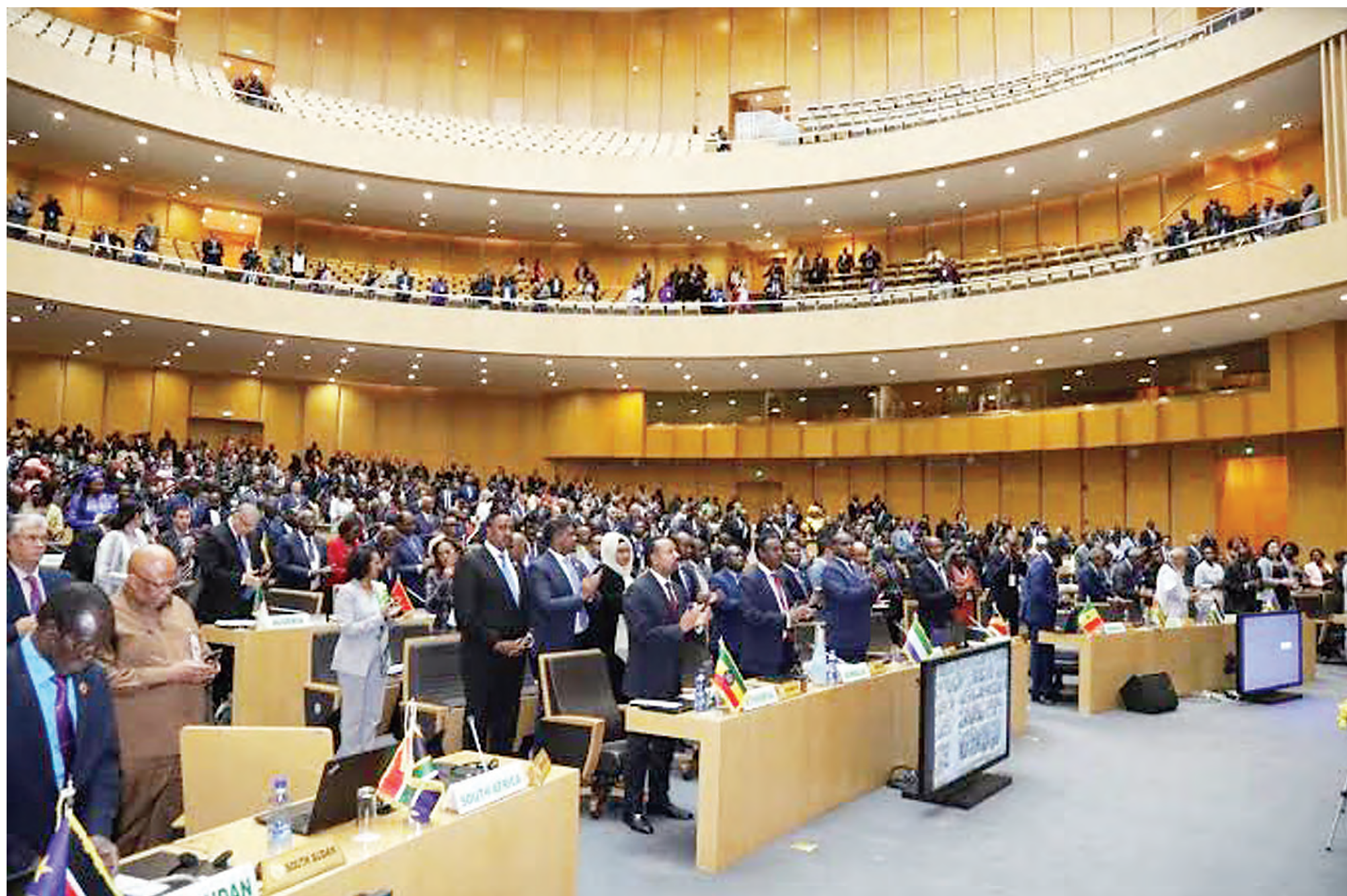
Photo shows the closing ceremony of the 32nd African Union (AU) summit of heads of state and government held at AU headquarters in February 2019. File photo

China has provided more than 100 batches of medical supplies to African countries and the AU. The China-aided headquarters of the Africa Centers for Disease Control and Prevention commenced its phase-1 project ahead of