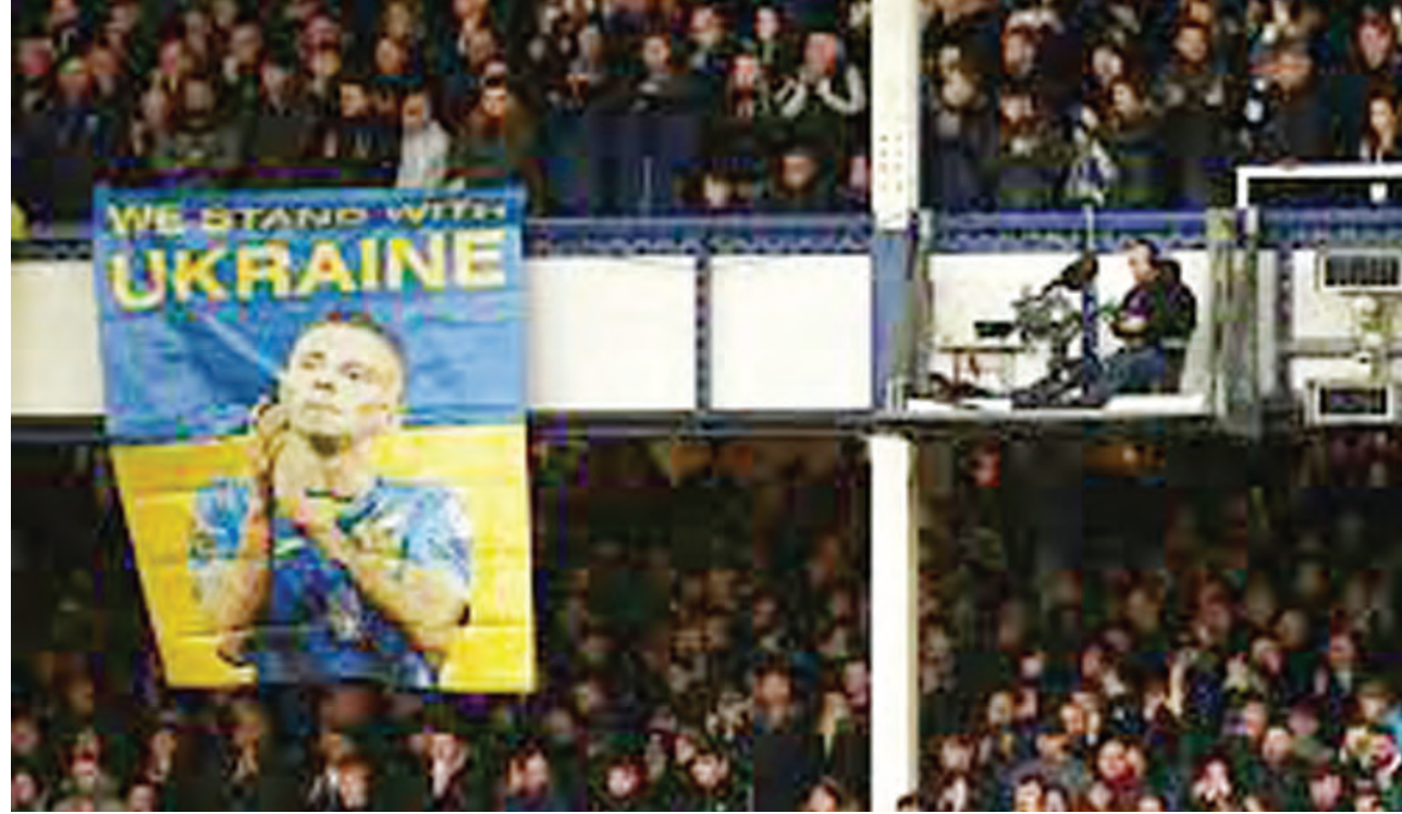
A Ukraine solidarity banner is hung from the stands at English club Everton's Goodison Park ground for its Premier League fixture against Manchester City on February 26