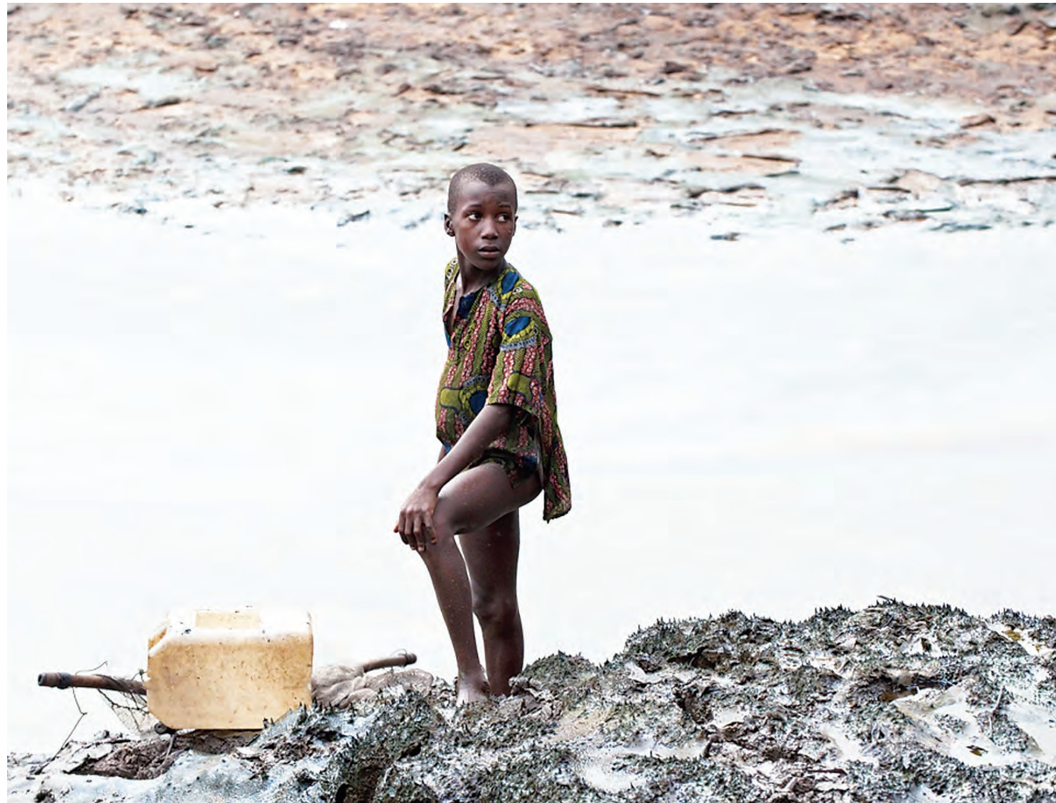
A boy stands on the oil-stained bank of a creek in Ogoniland, Nigeria. File photo

The government only began acting on the report's recommendations in 2016 – five years after its release. At the time, president Muhammadu Buhari said this marked a