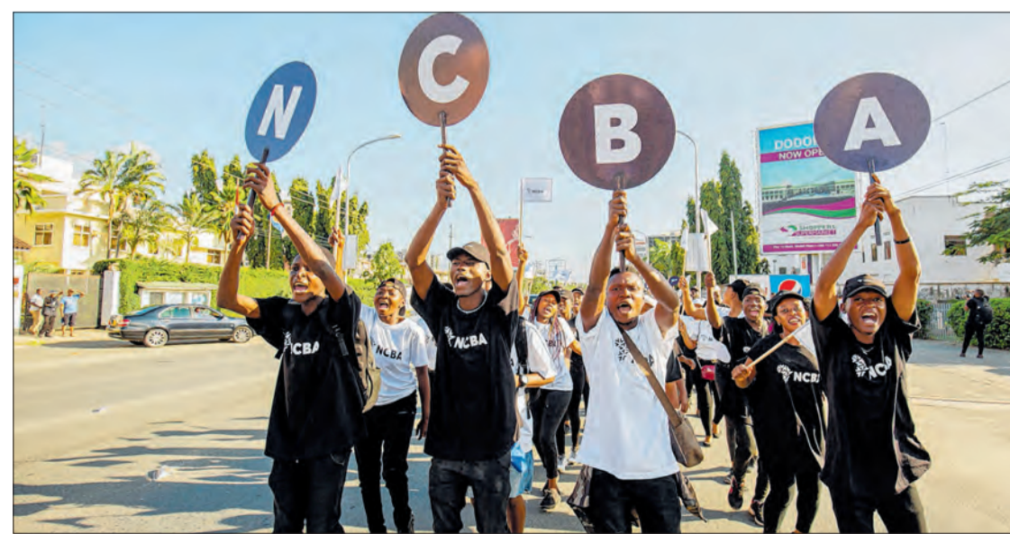
A historic NCBA arrival: The Staff parade of NCBA Bank Tanzania Limited storming the streets of Dar es Salaam city during the celebrations of the arrival and launch of the new bank in Tanzania.