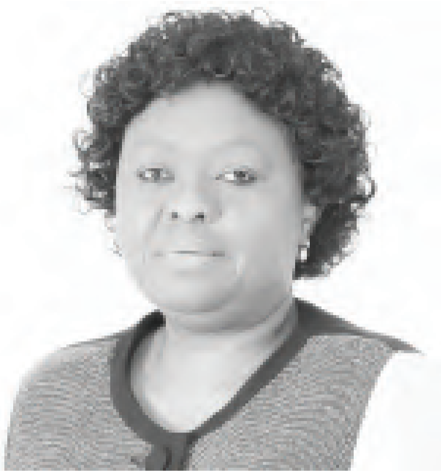
Every year, South Africa celebrates National Women's Month in August, in commemoration of the 9 August 1956 march of almost 20,000 women to the Union Buildings in Pretoria. Led by uMama uLilian Ngoyi, Rahima Moosa, Helen Joseph and Sophia de Bruyn, they marched to petition against the laws requiring South Africans who were classified as black in terms of the Population Registration Act to carry pass books.

Covid-19 has also taken its toll. Following the outbreak of the coronavirus in early March, South Africans were soon forced to