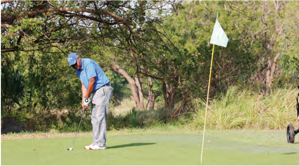
Deputy Minister for Foreign Affairs and East African Cooperation, Damas Ndumbaro, takes part at a monthly golf tournament, which took place at the Lugalo Club's course in Dar es Salaam yesterday. Telecomms firm, Zantel, organized the tournament.