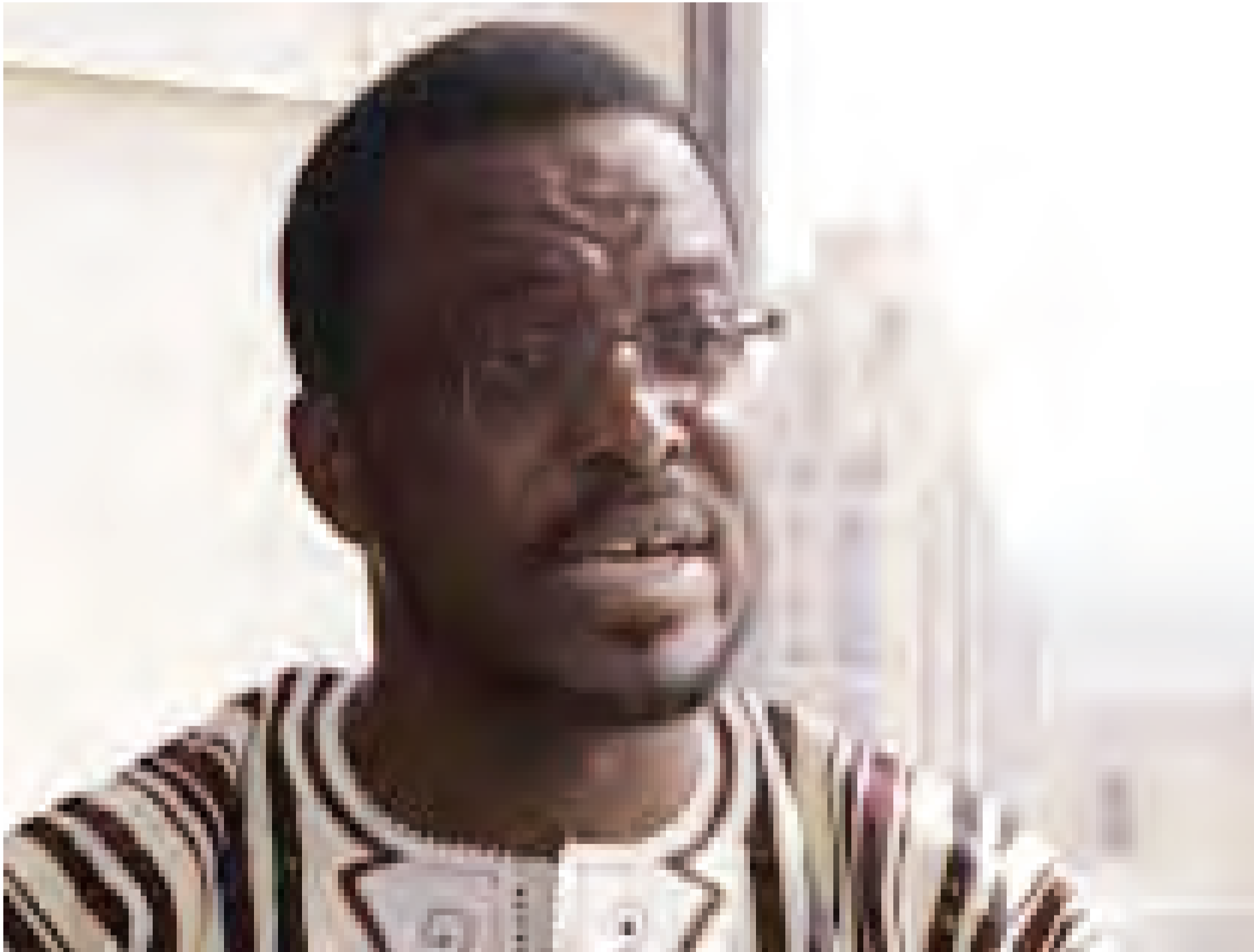
Former Education Minister backed up findings from a three year study conducted by two American independent research bodies, that showed the Liberian Education Advancement Program - has increased learning outcomes significantly

cation provider, Bridge. NTAL is happy to continue their campaign, teachers who are working hard and getting support, are not. While many mainstream media entities have seen through the allegations of angry ex-employees, a few others have continued to peddle the false claims with complete disregard for the facts which have been outlined. Others will think twice about working in Liberia and bringing funding into the economy if they have to work in an environment