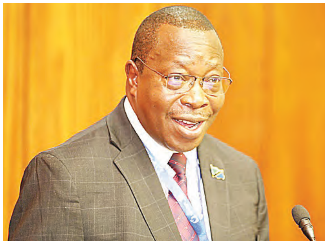
Finance and Economic Planning minister, Dr Philip Mpango.