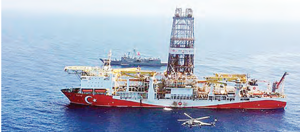
Turkish drilling ship Fatih had been carrying out exploration activities in the Tuna-1 sector in the western Black Sea for the past month.

Mr Aslam termed the find "a game-changer." "Turkey will no longer need to depend on US [LNG] supplies going forward," he said. Turkey will hope to replicate the success of Egypt, whose economy rebounded on the back of gas discoveries in the eastern Mediterranean that began with the Zohr gasfield and turned the North African country from