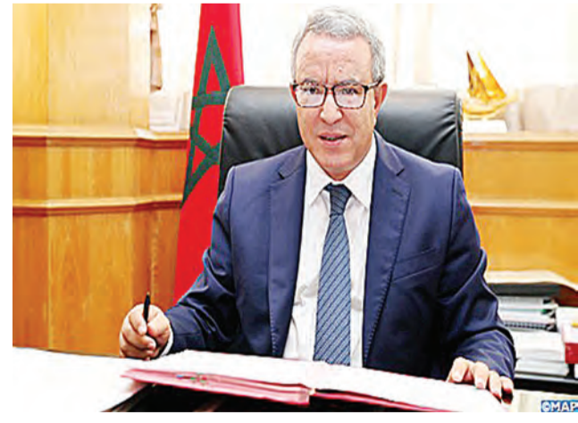
Former Moroccan minister and diplomat Mohamed Aujjar.

The fact finding mission on Libya was established by the Human Rights Council in June, inter alia, to document alleged violations and abuses of international human rights law and international humanitarian law by all parties in Libya since the start of 2016.