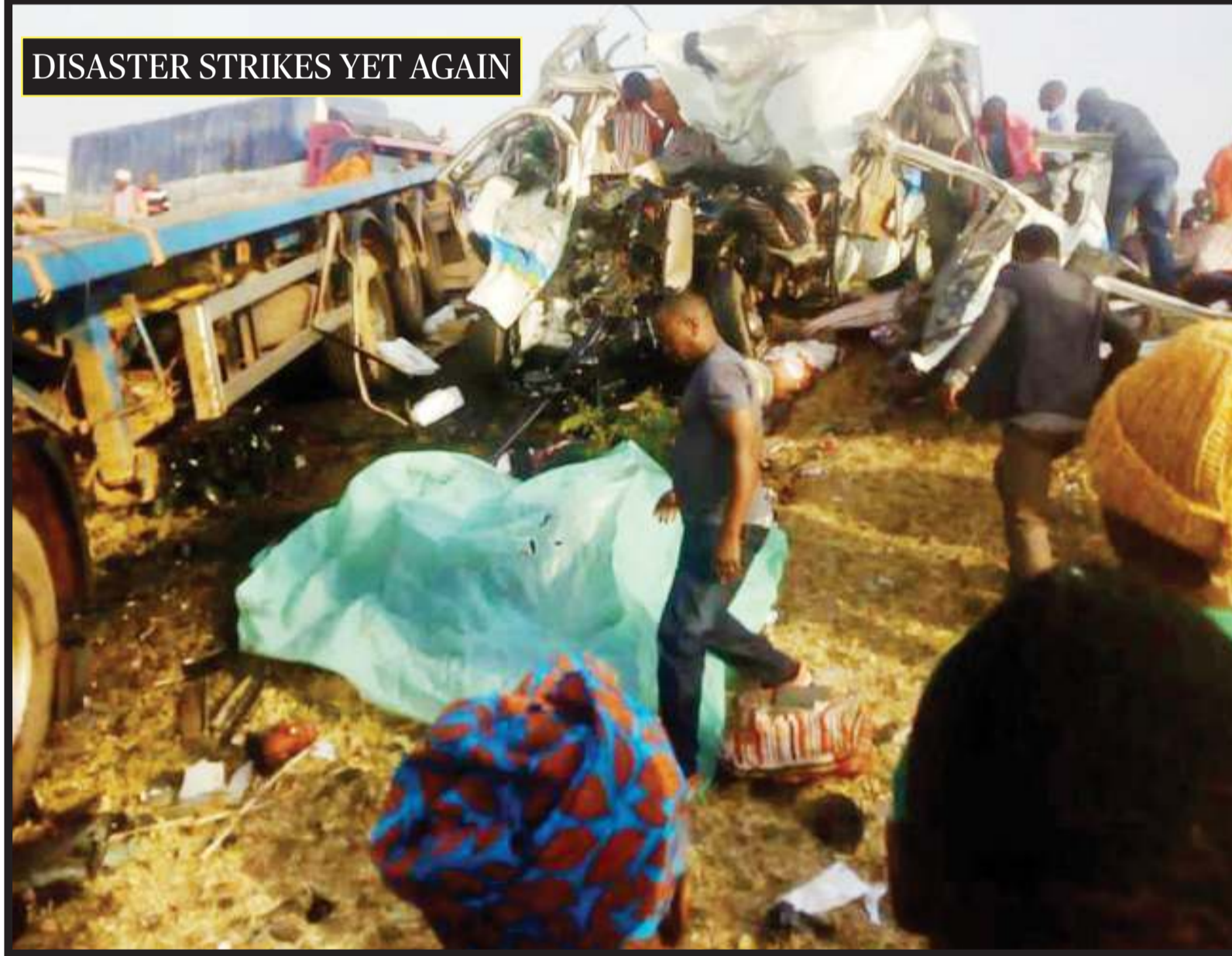
DISASTER STRIKES YET AGAIN This is the scene of yesterday's road crash at Shelui in Singida Region in which seven people including five Azam Media Group TV crew members died.