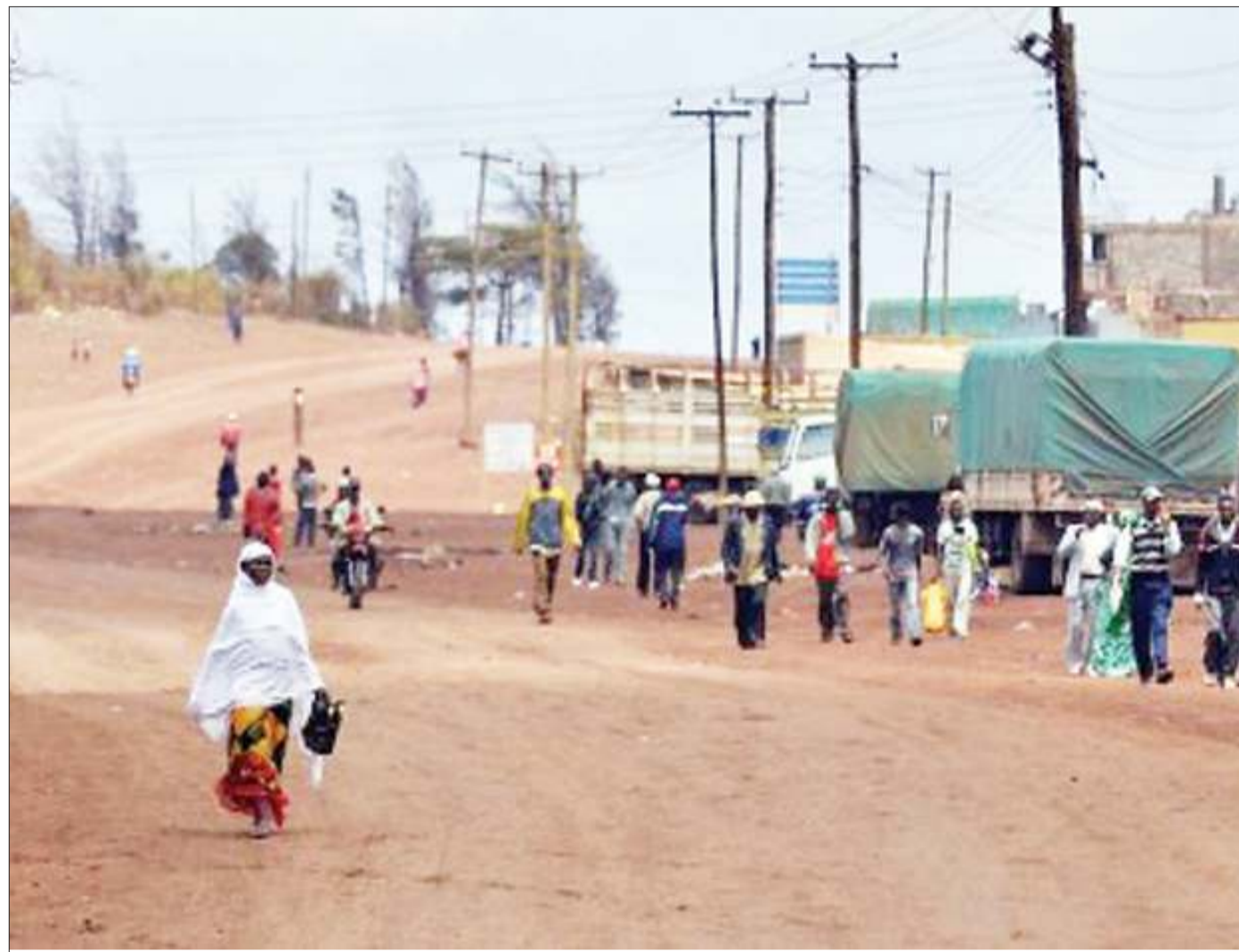
Peace initiatives over recent months have yet to stop the killings or promote genuine dialogue. File photo

The Kenyan government denied that the elders were killed in Kenya. Ethiopian authorities insisted that the killings took place on the Kenyan side, which was later confirmed by