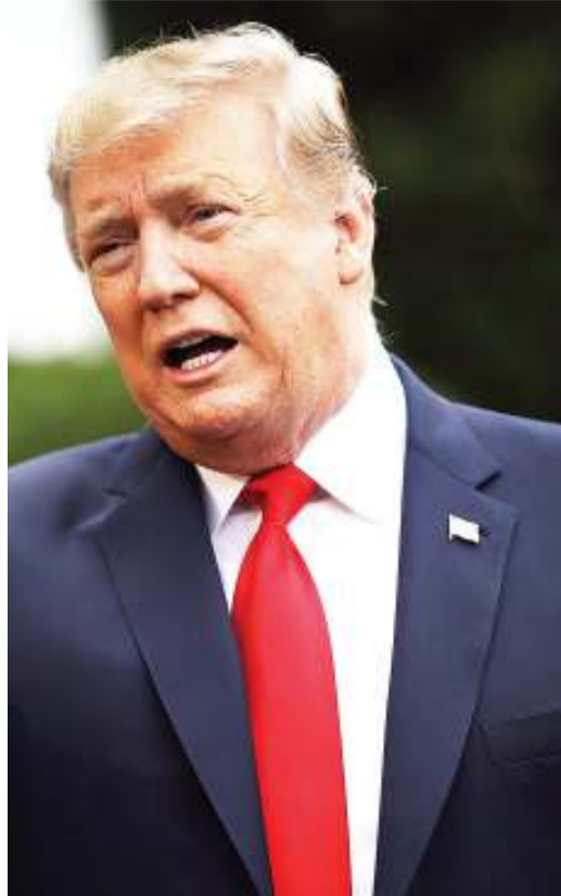
US President Donald Trump

"So important for our Country that the very simple and basic 'Are you a Citizen of the United States?' question be allowed to be asked in the 2020 Cen-