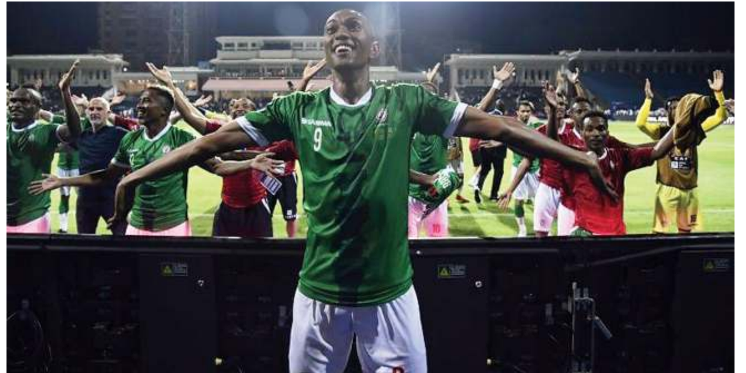
Madagascar's shootout win over DR Congo sent them into the quarter-finals in their first ever appearance in the Africa Cup of Nations

Mbemba smashed over as another left-wing cross found the Malagasy defence in