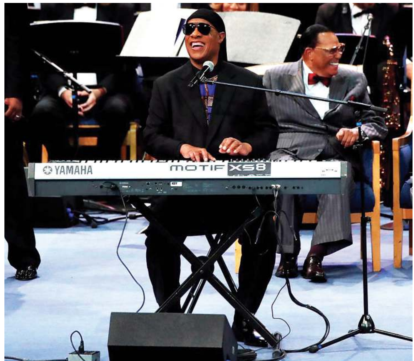
FILE PHOTO: Stevie Wonder performs at the funeral service for the late singer Aretha Franklin at the Greater Grace Temple in Detroit, Michigan, U.S., August 31, 2018.

Wonder, who has received more than two-dozen Grammy Awards, has produced a string