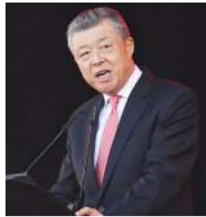
a live interview on BBC One's Andrew Marr Show, an hour-long British Sun-