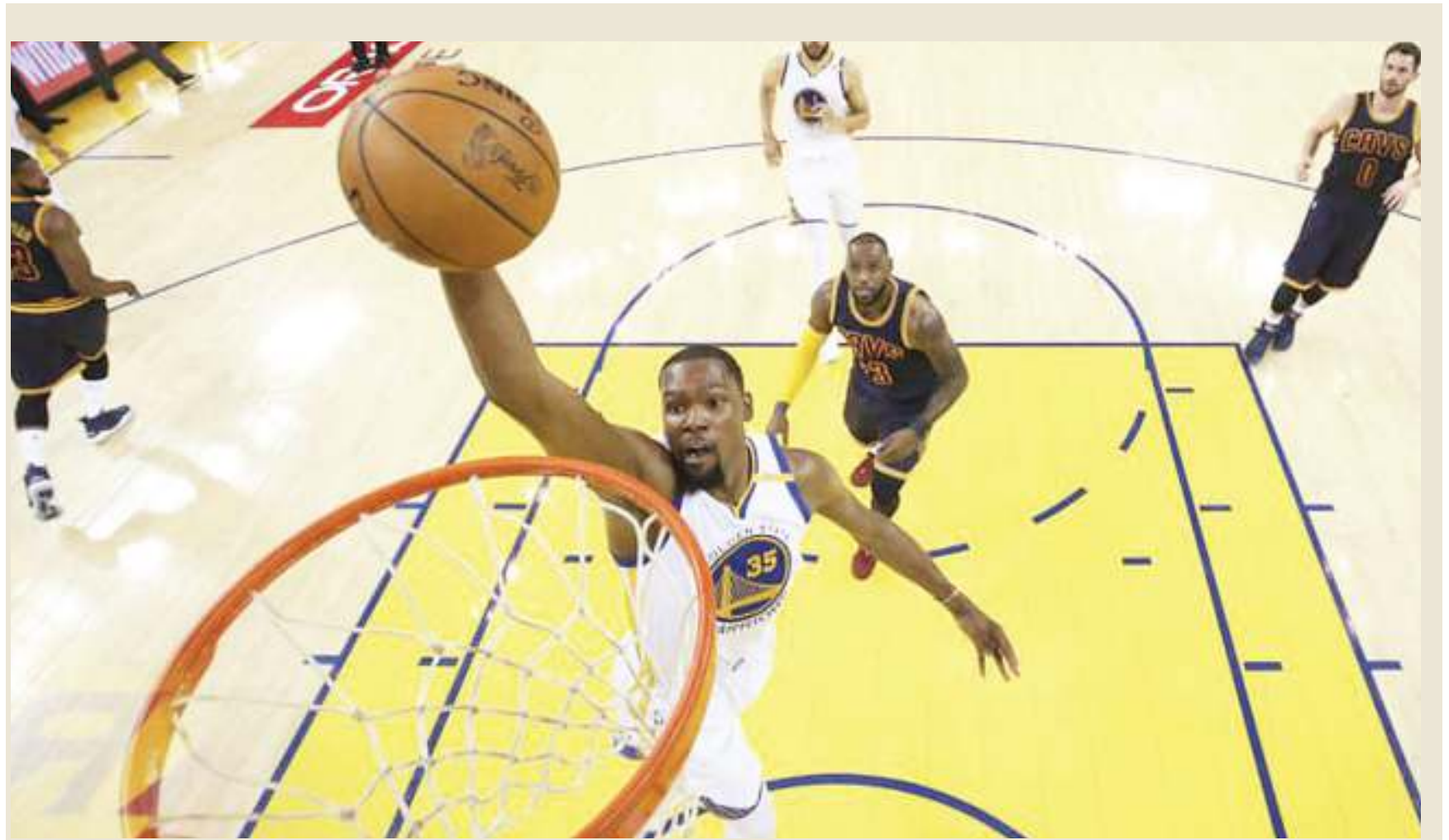
The main priority for the Golden State Warriors in the offseason was to retain free agent superstar Kevin Durant.