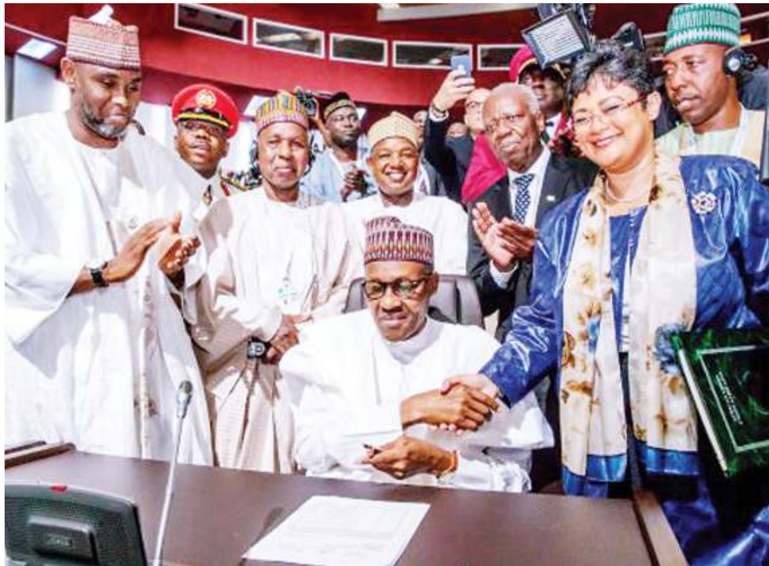
Nigerian President Muhammadu Buhari signs an agreement ahead of the launching of the African Continental Free Trade Area (AfCFTA) in Niamey, Niger.