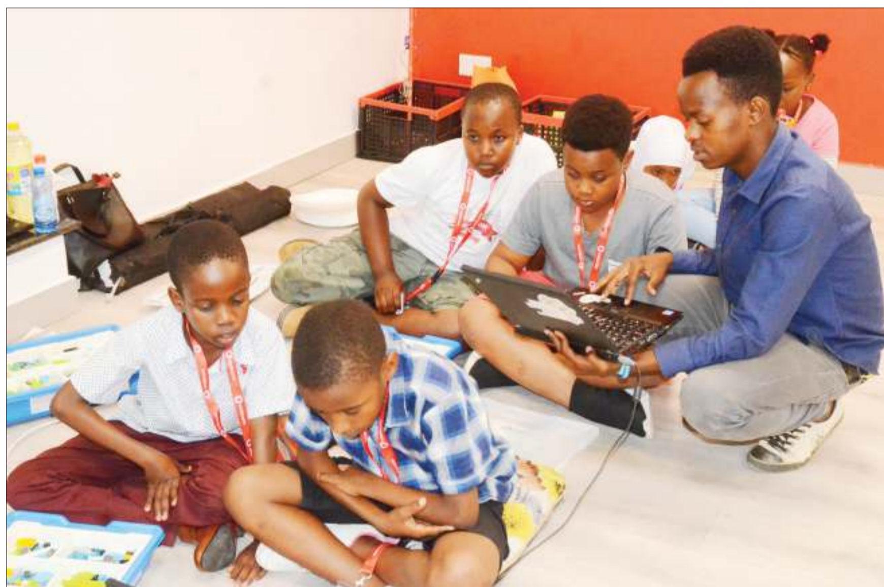
Children of Vodacom Tanzania employees attend training on how to use an instant school platform that helps students access a variety of text books. This was at the firm's 'Bring your Kid to Work' festival held in Dar es Salaam at the weekend.

UTSS is a Christian charitable organisation that promotes the wellbeing of PWA chiefly through education and advocacy.