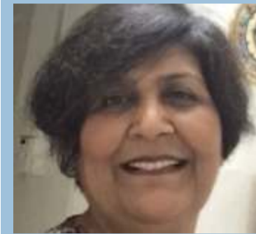
By Bhakti Shah, MPH

MENTAL health problems affect many - a fact that is usually overlooked because disorders tend to be hidden at work. The stigma attached to having a psychiatric disorder is such that individuals may be reluctant to seek treatment. Adequate treatment can help alleviate symptoms and improve performance, relationships and overall feeling of self-worth.