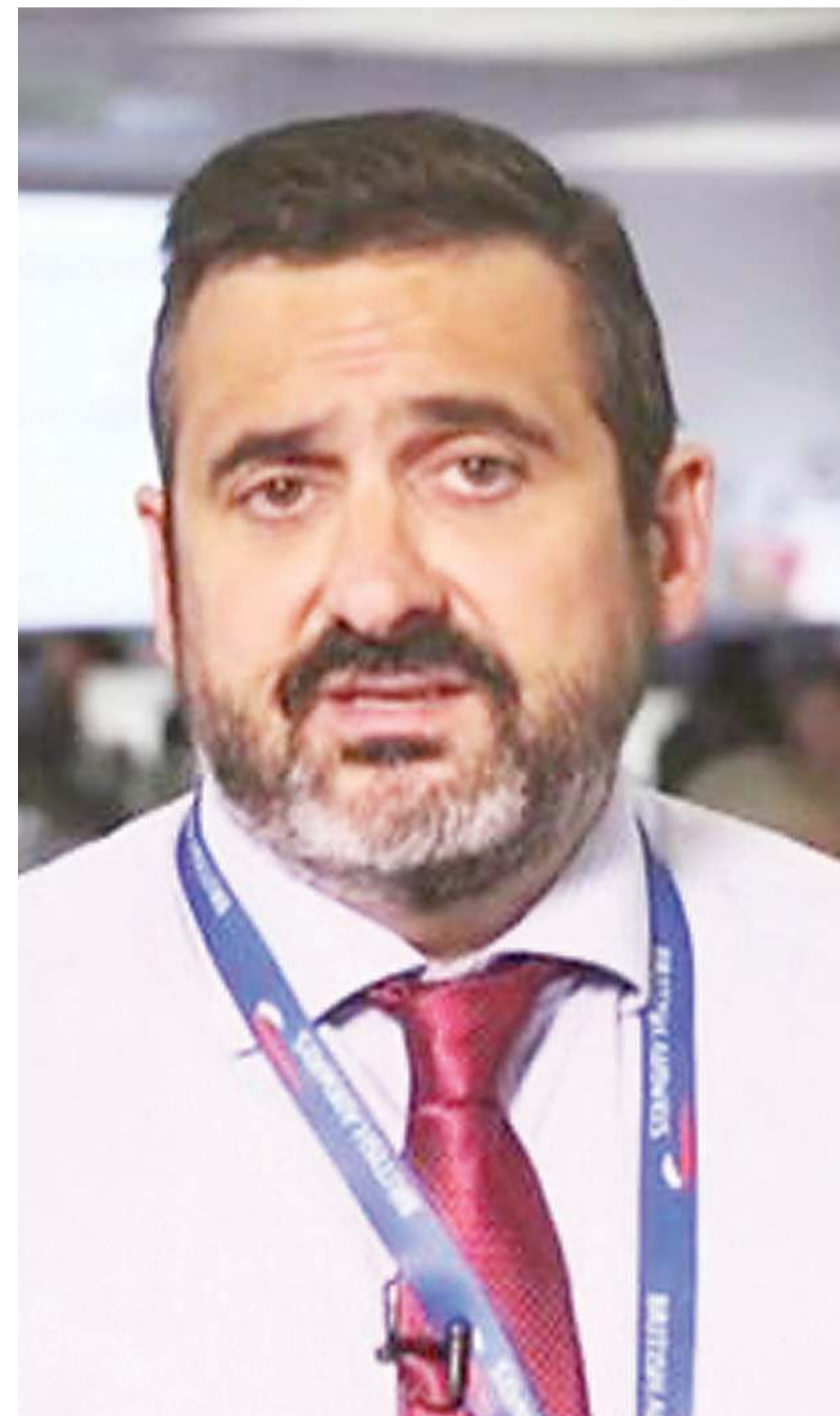
British Airways chairman and chief executive officer Alex Cruz.

The EU's General Data Protection Regulation allows, which took effect on May 25, 2018, requires companies to take technical precautions such as encryption to ensure customer data is protected. It also states that firms must notify authorities about breaches within 72 hours after learning about them. Violations may lead to fines of as much as 4% of a company's annual sales.