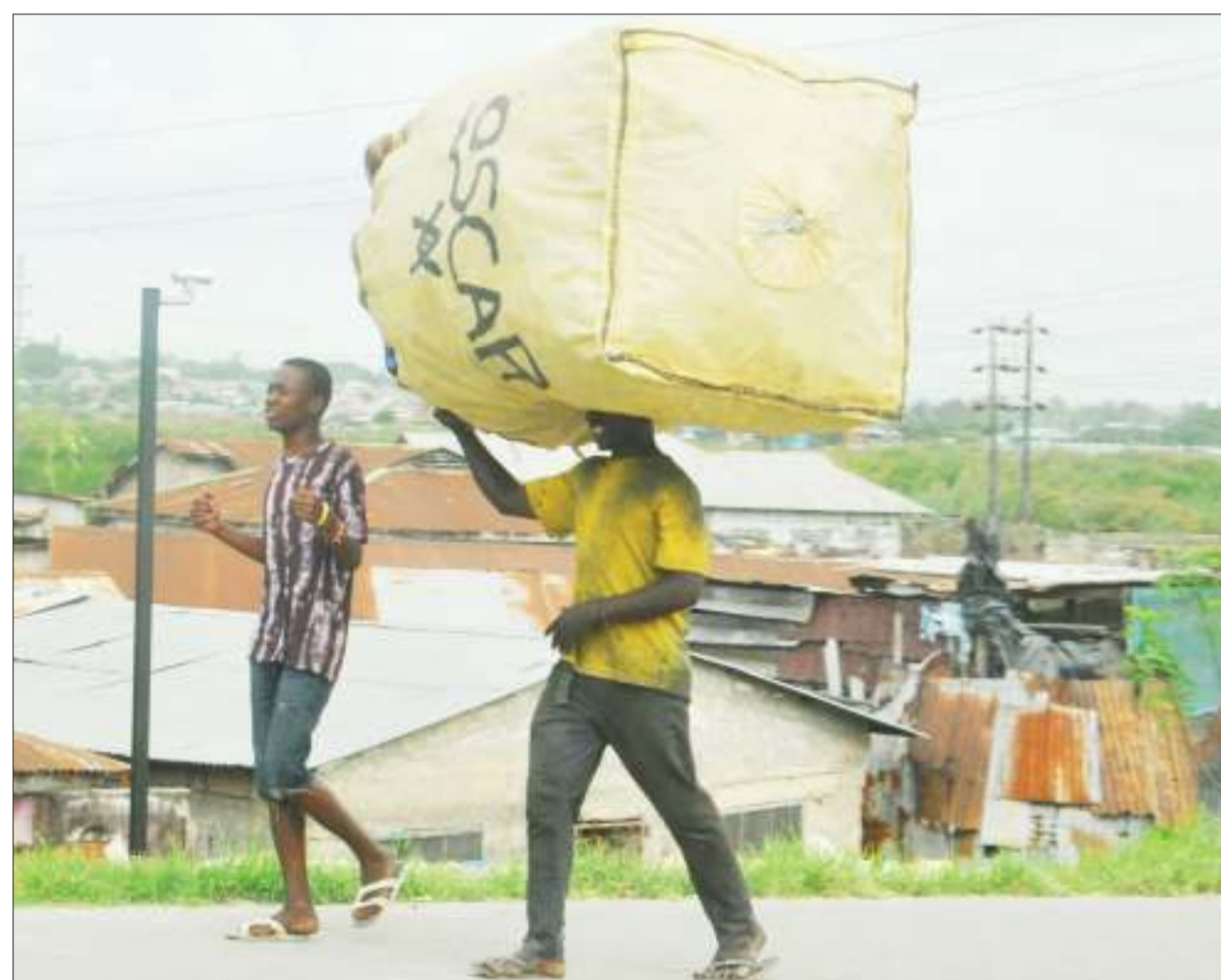
A Dar es Salaam resident goes hunting for customers for empty plastic bottles, as captured along the Jangwani Valley stretch of the city's Morogoro Road yesterday.