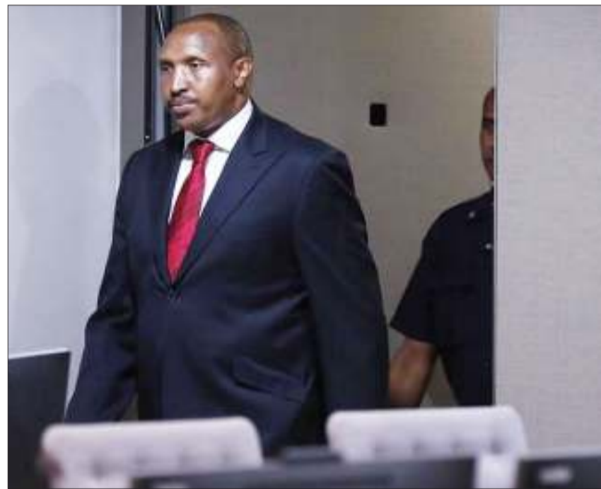
Congolese militia commander Bosco Ntaganda enters the courtroom of the International Criminal Court (ICC) during his trial at the Hague in the Netherlands, yesterday.

He was the deputy chief of staff and commander of operations for rebel group the Patriotic Forces for the Lib-