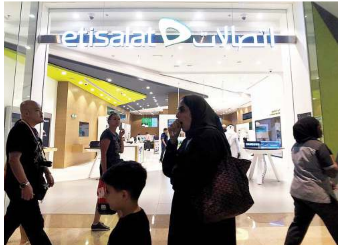
On Thursday Etisalat sent a text message to its subscribers saying: 'Great news! No more bill shocks on data!'

"Now the user can terminate the service contract and choose another service for a simple charge equal [to] one month fee, which is considered operational fees," he said. The TRA said on Friday these amendments have already been introduced to new contracts for mobile phone services and will be applied to other contracts in time.