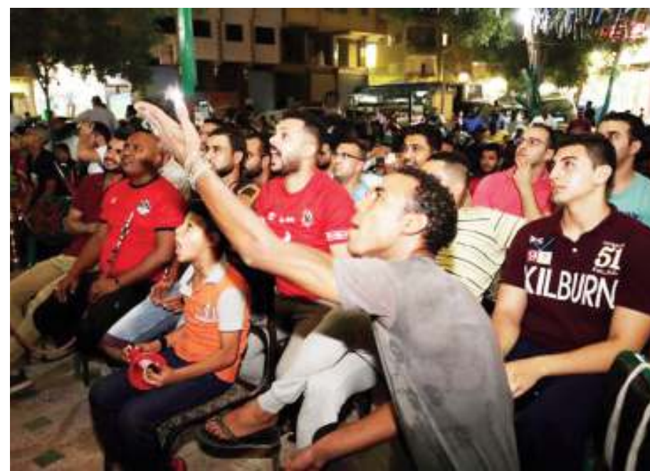
Egyptians react as they watch a telecast of Egypt playing against South Africa at cafe in Cairo, Egypt on July 6, 2019.

After Salah and other prominent team mates came to Warda's defence and Warda posted an apology on Facebook, the EFA reinstated him,