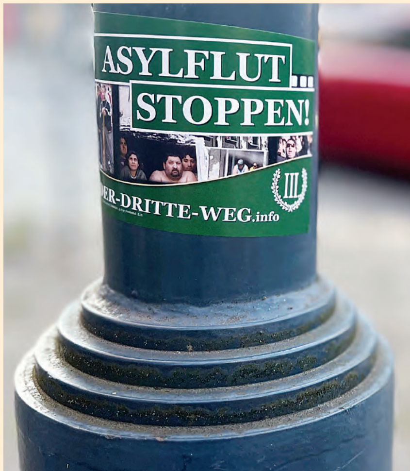
A sticker of German far-right and neo-Nazi political party The Third Way (Der III Weg) with the lettering 'Stop the flood of asylum seekers' is seen on a lamp post in Zwickau, Saxony, eastern Germany, on Aug 14, 2024.

The militant group Islamic State claimed responsibility for the Solingen