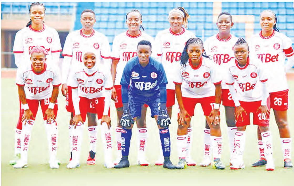
The Simba Queens squad pictured on Thursday before their CECAFA Women's Champions League qualifiers against Uganda's Kawempe Muslim Ladies at the Abebe Bikila Stadium in Addis Ababa, Ethiopia. Kawempe Muslim Ladies won 2-0.

The 2025 AFCON finals are scheduled to take place in Morocco from December 21, 2025, to January 28, 2026.