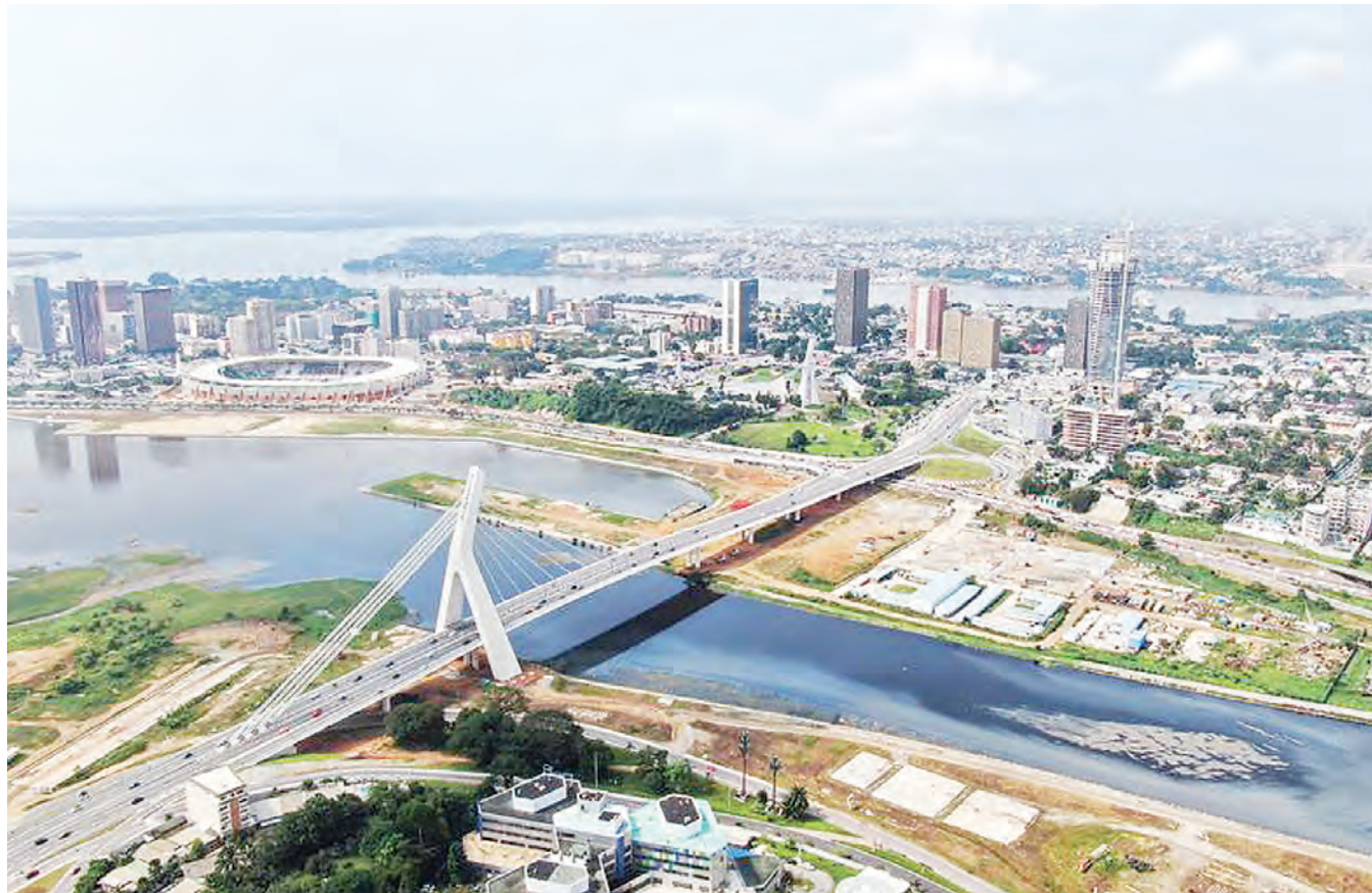
This aerial photo taken on Jan. 9, 2024 shows a view of Cocody Bridge in Abidjan, Cote d'Ivoire.