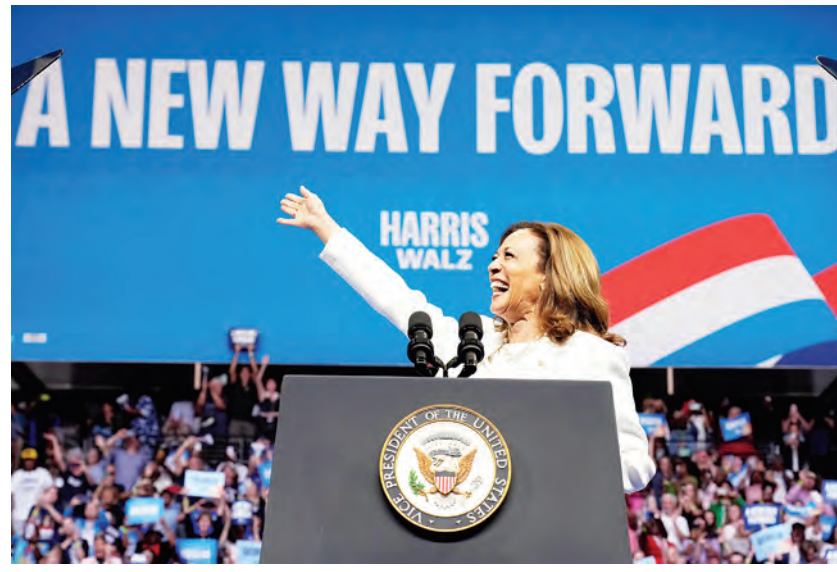
Democratic presidential nominee Vice-President Kamala Harris speaks at a campaign rally in Savannah, Georgia, United States, Aug 29, 2024.

Since becoming the Democratic candidate for president last month, Harris has surged in the polls, brought in hundreds of millions of dollars in campaign dona-