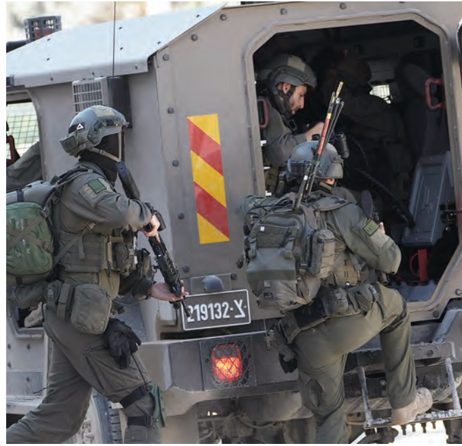
Members of Israeli forces prepare to enter in an armored vehicle during a military operation in the West Bank refugee camp of Nur Shams, Tulkarm on Thursday.

dozers edged along empty, rubbish-strewn streets as the sound of drones pierced the sky.