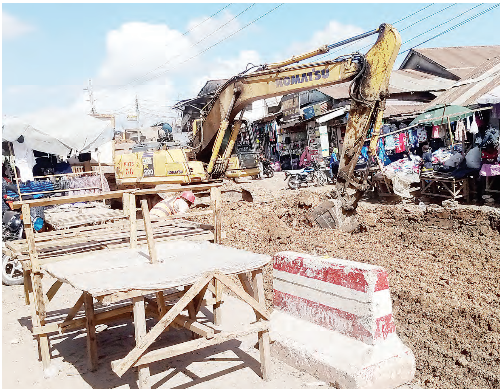
Construction of Dar es Salaam's rapid transit bus project infrastructure in progress along the Gongo la Mboto stretch of Nyerere Road yesterday.

"Referrals abroad have significantly decreased. Previously, nearly all patients arriving at Ocean Road Cancer Institute were often in advanced stages of illness. Thanks to the investments, over 70 percent of patients come with the disease at an early stage," he said.