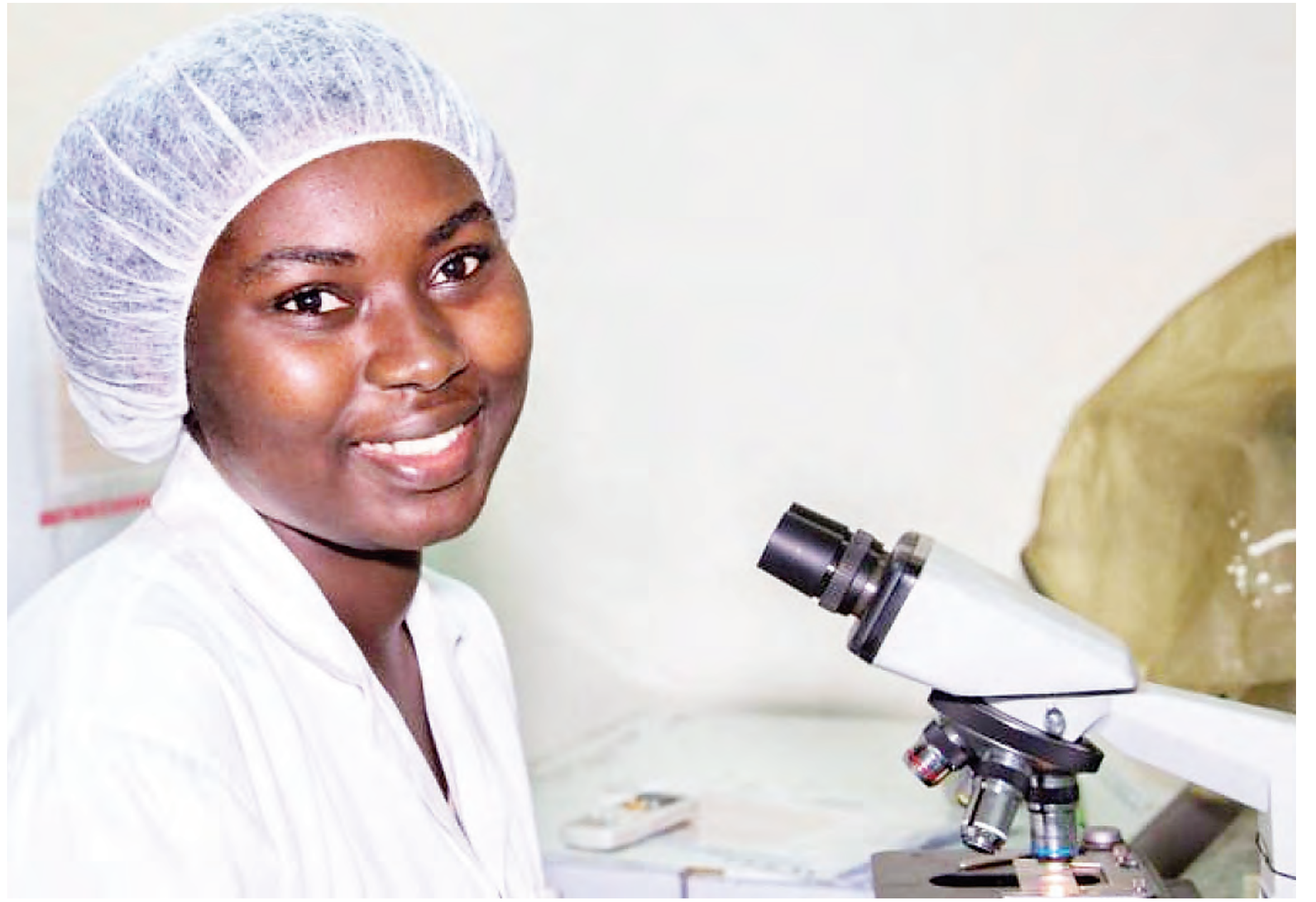
A staff member at the Environment and Agribusiness Laboratories (ENVAL) in Côte d'Ivoire