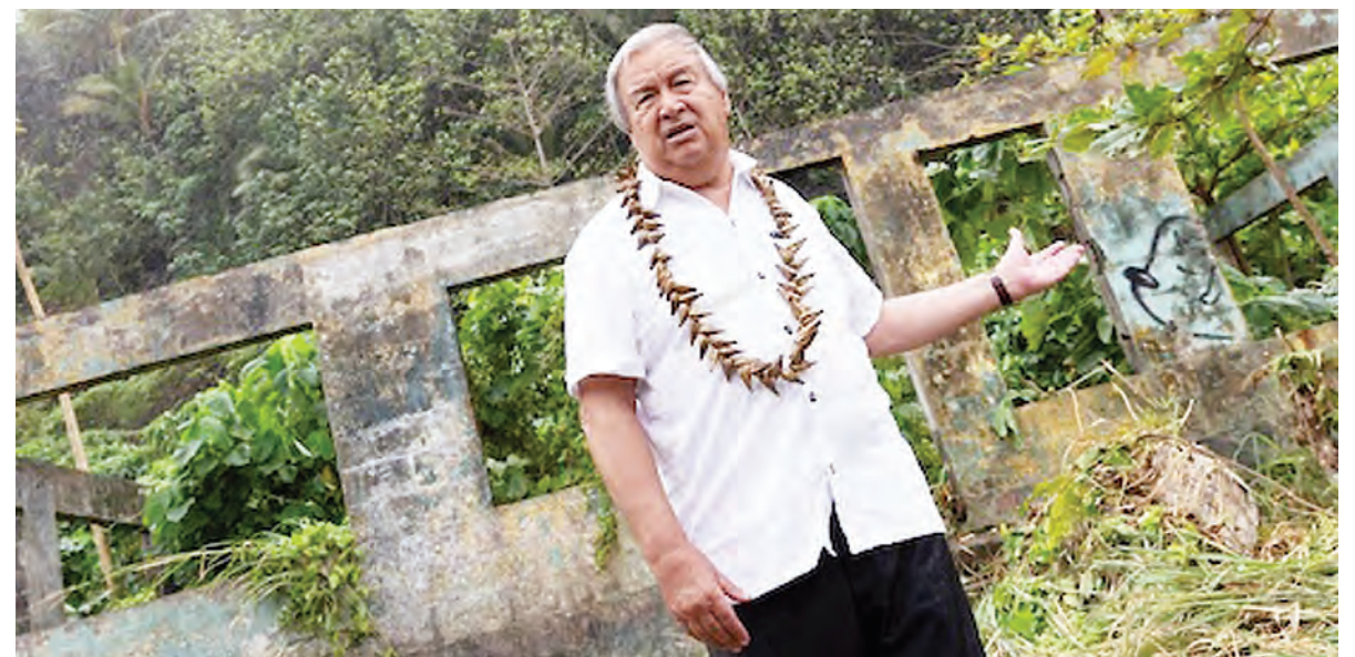
UN Secretary-General António Guterres visits a house in Lalomanu that has been abandoned due to storm damage and flooding as a result of climate change during his trip to Samoa.

For years, Pacific Island leaders have led the way in calling for world leaders and industrialized nations to take rigorous action to halt the increasing carbon dioxide emissions destroying earth's atmosphere. In Tonga, the