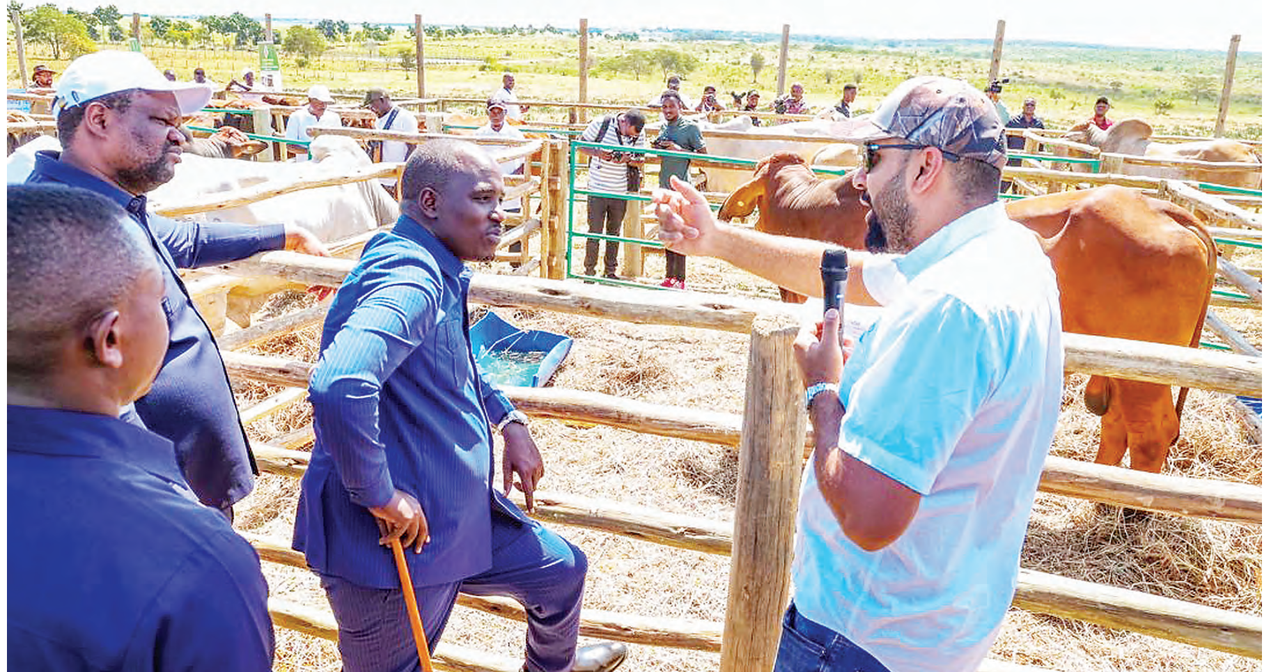
The June 2024 livestock exhibition and auction, spanning three days, was officially launched by Deputy Minister for Livestock and Fisheries, Alexander Mnyeti (with stick). File

Mushi explained that indigenous cattle hides are less valued due to their small size and the presence of bumps. "Many herders do not understand the importance of hides, and most cattle raised have lim-