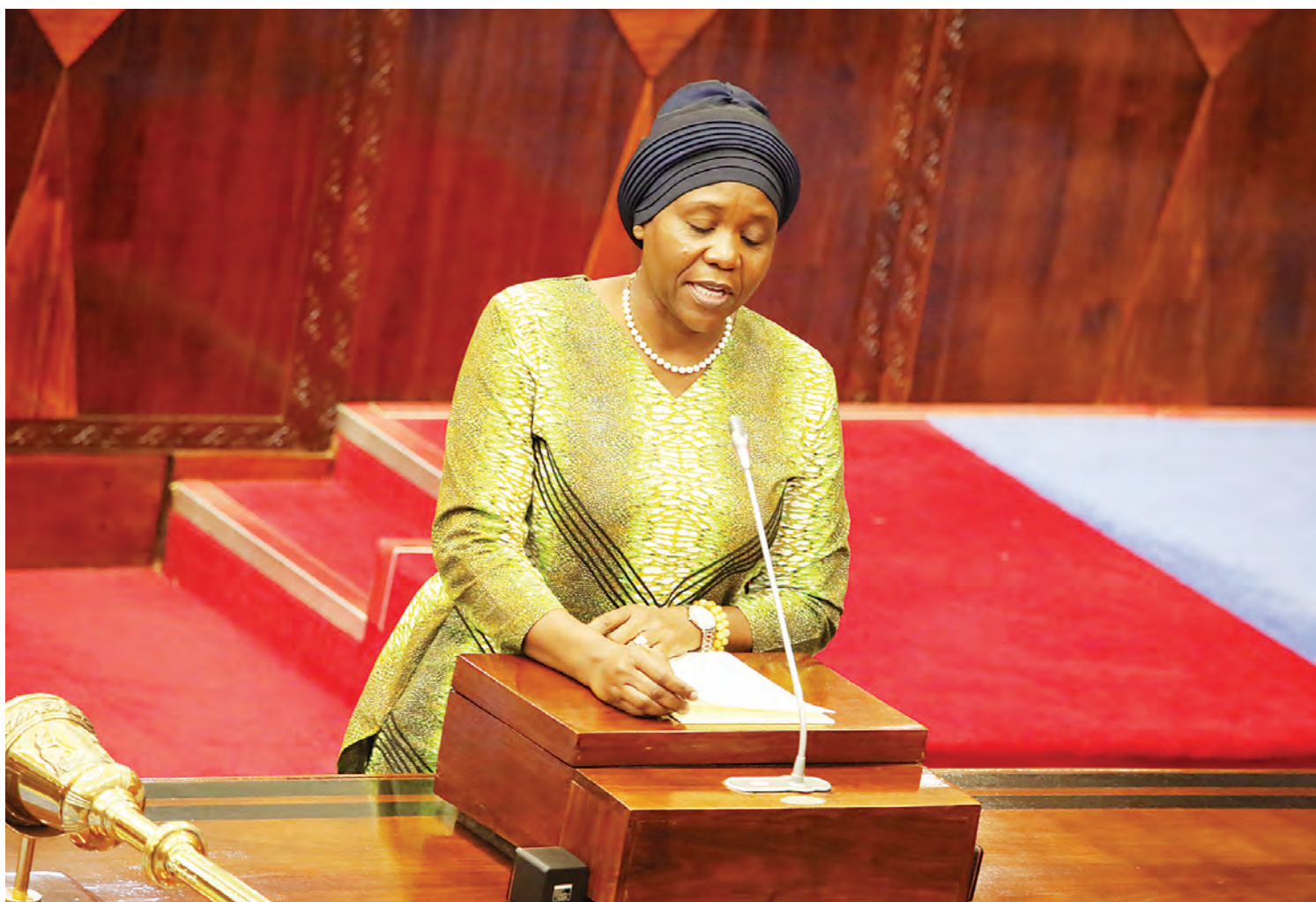
Community Development, Gender, Women and Special Groups minister Dr Dorothy Gwajima pictured in the National Assembly in Dodoma city yesterday tabling a bill on amendments to various pieces of legislation relating to the rights of children.