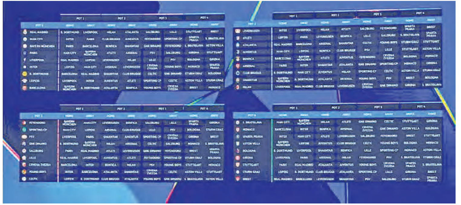
This photograph shows a screen displaying fixtures of the group stage of 2024-2025 UEFA Champions League football tournament, at the Grimaldi Forum in Monaco on August 29, 2024.

Defending champion Madrid's slate of opponents also include home games against seven-