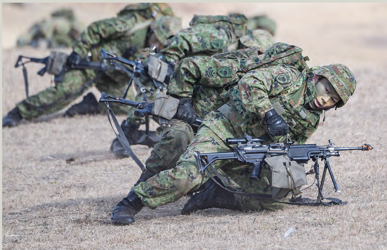
Japanese troops take position during a joint military drill and demonstration conducted by Japan's Ground Self-Defence Force 1st Airborne Brigade with participants from the US, Britain, Canada, Germany and others at Camp Narashino in the city of Funabashi, Chiba prefecture, east of Tokyo on January 7, 2024.

"As we increase our defensive strength, we need to build an organization that is able to fight in new ways," the defense ministry said in the annual budget request, which calls for a 6.9 percent