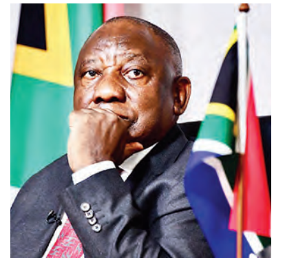
establish a sovereign wealth fund," said Ramaphosa.

The president, however, insisted that "at present, with our fiscal position, with substantial current account and budget deficits, it is not the most opportune and favorable time for us to establish a sovereign wealth fund."