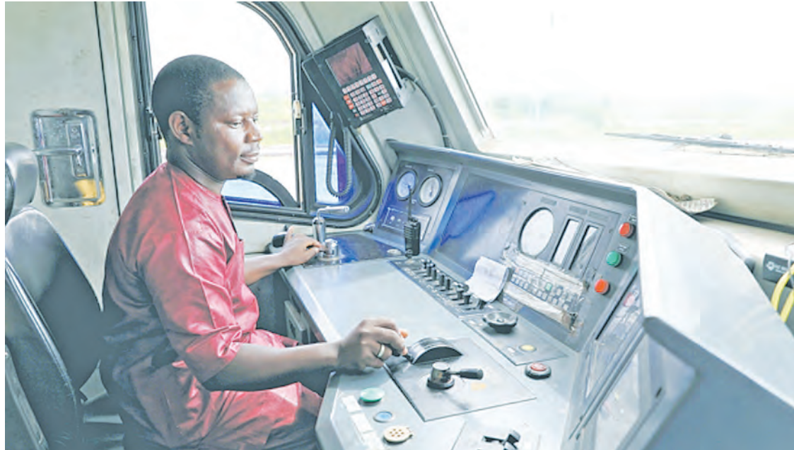
A train driver prepares for departure at Idu Railway Station, the starting point of the Abuja-Kaduna Railway in Abuja, the capital of Nigeria.

China and Africa will implement several livelihood projects such as growing mushrooms using Chinese technology, biogas promotion and greenhouse cultivation, the report said, adding that the enhanced cooperation aims to further increase Africa's capacity in realizing independent and sustain-