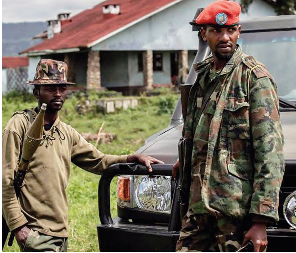
M23 rebels guard the area during the meeting between the East African Regional Force (EACRF) officials and M23 rebels during the handover ceremony at Rumangabo camp in eastern Democratic Republic of Congo on Jan 6, 2023.

flikt in Sudan, calling for the reactivation of the peace process in Sudan to find a lasting solution, and welcomed efforts by the African Union, the Intergovernmental Authority on Development, and other African sub-regional organizations, underlying the need for Africa's leadership and coordination of efforts.