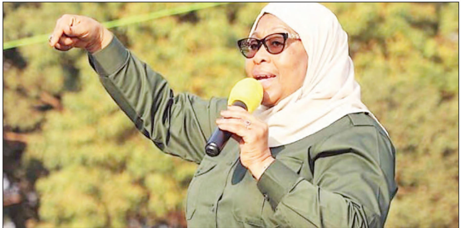
President Samia Suluhu Hassan addresses a gathering in Moshi municipality on her way to Marangu gate in Kilimanjaro Region to record 'Tanzania: The Royal Tour' documentary in September 2021.

I like his way of thinking and hope he delivers. Why not? Our country's incredibly rich natural tourism offer earned it the title of 'Africa's Leading Destination' in 2021. Furthermore, destination Tanzania boasts wildlife and beach attractions, the advantage that some countries that are ahead of us in the sector don't