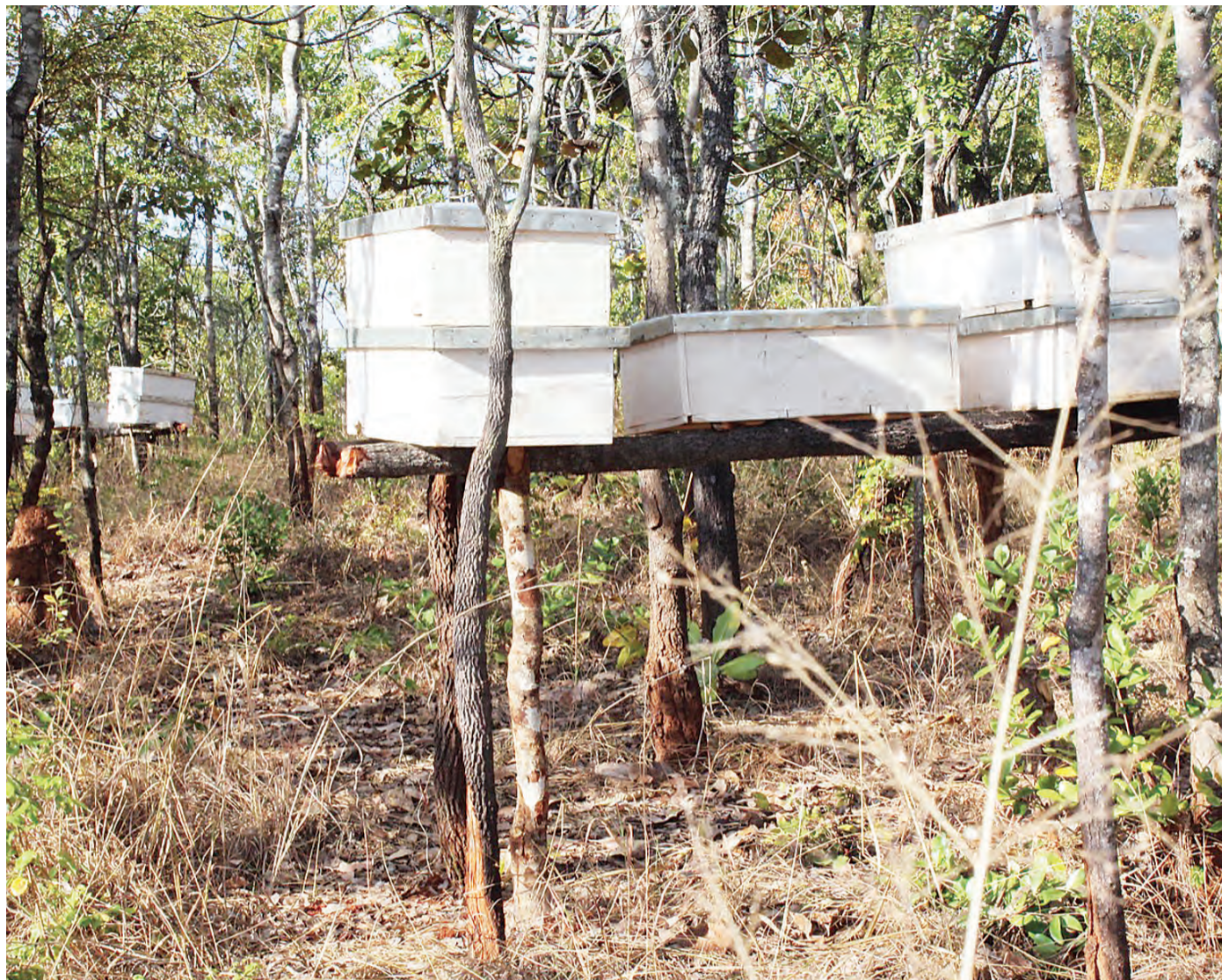
Beehives placed in a forest

Perhaps the participant was inadvertently shedding some light on the Tanzania Forest Fund (TaFF), the expenditure of which has raised questions from the CAG in his latest report. According to the report 1.9bn/- which is 80% of the Fund's accumulated financial resources has been spent on beekeeping