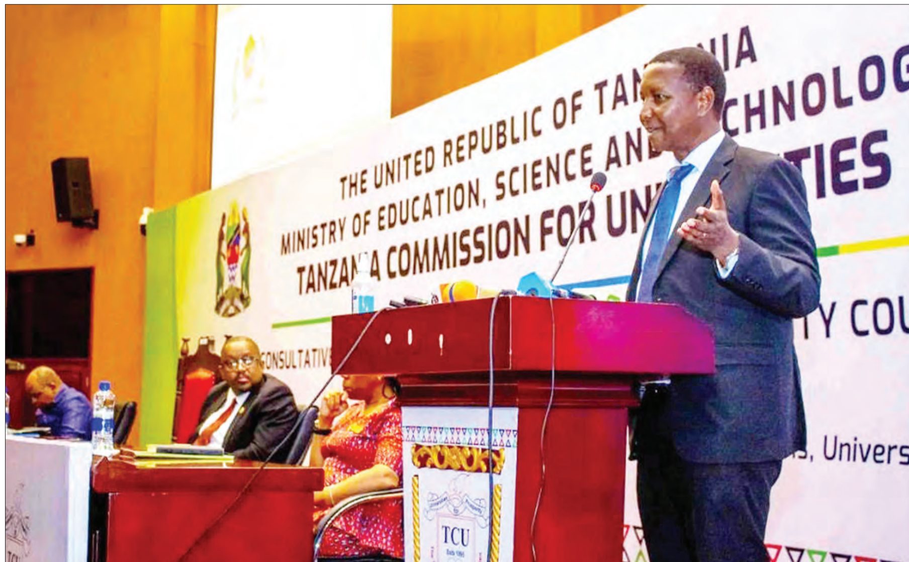
Education, Science and Technology minister Prof Adolf Mkenda addresses members of university councils, senates and governing boards at an event organised by the Tanzania Commission for Universities as he closed a two-day consultative workshop held in Dar es Salaam at the weekend.