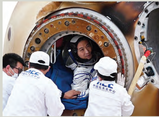
Astronaut Fei Junlong is helped out of the return capsule of the Shenzhou-15 manned spaceship at the Dongfeng landing site in north China's Inner Mongolia Autonomous Region yesterday. The return capsule of the Shenzhou-15 manned spaceship, carrying astronauts Fei Junlong, Deng Qingming and Zhang Lu, touched down at the Dongfeng landing site in north China's Inner Mongolia Autonomous Region safely yesterday.

in the space station complex for 186 days and conducted a number of experiments which produced fruitful results.