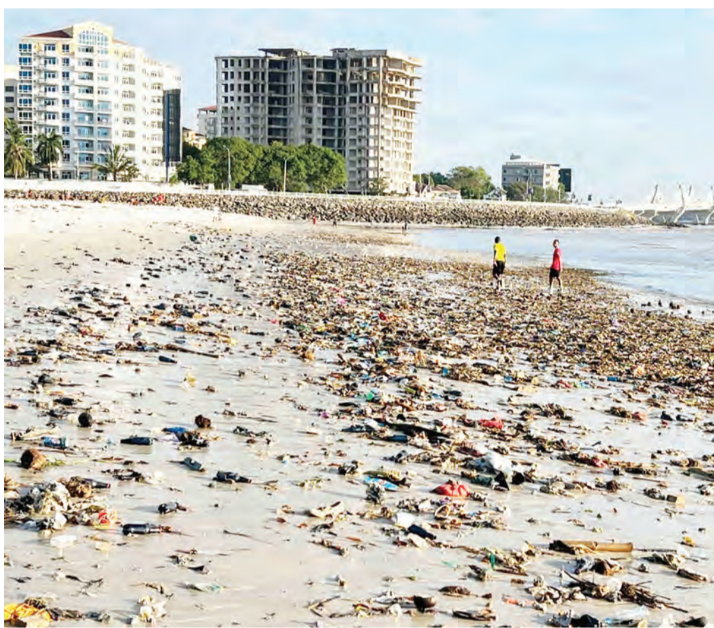
Yes, it is yet again World Environment Day today. The Day has been celebrated the world over each June 5 since 1973, chiefly to encourage global awareness and action for the protection of the environment. The theme for this year's WED underlines the need for humankind to refocus attention on solutions to plastic pollution. The argument is simple: plastic suffocates marine life, damages soil, poisons ground water, and can have serious health consequences. One of our readers sent us this photo yesterday afternoon, having captured the scene earlier in the day at a section of Dar es Salaam's Indian Ocean coastline - facing the city's Aga Khan Hospital and the landmark Tanzanite Bridge. How ironical, though, that the area is littered with all manner of garbage - including plastic material - on World Environment Day eve!

Australian companies are also good observants of environmental corporate governance rules, he said, inviting the firms to the Tanzania Mining Investment Forum set for October.