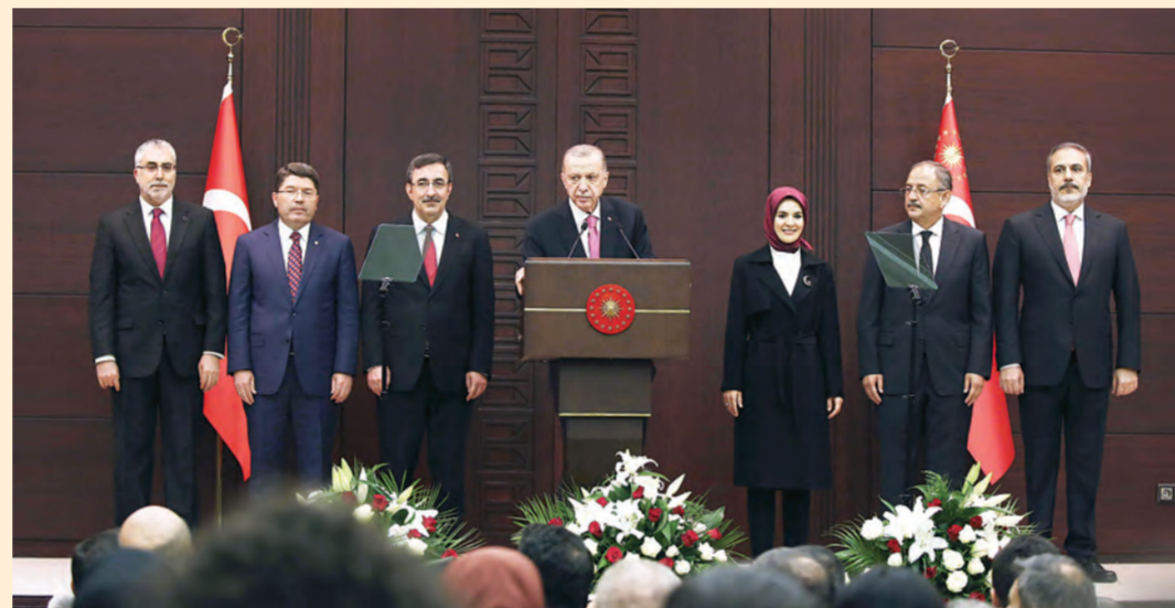
Turkish President Recep Tayyip Erdogan (center) stands with the new cabinet members during the inauguration ceremony at the presidential complex in Ankara, Türkiye on Saturday.

The inauguration ceremony was attended by several foreign leaders, including NATO Secretary-General Jens Stoltenberg, Venezuelan President Nicolas Maduro, Hungarian Prime Minister Viktor Orban and Armenian Prime Minister Nikol Pashinyan.