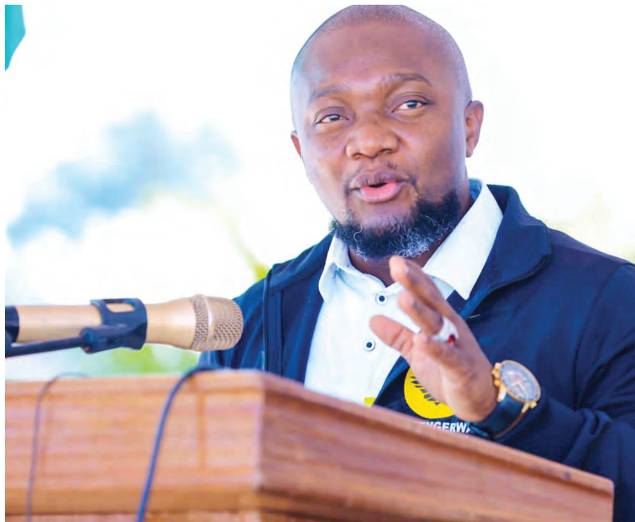
Natural Resources and Tourism minister Mohamed Mchengerwa

He also called on members of the public to cooperate with the government in the war.