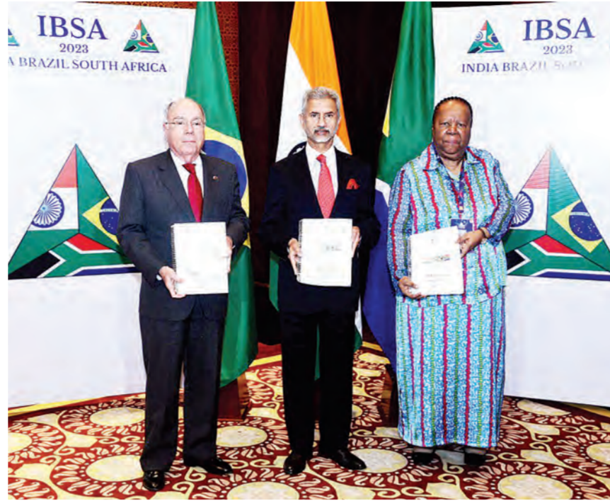
External Affairs Minister S Jaishankar with South African Foreign Minister Naledi Pandor hands over the India, Brazil and South Africa (IBSA) Partnership to Brazilian Foreign Minister Mauro Vieira, in New Delhi on Friday.

"And I still remember at that time, I was actually in Delhi, and I remember all our public buildings Rashavati Bhavan, the Parliament, the central Secretariat were all actually lit up for in celebration of what was happening here. And when we did establish our diplomatic footprint, this was actually