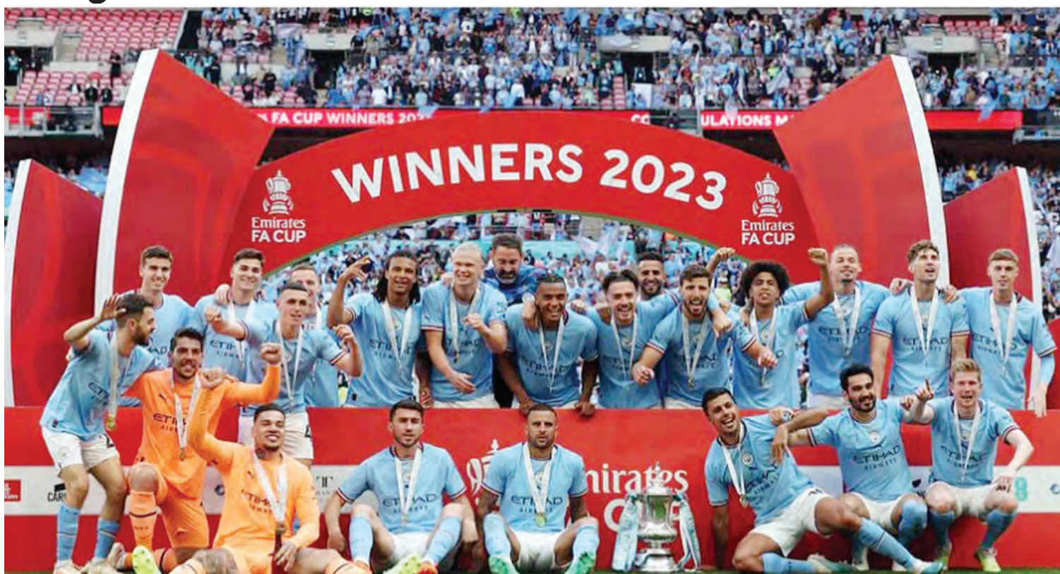
Manchester City players celebrate winning the English FA Cup final football match between Manchester City and Manchester United at Wembley stadium, in London, on 3 June, 2023.

ning strike after just 12 seconds will live long in the memory and not just for becoming the fastest goal in FA Cup final history.