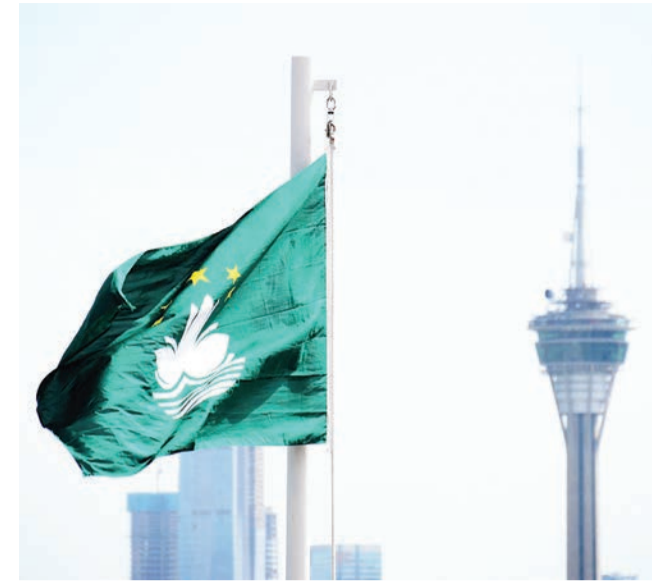
The flag of the Macao Special Administrative Region.

Only short listed candidates will be contacted.