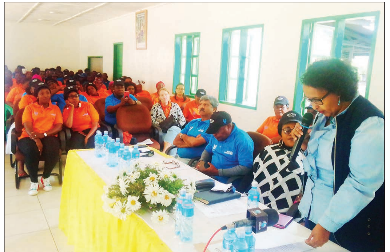
UN Women Representative Hodan Addou (R) delivers a speech in Iringa yesterday at the launch of the strengthening of Unilever's package of efforts to combat sexual harassment and other forms of gender-based violence in Mufindi and Njombe districts.

The new registration system has resulted in an overall increase of certification of under-fives in the specific regions from less than 10 percent to more than 80 percent.