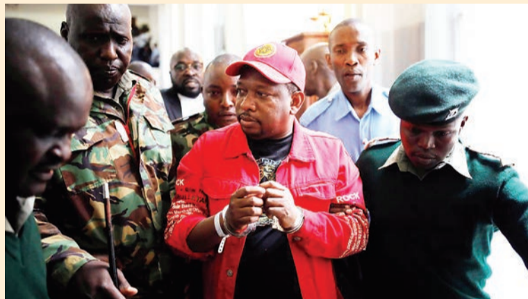
Nairobi's Governor Mike Sonko leaves the court room after a hearing, after he was arrested on corruption-related charges, at the Milimani Law Courts in Nairobi, Kenya yesterday.

The prosecution had also opposed the governor's release on bail because they said he had previously escaped from custody following con-