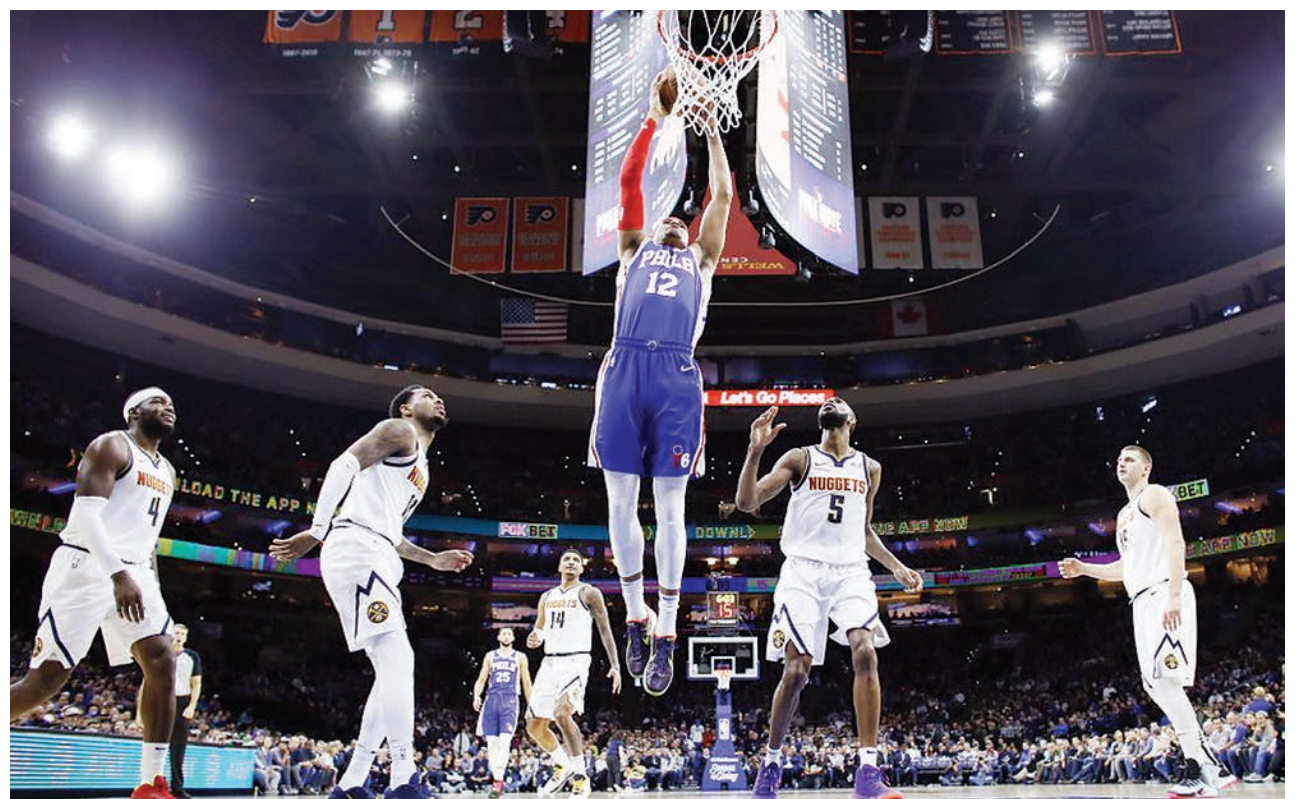
Philadelphia 76ers' Tobias Harris (12) goes up for a dunk during the first half of an NBA basketball game against the Denver Nuggets, Tuesday, Dec. 10, 2019, in Philadelphia.