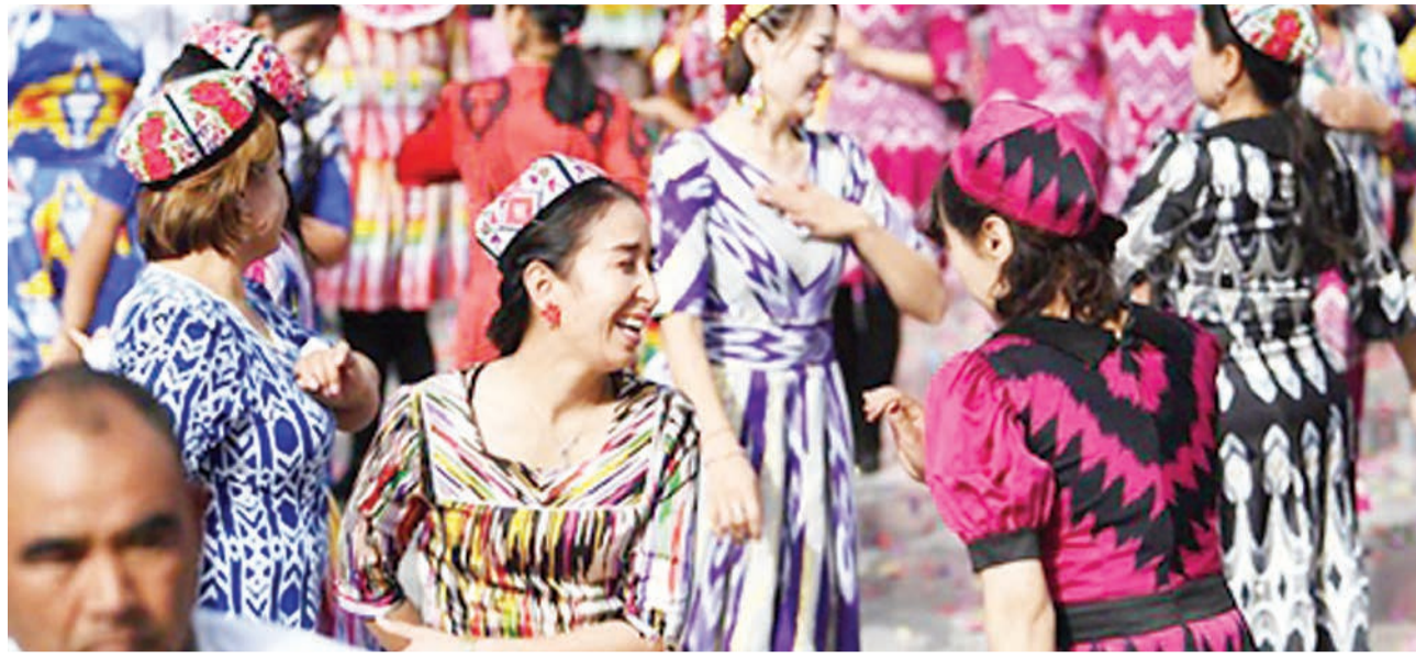
People dance at a square during a culture and tourism festival themed on Dolan and Qiuci culture in Awat County of Aksu Prefecture, Northwest China's Xinjiang Uyghur Autonomous Region on October 25. (File photo)

Since the end of 2018, more than 1,000 representatives from 91 coun-