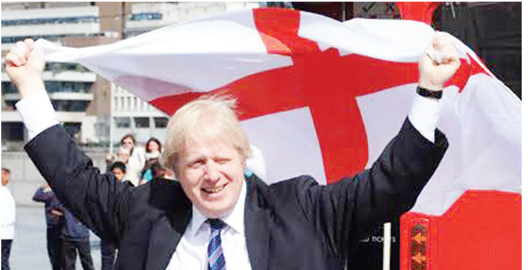
UK Prime minister Boris Johnson

She was dubbed “Iron Lady.” The domineering right-wing press backed