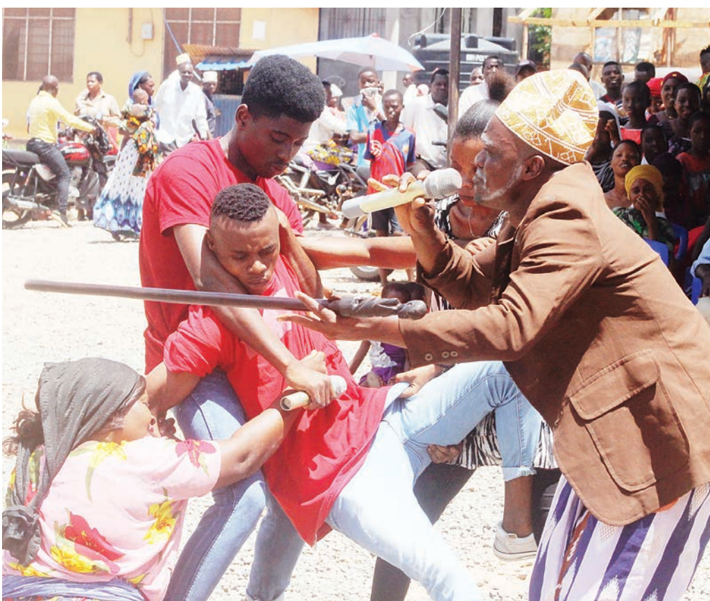
Dar es Salaam's Nyota Group's artistes perform a play, aiming at fighting gender-based violence, at a climax of a 16-day campaign for fighting gender-based violence, which was held in Kisarawe, Coast Region recently. TBL GROUP's department, known as 'Isiwe Sababu', backed the campaign in cooperation with ESO, an organization which fights gender-based violence.