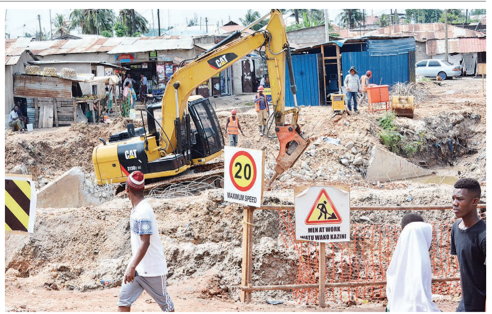
Construction of a bridge connecting Dar es Salaam's Kijitonyama and Manzese suburbs well in progress, as found on Tuesday.

GIZ and the Secretariat have been developing and managing key projects working