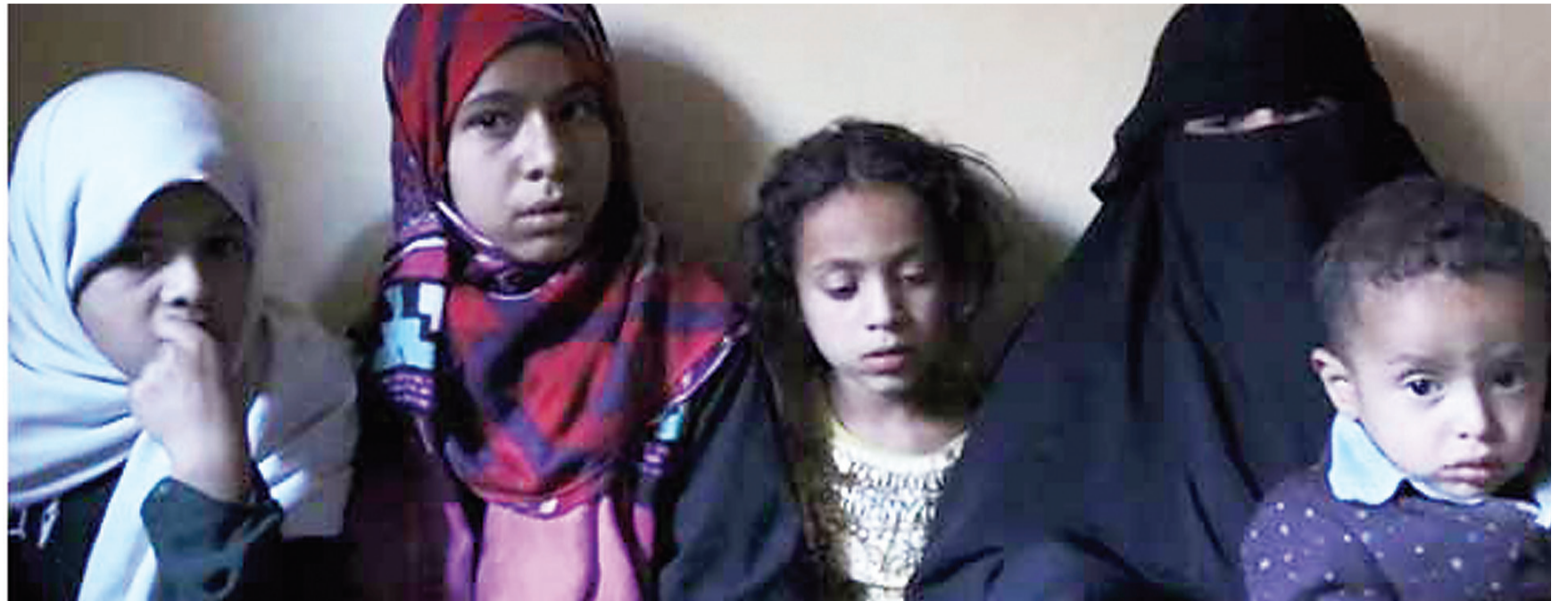
Roughly 82 percent of Afghan girls drop out of school before the sixth grade, partly due to early child marriages. File photo

HRW interviewed families who had been affected by three types of disasters—flooding, cyclones, and river erosion. Many of the families they interviewed had been barely surviving dealing with inadequate nutrition even before the disaster strikes;