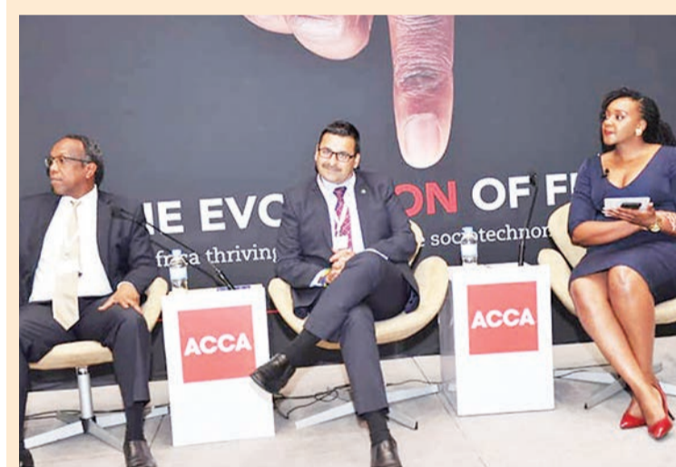
Panelists at ACCA Africa members' convention in Kigali

Turkey's banking regulator in September told lenders to reclassify 46 billion liras of loans as non-performing by the end of the year. Bloomberg reported on Thursday that it later decided to let lenders determine which company loans need to be reclassified as non-performing, and revised how banks classify credit to once-troubled companies, potentially helping them avoid adding more problem loans to their books.