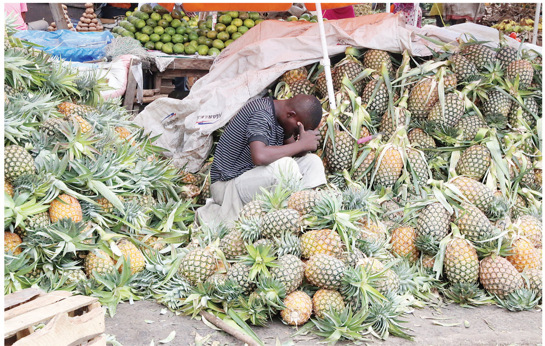
Finding that no customer is coming his way, a pineapple retailer at Dar es Salaam's Buguruni market Dar es Salaam takes a nap yesterday afternoon.

The protests follow the launch of large-scale military operations by the Congolese army against the ADF - an Islamist rebel group formed in 1995 in opposition to Ugandan Presi-