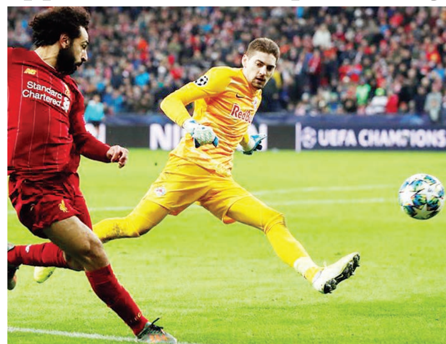
Liverpool's Mohamed Salah scores their second goal against FC Salzburg during their Champions League - Group E match at Red Bull Arena Salzburg in Salzburg, Austria on Tuesday.

Anfield advantage aside, Klopp's team are the most complete team in Europe at this moment in time, while all of their chief potential rivals