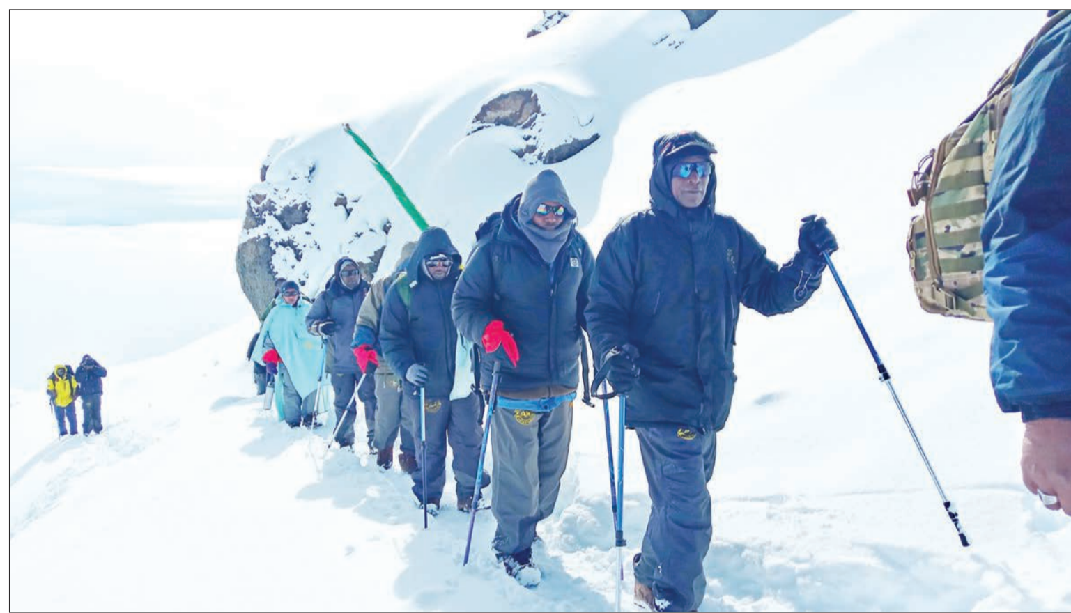
Colonel Machela Mwise (R) pictured on Tuesday leading a team of Uhuru Expedition climbers in scaling Mount Kilimanjaro, their aim being to hoist Tanzania's national flag at Uhuru Peak as part of celebrations to mark the 58th anniversary of Tanganyika's Independence. The mountain is located in northern Tanzania. With a height of 5,895 metres, it is the highest mountain in Africa and the highest free-standing mountain in the world.

Under the new, decentralised system, the government seeks to identify and register all under-five children across the country