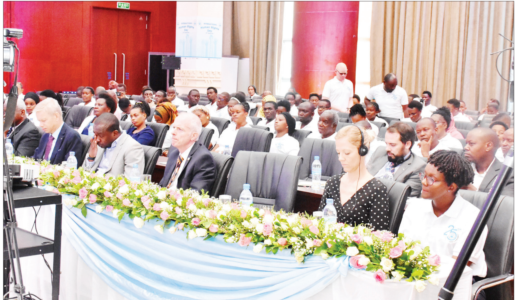
Participants of a seminar held in Dar es Salaam on Tuesday to mark International Human Rights Day follow a presentation by Tanzania's immediate former Controller and Auditor General Ludovick Utouh. The date (December 10) was chosen to honour the United Nations General Assembly's adoption and proclamation - in 1948 - of the Universal Declaration of Human Rights as the first global enunciation of human rights and one of the first major achievements of the new world body.

At national level, an estimated 40 percent of women aged between 15 and 49 have experienced physical violence while 17 percent are survivors of sexual violence, according to the Tanzania Demographic and Health Survey (TDHS) 2015/2016.