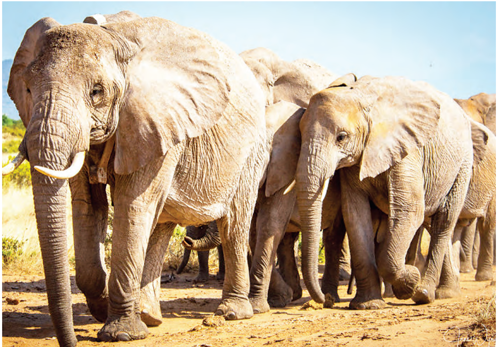
Following population declines over several decades due to poaching for ivory and loss of habitat, the African forest elephant ( Loxodonta cyclotis ) is now listed as Critically Endangered and the African savanna elephant ( Loxodonta africana ) as Endangered on the IUCN Red List of Threatened Species™. Before today's update, African elephants were treated as a single species, listed as Vulnerable; this is the first time the two species have been assessed separately for the IUCN Red List, following the emergence of new genetic evidence

A BBC programme reported that "....forensic tests showed that most poached tusks came from Tanzania, ....a country set to become a major player as a future source of smuggled ivory".....a shameful prognosis...but redemption can change it!