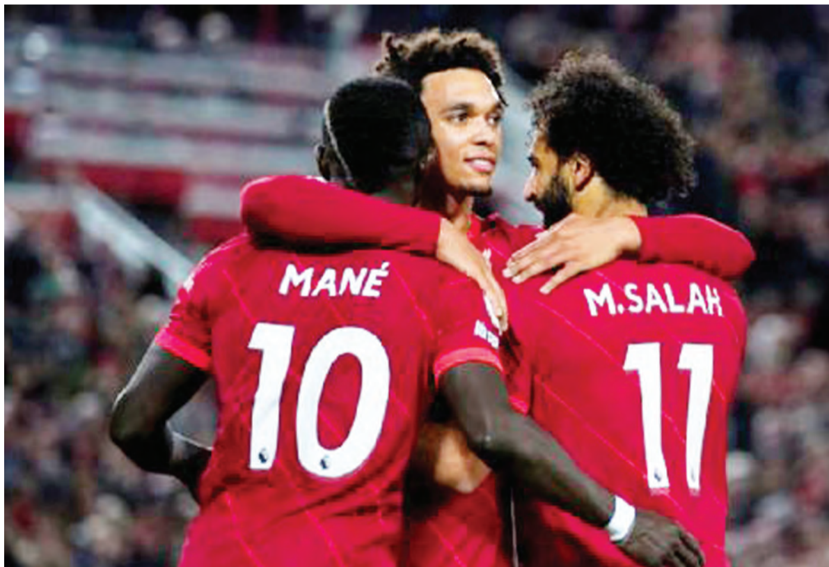
Liverpool went through the gears in the second half to run out comfortable winners against Arsenal.

For Liverpool, the winning margin was a fair reflection of their superiority and the latest high-scoring victory they have achieved this season. Manchester United and Watford have been hit for five, while Klopp's players have also scored three in wins