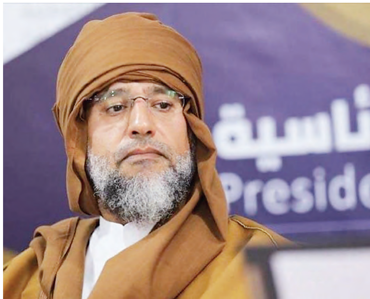
Saif al-Islam Gaddafi