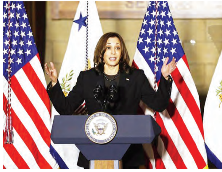
US Vice-President Kamala Harris speaks about the recently signed infrastructure law will benefit Ohioans after touring the Plumbers and Pipefitters Union Local 189, Nov 19, 2021, in Columbus, Ohio.

Psaki told reporters that the White House would release a comprehensive written summary of Biden's physical exam – conducted at Walter Reed National Medical Center near Washington – later on Friday.