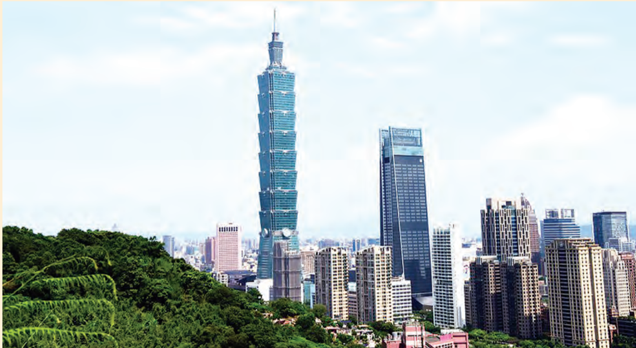
Photo taken on July 21, 2019 from Xiangshan Mountain shows the Taipei 101 skyscraper in Taipei, southeast China's Taiwan.

On Oct. 26, Blinken's clamor for Taiwan's "robust, meaningful participation throughout the United Nations system" once again crossed China's red line over the Taiwan question.