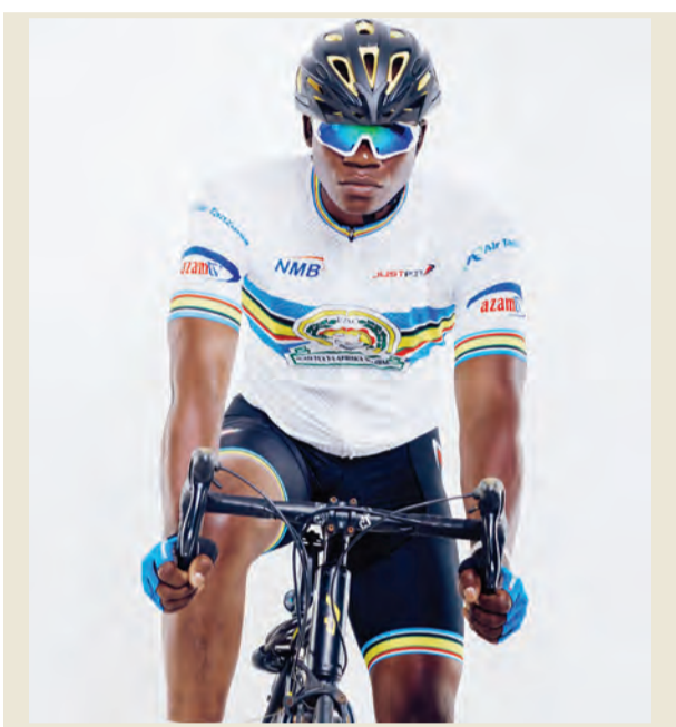
A cyclist that will take part in Tanzania at 60 Independence Anniversary International Cycling Tour, scheduled for early next month, shows kits that are to be used by cyclists in the race.