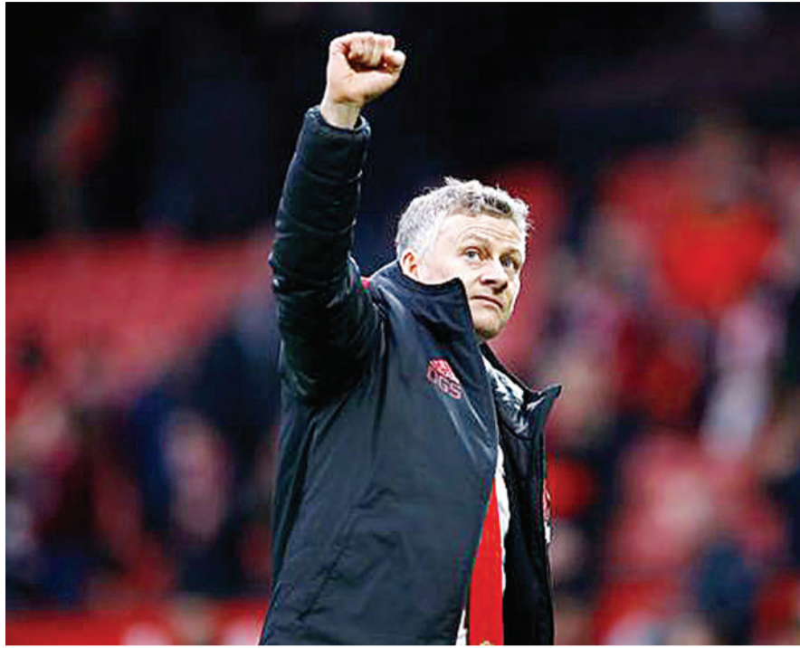
Ole Gunnar Solskjaer

"Ole leaves with our sincerest thanks for his tireless efforts as Manager and our very best wishes for the future. His place in the club's history will always be secure, not just for his story as a player, but as a great man and a Manager who gave us many great moments. He