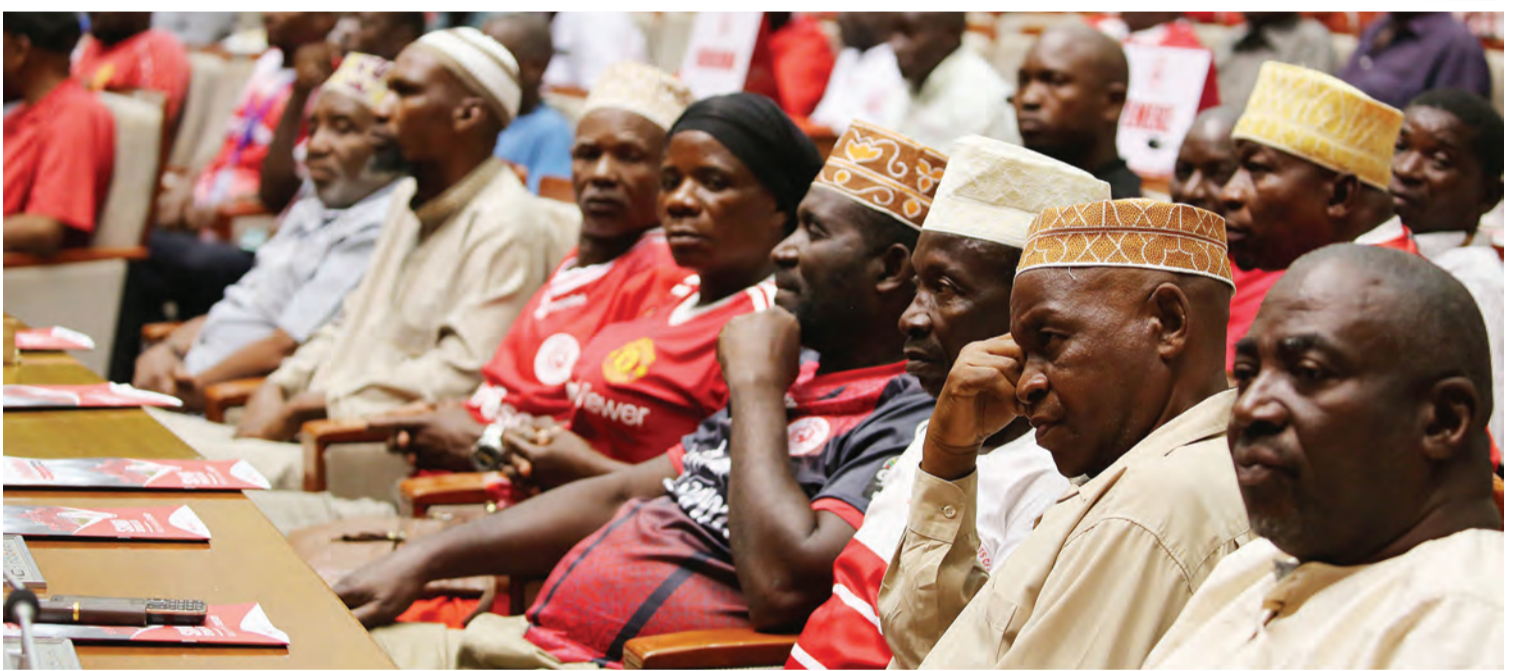
Some of Simba SC members participate in the side's Annual General Assembly, which took place in Dar es Salaam yesterday.

"It is quite a milestone and they have worked hard to get this marathon to where it is today. I appreciate their persistence, hard work, and faith in this event."