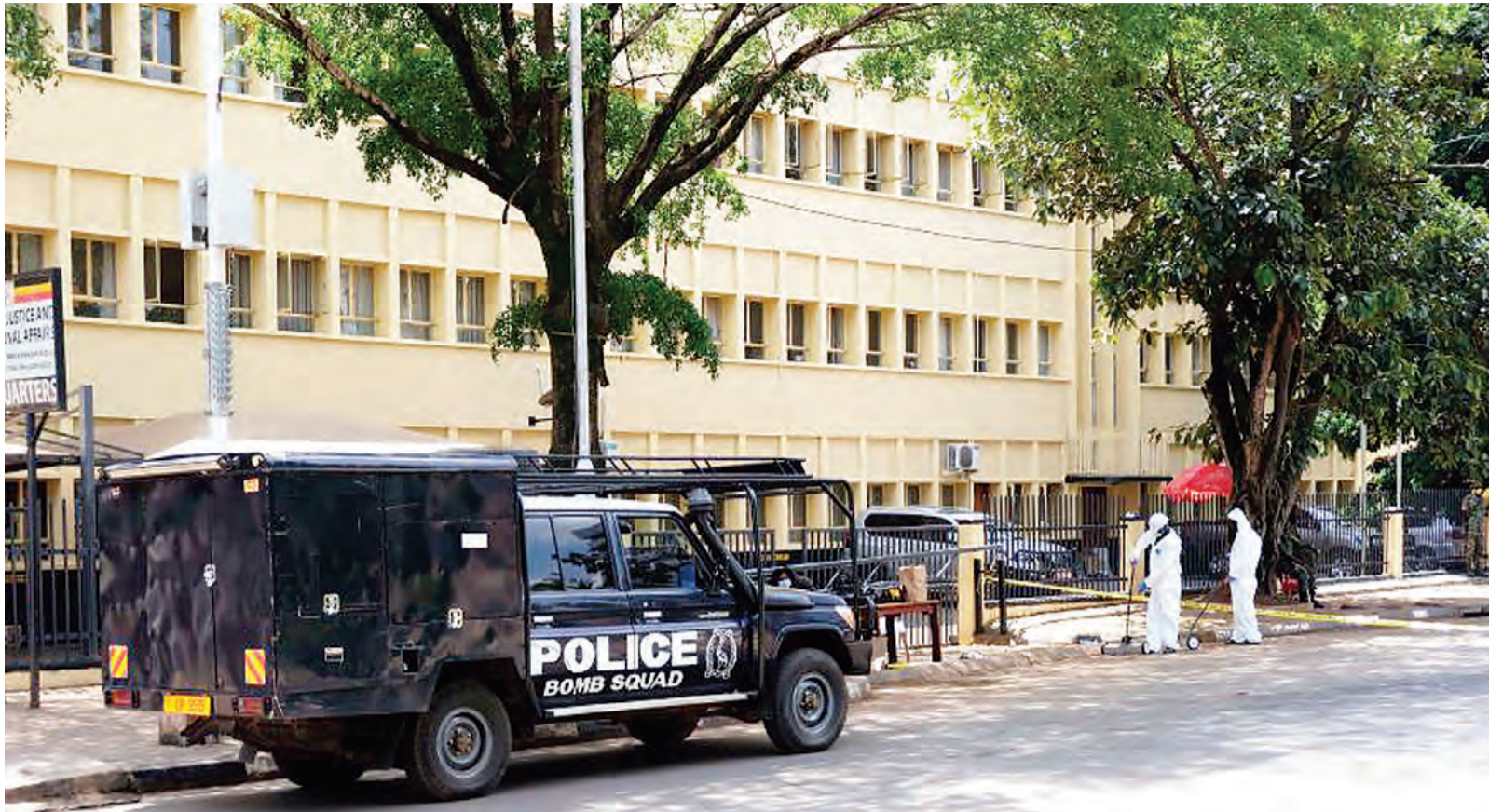
Investigators collect samples from the scene of a bomb blast at the parliamentary avenue in Kampala, Uganda, Nov. 17, 2021.

"From our analysis, they are attacking soft targets, which are many and quite difficult to defend," police said in a report issued after the first attacks late last month.