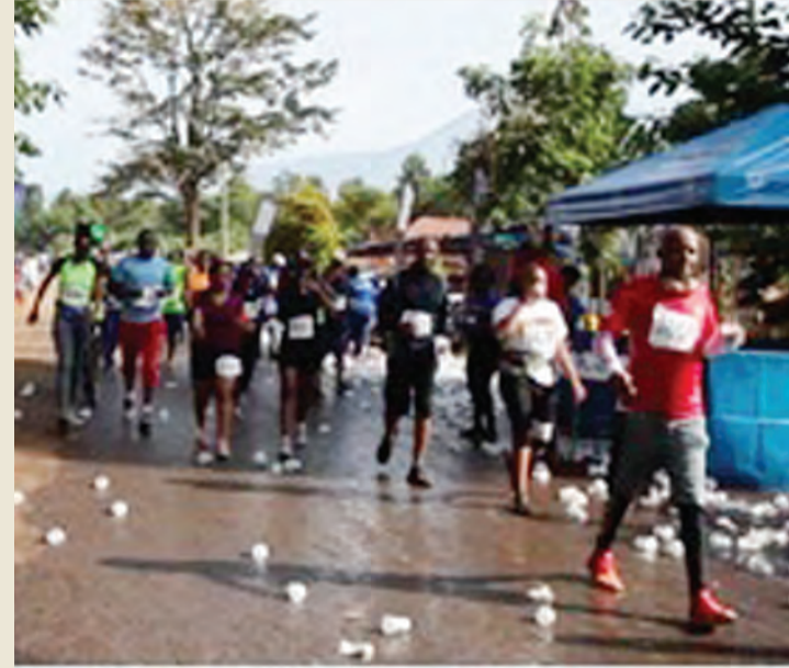
Participants of a past Kilimanjaro Premium Lager Marathon get water at the Unilever Company's water table during the marathon which took place in Moshi.

20th anniversary, they want to perfect their roles by among other things creating superior consumer engagement, raising the talking ability of the event, and being part of the team that makes the anniversary a huge success.