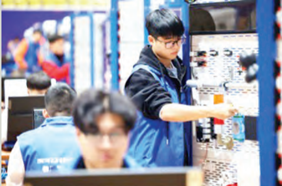
Photo taken on April 7, 2021 shows contestants operating the Internet of Things (IoT) devices in a competition event focusing on IoT applications and technologies at Jiangsu Vocational Students Skills Competition 2021 held in Nantong city, east China's Jiangsu province. File photo

and targets for the construction of the new infrastructure in a systematic way and sets the goal of preliminarily covering major cities in the country by the IoT by the end of 2023.