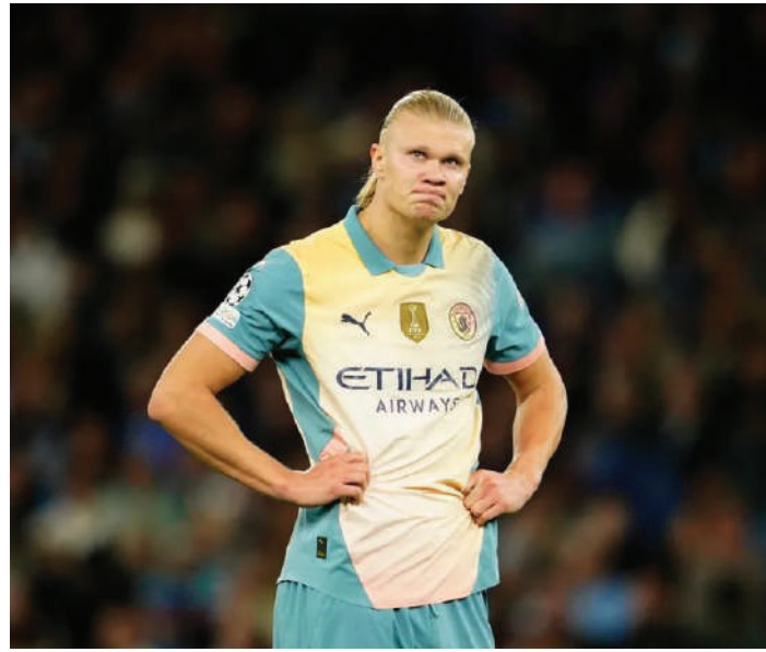
A frustrated Erling Haaland found himself stuck on 99 goals for Man City

That is a credit to Simone Inzaghi: Inter were expertly organised and, even in a draw, theirs was a triumph of intelligent tactics. They did not merely extend Erling Haaland's wait to bring up his century of City goals; they outshot Pep Guardiola's team in the first half and, until a late flurry from the hosts, had more attempts on target. Inzaghi was more animated than Guardiola in the technical areas, too. It symbolised the verve in his side. Quite what it means remains to be seen: these two sides should be assured of a top-24 finish and very probably the top-eight position that will spare them the play-off round.