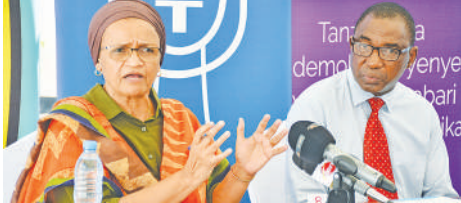
SCRIBES FROM IPPMEDIA NOMINATED FOR EJAT PAGE 3