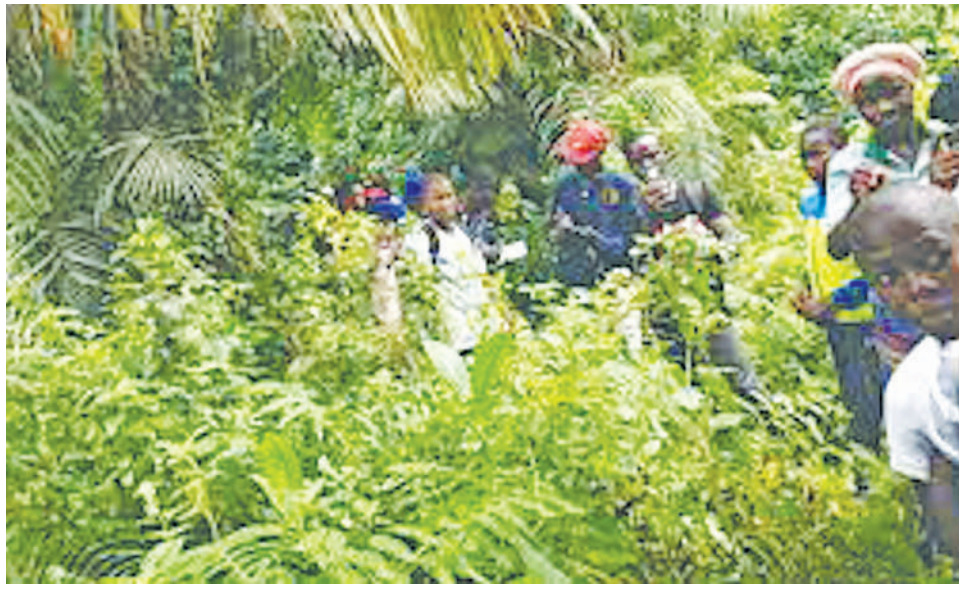
A group of young people taking part in an environmental education programme in the forest in Kenema district, Sierra Leone.

FOR two years, a volunteer organization in eastern Sierra Leone worked to encourage residents of Kenema district to plant trees and switch to more climate-resilient crops. Sierra Leone Environment Matter's 50 members aimed to protect both residents' farming livelihoods, faltering in the face of changing weather, and the Kambui Hills Forest Reserve which has been degraded by illicit logging and mining.