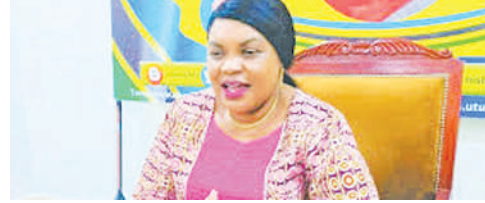
THREE DIE, 84 HOSPITALISED OF CHOLERA PAGE 4