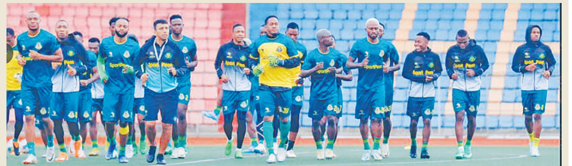
Young Africans players pictured recently during a training session in Addis Ababa, Ethiopia.

The guide further outlined the specific components that