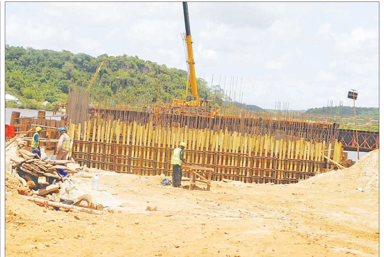
Construction of Pangani River bridge is well under way, as found yesterday, the contractor being China's road and bridge infrastructure firm Shandong Luqiao Group Co. Ltd.

Caused by the Vibrio cholerae bacteria, it can lead to severe dehydration through symptoms such as diarrhea and vomiting. The region is on high alert as health officials work to contain the outbreak and promote sanitation practices.