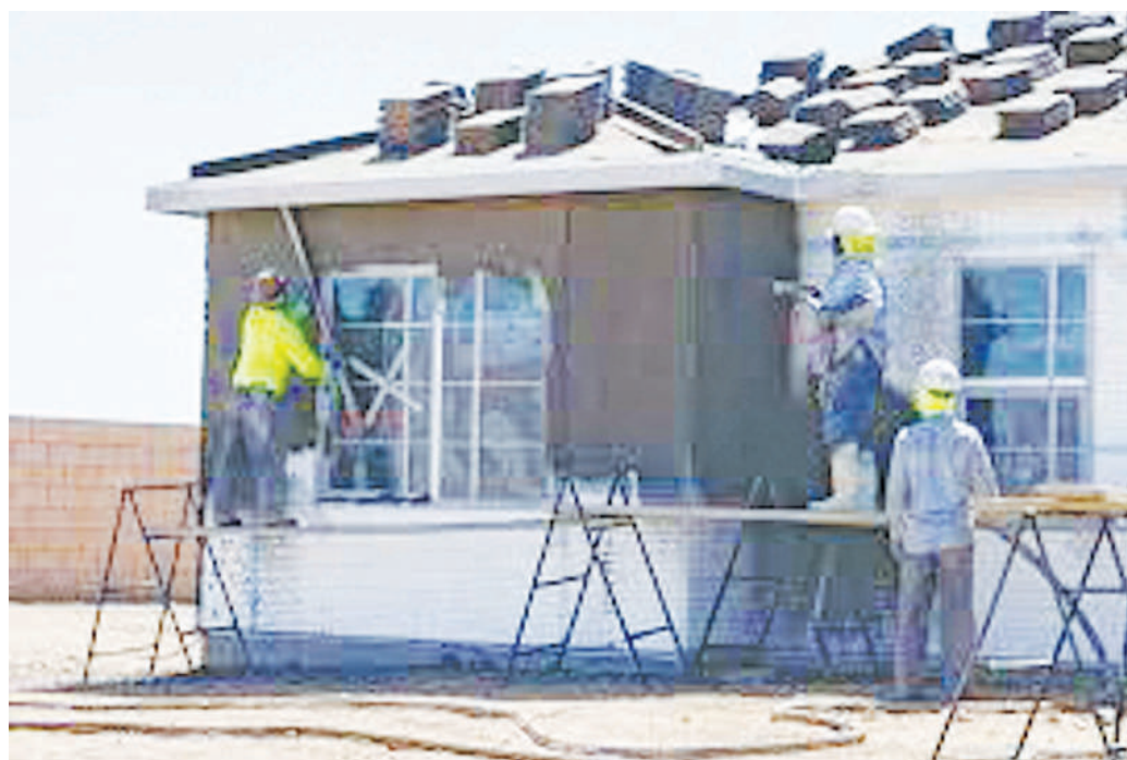
Housing has been one of the most common economic concerns for American families in the lead-up to the US presidential elections

"I think that she should focus more on the fact that incomes haven't kept up with mortgage rates or the escalating home prices,"