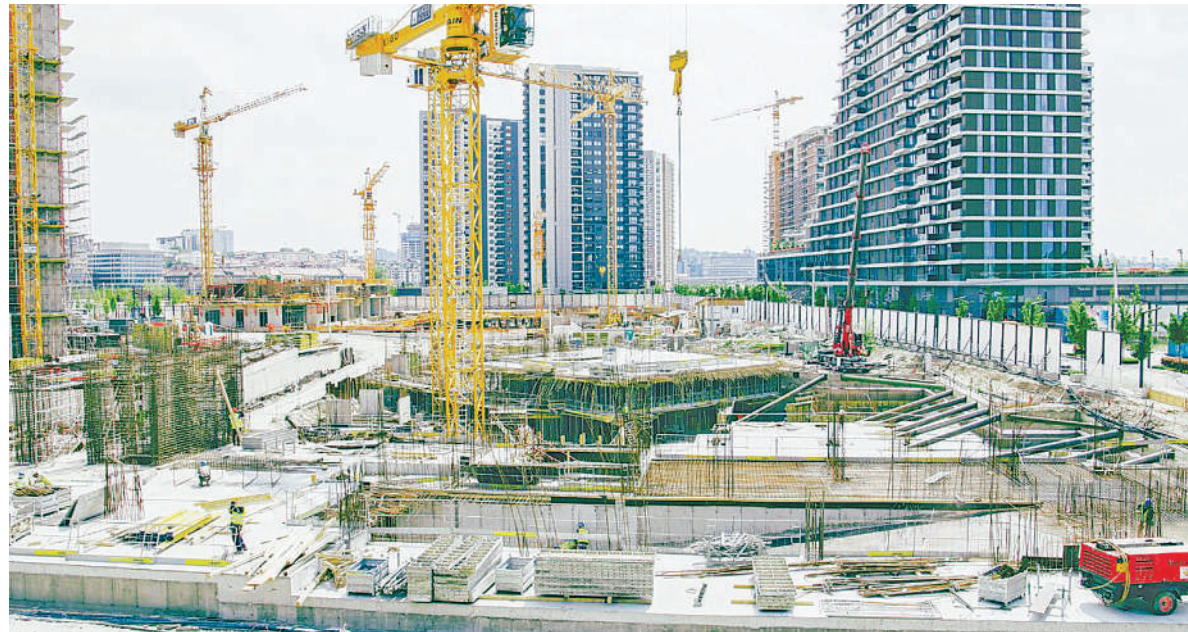
Construction activity in SA

to give these activities a political flavour. Early iterations came together in the Federation for Radical Economic Transformation (FFRET), drawing on a concept then being invoked to justify extractive economic policies and attendant corruption.