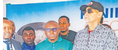
ZUNGU URGES MSMEs TO EMBRACE DIGITAL TRADE PAGE 6