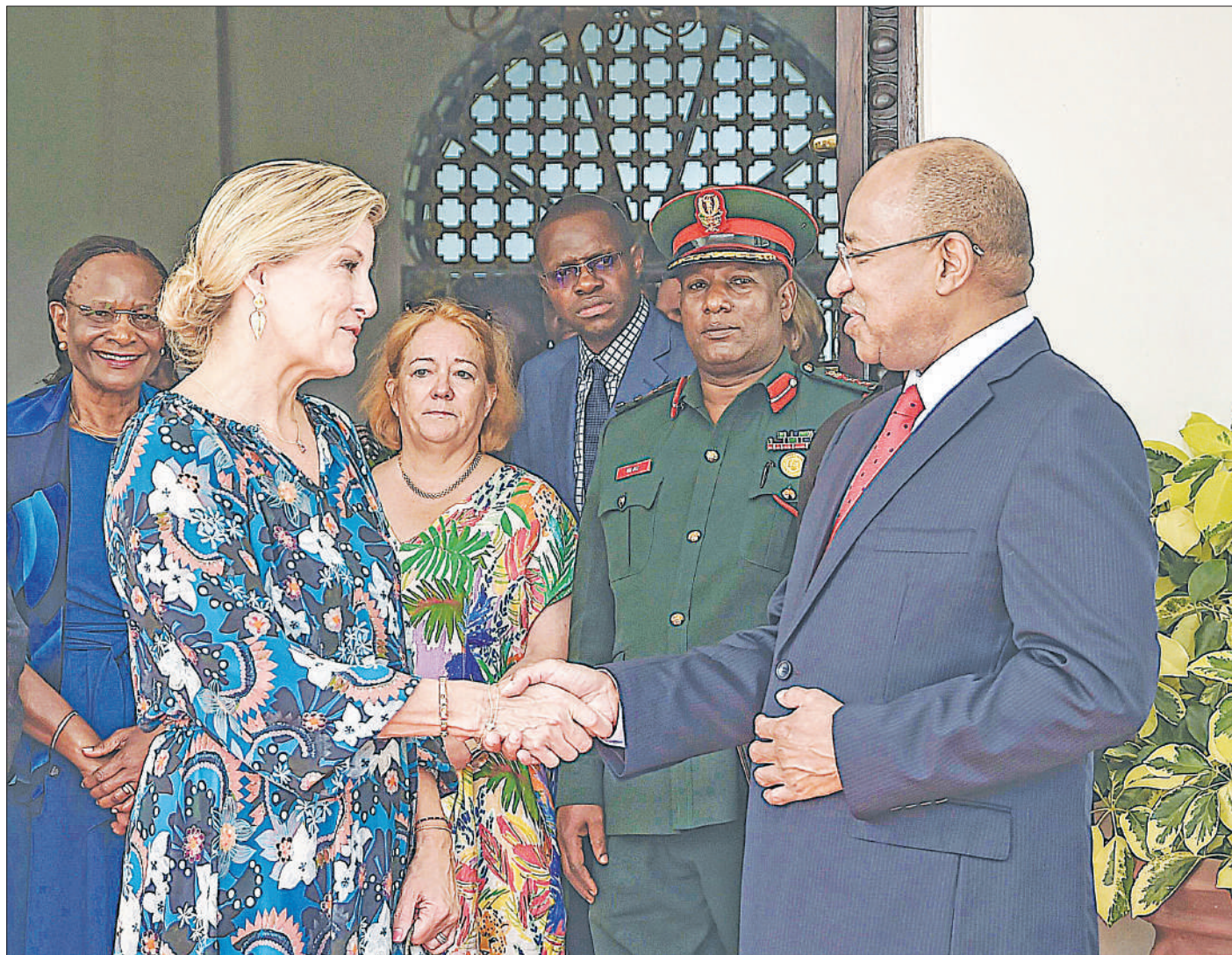
Zanzibar President Dr Hussein Ali Mwinyi bids farewell to Sophie, Duchess of Edinburgh, a member of the British royal family. It was shortly after talks at Zanzibar State House yesterday.

"We initiated the centre during challenging times and struggled to find common ground, which is why TCD was established"