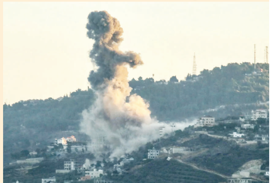
Smoke billows from the site of an Israeli strike that targeted the southern Lebanese village of Odaiseh near the border with Israel on Wednesday.

This move followed a decision by Prime Minister Benjamin Netanyahu's Security Cabinet to expand the war's objectives, aiming to facilitate the return of Israelis displaced by cross-border fighting with Hezbollah. The incidents have drawn sharp