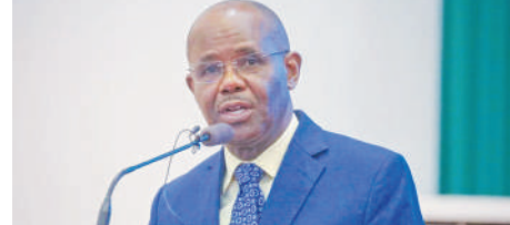
MINISTER SAYS ALL PORTS TO GET FACELIFT PAGES