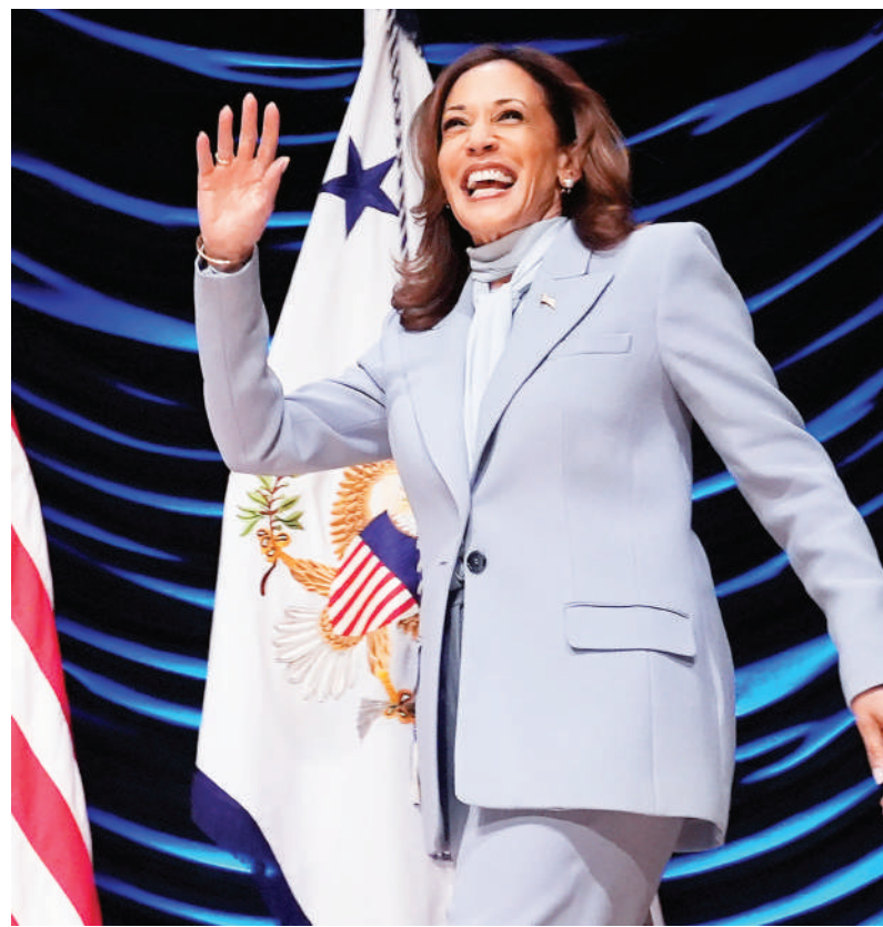
Democratic presidential nominee Vice-President Kamala Harris arrives to speak at the Congressional Hispanic Caucus Institute (CHCI) leadership conference, Wednesday, Sept 18, 2024, in Washington.

fense secretaries, Chuck Hagel and William S. Cohen; two former Central Intelligence Agency directors, Michael V. Hayden and William H. Webster; a former director of national intelligence, John D. Negroponte.