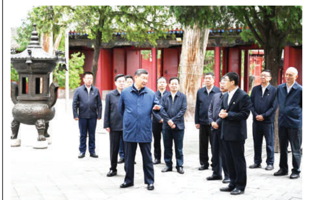
Chinese President Xi Jinping, also general secretary of the Communist Party of China Central Committee and chairman of the Central Military Commission, visits the Fuxi Temple to learn about the protection and preservation of local cultural heritage in Tianshui, northwest China's Gansu Province, Sept. 10, 2024. Xinhua

Gansu should promote new-type industrialization, accelerate the transformation and upgrading of traditional industries, build a significant national manufacturing base for new energy and new-energy-related equipment, and fortify the ecological security in the western part of the country, Xi said. Xinhua